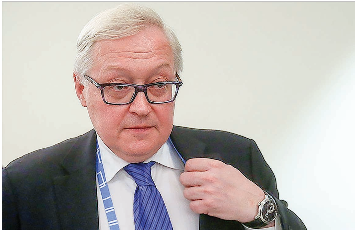
Russian Deputy Foreign Minister Sergei Ryabkov.