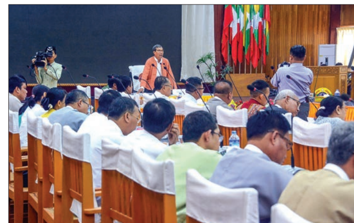
Rakhine State Chief Minister U Nyi Pu addresses the emergency meeting with departmental officials in Sittway.

close attention to death tolls and destruction caused by armed attacks and where they took place. The departments are required to help the displaced people." The meeting addressed the conditions of rescue camps, road conditions, communication infrastructure and the activities of the Arakan Rohingya Salvation Army extremist terrorists. Chief minister arranged for subsidies of rice, cooking oil, salt, pea, onion, potatoes, medicine, cigars and betel nuts for displaced people at rescue camps and delivery by military helicopter.—Myanmar News Agency ■