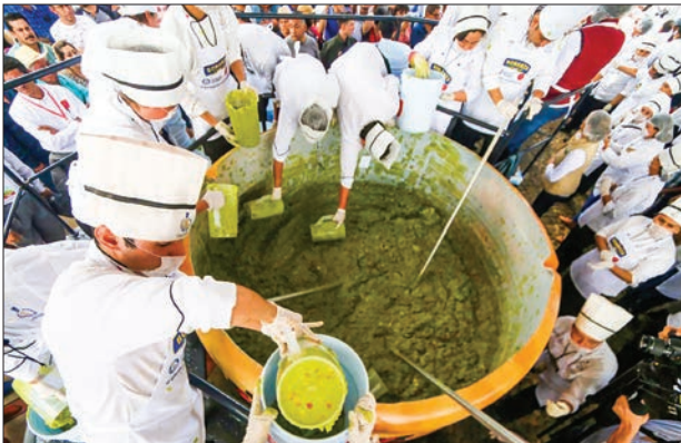
Volunteers from a culinary school mix mashed avocados as they attempt to set a new Guinness World Record for the largest serving of guacamole in Concepcion de Buenos Aires, Jalisco, Mexico on 3 September, 2017.

United States were meeting in the Mexican capital this weekend to revamp the 23-year-old NAFTA accord that Trump has threatened to end if he does not get concessions to curb a trade deficit with Mexico.