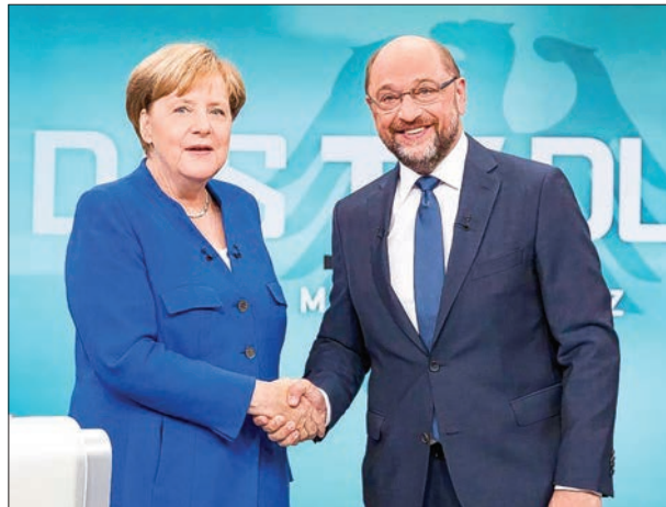
German Chancellor Angela Merkel of the Christain Democratic Union (CDU) and her challenger, Germany's Social Democratic Party SPD candidate for chancellor Martin Schulz, take part in a TV debate in Berlin, Germany on 3 September, 2017.

"It is clear that Turkey should not become a member of the EU," she