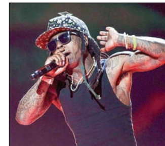
Rap star Lil Wayne.

CHICAGO — Grammy-winning rap star Lil Wayne was taken to hospital on Sunday after suffering a seizure and being found unconscious in his Chicago hotel room, TMZ said on its web site.