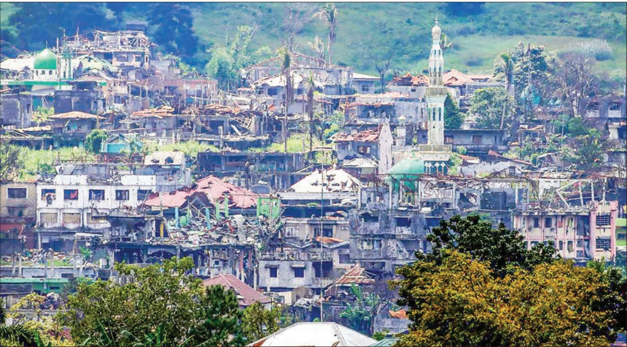
Damaged buildings and houses are seen as government troops continue their assault on its 105 th day of clearing operations against pro-IS militants who have seized control of large parts of Marawi city, southern Philippines on 4 September, 2017.