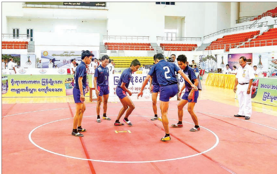
Members of chinlone team showing their skillful performance at Wunna Theikdhi Indoor Stadium in Nay Pyi Taw yesterday.