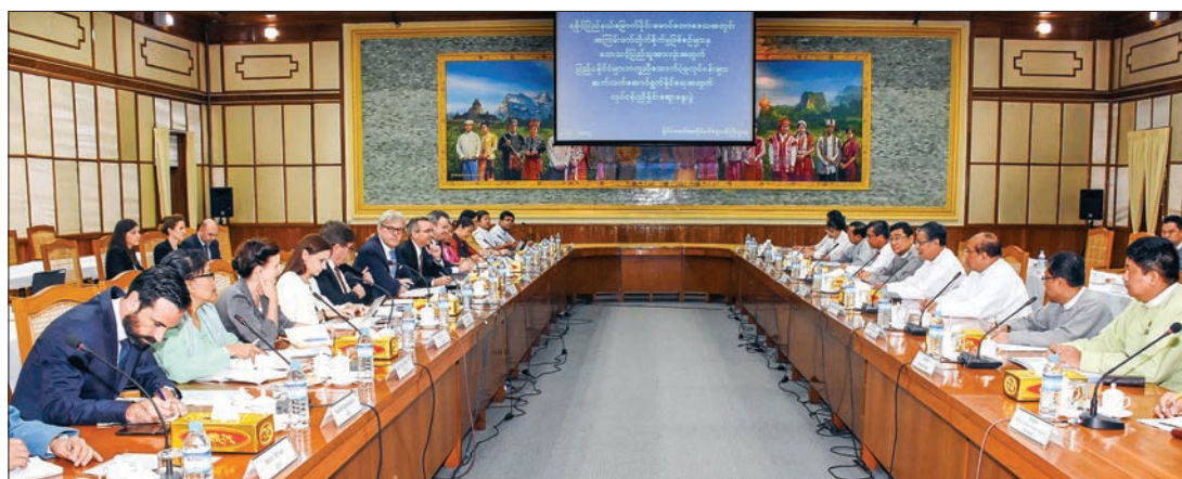
Union ministers hold talk with diplomats and INGOs over providing displaced persons in Maungtaung with humanitarian aid.

The Meeting was attended by Union Minister for the Office of the State Counsellor U Kyaw Tint Swe, Union Minister for Social Welfare, Relief and Resettlement Dr. Win Myat Aye, National Security Advisor to the Union Government U Thaung Tun, Deputy Minister U Khin Maung Tin, the Secretary of the Rakhine