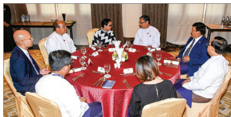
Union Minister U Kyaw Tint Swe hosts working lunch for Indonesian Foreign Minister Mrs. Retno L.P. Marsudi.

The Union Minister explained that as the Government has the primary responsibility to provide humanitarian assistance to all inhabitants who are displaced by terrorist attacks in