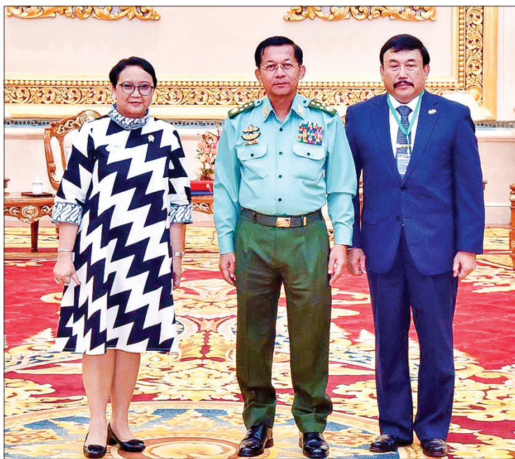
Senior General Min Aung Hlaing poses a documentary photo with Indonesia FM in Nay Pyi Taw yesterday.

First, Commander-in-Chief of Defence Services explained about the true situation of the ARSA extremist terrorist attacks that started in Buthidaung and Maungdaw townships in Rakhine State on 25 August. Afterward, Commander-in-Chief of Defence Services and the visiting Foreign Minister discussed about humanitarian assistance for conflict areas in Rakhine State. —Myanmar News Agency ■