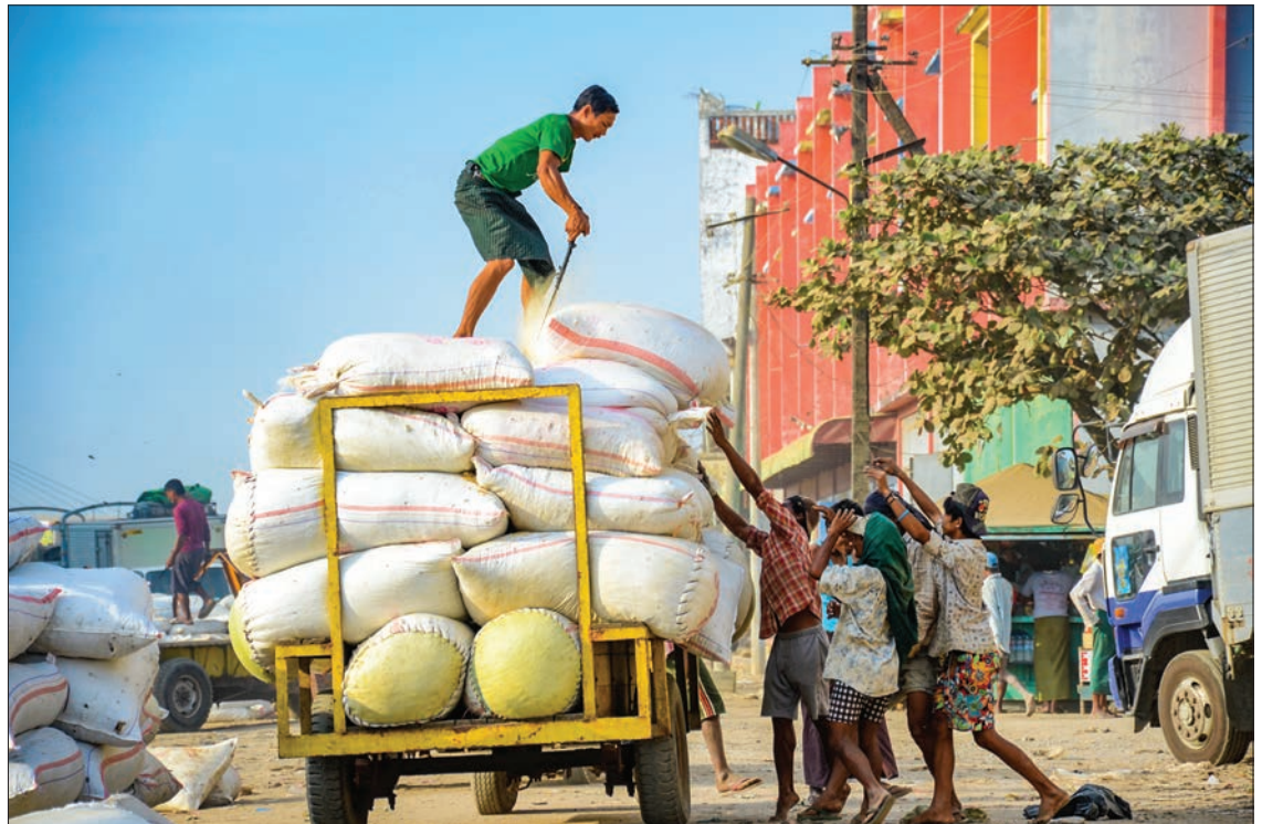
Workers unloading rice bags from the vehicle.

Rice exports to China have declined due to tougher Chinese border controls