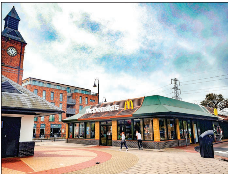
People walk past a McDonalds restaurant in Dartford, southern Britain on 4 September, 2017.

He said the company and its franchisees were offering staff the option of a guaranteed hour contract but so far 86 per cent of its employees had chosen to