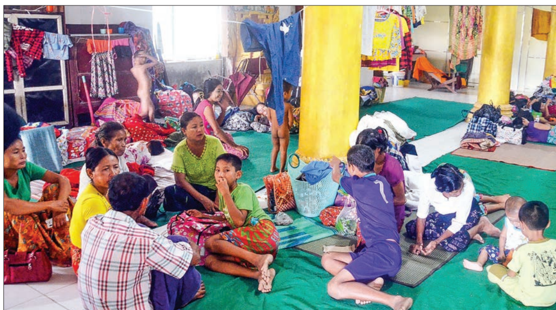
Displaced persons seen at Mahazayatheikdi monastery in Sittway, Rakhine State.