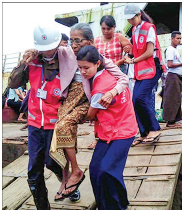
Myanmar Red Cross Society's members help an elderly woman to evacuate.

Afterwards, the Pyithu Hluttaw Speaker and party departed from Kunming International Airport by air to Shanghai at 8:25 pm local standard time.— Myanmar News Agency ■