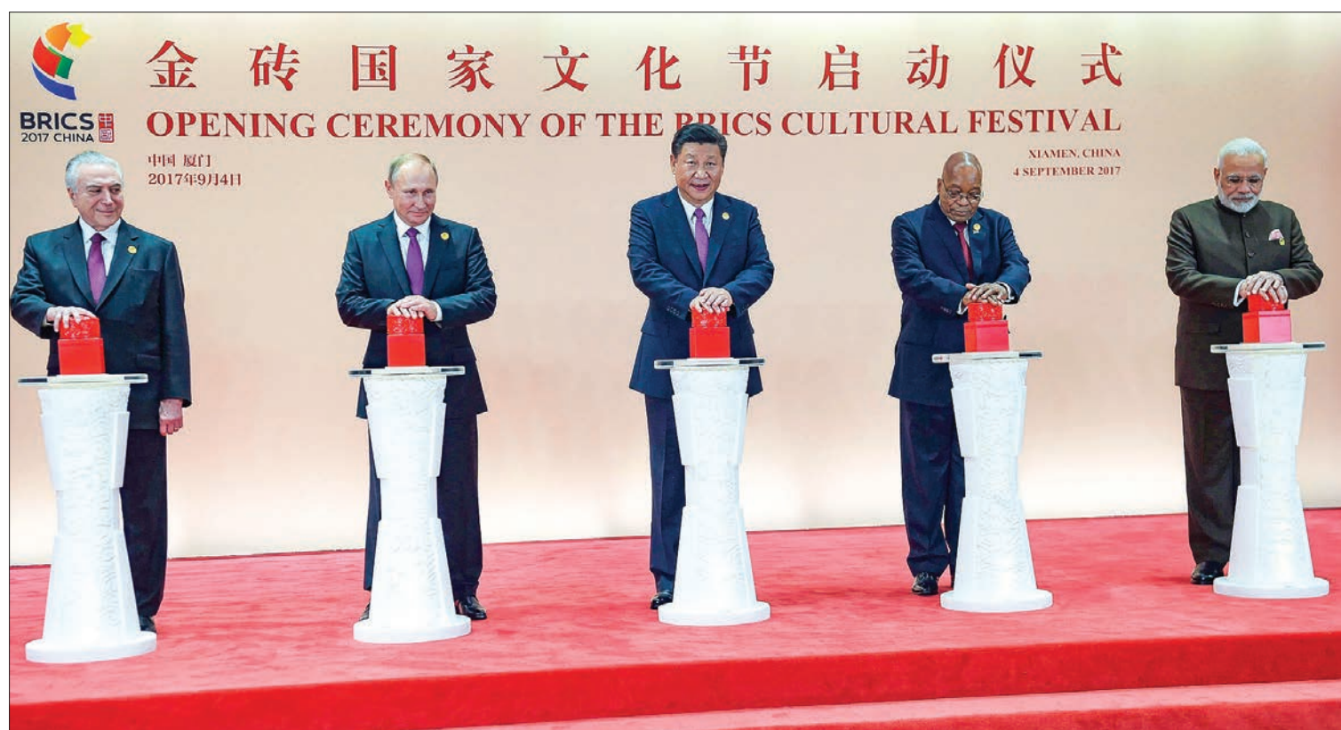
(L-R) Brazil's President Michel Temer, Russia's President Vladimir Putin, China's President Xi Jinping, South Africa's President Jacob Zuma and India's Prime Minister Narendra Modi take part in a ceremony opening the BRICS Cultural Festival in Xiamen, China on 4 September, 2017.

"We should redouble our efforts to comprehensively deepen BRICS partnerships and open