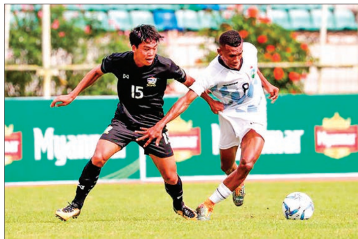
Thailand and Timor Leste players vying for the ball in yesterday match.

Host Myanmar will play against Indonesia today 6pm at Thuwunna Stadium. ■