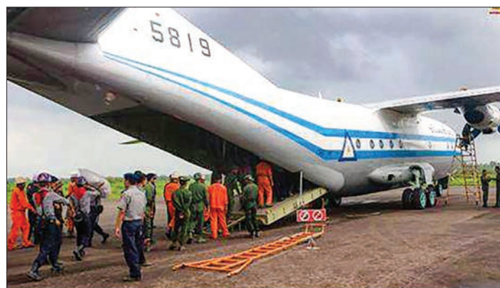
Members of the Tatmadaw and volunteers unloading aid from the military transport plane in Sittway.

Donation of foods and goods from Tatmadaw (Army, Navy, Air) families and donors all over the country for local people displaced by ARSA extremists terrorist attacks were continued to be airlifted to Sittway airport by a transport aircraft said a statement by the information committee of the government. Yangon Command commander and officials observed the loading