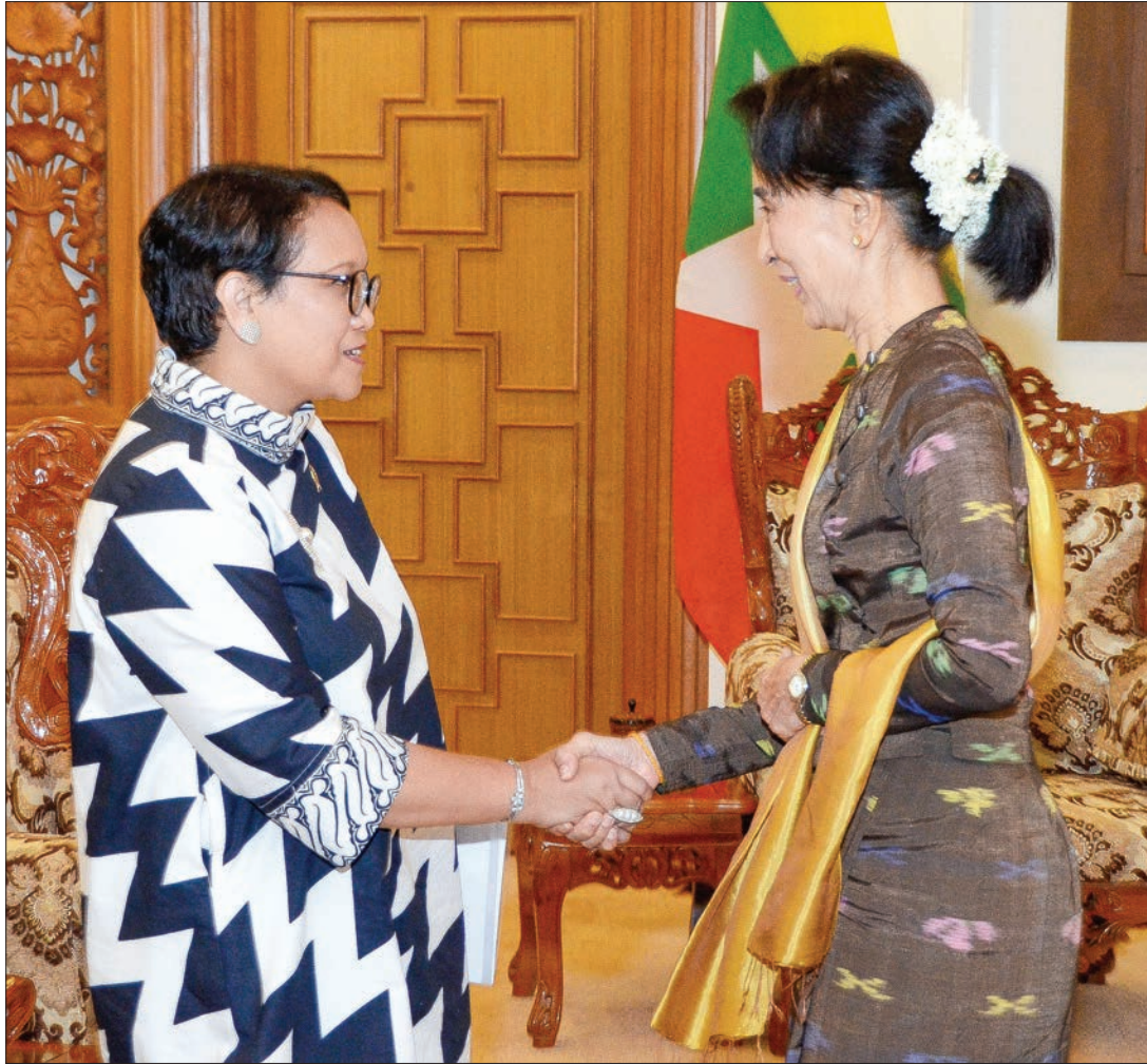
State Counsellor and Union Minister for Foreign Affairs Daw Aung San Suu Kyi welcomes Indonesian Foreign Minister Mrs. Retno L.P. Marsudi in Nay Pyi Taw yesterday.

Present at the meeting were U Kyaw Tint Swe, Union Minister for the Office of the State Counsellor; U Thaung Tun, National Security Advisor; U Kyaw Tin, Minister of State for Foreign Affairs and Dr. Ito Sumardi, Ambassador of the Republic of Indonesia to Myanmar.—Myanmar News Agency ■