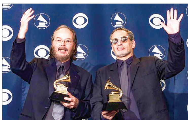
Steely Dan members Walter Becker (L) and Donald Fagen (R) won Best Pop Vocal Album for "Two Against Nature" at the 43rd annual Grammy Awards in Los Angeles on 21 February, 2001.

"We started writing nutty little tunes on an upright piano in a small sitting room in the lobby of Ward Manor, a moldering old mansion on the Hudson River