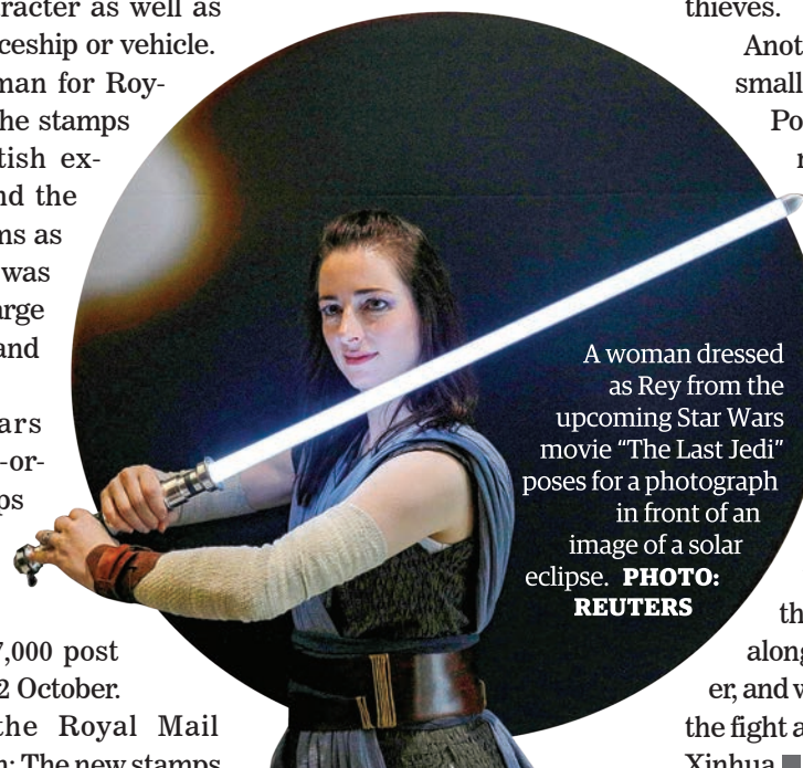
A woman dressed as Rey from the upcoming Star Wars movie "The Last Jedi" poses for a photograph in front of an image of a solar eclipse.

Meanwhile, the trusty little droid R2-D2 gets his own stamp after an adventurous life, first on board Queen Amidala's ship during the Battle of Naboo, then in the Clone Wars alongside Anakin Skywalker, and with Luke Skywalker in the fight against the Empire. —Xinhua ■