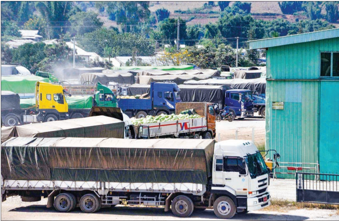
Fruit trading with around 200 truck-loads of watermelon and 50 to 70 truckloads of muskmelons entering Muse.