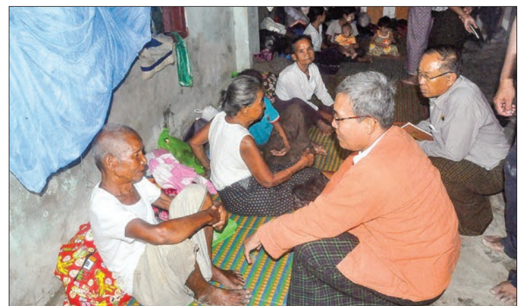
Chief Minister of Rakhine State U Nyi Pu gives words of encouragement to victims at the relief camps in Sittway.

More aids will be sent for the displaced persons taking shelter at temporary relief camps run by the local government in Sittway to ensure continuous flow of food and constant health care.—Myanmar News Agency ■