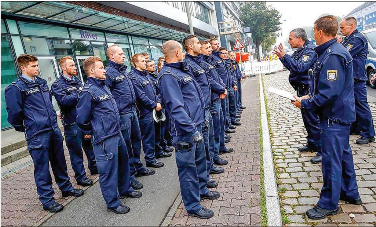
Police officers get their instructions as 60,000 people in Germany's financial capital are about to evacuate the city while experts defuse an unexploded British World War Two bomb found during renovations on the university's campus in Frankfurt, Germany, on 3 September 2017.