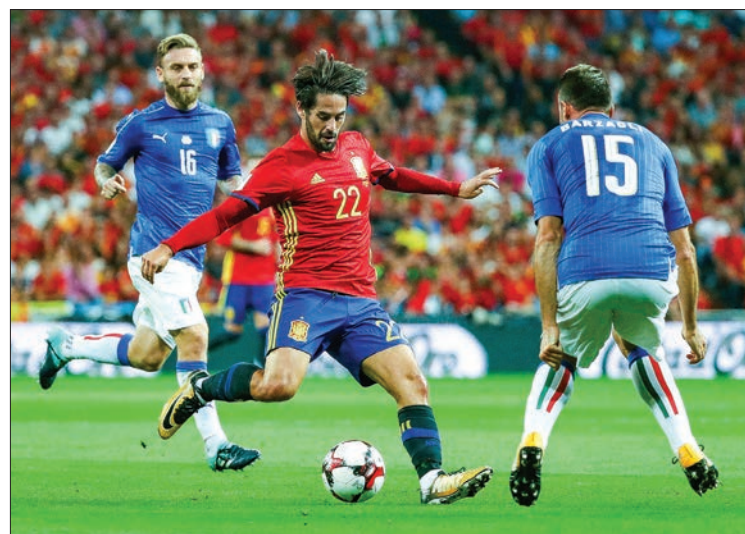
Spain's Isco in action with Italy's Andrea Barzagli during 2018 World Cup Qualifications in Madrid, Spain, on 2 September 2017.

MADRID — Two brilliant strikes from Isco and a late goal from Alvaro Morata gave Spain a spectacular 3-0 win over Italy, their nearest challengers in Group G, to move into the driving seat for automatic qualification to the 2018 World Cup.