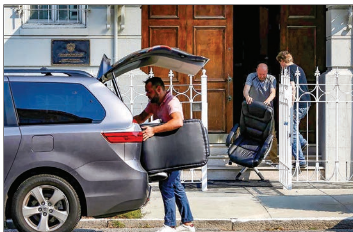
Members of the Consulate General of Russia load furniture into a vehicle in San Francisco, California, US, on 2 September 2017.

On Saturday, Russian diplomats worked to vacate three properties in the United States, including the six-story consulate in San Francisco, complying with the US order which was issued in retaliation for Moscow cutting the American diplomatic presence in Russia. —Reuters ■