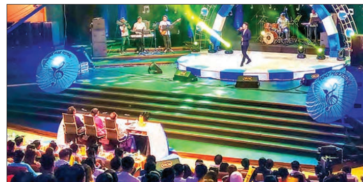
Level-1 of the Peace music festival 2017 in progress.

Level-1 of the Peace music festival 2017 was held at MRTV studio in Tatkon Township, Nay Pyi Taw yesterday evening, attended by Union Minister for Information Dr Pe Myint, member of Nay Pyi Taw Council U Tin Htut and officials.