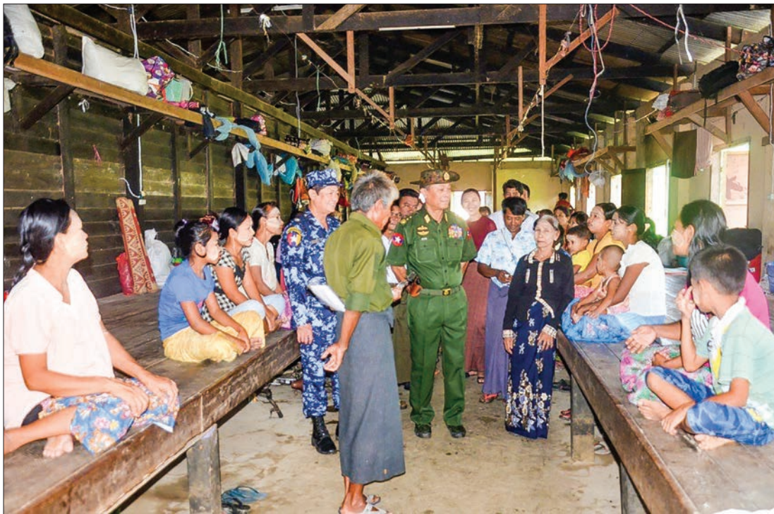
Union Minister encourages to ethnic people from the nearby villages taking shelter at the No 1 border gurad police force commander's office.