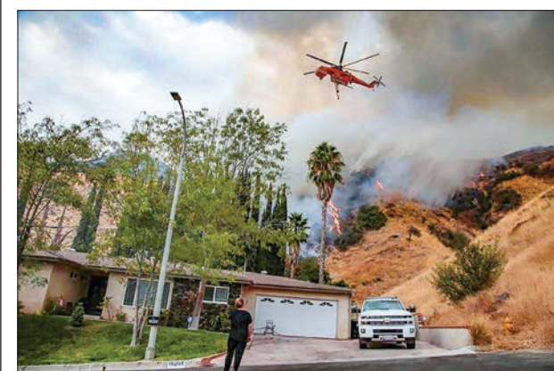
The La Tuna Canyon fire over Burbank, California, on 2 September 2017.

The fire could make air unhealthy to breathe in parts of Los Angeles, the nation's second-largest city, and nearby suburbs, the South Coast Air Quality Management District said in an advisory.—Reuters ■