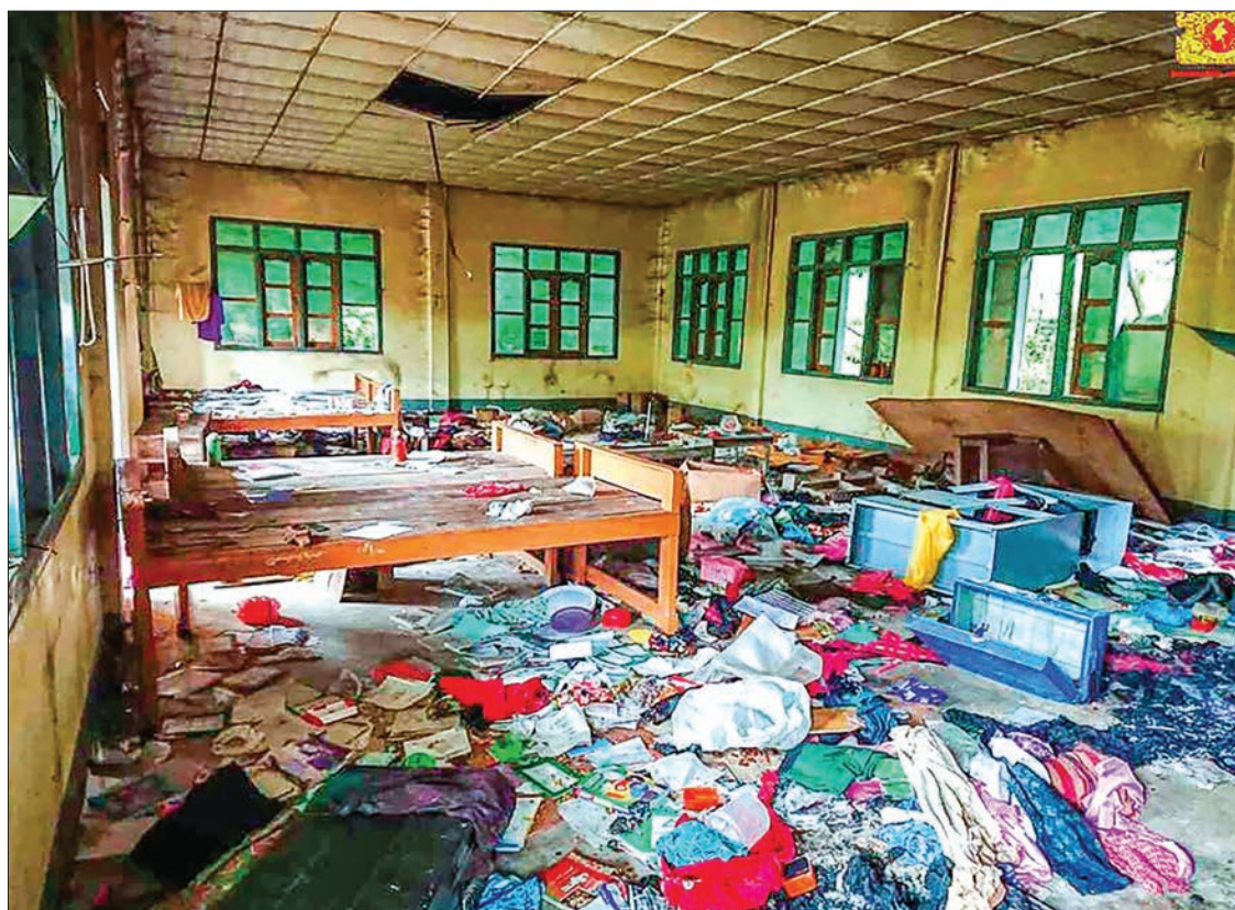
Photo shows the damage caused by ARSA extremist terrorists.

The security forces found that the terrorists cut off all the heads of the Buddha statues of the pagoda and burnt down a monastery, a Buddhist school and 37 homes. —Myanmar News Agency ■