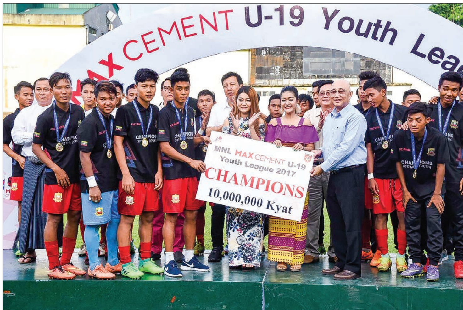
Shan United football players receiving the prize as they won the champion of MNL Max Cement U-19 Youth League 2017.

Myanmar U-18 will play against Indonesia U-18 on Tuesday at Thuwanna Stadium. ■