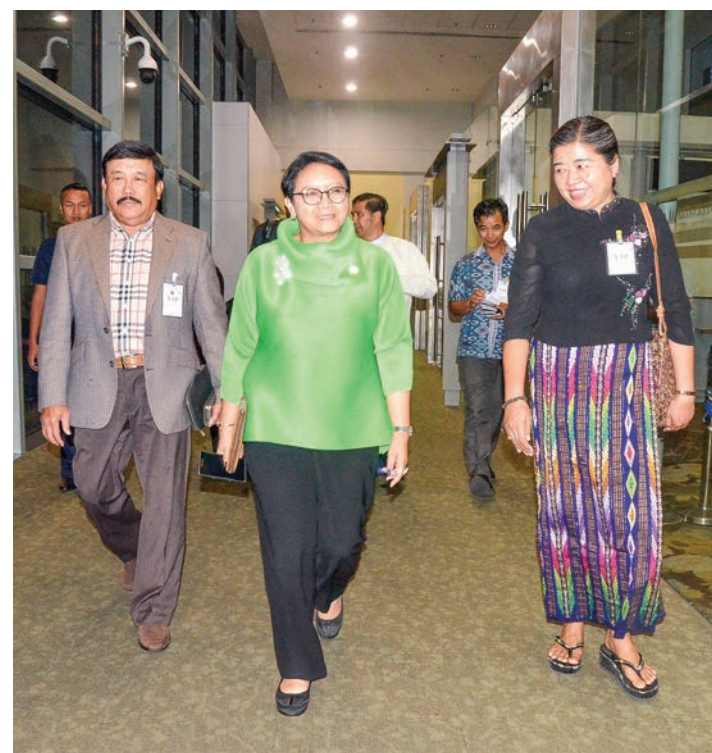
Indonesian Minister of Foreign Affairs, Mrs. Retno LP Marsudi and party arrive in Yangon.

of Strategic Studies and Training Department and officials from the Ministry of Foreign Affairs, Dr. Ito Sumardi, Indonesia Ambassador to Myanmar and officials from the embassy. —Myanmar News Agency ■