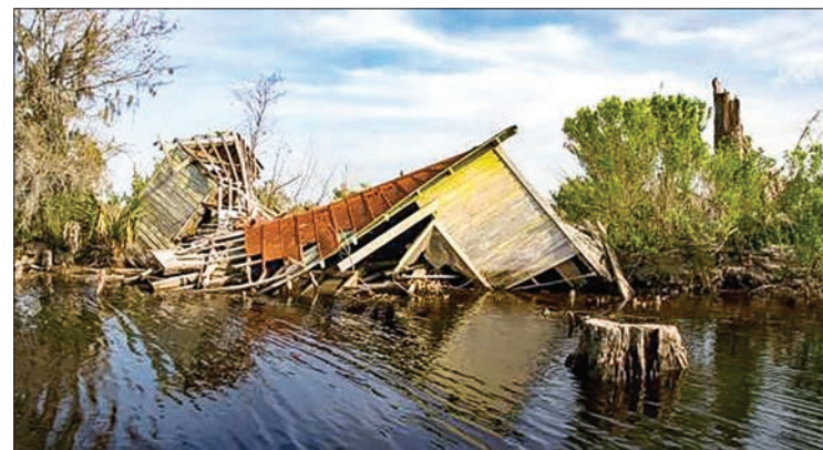
Hurricane Katrina (2005).

years. Even small increases in Earth's temperature caused by climate change can have severe effects. The earth's average temperature has gone up 1.4° F over the past century and is expected to rise as much as 11.5° F over the next 100 years. That might not seem like a lot, but the average temperature during the last Ice Age was about 4° F lower than it is today. Rising sea levels due to the melting of the polar ice caps (again, caused by climate change) contribute to greater storm damage; warming ocean temperatures are associated with stronger and more frequent storms; additional rainfall, particularly during severe weather events, leads to flooding and other damage; an increase in the incidence and severity of wildfires threatens habitats, homes, and lives; and heat waves contribute to human deaths and other consequences. While consensus among nearly all scientists, scientific organizations, and governments is that climate change is happening and is caused by human activity, a small minority of voices questions the validity of such assertions and prefers to cast doubt on the preponderance of evidence. Climate change deniers often claim that recent changes attributed to human activity can be seen as part of the natural variations in Earth's climate and temperature, and that it is difficult or impossible