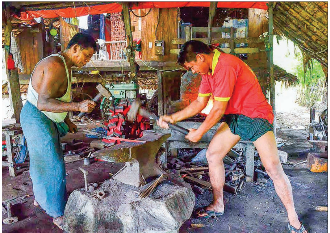
Workers of blacksmith workshop focusing on production of agricultural tools in traditional ways at a village in Kawa Township to survive their livelihoods while agricultural machinery are being used on a wider scale in rural area for cultivation of paddy and crops.

Blacksmiths make about Ks4,000 a day while other skilled workers earn Ks8,000.—GNLM ■