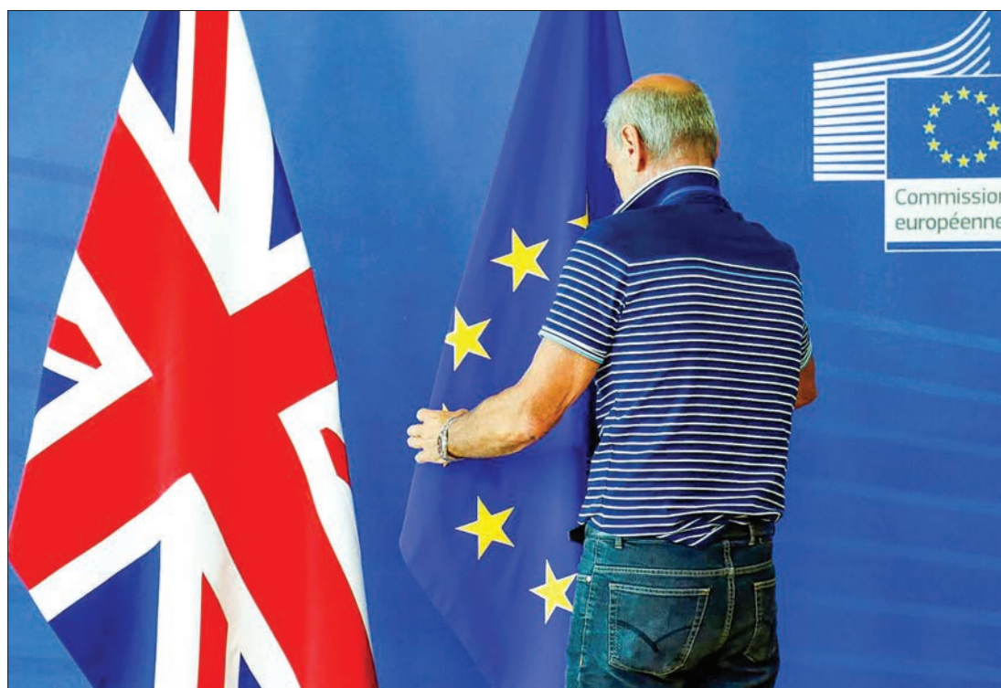
An official adjusts a European Union flag next to a Union Jack flag, ahead of a news conference by Britain's Secretary of State for Exiting the European Union David Davis and European Union's chief Brexit negotiator Michel Barnier in Brussels, Belgium, on 28 August 2017.

“The Repeal Bill ... (is) the single most important step we can take to prevent a cliff-edge for people and businesses, be-