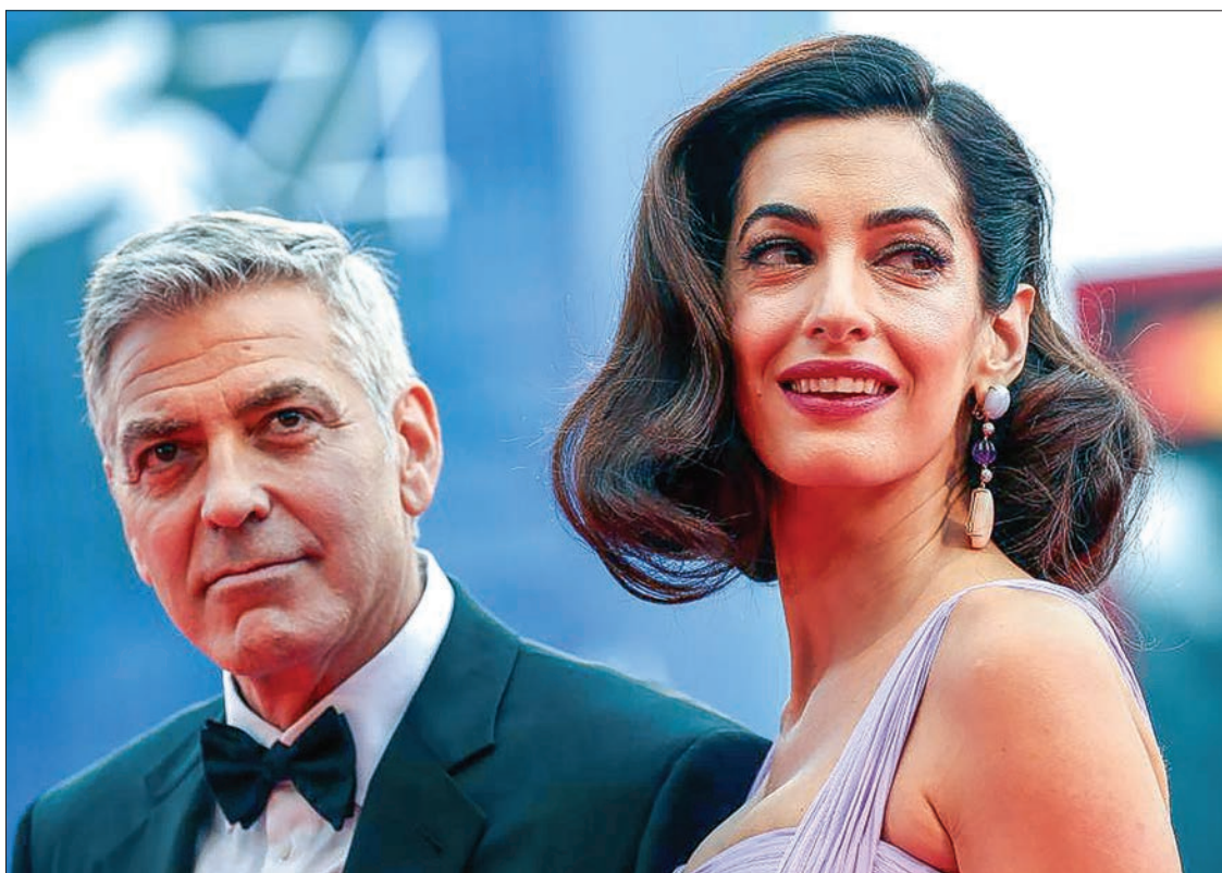
Actor and director George Clooney and his wife Amal pose during a red carpet event for the movie "Suburbicon" at the 74th Venice Film Festival in Venice, Italy, on 2 September 2017.

Clooney, a festival stalwart who got married in a star-studded party in Venice in 2014 and has since made Italy his second home, said the film reflected deep anger in his home country, al-