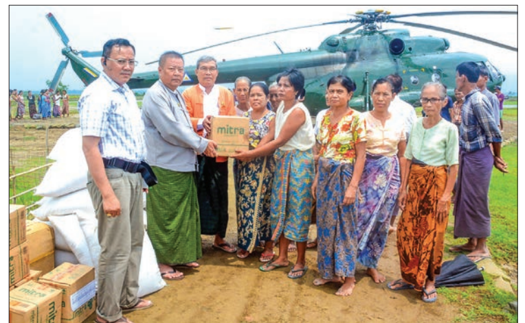
Provisions being handed over to local residents in Ywatnyotaung Village.

In yesterday's expedition, the Chief Minister travelled to Ywatnyotaung, Tamahn-tar and Laungtone villages in Maungtaw to provide food and healthcare. There are 43 houses in Ywatnyotaung Village with diverse ethnicities, 115 houses in Tamahn-tar Village with Rakhine, Daingnet, Thet and Hindu ethnicities and 105 houses in Laungtone Village with Myo, Thet, Daingnet, Burmese and Rakhine ethnicities coexisting together.—Myanmar News Agency ■