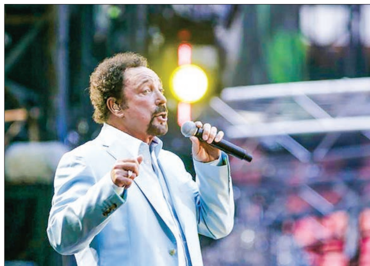
Singer Tom Jones performs at the Concert for Diana at Wembley Stadium in London, on 1 July 2007.

state of Kentucky when he was growing up, when the meaning of the roles assigned had eluded him. "You got to pick if you wanted to be a union or a rebel soldier and I was like give me the rebel, I want to be the rebel. You didn't really understand the history of the Confederate flag ... a flag that was designed to carry into battle ... in favor of slavery." —Reuters ■