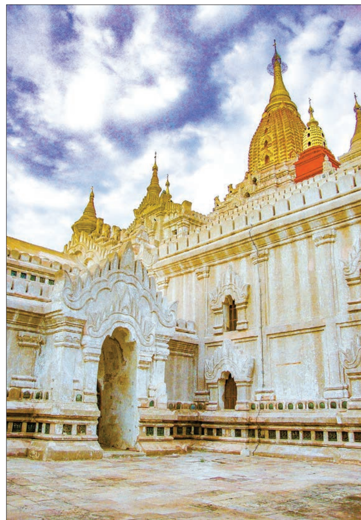
The Ananda temple in Bagan - possibly the next not to be missed UNESCO World Heritage site?.

Cambodia recently got a third temple complex listed as World Heritage Site and the country have seen how much benefits this recognition can