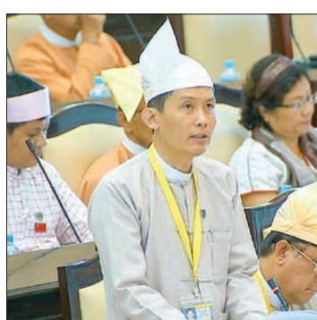
Dr Tun Naing, Deputy Minister for Electricity and Energy.

der way by spending the annual budget allotment for the ministry, by using annual budget allotments for Region and State Cabinets and by getting annually granted loans from international countries. Some villages are implementing the acquisition of electric power on a self-help basis, with the money collected from the villagers to brighten their locations earlier than normal. In doing so, the ministry designated 12 principles to abide by for village committees acquiring electricity. The aims of those 12 principles include long-term