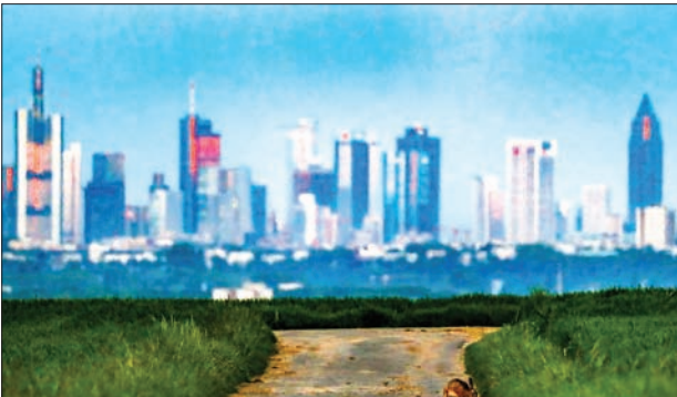
The skyline of Frankfurt, Germany, on 11 May 2017.

FRANKFURT — Around 60,000 inhabitants of Germany’s financial capital Frankfurt will be ordered to leave their homes on Sunday while a large World War II bomb discovered at a building site is made safe, the police said. Germany’s central bank, the Bundesbank, Frankfurt’s Goethe University, and at least two hospitals will also be evacuated, in one of the largest evacuations in German post-war history. The 1.4-tonne HC 4000 bomb dropped by the British air force during World War II was uncovered on a building site on Wismarer Strasse in Frankfurt’s leafy Westend