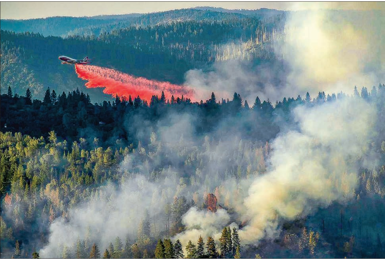
A 747 SuperTanker drops retardant while battling the Ponderosa Fire east of Oroville, California, US, on 30 August 2017.