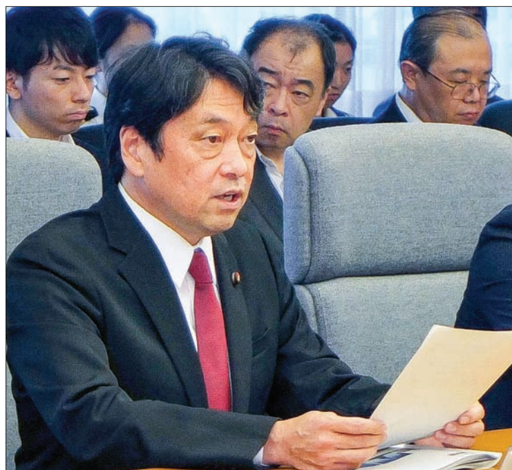
Japanese Defence Minister Itsunori Onodera speaks at a ministry meeting in Tokyo on 31 August, 2017.

Currently, the Maritime Self-Defence Force's destroyers, equipped with the Aegis combat system and Standard