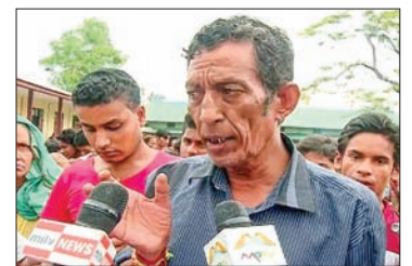
NATIONAL Interview with Hindus who fled from their villages in Maungtau PAGE-6

ARTICLE Cereal, drinks companies often overlook risk of forced labour in sugarcane PAGE-8