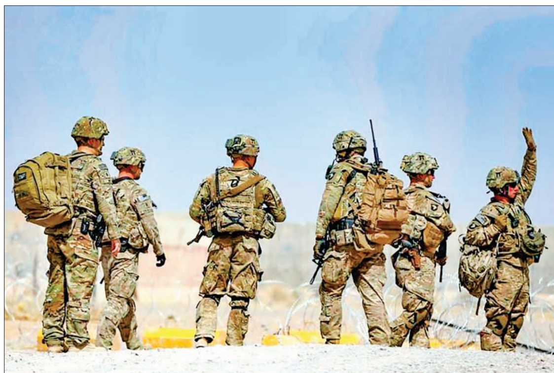
US troops walk outside their base in Uruzgan province, Afghanistan, on 7 July 2017.