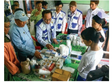
NATIONAL Union Minister for Health and Sports visits Rakhine PAGE-3

more than 500 members of Hindu families in Maungtau who were blocked in by ARSA were evacuated by security forces yesterday. Police carried out security operations to save about 300 people from 70 families in Latha Village and transported them to shelters. SEE PAGE-6