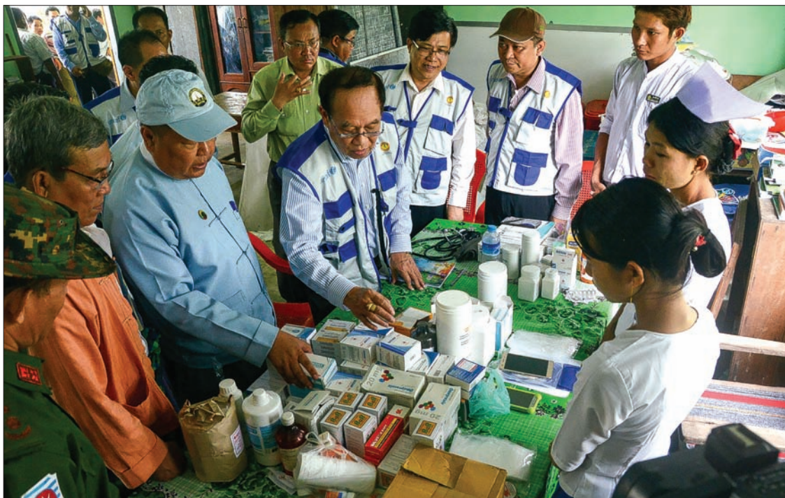
Union Minister Dr Myint Htwe and Rakhine State Chief Minister U Nyi Pu visits a clinic at an IDP camp.

Dr Myint Htwe, the Union Minister for Health and Sports, together with Rakhine Chief Minister U Nyi Pu, Rakhine Minister for Social Affairs Dr Chan Thar and other officials, arrived at Maungtaw yesterday morning and visited Maungtaw General Hospital and a camp for internally displaced people.