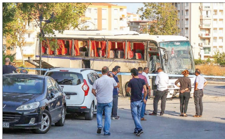
Plainclothes police officers stand after an explosion hit a shuttle bus carrying prison guards in Izmir, Turkey, on 31 August 2017.

"We are getting information from police sources and they are focussing on the possibility of a terrorist attack," he said, adding that all seven wounded were in good condition. Both state-run TRT Haber and private broadcaster Dogan news agency said the explosion was caused by a bomb placed in the garbage container that exploded