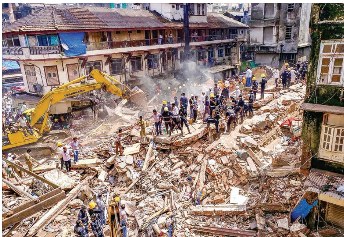
Firefighters and rescue workers search for survivors at the site of a collapsed building in Mumbai, India, on 31 August 2017.

And families were still living there. Desperate relatives pleaded with rescuers to help find their loved ones after getting phone calls from trapped survivors. About 200 police and fire personnel sorted through the debris. Police had yet to determine what caused the collapse near Crawford market, a