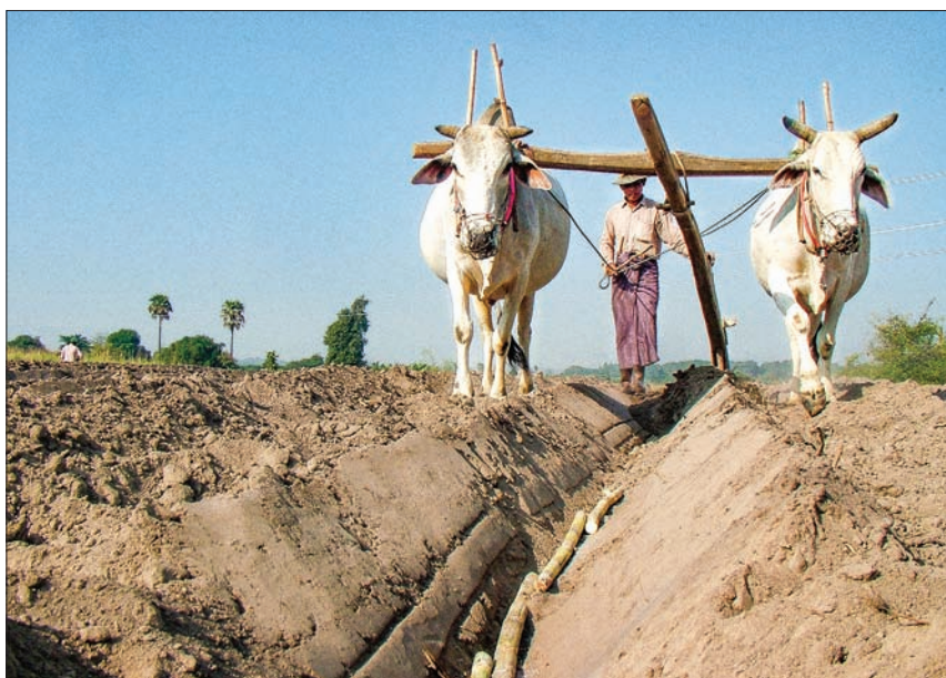
A farmer plants sugarcane in the traditional manner at a farm near Nay Pyi Taw in Myanmar.