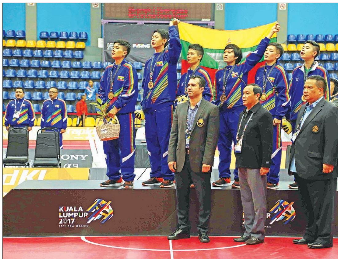
Myanmar Sepak takraw players seen with gold medals at the 29th Sea Games.