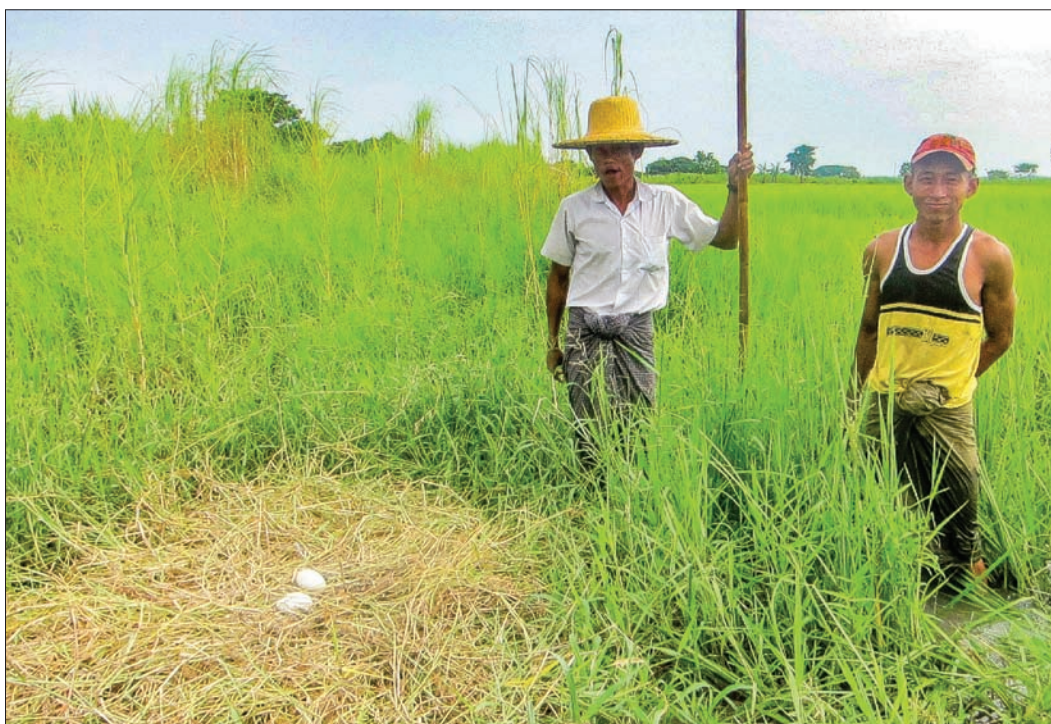
Rare sarus crane eggs seen in Ayeyawady Delta.

Due to limitation of space we are only able to publish "Letter to the Editor" that do not exceed 500 words. Should you submit a text longer than 500 words please be aware that your letter will be edited.