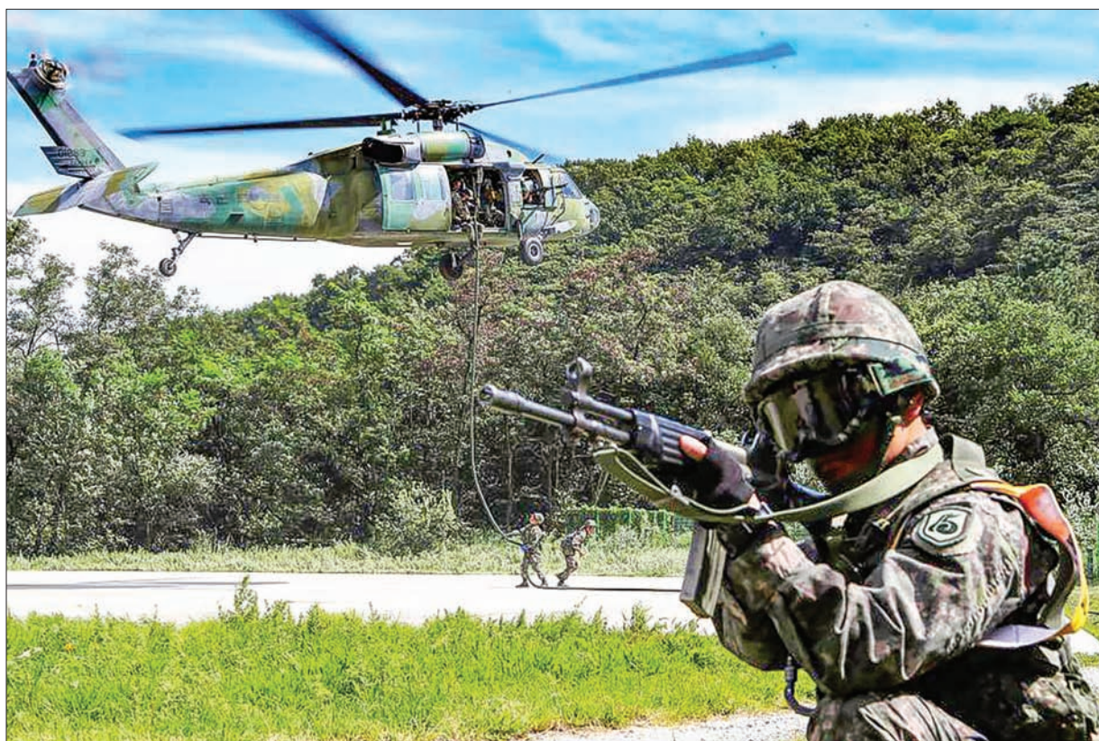
South Korean soldiers take part in a military drill held as a part of the Ulchi Freedom Guardian exercise in Yongin, South Korea, on 29 August 2017.