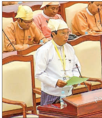
Deputy Minister for Agriculture, Livestock and Irrigation U Hla Kyaw.

Two small-scale fish hatcheries operated by local fish breeders were set up in Thatkekone and Pazinikan villages in fiscal year 2014-2015 with government funding. The laboratory