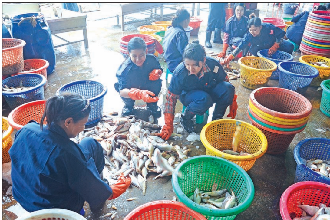
Workers sort fish at the Nyaungtan Jetty in Yangon.