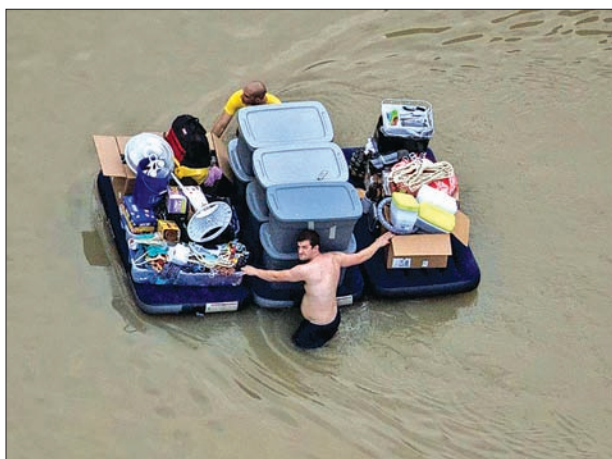
Residents wade with their belongings through flood waters brought by Tropical Storm Harvey in Northwest Houston, Texas, US, on 30 August 2017.

The storm that paralyzed Houston is predicted to be one of the most expensive natural disasters in US history and presents the administration of US President Donald Trump with massive humanitarian and rebuilding challenges.