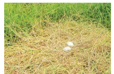
LOCAL NEWS Rare sarus cranes found in Ayeyawady Delta PAGE-4

ARTICLE Cereal, drinks companies often overlook risk of forced labour in sugarcane PAGE-8