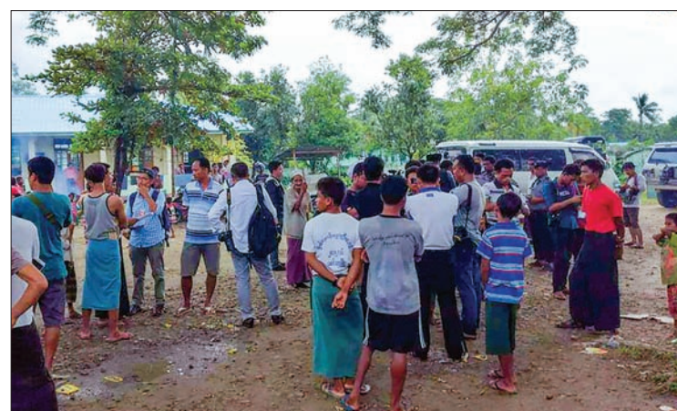
Independent journalists interview local people from conflict areas.