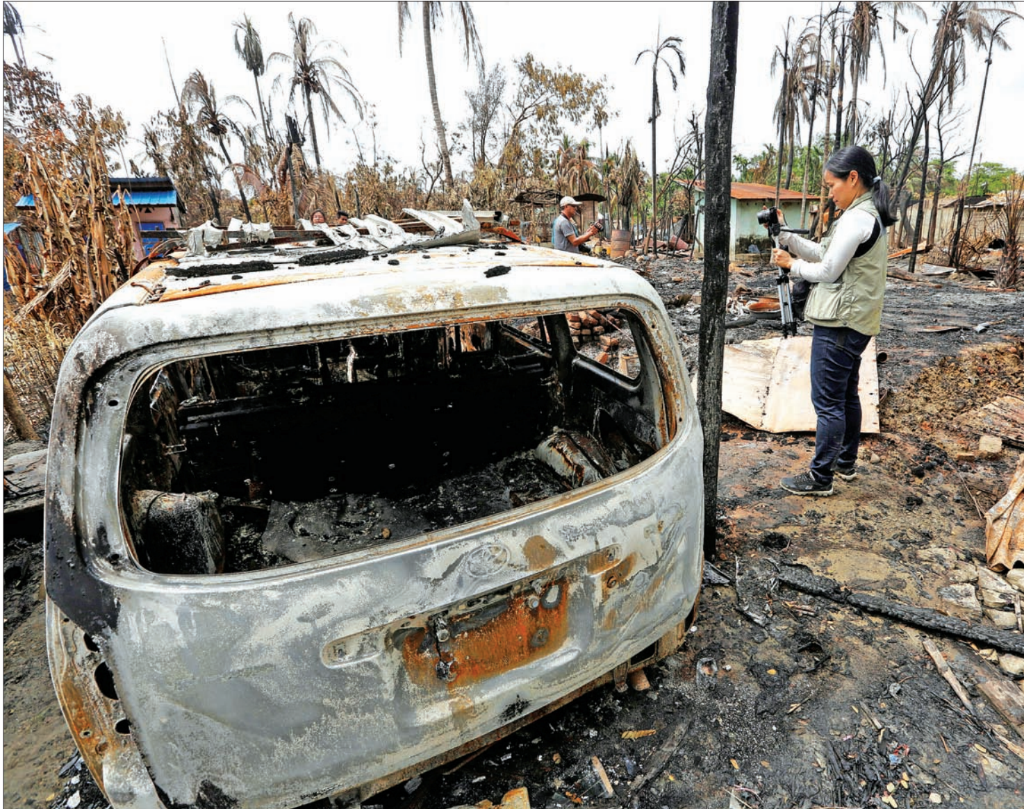
An independent journalist records video footage of a destroyed car near a house that was burnt down in an ARSA extremist terrorist attack in Maungtau yesterday. One terrorist was killed and four were arrested, including one 13-year-old boy.