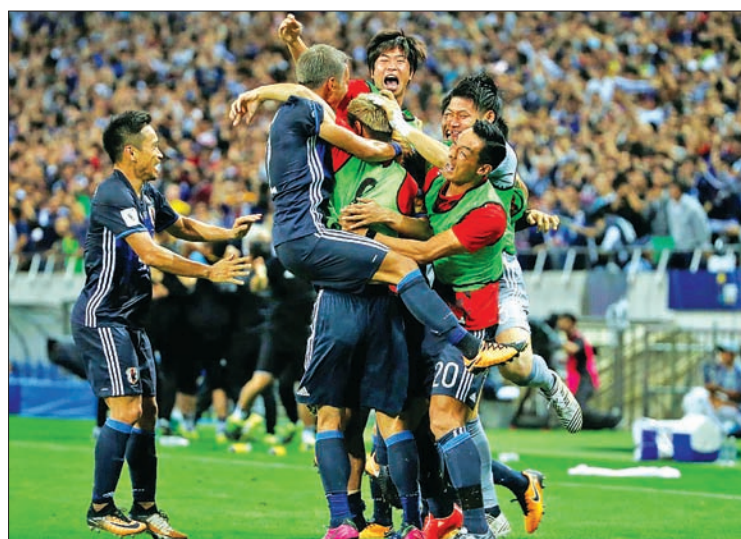
Japan's Ideguchi Yosuke (C) celebrates his goal with teammates during World Cup 2018 Qualifiers at Saitama Stadium 2002, Saitama Japan, on 31 August 2017.

Japan are now assured of finishing top of Group B in Asian qualifying before their final match away to second-placed Saudi Ara-