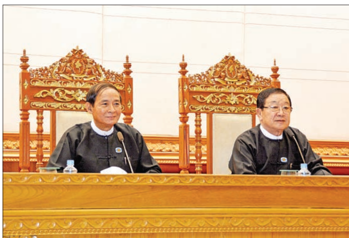
Speaker of Pyithu Hluttaw U Win Myint (left) meets with local and international news media reporters in Nay Pyi Taw.