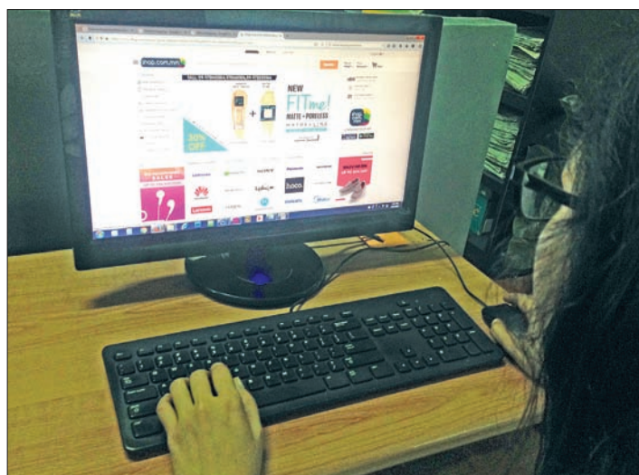
A woman browses on a desktop computer.

Regarding this matter, Myanmar retailers and the officials from the Commerce Ministry had a brief meeting. Additionally, this matter was already raised at regular meeting between Vice President U Myint Swe and the entrepreneurs.