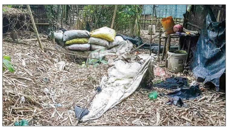
Banker built by ARSA extremist terrorists inside a village.