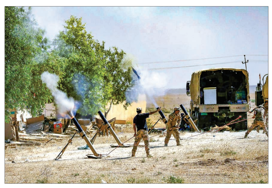
Members of Iraqi Army fire mortar shells during the war between Iraqi army and Shi'ite Popular Mobilization Forces (PMF) against the Islamic State militants in al-Ayadiya, northwest of Tal Afar, Iraq on 28 August, 2017.

Though the exact numbers of militants on the ground in al-'Ayadiya was still unclear, al-Lami, the Iraqi Army colo-