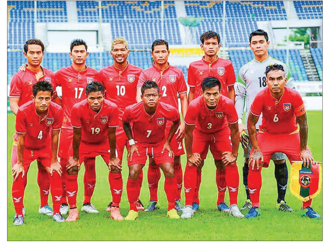
Myanmar national football team seen at an international football match . PHOTO MFF

The 2019 AFC Asian Cup qualification is the qualification process organised by the Asian Football Confederation (AFC) to determine the participating teams for the 2019 AFC Asian Cup, the 17th edition of the international men's football championship of Asia. For the first time, the Asian Cup final tournament will be contested by 24 teams, having been expanded from the 16-team format that had been used since 2004.