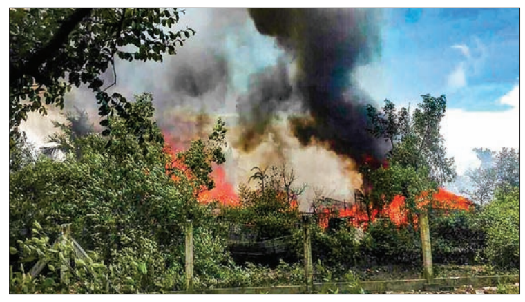
ARSA extremist terrorists burn down homes in Maungtaw.