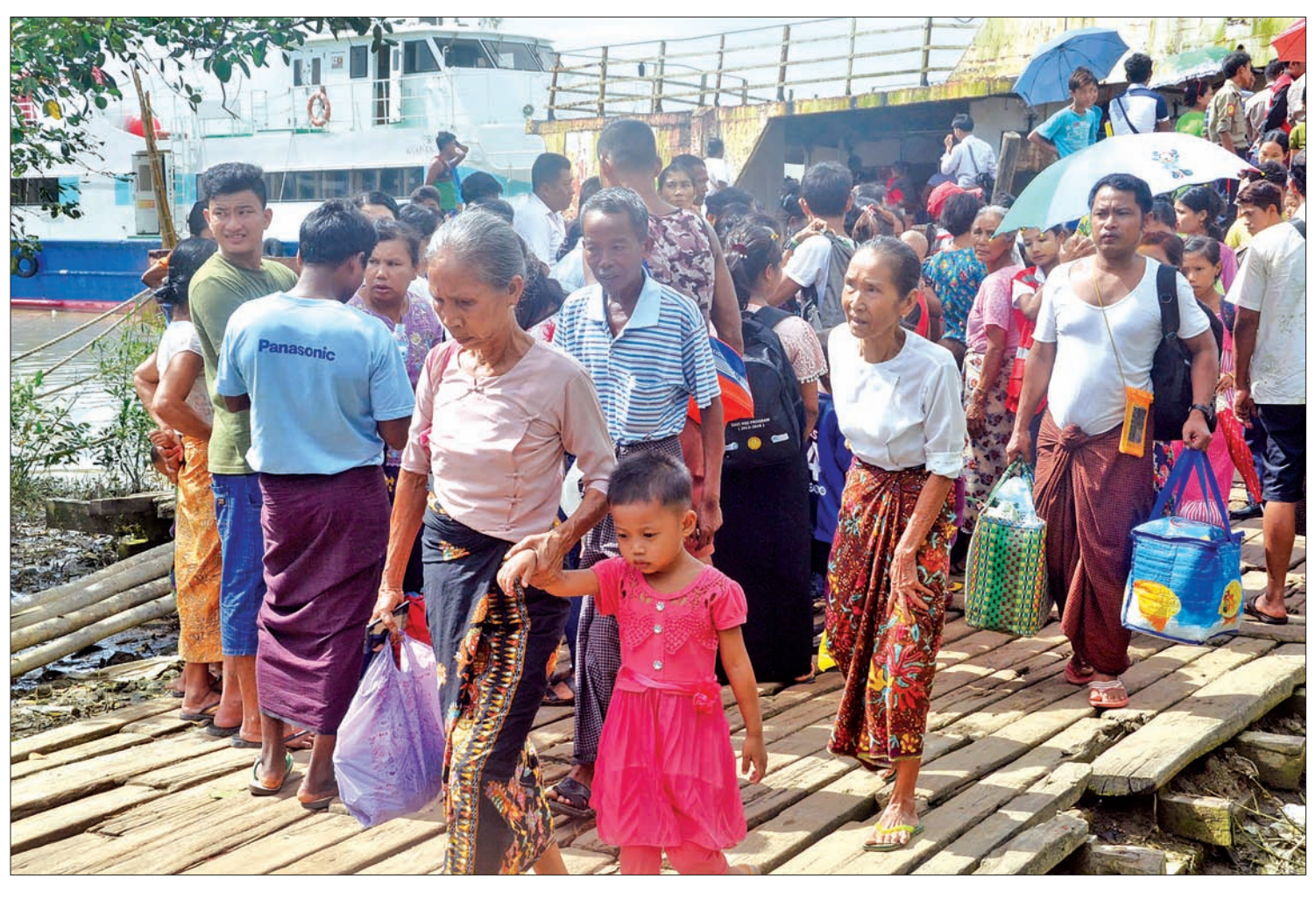
Villagers from northern Rakhine State fled to Sittway above, and Bangladesh border to escape the ongoing terrorist attacks.