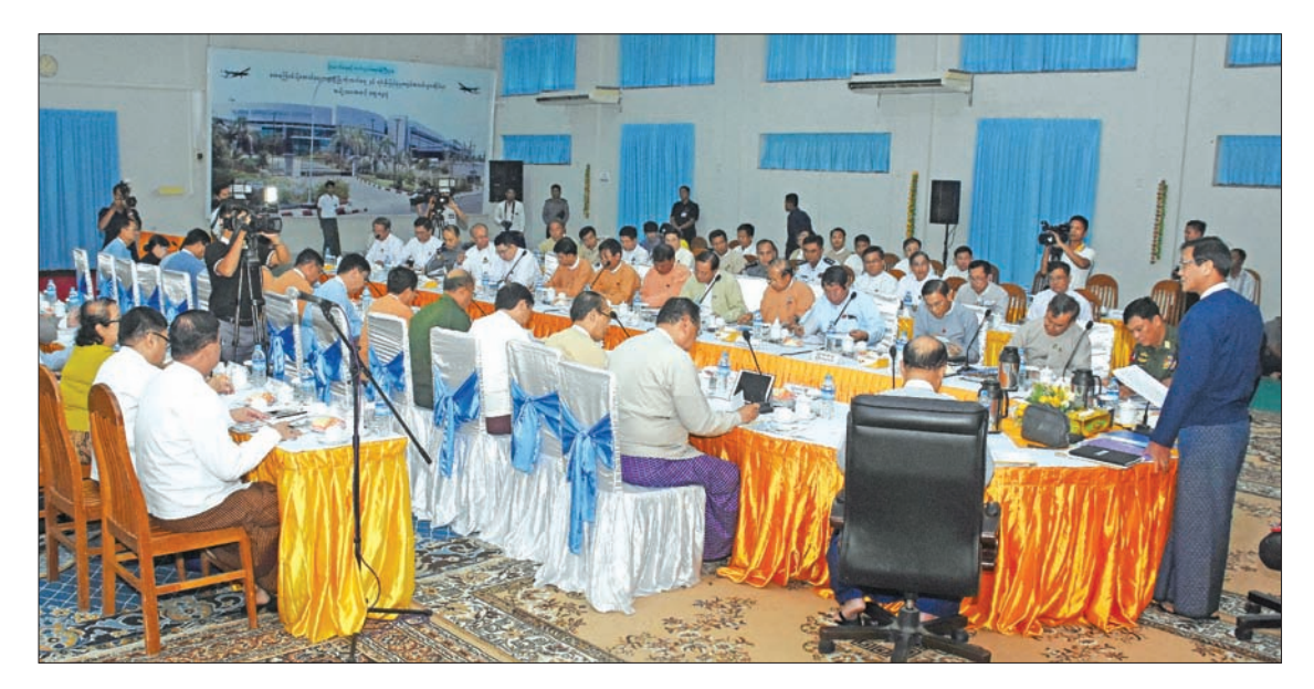
U Henry Van Thio addresses the 3rd meeting of the National Road Safety Council-NRSC.

U Henry Van Thio, Vice-President and Chairman of National Road Safety Council (NRSC) addressed the third meeting of the council at the Ministry of Transport and Communications in Nay Pyi Taw and spoke about basic steps toward improving road safety such as the use of seat belts, abstaining from use of mobile phones and driving more slowly.