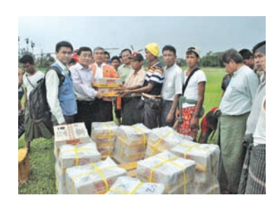
NATIONAL Ethnic people in Mingyi and Tamanthar villages provided with aid PAGE-3