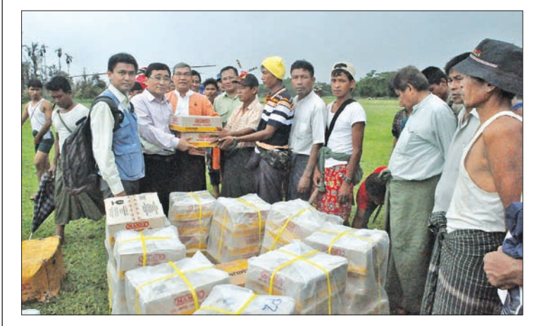
Dr Win Myat Aye hands over the aid to ethnic people during his tour of Mingyi and Tamanthar villages.

In the morning, packs of instant noodle and fried fish were provided to local ethnic people in Mingyi and Tamanthar villages. In the evening, the party led by U Nyi Pu, Chief Minister of Rakhine State and U Soe Aung, permanent secretary of the Ministry of SWRR visited Htarein, Yan Aung Myin, Kyauk Pandu villages, giving words of encouragement and providing provisions and drugs. Moreover, feeble mother and new-born baby from Kyauk Pandu village were brought to Sittway, general hospital by helicopter for medical treatment. The Ministry of SWRR supported monetary aids and necessary social affairs for them will be fulfilled by the ministry. —Myanmar News Agency