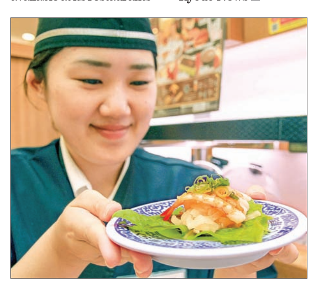
A woman holds up a plate of a low-carbohydrate sushi-like dish using Japanese white radish in place of orthodox vinegared rice in Osaka on 29 August,

"We hope (the dish) will be savored deliciously with vegetables, without (the consumer) worrying about sugar content," said an official of the sushi chain. —Kyodo News ■