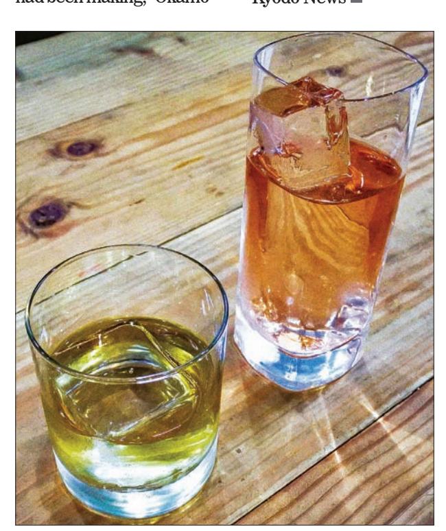
Photo taken on 15 August, 2017, in New York shows beverages using specialty ice crafted by ice sculptor Shintaro Okamoto for cocktail bars. Okamoto's ice is perfectly clear with no air bubbles inside, and the feature makes it slow to melt.

(03:00 \text{ Am} \sim 07:00 \text{ Am}) -Today Repeat 07:00 \text{ Am} \sim 11:00 \text{ Am}) (For Detailed Schedule - www.myanmaritv.com/schedule)