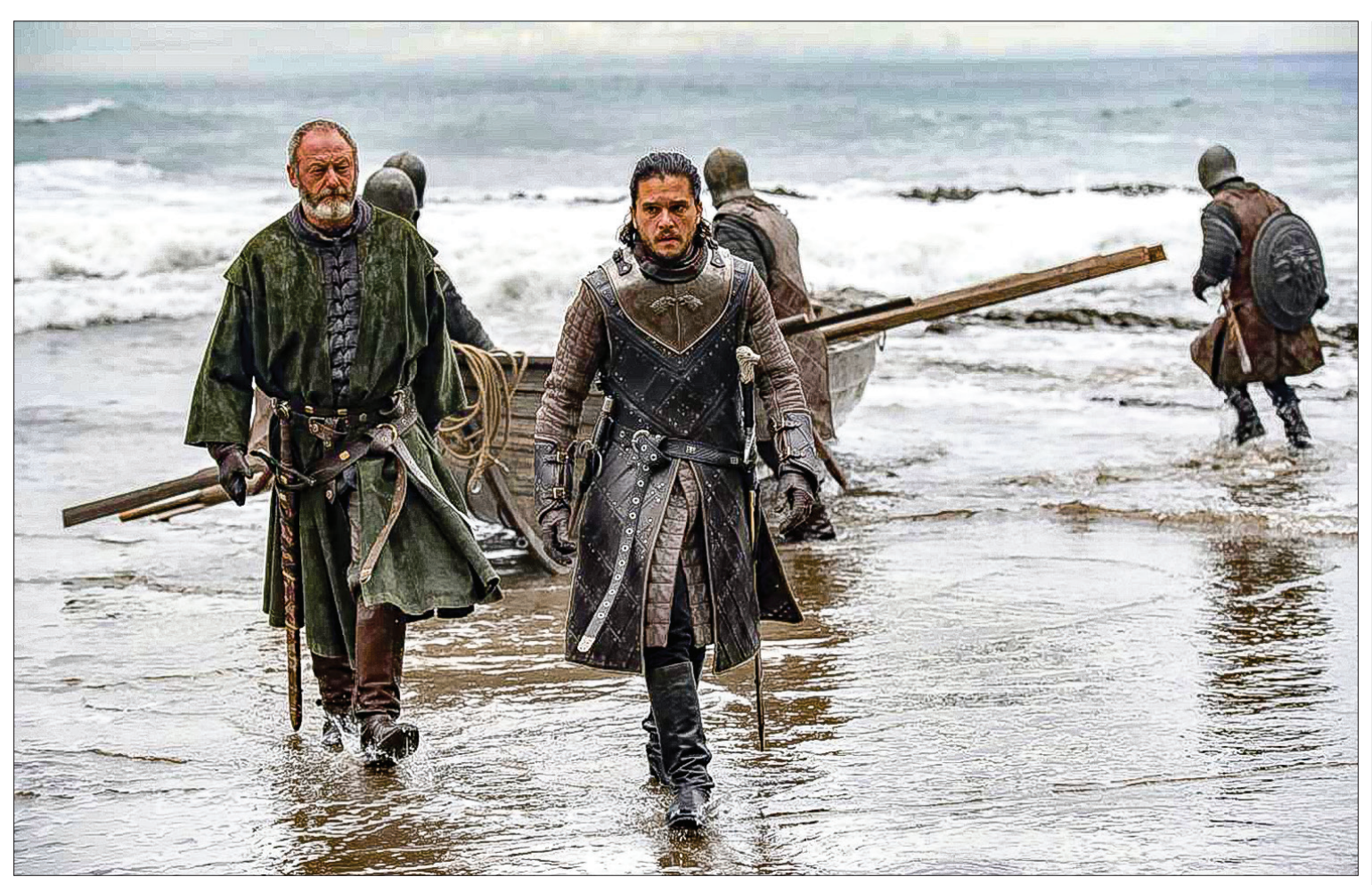
A scene from the latest season of "Game of Thrones".

SOCIAL 30 AUGUST 2017 THE GLOBAL NEW LIGHT OF MYANMAR