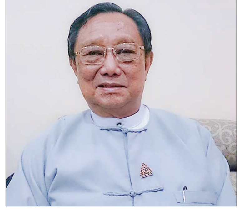
\label{thm:continuous} U\,Than\,Lwin, former\,deputy-governor\,of\,the\,Central\,Bank\,of\,Myanmar.

The government should consider other ways to attract foreign investors. It needs to reduce tax