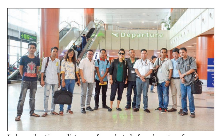
Independent journalists pose for a photo before departure for Sittway at the Yangon International Airport.

A: Medicines are adequately provided to hospitals in Buthidaung and Maungtaw as well as village health clinics. Police personnel and people killed and hurt by ARSA extremist terrorists were provided with financial supports. The events that occurred will be properly reviewed and the union government will be coordinated with.—MNA