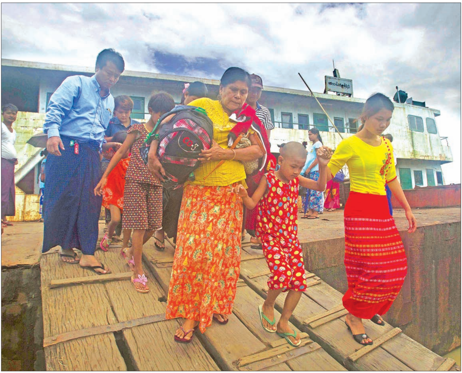
Ethnic Rakhine disembark from a boat that brought them from violence-plagued Maungtaw to Buthidaung, Rakhine State.