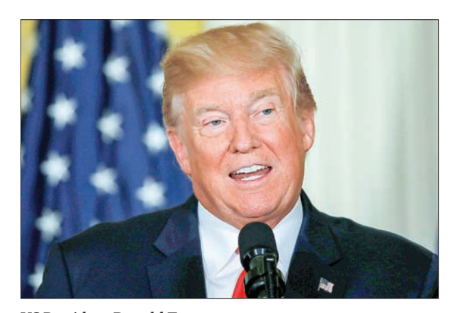
US President Donald Trump.

At a campaign-style rally in Phoenix last week, Trump doubled down on his earlier demands that Congress fund a Mexican border wall in government spending legislation, adding a clear threat. "If we have to close down our government, we're building that wall," he told supporters.