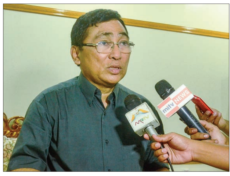
Union Minister for Social Welfare, Relief and Resettlement Dr Win Myat Aye speaks during the interview.

On 28 August, we saw some areas and villages burned by ARSA extremist terrorists. The city entrance to Maungtaw was also burnt and we went to the gathering places of the villagers. In Taunbazar there were about 633 displaced people and 25 hu-