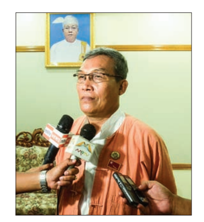
Rakhine State Chief Minister U Nyi Pu speaks during the interview.

A: Arrangements will be made to reconstruct the damaged homes once the ethnic nationals return to their respective places. Records will be made of damages and losses, which village had how many number of houses, the population etc. With this complete information and records, reconstruction will be done speedily. Requirements of the ethnic nationals will also be