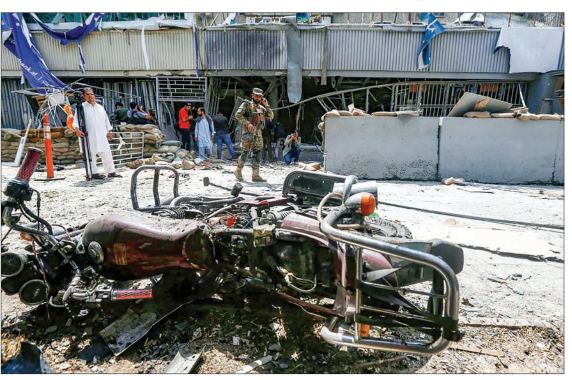
An Afghan security force stands guard at the site of a suicide bomb attack in Kabul, Afghanistan on 29 August, 2017.

Attacks on banks where soldiers and police withdraw their salaries have become a regular tactic of the Taliban and the movement's spokesman Za-