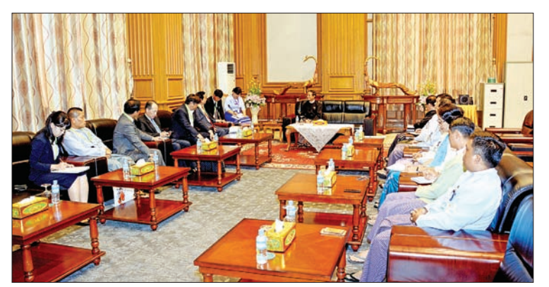
Pyithu Hluttaw Speaker U Win Myint holds talks with Mr Kozo Yamamoto in Nay Pyi Taw.

In a separate issue, U Khin Myo Win of Taninthayi Region constituency 12 tabled a motion urging the government to conduct proper inspections and record keeping of all landed fish at ports before sending it to processing plants or loading it on ships for export. In tabling the motion, U Khin Myo Win said the volume of Myanmar fishery and aquaculture exports are ten times less than that of neighbouring countries like Thailand and Viet Nam. The motion had originally been brought forward to ensure the long-term development of fishery and aquaculture resources in Myanmar and to obtain adequate taxes. Amyotha Hluttaw Speaker Mahn Win Khaing Than announced the Hluttaw's acceptance to discuss the motion after he obtained the decision of the Hluttaw.