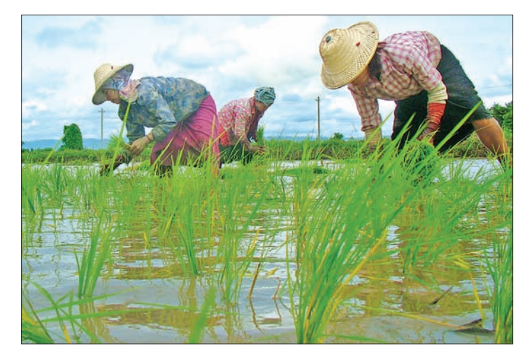
Farmers plant rice seedings in Nay Pyi Taw.

About 8,900 tons of broken rice with an estimated value of $2.2 million was exported to