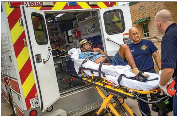
A man, who lost his home to Hurricane Harvey, is loaded into the back of an ambulance in Rockport, Texas, US, on 26 August 2017.

“It appeared that her vehicle went into high water and she drowned as a result,” he said. The victim was not immediately identified.