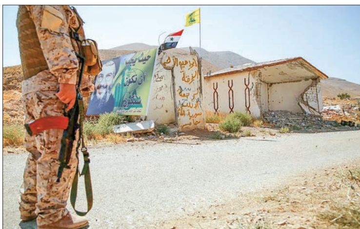
A Hezbollah fighter stands as he holds his weapon in Western Qalamoun, Syria, on 23 August 2017.

The fighting began a week ago when the Lebanese army,