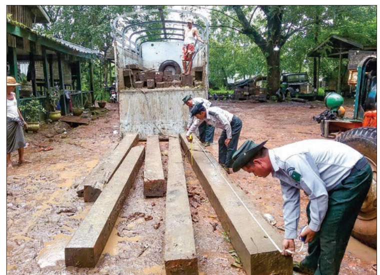
Police members measuring seized timber.

Police are still investigating the case in an effort to question the driver of the truck and one other person who fled from the scene.—Maung Maung Than Win ■