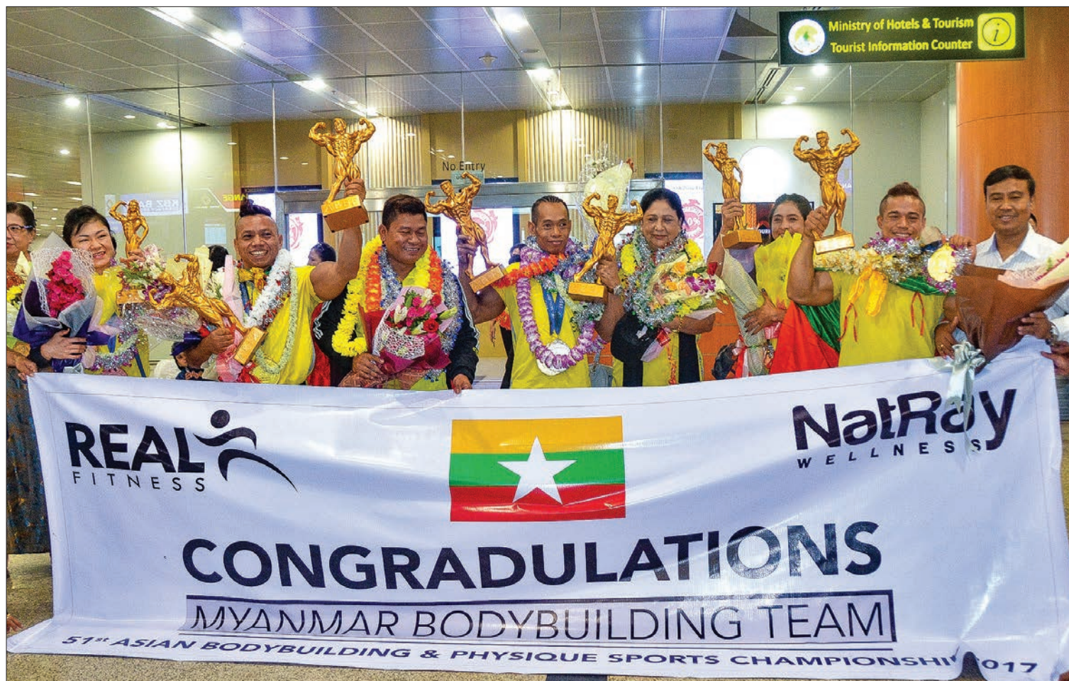
Myanmar bodybuilders seen with the gold medals at the Yangon International Airport.