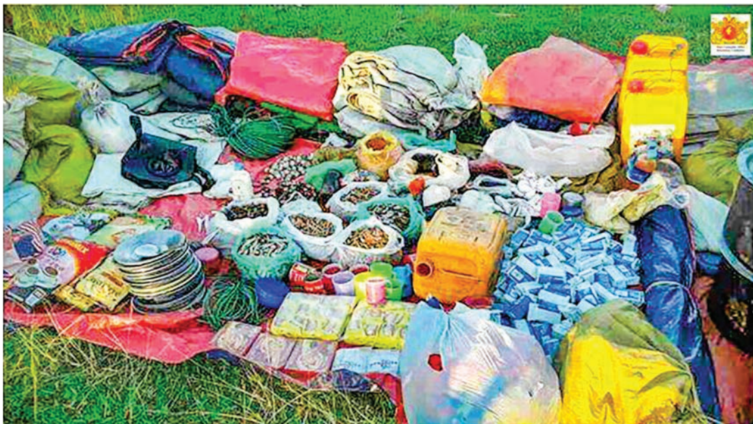
Utensils and construction material seized from extremist terrorists.

It is highly important to stamp out the extremist terrorists and ARSA since the Counter-terrorism is the common interest for the families of the world, international organizations including the United Nations, and international