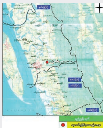
The red spot on the map shows where the murders took place.

family, all of them Hindus, sought cover in a nearby construction site. Two men, a woman and three children were killed. Two other women were critically injured. Four children survived without injury. The dead were taken to Maungtaw Hospital. —Myanmar News Agency ■