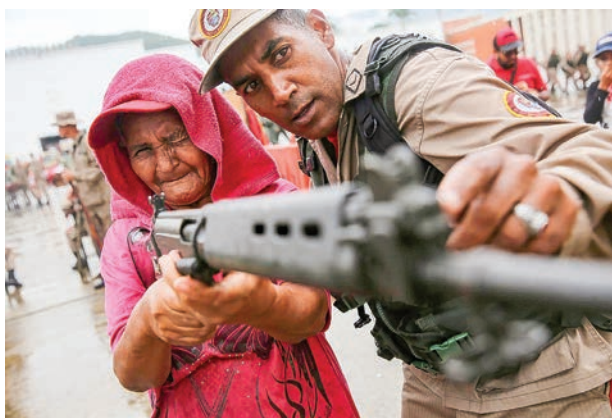
A member of the Militia of the National Bolivarian Armed Forces teaches a woman how to use a rifle during a military exercise in Caracas, Venezuela, on 26 August, 2017.

TV images showed Venezuelans young and old entering military reserve registration centres. But there was no evidence