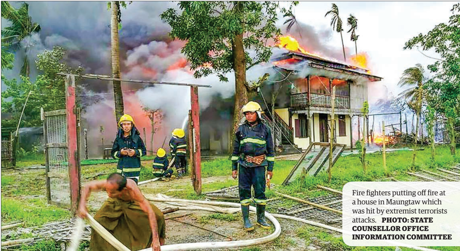
Fire fighters putting off fire at a house in Maungtaw which was hit by extremist terrorists attacks.

EXTREMIST terrorists blew out improvised bombs, set fire the villages and attacked the police outposts in Region-2 of Maung-taw yesterday from the morning to afternoon.