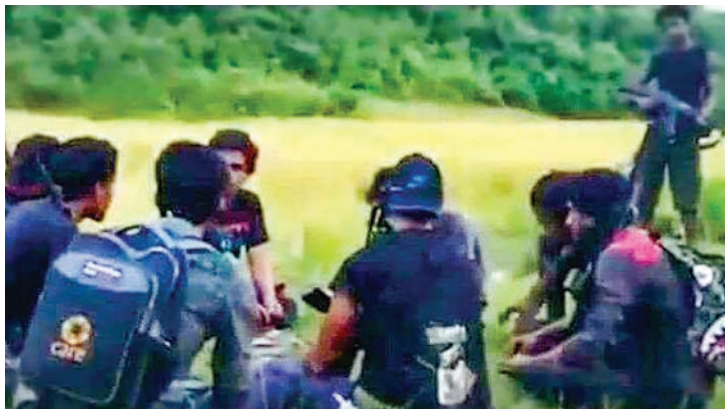
Extremist terrorists hatching plot for another brutal attack.

Information Committee of State Counsellor's Office issues the warning notification which states not to do supporting to or abetting the extremist terrorists and ARSA, supplying, or writing in medias in support of extremist terrorists and ARSA, it is learnt.