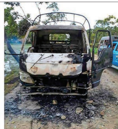
Equipment left behind by terrorists.