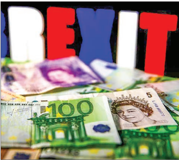
Euro and Pound banknotes are seen in front of BREXIT letters in this picture illustration taken in 2017.

to its stance that “sufficient progress” must be made in those areas before moving on to any discussion of the future relationship. The new series of talks begin as Britain’s economy is starting to show the strain of last year’s vote to leave. After a prolonged period of relatively benign economic numbers following last year’s there are now signs of a potentially serious slow down — including in household spending and business investment. —Reuters ■