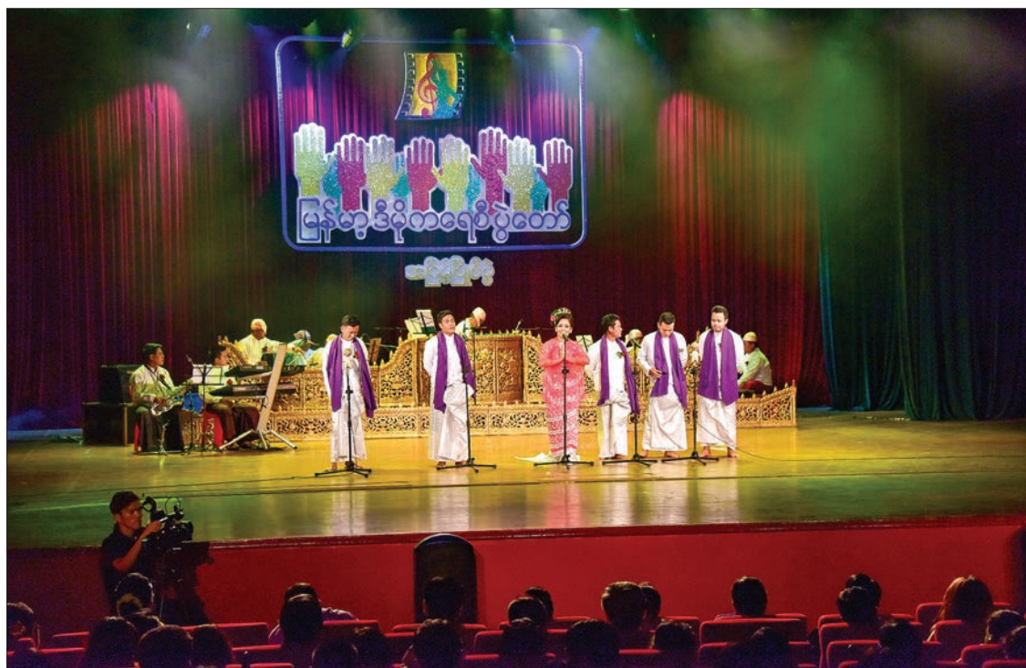
Anyient contest in progress at National Theatre in Yangon.