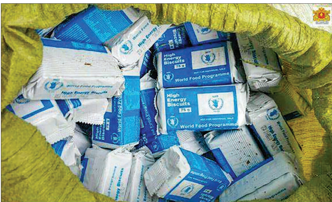
Food delivered by WFP to IDP camps are found in the hidden tents of terrorist

governments. In this warning notification, supporting to or abetting the extremist terrorists and ARSA, supplying, or writing in medias in support of extremist terrorists