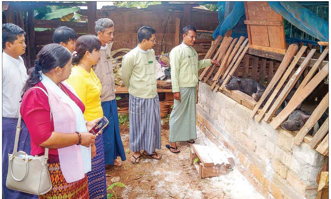
Officials surveying from animals.

An official of the department said Myanmar has not conducted a national live-stock survey since 1993. —Ko Htwe (Pekon) ■