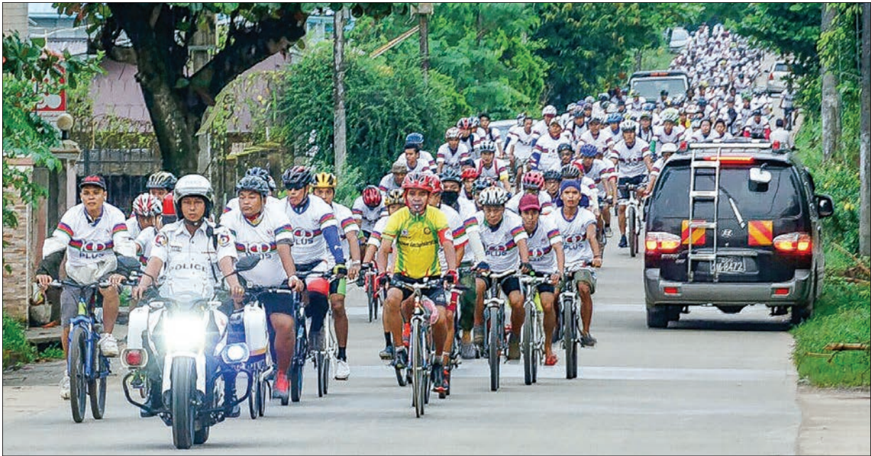
Bicyclists tour for 15th annual event in Yangon.

ABOUT 200 Bicyclists toured Yangon yesterday for their 15 th annual event to promote health and fitness and annual biking event in Yangon south district, activity for health and fitness. Riders in Mandalay