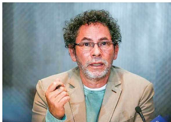
Pastor Alape, a member of the Revolutionary Armed Forces of Colombia (FARC), gestures during a news conference in Bogota, Colombia in March 2017.

The FARC’s often-old fashioned Marxist rhetoric strikes many as a throwback to their 1964 founding, but proposals for reforms to labyrinthine property