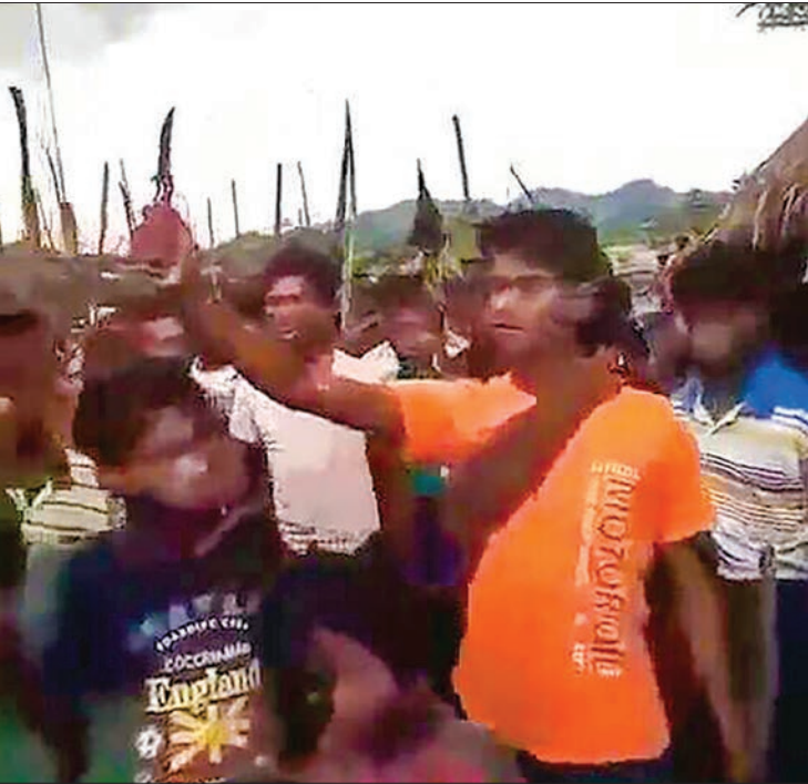
Extremist terrorists gathering to commit atrocities against innocent ethnic people.

yar police outpost and an IED in the village. Similarly, two improvised explosive devices went off in Kyaukhlaygar Village. They also destroyed Pyathat Village.