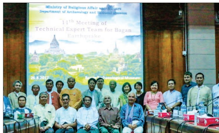
Participants pose for group photo.