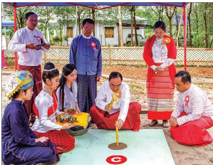
Stakes driven in for building an ethnic affairs office in Mawlamyine.

The special construction group 13 of the Ministry of Construction is building the 48-ft by 60-ft two-storey