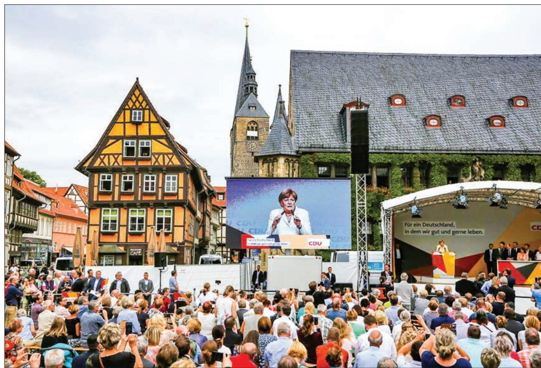
German Chancellor Angela Merkel a top candidate for the upcoming general elections of the Christian Democratic Union party (CDU) gives a speech during an election campaign rally in Quedlinburg, Germany, on 26 August 2017.

borders contributed to a surge in support for the far-right Alternative for Germany (AfD) party, which pollsters say could win up to 10 percent in the September election.