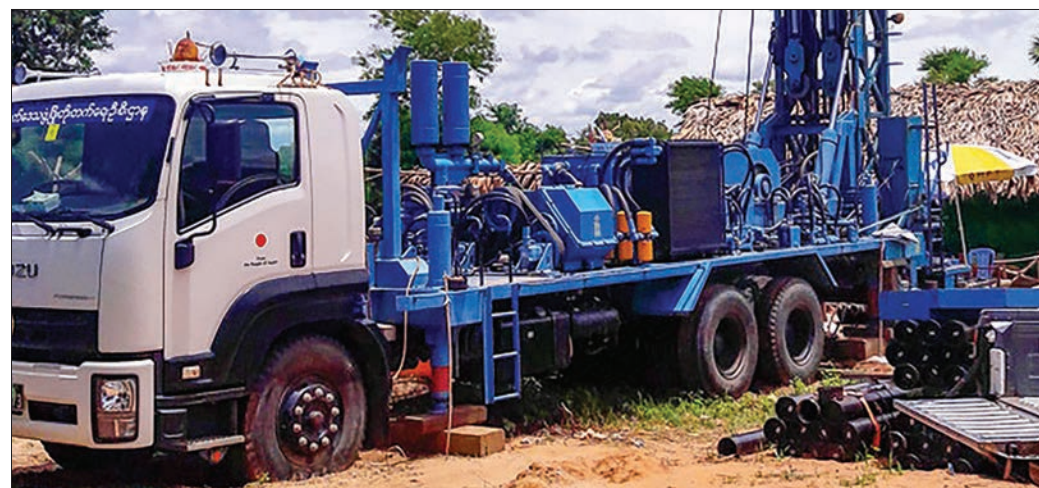
A tube-well is drilled in the arid zone of Myanmar.

The project began 7 August.—Ko Nay (Kyaukpadaung) ■