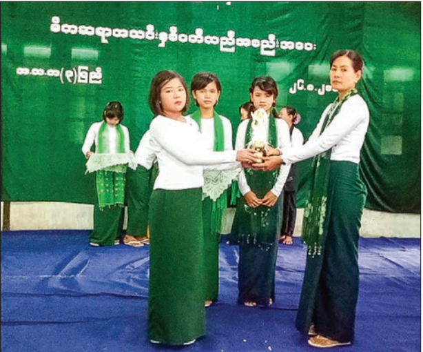
First prize winner received the award at BEMS, Pyay.