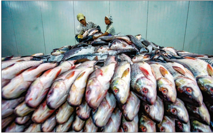
Employees work at a fish export factory at Hlinetharya Industrial Zone in Yangon.