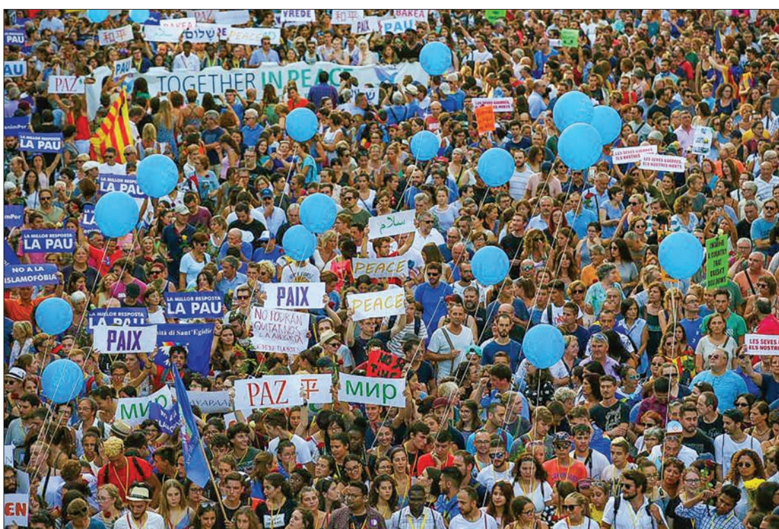
People hold signs as they take part in a march of unity after the attacks last week, in Barcelona, Spain, on 26 August 2017.

Members of Spain's Islamic community marched alongside