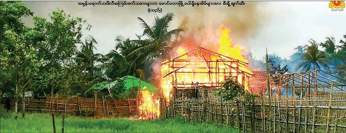
Extremist terrorists turn homes into inferno.