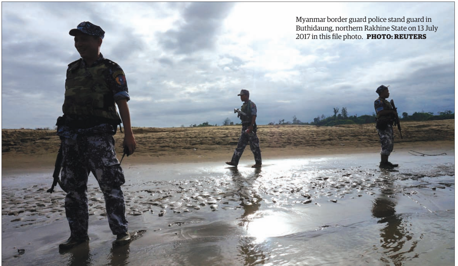
Myanmar border guard police stand guard in Buthidaung, northern Rakhine State on 13 July 2017 in this file photo.