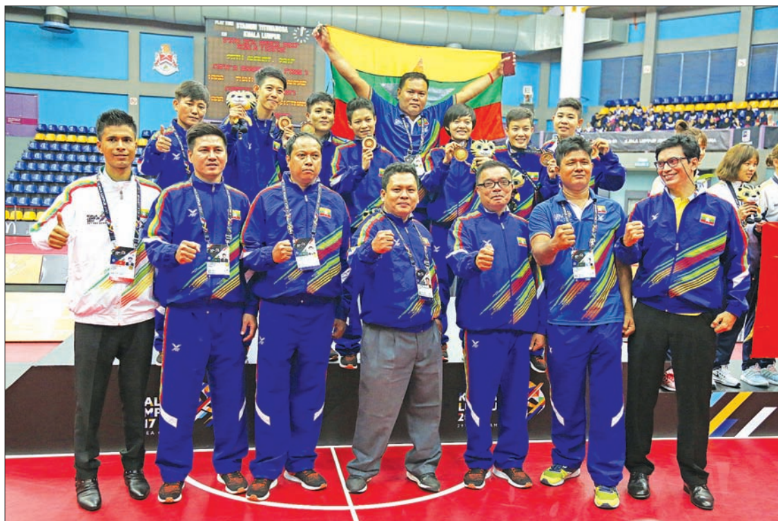
Myanmar Sepak Takraw team seen with gold medals at Titiwangsa Stadium in Kuala Lumpur yesterday.

Myanmar has already earned six gold medals, eight silver medals and 12 bronze medals at this year's SEA Games. —Public Sports and Educative Department ■