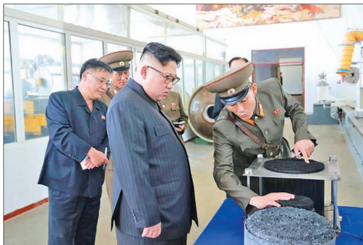
North Korean leader Kim Jong-Un looks on during a visit to the Chemical Material Institute of the Academy of Defence Science in this undated photo released by North Korea's Korean Central News Agency (KCNA) in Pyongyang on 23 August 2017.

The United States on Tuesday imposed new North Korea-related sanctions, targeting Chinese and Russian firms and individuals for supporting Pyongyang's weapons programmes, including a Namibia-based subsidiary of a Chinese company and a North Korean entity operating