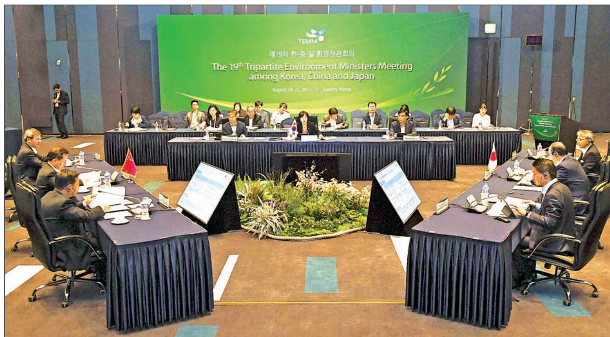
Japan's Environment Minister Masaharu Nakagawa and his Chinese and South Korean counterparts — Li Ganjie and Kim Eun Kyung — attend trilateral environmental talks in Suwon, South Korea, on 25 August 2017.

The fire ants are known for their sting, which can cause anaphylaxis, a severe allergic reaction that can lead to