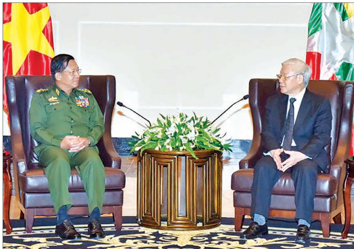
Senior General Min Aung Hlaing holds talk with Mr. Nguyen Phu Trong.

Commander-in-Chief of Defence Services Senior General Min Aung Hlaing held talk with on visiting General Secretary, Communist Party of Viet Nam's Central Committee Mr. Nguyen Phu Trong at Thazin Hall, Hilton Hotel, Nay Pyi Taw yesterday morning.