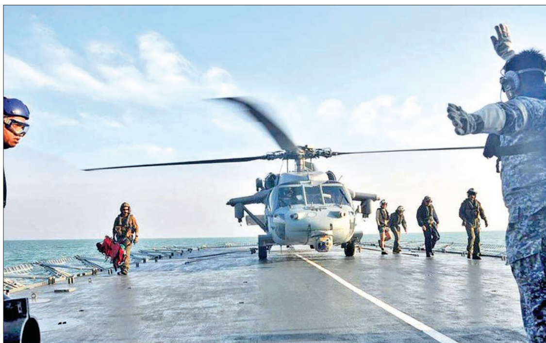
US Navy helicopter from USS America lands on Royal Malaysia Navy's KD Lekiu Frigate 30 during a search and rescue operation for survivors of the USS John S. McCain ship collision in Malaysian waters in this handout photo distributed, on 23 August 2017.

The Navy has already released the names of all the sailors who were missing.—Reuters ■