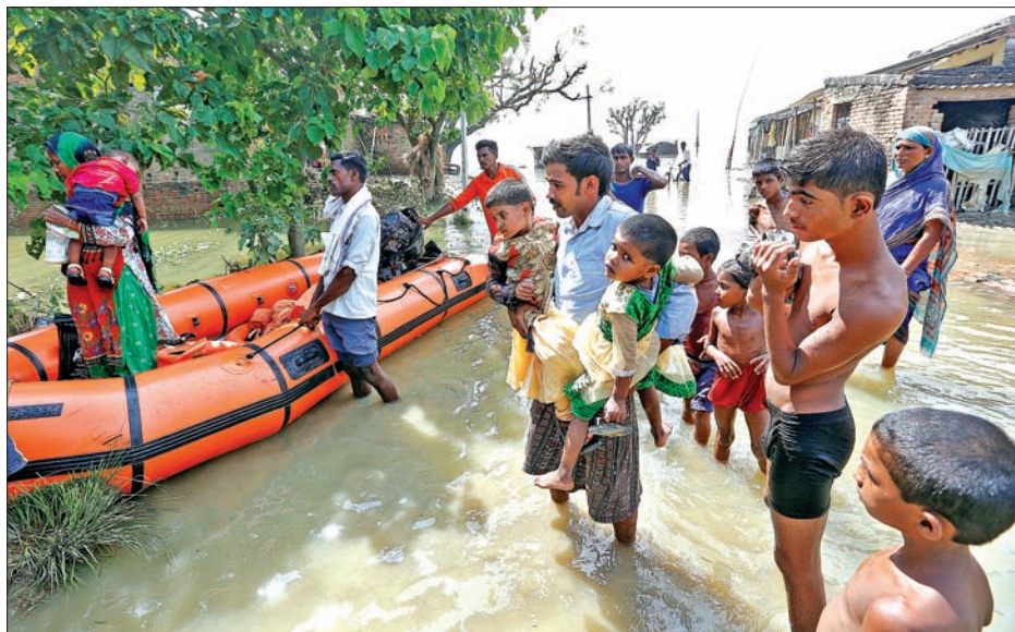
People are rescued from a flooded village in Motihari, Bihar State, India, on 23 August 2017.

Government officials in India's eastern state of Bihar said at least 379 people