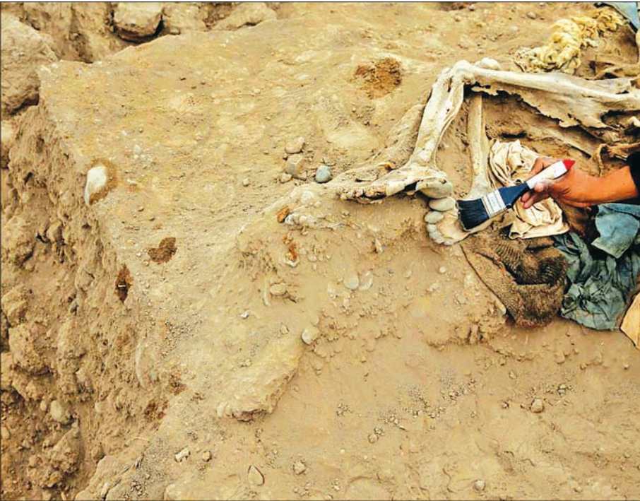
Archaeologist works at a tomb of one of sixteen Chinese migrants, discovered buried at the turn of the 20 th century in the pre-colombian pyramid of Bellavista, according to Ministry of Culture, in Lima, Peru, on 24 August 2017.