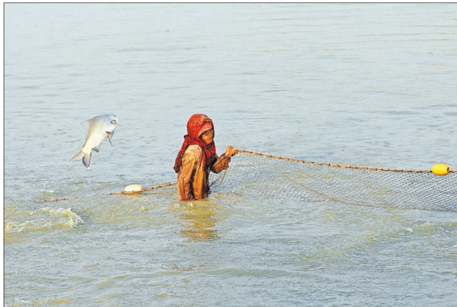
A fish jumps over a net as a worker works in a fish farm at Htantapin township in Yangon, Myanmar on 18 February 2016.

The social, economic and environmental benefits of the fishery sector are substantial. In addition to creating employment and increasing foreign exchange earnings, fishing provides a