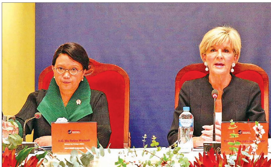
Australian Minister for Foreign Affairs Julie Bishop speaks as she sits next to Indonesia's Foreign Minister Retno Marsudi during the Bali Process Government and Business Forum held in Perth, Australia, on 25 August 2017.

"I propose that during the next Bali meeting next year, the industries, the private sector, will be able to showcase the best practices that have been taken by industries on initiatives resulted from this forum," Mar-