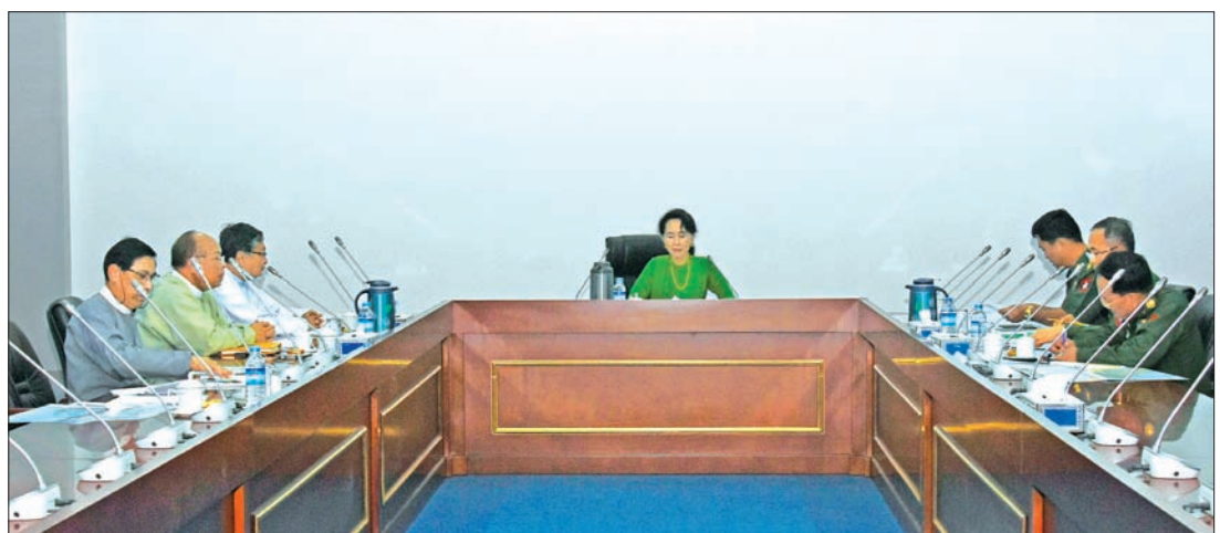
Daw Aung San Suu Kyi and Union Ministers hold the emergency meeting following terrorist attacks on police outposts in Rakhine State.

At that moment, arrangements were made to deploy additional Myanmar Police Force personnel to the region, while