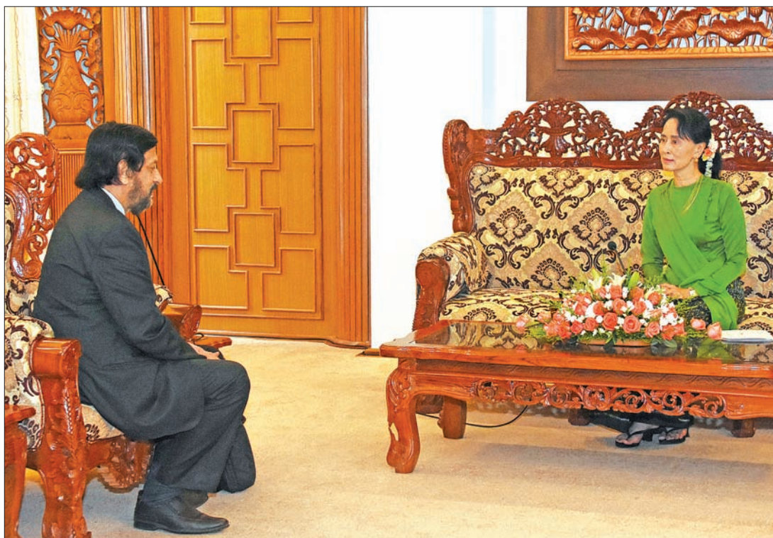
State Counsellor Daw Aung San Suu Kyi holds talk with Dr R.K. Pachauri, Chairman of the Energy Farm International Foundation.