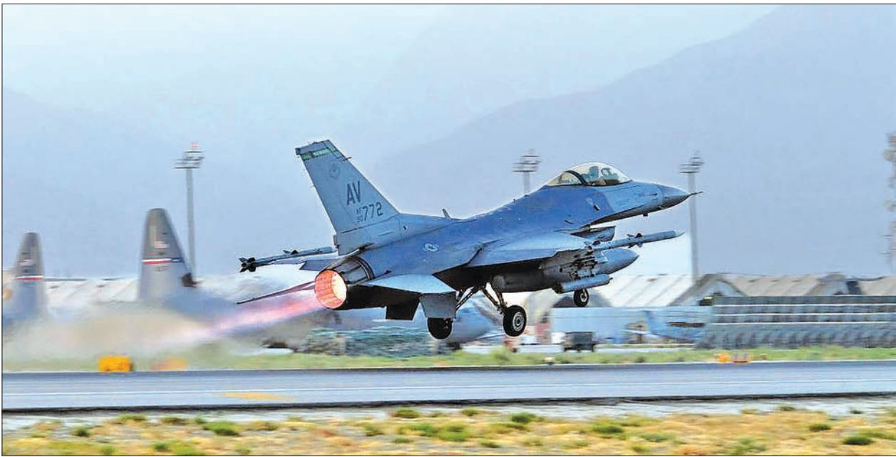
A US Air Force F-16 Fighting Falcon aircraft takes off for a nighttime mission at Bagram Airfield, Afghanistan, on 22 August 2017.

"Between the two groups, the Taliban are definitely smarter," F-16 pilot Maj. Daniel Lindsey told Reuters. "The Taliban