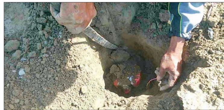
The landmine planted by terrorists is being removed.

“The situation in Rakhine State cannot be improved