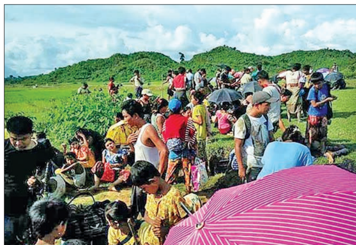
Civilians are evacuated to a safe place by the security forces.

Eleven staff members and five families from Taungpyo Letwe GAD, one staff member and seven family members from the Department for Development of Border Areas and National Races and two staff members from the Roads Department were moved to Region-1 Police Station of Border Guard Police Battalion. In addition, 17 staff members from Myinlut GAD were moved to the Maungtaw GAD Office and