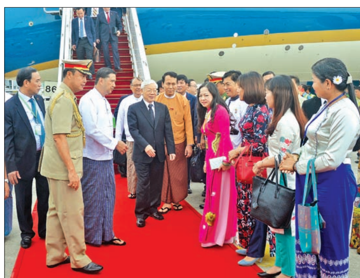
Mr. Nguyen Phu Trong, General Secretary of the Communist Party of Viet Nam, Central Committee welcomed by at the Yangon International Airport.

Then, the General Secretary and party met with Chief Minister U Phyo Min Thein at Melia Yangon Hotel and discussed matters relating to investments by Vietnamese businesses within Yangon Region, promoting investments on communication