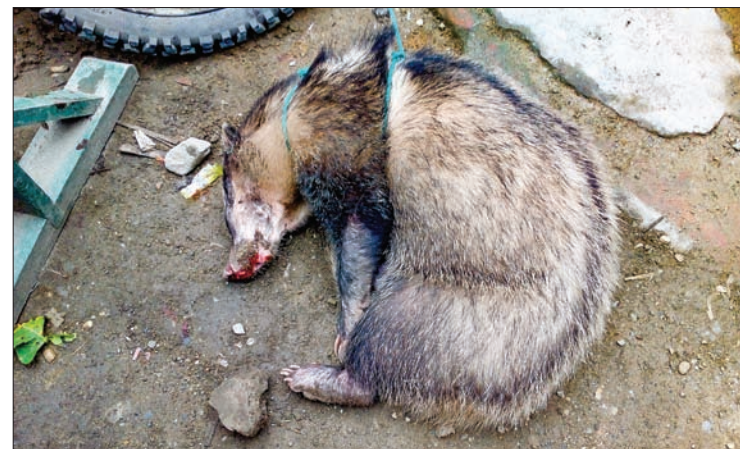
A hog badger is undergoing veterinary treatment.

retary of the Ministry of Health and Sports and responsible personnel. The H1N1 vaccines and related medical equipment donated by the People's Republic of China arrived at Yangon International Airport yesterday by the chartered plane, it was learnt. —Myanmar News Agency ■