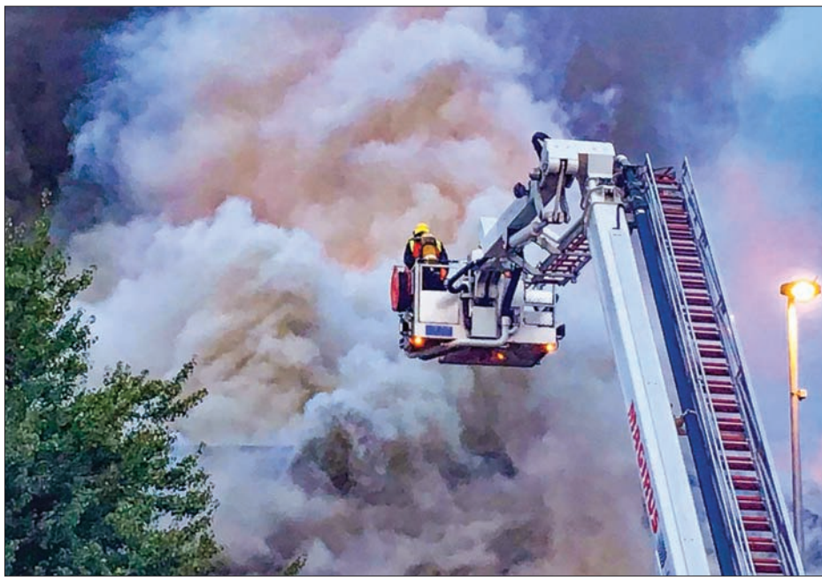
Firefighters battle a fire at a department store in Chingford, London, Britain, on 23 August 2017.

"A mother and daughter in an adjacent flat saw smoke and evacuated the