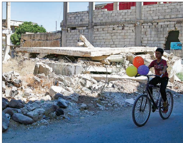
A boy rides a bike along a damaged street in a rebel-held area, in the town of Dael, Syria, on 22 August 2017.

"The Russians have been nothing but professional, cordial and disciplined," Army Lieutenant General Stephen Townsend, the Iraq-based commander of the US-led coalition, told Reuters. —Reuters ■