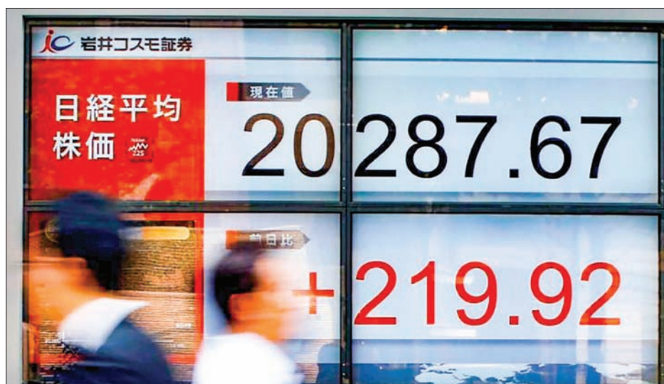
People walk past an electronic board showing Japan's Nikkei average outside a brokerage in Tokyo, Japan, on 20 June 2017.

That is the result of lower rates, agreed for the six months through September with steelmakers such as Nippon Steel