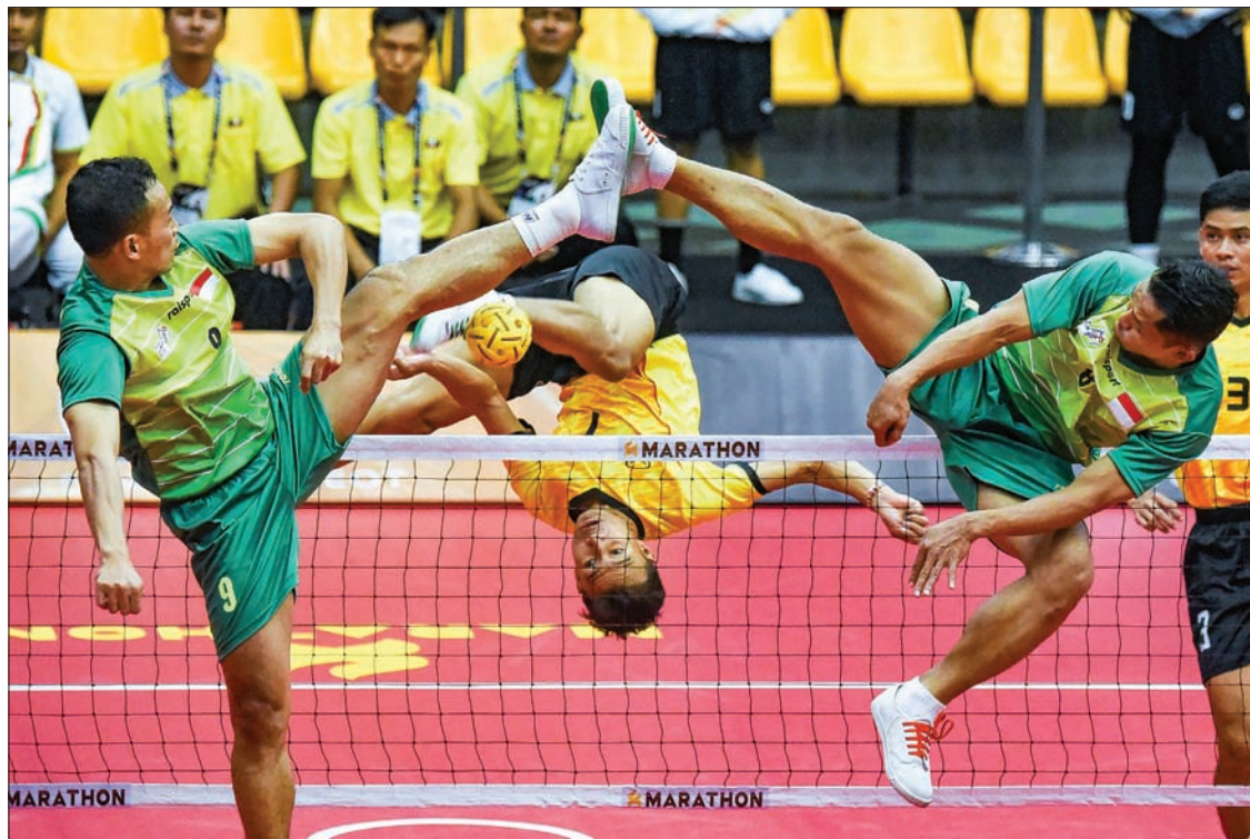
Myanmar striker in action during the Sepak Takraw men's double match against Indonesia squad at the 29 th SEA Games, Malaysia.

At the SEA Games, Sepak takraw differs from the similar sport of footvolley in its use of a rattan ball and only allowing players to use their feet, knees, chest and head to touch the ball. Sepak takraw is now a regular sport event in the Asian Games and the Southeast Asian Games. The final will be played today at Titiwangsa Indoor Stadium in Kuala Lumpur, with the winning team earning gold and the losing team earning the silver medal.—Ye Yint Shine ■