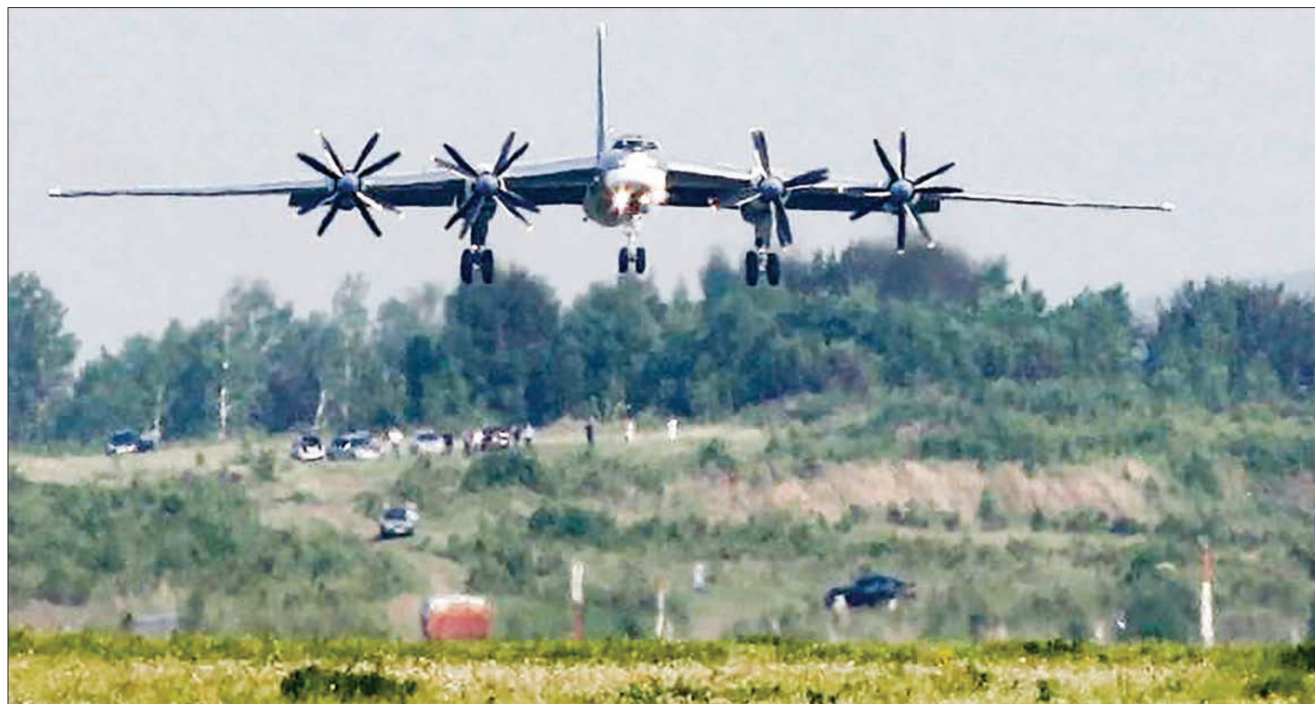
A Tupolev Tu-95MS strategic bomber, the carrier of nuclear rockets, lands at the Yemelyanovo airport near Russia's Siberian city of Krasnoyarsk, in 2011.