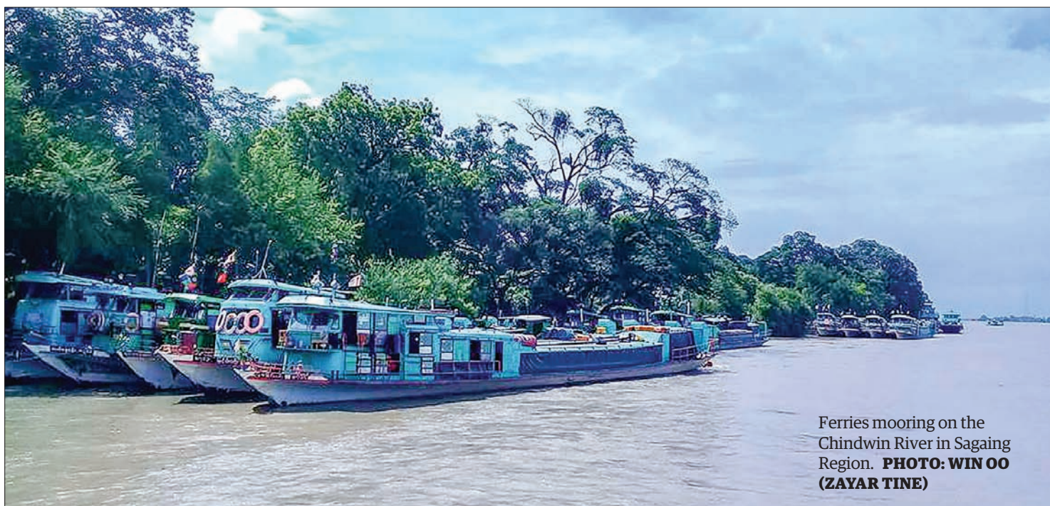
Ferries mooring on the Chindwin River in Sagaing Region.

Due to limitation of space we are only able to publish "Letter to the Editor" that do not exceed 500 words. Should you submit a text longer than 500 words please be aware that your letter will be edited.