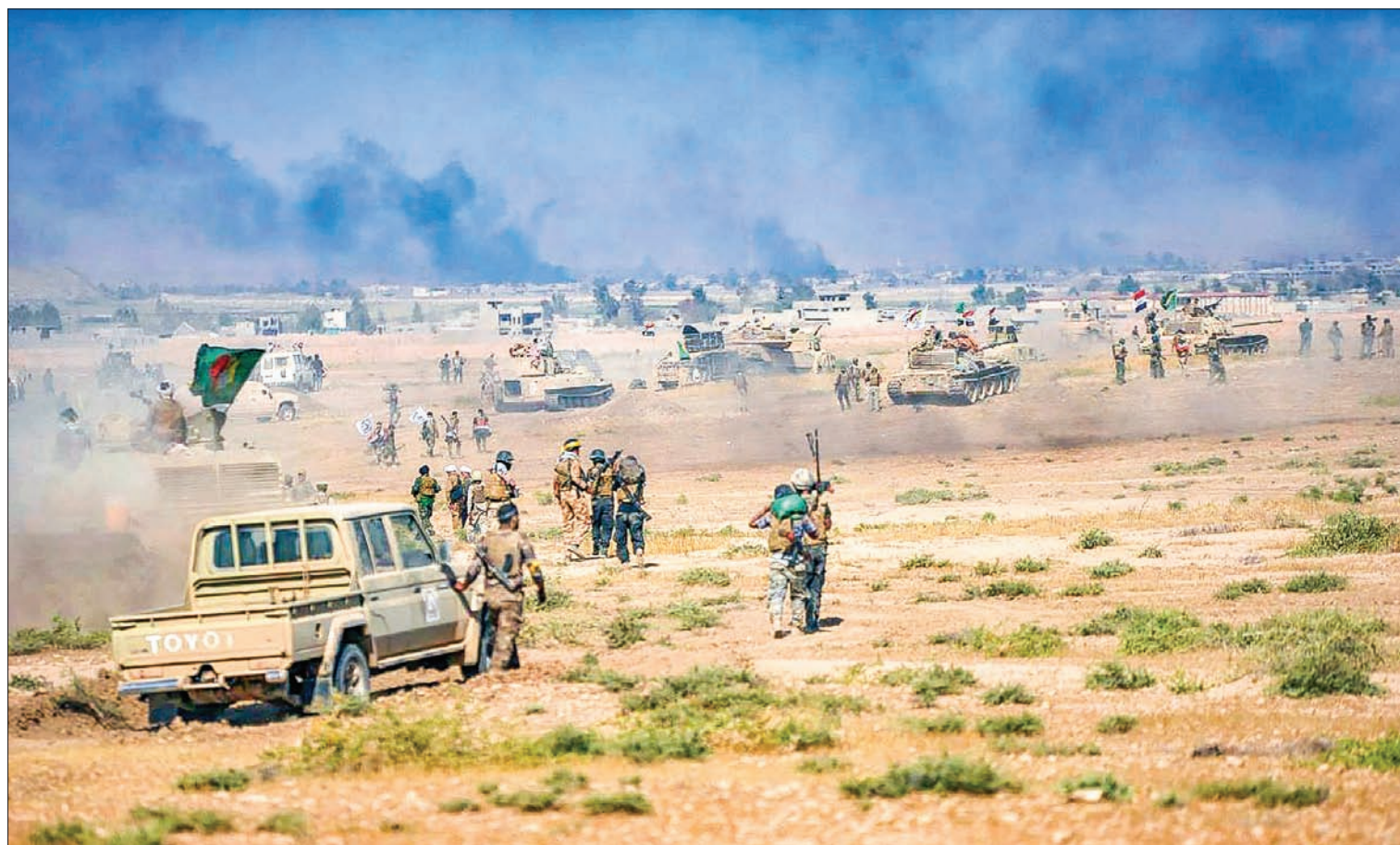
Shi'ite Popular Mobilization Forces (PMF) gather with Iraqi army on the outskirts of Tal Afar, Iraq.

About three quarters of Tal Afar remains under militant control including the Ottoman-era citadel at its centre,