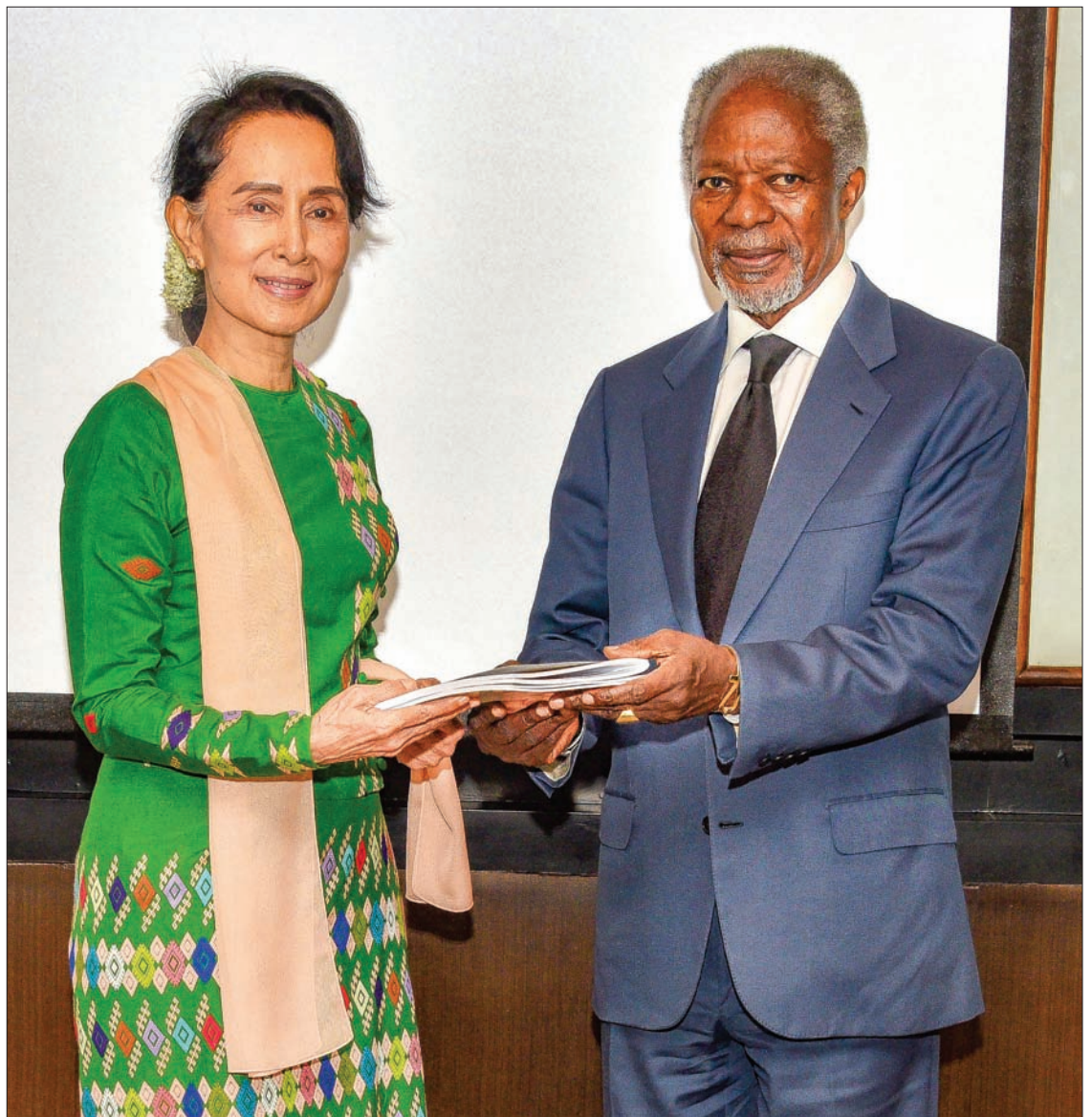
State Counsellor Daw Aung San Suu Kyi accepts the final report of the Advisory Commission on Rakhine State handed over by Mr Kofi Annan, the chair of the commission.