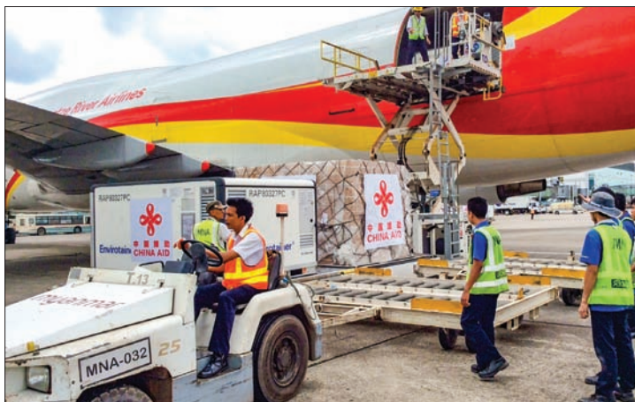
Airport staff unloading H1N1 vaccines donated by PRC from a cargo plane at Yangon International Airport.

At the ceremony, the document allowing the handover of H1N1 vaccines and equipment — disease protection suits, ventilators and breathing machines worth of US$ 3.7 million — was signed by the Chinese ambassador to Myanmar and the permanent secretary of the