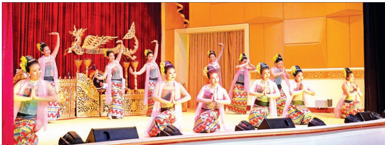
Dancers perform at the dinner in honour of General Secretary, Communist Party of Viet Nam's Central Committee.

At the dinner, President U Htin Kyaw and Gen-