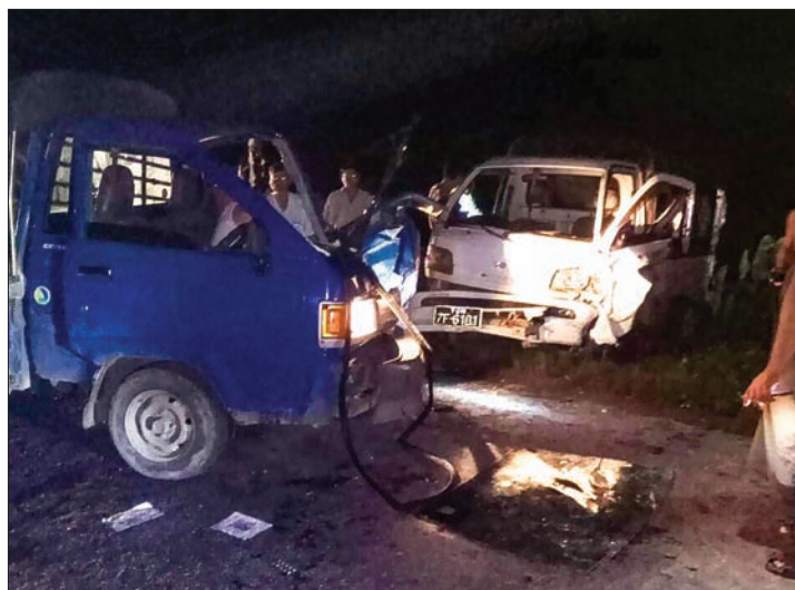
Blue light truck headon collided with Hi-jet vehicle along the Yangon-Nyaungdon highway in Nyaungdon.

A blue colour light truck driven by Zin Ko Ko, heading to Nyaungdon from Yangon allegedly cross the center median and crashed into a white Hi-Jet vehicle heading to Yangon from