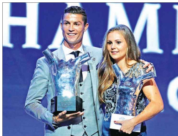
Real Madrid's Cristiano Ronaldo and Barcelona's Lieke Martens hold their trophies after winning the UEFA Men's and Women's Player of the Year award at the UEFA Player of the Year Awards, Monaco on 24 August 2017.

women's team to their first international title when they won the European championship this year. The 24-year-old was named player of the tournament.—Reuters ■