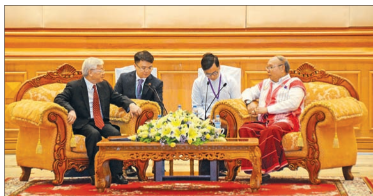
Amyotha Hluttaw Speaker meets Viet Nam Communist Party General Secretary in Nay Pyi Taw.