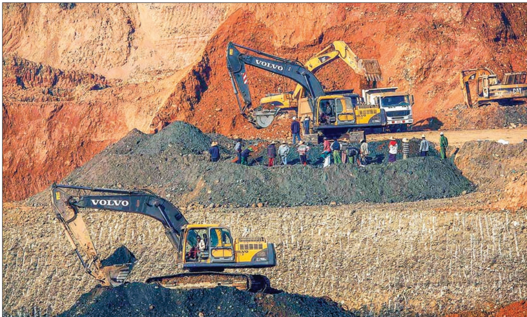
A file photo shows people gather around machines at a jade mine in Pharkant, Kachin state.