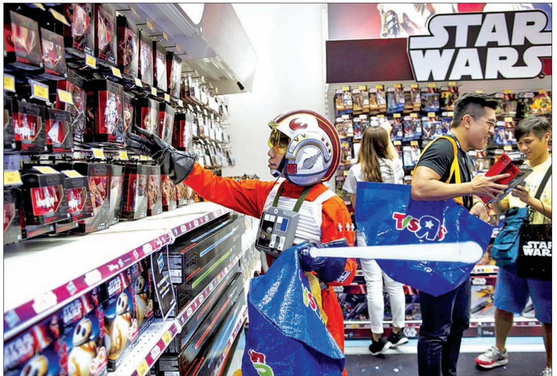
A fan dressed up as Luke Skywalker picks new toys from the upcoming film "Star Wars: The Force Awakens" on "Force Friday" after the launch of the film's new toys in Hong Kong, China, in 2015.

"Star Wars," one of Disney's most important franchises, was the US toy industry's top-selling property for 2015 and 2016, with $1.5 billion in sales over the two years, according to research firm NPD. "The Last Jedi," the eighth movie in the "Star Wars" film saga, arrives in theaters in December. —Reuters ■