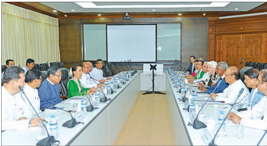
State Counsellor Daw Aung San Suu Kyi holds talk with Advisory Commission on Rakhine State at the Ministry of Foreign Affairs in Nay Pyi Taw.