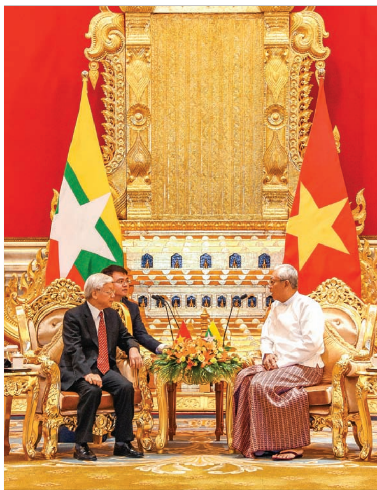
President U Htin Kyaw (Right) holds talk with Mr. Nguyen Phu Trong (Left) in Nay Pyi Taw.

witnessed by President U Htin Kyaw and General Secretary Mr. Nguyen Phu Trong. MoU on Cultural Cooperation between Ministry of Religious Affairs and Culture of the Republic of the Union of Myanmar and the