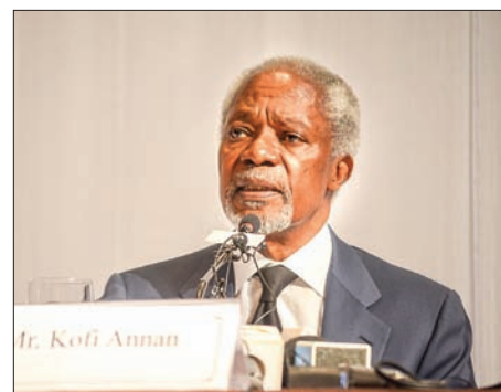
Mr. Kofi Annan, the chair of the Advisory Commission on Rakhine State.

"This is a crucial step for Rakhines and Muslims alike. Only in this way can