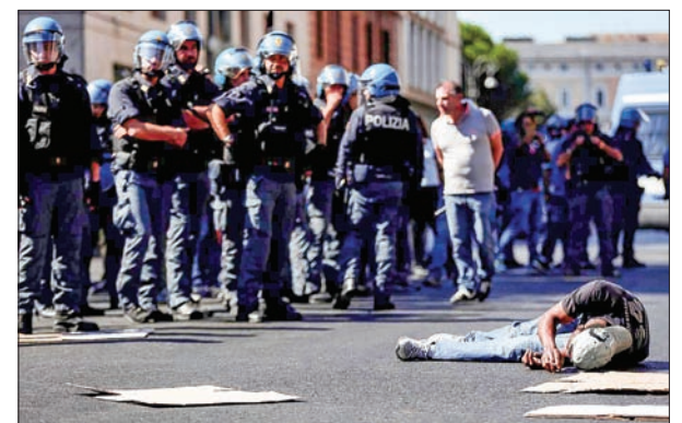
A refugee protests in the street after being forcibly removed from a building where he had been living, in central Rome, Italy, on 23 August 2017.

office building they had occupied for about five years. Hung on the building was a sheet with writing reading "We are refugees, not terrorists" in Italian. A small fire burned on the pavement and a sheet hanging from a first-floor window was set alight by squatters inside. Most of the squatters were Eritreans who had been granted asylum. Police said they had refused to accept lodging offered by the city. In a statement, the police said the refugees had gas canisters, some of which they had opened, and officers had been hit by rocks, bottles and pepper spray. Two people were arrested. —Reuters ■