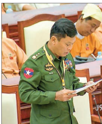
Lt. General Kyaw Swe, Union Minister for Home Affairs.

Lt Colonel Zaw Tun Oo, Tatmadaw Hluttaw representative said: "Atrocious deeds of Bengali extremists must be severely arrested under the existing anti-terrorism law. If prompt responses are not made against