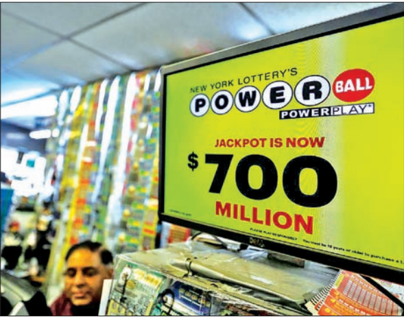
A screen displays the value of the Powerball jackpot at a store in New York City, US, on 22 August 2017.

NEW YORK — The owner of a Powerball ticket sold in Massachusetts won an estimated $700 million on Wednesday, one of the largest prizes in the lottery's history. Powerball said on its website the single ticket matched all six numbers in drawn on Wednesday night: 6, 7, 16, 23, 26 and the Powerball of 4. The winner will get annual payments over 29 years, totaling at least $700 million, or $443.3 million in a lump sum payment, before taxes. The odds of a ticket having all six winning numbers are 292.2 million-to-1, according to the Multi-State Lottery Association. Powerball tickets are sold in 44 US states, and Washington, DC, Puerto Rico and the US Virgin Islands. No one had won the Powerball's top prize in the twice-a-week drawings since 10 June, when a California man won a jackpot valued at $447.8 million.—Reuters ■