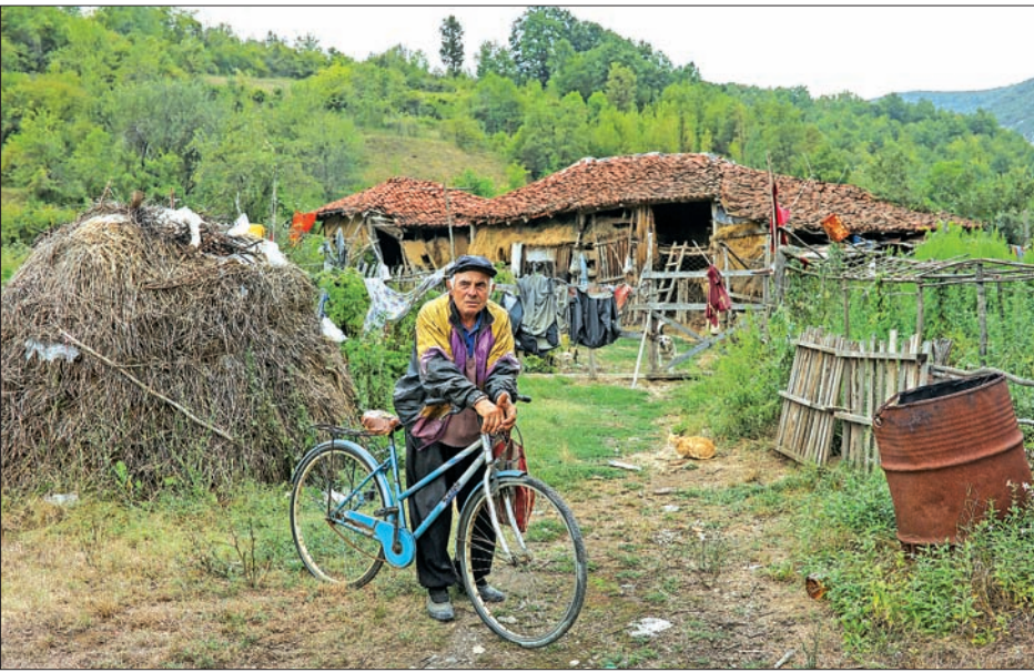
A man holds his bicycle in front of his home in the village of Gornja Kamenica, near the south-eastern town of Knjazevac, Serbia, on 14 August 2016.

REPUSNICA, (Serbia) —Repusnica was once a bustling village on the slopes of Mount Stara Planina in Serbia. Now its bars lie empty, its houses stand shuttered and nobody walks its streets. Authorities declared the village near the border with Bulgaria closed in 1998 due to depopulation caused by mechanization of the economy, the closure of state factories and an exodus from Serbia linked to the Balkan wars of the 1990s.