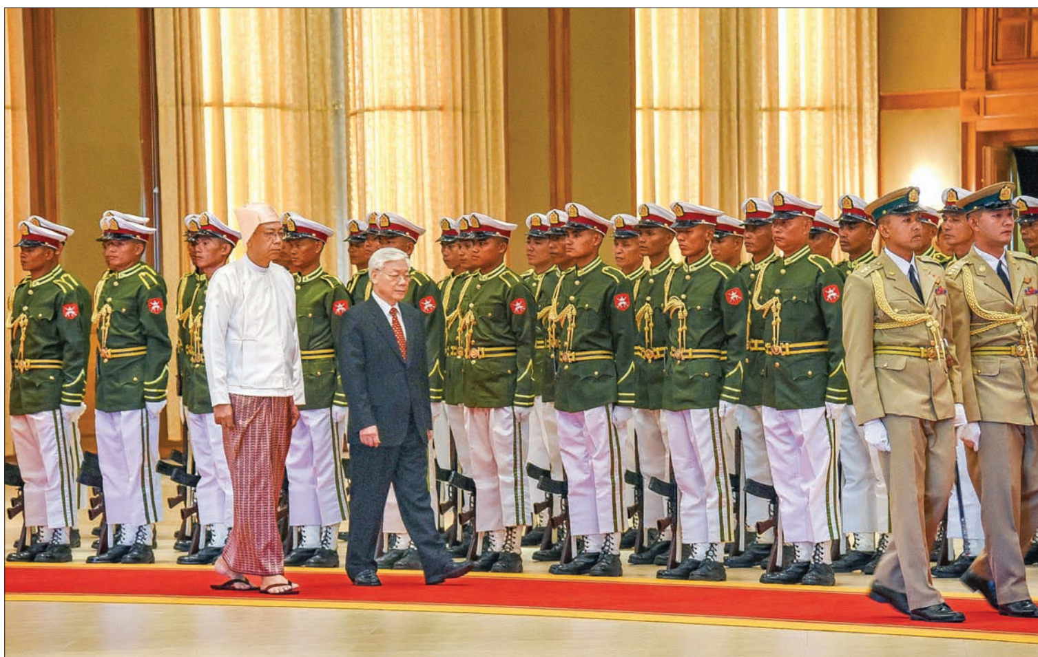
President U Htin Kyaw (Left) and Mr. Nguyen Phu Trong (Right), General Secretary, Communist Party of Viet Nam's Central Committee (CPVCC), inspect the Honour Guard in Nay Pyi Taw.

After the meeting, a signing ceremony of memoranda of understanding (MoUs) and Agreement on Cooperation and Mutual Assistance between the two countries was held and