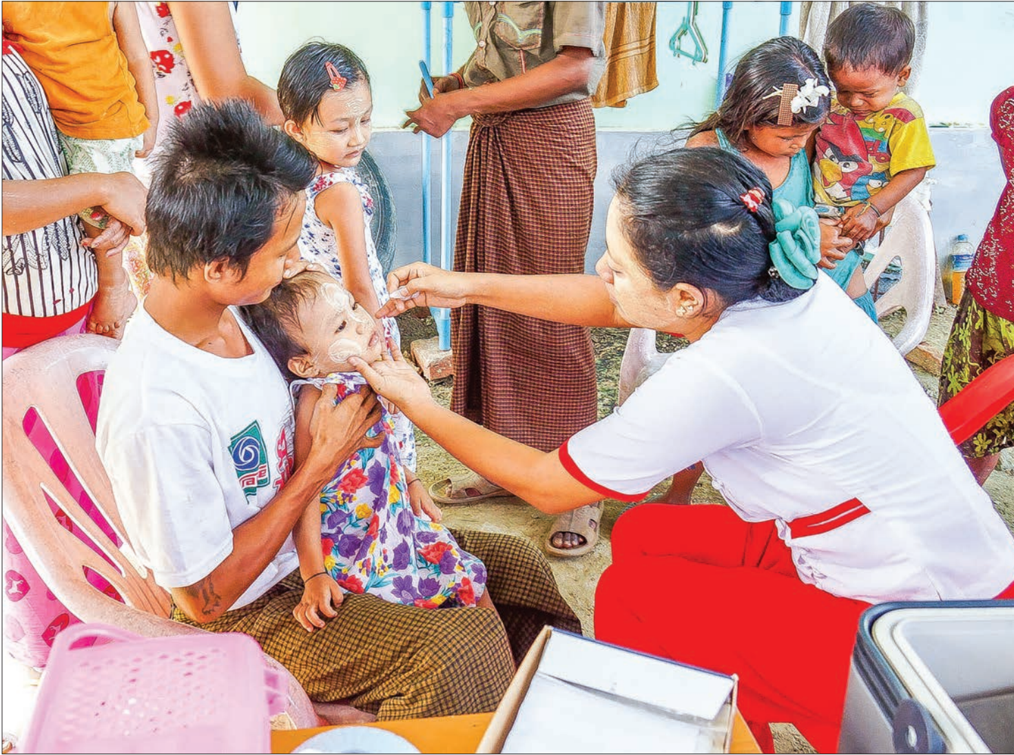
A nurse gives polio vaccine to a child in Maungtaw, Rakhine State, on 21 August, 2017.