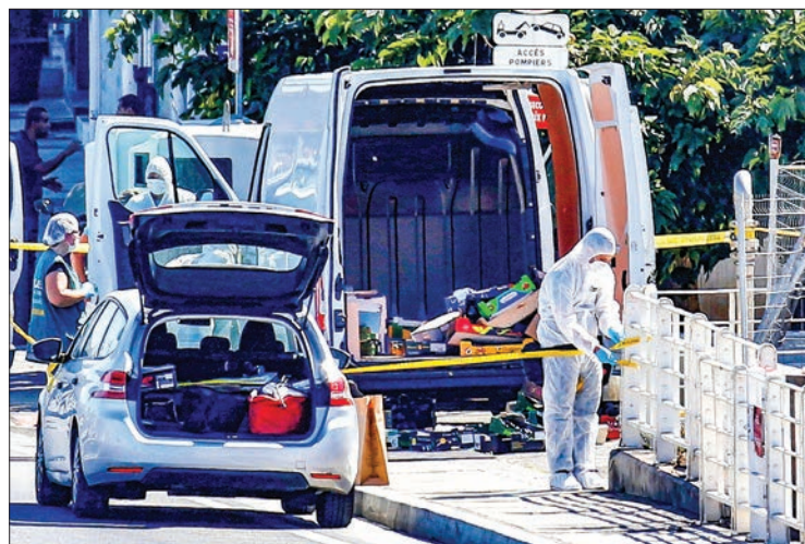
French police conduct their investigation in the French port city of Marseille after one person was killed and another injured after a vehicle crashed into two bus shelters, in Marseille, France on 21 August, 2017.