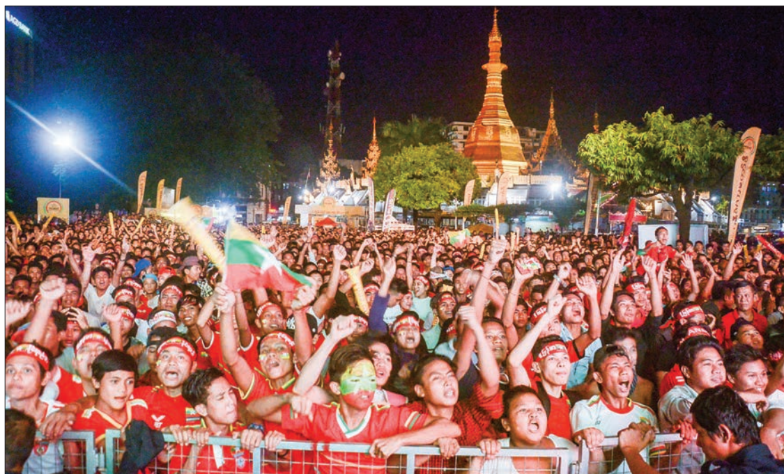
A crowd in Mahabaddoola Park in Yangon watches the Myanmar football match on a large outdoor screen.

Myanmar responded early in the second half with having many