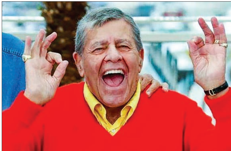
Veteran American entertainer Jerry Lewis.

By age 15, he had assembled his own routine of comedic lip-synching and made the rounds of New York talent agents, although only a burlesque house in Buffalo was interested. At the age of 20, however, everything changed for Lewis, when he embarked on arguably one of the most successful entertainment partnerships of all time with smooth crooner Dean Martin.