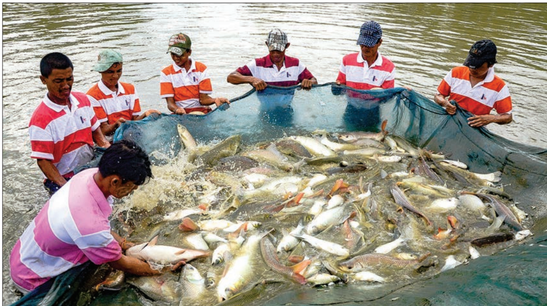
Fish are caught to be bred at a farm in Yangon.