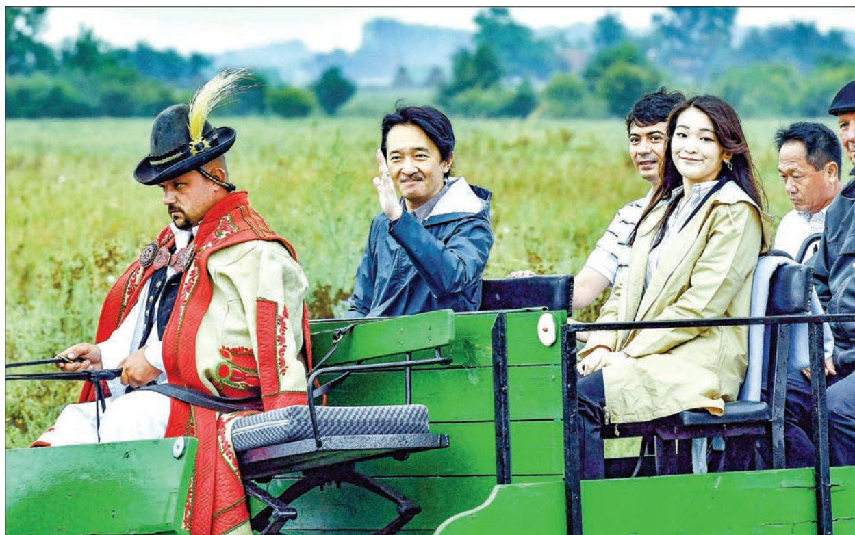
Japanese Prince Akishino and his daughter Princess Mako take a coach ride at a farm in Bugac, Hungary on 20 August, 2017. Their trip comes prior to her engagement announcement in September.

has been engaged in museum studies research, showed her interest in pottery used for keeping wine.