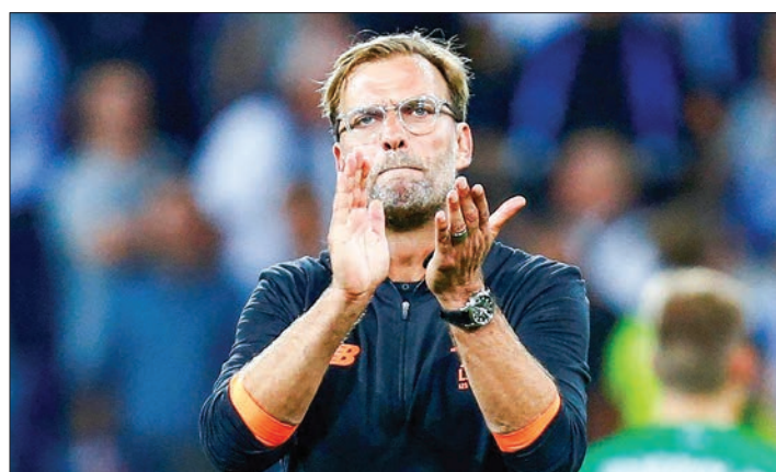
Liverpool manager Juergen Klopp.

LONDON — Liverpool must rotate their squad this season if they are to sustain their challenge in both the Premier League and the Champions League, manager Juergen Klopp has said.