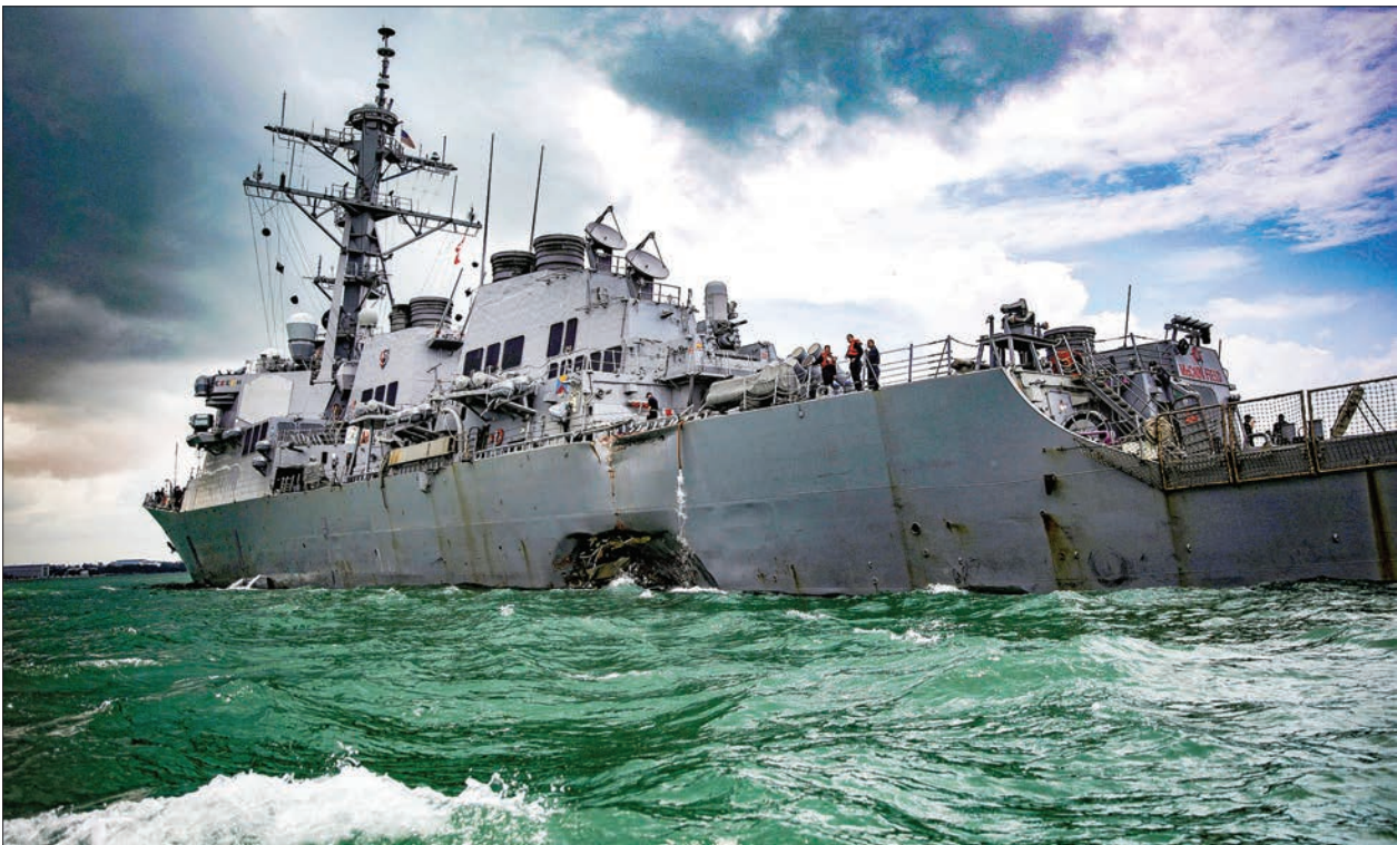
The US Navy guided-missile destroyer USS John S McCain is seen after a collision, in Singapore waters on 21 August, 2017.

class destroyer as the Fitzgerald and is 154 metres long. On 10 August, it took part in the Navy's third “freedom of navigation operation” in the South China Sea since Trump became president, Reuters news agency reported earlier. The destroyer sailed within 12 nautical miles, or 22 kilometres, of Mischief Reef in the Spratly Islands, among a string of islets, reefs and shoals, the report said. China has territorial rows with its neighbors over the area. The Alnic MC is a Liberian-flagged, 183-metre oil and chemical tanker that was due to make a port call at Singapore on Monday after leaving a port in South Korea on 3 July, according to ship-related information site MarineTraffic. The US Navy said last week it will remove the commander and two other senior officers of the Fitzgerald over the fatal collision with the Philippine-flagged container ship off Japan's Izu Peninsula on 17 June. The Maritime and Port Authority of Singapore said there is no report of oil pollution, and that traffic in the Singapore Strait is unaffected, adding that it is investigating the incident.—Kyodo News