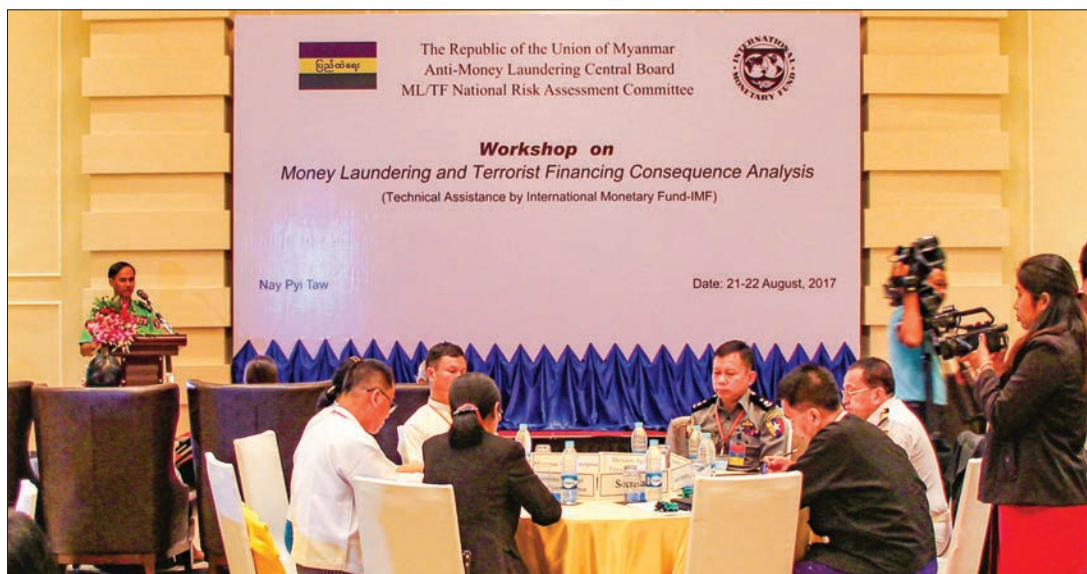
Deputy Minister for Home Affairs Maj-Gen Aung Soe delivered an opening speech at the workshop on Money Laundering and Terrorist Financing Consequence Analysis in Nay Pyi Taw.

"The deadline is today so we have to submit it. This is the final chance to appeal," Nakhon Chomphuchat, head of the pair's defence team, told Reuters.— Reuters ■