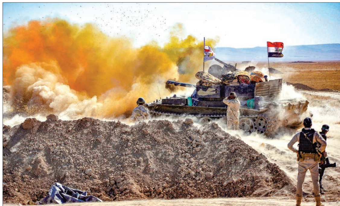
Iraqi army fire against Islamic State militants on the outskirts of Tal Afar, Iraq on 20 August, 2017.

"We are cutting off the arms of the octopus to make it weaker and vulnerable," Colonel Kareem al-Lami of the Iraqi army's 9th Division, said. — Reuters ■