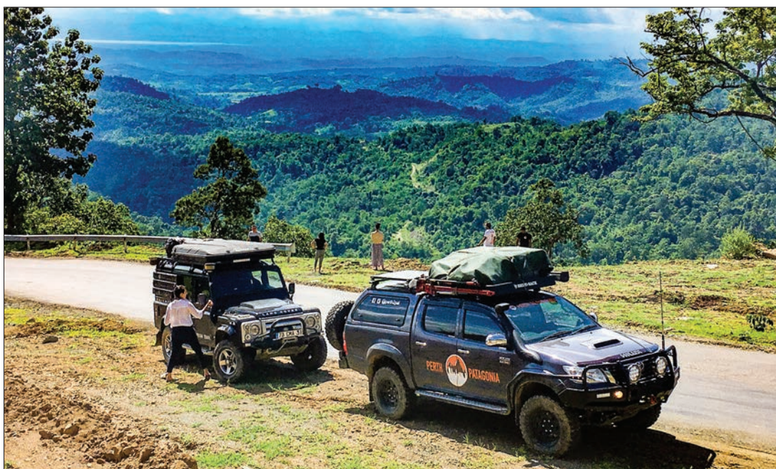
French tourists pass Myanmar from Tamu to Myawady, under the supervision of a local tour company and the Ministry of Hotels and Tourism.

Due to limitation of space we are only able to publish "Letter to the Editor" that do not exceed 500 words. Should you submit a text longer than 500 words please be aware that your letter will be edited.