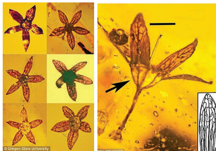
It is the largest collection from this age to be analyzed yet for a single study, and the experts say the flowers look 'just picked'.

'Araucaria trees are related to kauri pines found today in New Zealand and Australia, and