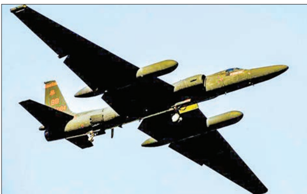
A U-2 "Dragon Lady" aircraft takes off from Osan Air Base, South Korea in this US Air Force handout photo on 21 October, 2009.

"It's like a wrestling match in there," said another U-2 pilot. The Air Force website acknowledges that all those factors give the U-2 "a widely accepted title as the most difficult aircraft in the world to fly." — Reuters ■