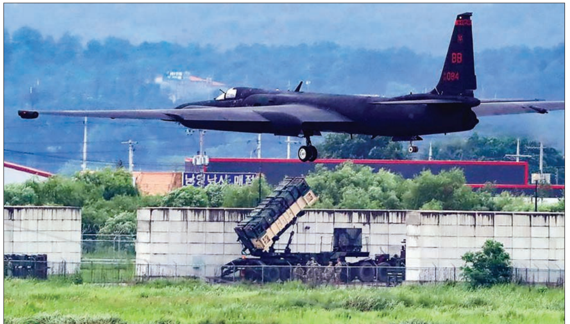
A US Air Force U-2 Dragon Lady takes part in a drill at Osan Air Base in Pyeongtaek, South Korea on 21 August, 2017.

North Korea views such exercises as preparations for