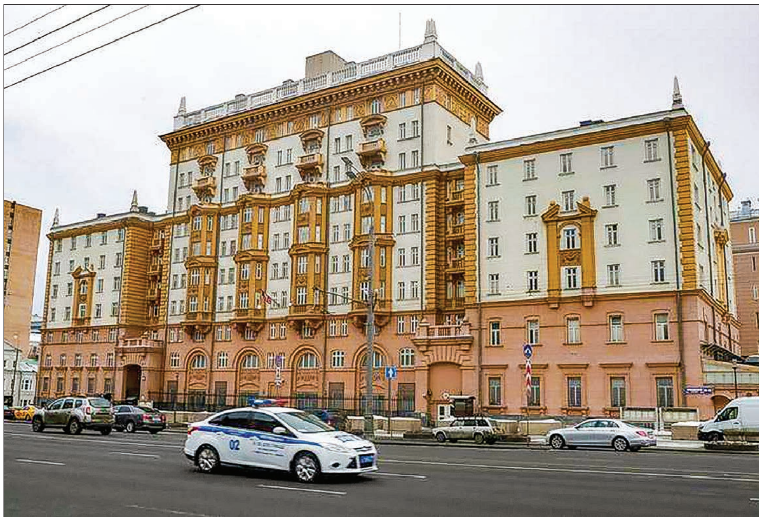
A general view of the US embassy in Moscow, Russia on 30 December, 2016.