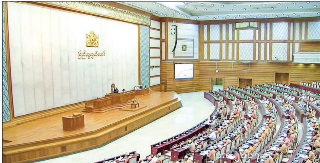
Pyithu Hluttaw is being convened in Nay Pyi Taw.

The Deputy Minister said out of 18,531 households without electricity in Paletwa, 19 villages with 1,022 households had proposed for solar power lighting under the part payment by the people scheme and will