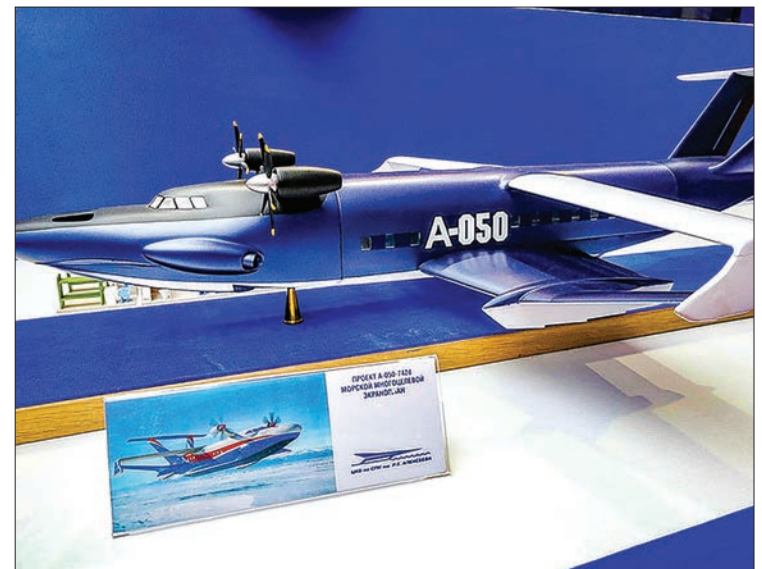
A model of sea-based multipurpose ground effect vehicle.

"In principle I can say that the government is interested in GEV vehicles. We are working in this direction... The GEVs are a fundamentally new and promising type of transport. It can approach unequipped coast, fly over rough seas and carry large payloads," Antsev said.—Tass ■