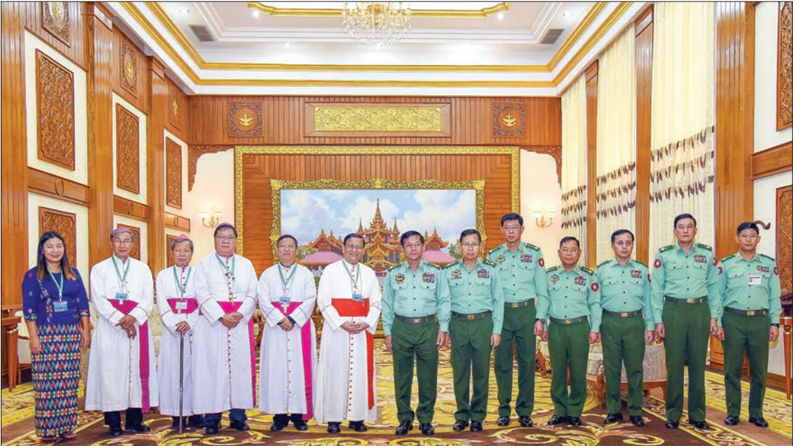
C-in-C of Defence Services Senior General Min Aung Hlaing pose for a documentary photo with a delegation led by Cardinal Charles Bo, the Archbishop of the Roman Catholic Archdiocese of Myanmar.

SENIOR General Min Aung Hlaing, Commander-in-Chief of Defence Services met with a delegation led by Cardinal Charles Bo, the Archbishop of the Roman Catholic Archdiocese of Myanmar at the Bayintnaung Guest House in Nay Pyi Taw, yesterday. During the meeting, the Archbishop urged the various participants in recent cease-fire negotiations to continue to try to find a way to bridge their differences and peacefully resolve their conflicts. The Archbishop and the Senior General discussed various strategies to improve Myanmar's political transition. — Myanmar News Agency ■