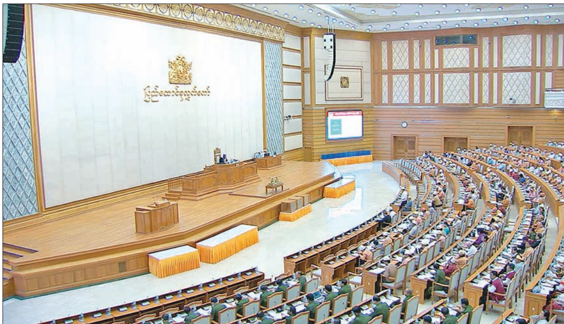
Pyidaungsu Hluttaw is being convened in Nay Pyi Taw.

The deputy minister also pledged that the bill would allow the people to get the full rights provided under the law when it is enacted into a law. The hluttaw also decided to amend Christian Marriage Act, which had been marked up by the President. ■