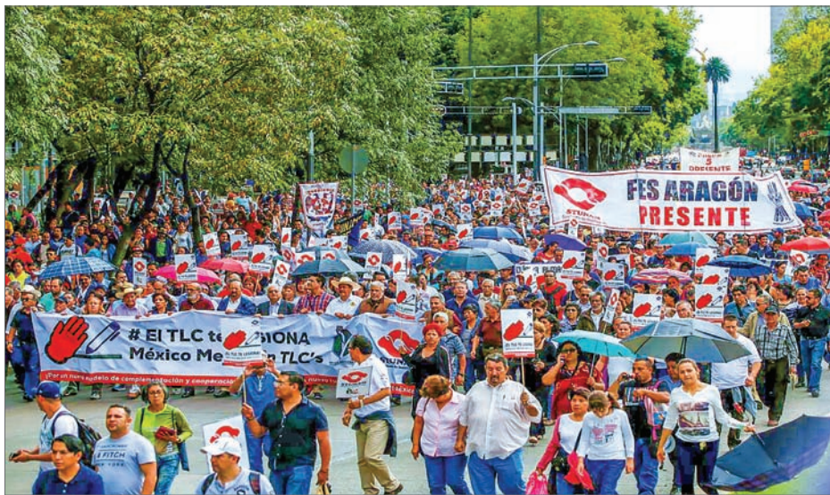
Union workers and farmers protest as NAFTA renegotiation begins in Washington, DC, in Mexico City, Mexico, on 16 August 2017. The placards read "FTA hurts, Mexico better without FTA".

"We are against the treaty and the renegotiation because it has not