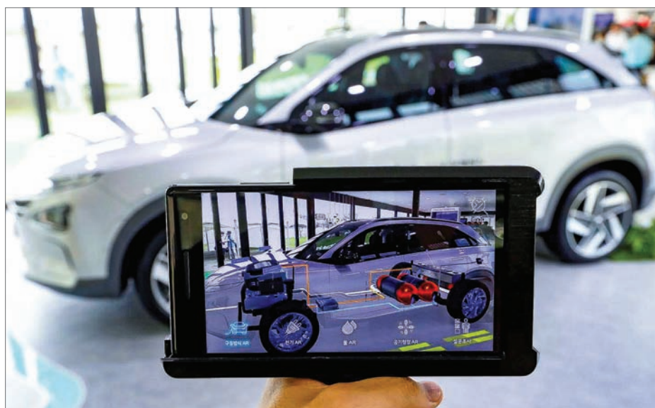
Hyundai Motor’s new fuel cell SUV is seen during a media event in Seoul, South Korea, on 17 August 2017.

The automaker and affiliate Kia Motors Corp (000270.KS), which together rank fifth in global vehicle sales, also said they were adding three plug-in vehicles to their plans for eco-friendly cars, bringing the total to 31 models by 2020. Underscoring Hyundai’s electric shift, those plans include eight battery-powered and two fuel-cell vehicles — a contrast to its 2014 announcement for 22 models, of which only two were slated to be battery-powered.