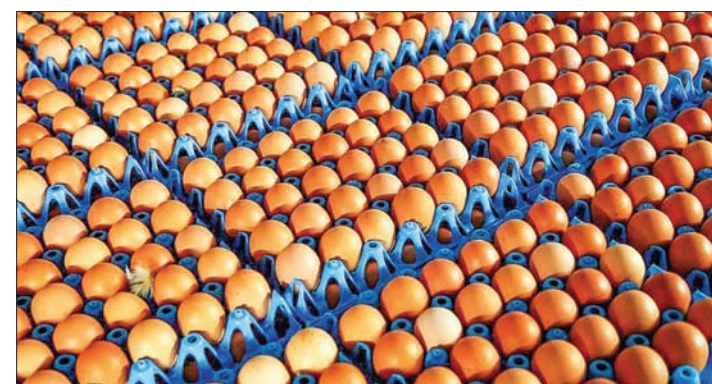
Eggs are packed to be sold at a poultry farm in Wortel near Antwerp, Belgium, on 8 August 2017.

Millions of chicken eggs have been pulled from European supermarket shelves as a result of the scare over the use of the insecticide fipronil, which is forbidden in the food chain and can cause organ damage in humans.—Reuters ■