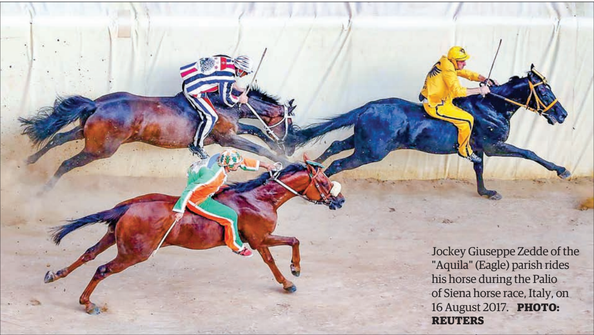
Jockey Giuseppe Zedde of the "Aquila" (Eagle) parish rides his horse during the Palio of Siena horse race, Italy, on 16 August 2017.