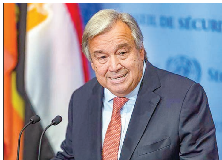
United Nations Secretary-General Antonio Guterres speaks to the press during a media encounter at the UN headquarters in New York, on 16 August 2017. UN Secretary-General Antonio Guterres said Wednesday that the Democratic People's Republic of Korea (DPRK) should "fully comply with international obligations" and "engage in a credible and meaningful dialogue" in order to defuse tensions on the Korean Peninsula.

He also called on the international community to send a clear, coherent message to the