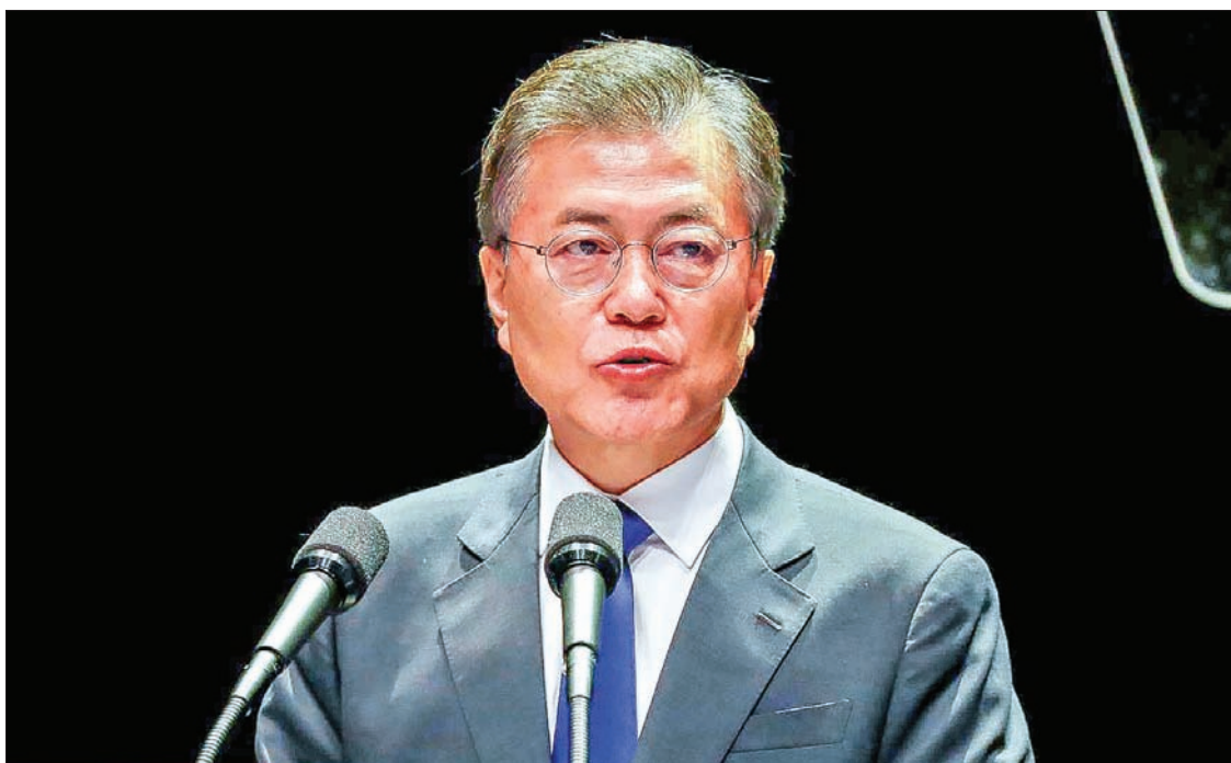
South Korean President Moon Jae-In, delivers a speech during celebrations of the 72 th anniversary of Korea's Independence Day from Japanese colonial rule in 1945 in Seoul, South Korea, on 15 August 2017.

Moon urged North Korea not to make further provocations, saying it would face much tougher sanctions that the impoverished country would be unable to withstand if it persists with its nuclear weapons development.—Reuters ■