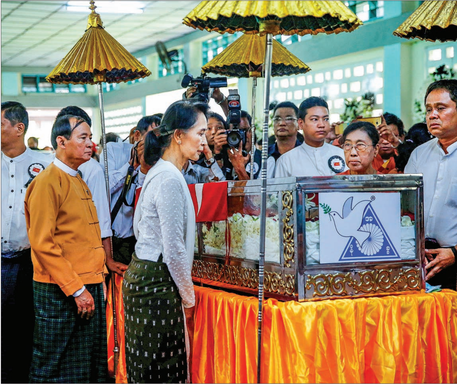
State Counsellor Daw Aung San Suu Kyi and Pyithu Hluttaw Speaker U Win Myint look at the body of U Aung Shwe, former chairman of the National League for Democracy, during his funeral in Yangon yesterday.