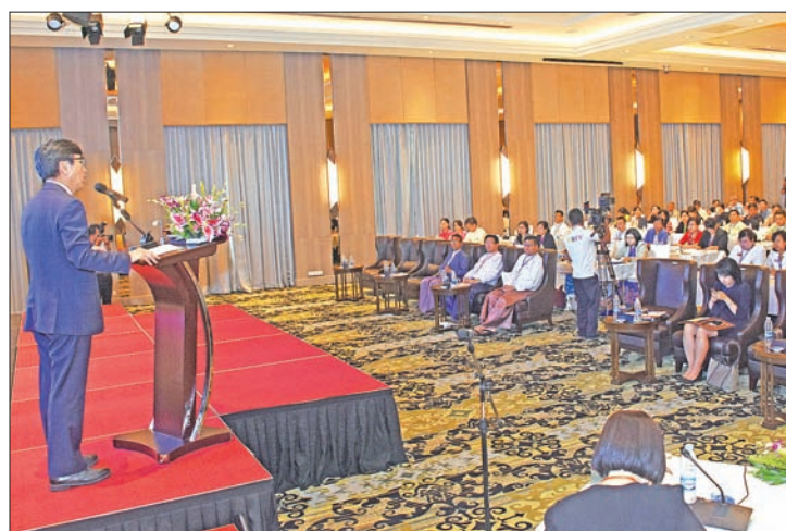
Ambassador of the Republic of the Korea Mission to ASEAN addresses the 2 nd workshop on the ASEAN-ROK Cooperation Mechanism.

The 2 nd workshop on the ASEAN-ROK Cooperation Mechanism was hosted by the Ministry of Foreign Affairs of the Republic of the Union of Myanmar in cooperation with the ASEAN Secretariat and the ASEAN-ROK Programme Management Team (AKPMT) at the Hilton Hotel in Nay Pyi Taw, Myanmar on 17 August 2017.