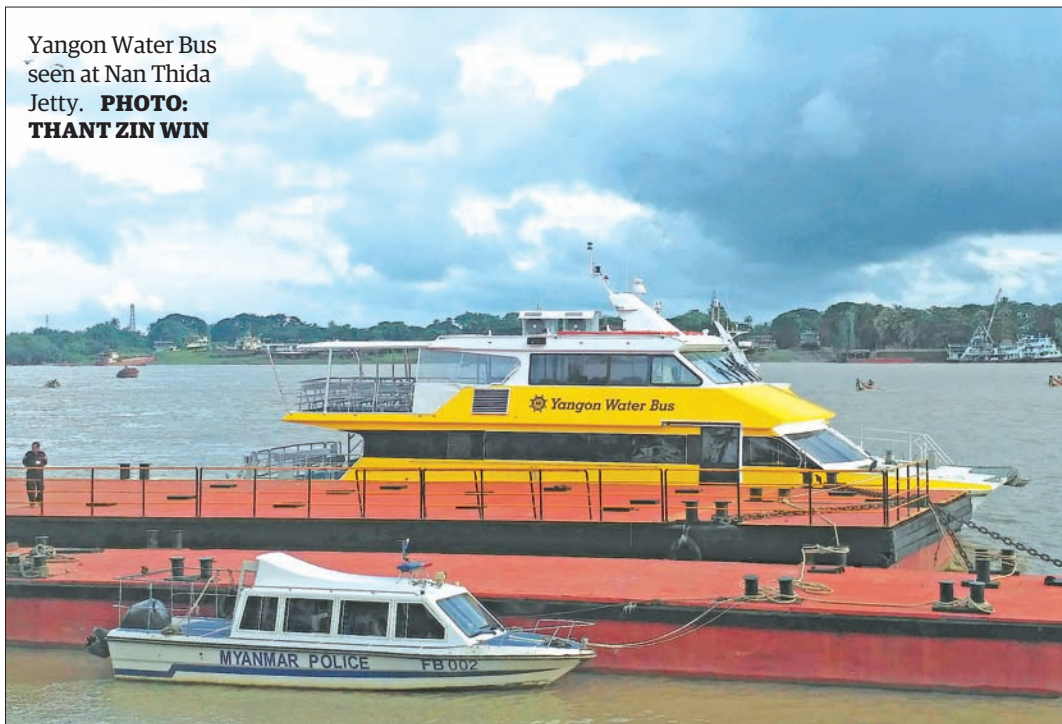
Yangon Water Bus seen at Nan Thida Jetty.

Due to limitation of space we are only able to publish "Letter to the Editor" that do not exceed 500 words. Should you submit a text longer than 500 words please be aware that your letter will be edited.