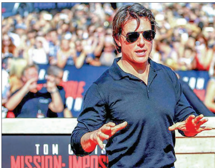
US actor Tom Cruise arrives for the world premiere of "Mission Impossible - Rogue Nation" in front of the State Opera House in Vienna, Austria, in 2015.

Paramount did not say how long production would be delayed. Hollywood trade paper Variety said filming could be halted anywhere from six weeks to three months while Cruise recovers.