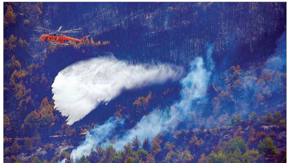
A firefighting helicopter makes a water drop as a wildfire is being contained after four days near the village of Kapandriti, north of Athens, Greece, on 16 August 2017.

ATHENS — Firefighters on Wednesday contained a wildfire burning for nearly four days near Athens after it destroyed thousands of hectares of pine forest and dozens of homes.