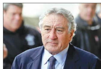
Actor Robert De Niro.

shows are currently produced every year in the United States across traditional broadcast and cable networks and services such as Netflix, Amazon and Hulu, leading to what has been dubbed a golden age of television. "Ten years ago we wouldn't have needed a TV festival. Now, with the change in the TV landscape, both the quality and quantity of shows, it makes sense," actor Robert De Niro, who co-founded the Tribeca Film Festival in 2002 to rejuvenate lower Manhattan, said in a statement.—Reuters ■