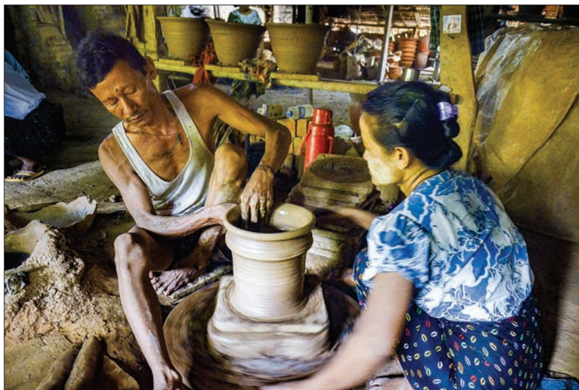
A Myanmar couple make a pot in Twantay, about 50 miles south of Yangon. Microfinance initiatives – which provide small, low-cost loans to the poor – are seen by experts as a way to help alleviate poverty in one of the world's least-developed countries.