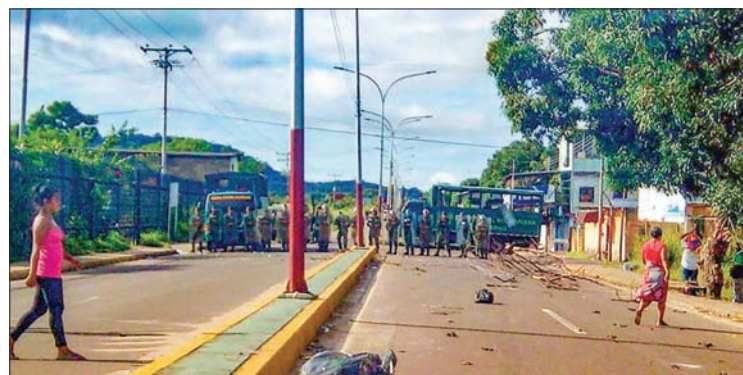
Image taken on Aug. 16, 2017 shows members of the security force standing guard outside a detention centre in Puerto Ayacucho, Amazonas state, Venezuela.

Venezuelan President Nicolas Maduro has formed the National Constituent Assembly, aiming to amend the constitution in order to carry out reforms. This, however, is rejected by opposition parties.—Xinhua ■