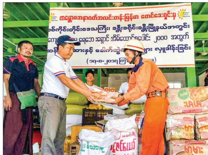
KBZ’s Brighter Future Myanmar Foundation official hands over aid to flood victims in Hkamti.