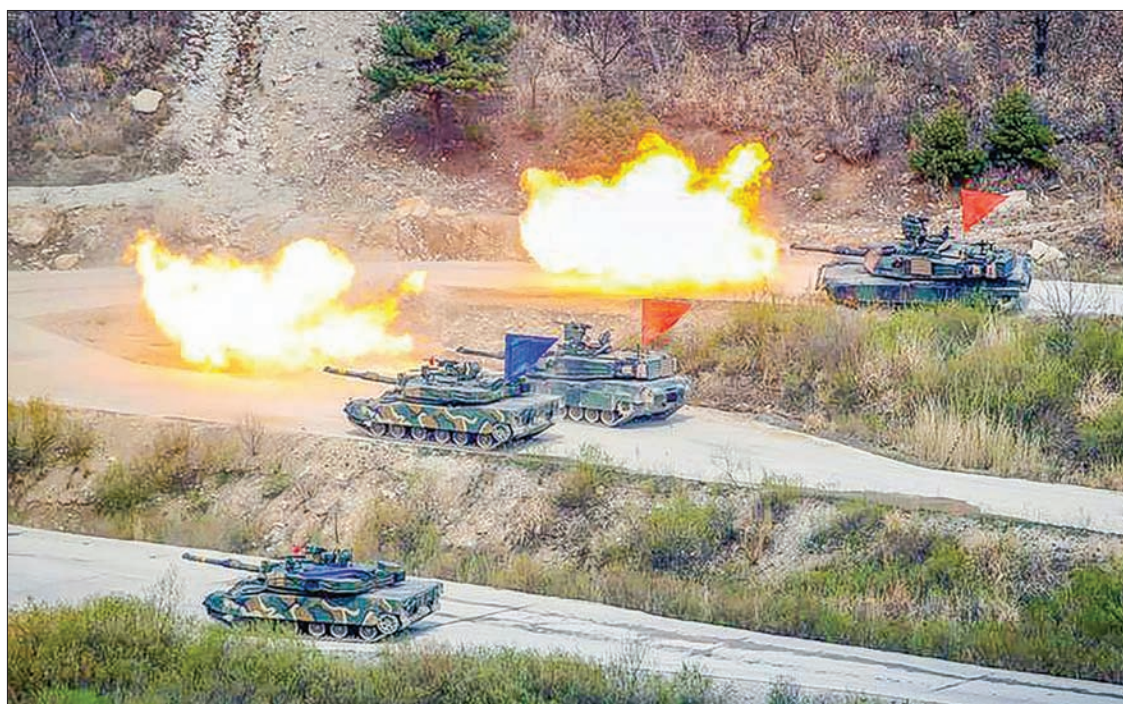
South Korean Army K1A1 and US Army M1A2 tanks fire live rounds during a US-South Korea joint live-fire military exercise, at a training field, near the demilitarized zone, separating the two Koreas in Pocheon, South Korea, on 21 April 2017.

is that we not dial back our exercises. The exercises are very important to maintaining the ability of the alliance to defend itself," Dunford told reporters in Beijing after meeting his Chinese counterparts.