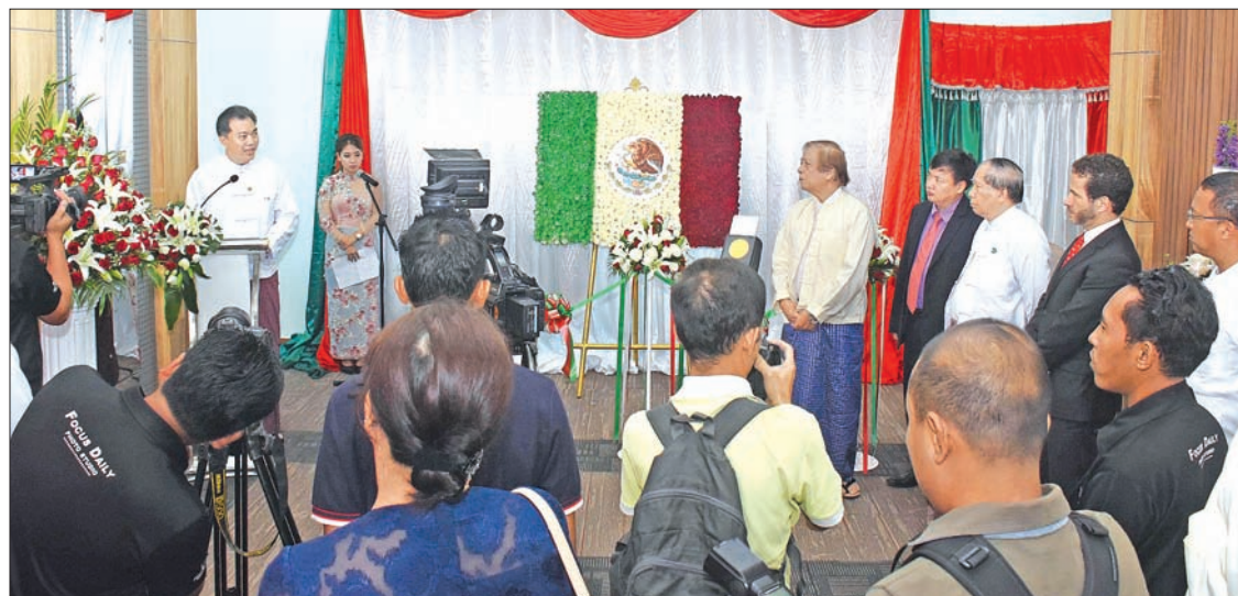
Ministry of Foreign Affairs Permanent Secretary U Kyaw Zeya delivers an opening speech at the opening ceremony of Mexico Honorary Consulate in Myanmar.

Also present at the meeting were Minister of State for Foreign Affairs U Kyaw Tin, Deputy Minister U Khin Maung Tin and other officials. —Myanmar News Agency ■