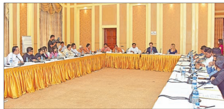
Officials of the Ministry of Foreign Affairs and British Embassy held a workshop.

About thirty participants from Ministry of Foreign Affairs, Ministry of Home Affairs, Ministry of State Counsellor's Office, Ministry of Information, Ministry of Religious Affairs