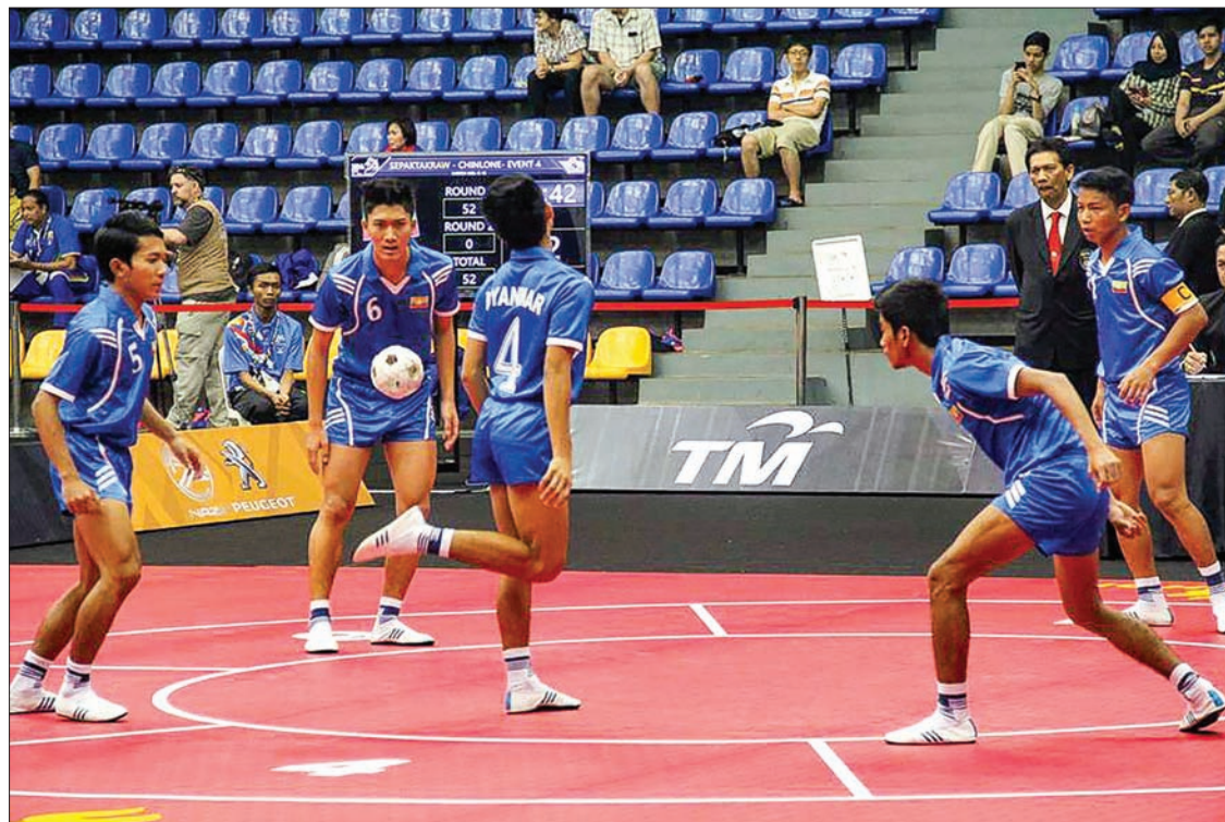
Members of Myanmar Chinlone team who took Myanmar's second gold medal competing at the 29th SEA Games Chinlone Competition at Titiwangsa Indoor Stadium.

players who keep a cane ball aloft as long and as creatively as possible without using their