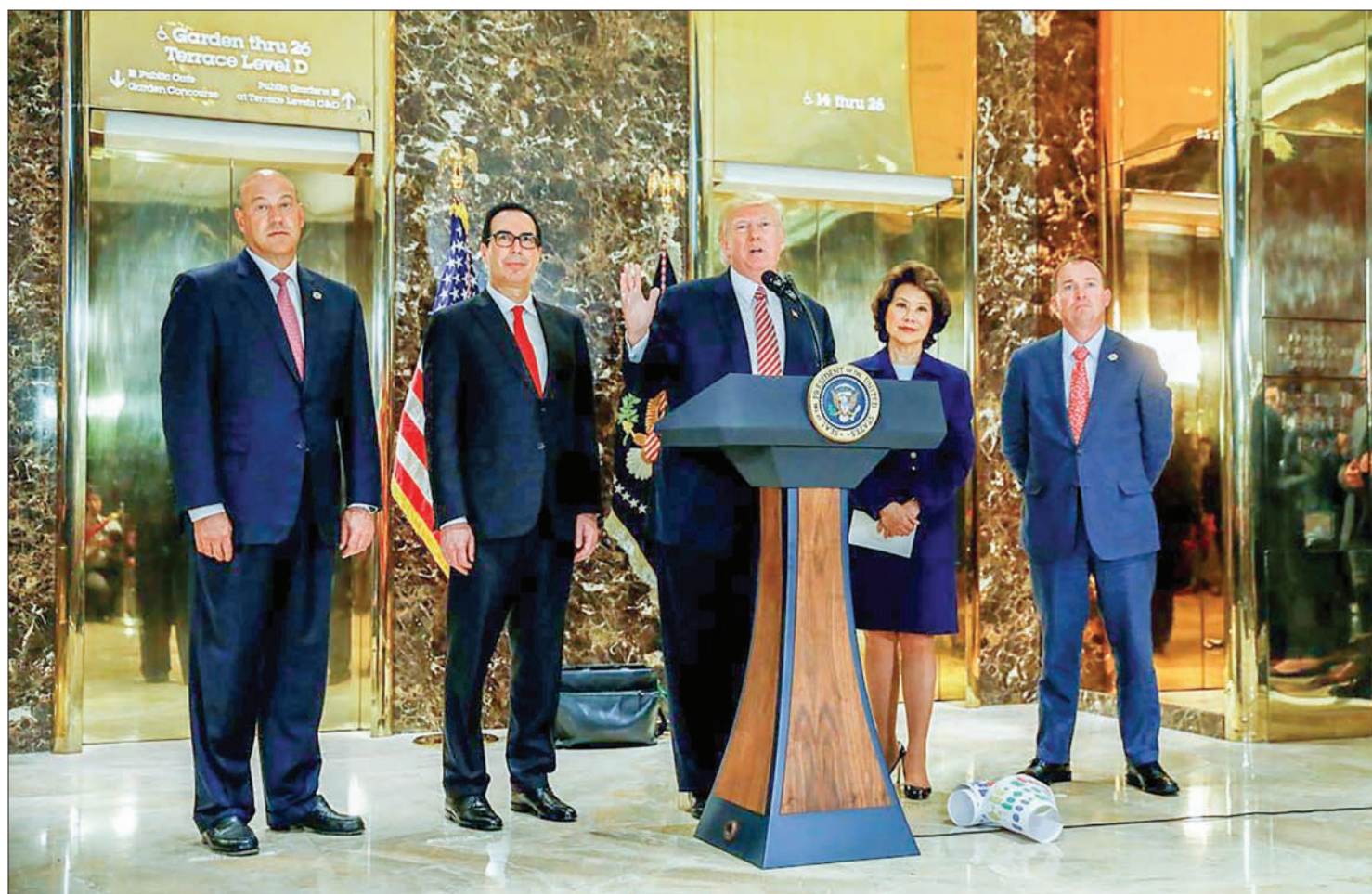
US President Donald Trump is flanked by (L-R) Director of the National Economic Council Gary Cohn, Treasury Secretary Steven Mnuchin, Secretary of Transportation Elaine Chao and Director of the Office of Management and Budget Mick Mulvaney as he speaks about the violence, injuries and deaths at the "Unite the Right" rally in Charlottesville while talking to the media in the lobby of Trump Tower in Manhattan, New York, US, on 15 August 2017.

Around 400 bodies have been found. — Reuters ■