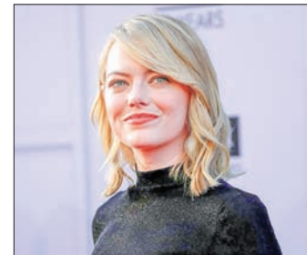
Actress Emma Stone.

The actress, who has spoken out on equal pay for women in Hollywood, saw her earnings dip this year after the conclusion of the "Hunger Games" franchise, but continues to make money from movie deals and an endorsement deal with