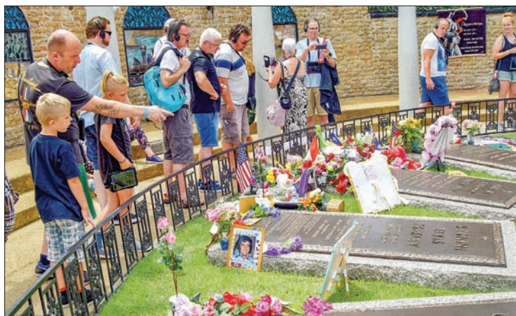
Fans of Elvis Presley, the king of rock and roll, visit his grave in Memphis, Tennessee, on 15 August 2017, a day before the 40 th anniversary of his death. A candlelight vigil from the evening of 15 August into the early hours of the next day is estimated to have drawn as many as 60,000 visitors.

Speakers at the 38 th annual service included Cynthia Pepper, Presley's co-star in the 1964 mov-