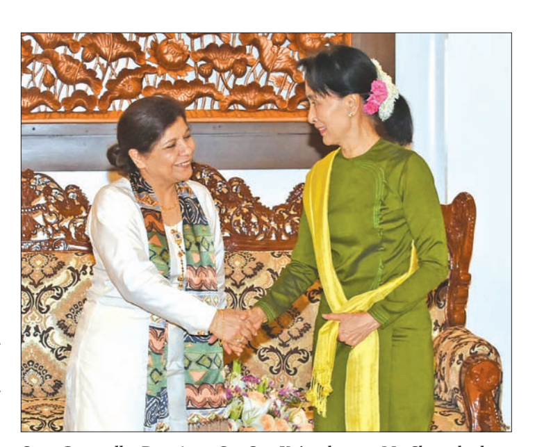
State Counsellor Daw Aung San Suu Kyi welcomes Ms. Shamshad Akhtar, Under Secretary-General of the United Nations and Executive Secretary of ESCAP in Nay Pyi Taw.

During the meeting, they exchanged views on promoting cooperation between Myanmar and ESCAP in the areas of sustainable development, cross border trade, development of small and medium-sized enterprises (SMEs) and trade and investment.—Myanmar News Agency