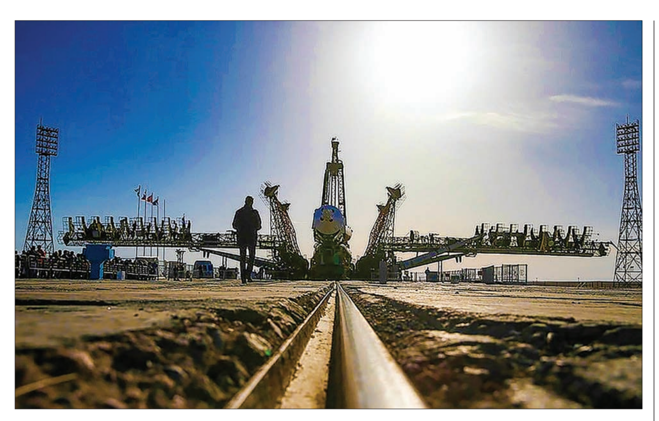
Earlier it was reported that the first launch of the new Russian super-heavy carrier rocket was expected in 2028.

WORLD 16 AUGUST 2017 THE GLOBAL NEW LIGHT OF MYANMAR