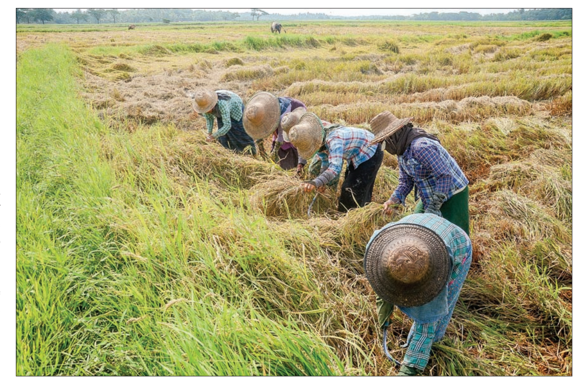
Farmers harvesting rice in their paddies in Kangyidaunk, Ayeyawady Region.

such as rice, beans and pulses, fruits, rubber, sesame seeds and maize are exported across land