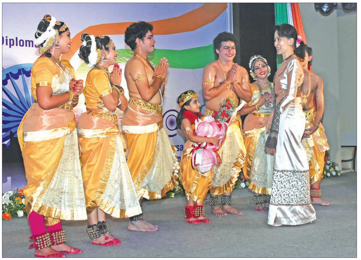
Daw Aung San Suu Kyi greets performers at the ceremony to mark 70 years of diplomatic relations between Myanmar and India.