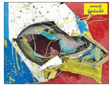
More wreckage of Y-8 Tatmadaw transport plane discovered.

Tatmadaw navy ships and local fishermen continue to trawl the area where the plane crashed. —Myanmar News Agency ■