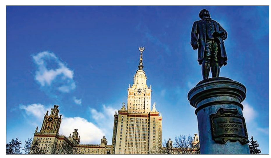
The top-5 includes Harvard University, Stanford University, University of Cambridge, Massachusetts Institute of Technology and University of California, Berkeley.

The top-5 of the 2017 Academic Ranking of World Universities includes Harvard University, Stanford University, University of Cambridge, Massachusetts Institute of Technology and University of California,