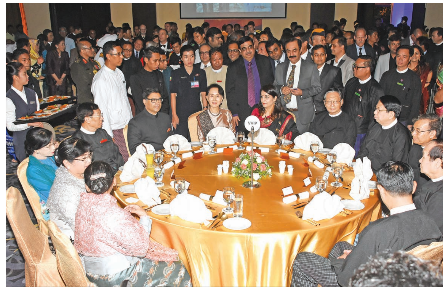
State Counsellor Daw Aung San Suu Kyi and Union ministers atttend a dinner to mark 70<sup>th</sup> anniversary of diplomatic ties between India and Myanmar and 70<sup>th</sup> anniversary of the Independence Day of India in Nay Pyi Taw yesterday.

The ministry urged the elderly, children, pregnant women, people with chronic illnesses and low immune systems to follow the ministry's guidelines to protect against the seasonal influenza and to receive medical examinations at the nearest health department if they experience any of the virus' symptoms. —Myanmar News Agency