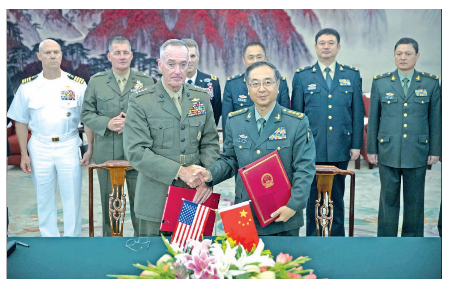
Joint Chiefs Chairman General Joseph Dunford and Chief of the General Staff of the Chinese People's Liberation Army General Fang Fenghui shake hands after signing an agreement to strengthen communication between the two militaries amid tensions concerning North Korea at the Bayi Building in Beijing, China on 15 August, 2017.