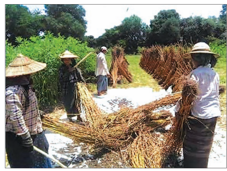
Farmers harvest and then dry and thrash until all the seeds are broken free from the pods.

About 73 per cent of agriculture land in Magway Region is used for agriculture. Twenty nine per cent of the region's crops are used for edible oil production. Currently, Agriculture Department officials are discussing with people engaged in supply chain to produce quality sesame seeds and access to beneficial markets. —Zin Oo (Myanma Alinn) ■