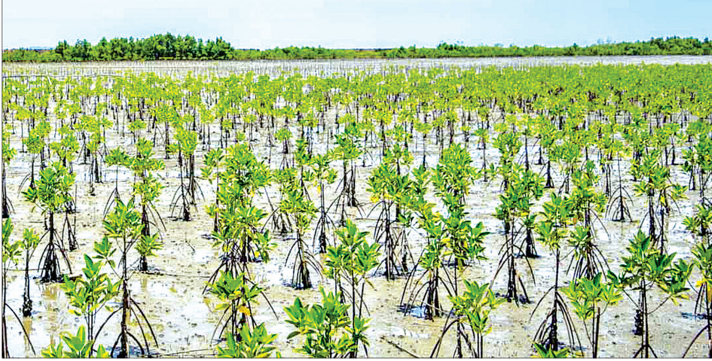
Supporting the mangrove restoration in Myanmar. In partnership with Worldview International Foundation

Mangroves play a vital role in the fight against climate change. They help mitigate carbon emissions, as well as protect vulnerable coastal communities from extreme weather, while strengthening seafood stocks up to 50 per cent.