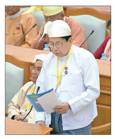
Union Minister for Information Dr Pe Myint.

In other issues discussed yesterday, Union Minister for Industry U Khin Maung Cho said the No. 1 Steel Factory (Myingyan) is producing steel billets that are not of finished product quality and thus losses are being incurred. As steel usage in