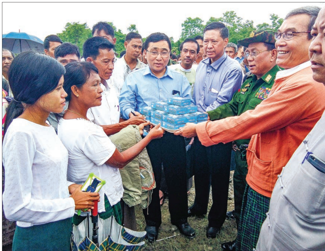
Union Minister Dr Win Myat Aye provides FM radios to villagers in Rakhine State.

After inspecting a relief camp at Hsatyoekeya new town, Sittway Township, they provided Ks 67.7 million, one hundred thousand kyats per house, to install meters at the new town. They also looked around the Thekkepyin and Darpaing IDP camps. They also discussed regional development undertakings with the local.— Myanmar News Agency ■