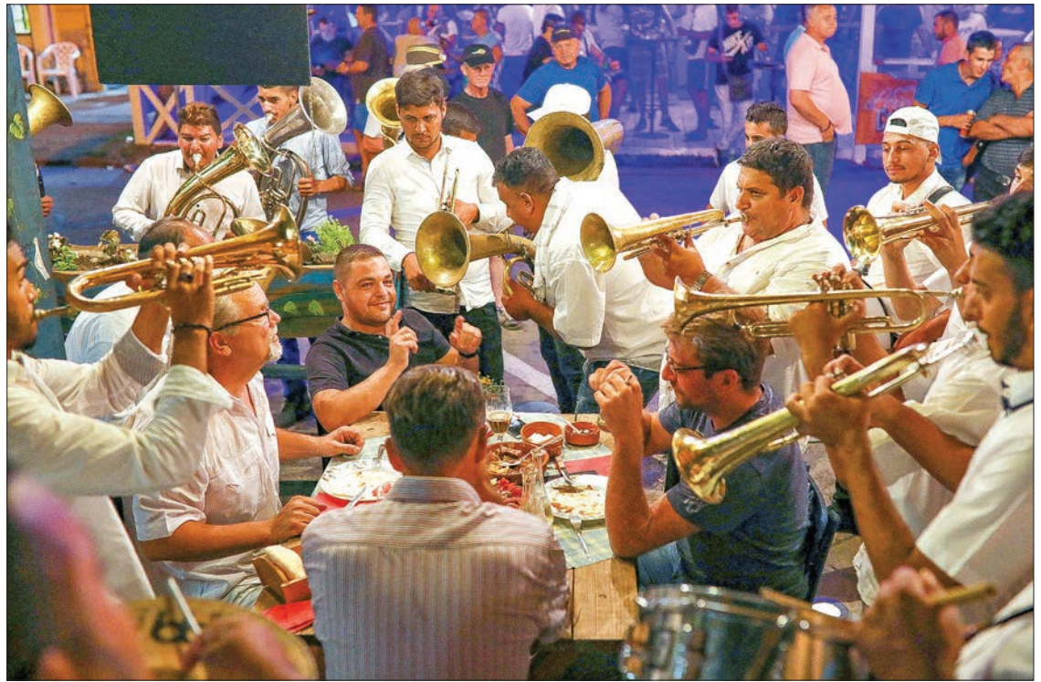
A band plays during the 57th Brass Band Festival, in the village of Guca, Serbia, on 11 August 2017.

In an attempt to avoid the serious road accidents which have marred the festival in the past, police have ordered all drivers along the two roads leading in and out of Guca to take a breathalyzer test.—Reuters ■