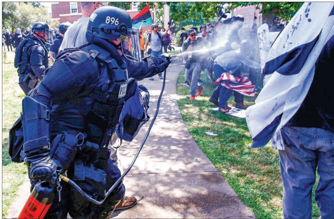
Virginia State Police use pepper spray as they move in to clear a clash between members of white nationalist protesters against a group of counter-protesters in Charlottesville, Virginia, US, on 12 August 2017.

About two dozen people were arrested in Charlottesville in July when the Ku Klux Klan rallied against the plan to remove the Lee statue. Torch-wielding white nationalists also demonstrated in May against the removal. —Reuters ■