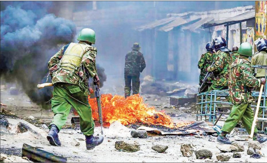
Anti riot policemen clash with protesters supporting opposition leader Raila Odinga in Mathare, in Nairobi, Kenya, on 12 August 2017.

Reuters was able to confirm 11 deaths, including one girl, in the space of 24 hours. The Kenya National Commission on Human Rights said 24 people had been shot dead by