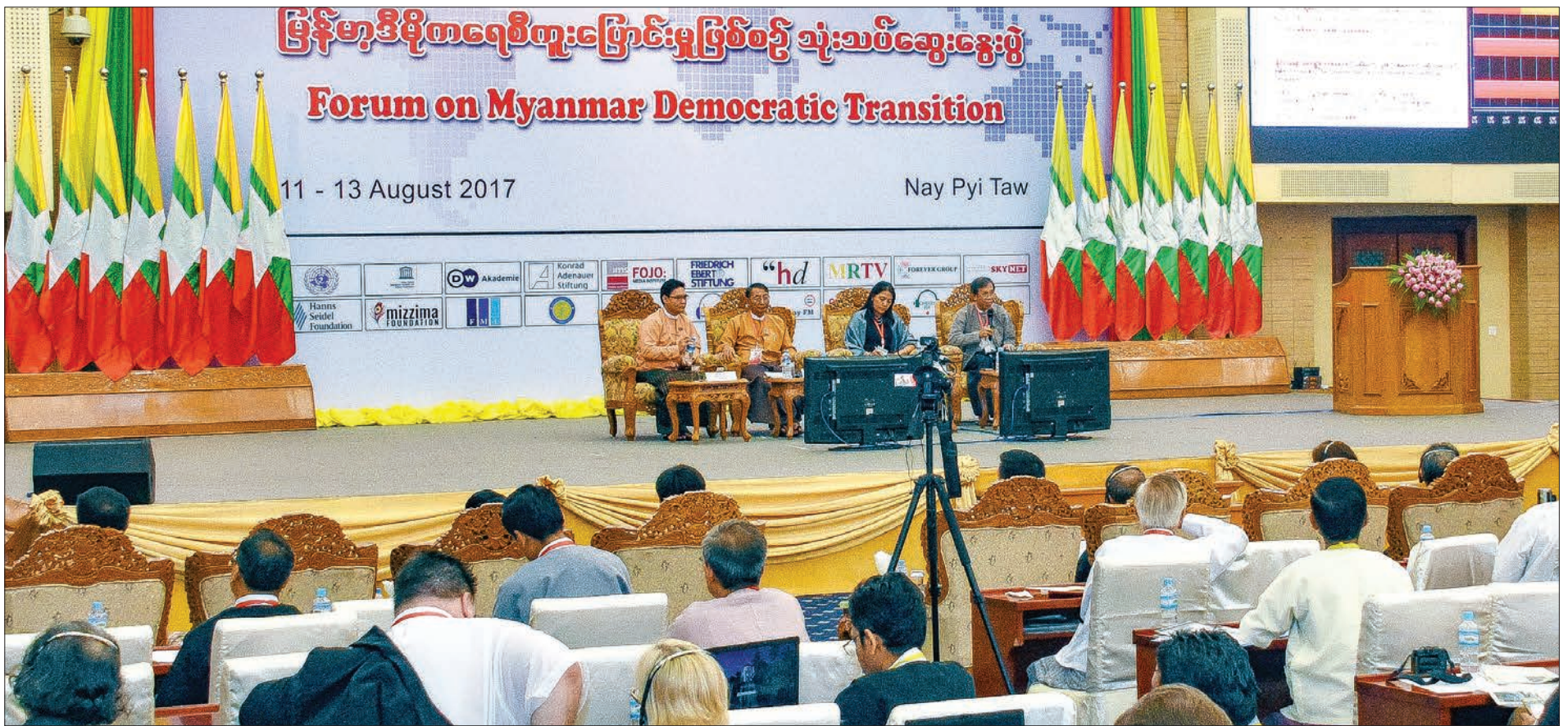
Panelists participate in the "Where is Myanmar in its Transition" session of the Forum on Myanmar Democratic Transition.