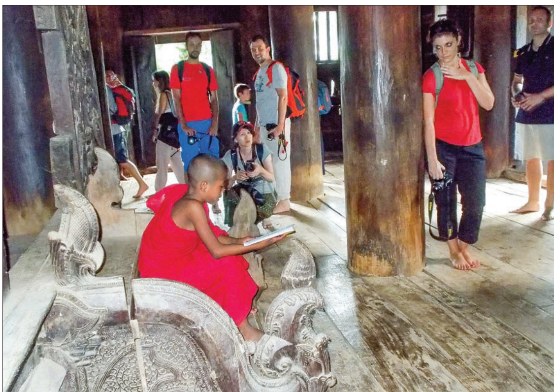
Tourists are taking photograph of a novice who is sitting and reading religious book at an ancient monastery.

Among the most popular landmarks in Ava are the Ava Bridge, the Ava Palace, the Bagaya Monastery, the Maha Aungmye Bon Zan Brick Monastery (Me Nu Oak Kyaung), the Nanmyin Tow-