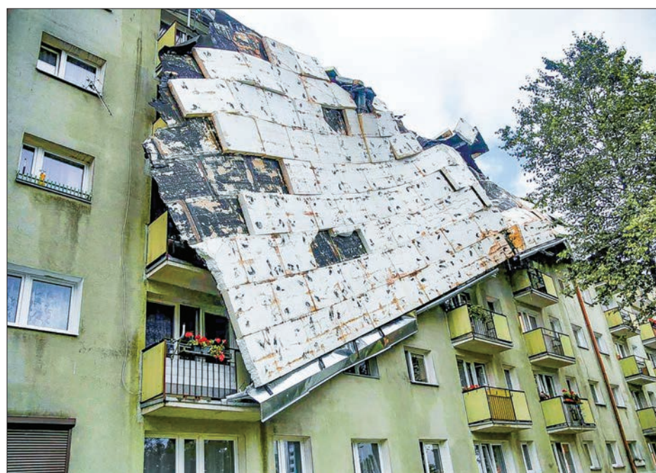
A roof destroyed by a storm hangs from an apartment building in Bydgoszcz, Poland, on 12 August 2017. PHOTO: REUTERS

Grzegorz Nowik, head of the Scouting Association of the Republic (Poland), ordered a month of mourning for the organisation. —Reuters ■