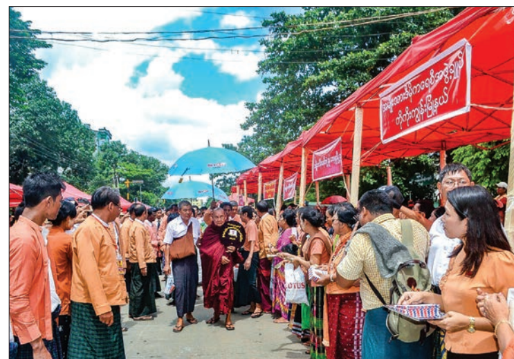
The rice donation ceremony in progress.

At noon, the National League for Democracy (Yangon Region)