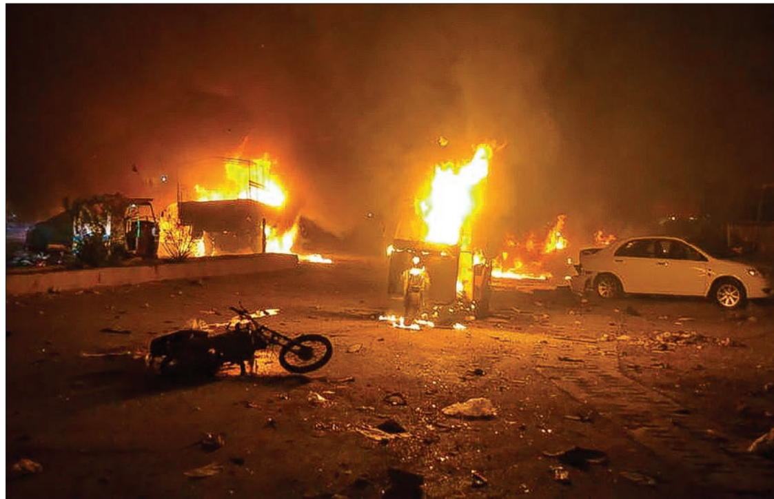
Vehicles are seen burning after a bomb blast in Quetta, Pakistan, on 12 August 2017.