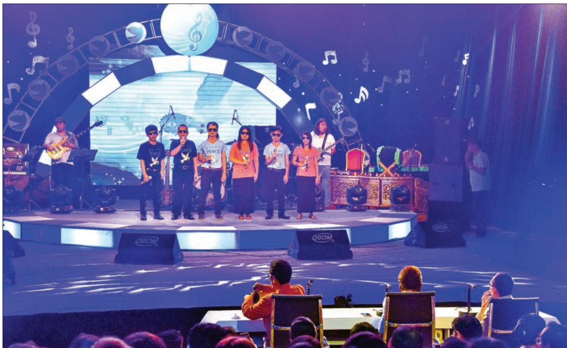
Peace music festival in progress.

Families of the festival and well-wishers are visiting IDP camps of the host cities and donating provisions.—MNA ■