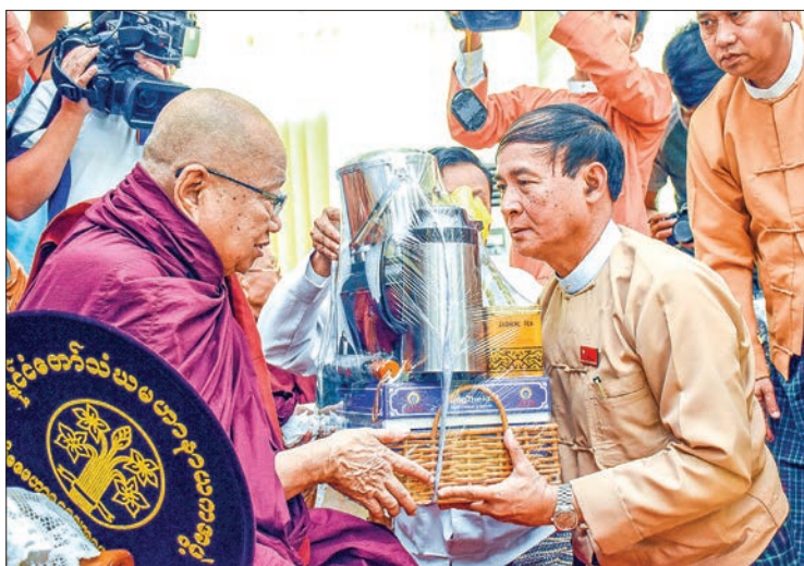
Pyithu Hluttaw Speaker U Win Myint presents offertories to a Sayadaw.