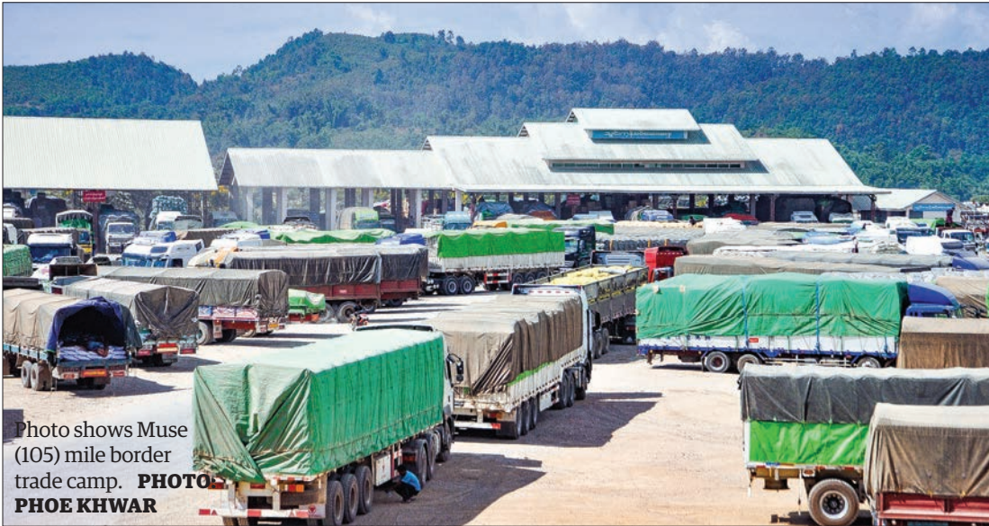
Photo shows Muse (105) mile border trade camp.