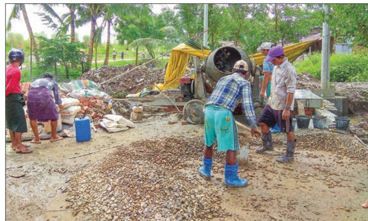
Workers being seen at the work place.

In addition to the culverts, three new creek bridges have been installed in Ward-9 and Ward-1 according to the development plan.—Ko Kyaw (Thonegwa)