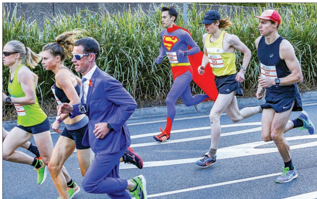
A man in a Superman outfit runs during the annual City to Surf fun race in Sydney, Australia, on 13 August 2017.