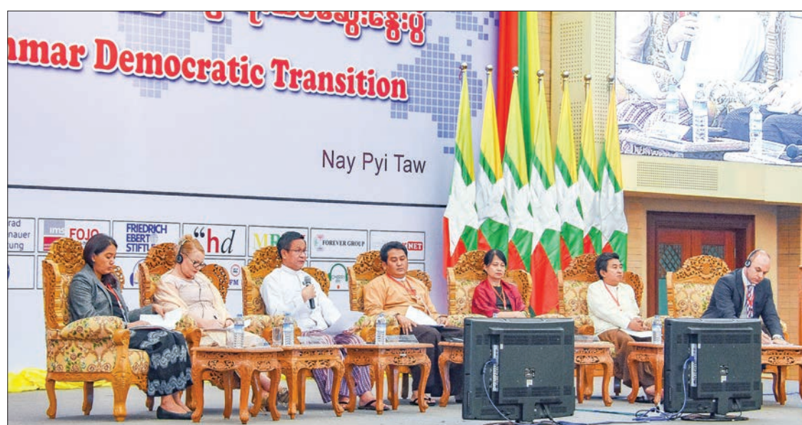
The review session of the Forum of Myanmar Democratic Transition in progress.

She noted the important role of the rule of law, the firmness of the rule of law, internal security and institutions and the absence of corruption in democracy, the holding of such forums also in the provinces, the youth involvement, the invitation of the Tatmadaw for transition, reinforcement of the transition through promotion of military-civilian relations by encouraging more public participation in the Tatmadaw's role, the essential role of the people in political, economic and social sectors, self-determination and all-inclu-