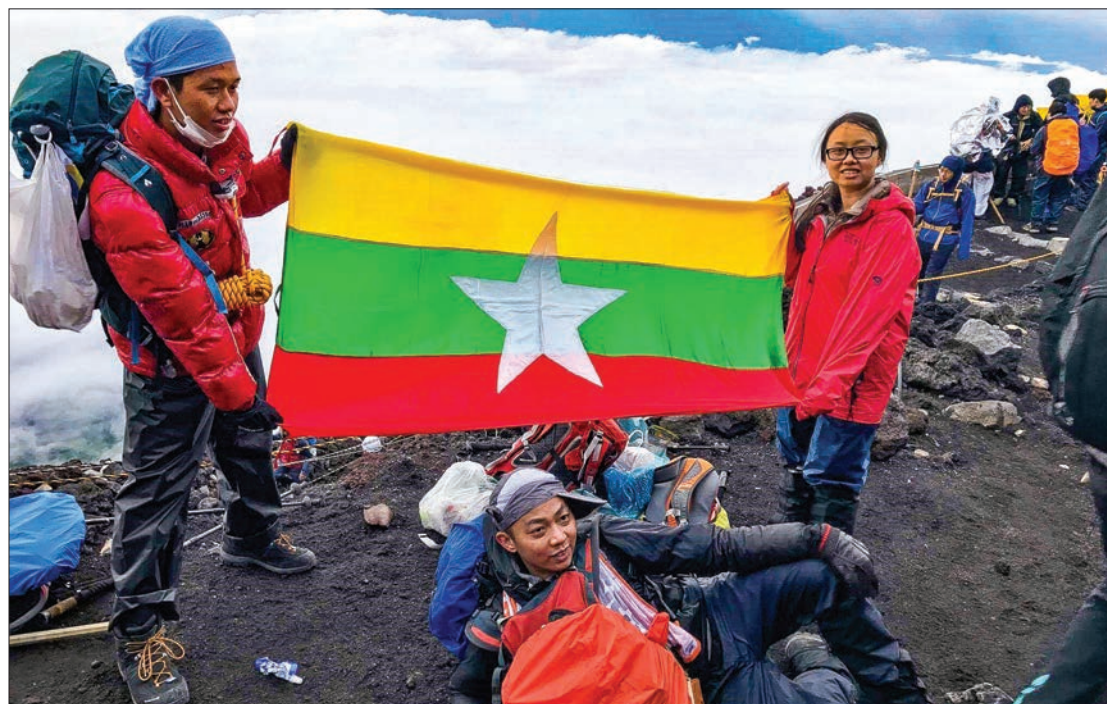
MYANMAR climbers in Japan reached the 12,389-foot peak of Mount Fuji, an active volcano and Japan's highest at dawn on 12 August, according to the expedition team.

The Myanmar climbers are currently working and living in Japan and started climbing the world famous mountain on 11 August, Japan's Mountain Day. Once arriving at the peak, they planted the country's flag, said a member of Myanmar Tozan Club.