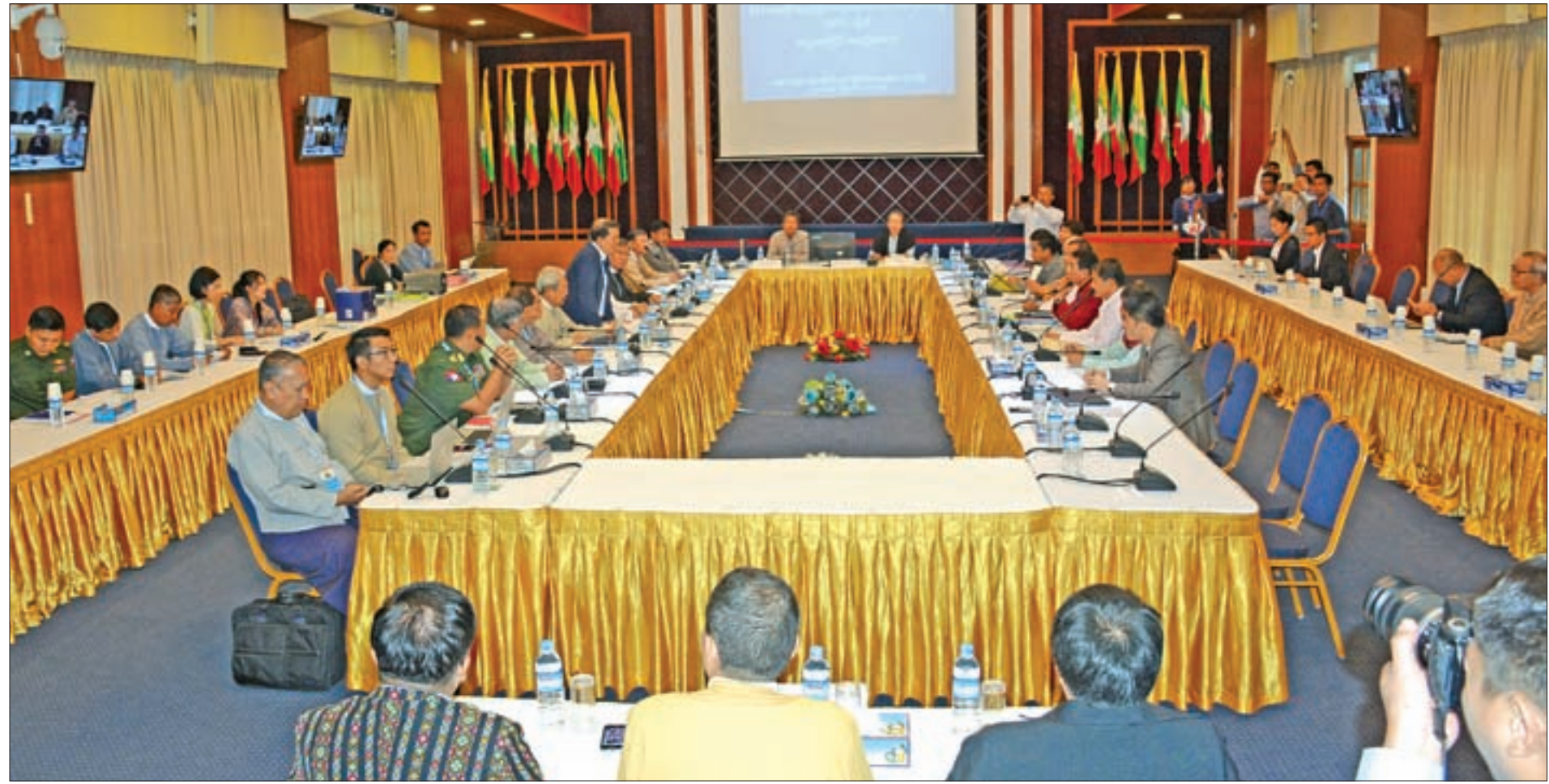
Peace makers discuss agreed points in detail at the sixth dialogue between the Delegation for Political Negotiation of the UNFC and the Peace Commission in Yangon.