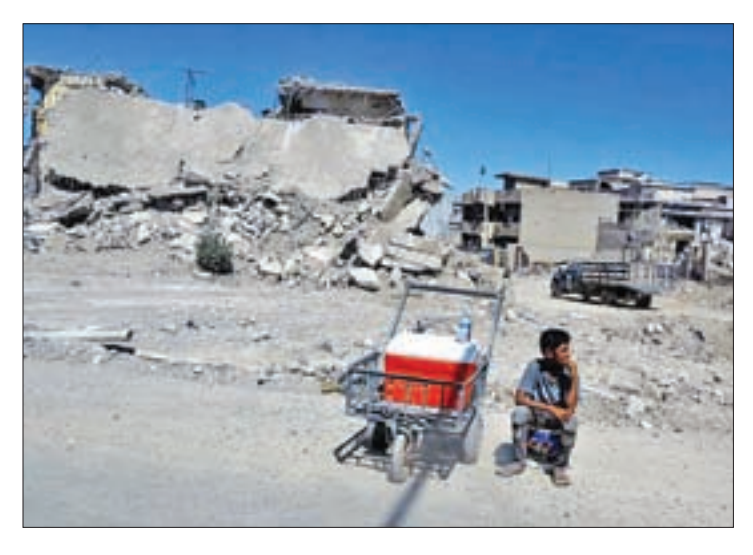
An Iraqi boy sells water in front of destroyed houses on a street in Western Mosul, Iraq on 7 August, 2017.

MOSUL, (Iraq) — Abu Ghazi stood smoking a cigarette outside what used to be his home in Mosul's Old City, where only the sound of the footsteps of a few soldiers on patrol and twisted pieces of metal and fabric flapping in the wind disturb the eery silence.