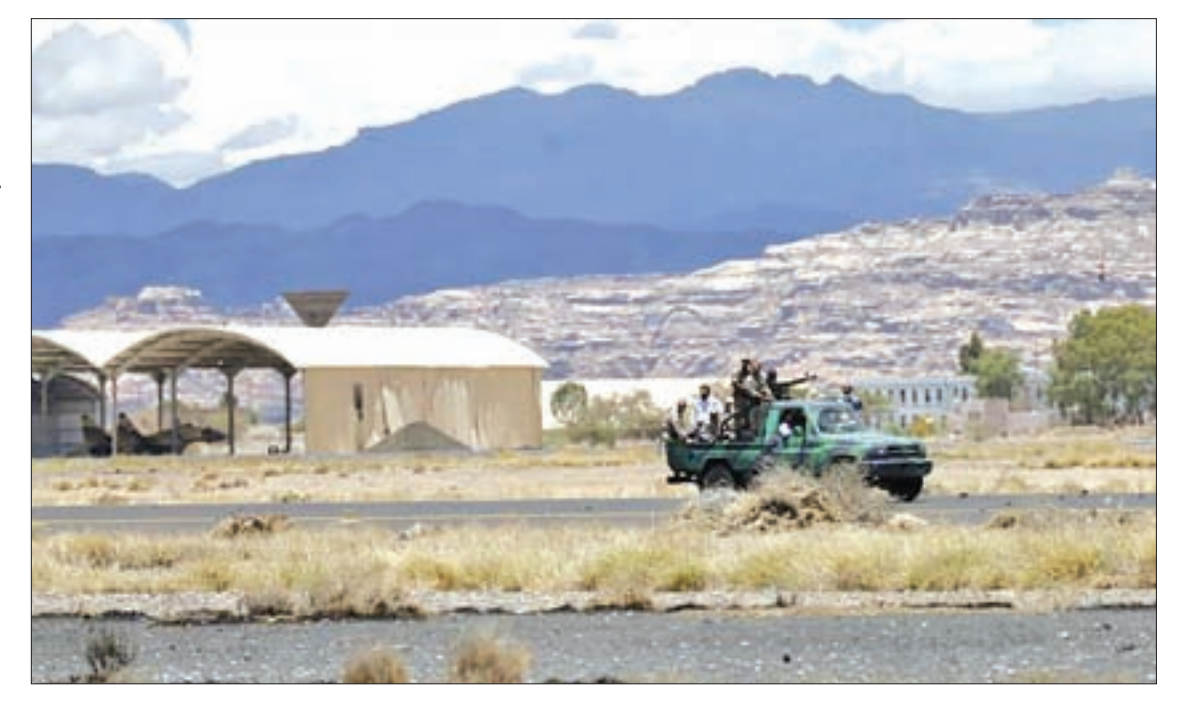
Houthi militants ride on a vehicle on the runway of the international airport of Yemen's capital Sanaa, on 5 May 2015.

"The official closure of Sanaa airport, one year ago today, effectively traps millions of Yemeni people and serves to prevent the