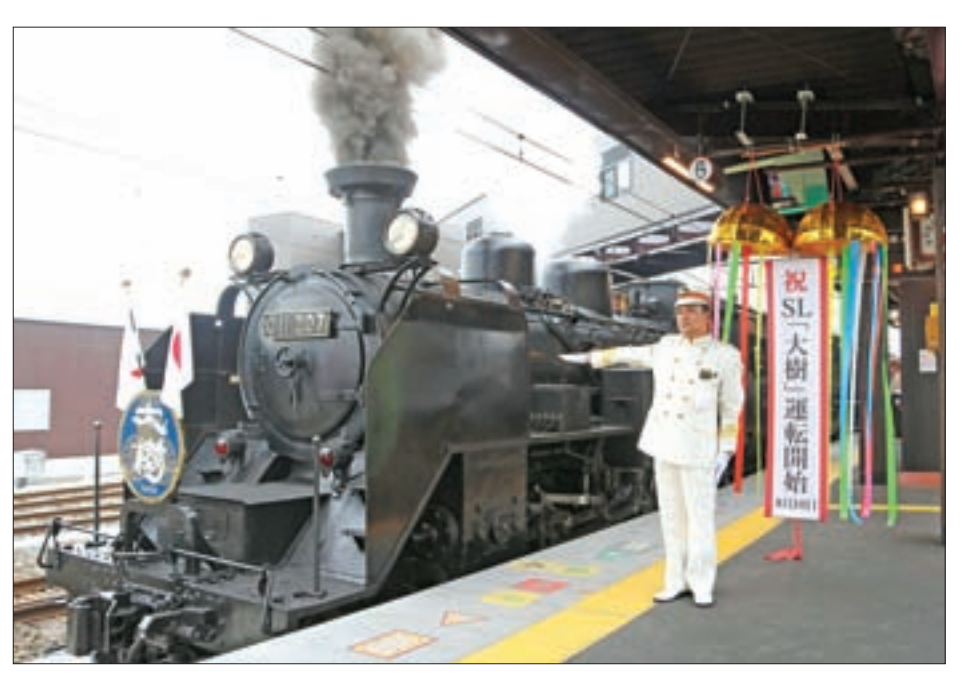
A steam locomotive emits smoke at Shimoimaichi station in Tochigi Prefecture, eastern Japan, on 10 August 2017, as Tobu Railway Co. began operating its first steam train service in 51 years on a short stretch of track in the tourist site of Nikko in the prefecture.

way operator abolished its steam locomotive service in 1966 but decided to revive it now with the aim of revitalizing the Nikko and Kinugawa areas, whose main tourist spots include the Nikko Toshogu shrine, a UNESCO World Herit-