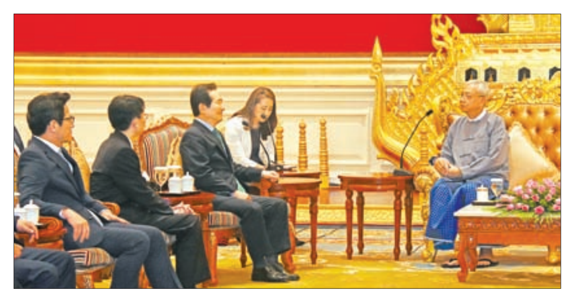
President U Htin Kyaw meets with a delegation led by Speaker of National Assembly of Korea.

Also present at the meeting were Deputy Pyithu Hluttaw Speaker U T Khun Myat, Deputy Amyotha Hluttaw Speaker U Aye Tha Aung, Deputy Minister of President's Office U Min Thu and officials. — Myanmar News Agency ■