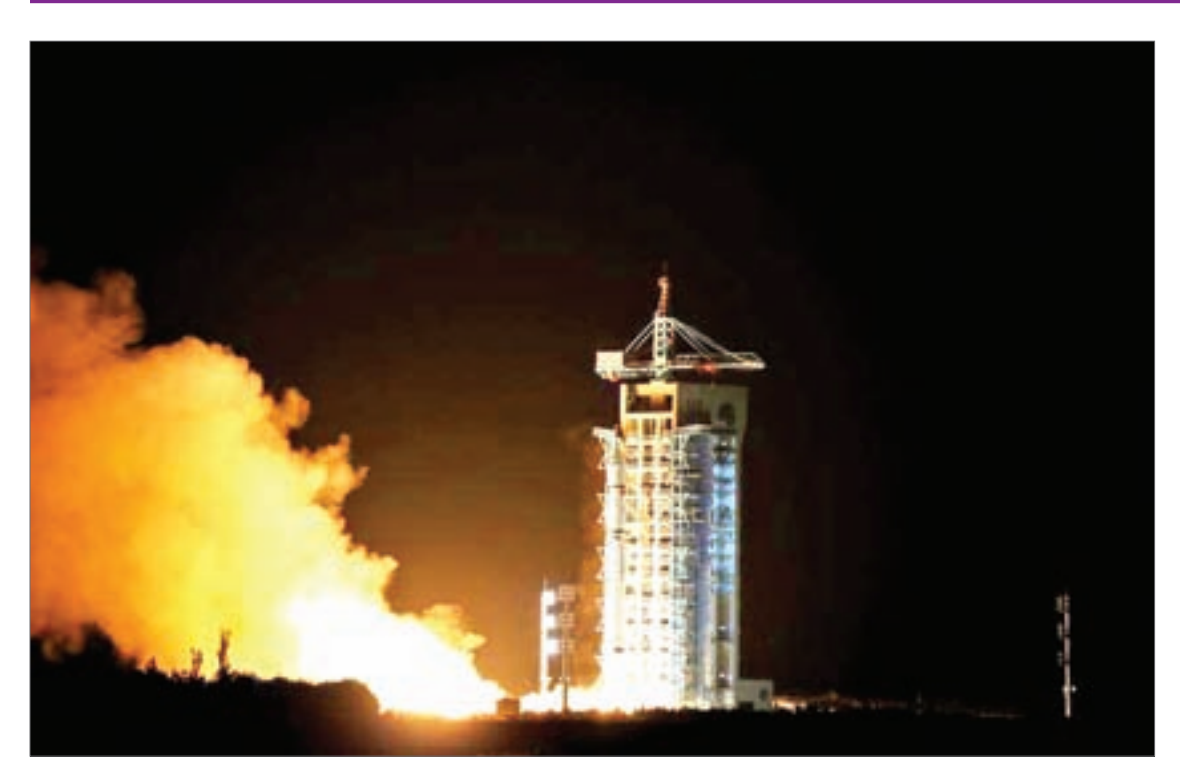
World's first quantum satellite is launched in Jiuquan, Gansu Province, China, on 16 August 2016. PHOTO:

11 AUGUST 2017 WORLD THE GLOBAL NEW LIGHT OF MYANMAR