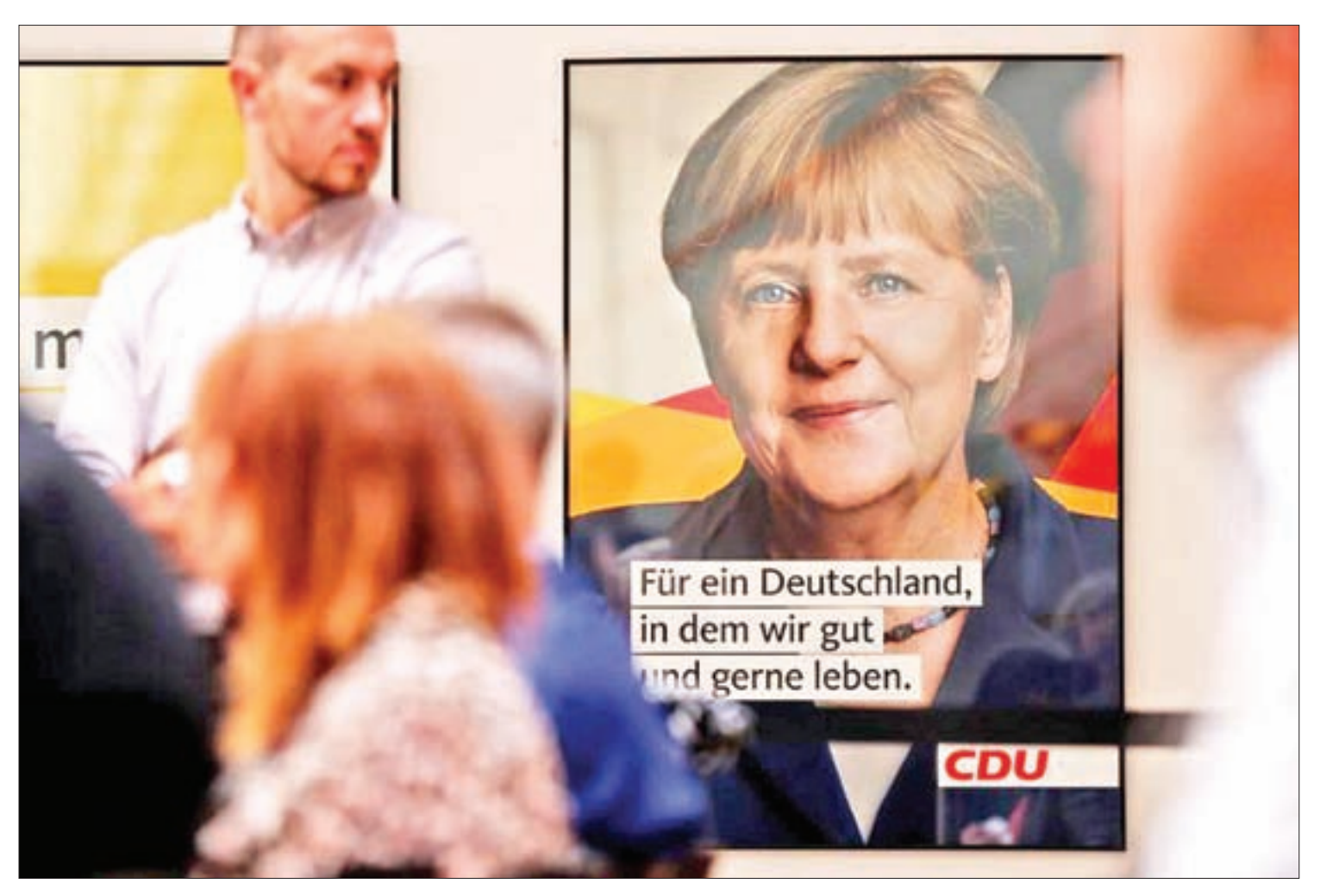
The party Christian Democratic Union (CDU) presents a new poster for the upcoming election campaign with a headshot of German Chancellor Angela Merkel in Berlin, Germany, on 7 August 2017.