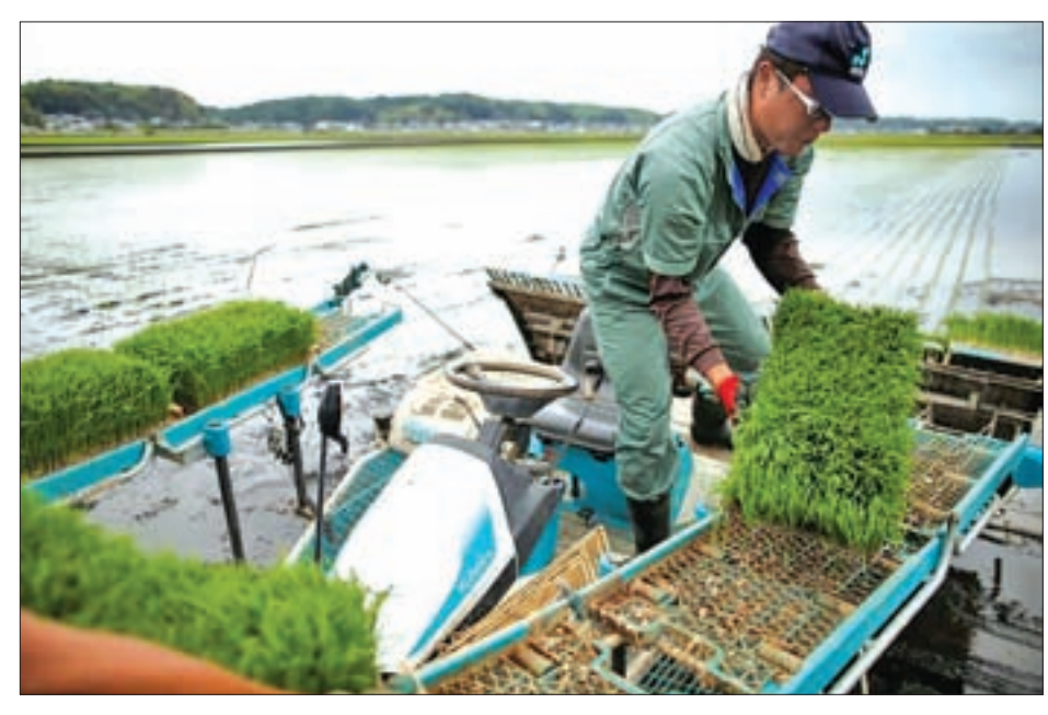
A farmer using rice planting machine conducts rice transplanting in Ryugasaki, Japan, on 26 June 2017.

He markets his "Migaki Ichigo" brand strawberries directly to fancy department stores in Tokyo, where they go for as much as 1,000 yen ($9) apiece, as well as to customers in Hong Kong, Singapore, Tai-