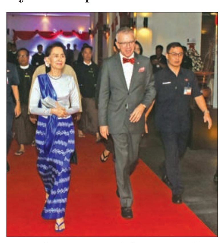
State Counsellor Daw Aung San Suu Kyi arrives a ceremony to celebrate 60 years of Swiss-Myanmar diplomatic relations.

State Counsellor Daw Aung San Suu Kyi attended a ceremony to celebrate 60 years of diplomatic relations between Myanmar and Switzerland in Nay Pyi Taw.