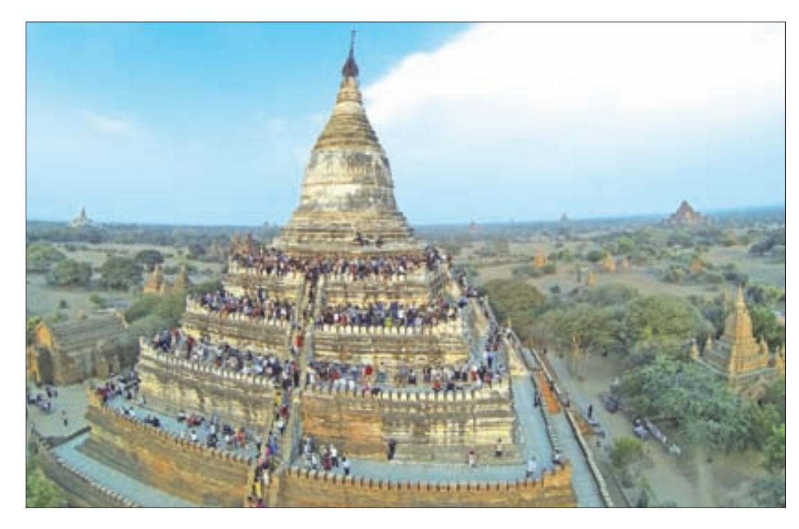
FILE PHOTO - People wait to see the sunset from the top of Shwesandaw Pagoda in the ancient city of Bagan February 13, 2015.

Due to limitation of space we are only able to publish "Letter to the Editor" that do not exceed 500 words. Should you submit a text longer than 500 words please be aware that your letter will be edited.