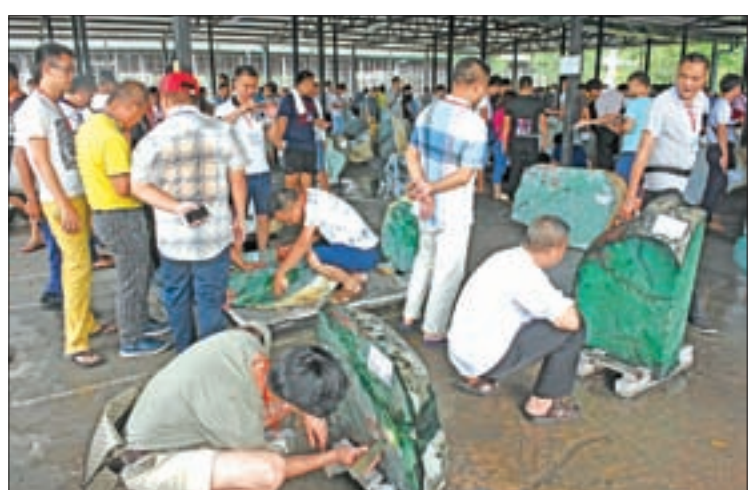
Merchants appraise jade stones at the 54th Myanmar Gems Emporium at the Mani Yadana Jade Hall in Nay Pyi Taw.

total of 4,282 lots of jade were sold from the displayed 5500 lots. —Myanmar News Agency ■