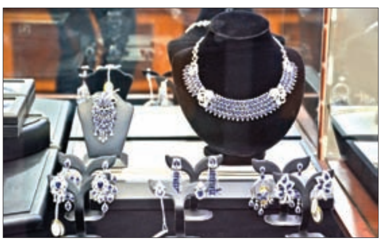
A view shows jeweleries displayed in glass cabinets at the shop of jeweleries.