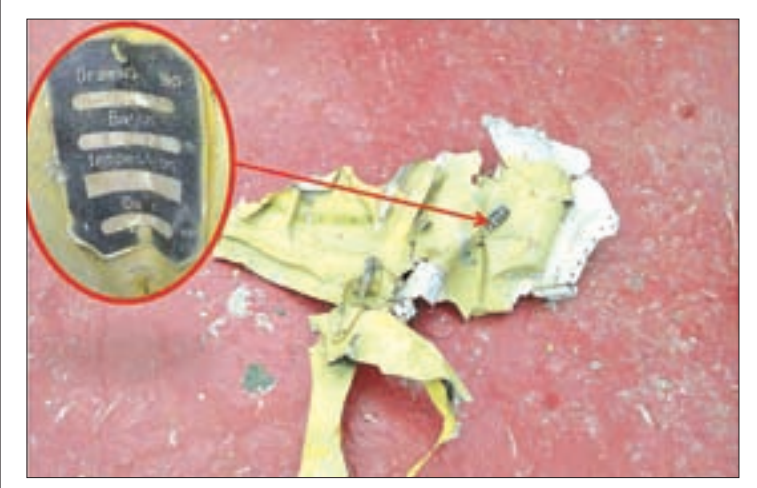
Additional debris of Y-8 plane found yesterday.

Tatmadaw naval vessels, military divers and civilian fishermen have continued to search for wreckage at the crash site.— Myanmar News Agency ■