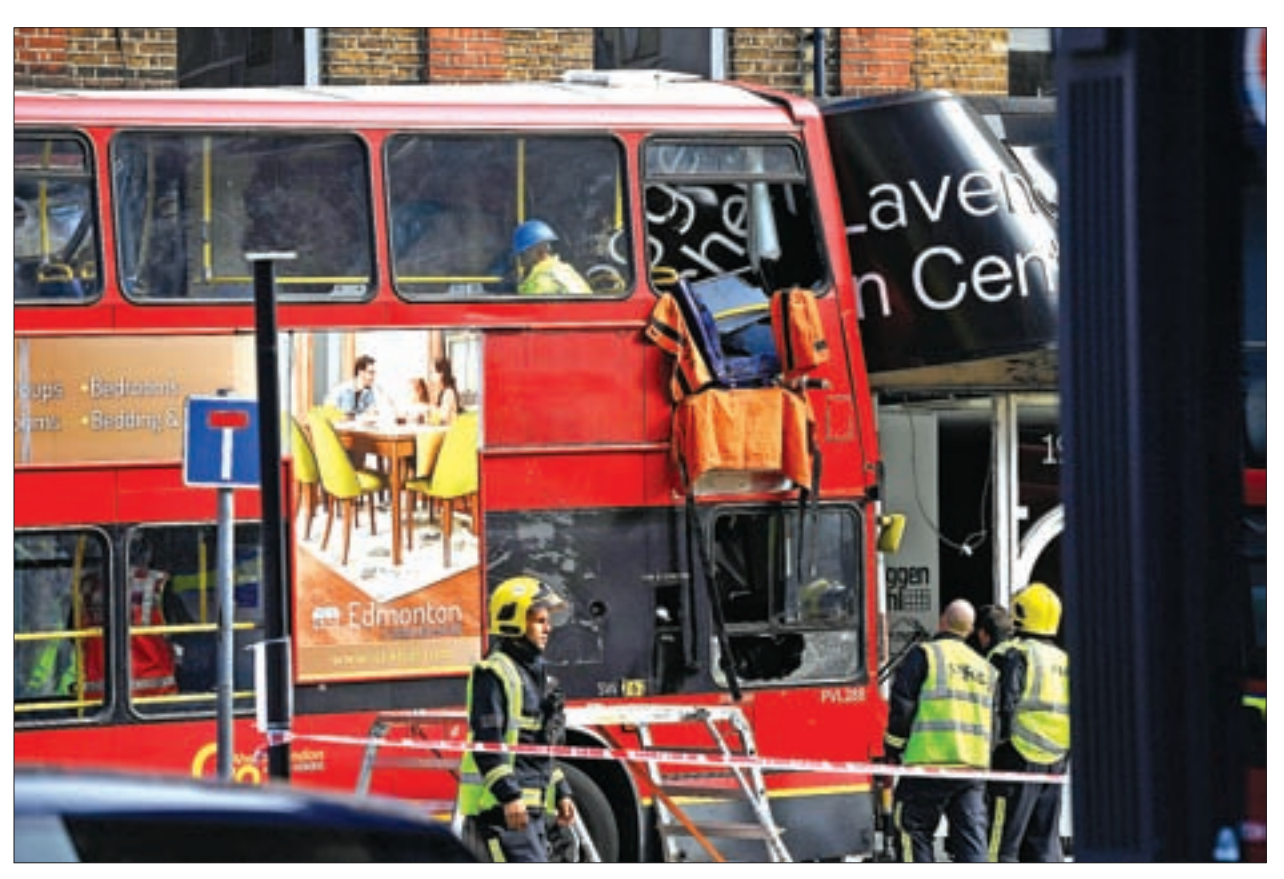
Emergency services attend the scene after a bus crashed into shops in Lavender Hill in Clapham, London, Britain, on 10 August 2017.

11 AUGUST 2017 \mathbf{WORLD} THE GLOBAL NEW LIGHT OF MYANMAR