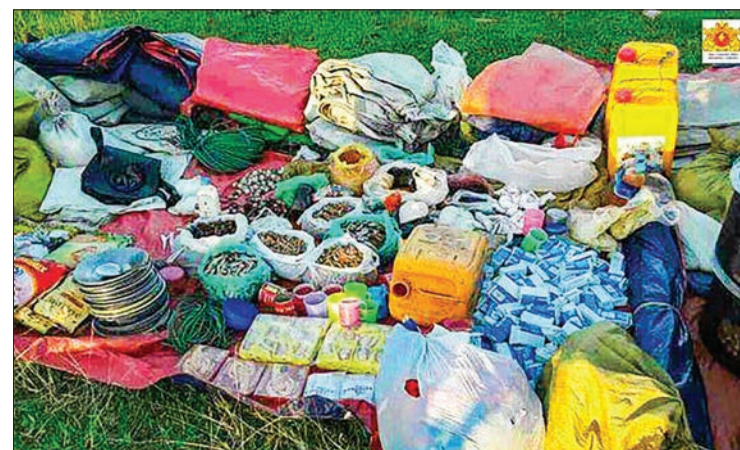
Food delivered by WFP to IDP camps (Upper) and utensils and construction material (Lower left and right) are found at the hidden tents of violent attackers.