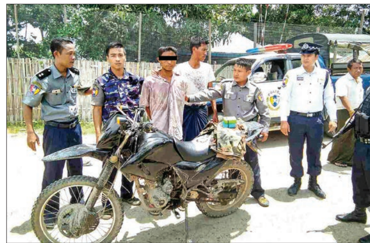
Police arrest man and discover narcotic.

Ministries were assigned responsibilities to enable Myanmar to increase its World Bank ease of doing business ranking. The Ministry of Agriculture, Livestock and Irrigation was given the responsibility to improve Myanmar's Registering Property ranking.—Myanmar News Agency ■