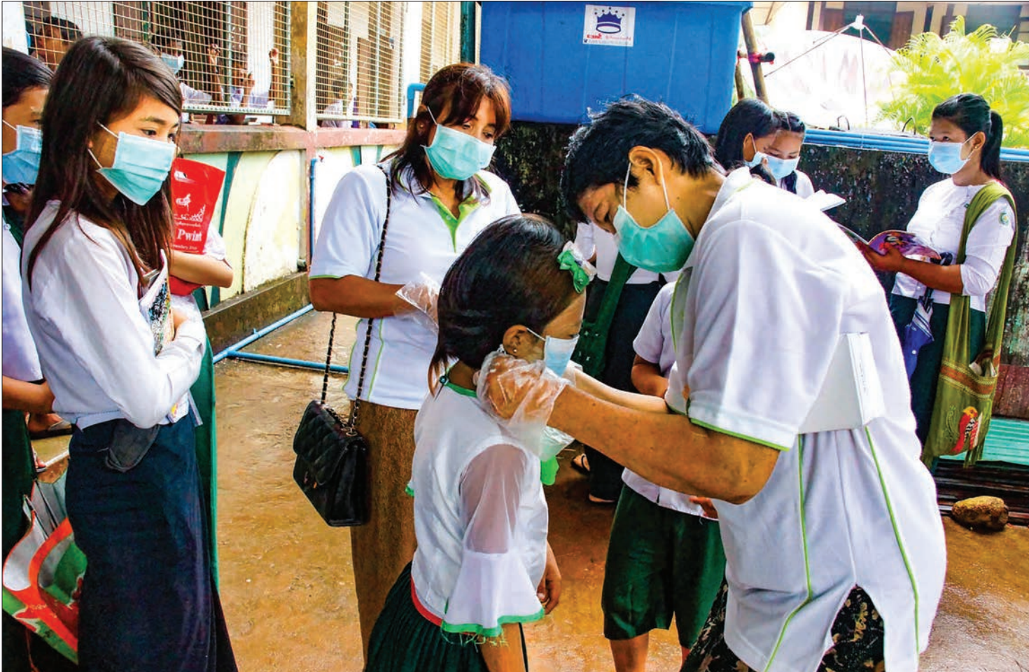
A health official assists a schoolgirl in wearing mask following recommended precautionary measures in Kawthoung.