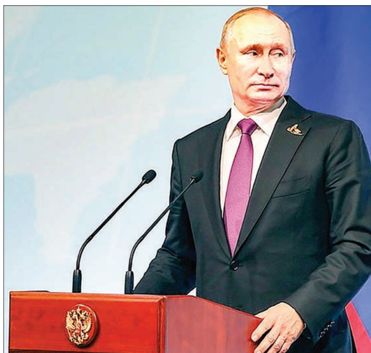
Russian President Vladimir Putin.

"We do have what to say and impose restrictions in such