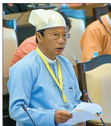
Deputy Minister for Agriculture, Livestock and Irrigation U Hla Kyaw.

Some legislators argued that easing restrictions on agricultural lands would open one of Myanmar's largest economic sectors, and its largest employer, to greater foreign investment. Myanmar agriculture lags behind many of its neighbours in the region due to the lack of agricultural inputs including fertilizers, pesticides, seed productions, farming machinery, storage facilities, food processing and packaging facilities, quality testing facilities and training across agricultural supply chains.