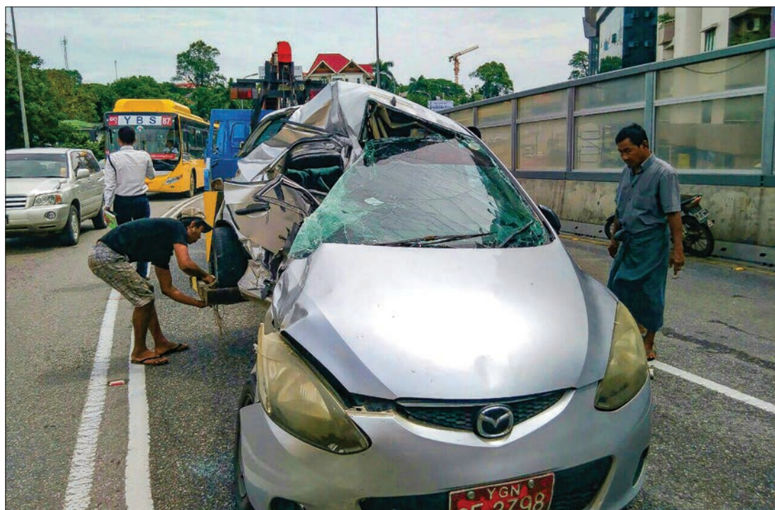
YBS passenger bus crashes into a taxi on the Shwe Gone Taing overpass on Kabar Aye Pagoda Road, yesterday.