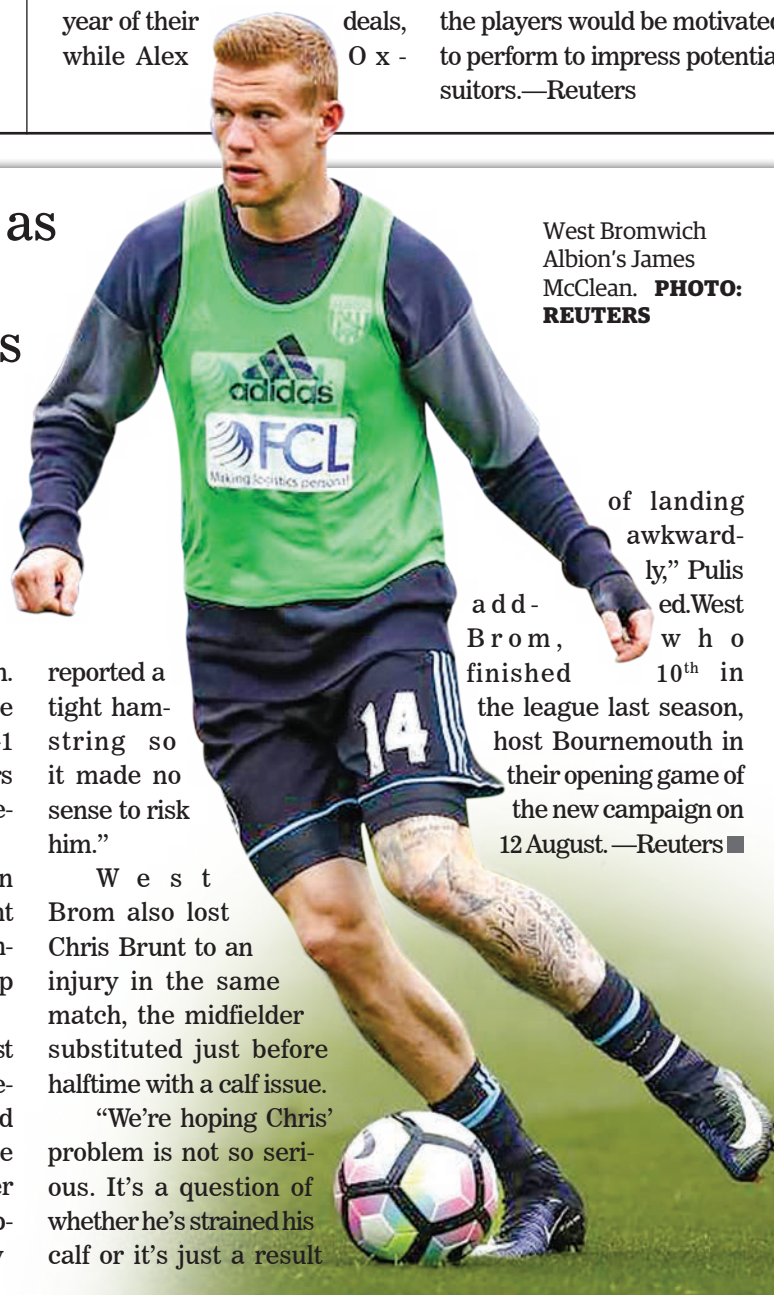
West Bromwich Albion's James McClean.

"James' (injury) is the most concerning at the moment because it is in the knee area and we'll get that scanned to see what that tells us," manager Tony Pulis told the club website. (www.wba.co.uk) "Matty