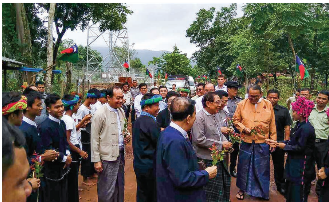
The joint delegation of the Peace Commission and PNLO meeting with local people in a ceasefire area in Thaton, Mon State.