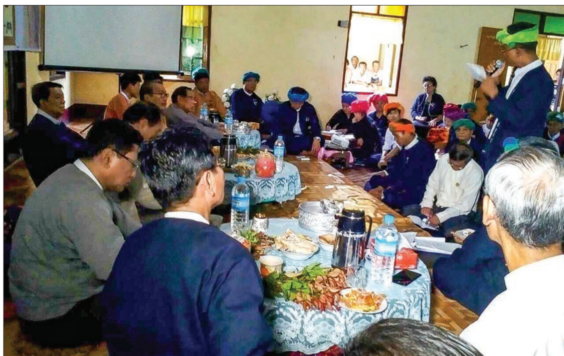
The joint delegation of the Peace Commission and PNLO holds talks with local people in a ceasefire area in Thaton, Mon State.