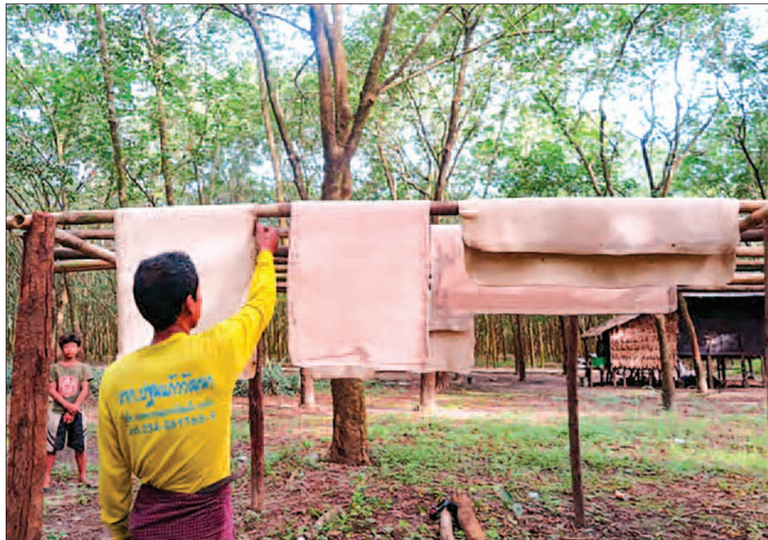
A man hangs up sheets of raw latex rubber to dry in the sun.

Rubber prices for this week are $1,600 to $1,700 per ton for RSS 1, $1,550 to $1,650 for RSS 2, $1,500 to $1,600