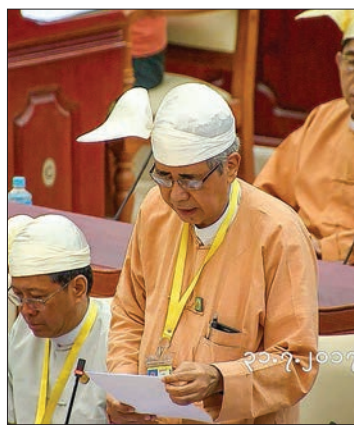
Deputy Minister for Transport and Communications U Kyaw Myo.

satellite earth station in Yangon and Nay Pyi Taw (Tatkon), building the studio, purchasing and installation of machinery needed for the project, hiring fiber channel connections will all require Ministry of Education funding. The Ministry of Information will cooperate with the Ministry of Education." "Teaching and learning is now done in the classroom, but the future paradigm of learning will be beyond classrooms," said U Min Thein of Taungdwingyi constituency. "Instead schools