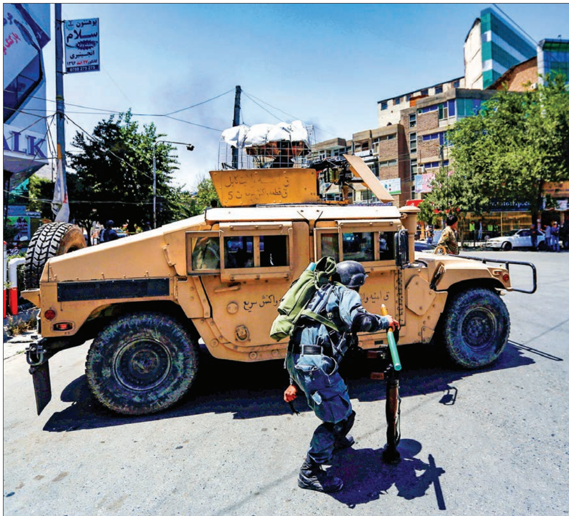
An Afghan police man covers himself as smoke rises from the site of an attack in Kabul, Afghanistan on 31 July, 2017.

The Taliban, fighting to reestablish strict Islamic law 16 years after being expelled by a US-led campaign in 2001, have opposed Islamic State.— Reuters ■