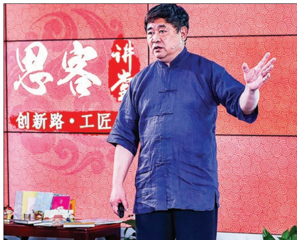
Shan Jixiang, curator of the Palace Museum, gives a lecture at Xinhuanet in Beijing, capital of China, on 26 July, 2017.

"Now, we have finally met people's needs of taking home the culture of Palace Museum," said Shan. — Xinhua ■