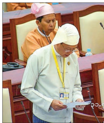
Union Minister for Education Dr. Myo Thein Gyi. PHOTO: MNA

Setting up fiber channel connections and connecting it to the