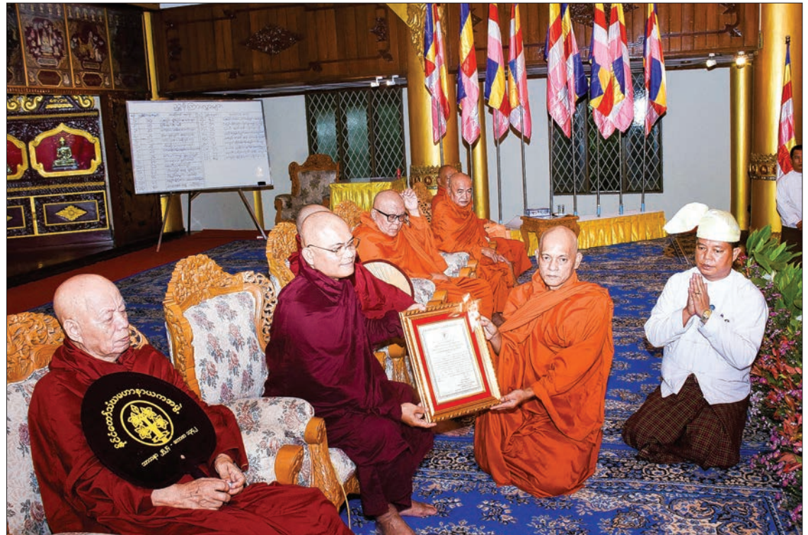
State Sangha Maha Nayaka Committee Sayadaws offer certificates to graduate sanghas at the Tatmadaw Dhammayone yesterday.