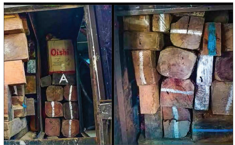
Illegal timber seized on Lashio-Muse road in Shan State.

Timber smuggling is a common practice along the Myanmar-China border in Shan State. The seizure of the three vehicles occurred on a day that authorities at the Yaypu inspection station conducted a total of 10 seizures of contraband lumber worth an estimated Ks173 million. Traffic checkpoints are stationed at Yaypu, Hsenwi Township, Shan State and Mayanchaung, Kyaikto Township, Mon State.—GNLM ■