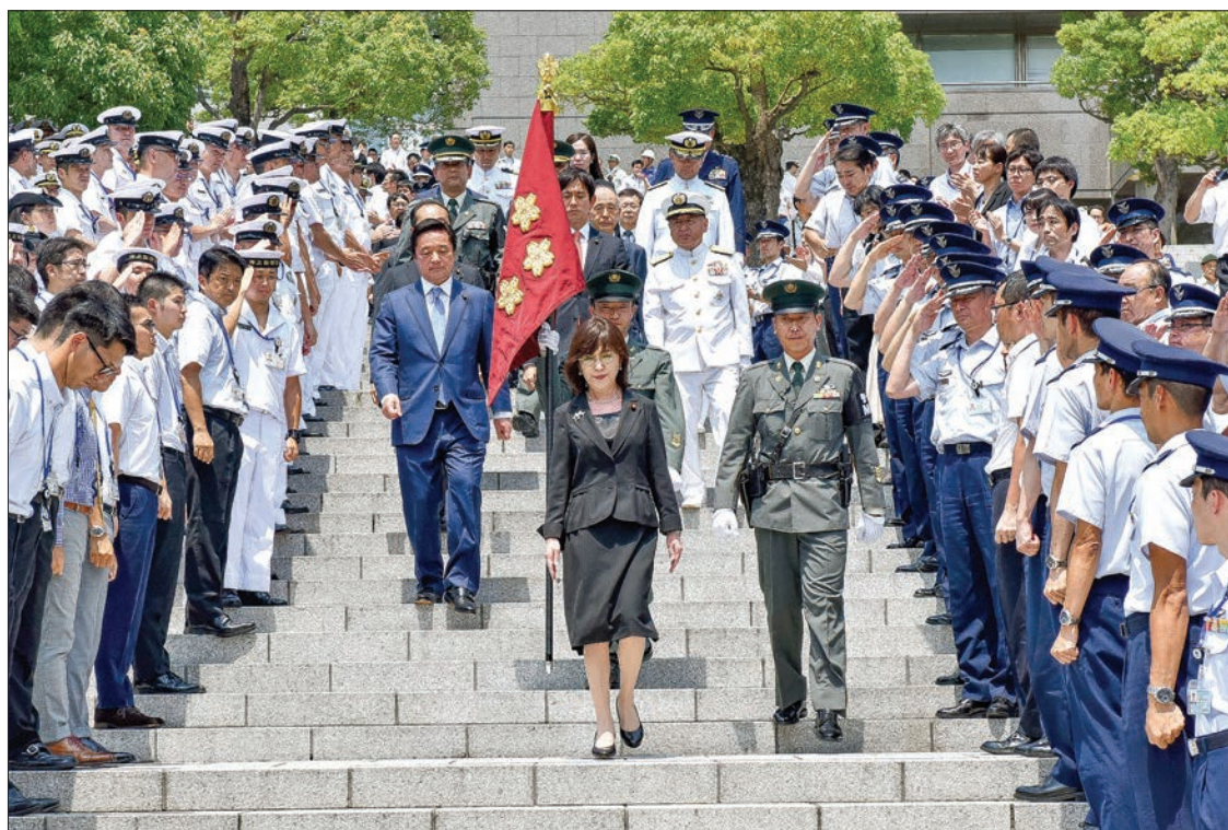
Former Defence Minister Tomomi Inada (L front) walks down stairs as personnel see her off after a ceremony marking the end of her duties at the Defence Ministry in Tokyo on 31 July, 2017.

The Defence Ministry usually holds a ceremony for a min-