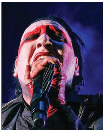
Marilyn Manson.