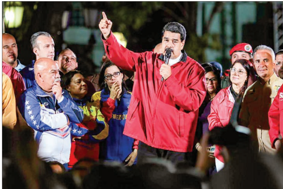
Venezuela's President Nicolas Maduro (C) speaks during a meeting with supporters in Caracas, Venezuela on 30 July, 2017.

The vote could exacerbate those economic woes if the United States — the top market for Venezuelan oil — follows through on threats of economic sanctions, and could sow doubts among investors