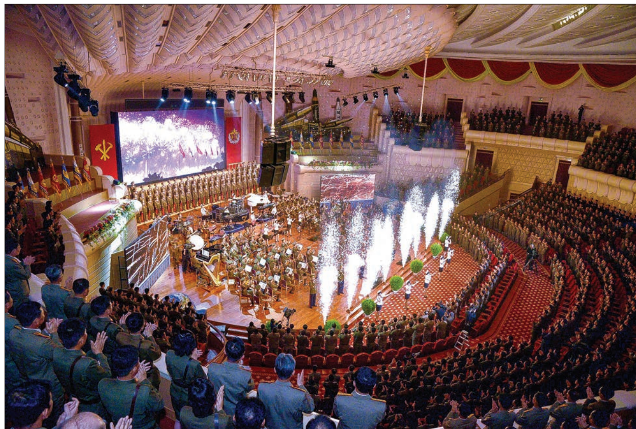
The Central Committee and the Central Military Commission of the Workers' Party of Korea hold a banquet at the Workran House in celebration of secone successssful test-fire of international ballistic missiles (ICBM) Hwasong-14, in this update picture provided by KCNA in Pyongyang on 30 July, 2017.

It said Trump “reaffirmed our ironclad com-