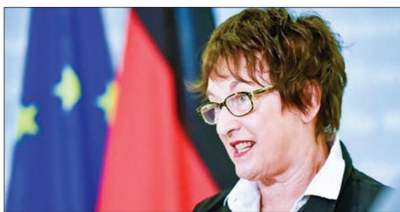
German Minister for Economic Affairs and Energy, Brigitte Zypries.

"We consider this as being against international law, plain and simple," Brigitte Zypries told the Funke Mediengruppe newspaper chain. "Of course we don't want a trade war. But it is important the European