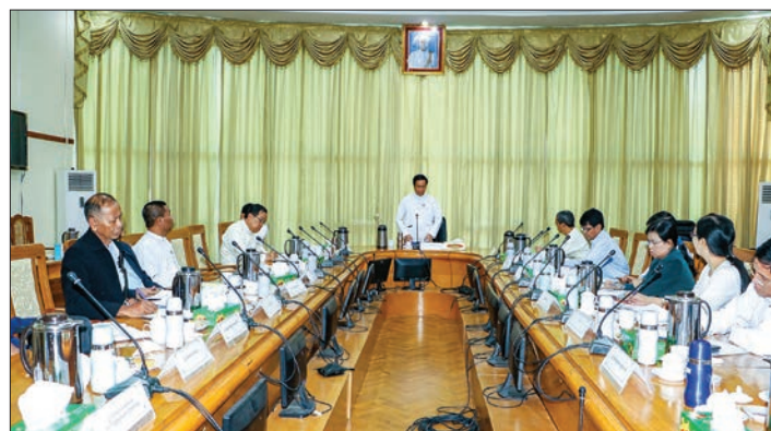
Deputy Minister for Commerce U Aung Htoo addresses the Trade and Investment Development Work Committee meeting.

The discussions were led by Work Committee Chairman Deputy Minister U Aung Htoo.—Myanmar News Agency ■