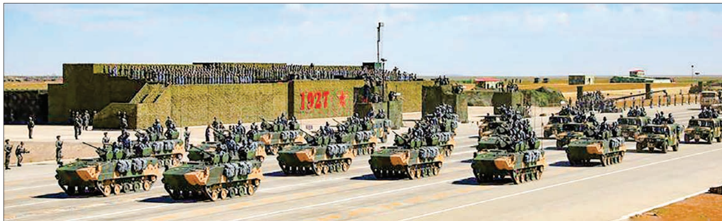
Photo taken on 30 July, 2017 shows a formation of airborne troops during a military parade at Zhurihe training base in north China's Inner Mongolia Autonomous Region. China on Sunday held a grand military parade to mark the 90th founding anniversary of the People's Liberation Army.

culations based on that flight data and estimates from the US, Japanese and South Korean militaries showed the missile could have been capable of going as far into the United States as Denver and Chicago. David Wright of the US-based Union of Concerned Scientists wrote in a blog post that if it had flown on a standard trajectory, the missile would have had a range of 10,400 km (6,500 miles). —Reuters ■