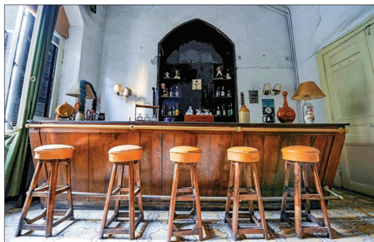
A view shows the bar of the Baron Hotel in Aleppo, Syria, on 14 July 2017.

Critics say Syria's government has long been one of the most oppressive in the Middle East and this was a root cause of the war.—Reuters ■