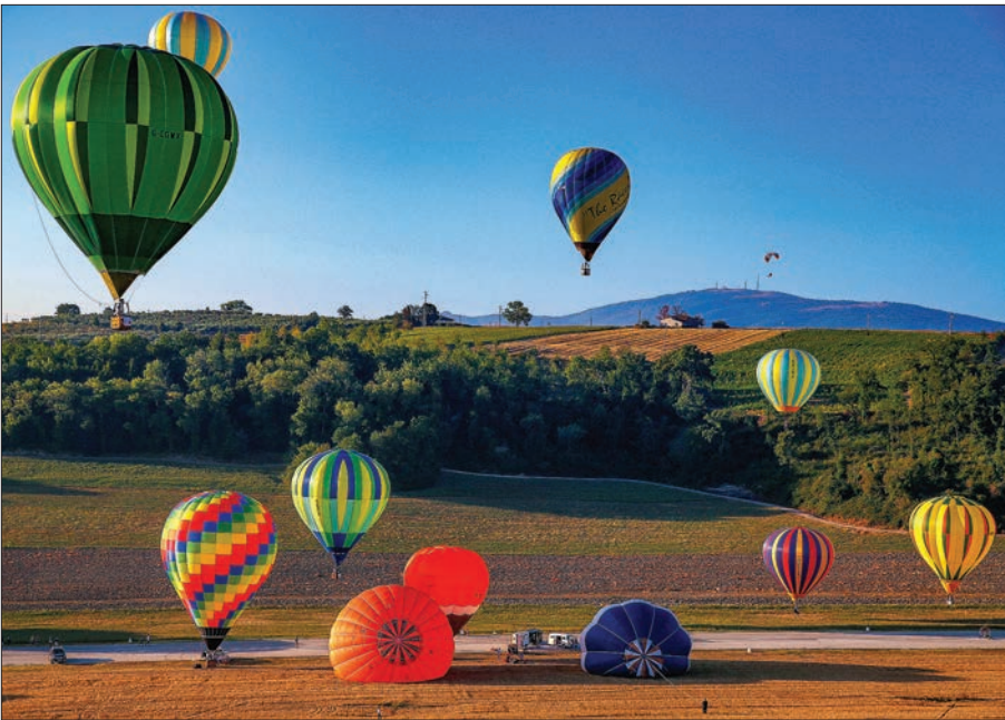
Hot air balloons fly during a hot air ballooning event in Todi, Italy, on 29 July 2017.

as the top of the trees or as high as the clouds and you have no idea where you are going to land," said balloonist Andrew Laing from Scotland. "It's a magical mystery tour." —Reuters ■