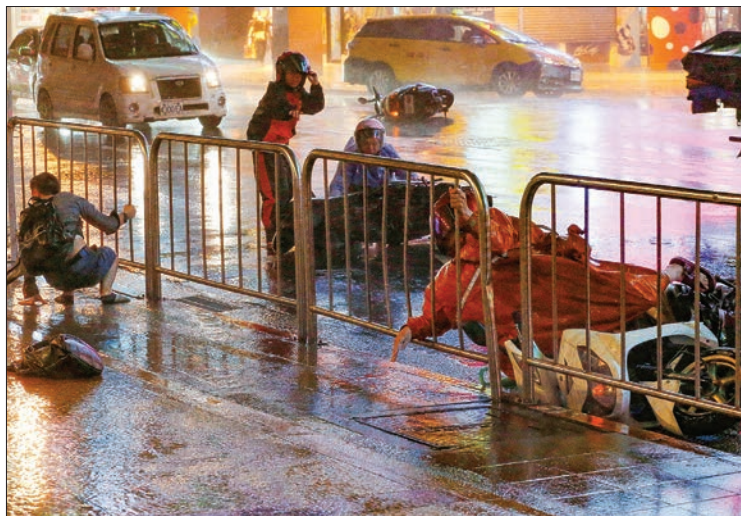
A man and motorcyclist fall as Typhoon Nesat hits Taipei, Taiwan on 29 July 2017.

Critics say Duterte has turned a blind eye to thousands of deaths during police operations that bear all the hallmarks of executions. — Reuters ■