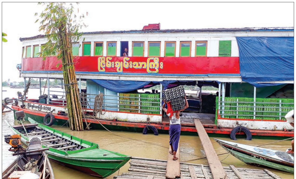
Double decker carrying duck eggs arrives at a Jetty in Yangon.

Pyapon duck egg seller U Myo Myint said that duck eggs are selling for an average of Ks110 each in Pyapon and Ks120 in Yangon.—Aung Win (Pyapon) ■