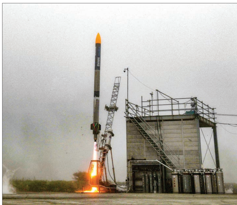
A rocket lifts off from a test site in Taiki in Japan's northernmost prefecture of Hokkaido on 30 July 2017.

"Now we are working on preparing areas for golf courses, to be built in the westernmost municipality of the island, with an investment considered as the most important in the tourism sector for the next several years," explained Barreto.—Xinhua ■