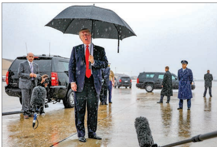
US President Donald Trump talks to reporters about the departure of his Chief of Staff Reince Priebus after arriving aboard Air Force One at Joint Base Andrews, Maryland, US, on 28 July, 2017.

Among some establishment Republicans, there were signs that patience with Trump was wearing thin.