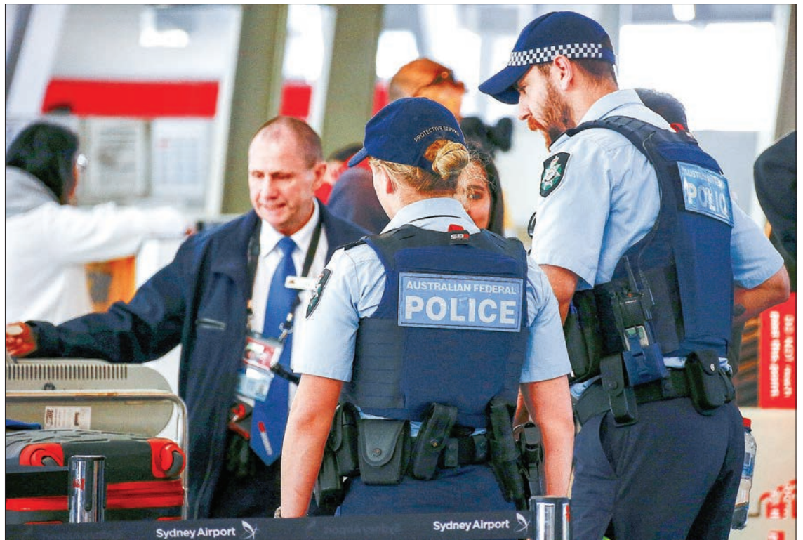
Australian Federal Police officers talk with passengers near the check-in counters at the Sydney Airport Domestic terminal in Australia, on 30 July 2017.

Turnbull said advice from Australian security and intelligence agencies had led to increased security measures at