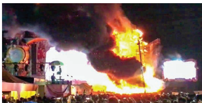
Smoke is seen rising from flames engulfing the stage after a fire broke out at Tomorrowland Unite Spain festival in Barcelona, Spain, on 29 July 2017, in this still image from a video obtained from social media.

MADRID — More than 22,000 people were evacuated from an electronic music festival in Barcelona on Saturday night after a huge fire broke out on one of the stages during a sequence of the show involving fireworks, emergency services said. They said no one was injured. Footage circulated on social media