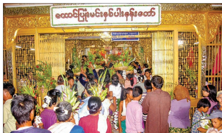
Taung Byone Festival will start only after H1N1 has been under control.