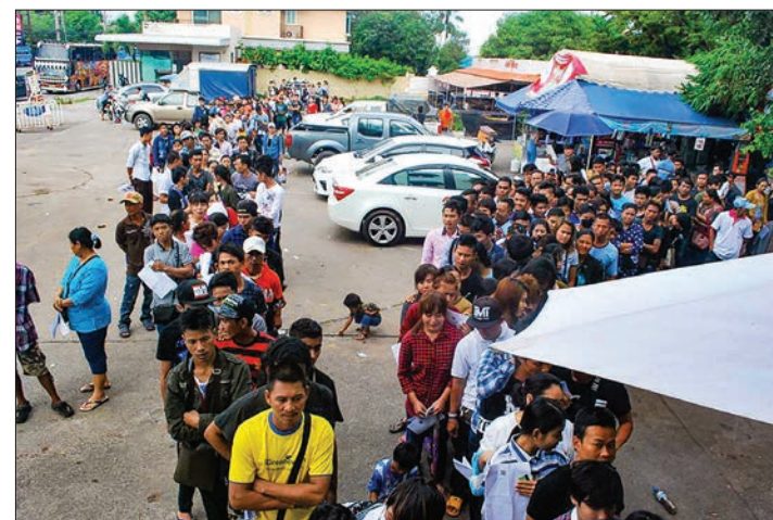
Myanmar migrant workers' waiting to get CI.

MYANMAR'S Embassy in Thailand issued an announcement that more centers to provide identify papers will be established to facilitate Myanmar migrant workers' residency in Thailand.