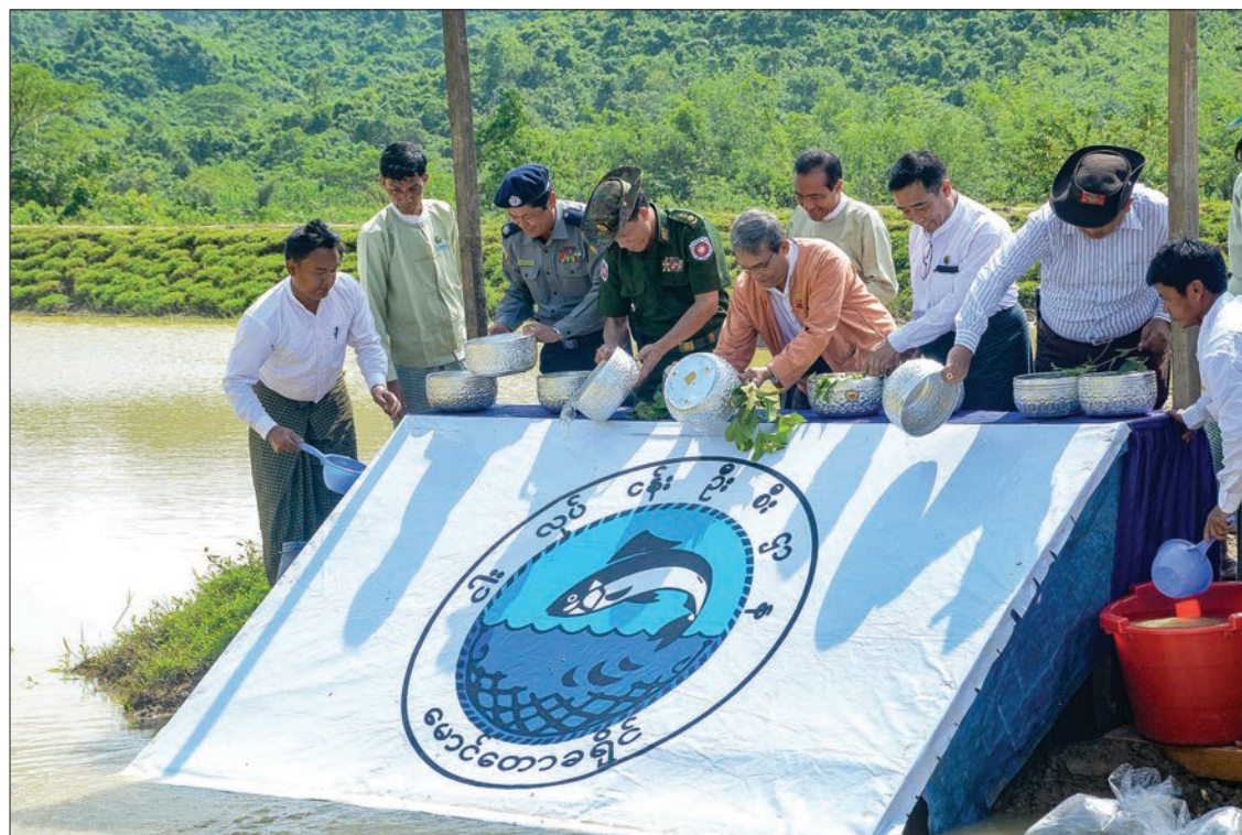
Chief Minister U Nyi Pu releasing fingerlings into a breeding pond.

CHIEF Minister of Rakhine State U Nyi Pu and his cabinet members inspected development undertakings in Maungtaw Township in the state yesterday, visiting a fish hatchery at Myothugyi village in the morning.