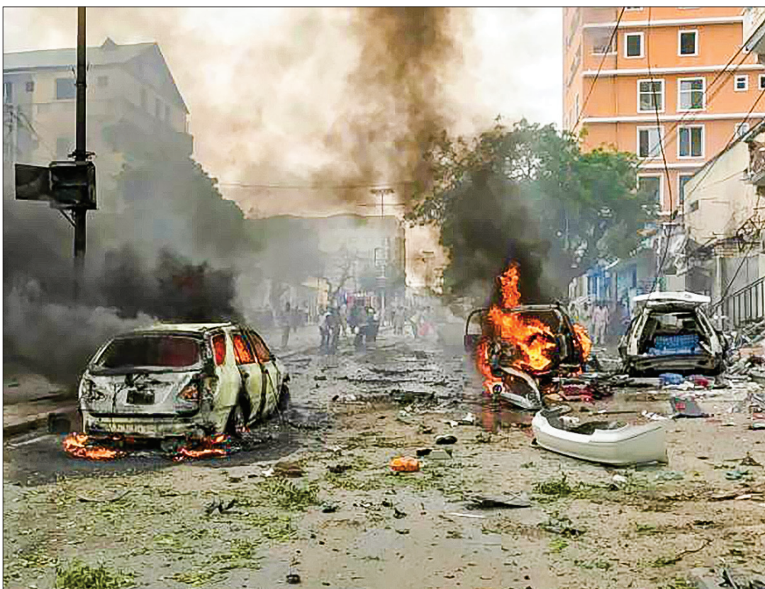
Vehicles burn at the scene of an explosion in Mogadishu, Somalia, on 30 July 2017.

A Reuters reporter near Ruto's compound said he saw several police vehicles going in and out of the compound, as well as one armoured vehicle in the compound. The reporter said he also saw one armoured vehicle in the compound.—Reuters ■