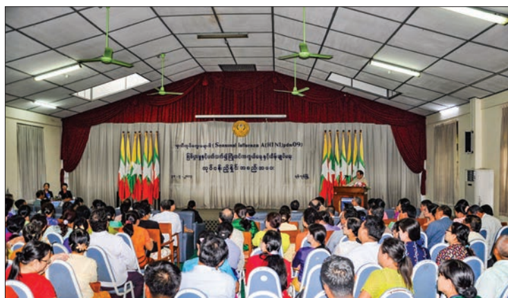
Meeting on effective preventive and control measures in progress.

In the evening, the minister looked into the requirements in admitting, examining and treat-