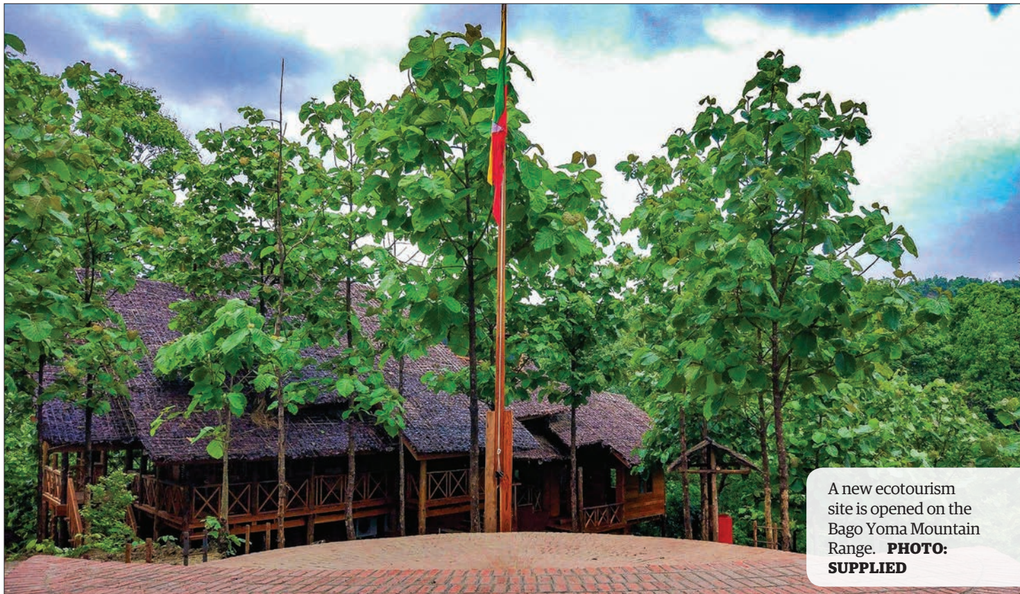
A new ecotourism site is opened on the Bago Yoma Mountain Range.