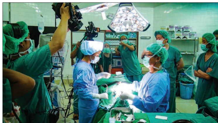
Specialists performing surgical operation.

The famous artists from Myanmar are coming and receiving surgery at JW surgical hospital, it is learnt from responsible personnel from Medical Institute of Seoul.—Maung Maung Win ■