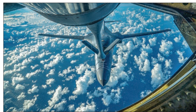
One of two US Air Force B-1B Lancer bombers receives fuel from a KC-135 Stratotanker while flying a 10-hour mission from Andersen Air Force Base, Guam, into Japanese airspace and over the Korean Peninsula, on 30 July 2017.

with North Korea, just talk. We will no longer allow this to continue. China could easily solve this problem!" he said in a subsequent tweet. The Hwasong-14, named after the Korean word for Mars, reached an altitude of 3,724.9 km (2,314.6 miles) and flew 998 km (620 miles) for 47 minutes and 12 seconds before landing in the waters off the Korean peninsula's east coast, KCNA said.