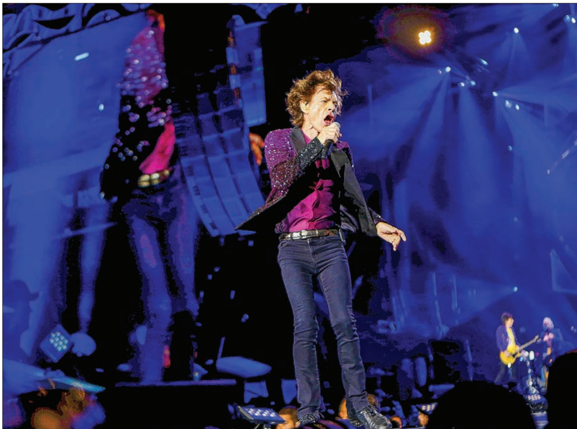
British veteran rockers The Rolling Stones singer Mick Jagger opens their North American "Zip Code" tour in San Diego, California in 2015.

LONDON — Rolling Stones frontman Mick Jagger has released two politically charged songs targeting what he sees as the uncertainty and surrealism permeating politics in the age of Brexit and Donald Trump.