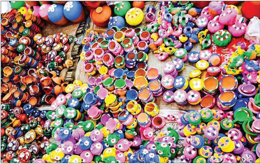
Traditional earthen pot toys are displayed in shop at the festival.