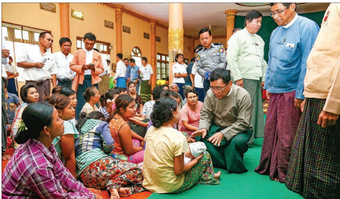
Dr Win Myat Aye, Union Minister for Social Welfare, Relief and Resettlement meets local people.

Dr Win Myat Aye, Union Minister addressed, “Under the leadership of National Natural Disaster Management Committee, 12 working committees consisting of related ministries and natural disaster management committees at regions, states, districts and township levels had been found to have been working in combining with each other, more than ever. Due to preparatory tasks of making irrigation channels, ditches, embankments, building multi-purpose shelters for disasters, digging up sand-silted creeks and rehearsing for preparedness, this year impacts of natural disasters were found to have alleviated more than previous years. Rescue works were carried out promptly as soon as floods had broken out, through the co-operative efforts of natural disaster management committees at different levels under the Ministry of Social Welfare, Relief and