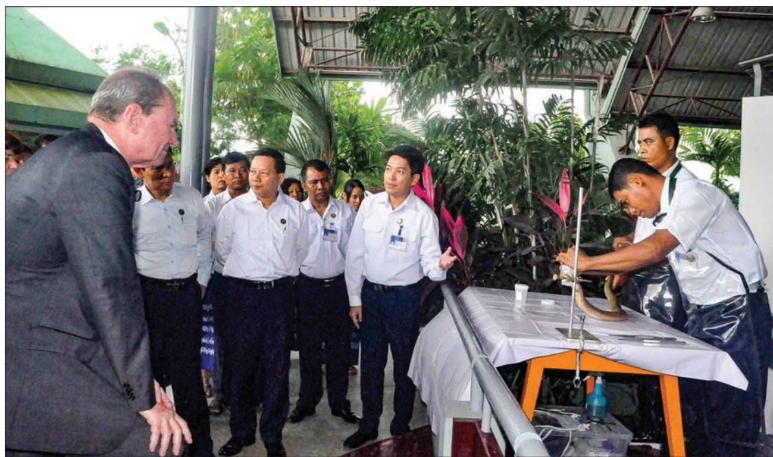
Australian Minister Mr. Martin Hamilton Smith and Union Minister U Khin Maung Cho visit BPI Pharmaceutical Industry factory.