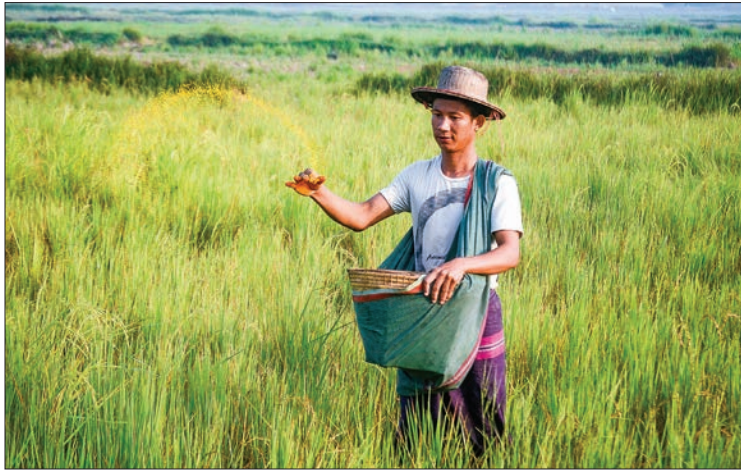
A farmer scatters the fertilizer in a paddy field.