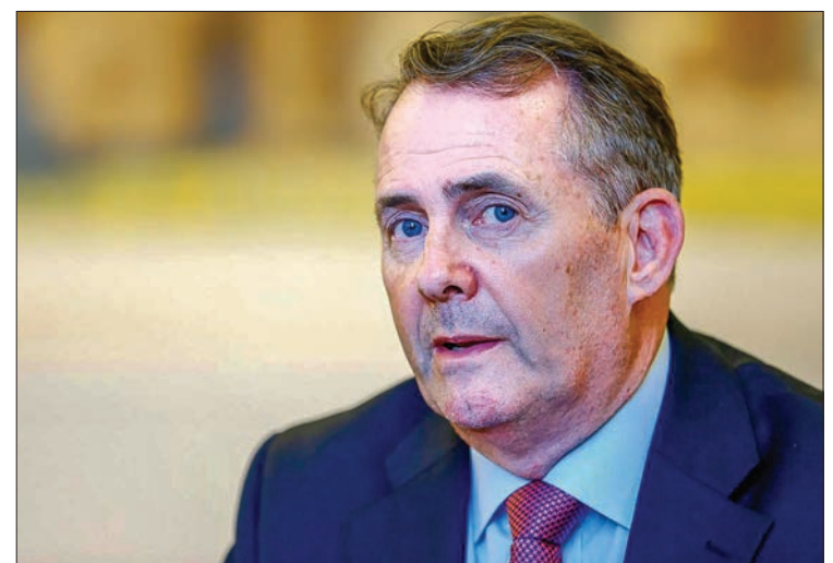
Britain's International Trade Secretary Liam Fox speaks during an interview with Reuters at the World Trade Organization (WTO) in Geneva, Switzerland, on 20 July 2017.

Fox had previously said he backed a transition agreement