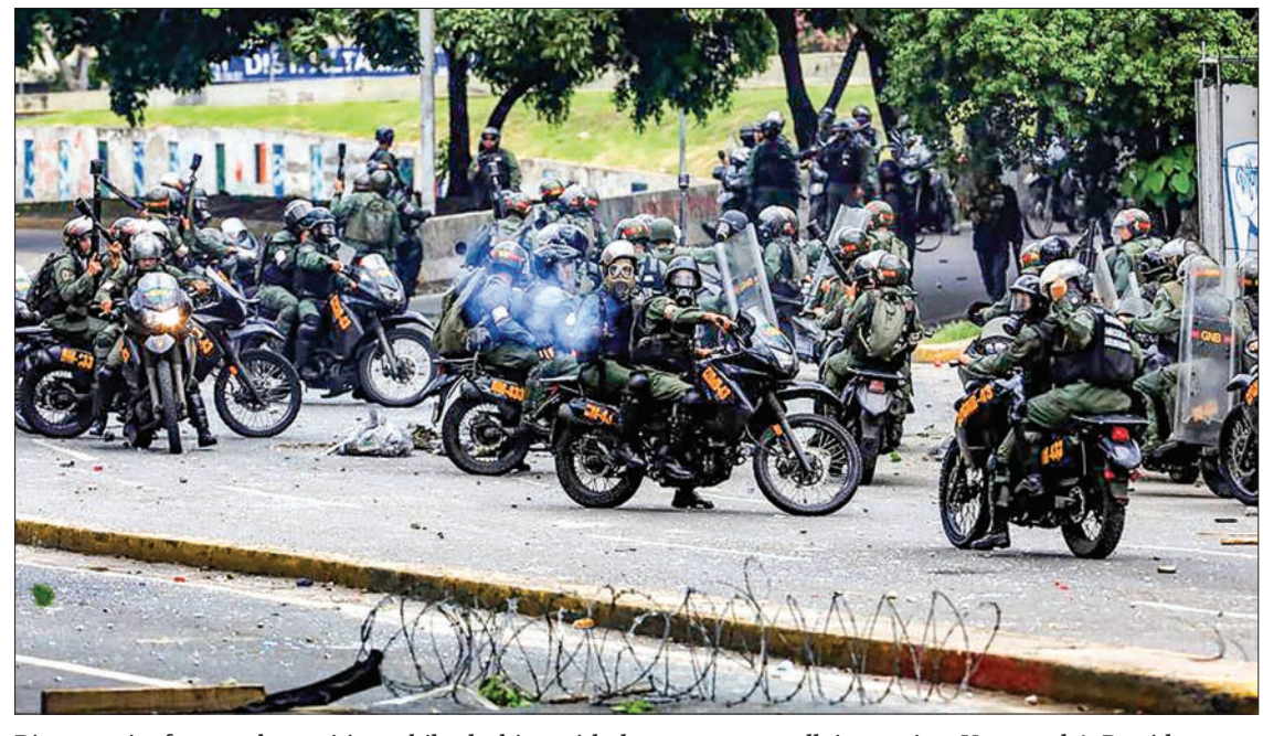
Riot security forces take position while clashing with demonstrators rallying against Venezuela's President Nicolas Maduro's government in Caracas, Venezuela, on 22 July 2017.

"The Venezuelan people are not giving up, they are valiant, they will come out to defend democracy and the constitution," opposition lawmaker Simon Calzadilla said at a news con-