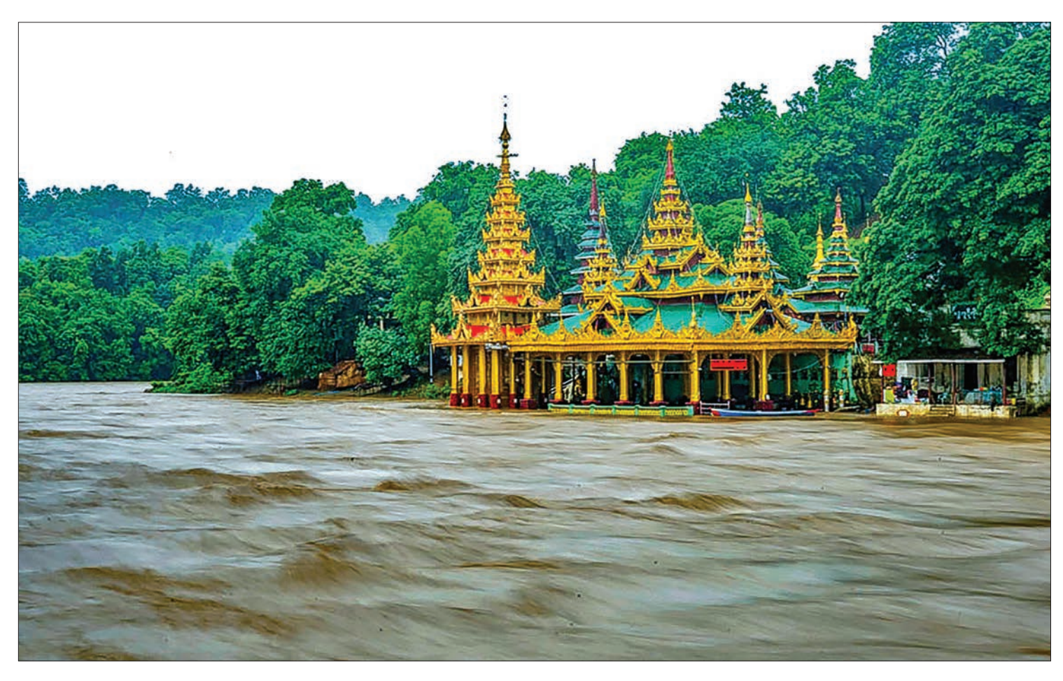
Photo shows the swelling Mann Creek and Auk Settawya.