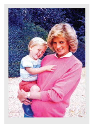
Britain's Prince William, the Duke of Cambridge, and the late Diana, Princess of Wales are seen in an undated photo released by Kensington Palace on 23 July 2017.

The film, made by Oxford Film and Television, will air in the