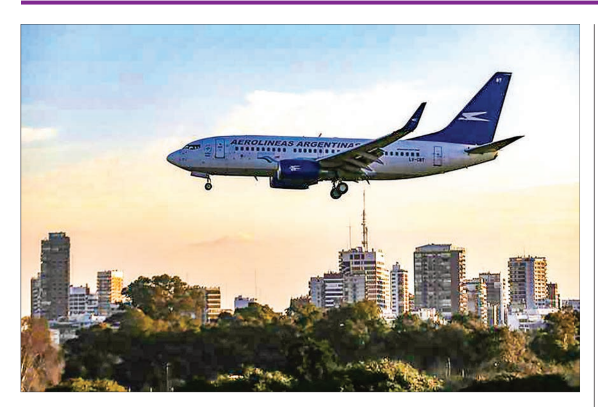
A Boeing 737-700 aircraft belonging to state-run Aerolineas Argentinas lands at Buenos Aires' domestic airport, in 2014.

WORLD 24 JULY 2017 THE GLOBAL NEW LIGHT OF MYANMAR