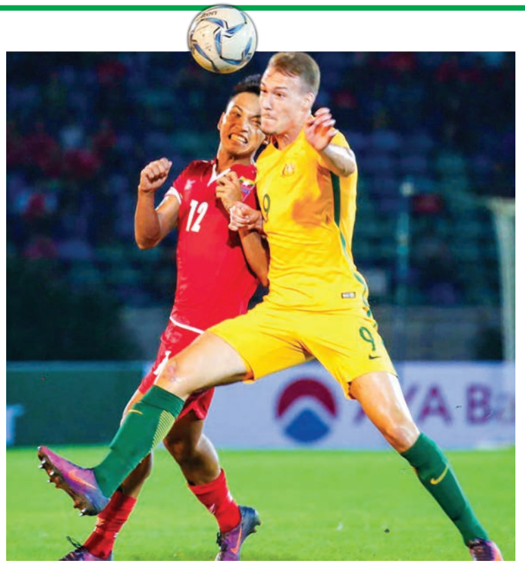
Myanmar player and Australian player vying for the ball.

At 30 minutes corner kick was given to Australia after Myanmar goal keeper made a