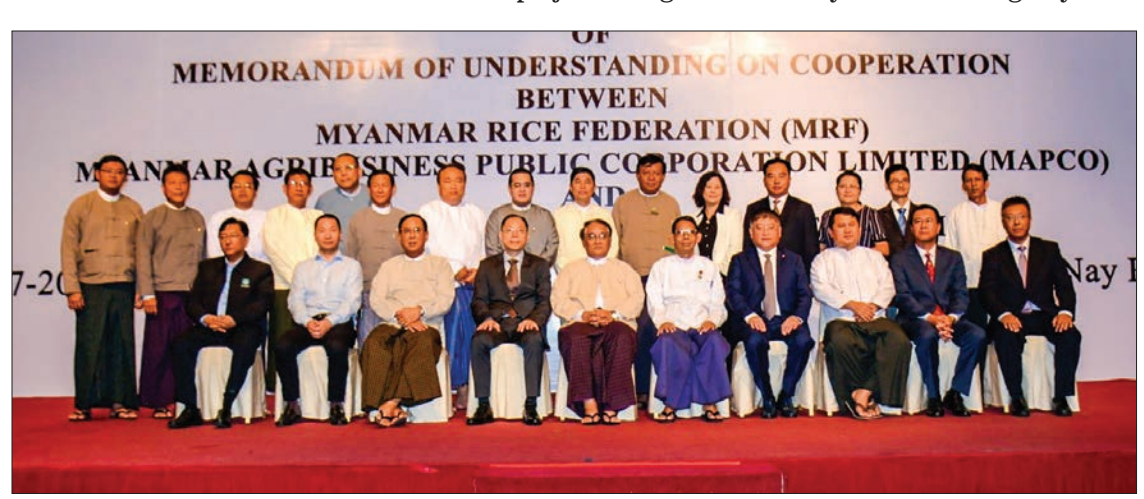
Signing ceremony in progress.

increase in per acre production rate, to support the increase in individual income of the farmers, to mitigate production cost, to acquire the good price, to increase internal and external investment in rice production, milling and trading, to enhance the quality of rice, to conserve the natural environment and to ensure the consumers' safety, it was learnt. —Myanmar News Agency ■