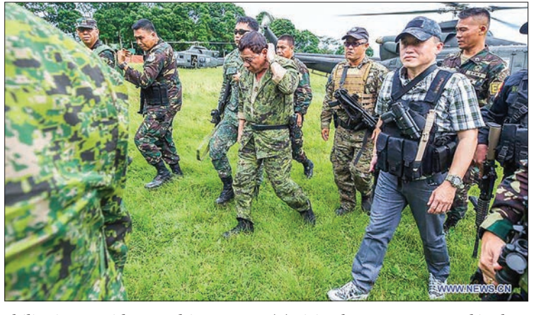
Philippine President Rodrigo Duterte(C) visits the troops engaged in the battle with the Maute group in Marawi City, the Philippines, on 20 July 2017.

He said security forces are determined to defeat terrorism within the next five months when martial law is enforced in the