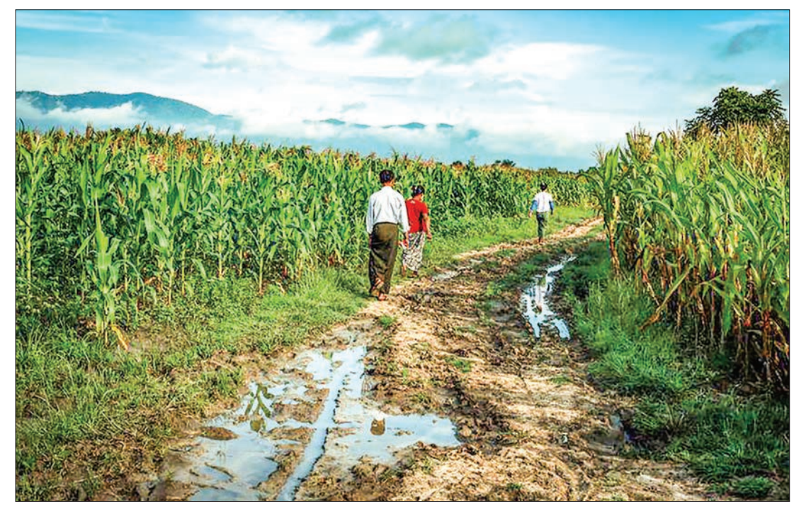
Farmers walk in their farm outside Yebu village in Shwenyaung township, Shan State, Myanmar in this still image taken from a August 25, 2016 video.

Due to limitation of space we are only able to publish "Letter to the Editor" that do not exceed 500 words. Should you submit a text longer than 500 words please be aware that your letter will be edited.