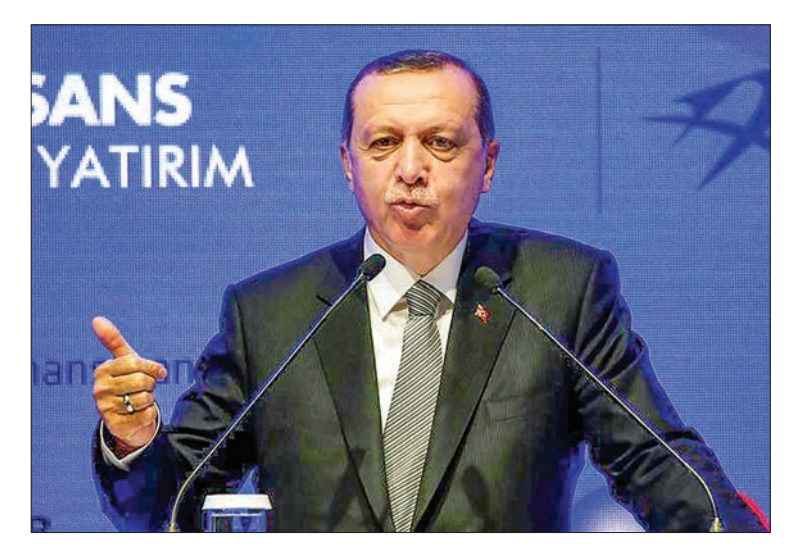
Turkish President Tayyip Erdogan speaks during a ceremony in Istanbul, Turkey, on 21 July 2017.

Qatar, while not a major trade partner for Turkey, holds strategic importance not least because of the military base es-