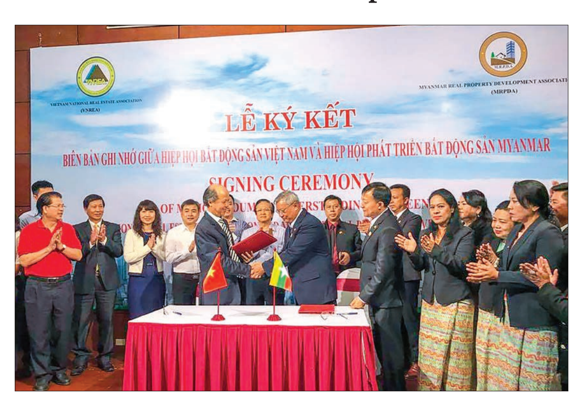
Signing ceremony in progress.

REAL estate organizations in Myanmar and Viet Nam signed a memorandum of understanding on 18 July in Hanoi with the hope of improving property development sectors in both nations.