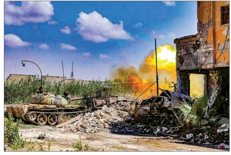
A tank belonging to Libyan National Army fires towards Islamist militants during clashes in the militants' last stronghold in Benghazi.

Two weeks ago, Haftar declared Benghazi's "liberation" in a televised speech after three