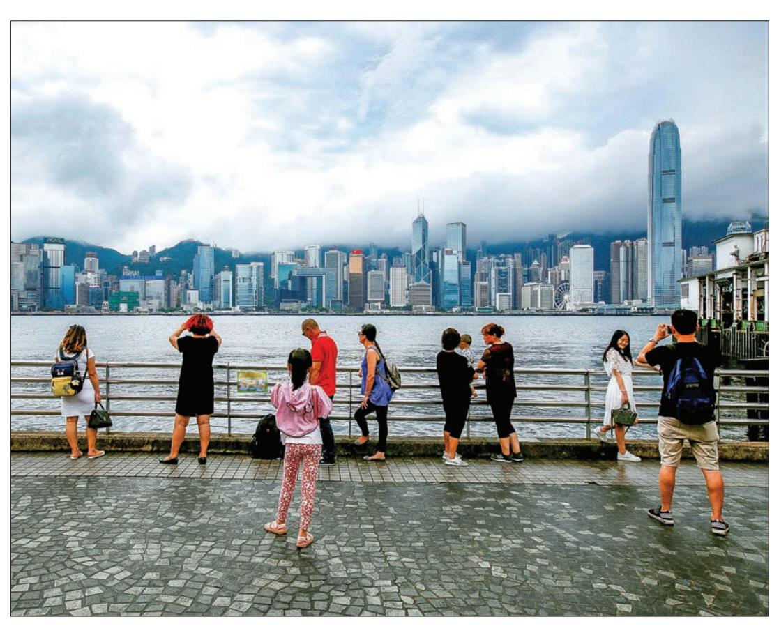
People gather at a waterfront as Typhoon Roke approaches Hong Kong, China, on 23 July 2017.

Local media reported many people who were evacuated across eastern parts of the south island were returning home on Sunday, however some may have to stay away for days to come due to flooding. The meteorological service said some areas had received more than triple the monthly average rainfall in two days. The heaviest recorded fall was 266 millimetres (10.5 inches) north of Dunedin over a 48-hour period.—Reuters ■