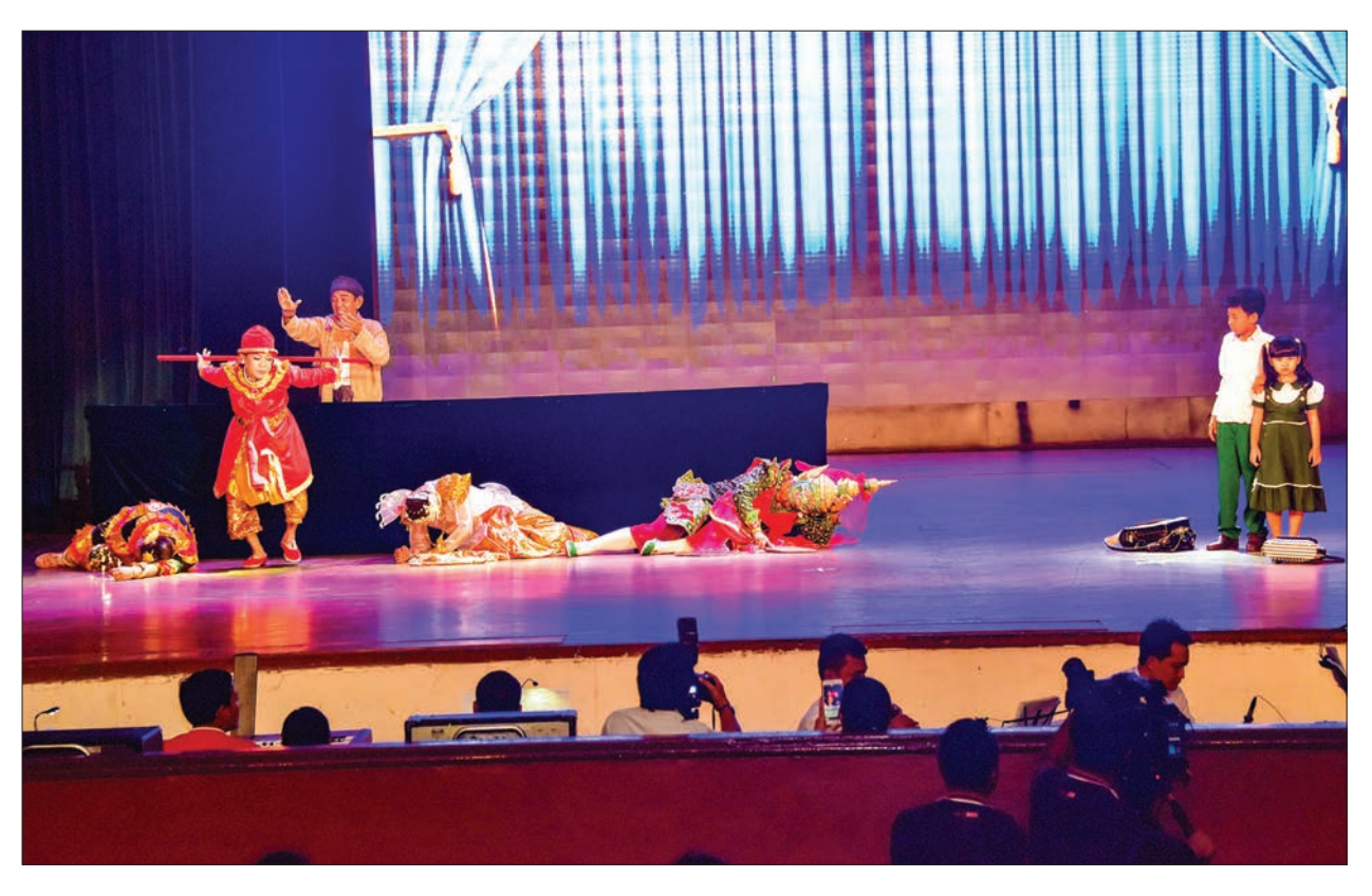
Comedians performing entertainment program to raise funds for their aged counterparts.