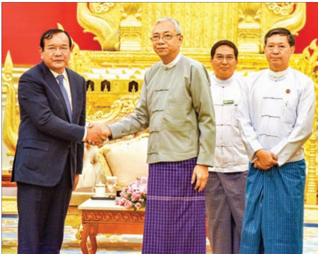
President U Htin Kyaw shakes hands with Mr. Prak Sokhonn, Minister for Foreign Affairs and International Cooperation of the Kingdom of Cambodia yesterday in Nay Pyi Taw.

During the meeting, matters relating to the restoration of Mon-Khmer culture, increasing bilateral cooperation in the travel sector and increasing the export of agriculture produce to Cambodia were discussed.—Myanmar News Agency ■