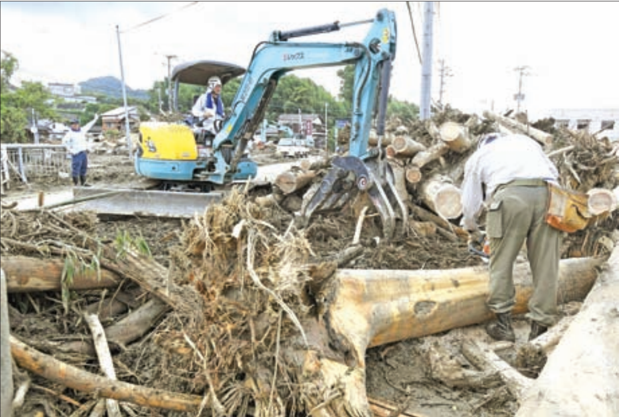
People remove driftwood from a residential area on 11 July, 2017, in the city of Asakura, Fukuoka Prefecture, following torrential rain in the southwestern Japan.

isterial meeting after his return. "About 12,000 personnel from the SDF, police, fire service and coast guard are still engaged in search and rescue efforts...I want them to continue their thorough search operations, keeping in mind those who are praying for their loved ones' safety," he said.—Kyodo News ■