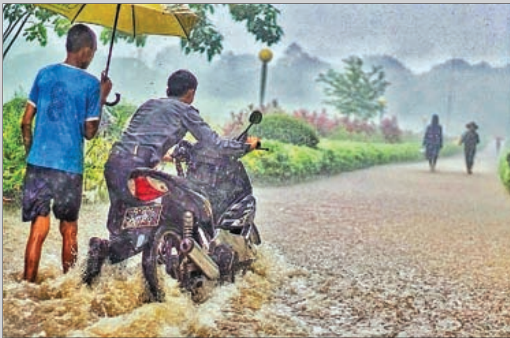
A Yangon policeman moves his stalled motorcycle off of Bagayar Street near Padonmar Park in Mayaynigone. A heavy rainstorm yesterday afternoon flooded many of Yangon's streets, stalled vehicles and overflowed storm drains. More rain is predicted for today.

Due to limitation of space we are only able to publish "Letter to the Editor" that do not exceed 500 words. Should you submit a text longer than 500 words please be aware that your letter will be edited.