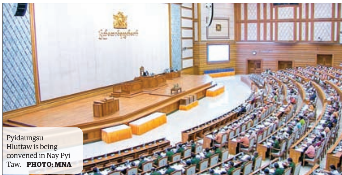
Pyidaungsu Hluttaw is being convened in Nay Pyi Taw.