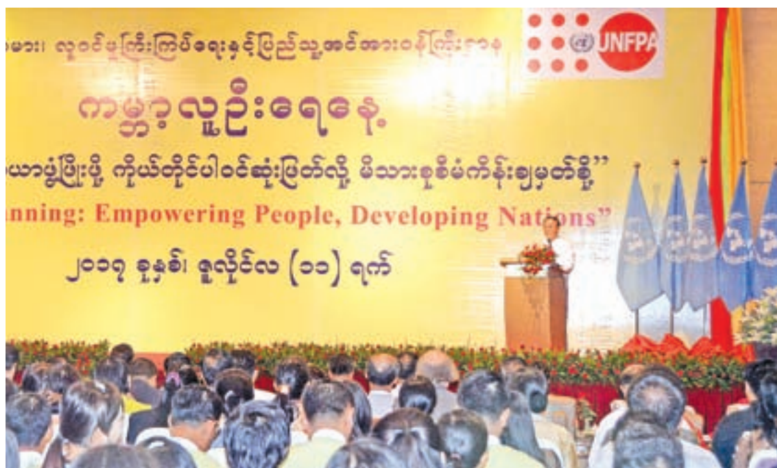
Vice President U Myint Swe delivers the opening speech at World Population Day ceremony.

Today, over half of married women (52 per cent) in Myanmar practice family planning. But one in six women (16 per cent) have an unmet need for contraceptives. This means that although they would like to, they cannot access modern methods of contraception. This leads to unintended pregnancies, unsafe abortions, and maternal and infant death, and it limits women in their work and career choices.