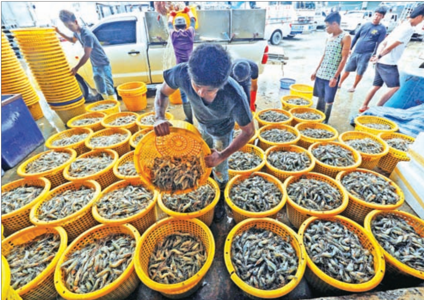
Myanmar migrant workers sort shrimp at a wholesale market in Mahachai, Samut Sakhon province, Thailand, on 4 July 2017.