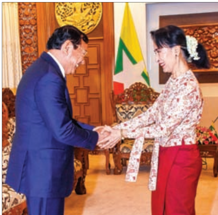
State Counsellor Daw Aung San Suu Kyi, right, welcomes Mr. Prak Sokhonn, Minister for Foreign Affairs and International Cooperation of the Kingdom of Cambodia in Nay Pyi Taw.

(Excerpt from Bogyoke Aung San's speech broadcast on radio on 5 th April 1947)