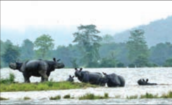
One-horned rhinos take shelter on higher ground at flooded Kaziranga national park in northeastern Indian state of Assam, on 11 July, 2017.

BANGKOK — Thai Prime Minister Prayut Chan-ocha said on Tuesday his government has approved the start of construction of a $5 billion high-speed train project, to be developed by China. Speaking at press conference, Prayut said construction of the rail link between Bangkok to the northeastern province of Nakhon Ratchasima, a distance of more than 250 kilometres, will start later this year and is scheduled for completion in 2021. It will cost an estimated 179 billion baht (around $5.1 billion). The government hopes to eventually extend the high-speed railway by some 350 km to Nong Khai Province, opposite Laos, in the hope of boosting cross-border trade volume and turning