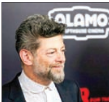
Actor Andy Serkis is seen on the red carpet at a screening of 'War for the Planet of the Apes' in Manhattan, New York, US on 10 July, 2017.

Matt Reeves, director of the second and third films in the current trilogy, called his five years of immersion in the tale a "great journey", adding, "It's very bittersweet because now this chapter is over."