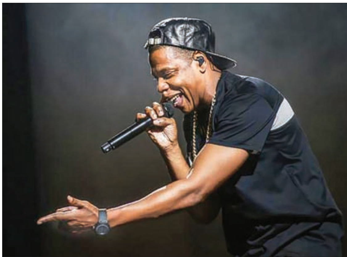
American rapper Jay-Z performs at Bercy stadium in Paris on 17 October, 2013.

Just six days after "4:44" was released, the Recording Industry Association of America certified the album as platinum,