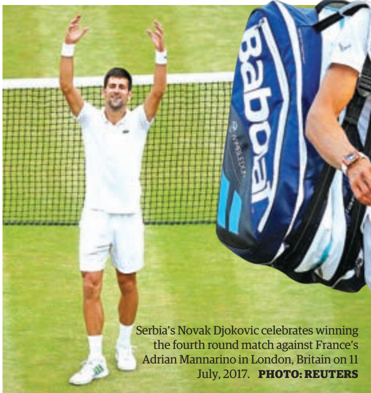
Serbia's Novak Djokovic celebrates winning the fourth round match against France's Adrian Mannarino in London, Britain on 11 July, 2017.

Light rain led officials to close the roof over Centre Court. Djokovic, who will face Czech Tomas Berdych in the last eight, received treatment to his shoulder during a medical time-out late in the third set.—Reuters ■