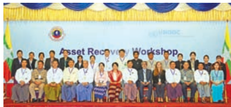
Participants of the Asset Recovery Workshop in Nay Pyi Taw pose for a documentary photo.

Mr Shervin Majlessi and those present at the meeting discussed at length topics re-