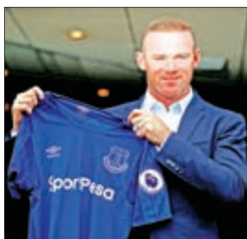
Everton's Wayne Rooney poses with the club shirt after the press conference on 10 July, 2017.

The 31-year-old is hopeful of a different scenario after re-joining his boyhood club after 13