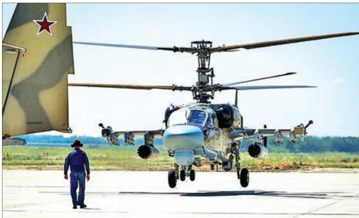
Ka-52 Alligator attack helicopter.

This innovation will make it possible to keep this helicopter at hangars, which gives the Alligator's land version a fundamental advantage, the press office said.