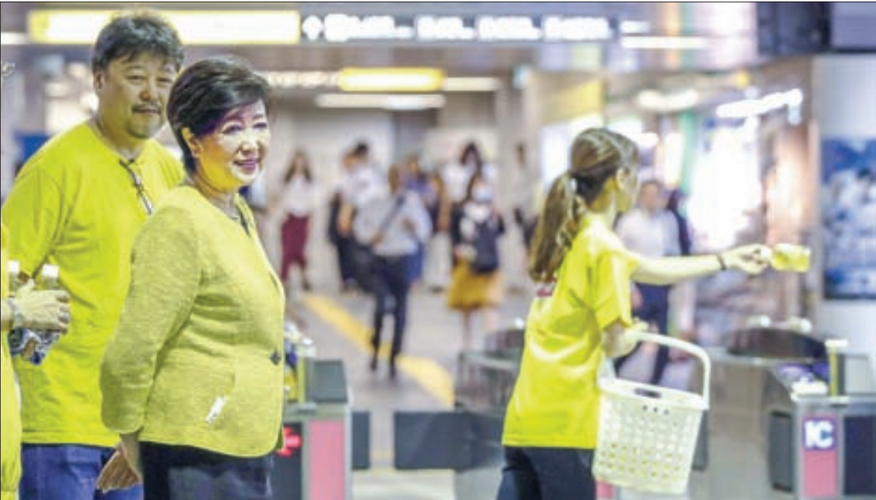
Tokyo Governor Yuriko Koike watches efforts to ease overcrowding on trains during morning rush hour by encouraging staggered commuting, at a train station on 11 July, 2017.

TOKYO — Tokyo on Tuesday launched a campaign to ease overcrowding on trains during morning rush hour by encouraging staggered commuting. To boost the two-week campaign, which involves a total of about 260 companies and municipalities, extra trains will run early in the morning while commuters avoiding the rush hour have a chance to earn gifts. Called Jisa Biz, or staggered work shifts, and led by Tokyo Governor Yuriko Koike, the campaign is aimed at alleviating train congestion in the city in the run-up to the 2020 Tokyo Olympics and Paralympics. Koike promised to mitigate train congestion when she first ran for governor last summer. The Tokyo government plans to make it a yearly campaign.