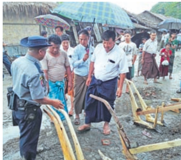
Officials inspect ploughs on sale at the Kyein Chaung Village.

Responsible officials gave words for making the market clean and for sellers to sell their