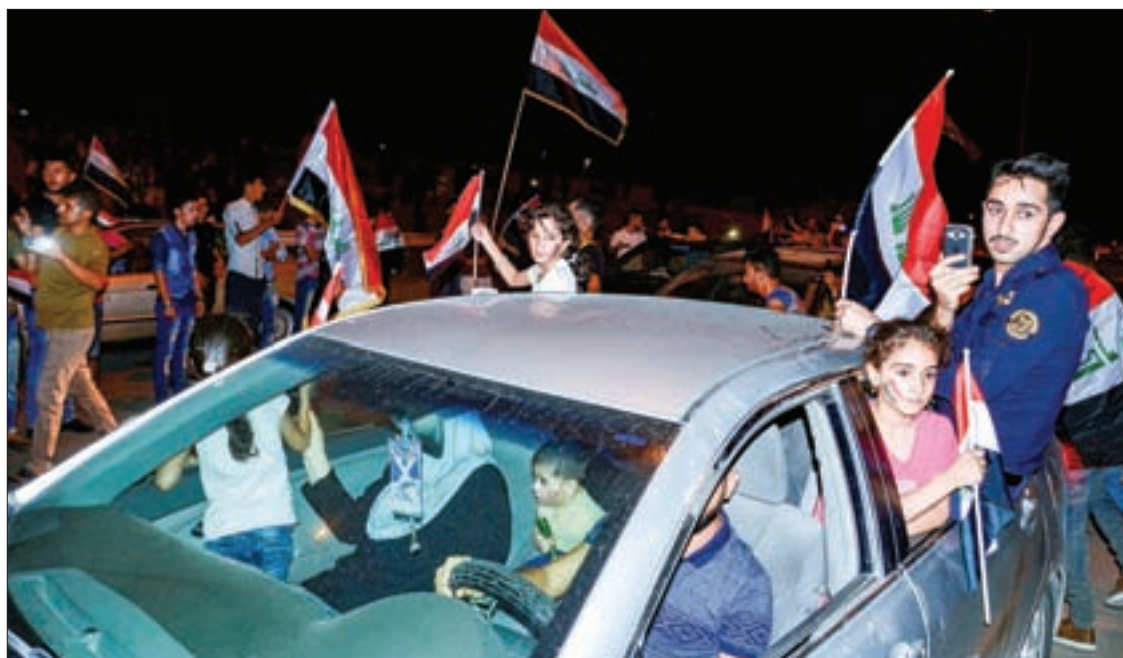
Iraqis celebrate as Prime Minister Haider al-Abadi announces victory over Islamic State in Mosul, Iraq on 10 July, 2017.

Islamic State named the training camp it established in the town after Osama bin Laden, the founder of the al-Qaeda militant group killed by US forces in 2011. —Reuters ■