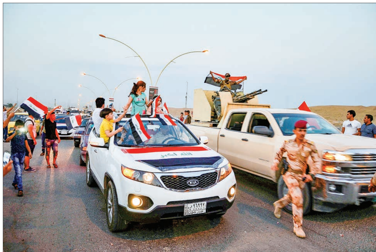
Iraqi people celebrate the liberation of the embattled city of Mosul, in Mosul, Iraq on 9 July, 2017.

Islamic State is also under heavy pressure in its operational headquarters in the Syrian city of Raqqa and its self-proclaimed caliphate that once straddled the two countries is crumbling. But the militants are expected to keep plotting