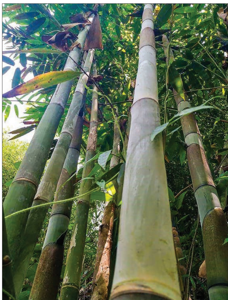
Bamboo plantation.

"The only tree that can rapidly afforest an area is