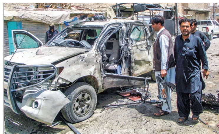
Police and security personnel stand next to a damaged police vehicle after a blast in Chaman, Pakistan on 10 July, 2017.

a suicide bomber belonging to the Taliban Special Group. "Many people were killed in the attack. Our attacks will continue until the enforcement of Islamic shariah (law) in Pakistan," the spokesman said. A separatist campaign has been raging for years in Baluchistan. The separatists accuse the Punjab-led Pakistani establishment of plundering the province's natural resources including oil and gas. —Kyodo News ■