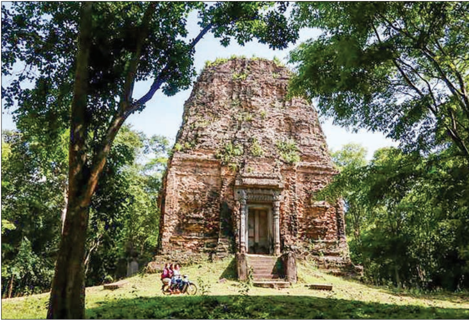
Sambor Prei Kuk temple, an archaeological site of Ancient Ishanapura, is seen in Kampong Thom province, Cambodia on 20 May, 2017.

Cambodia rose 5 per cent to five million last year. About 5.5 million tourists