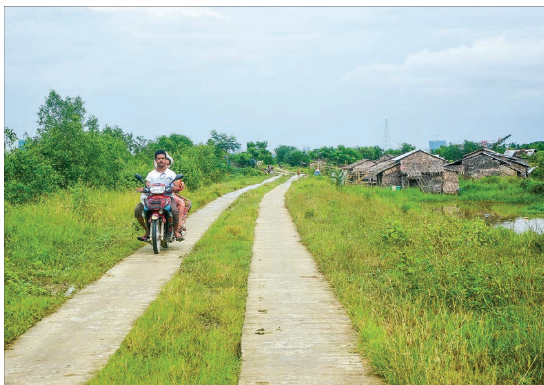
A motorcyclist drives past the area which includes in the area for Yangon New City Project.

Yangon's population density was 310 people per sq.km in 1973, 387 people per sq.km in 1983 and was 716 people per