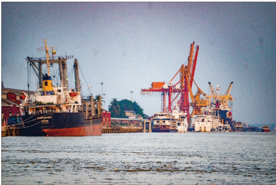
Ships are mooring along the Yangon River in Yangon.

Due to limitation of space we are only able to publish "Letter to the Editor" that do not exceed 500 words. Should you submit a text longer than 500 words please be aware that your letter will be edited.