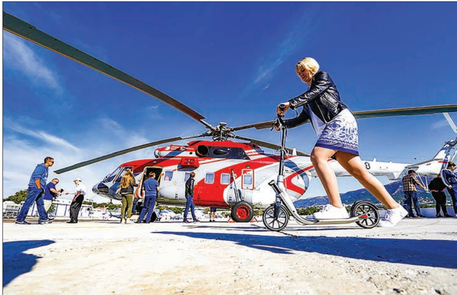
Mi-8AMT helicopter.

"Equipment from all the company's manufacturers will be presented [at the show]. We've got two versions of the helicopter produced by Ulan-Ude Aviation Plant: the multi-purpose Mi-8AMT (which can perform medical evacuation and transportation of cargo and personnel) and a VIP [version]," he said.