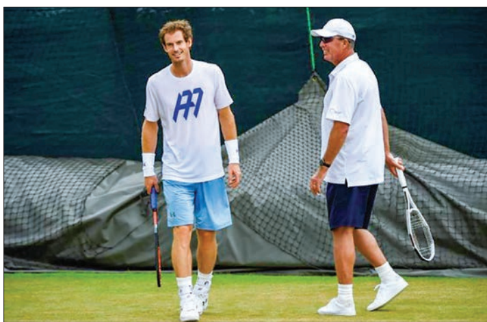
Great Britain's Andy Murray with coach Ivan Lendl during a practice session in London, Britain on 9 July, 2017.

"When you play, sometimes you feel tired and you have to push through that pain barrier