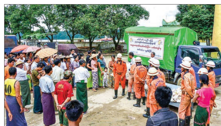
Volunteers deliver food to flood victims at Thathana Waiponla Monastery in Hmanpin Village, Homalin Township.

The philanthropic organization also delivered lunch and dinner boxes to 960 flood victims in three wards in Khamti on 7th July. According to the 10.30 hr