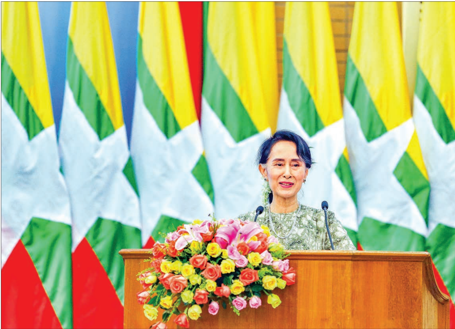
State Counsellor Daw Aung San Suu Kyi delivers an opening address at the launch of four-year Civil Service Reform Strategic Action Plan.