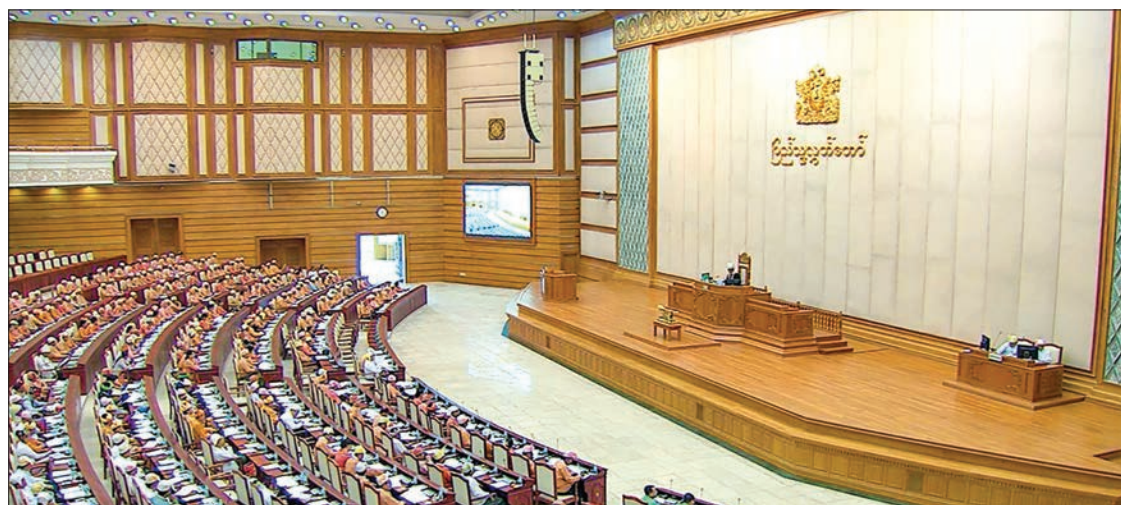
Pyithu Hluttaw is being convened in Nay Pyi Taw.

Arrangements will be made to use these channels by linking with Myanmar Condo SAT 1, co-hired together with