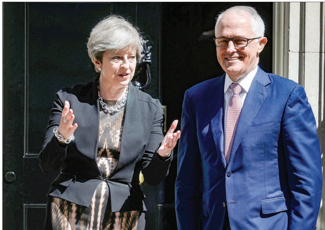
Britain's Prime Minister Theresa May meets Australia's Prime Minister Malcolm Turnbull at Downing Street, in London, Britain on 10 July, 2017.

May also told the news conference that she wanted “the broadest possible consensus” for Brexit to make sure the deal she negotiates with the EU is the right one for Britain. —Reuters ■