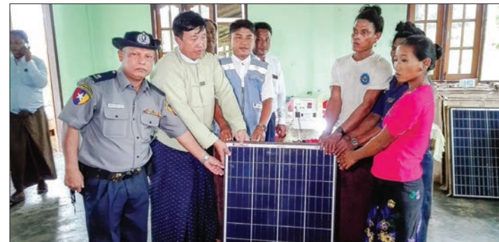
Authorities hand over the solar panel to villagers at Trane Village in Maungtaw Township.

The event was attended by Maungtaw Township chief administrator, township police head, officials from township land record department and township planning department and local people. Security is very important for this area and for the local