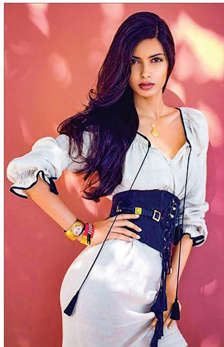
Actress Diana Pentty. PHOTO: PTI

Paramount’s “Transformers: The Last Knight” finished fifth with an estimated 6.3 million US dollars in its third weekend.—Xinhua ■