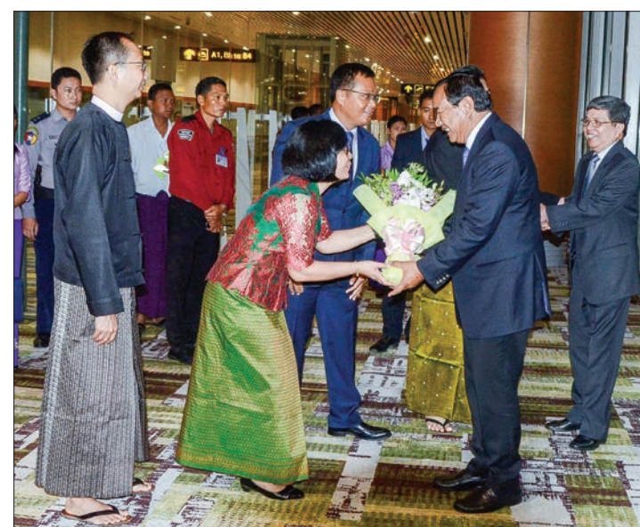
Cambodian Minister for Foreign Affairs and International Cooperation is welcomed at Nay Pyi Taw International Airport.

areas need to be identified and researches conducted so that programmes to benefit people can be effectively performed. The ministry can draw up required laws and programmes through solid results and findings of researches and provide effective services. He also invited Ethical Review Board members to provide suggestions and discussions for the ministry to conduct its work effectively. —Myanmar News Agency ■