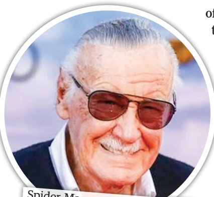
Spider-Man co-creator Stan Lee.

as the new Spider-Man, the film was directed by Jon Watts and costed 175 million US dollars to produce.