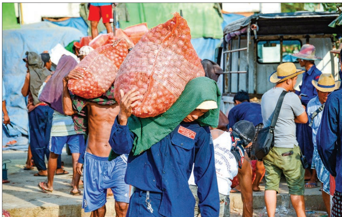
Labourers carrying sacks of onions on their shoulders.