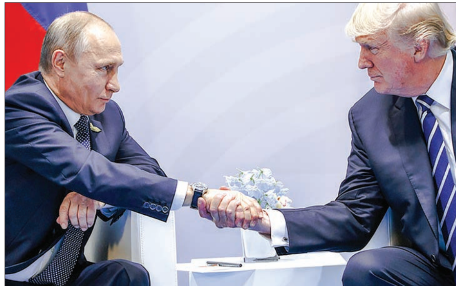
Russian President Putin and US President Donald Trump.

"No one promised anything to one another, and there was no such a goal. The positive outcome is that the readiness to work in this direction was stated (at Putin's meeting with