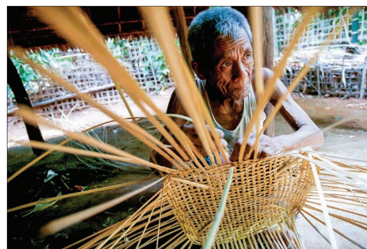
A man makes a basket with bamboo at a village at Made island outside Kyaukpyu, on 17 May 2017.

most profitable for growers if it is grown and used in commercial sense. Now it is the time for bamboo lovers and those who want to grow bamboos to get