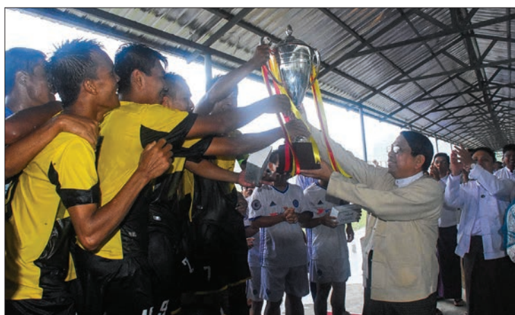
Union Minister for Information Dr Pe Myint presents the trophy to the News and Periodicals Enterprise team.