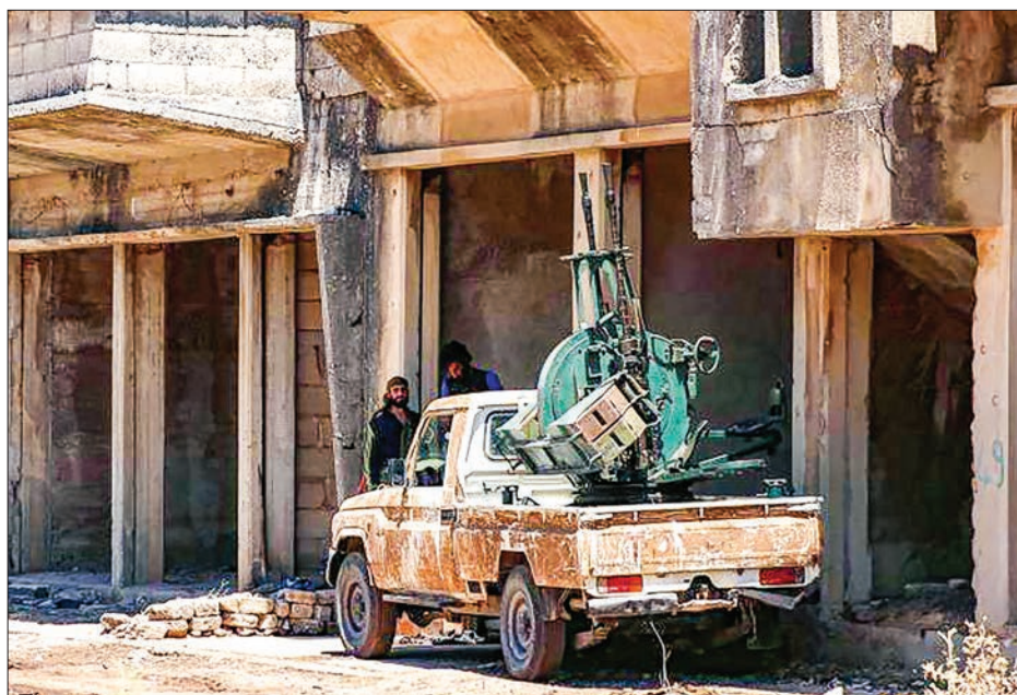
Free Syrian Army fighter stand near an anti-air craft machine gun in Quneitra, Syria, on 8 July 2017.

have crumbled since the onset of the conflict and it was not clear how much