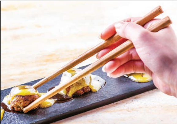
Undated supplied photo taken in Kumamoto, Japan, shows "edible chopsticks" with the flavor of rush grass, developed by a group promoting the wider use of "tatami." The group, the Kumamoto IGSA and TATAMI Conference, plans to begin selling the product in July 2017 over the internet.

rush grass produced in the prefecture" in southwestern Japan, said an official at the conference in charge of the product. Each baked confectionery chopstick, made by Marushige Inc. based in Hekinan, Aichi Prefecture, in central Japan, is 20 centimeters long and 1 cm thick, and tastes mildly sweet and bitter with a subtle favor of rush grass. After being mixed with rush grass powder, dough made from wheat and eggs is baked slowly at a low temperature, making its texture similar to hardtack. Even if soaked in a soup, it hardly becomes soft. — Kyodo News ■