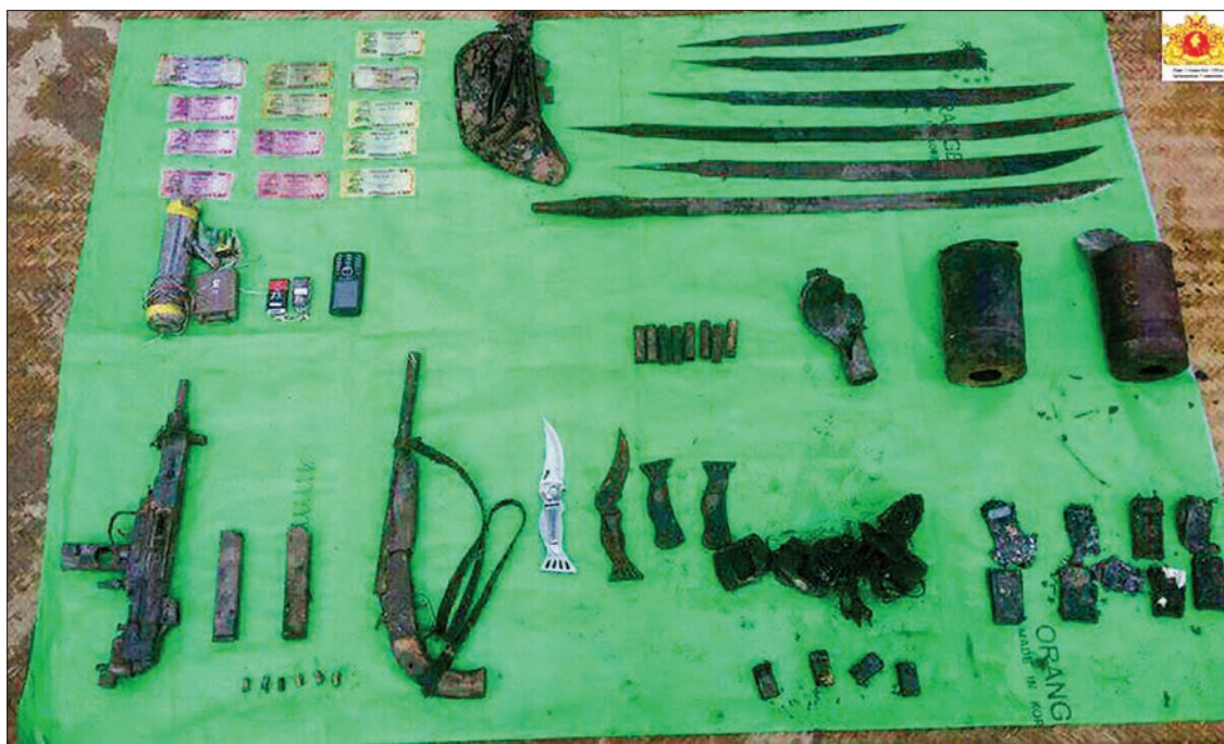
Various types of weapons and equipment seized from terrorists.

to clear the house three terrorists ran out of the house. They were shot by security forces and two dead bodies and Phwayaut Islam and Zarbe who interfered were caught. As the security forces cleared the house, burnt BA94- 1 no., 2 cartridge cases, BA94- blank bullet 6 no., hand-made gun- 1 no., remote mine- 1 no., things for IED were seized. Moreover, Bangladesh Tarca 1000 note- 1 no., and some other denominations, Symphony phone-1 no., and small other things were also found in his fanny bag. The seized BA-94 was known as the gun which had been brought by terrorists in the 2016, October 9 Kyikanpyin attack.—Myanmar News Agency ■