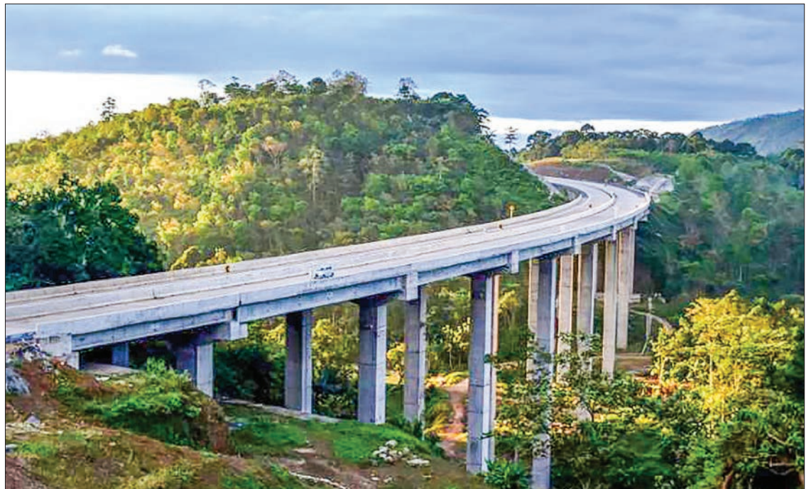
Cars pass through a new toll road Salatiga-Bawen section in Semarang, Central Java province, Indonesia on 15 June, 2017.

Indonesia's biggest toll road operator, PT Jasa Marga Tbk (JSMR.JK), has begun working to securitize about half of the 4 trillion rupiah ($298.4 million) in