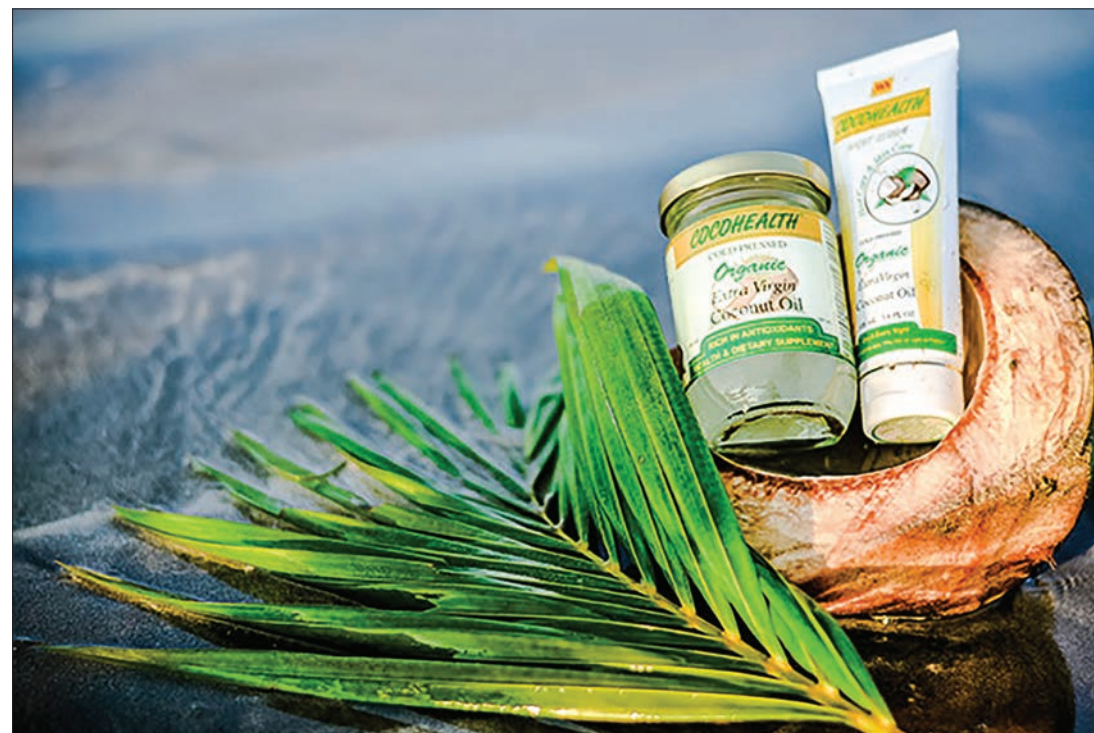
Tonic food and ointment produced from coconut .

Enthusiasts may dial 09 799700709, 09 420015507 and 01 218367 of the group to confirm their participation.—GNLM ■