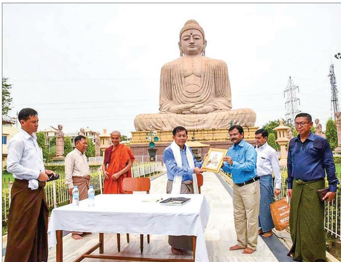
Senior General Min Aung Hlaing accepts a Dhamma gift.