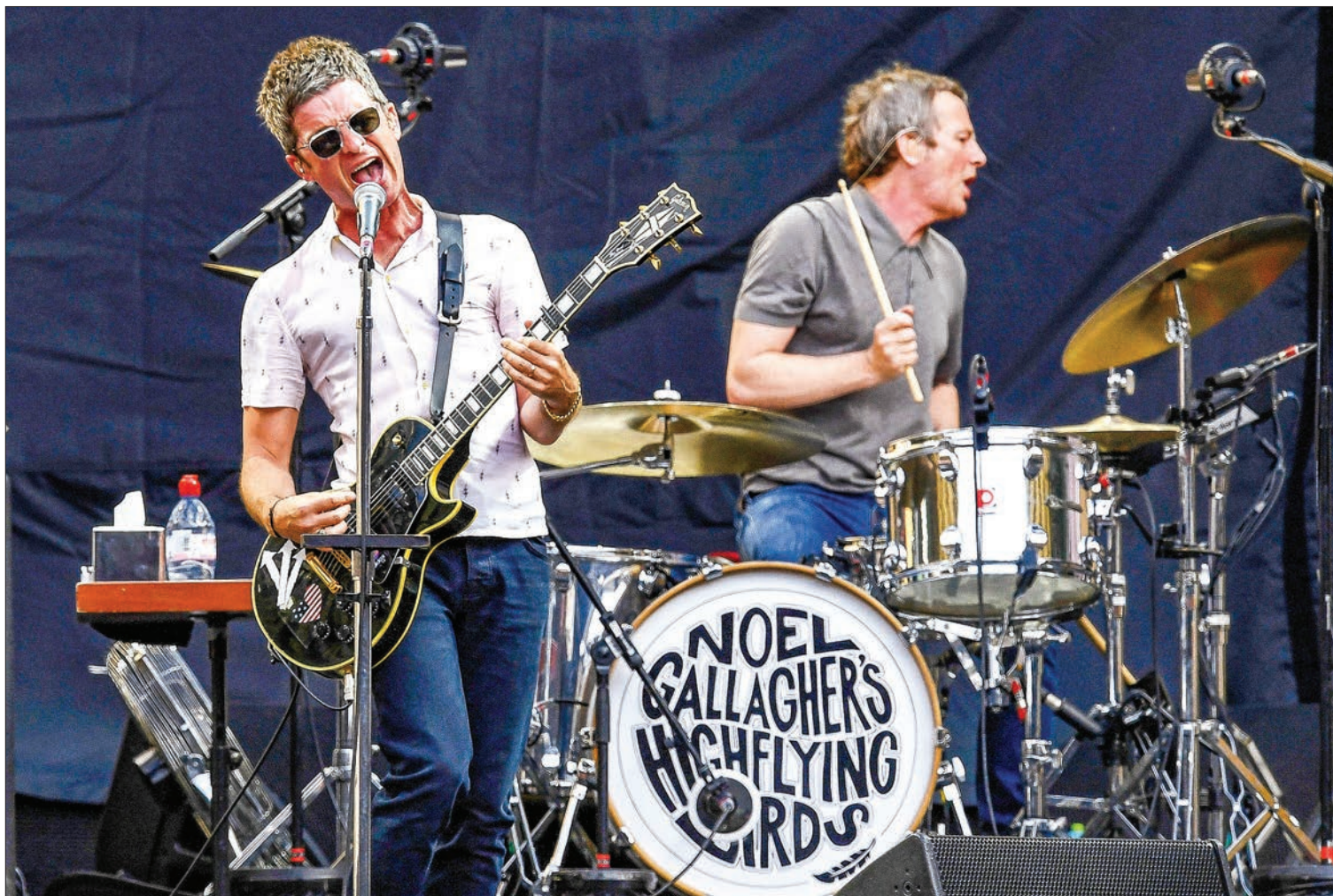
Noel Gallagher sings as Noel Gallagher's High Flying Birds perform, at Twickenham Stadium, London, Britain, on 8 July 2017.