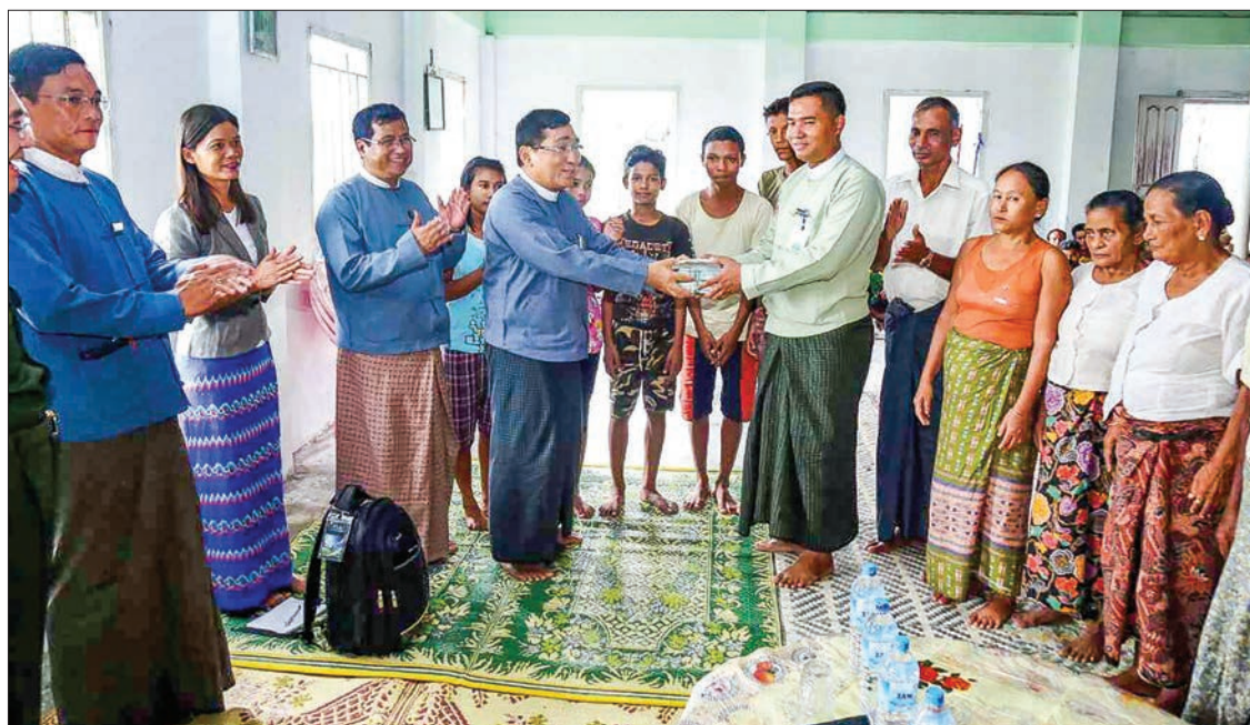
Union Minister for Social Welfare, Relief and Resettlement Dr Win Myat Aye presenting assistance for local needs.

The Union Minister fulfilled the immediate needs of the people during the meeting,