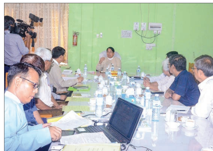
Union Minister for Information Dr. Pe Myint, writers and booksellers discuss in Sarpay Beikman on merchant street in Yangon.

Union Minister Dr. Pe Myint also urged writers who attended the event to discuss the 100 Myanmar books series.