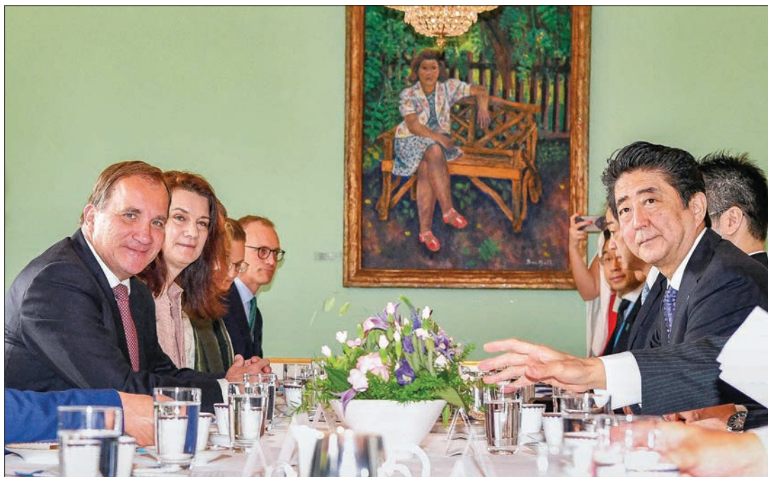
Swedish Prime Minister Stefan Lofven (L) and Japanese Prime Minister Shinzo Abe hold talks in Stockholm, on 9 July 2017.

Abe's visit to Sweden is part of a roughly weeklong European tour that took him to Germany to attend a Group of 20 summit. Abe is the second