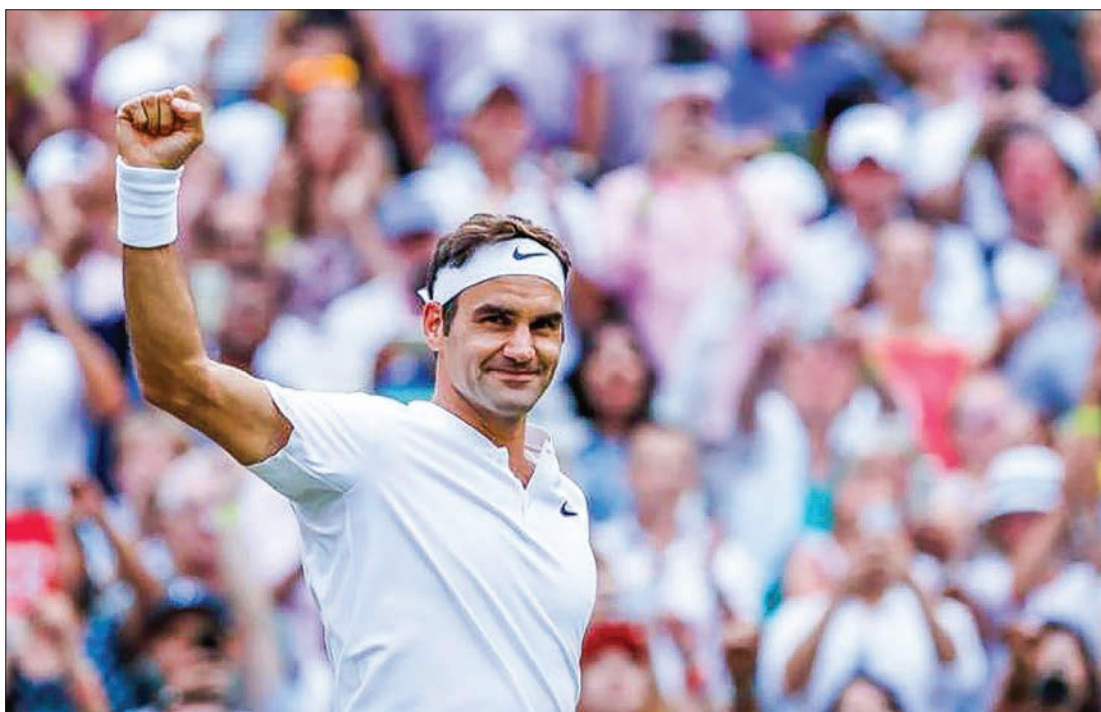
Switzerland's Roger Federer celebrates winning the third round match against Germany's Mischa Zverev at Wimbledon, in London, Britain, on 8 July 2017.

of the net posed few issues for third seed Federer, who stayed on course for a record eighth Wimbledon title by using the German as a target and relentlessly picking him off.