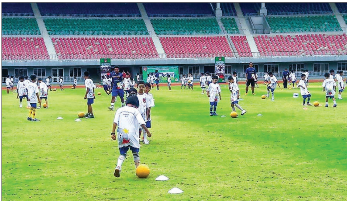
Children from primary and middle schools train with their coaches at the Mandalay Thiri Stadium in Mandalay.

After that, officials cut the ribbon to open the ceremony and the children showed up their ability along with football coaches. ■