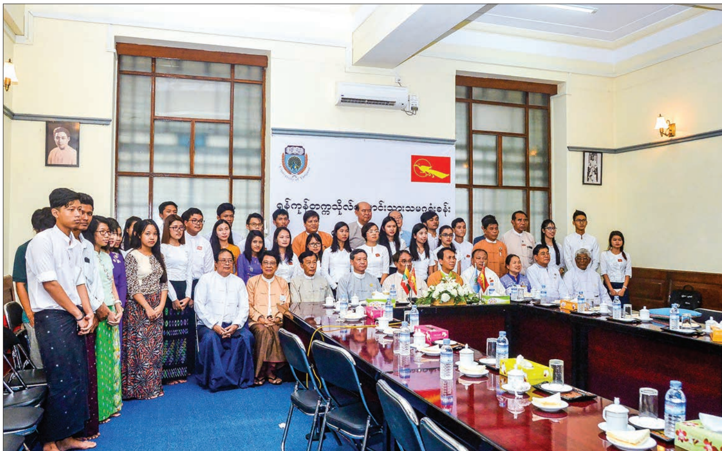
The opening ceremony of the Office of the Yangon University Students' Union in progress.