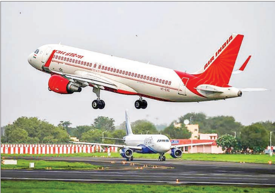
An Air India aircraft takes off as an IndiGo Airlines aircraft waits for clearance at the Sardar Vallabhbhai Patel International Airport in Ahmedabad, India, on 7 July 2017.

Once the nation's largest carrier, its mar-