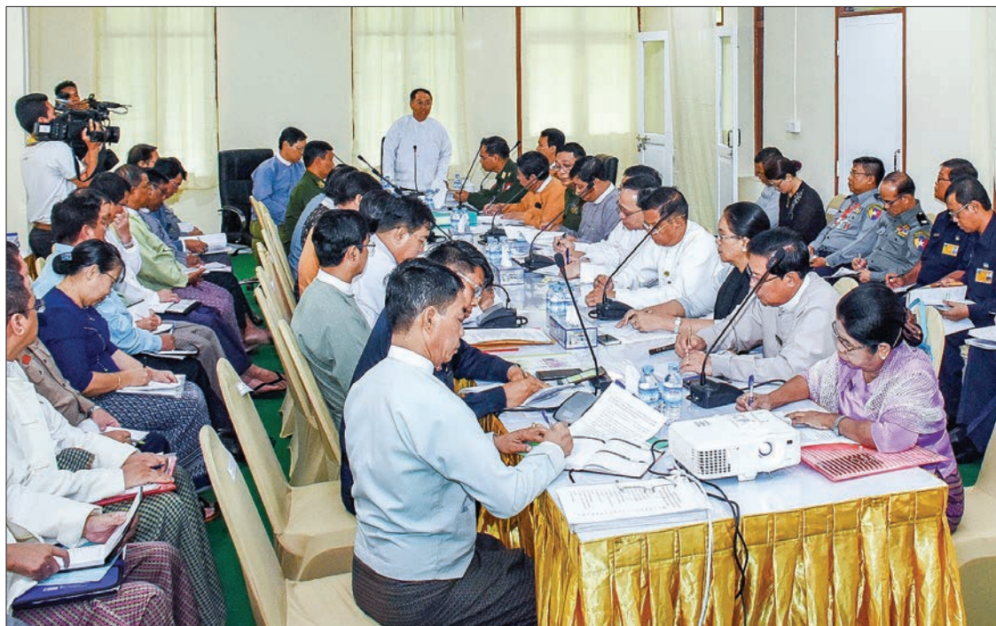
Vice President U Myint Swe delivers speech at the meeting of 70th Anniversary of Martyrs' Day Commemoration Committee.

Organizers of the 70th Anniversary of Martyrs' Day Commemoration met at the administrative office of Martyrs' Mausoleum yesterday, according to a Myanmar News Agency report.