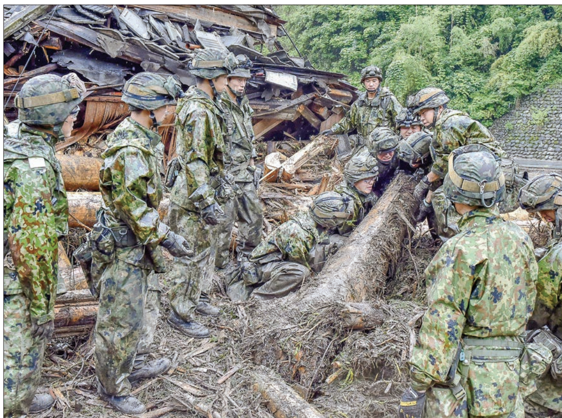
Ground Self-Defence Force personnel continue searching for missing people in the village of Toho, Fukuoka Prefecture, on 9 July, 2017, as around 30 remained unaccounted for in Fukuoka and Oita prefectures, where disasters triggered by torrential rain since 5 July have claimed 18 lives.

The Japan Meteorological Agency said parts of southwestern Japan may see more heavy rain Sunday as a seasonal rain front lingered near the region. —Kyodo News ■