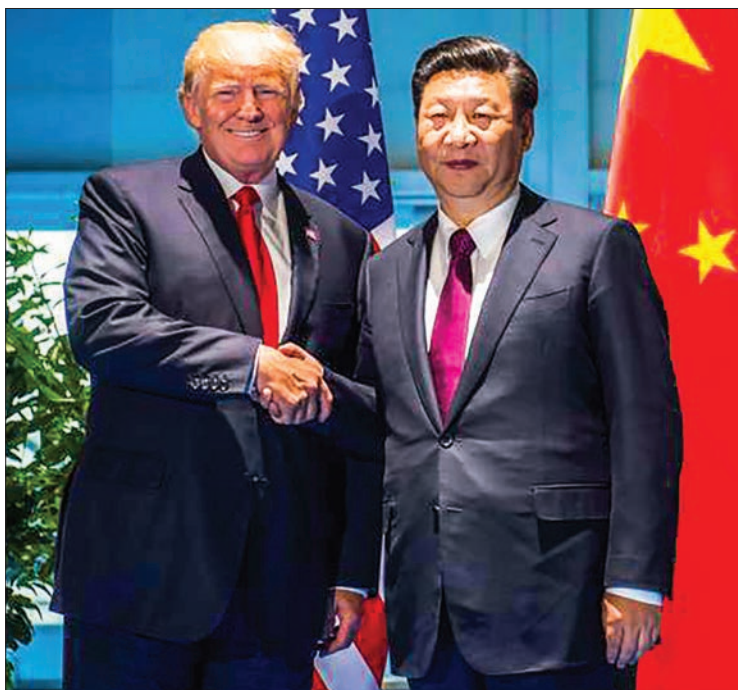
US President Donald Trump and Chinese President Xi Jinping (R) shake hands prior to a meeting on the sidelines of the G20 Summit in Hamburg, Germany, on 8 July 2017.

Lately, Trump has expressed some impatience on China's role in North Korea — particularly