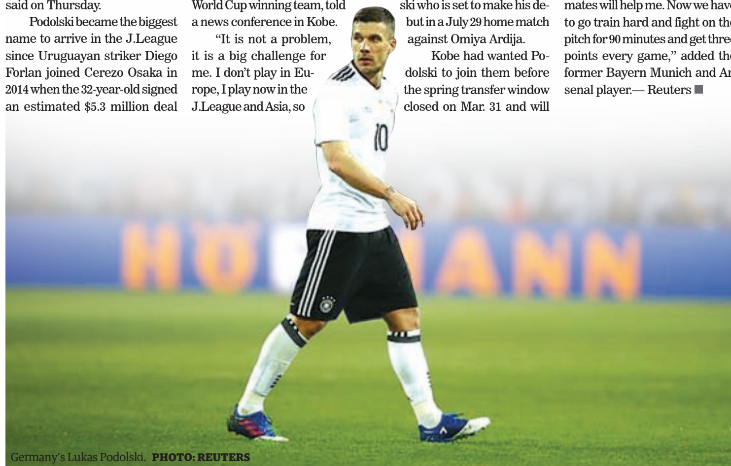
Germany's Lukas Podolski.

expect him to lift the club, currently lying 11th and 13 points behind leaders Kashima Antlers, in the second half of the season. "I am here now to help everyone. I am not alone. I know my teammates will help me. Now we have to go train hard and fight on the pitch for 90 minutes and get three points every game," added the former Bayern Munich and Arsenal player.— Reuters ■