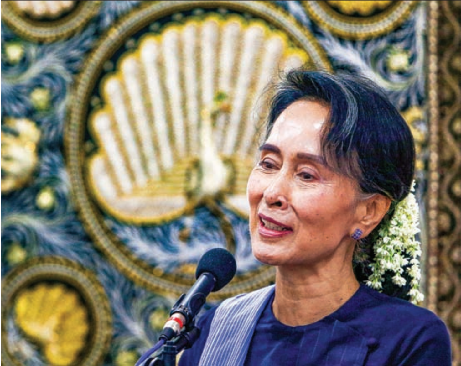
State Counsellor Daw Aung San Suu Kyi addresses the media at a press conference yesterday in Nay Pyi Taw.