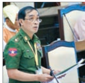
Border Affairs Deputy Minister Maj-Gen Than Htut.

Border Affairs Deputy Minister Maj-Gen Than Htut said the five-miles gravel road was assigned through a tender won by Global Village Company in FY2016-2017 and that the Chin State government allocated funds of Ks383.29 million. He said the road is still under construction with 80 percent of the work done. Chin State government is overseeing the work of the company in order that it is completed according to set standard said the deputy