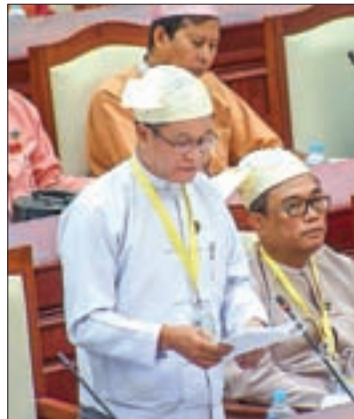
U Aung Htoo, Deputy Minister for Commerce.

And, deputy minister added, "Kyaukphyu SEZ is a long term project. Profits are expected to be gained in 2039. Volume of the investment is huge, thus discussions are being made transparently as it is of great importance as a strategy in implementing the project. As regards compensation for the land, it is K 25 million per acre for the land nearest to Yangon in Thilawa SEZ, whereas in Kyaukphyu compensation for the land is being demanded at up to K 90 million per acre. Regarding