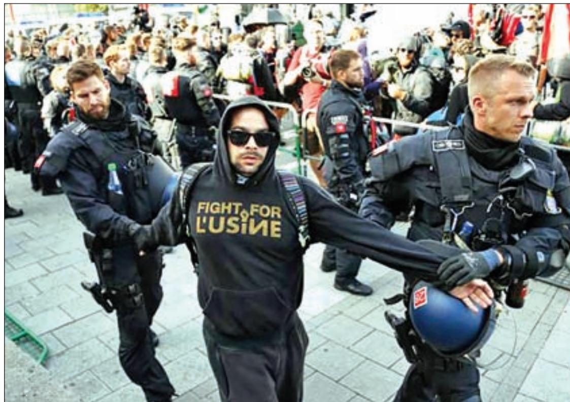
An activist is detained by police following his arrival at Hamburg Hauptbahnhof central railway station during the G20 summit in Hamburg, Germany, on 6 July 2017.

But a fire overnight at a Porsche car dealer in the north of the city that damaged eight vehicles could be a foretaste of what’s to come. Police said they were investigating whether it was an arson attack.