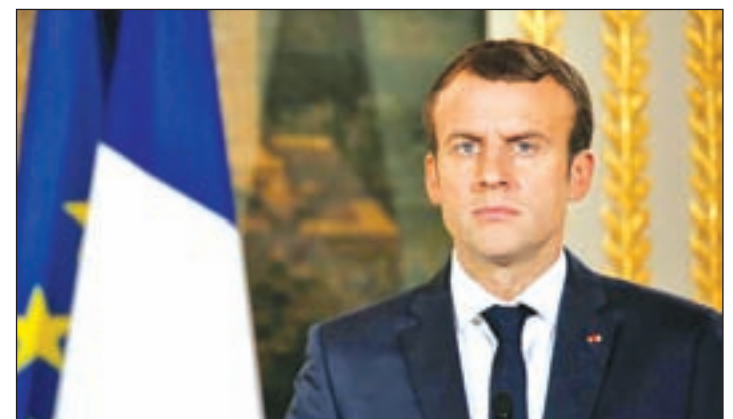
French President Emmanuel Macron attends a joint news conference at the Elysee Palace in Paris, France, on 6 July 2017.

The National Guard has been at the forefront of policing protests across the country. It uses tear gas, water cannons, and rubber bullets against masked youths who in turn hurl stones, Molotov cocktails and excrement at security lines. At least 90 people have been killed since April.—Reuters ■