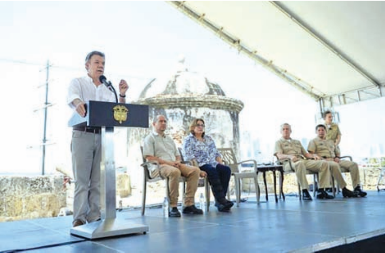
Colombia's President Juan Manuel Santos speaks in Cartagena, Colombia, on 5 July 2017.

A team of international experts, the Colombian navy and the country's archaeology institute discovered the wreck in 2015. The San Jose was the subject of a legal dispute between Colombia and Sea Search Armada, a US-based salvage company, which said in 1981 it had located the area where the ship sank. The company and the government agreed to split any proceeds from the wreckage, but the government later said all treasure would belong to Colombia, a view that was backed by a US court in 2011.—Reuters ■