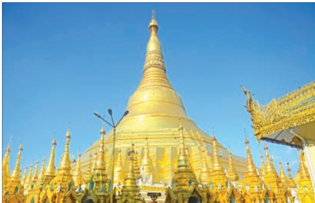
Myanmar's national landmark Shwedagon Pagoda in Yangon.

According to World Health Organization, 24 countries in South East Asia and western Pacific region are affected by an ongoing Japanese Encephalitis epidemic affecting more than 3 million people. ■