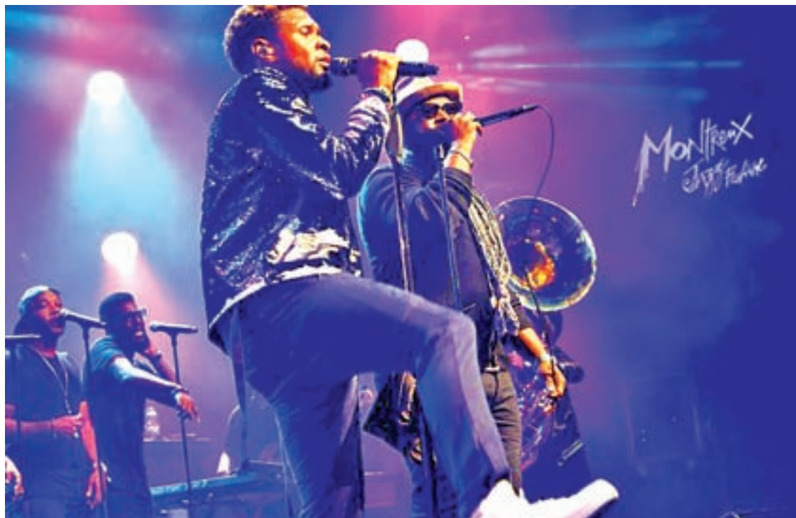
Usher (L) & Tarik Trotter from The Roots perform during the 51st Montreux Jazz Festival in Montreux, Switzerland, on 5 July 2017.

He played tracks from his latest album “Parking Lot Symphony”, released in April, often doing both vocals and trombone,