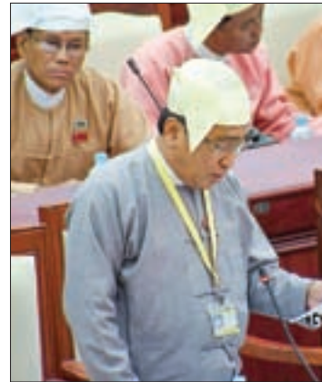
Dr Win Myat Aye, Union Minister for Social Welfare, Relief and Resettlement.

As regards the question raised by U Sai Ngaung Hsai Hein of Maukmae constituency, Dr Win Myat Aye, Union Minister for Social Welfare, Relief and Resettlement said, "209 villagers of 45 house-holds from Mikesarsay and Ponesote villages of Gadugyi village-tract in Maukmae township are taking shelter at Narhii village of Barnmart village-tract in Maukmae township. For them,