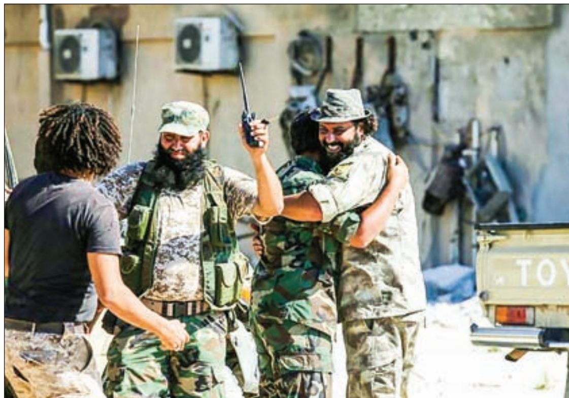
Members of the Libyan army's special forces celebrate after the liberation of the last region of Islamist militants in their last stronghold in Benghazi, Libya, on 5 July, 2017.

made rapid progress through the seafront district of Sabri, using heavy artillery to blast their way through some of the final pockets of resistance.