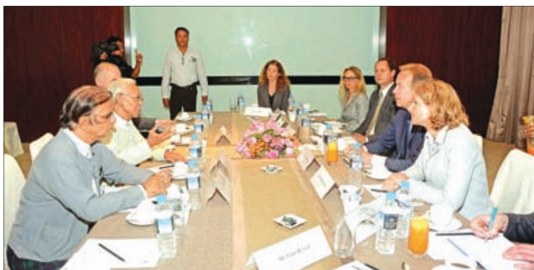
Norwegian Foreign Minister Mr. Borge Brende holds talks with Rakhine State Advisory Commission.

A delegation led by Norwegian Foreign Minister Mr. Borge Brende separately met ethnic armed groups' leaders and members from Advisory Commission on Rakhine State at Kempinski Hotel in Nay Pyi Taw yesterday afternoon.