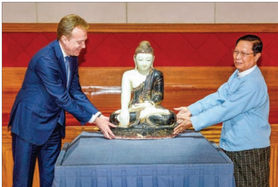
Norwegian Foreign Minister Mr Børge Brende handed over Buddha Statue to Thura U Aung Ko, Union Minister of Religious Affairs and Culture at the National Museum in Nay Pyi Taw.

The alabaster statue depicts Buddha in the mudra of 'earth witness' ( bhūmisparśa ), one of the most common iconic representations of Buddha images in Myanmar. Its tumultuous story dates back to 2011 when the Norwegian Customs identified and prevented the illegal import of this cultural artefact. The Norwegian prosecutor confiscated the statue and after years of research, the statue was identified by experts as originating from the Manda-