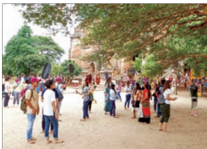
Foreign veterinary students are seen in Bagan.

The program is part of the ASEAN Veterinary Volunteer Project 2017.— Ye Thura Aung (NyaungU) ■