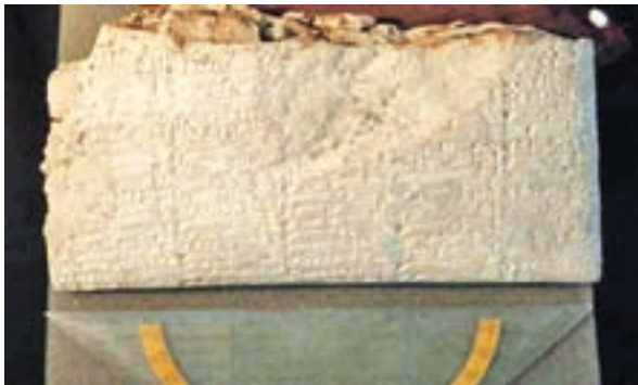
A cuneiform tablet, an ancient clay artifact that originated in modern-day Iraq is seen in this undated handout photo obtained by Reuters on 15 July 2017.