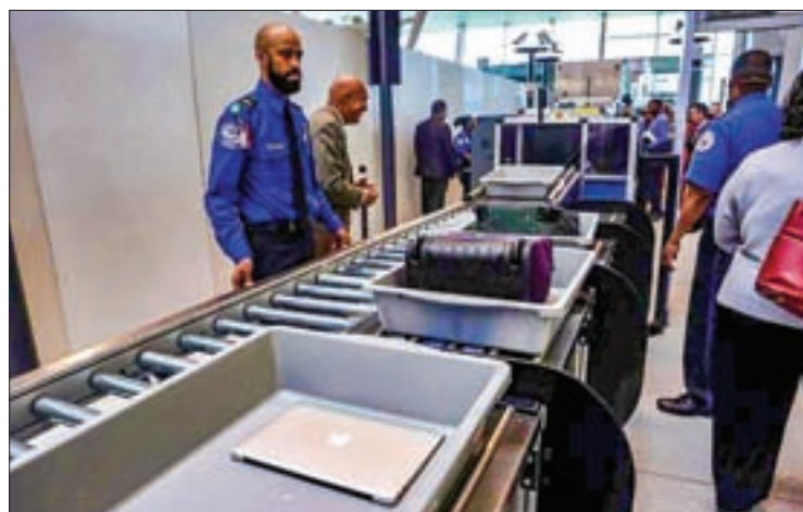
Baggage and a laptop are scanned using the Transport Security Administration's new Automated Screening Lane technology at Terminal 4 of JFK airport in New York City, US, on 17 May, 2017.

Qatar Airways said in a statement early on Thursday the ban had been lifted after the airline and its hub airport Hamad In-