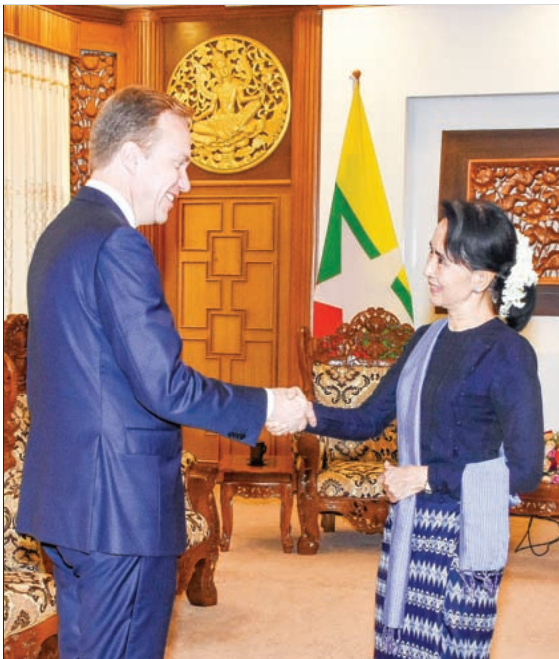
State Counsellor Daw Aung San Suu Kyi welcomes Norwegian Foreign Minister Borge Brende.