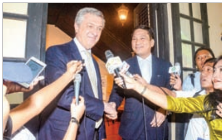
UN High Commissioner for Refugees, Filippo Grandi talks to reporters at the U Thant House in Yangon.

The High Commissioner and his entourage then left Yangon via the Yangon International Airport in the evening.— Myanmar News Agency ■