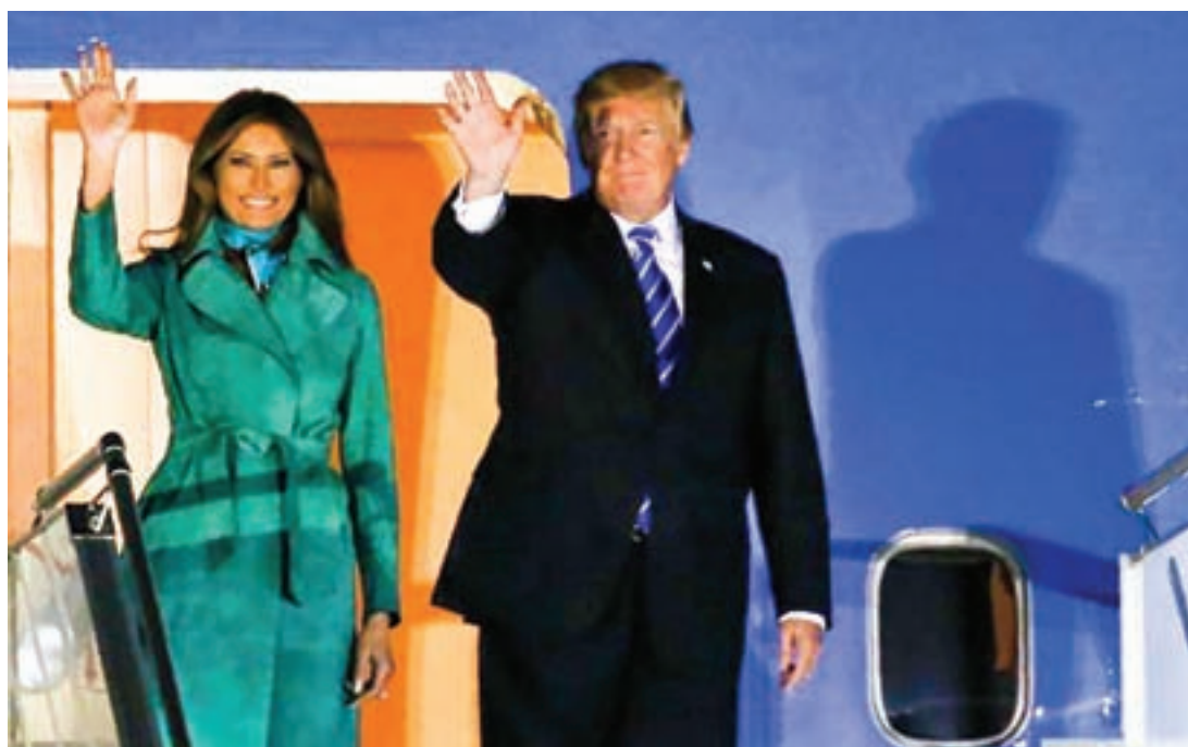
US President Donald Trump and First Lady Melania Trump arrive at Warsaw military airport in Warsaw, Poland, on 5 July 2017.

The west Europeans, critical of Poland's democratic record, will be watchful as to whether Trump, who will give a major policy speech on a Warsaw square, may encourage its government in its defiance of Brussels.