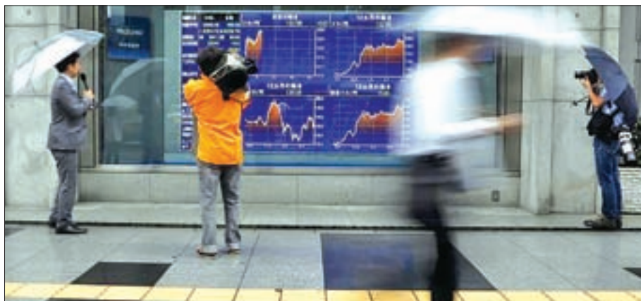
Videographer films an electronic board showing the graphs of exchange rates between the Japanese yen, the US dollar and Euro outside a brokerage in Tokyo, Japan in 2015.

The Nasdaq closed up 0.7 per cent on Wednesday.