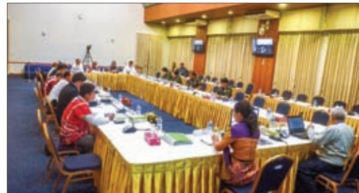
The 11 th meeting of the Union Joint Monitoring Committee held in Yangon.

Local-level Joint Monitoring Committees-JMC-L has been formed in Langkho, and further committees will be formed in Papun and Bawkali in Kayin State before August, according