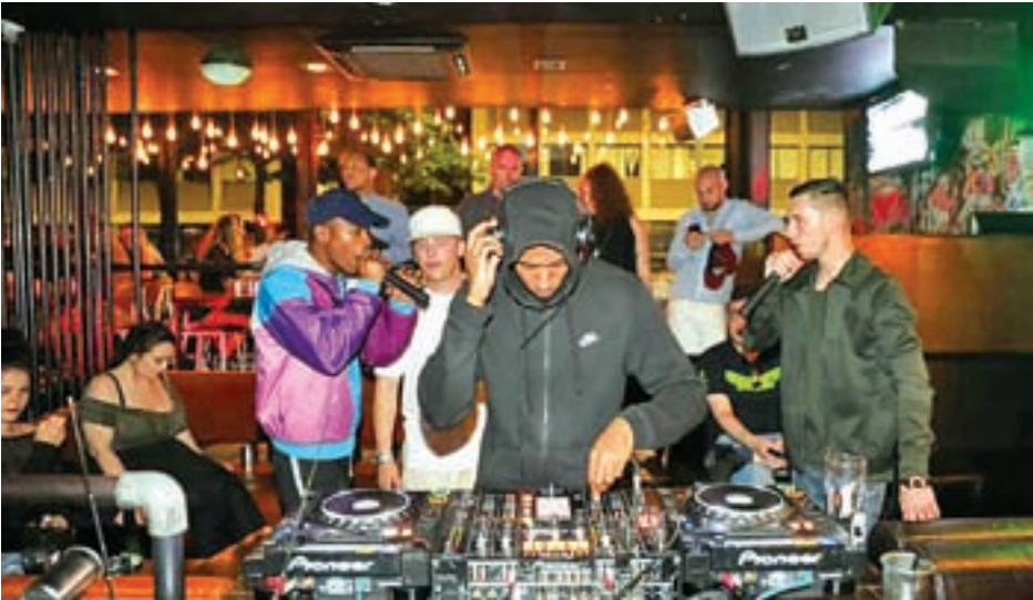
Members from grime group The Collective perform at City Sound Project, Penny Theatre club, Canterbury, Britain on 28 May, 2017.

The grime artists do tackle drugs, money, respect, turf wars and other gritty topics, all set over a tempo of 140 beats per minute. "A lot of us come from dark backgrounds and deeper struggles so the real lyrics we write may have violence in them but it's just a form of expression," said Clipson, another member of the Slew Dem Crew. —Reuters ■