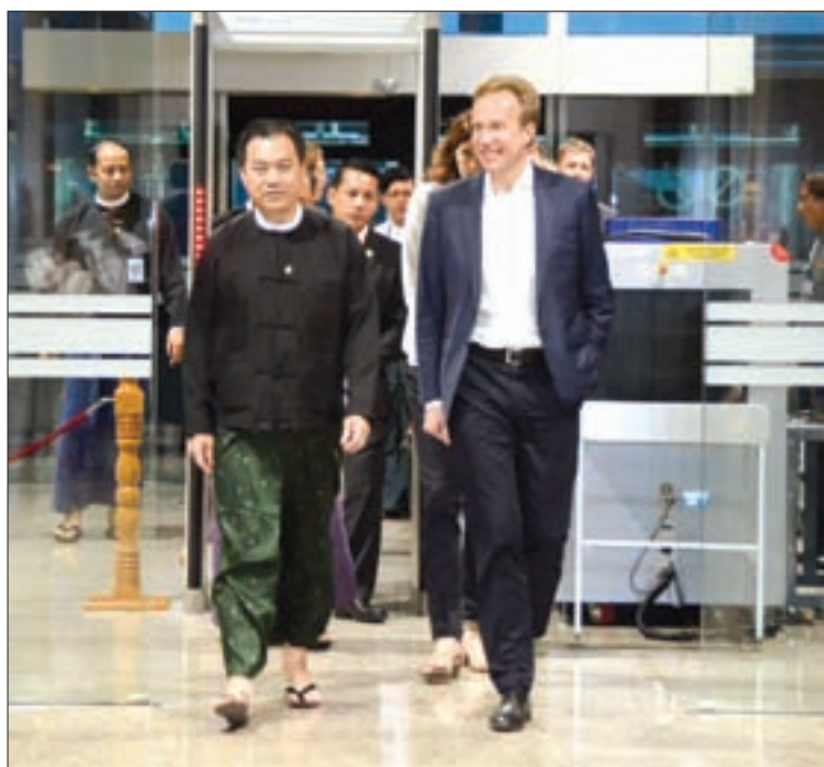
Foreign Minister of Norway Mr. Borge Brende arrives at Nay Pyi Taw International Airport yesterday.