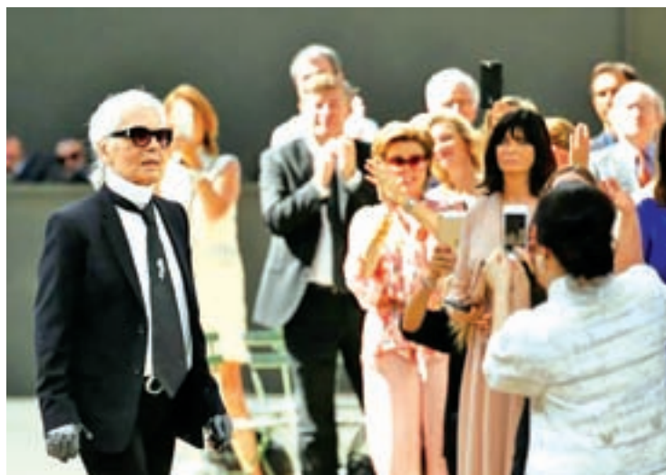
German designer Karl Lagerfeld appears at the end of his Haute Couture Fall/Winter 2017/2018 collection for fashion house Chanel in Paris, France on 4 July, 2017.

They were crowned with matching bowler-style hats in keeping with the collection’s vin-