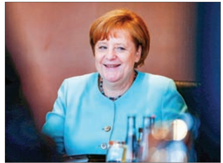
German Chancellor Angela Merkel attends the weekly cabinet meeting at the Chancellery in Berlin, Germany on 5 July, 2017.

“We are not deploying tanks at Brenner and I can emphasise again that cooperation with Italy is really good,” Kern said, adding that there was no indication Italy was not in control of the situation on its southern flank, where there has been a surge in the number of migrants crossing the Mediterranean.—Reuters ■