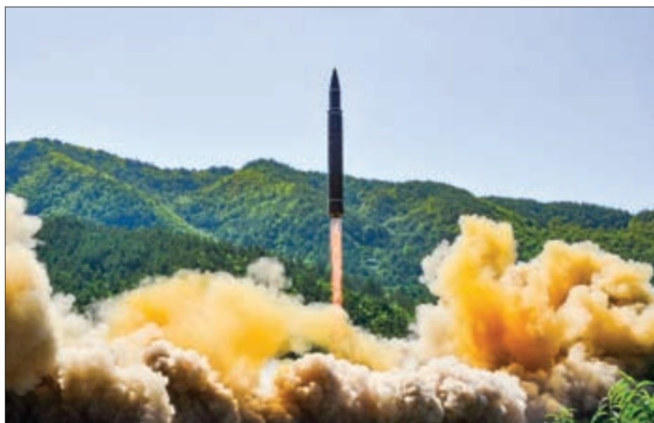
The intercontinental ballistic missile Hwasong-14 is seen during its test in this undated photo released by North Korea's Korean Central News Agency (KCNA) in Pyongyang on 5 July 2017.

US Secretary of State Rex Tillerson said the test, on the eve of the US Independence Day holiday, represented “a new esca-