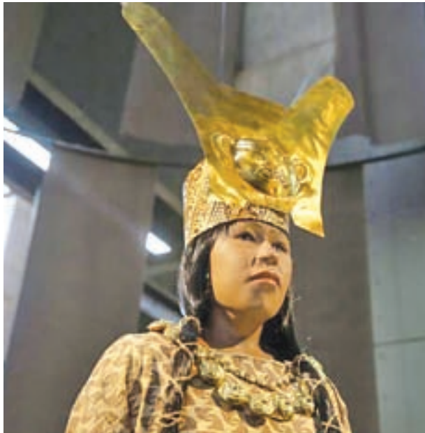
A replica of The Lady of Cao face, a female mummy found at the archaeological site Huaca El Brujo, a grand pyramid of the ancient Moche pre-hispanic culture, is seen at the Ministry of Culture in Lima, Peru on 4 July 2017.

LIMA, PERU — She died in her twenties some 1,700 years ago, and is believed to have ruled over a desert valley in ancient Peru where her elaborately tattooed body was buried with weapons and gold objects.