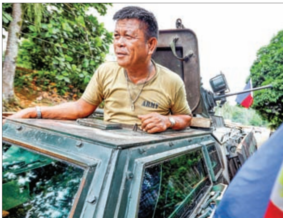
A Filipino army driver of an armored vehicle takes a look while driving on the route to Marawi, as army troops continue their assault against insurgents from the Maute group in Marawi, Philippines on 5 July, 2017.

The Abu Sayyaf militants are allied with the Maute group.—Reuters ■