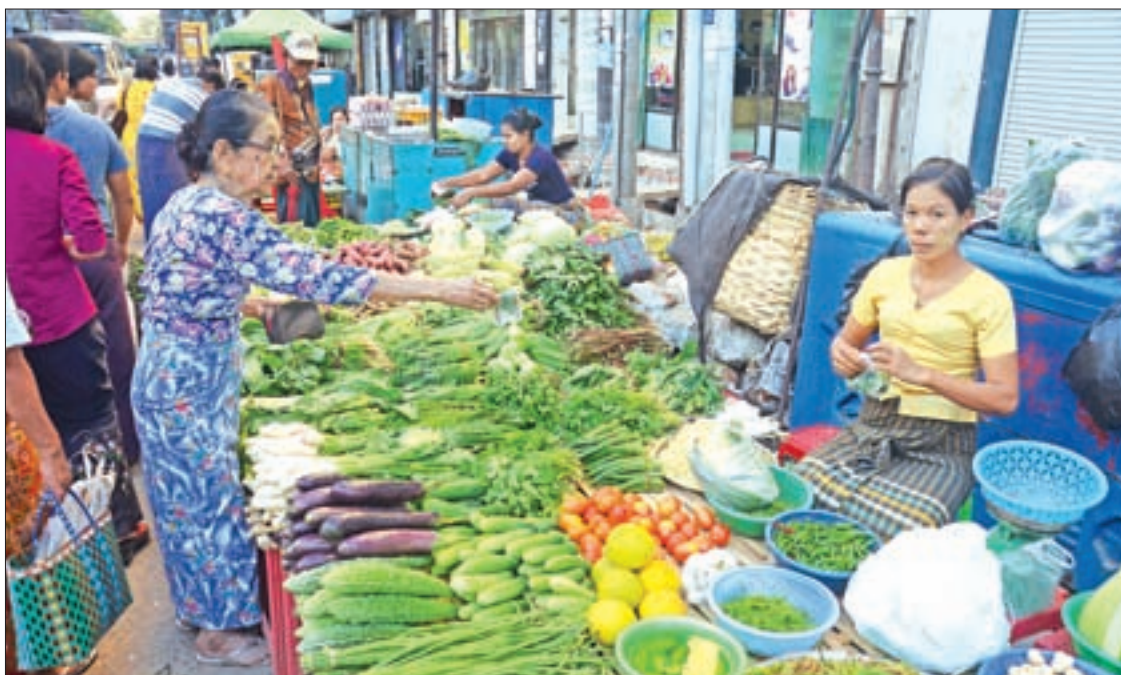
Vegetable prices have risen through the years with the general price for a kilogram of a certain type of vegetable usually costing no less than a thousand kyat.

"Oh! My goodness" ■ (Translated by Wallace)