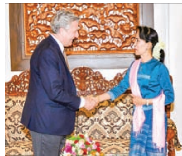
State Counsellor Daw Aung San Suu Kyi shakes hands with UN High Commissioner Mr. Filippo Grandi at the Ministry of Foreign Affairs.

During the meeting, they exchanged views on the measures taken in the form of humanitarian aids from UNHCR, and cooperation between Myanmar and UNHCR.—Myanmar News Agency ■