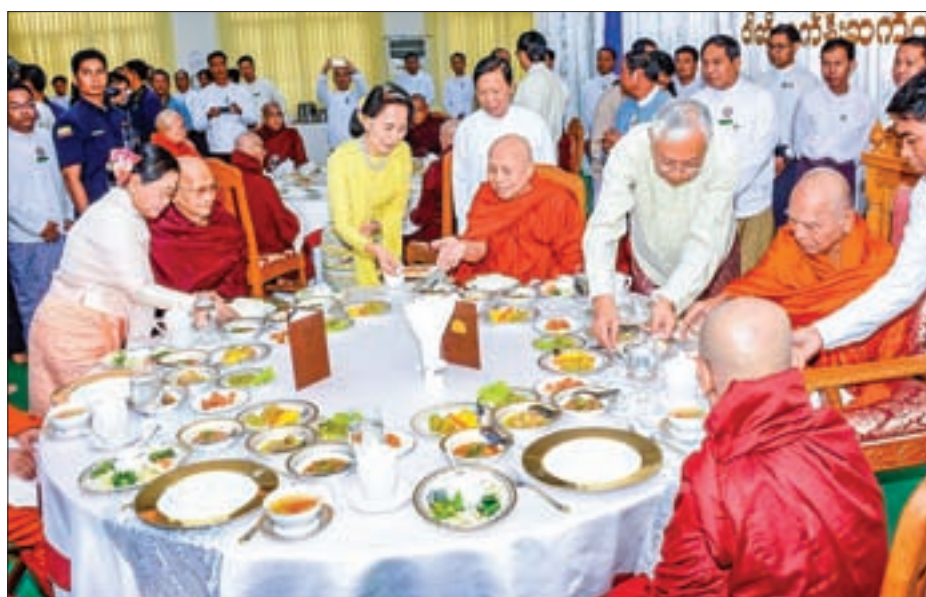
President U Htin Kyaw, First Lady Daw Su Su Lwin and State Counsellor Daw Aung San Suu Kyi offering 'soon' to Sayadaws as part of the Waso robe offering ceremony.