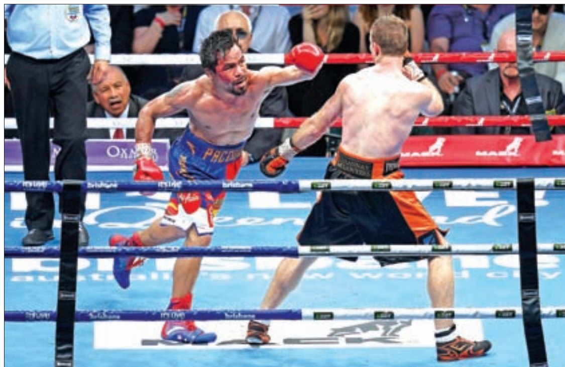
Manny Pacquiao of the Philippines swings and misses during his loss to Jeff Horn of Australia in Brisbane, Australia on 2 July, 2017.

"WBO should take appropriate action on the letter sent