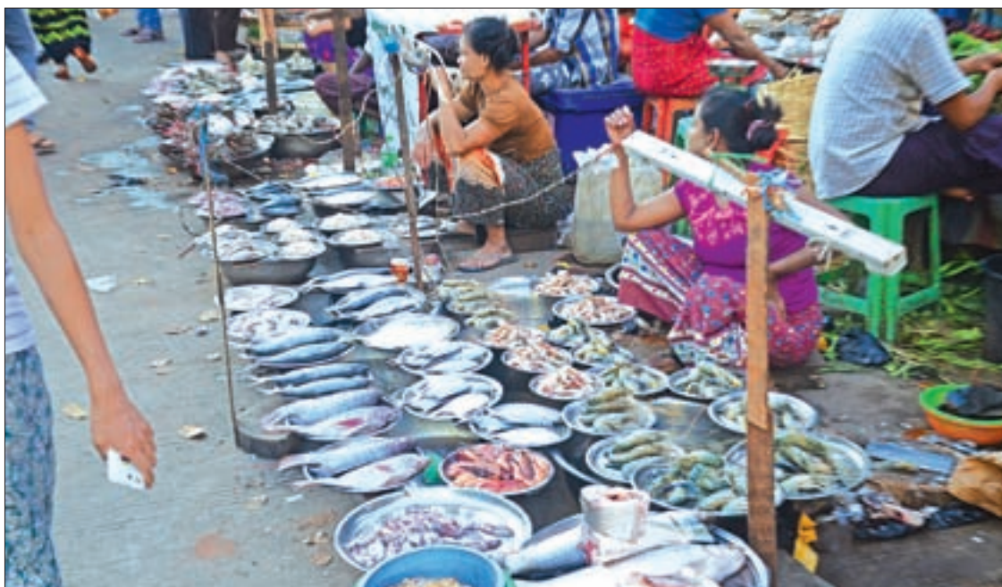
Fish, like other meat products, sell for more than ten thousand kyat per viss in the market.