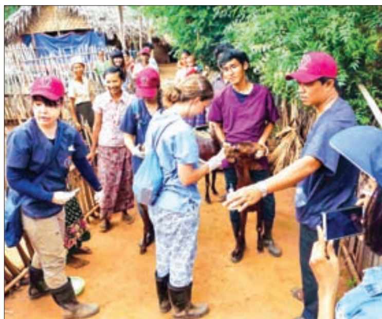
A foreign veterinary student vaccinates a goat.

The Norwegian Minister of Foreign Affairs was welcomed at the Nay Pyi Taw International Airport by U Kyaw Zeya, Permanent Secretary of Ministry of Foreign Affairs, Mrs. Tone Tinnes, Norwegian Ambassador to Myanmar and officials.—Myanmar News Agency ■