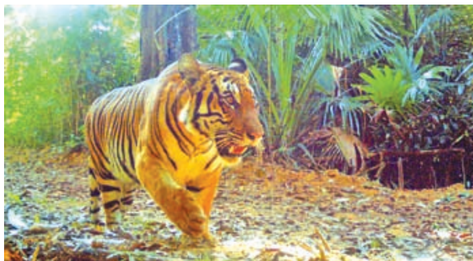
An endangered tiger in Hukaung Valley.

In a paper published in Conservation Biology , we argue that the United Nations' World Heritage Convention should expand the amount of wilderness included in its list of Natural World Heritage Sites (NWHS). Wilderness areas are underrepresented among the 203 sites currently on the list. The World Heritage Committee's meeting in Poland this week offers a good opportunity