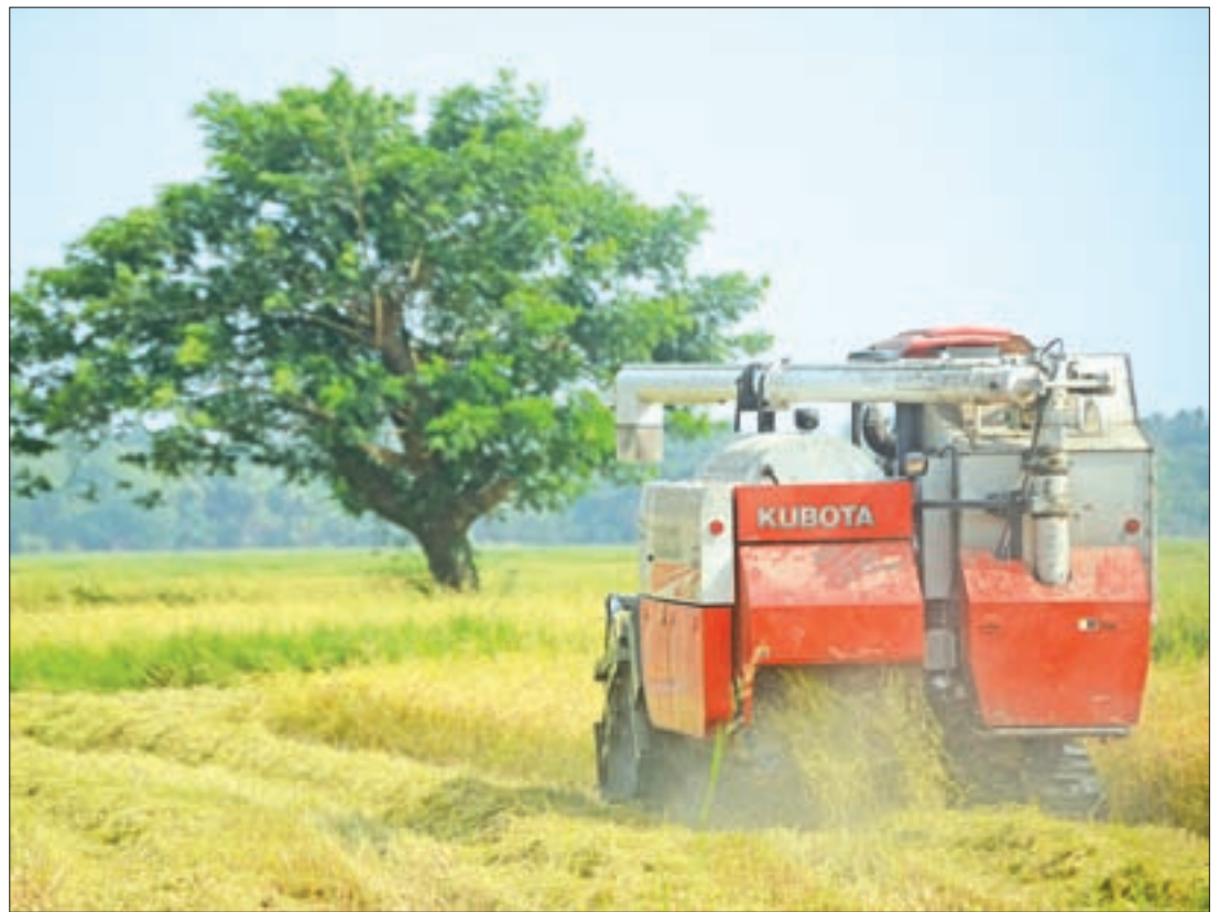
Rice cutting machine working in paddy field in Kangyidauk, Ayeyawady.