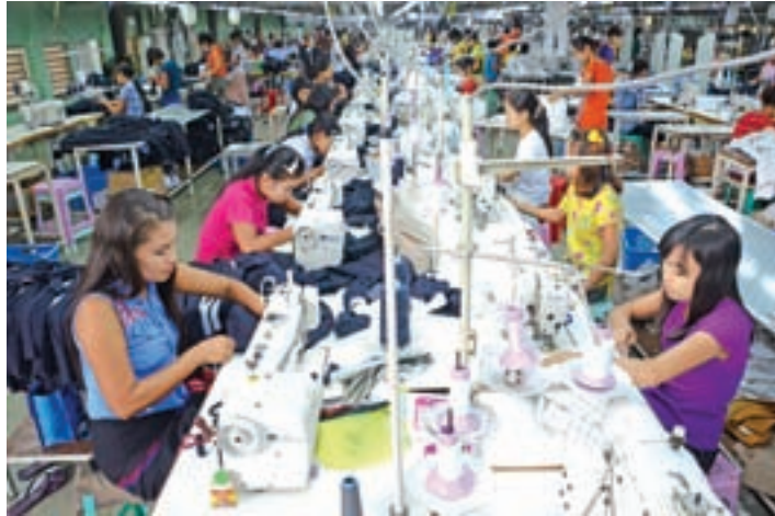
Employees work on a production line at a garment factory in Hlinethaya industrial zone, Yangon.

Myanmar's garment industry is focused on "cutting, making and packing," which is a basic contract garment assembly system that allows international garment companies to reduce their labour costs. Myanmar labour leaders and policymakers are hoping to transition the domestic garment industry into a more value-added "free on board" system which puts internation-