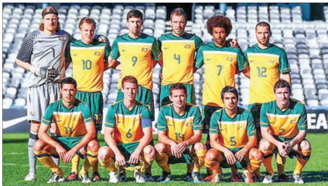
Australian players cum European League's players post for the group photo.