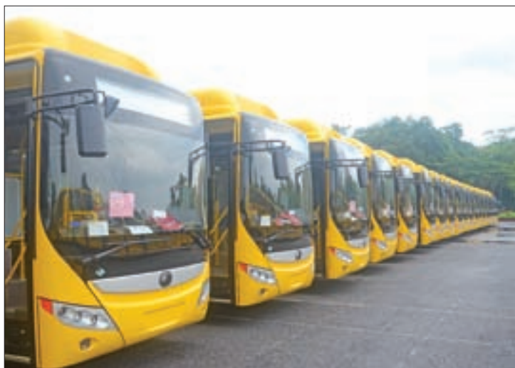
New buses parked in People's Park which will eventually be used in new YBS bus routes.