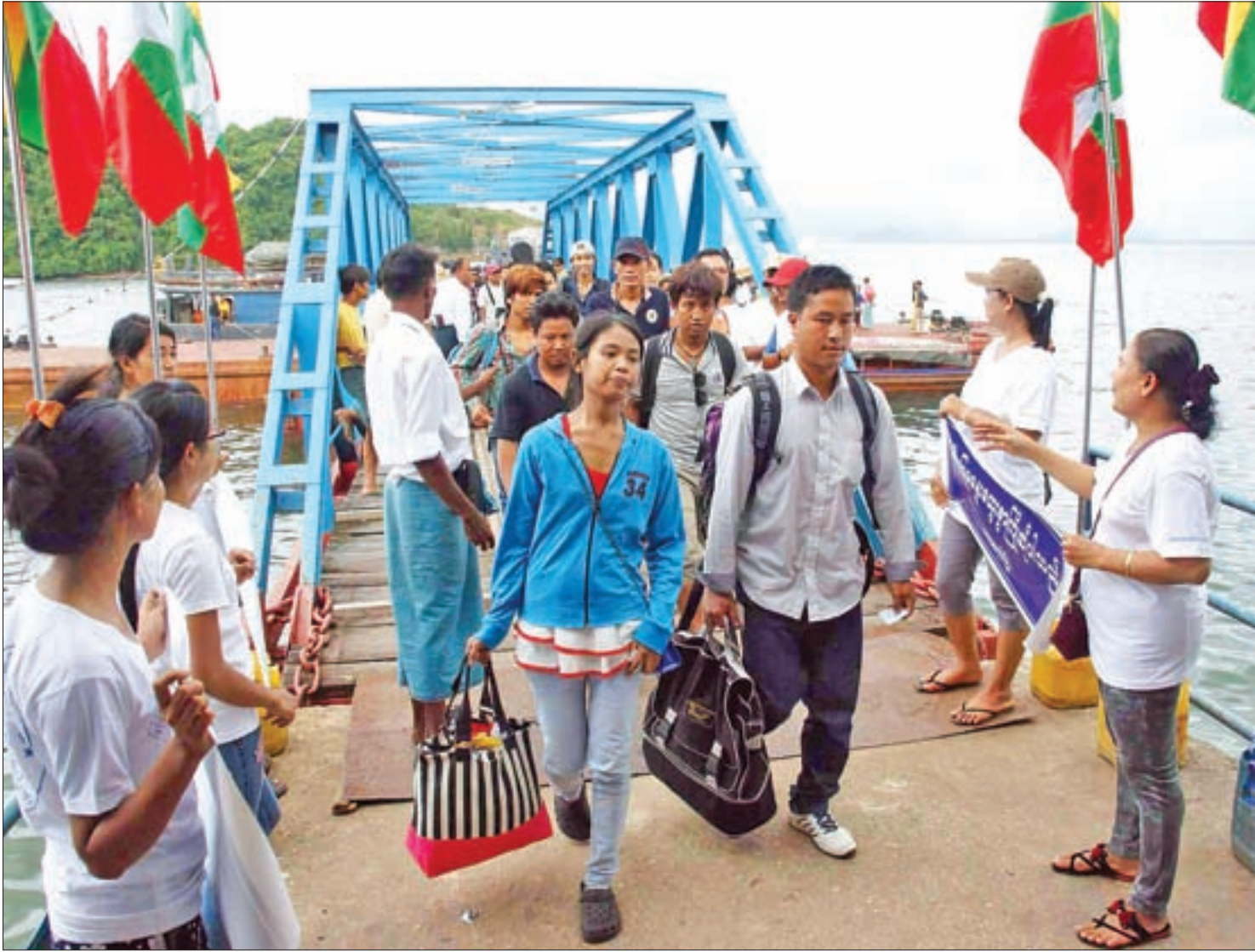
Migrant workers are welcomed by volunteers as they arrive in Kawthoung on the Thai-Myanmar border.