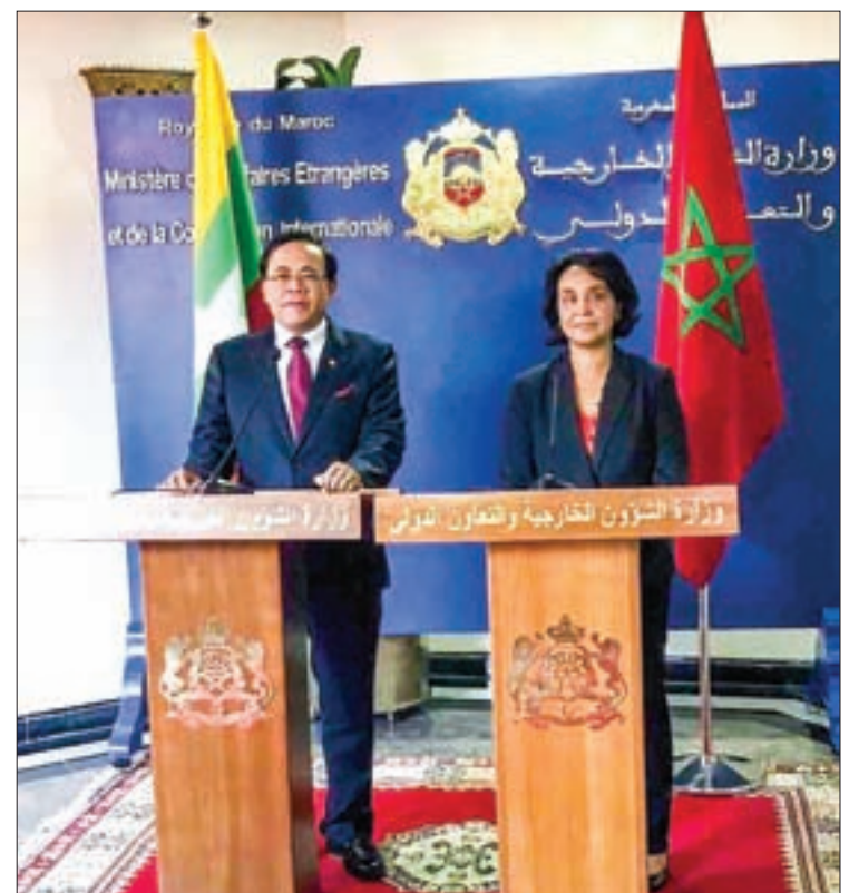
Minister of State for Foreign Affairs U Kyaw Tin (Left) and Secretary of State of Morocco Mrs. Mounia Boucetta (Right) hold joint press conference.

of the Republic of the Union of Myanmar and the Ministry of Foreign Affairs and International Cooperation of the Kingdom of Morocco on Bilateral Consultations and the Agreement between the Government of the Republic of the Union of Myanmar and the Government of the Kingdom of Morocco on the exemption of Visa for diplomatic, official, service and special passports. Minister of State U Kyaw Tin and Secretary of State Mrs. Mounia Boucetta then held a joint press conference and briefed the highlights of discussion at the Bilateral Consultations. The Minister of State also made a study tour of the Moroccan Academy for Diplomatic Studies at the Ministry of Foreign Affairs and International Cooperation in Rabat. —Myanmar News Agency ■