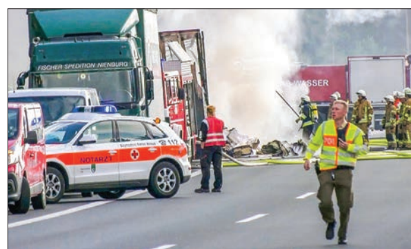
Firefighters are seen at the site where a coach burst into flames after colliding with a lorry on a motorway near Muenchberg, Germany in this still image taken from video on 3 July, 2017. PHOTO: REUTERS

Thirty-one people were injured, some seriously, police said on Twitter. They said there were 48 people on the bus at the time of the crash.—Reuters ■