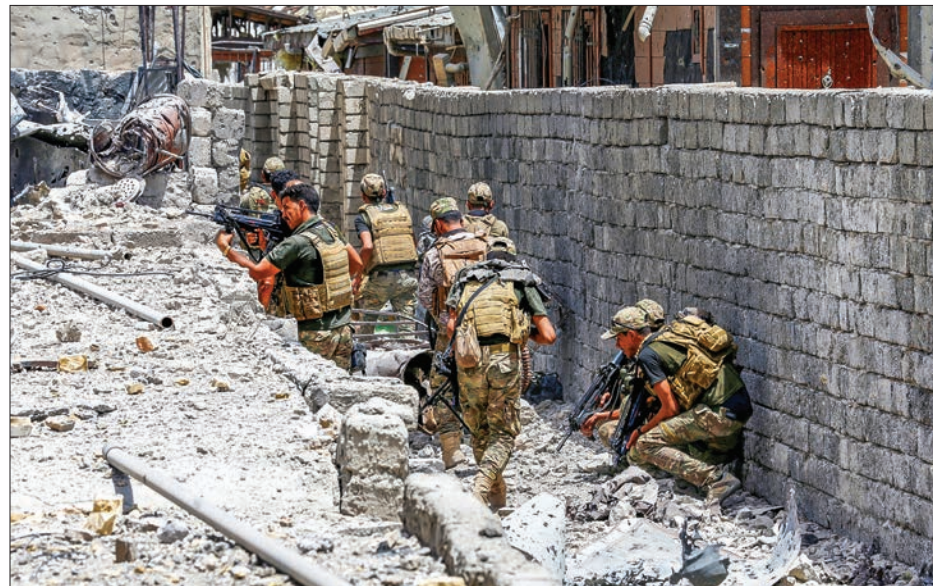
Members of the Emergency Response Division walk with their weapons during the fight with the Islamic States militants in the Old City of Mosul, Iraq on 3 July, 2017.

Reaching the Tigris would give Iraqi forces