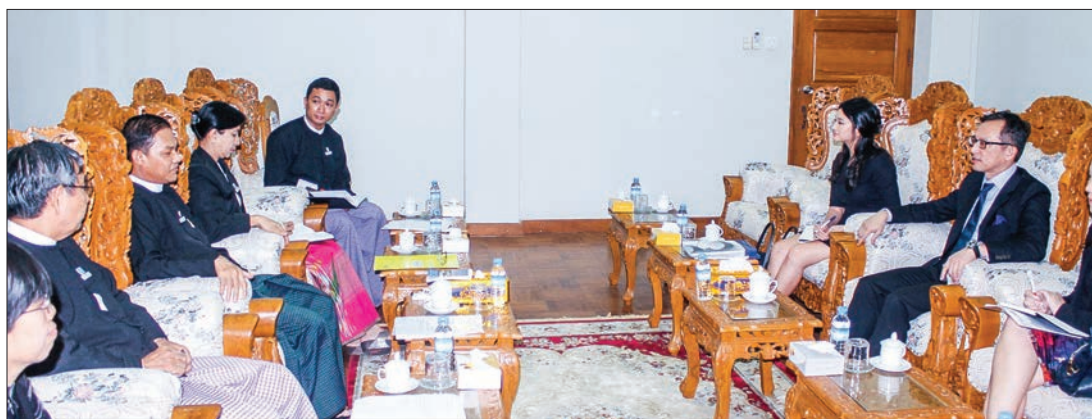
Union Attorney-General holds talks with SIIA's Chairman Prof. Simon Tay in Nay Pyi Taw.

The Deputy Minister's comments at yesterday's Amyotha Hluttaw also describe insurgent cross-border tactics and efforts by Myanmar security forces to prevent infiltration. —Myanmar News Agency ■