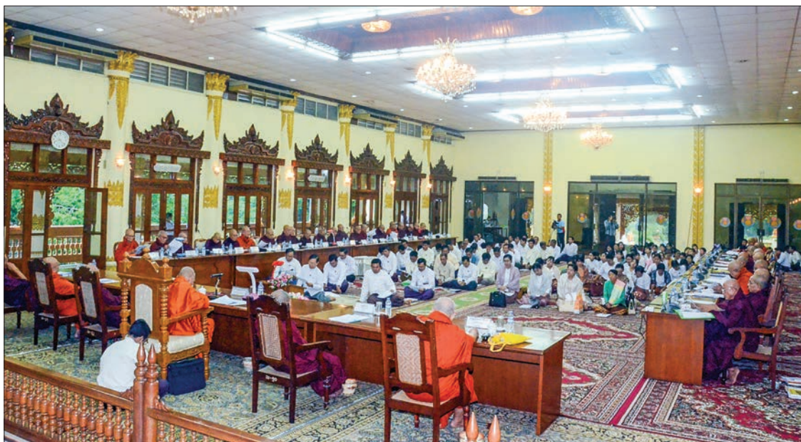
Second day of State Sangha Maha Nayaka Committee meeting was held in Yangon.