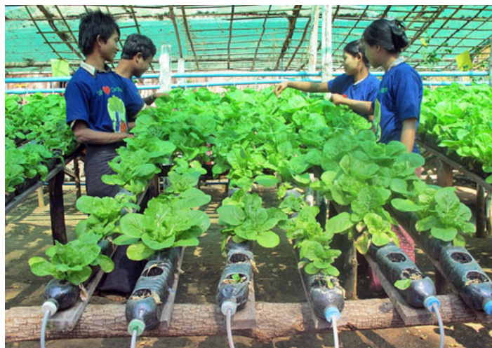
Volunteers learn new farming techniques at a greenhouse in Mangway located in Myanmar's dry zone.

The four-year US$7.9 million project is the first in Myanmar to receive funding from the Adaptation Fund. The project is being implemented by UNDP