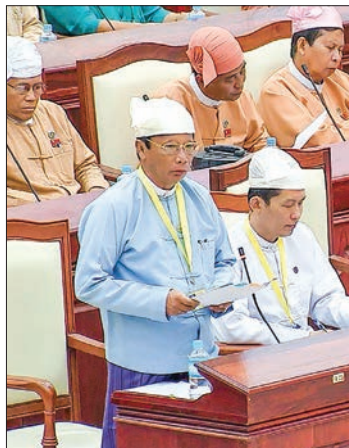
Deputy Minister for Agriculture, Livestock and Irrigation U Hla Kyaw.

Deputy Minister for Electricity and Energy Dr. Tun Naing said electricity was distributed on 30 June 2017 after the construction of the sub-station and the laying of the cable was