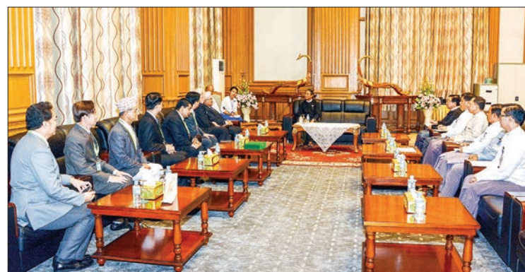
Pyithu Hluttaw Speaker receives MP and former Prime Minister of Nepal Mr. Madhav Kumar Nepal in Nay Pyi Taw.

In the day's meeting a Pyithu Hluttaw agriculture, livestock breeding and rural development committee report was discussed and approved and a decision made to approve the Oil and Petroleum Products Bill sent back by Amyotha Hluttaw with amendments. ■