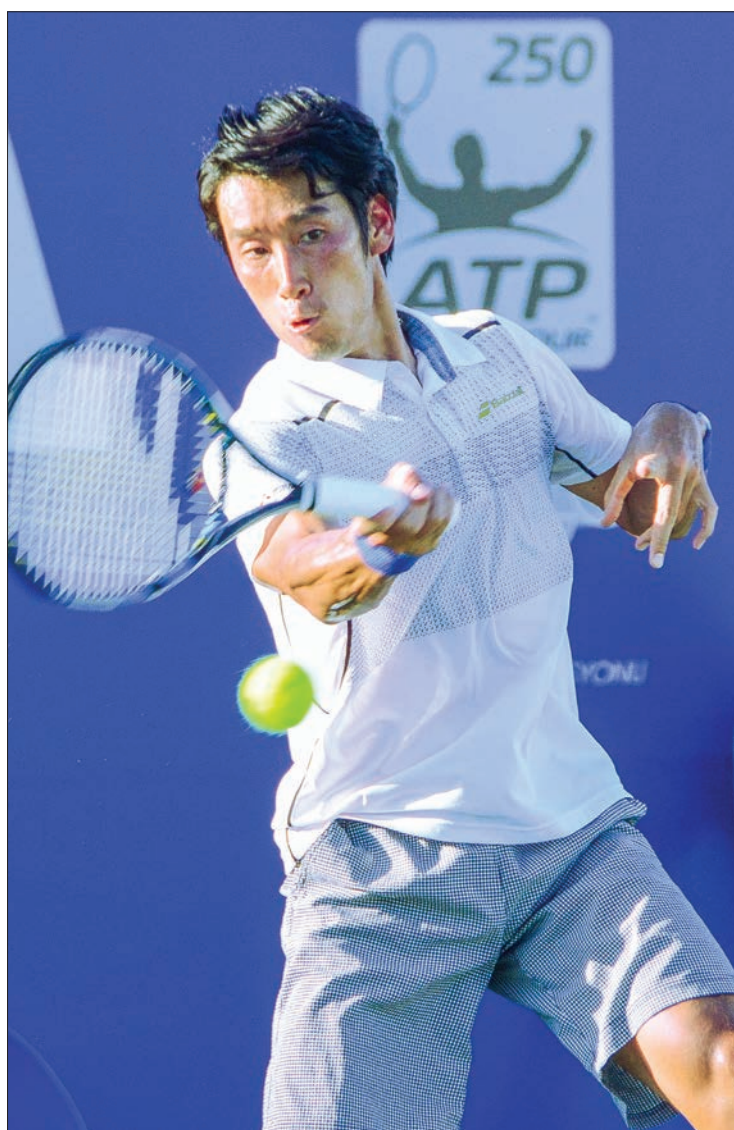
Yuichi Sugita of Japan hits a forehand during the Antalya Open final against Adrian Mannarino of France in Antalya, Turkey, on 1 July, 2017.

Wimbledon and the Antalya Open are among the seven grass court tournaments on the ATP World Tour. "This is where I have to win. I felt myself bracing the moment I set foot in the facility (in Wimbledon)," he said.—Kyodo News ■