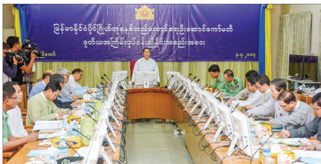
Vice President U Myint Swe addresses at the second coordination meeting of Steering Committee to Setup a Myanmar Owned Satellite System.

After the Vice President's visit, the Union Minister for Transport and Communications U Thant Sin Maung, who is leading the satellite purchase plan, lead the strategy meeting.—Myanmar News Agency ■