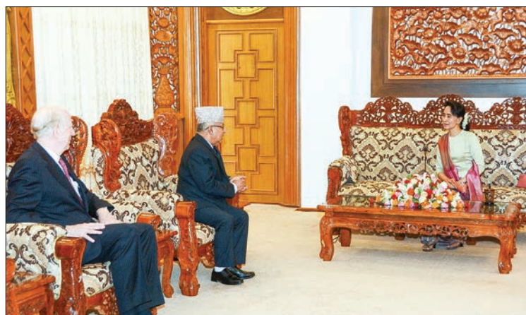
State Counsellor Daw Aung San Suu Kyi holds talks with Mr. Madhav Kumar Nepal, Member of Parliament of Nepal in Nay Pyi Taw.