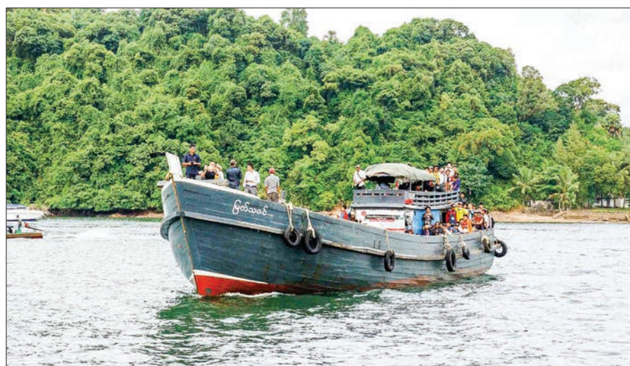
Myanmar migrant workers are seen on their way back home.

Finally, the Senior General said that making arrangements for the acquisition of rights, other supports including their living, education and health, are to be given to bereaved families and it must be done for taking news and information about weather conditions. Simultaneously, it is necessary for all to carry out search works up to the latest situation, expressed the Senior General.—Myanmar News Agency ■