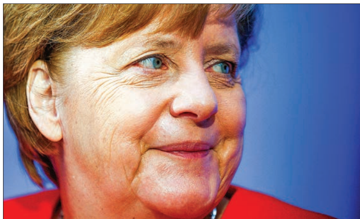
German Chancellor and head of the Christian Democratic Union (CDU) Angela Merkel.

As the countdown to the 24 September ballot continues, they hold a clear opinion poll lead over the centre-left Social