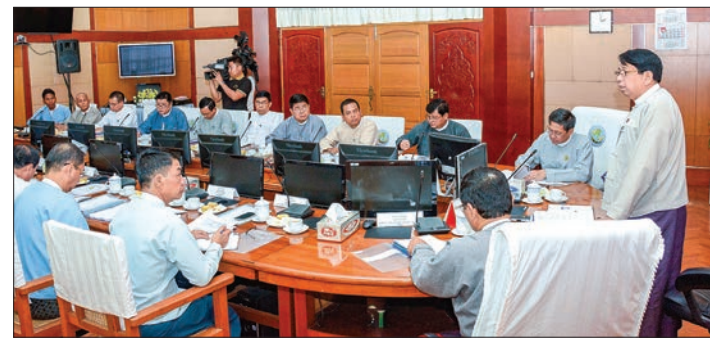
Union Minister for Information Dr. Pe Myint addresses at the meeting to organise an All-Round Development of Youth Fair.

His family has filed a case at the Pyin Phyu police station in the afternoon of 30 June and further investigation is ongoing by the police force.—Myanmar News Agency