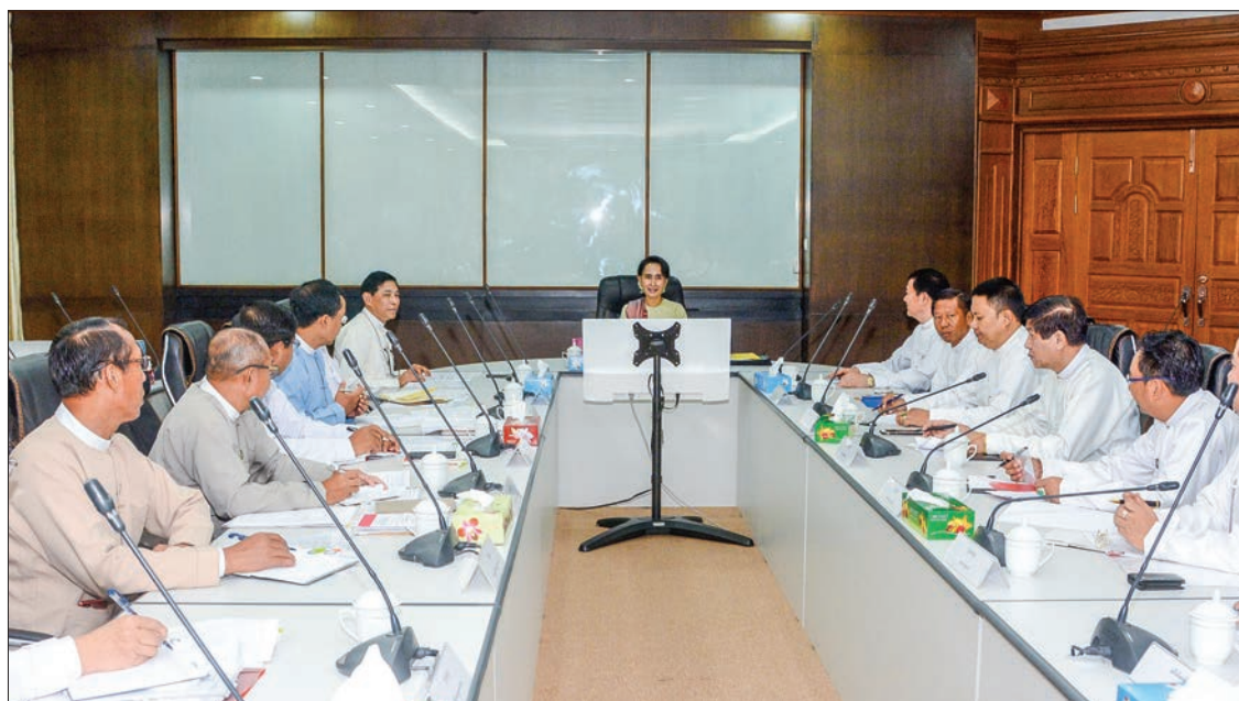
State Counsellor Daw Aung San Suu Kyi speaks to Myanmar Gems and Jewellery Entrepreneurs Association's chairman and officials in Nay Pyi Taw.

Present at the meeting were Deputy Minister for the President's Office U Min Thu, Deputy Minister for the Office of the State Counsellor U Khin Maung Tin and officials from the Ministry of Natural Resources and Environmental Conservation.—Myanmar News Agency ■