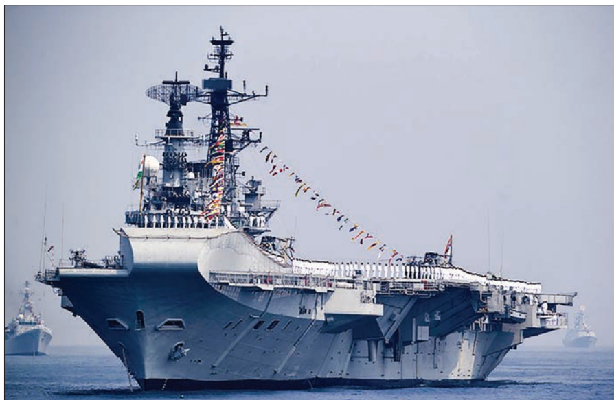
Indian aircraft carrier Vikramaditya.

maintained and timely repaired, it can serve for 40 and 50 years,” Vlasov added.