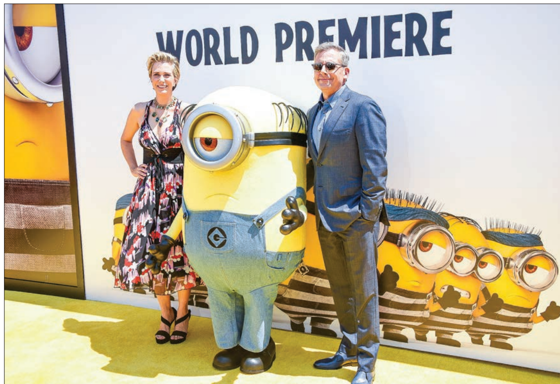
Cast members Kristen Wiig (L) and Steve Carell attend the premiere of 'Despicable Me 3' in Los Angeles, California, US on 24 June, 2017.

Starting with "Baby Driver," from Sony's TriStar Pictures, MRC, and Working Title. Edgar Wright's latest also appears to be his biggest box office hit, as it's