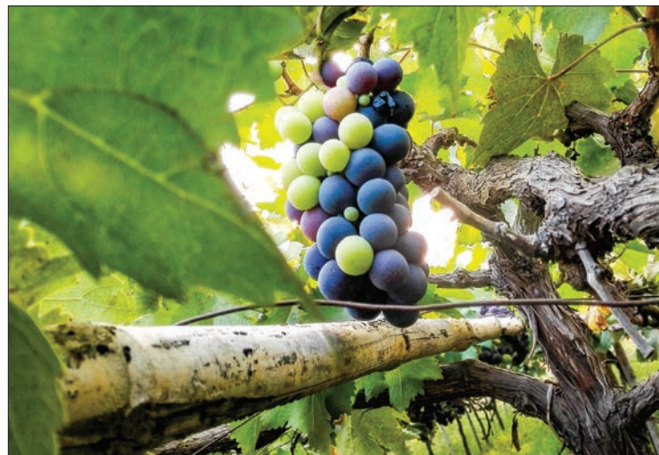
Grape seen at a farm in Yamethin.

The grapes are mostly grown in Kyaukpadaung, Meiktila, Mandalay, Sagaing, Monywa, Pakoku, Yenangyoung, Yamethin and Pyawbwe townships.—GNLM