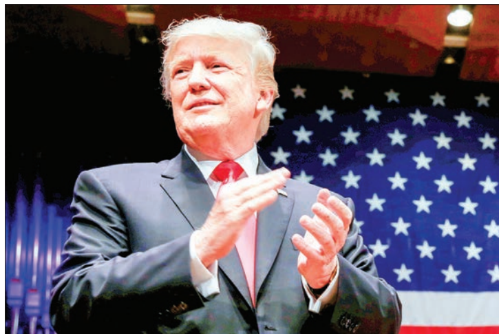
US President Donald Trump.

“They reaffirmed that the United States-Japan Alliance