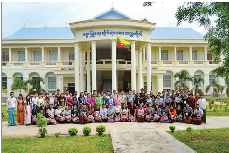
Students of veterinary medicine from 12 countries and teachers pose for a documentary photo.

The group will hold educational seminars, perform cattle and rabies vaccination, give medicine to get rid of parasitic worms, perform needed surgeries on animals and plant long-lived trees, among other projects.—GNLM ■