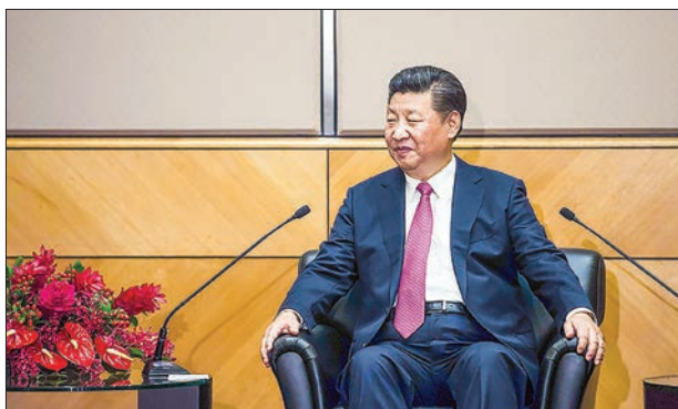
China's President Xi Jinping.

“Despite the impact of such adverse factors as a sluggish global economy and fluctuating prices for