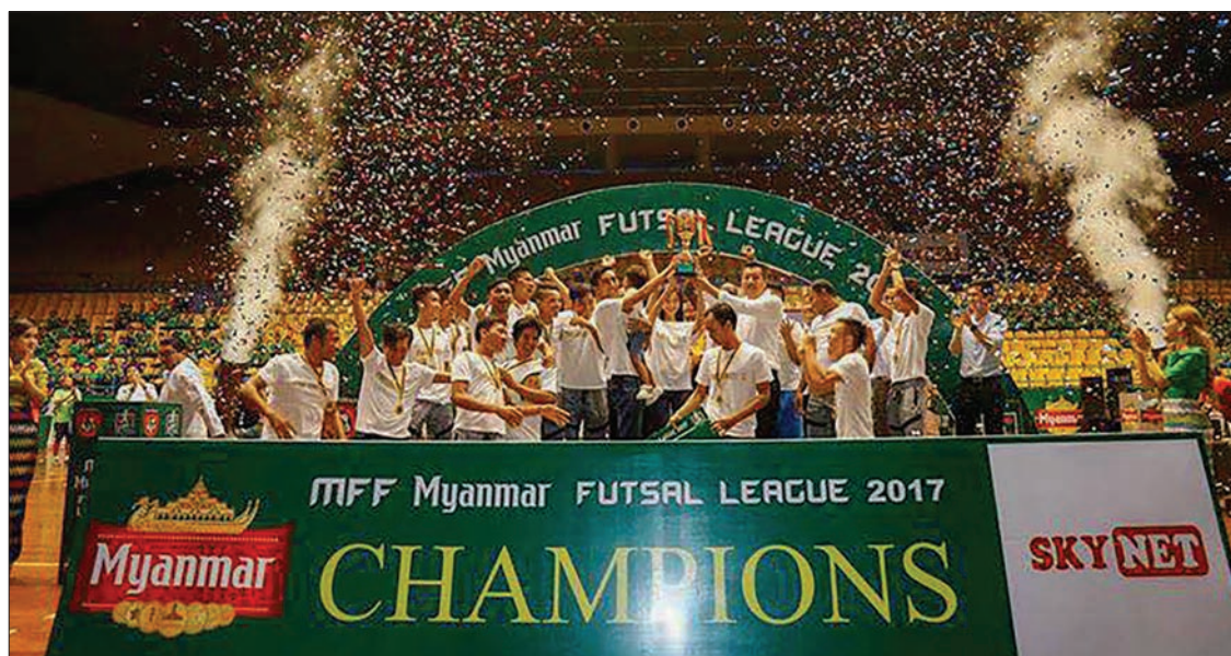
PU team seen together with MFF Futsal League champion cup rewarded in Myanmar last month.