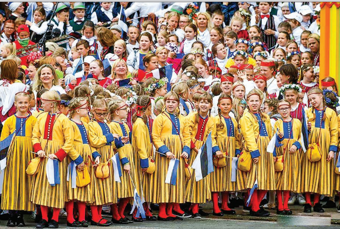
Children take part in the 12 th Estonian Youth Song and Dance Celebration in Tallinn, Estonia, on 2 July, 2017. The joint procession and song celebration Sunday ended the third day of the 12 th Estonian Youth Song and Dance Celebration under the theme of "Here I'll Stay". The theme of the 2017 celebration focuses on the connection between the younger generation and its land, culture and the older generations, meaning a turn to "our roots".