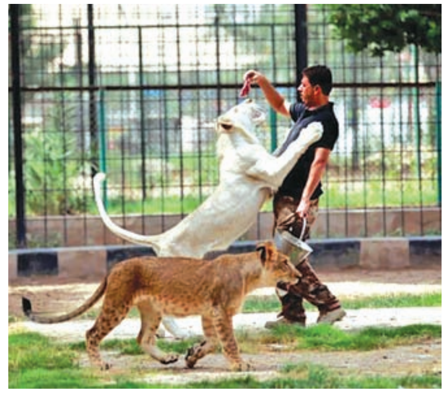
A keeper feeds a white lion at Al Zawra zoo in Baghdad, Iraq, on 15 June 2017.