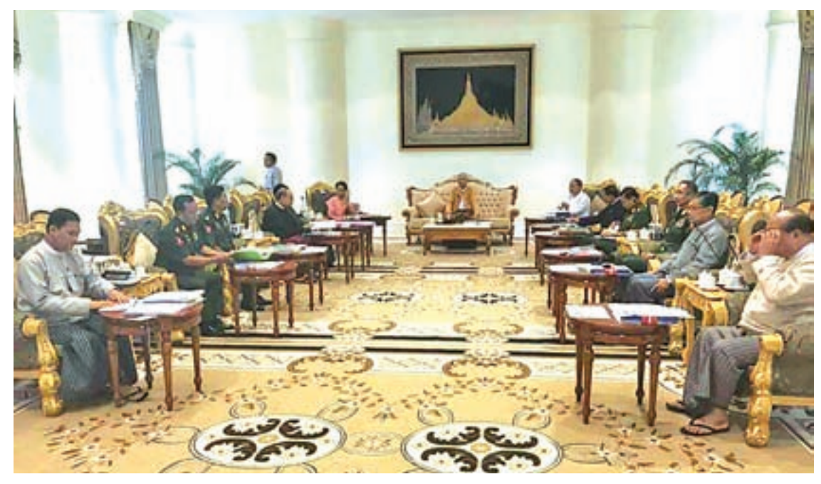
Special meeting on Rakhine issue is held at the Presidential Palace in Nay Pyi Taw.