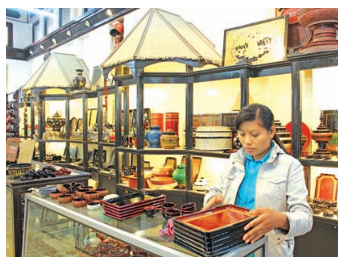
A woman prepares lacquerware at her shop in Bagan.