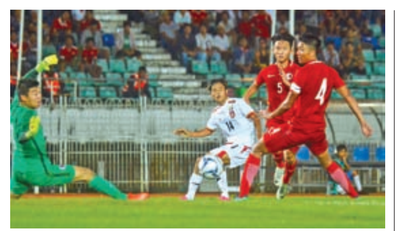
Hong Kong U-22 goal keeper vied for football clearance in yesterday match with Myanmar U-22.

Although Myanmar had chances to score, Myanmar strikers could not convert as Hong Kong's defenders cleared well. The first half ended with no goals scored. In the second half, Myanmar changed tactics and concentrated their efforts into offense. The Myanmar midfielder