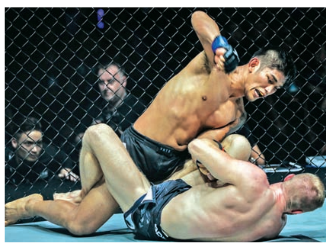
Aung La N Sang fights with Vitaly Bigdash during ONE Championship at Thuwunna National Indoor Stadium in Yangon yesterday night.

AUNG La N Sang gave Vitaly Bigdash an early beating in today's "ONE Championship 56: Light of a Nation" headliner. That was all the Myanmar native needed. He rode the momentum of the early high all the way to the end and claimed the middleweight championship to send the crowd into frenzy.