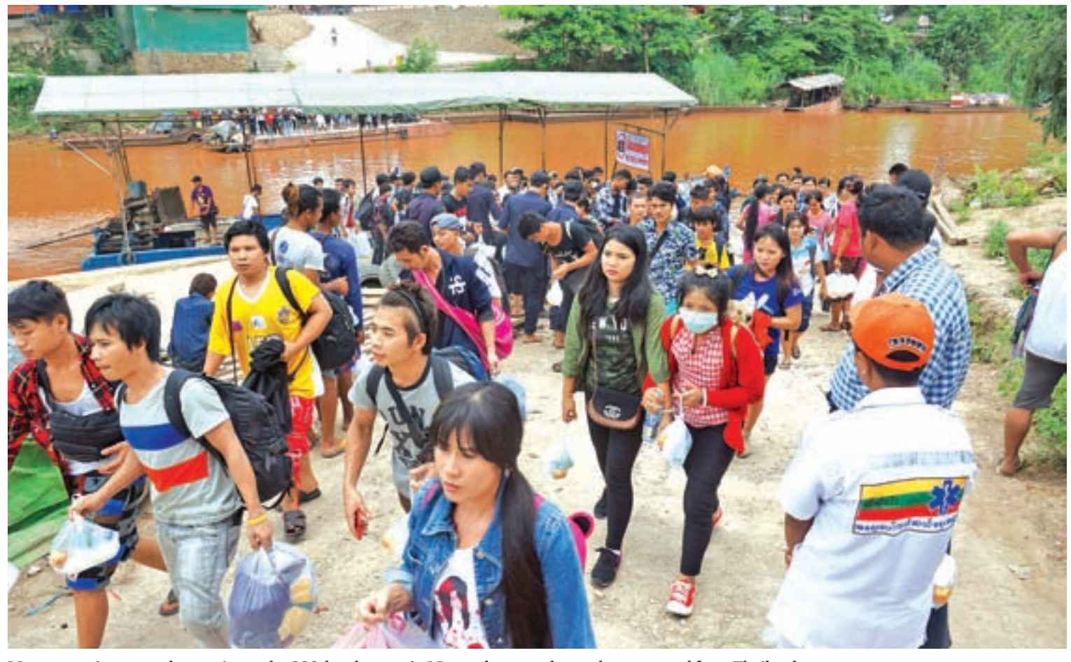
Myanmar migrant workers arrive at the 999 border gate in Myawady yesterday as they returned from Thailand.

Undocumented migrants are sometimes subject to exploitation by employers and cases of forced labour have been found by the media and Thai-