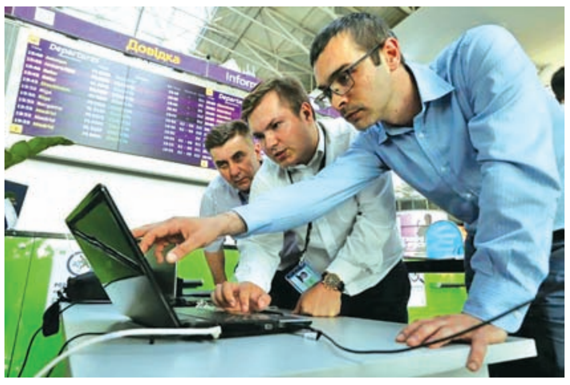
Technicians work on a flight timetable for the airport's site at the capital's main airport, Boryspil, outside Kiev, Ukraine, on 27 June 2017.

Cyber security firms are trying to piece together who was behind the computer worm, dubbed NotPetya by some experts, which has paralyzed thousands of machines worldwide, shutting down ports, factories and offices as it spread through internal organizational networks to an estimated 60 countries. Ukrainian politicians were quick on Tuesday to blame Russia, but a Kremlin spokesman dismissed "unfounded blanket accusations". Kiev has accused Moscow of two previous cyber strikes on the Ukrainian power grid and other attacks since Russia annexed Crimea in 2014. A growing consensus