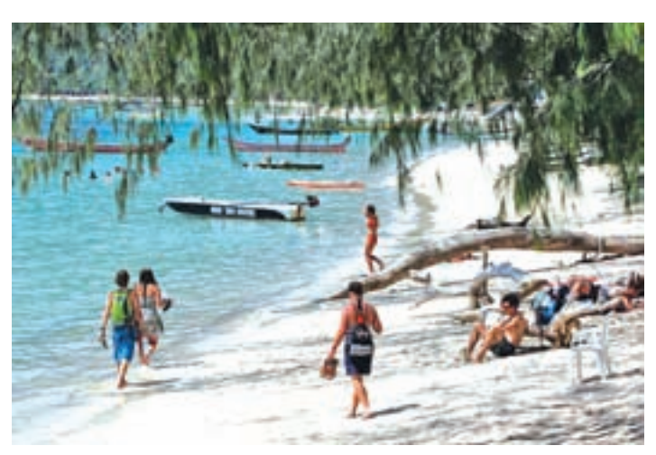
Tourists enjoy on a beach at the island of Koh Tao, Surat Thani Province, Thailand, on 19 September 2014.