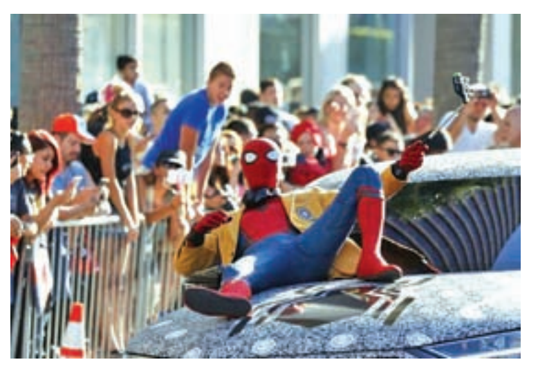
Fans watch as stars from the movie arrive in Los Angeles, California, on 28 June 2017.

LOS ANGELES — Fans were crawling up the walls with excitement as the stars of "Spider-Man: Homecoming" swung into the wider Marvel Cinematic Universe series of films, which have dominated the global box office for years.