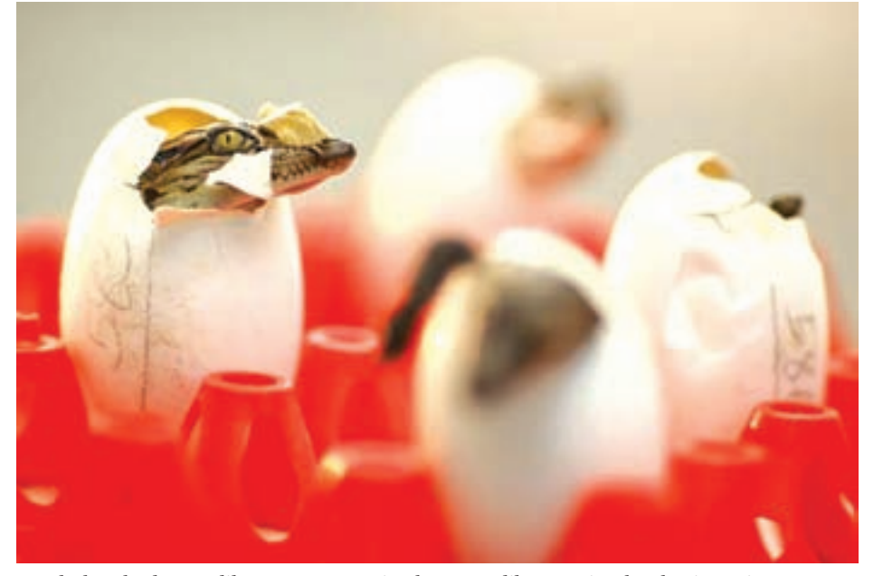
Newly-hatched crocodiles are seen at Sriracha Crocodile Farm in Chonburi province, Thailand, on 20 June 2017. PHOTO: REUTERS

The industry has been facing a setback as exports of Thai crocodile leather products fell more than 60 percent in 2016 to 13 million baht from 34 million baht in 2015, commerce ministry figures show. —Reuters