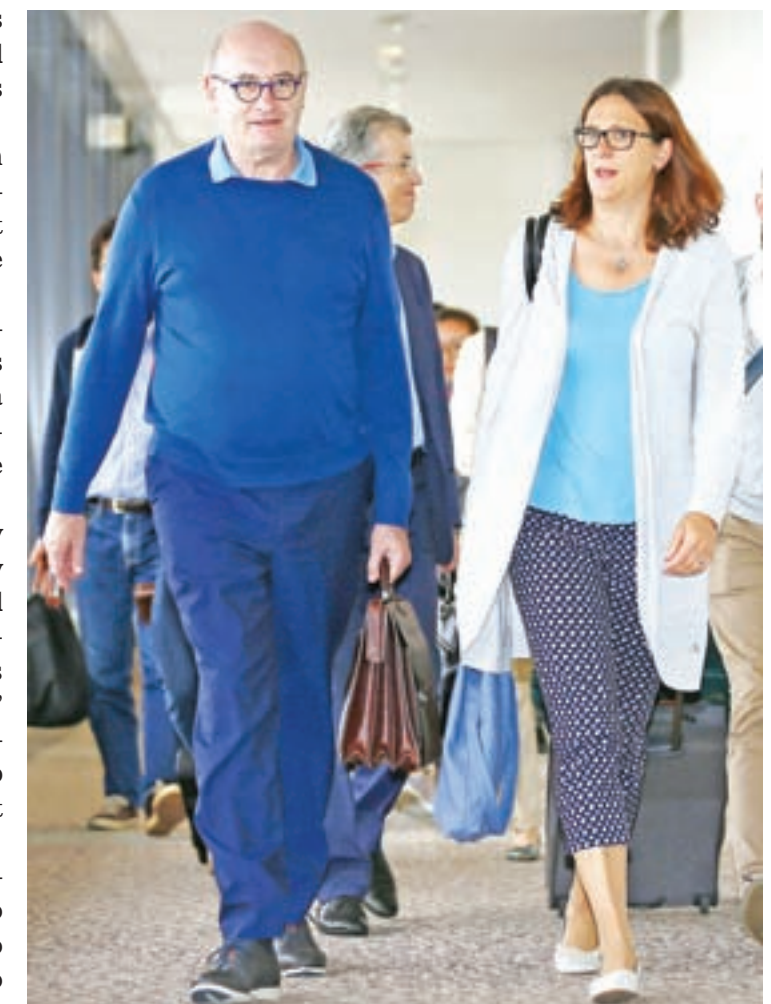
European Union Trade Commissioner Cecilia Malmstrom (R) and EU Agriculture and Rural Development Commissioner Phil Hogan arrive at Narita airport, near Tokyo, on 30 June 2017, to attend final-stage talks for a broad bilateral free trade agreement.

Japan and the European Union say they hope to strike the free trade deal to send a strong message to countries leaning towards a more protectionist stance while demonstrating the importance of free and fair trade based on high-level rules. —Kyodo News