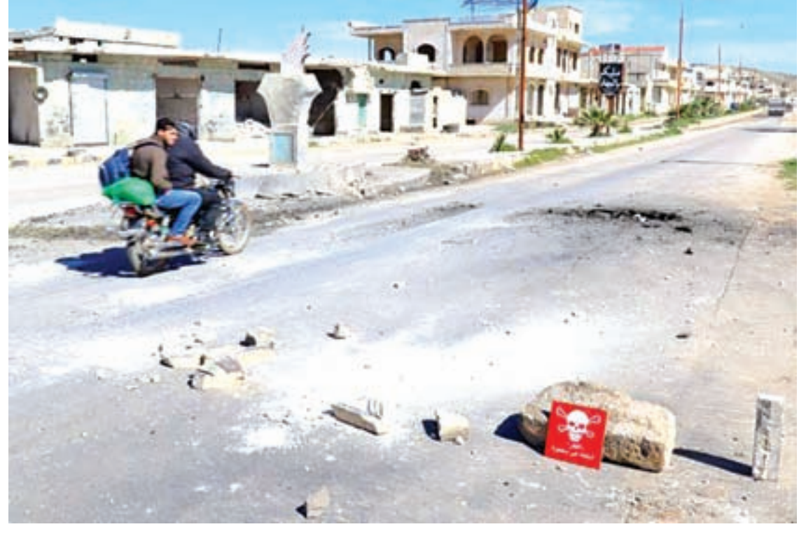
Men ride a motorbike past a hazard sign at a site hit by an airstrike on Tuesday in the town of Khan Sheikhoun in rebel-held Idlib, Syria, on 5 April 2017. The hazard sign reads, "Danger, unexploded ammunition".

"It is the conclusion of the FFM that such a release can only be determined as the use of sarin, as a chemical weapon," a summary of the report said.