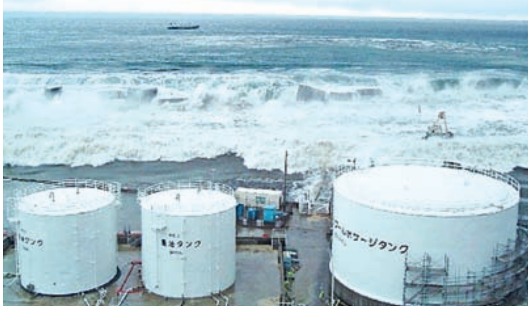
File photo taken 11 March 2011, shows a tsunami rolling into the Fukushima Daiichi complex in northeastern Japan, destroying its seawalls. Former top officials of Tokyo Electric Power Co. went on trial on 30 June 2017, over the nuclear disaster at the plant, pleading not guilty.

After the prosecutors' decision was overturned by an inquest of prosecution made up of ordinary citizens for a sec-