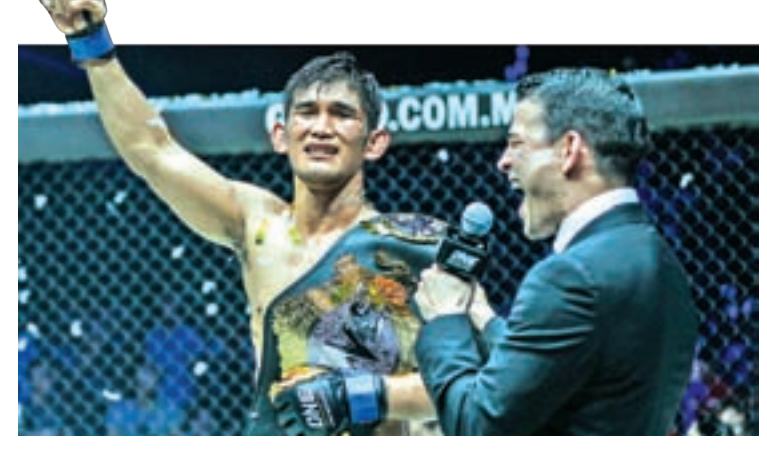
One champion Aung La N Sang celebrates after winning the middleweight title at Thuwunna National Indoor Stadium in Yangon yesterday night.