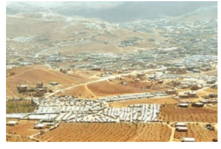
A general view shows Syrian refugee camps dotted in and around the Lebanese town of Arsal, near the border with Syria, Lebanon in 2016.

A number of attacks in Lebanon in recent years have been linked to the war in Syria, where Lebanese Shi'ite group Hezbollah is fighting in support of President Bashar al-Assad. —Reuters