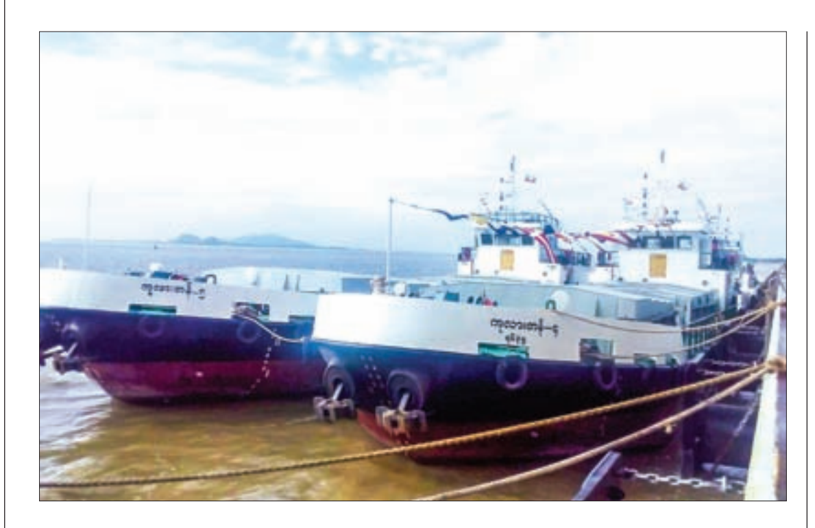
Six Cargo vessels are handed over to Myanmar at the Sittway port.

Nearly 2516 Myanmar workers including initial 1546men and 970women arrived back in Myawady till 4p.m. on June 29.—Htain Linn Aung (IPRD) ■