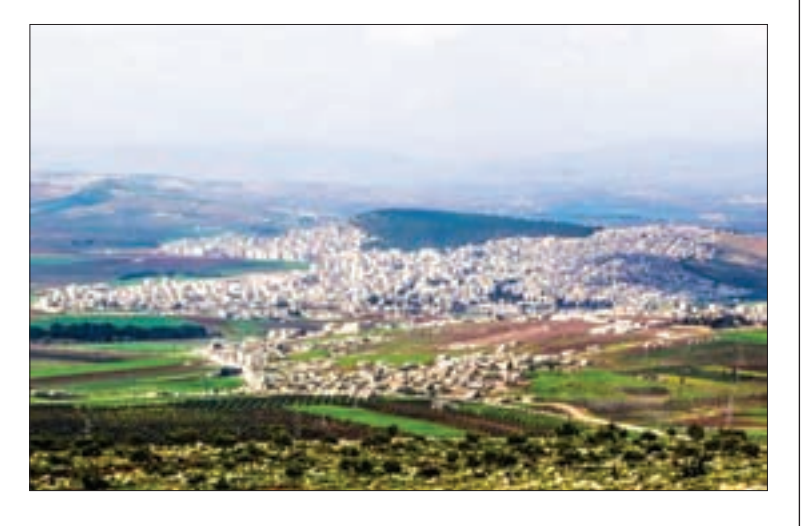
A general view shows the Kurdish city of Afrin, northwest Syria on 18 March 2015.

Asked about the chances of greater confrontation between the SDF and Turkish forces in the area north of Aleppo, Mansour said: "Certainly there is a big possibility of open and fierce confrontations in this area, par-