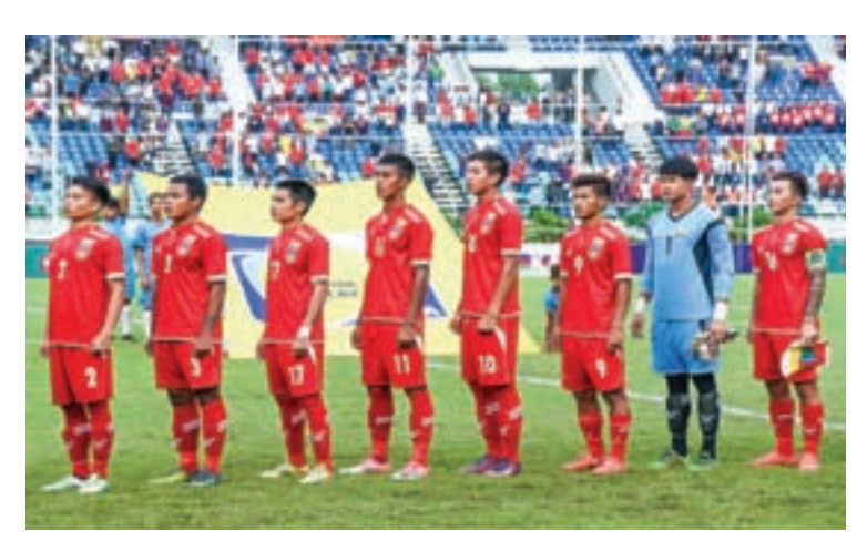
Myanmar players seen before a match.

The Hong Kong team is considered better than the team from Cambodia, which