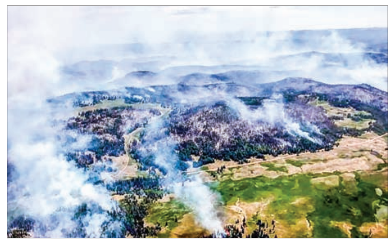
An aerial photo of wildfires burning across almost 50,000 acres near the ski resort of Brian Head, about 245 miles south of Salt Lake City, Utah is shown in this handout photo provided on 27 June 2017.