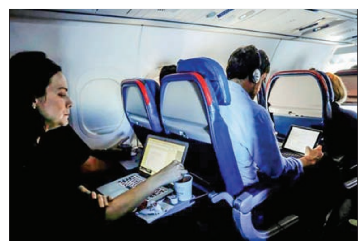
Passengers use their laptops on a flight out of John F. Kennedy (JFK) International Airport in New York, US, on 26 May 2017.

The decision not to impose new laptop restrictions eases US and European airlines' concern that expanding the ban to Europe or other locations could cause major logistical problems and