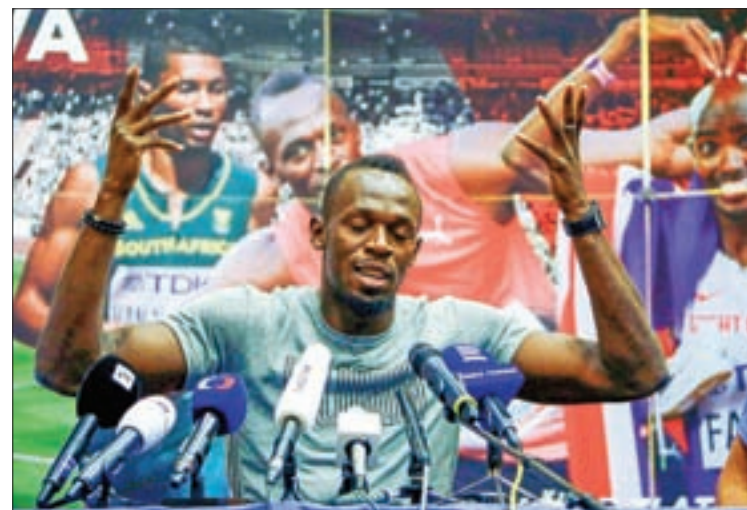
Jamaican sprinter Usain Bolt reacts during a news conference before the Ostrava Golden Spike athletics meeting in Ostrava, Czech Republic on 26 June, 2017.