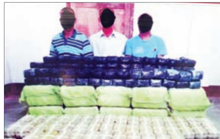
Yaba worth Ks 5.2 million seized during first six months of 2017.

Currently, the counternarcotics forces are conducting drug prevention training courses in Rakhine State wards and villages.—Myint Maung Soe ■