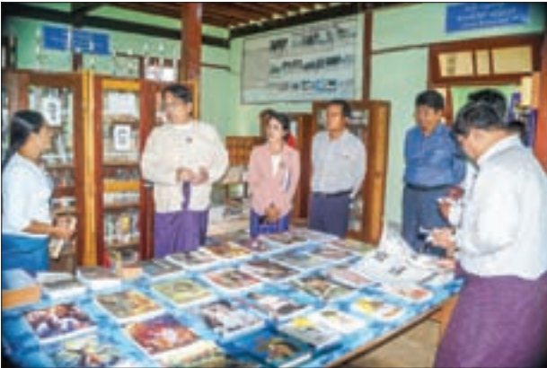
Union Minister Dr Pe Myint visits the library at the Pekhon Township IPRD.

Union Minister for Information Dr. Pe Myint inspected Pekhon Township Information and Public Relations Department (IPRD) office and met with the staff yesterday morning. The Union Minister viewed the traditional utensils of ethnic people displayed in the library hall of the IPRD office and inspected the reading room for children at the library. Afterwards, the Union Minister met with office staff and gave remarks on making the library as a place that is frequented by locals, office staff to become familiar with locals, increase their capabilities and work diligently.—Ko Htwe (Pekhon), Maung Maung Htwe (IPRD) ■