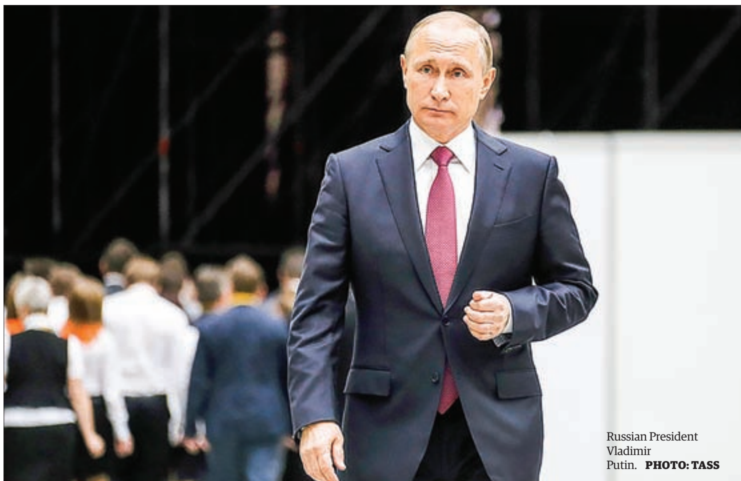
Russian President Vladimir Putin.