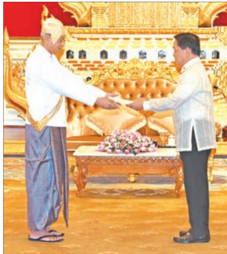
The newly-accredited Ambassador of the Republic of the Philippines presents his credentials to President U Htin Kyaw.