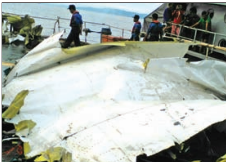
Photos show wreckage of Y-8 military transport plane found by Tatmadaw naval vessels, civilian fishermen, military divers.

Additional pieces of aluminium believed to be parts of the fuselage were discovered yesterday evening, according to the Ministry of Defence.—Myanmar News Agency ■