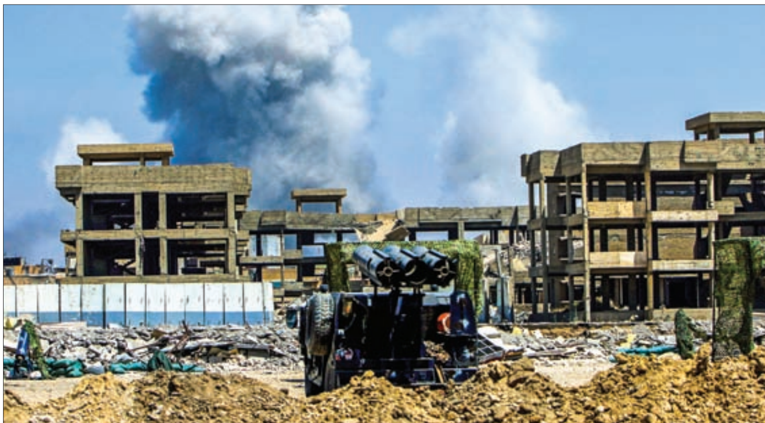
Smoke rises from clashes in the Old City of Mosul, Iraq on 27 June, 2017.