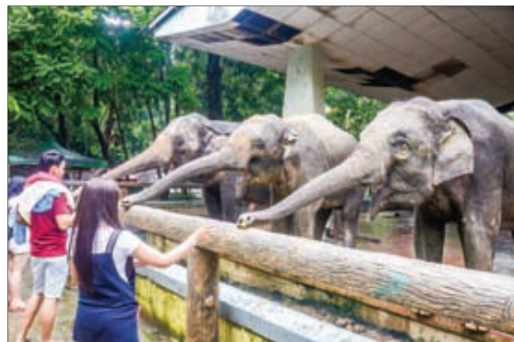
Visitors feeding elephants at Yangon Zoological Garden.

Nationally, Myanmar has set aside 9,205 square miles for elephant sanctuaries. Local and international non-governmental organizations are also planning to expand the amount of land dedicated to wildlife reserves in Myanmar. Mingalar Myanmar, a local NGO, and an elephant conservation organization from Australia have announced plans to establish an elephant reserve in Myanmar.— City News ■