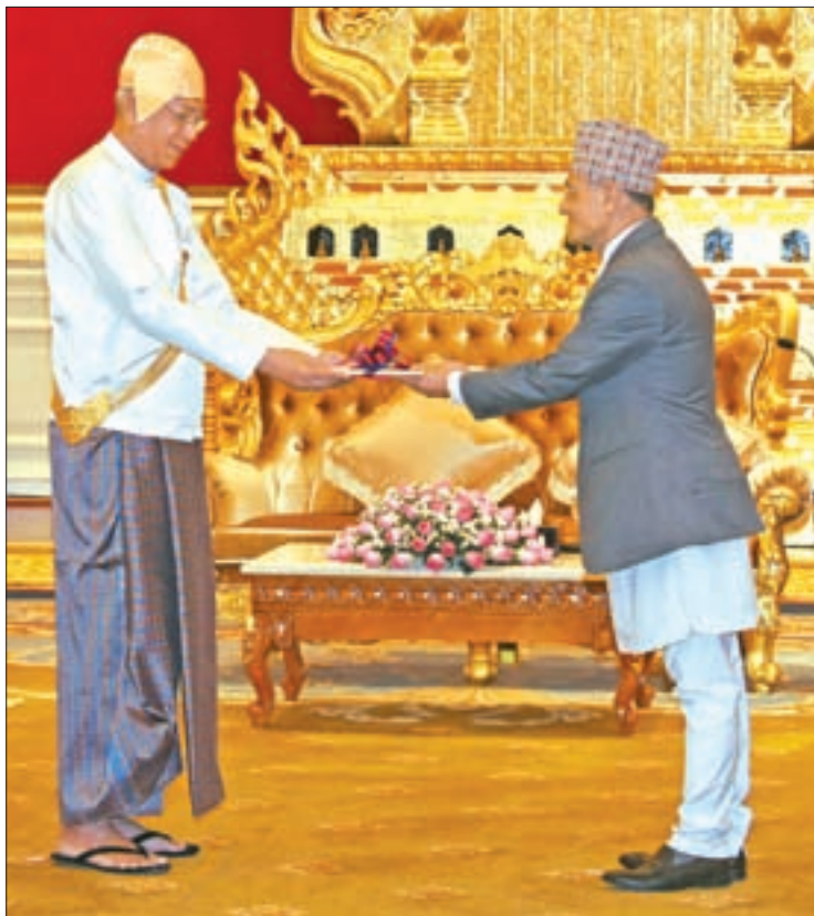
The newly-accredited Ambassador of Nepal presents his credentials to President U Htin Kyaw in Nay Pyi Taw.

Present on the occasion were Minister of State for Foreign Affairs U Kyaw Tin and Director-General U Thant Sin of the Protocol Department.—Myanmar News Agency ■