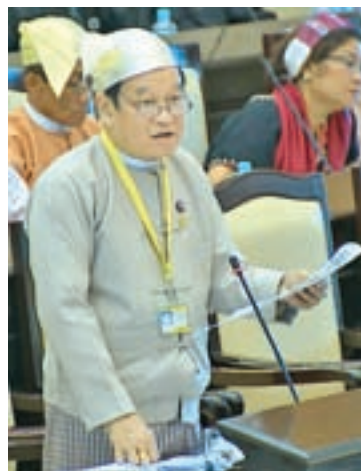
Union Minister for Health and Sports Dr Myint Htwe.

Union Minister for Health and Sports Dr Myint Htwe replied that a cost sharing system was introduced to reduce the people's health care cost before the National Health Insurance System