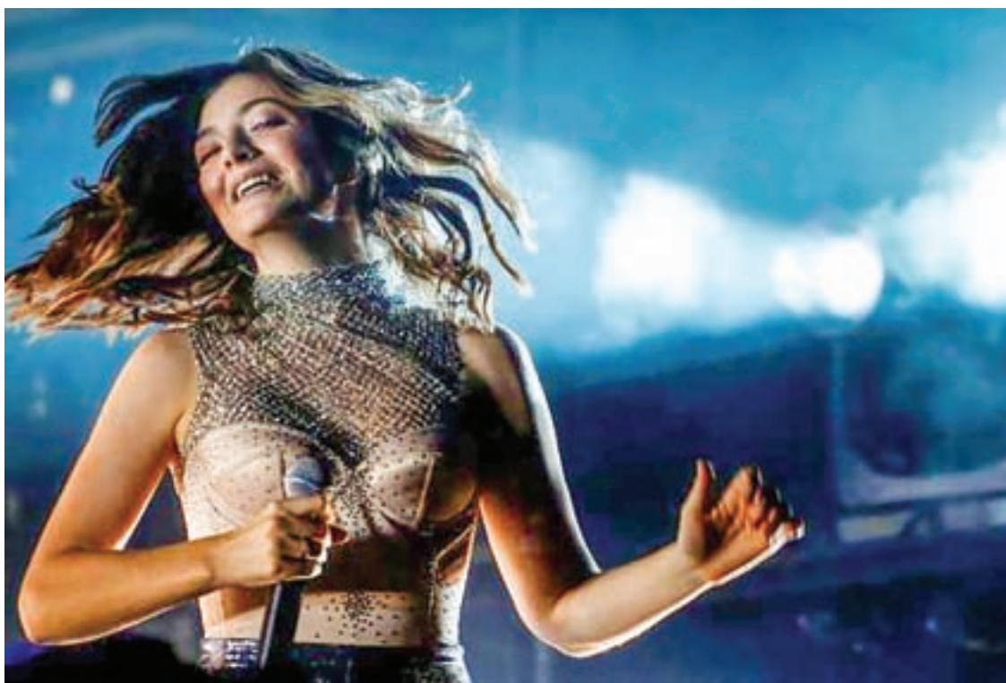
Lorde performs during the Coachella Valley Music and Arts Festival in Indio, California, US on 16 April, 2017.