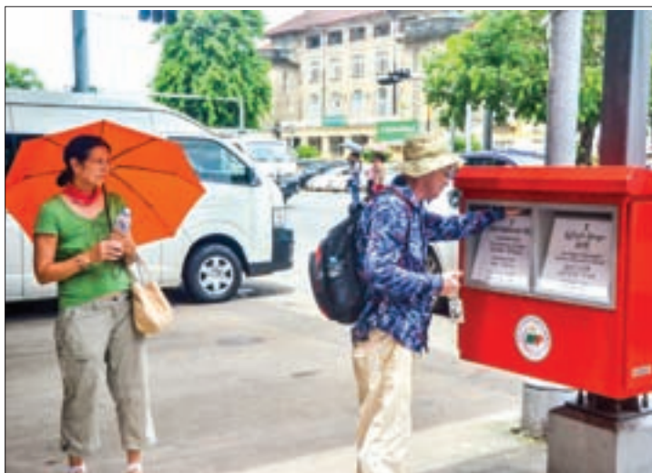
A pedestrian puts a letter into Myanmar Renewal Post Box at Strand Road in Yangon.

Ministry of Internal Affairs and Communication of Japan contributed for Post-