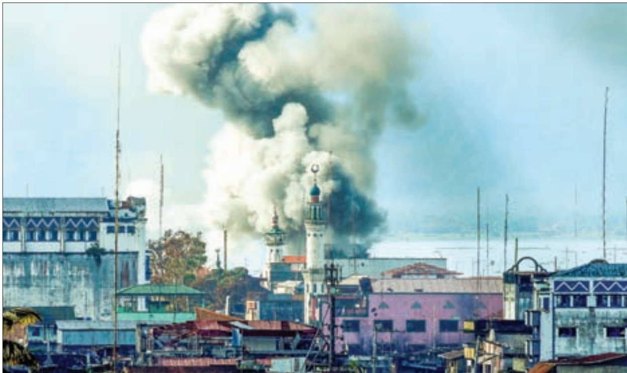
An explosion is seen after a Philippines army aircraft released a bomb during an airstrike as government troops continue their assault against insurgents from the Maute group in Marawi city on 27 June, 2017.

The Philippine Daily Inquirer reported that Abdullah Maute, one of two brothers who formed the militant group carrying their name, had told religious emissaries on Sunday that he wanted his mother and father freed in