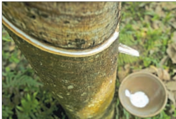
Rubber latex is collected in a bowl at plantation.