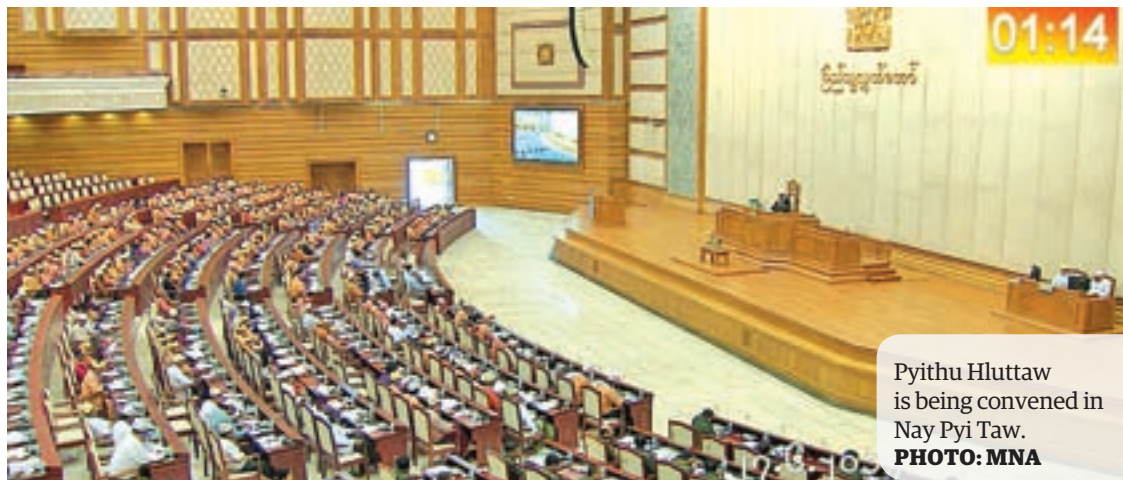
Pyithu Hluttaw is being convened in Nay Pyi Taw.