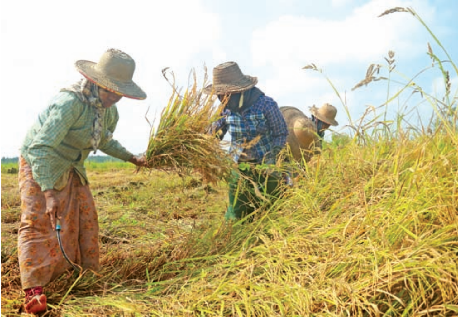
The agriculture sector is among the 10 investment areas prioritised by the government yesterday.