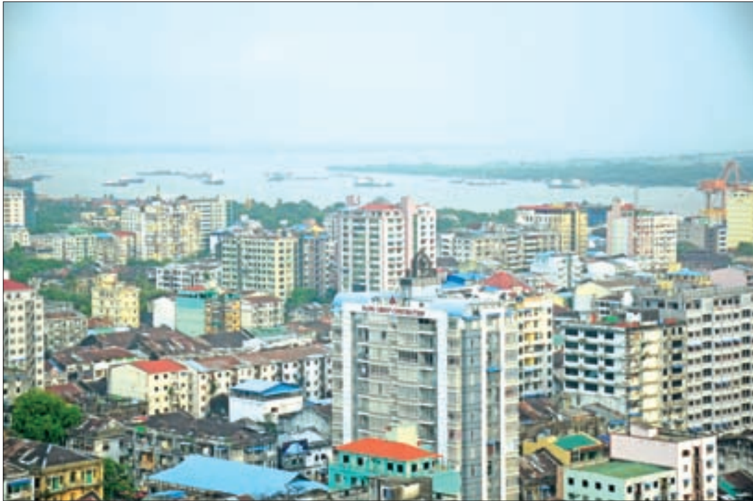
Real estate recorded high prices in downtown Yangon. File photo taken on 20 May 2017.