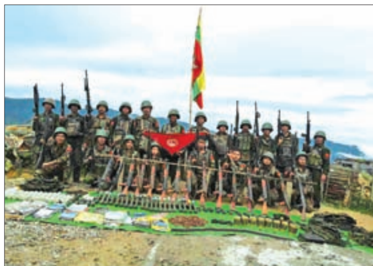
Tatmadawmen celebrate after conquering TNLA training camp.

SEVERAL Tatmadaw officers and troops and four men of an ethnic armed group were killed over a six-day period during fierce fighting that began last week after the discovery of a Ta'ang National Liberation Army (TNLA) training camp in northeast Shan State. The fighting began when Tatmadaw columns, acting on a tip-off, conducted a search on 20 June and discovered a hidden TNLA training camp about 2,000 meters northeast of Manlan village, Namsang Township in Shan State.