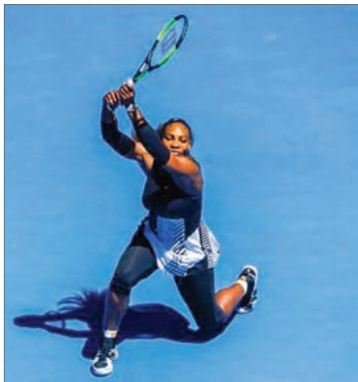
Serena Williams of the US hits a shot during her Women’s singles quarter-final match against Britain’s Johanna Konta at Melbourne Park in Melbourne, Australia on 25 January, 2017.

Williams has won the most grand slam singles titles in the professional era, five more than Swiss Roger Federer, the most prolific winner in the men’s game. She is one short of Australian Margaret Court’s overall record of 24 grand slam titles, which were split between the professional and amateur eras.—Reuters