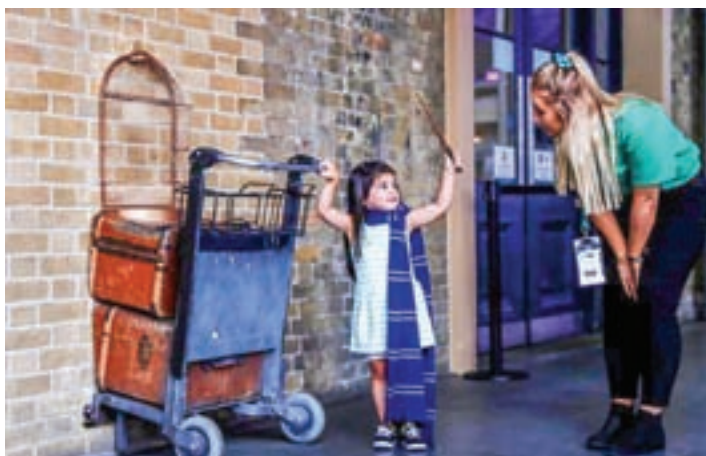
A girl waves a wand at the Harry Potter trolley at Kings Cross Station, in London, Britain on 26 June, 2017. The first Harry Potter book, ‘Harry Potter and the Philosopher’s Stone’ was first published 20 years ago.

LONDON — Twenty years to the day after the first book in the Harry Potter series was published, fans gathered online and in the real world to express their enduring love for JK Rowling’s magical creation.