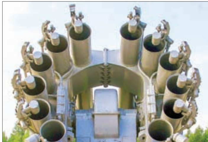
RPK-8 anti-submarine rockets.

This equipment will also be demonstrated at the International Maritime Defence Show.