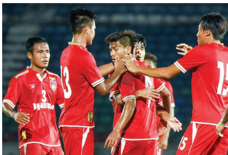
Myanmar football players celebrate during a match.