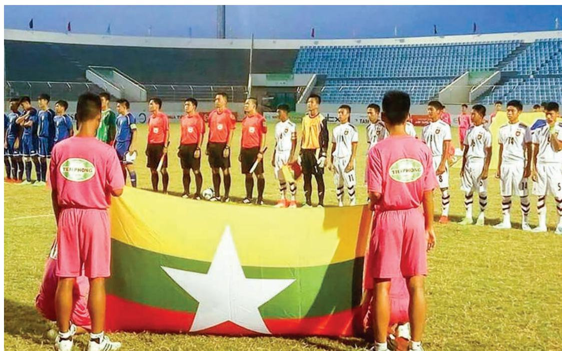
Myanmar youth players sing Myanmar's national anthem before a match.