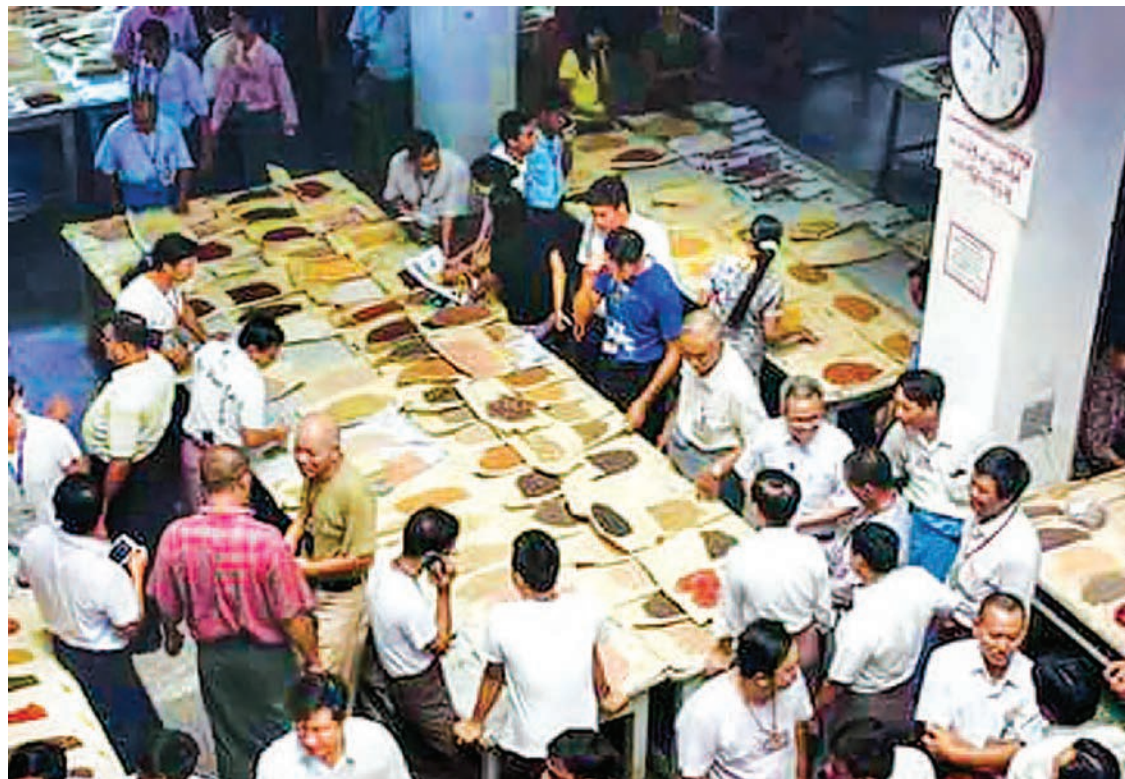
Mandalay vegetable market on decline despite unblocking of accounts.

A bag of white sesame seeds fetches Ks.110,000 while the price of black sesame seeds is Ks.115,000 a bag. The newly harvested sesame