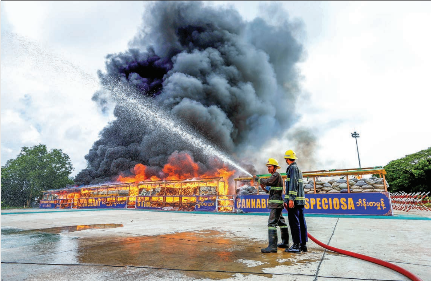
Firefighters prepare to distinguish fire after burning seized drugs at an event to mark International Day against Drug Abuse and Illicit Trafficking, outside Yangon, Myanmar, on 26 June, 2017.