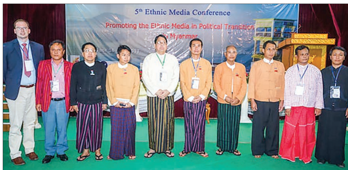
Participants of the 5th Annual Ethnic Media Conference in Loikaw.

The first day of the Fifth Annual Ethnic Media Conference opened with speeches and dances in Loikaw, Kayah State yesterday under the title "Promoting the Ethnic Media in Political Transition in Myanmar."