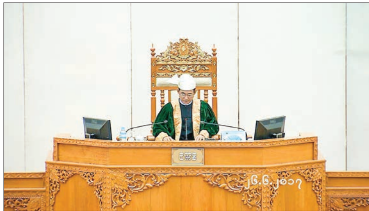
Pyithu Hluttaw Speaker U Win Myint.

Major-General Aung Soe, Deputy Minister for Home Affairs replied to the question raised by Daw Mar Mar Khaing of Thaton constituency, "Arrangements had been made in 3 steps to equip police forces with modern weapons and firearms used in suppressing riots instead of out-dated and moribund weapons being used presently. In the FY 2012-2013, only 102 long distance communication equipments were installed, with 869