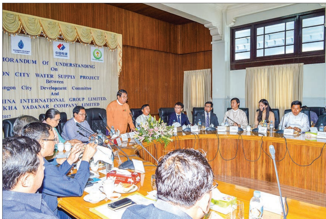
Mayor U Maung Maung Soe delivers opening address at the signing ceremony.

Memorandum of Understanding on Yangon City Water Supply Project between Yangon City Development Committee and POWERCHINA International Group Limited and Thu Kha Yadanar Company Limited was signed on 23rd June 2017.