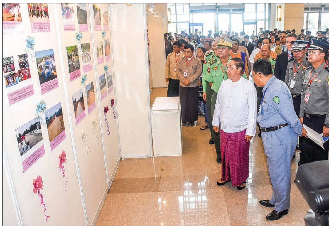
Vice President U Myint Swe views an exhibition commemorating the 2017 International Day Against Drug Abuse and Illicit Trafficking.

At the UN's 30th general assembly of the Special Session on World Drug Problem in 2016, a road map has been designed which incorporates public health and development. A drug report in Myanmar is being carried out with help from the United Nations Office on Drugs and Crime (UNODC) to help efforts in reducing drug addiction and drug production. A project for Community Base Treatment (CBT) is also being drafted and it will be used at the township level and