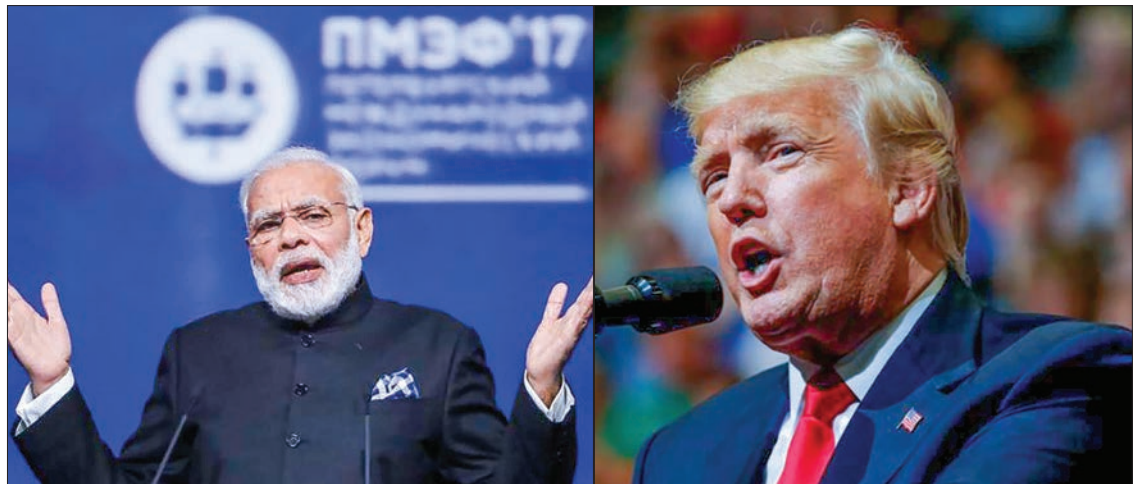
Indian Prime Minister Narendra Modi and US President Donald Trump.

They will have one-on-one talks followed by statements to the news media without taking