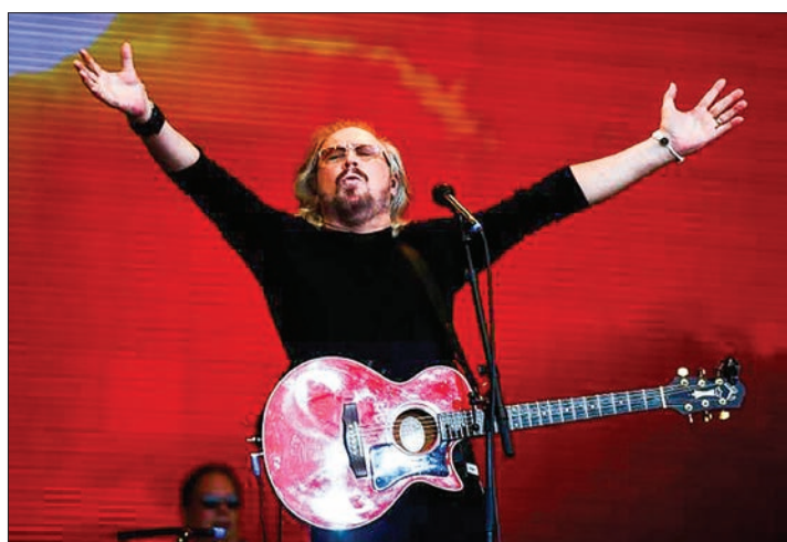
Barry Gibb performs on the Pyramid Stage at Worthy Farm in Somerset during the Glastonbury Festival in Glastonbury, Britain, on 25 June, 2017.

GLASTONBURY, (England) — Barry Gibb brought some Sunday afternoon fever to the legends slot at Glastonbury Festival when he entertained a huge crowd with Bee Gees hits “Stayin' Alive”, “How Deep is Your Love”, “Night Fever” and “Tragedy”.