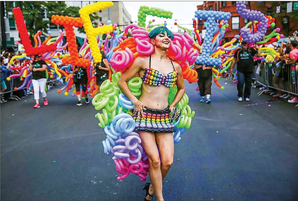
A participant takes part in the 48 th Annual Chicago Pride Parade in Chicago, the United States on 25 June, 2017.

The company's future programming plans include an adaptation of comedian James Corden's "Carpool Karaoke" segment from his CBS Corp (CBS.N) show that will begin airing in August.—Reuters ■