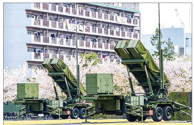
Ground-based Patriot Advanced Capability-3 interceptors remain on standby at the premises of the Defense Ministry in Tokyo at 11:18 am on 13 April, 2012, even though the North Korean rocket launch earlier in the morning ended in failure.

The Defence Ministry will request a budget for the next fiscal year from April 2018 necessary to prepare for Aegis Ashore deployment, according to the source. The current fleet of Maritime Self-Defence Force ships equipped with the Aegis missile defence system may not be enough to shield the country's entire territory against North Korean ballistic missiles if they are launched with a higher trajectory to make them fall faster and at a