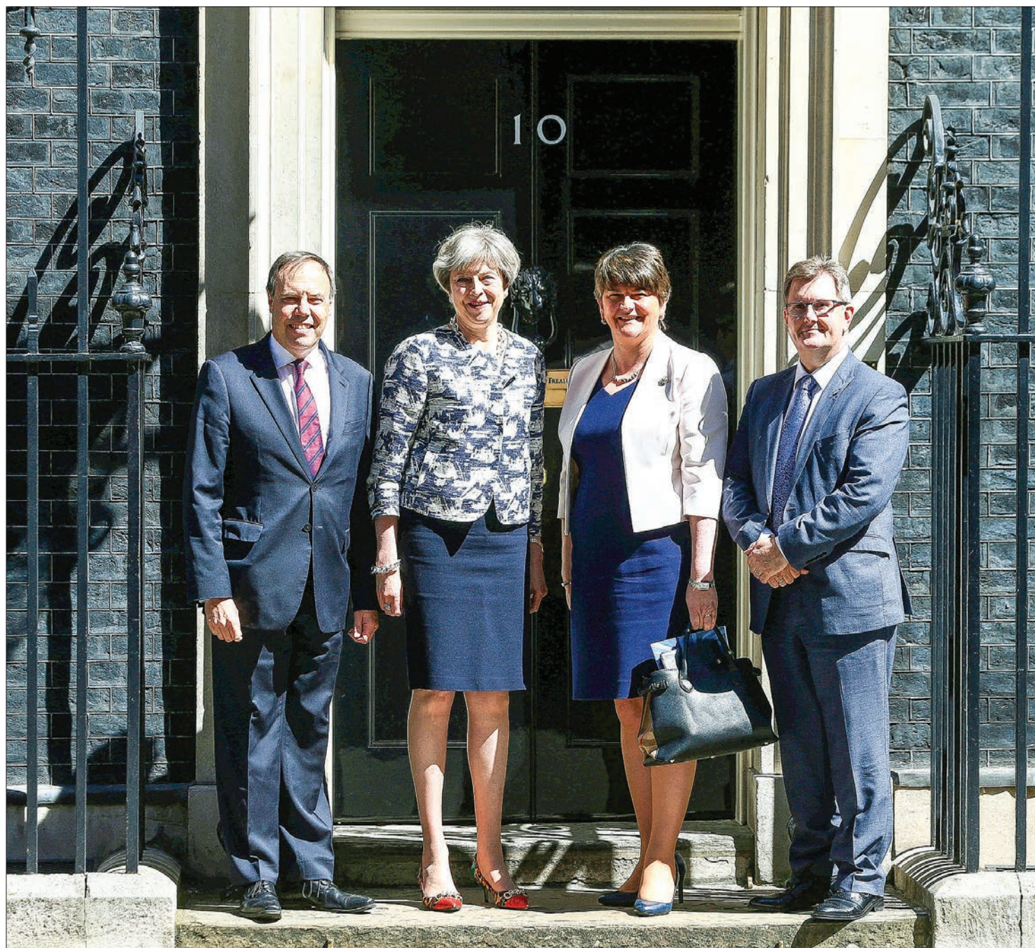
Britain's Prime Minister, Theresa May, poses for a photograph with Democratic Unionist Party (DUP) Leader Arlene Foster, Deputy Leader Nigel Dodds, and Chief Whip Jeffrey Donaldson, outside 10 Downing Street, in central London, Britain on 26 June, 2017.

The justices will hear Digital Realty Trust Inc's appeal of a lower court ruling in favour of an executive who the San Francisco-based company fired after he complained internally about alleged misconduct by his supervisor but never reported the matter to the US Securities and Exchange Commission. —Reuters ■