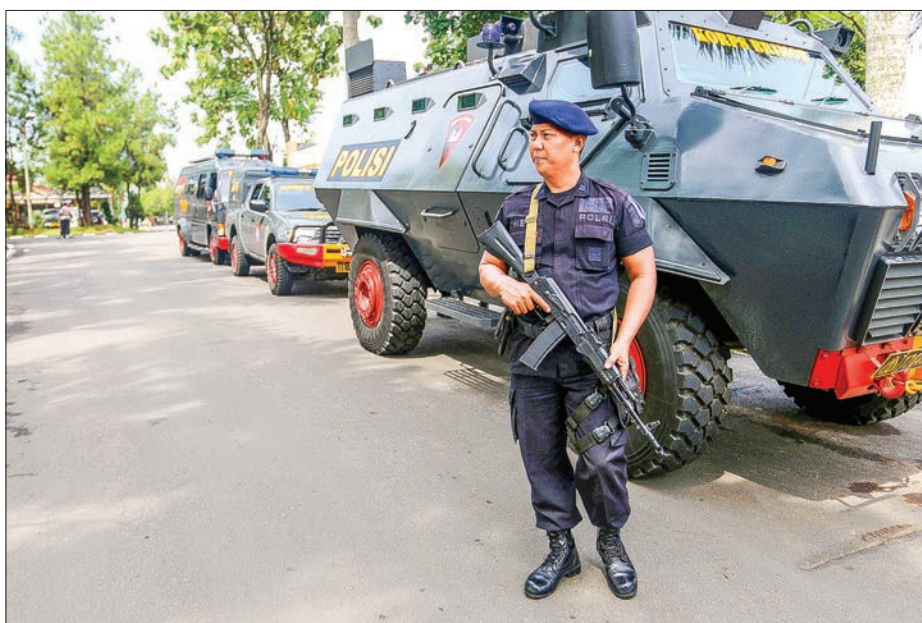
A Mobile Brigade Corps police officer stands guard by police vehicles, following an attack on a police post, that left one officer dead in Medan, Indonesia on 25 June, 2017.

Police believe the men were part of Jemaah Ansharut Daulah (JAD), an umbrella organization on a US State Department "terrorist" list