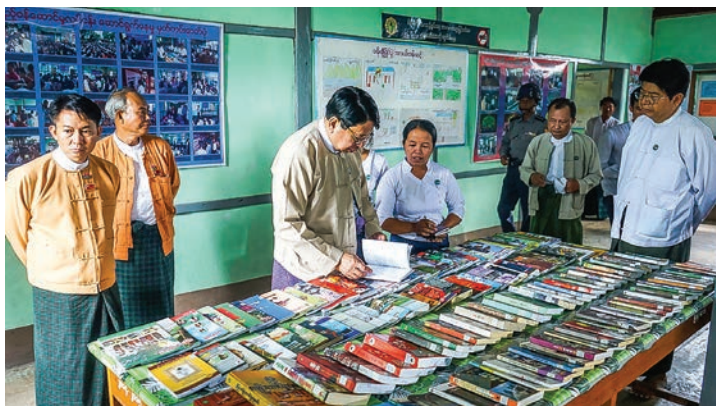
Union Minister for Information Dr. Pe Myint visits a public library during his visit in Loikaw.

Dr. Pe Myint encouraged the gathering to establish a public library and community centre in the long run to promote ethnic literature, culture and literacy. — State IPRD ■