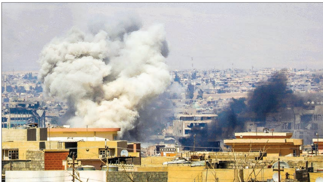
Smoke billows after an air strike by Iraqi forces towards the positions of the Islamic State militants in the Old City of Mosul, Iraq on 25 June, 2017.

The militants last week destroyed the historic Grand al-Nuri Mosque and its leaning minaret from which their leader Abu Bakr al-Baghdadi declared a caliphate spanning parts of Iraq and Syria three years ago. The mosque’s grounds remain under the militants’ control.