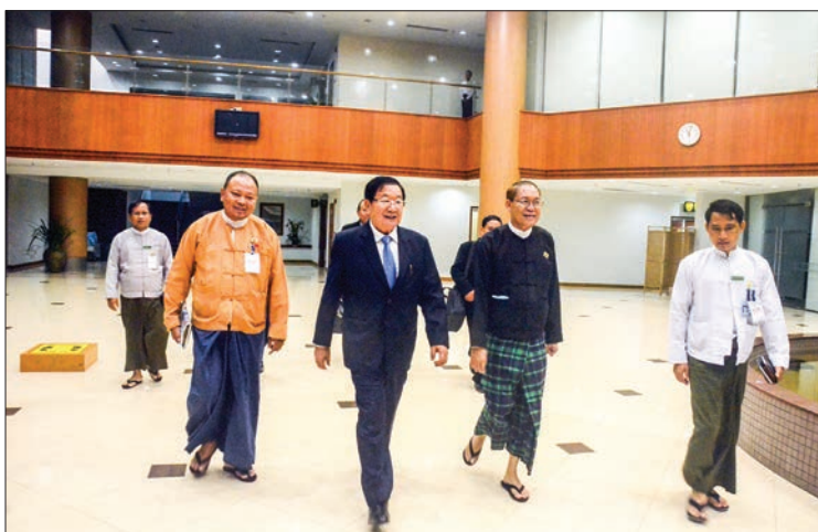
U T Khun Myat, Deputy Speaker of Pyithu Hluttaw, is seen off by officials as he leave for Seoul, South Korea.