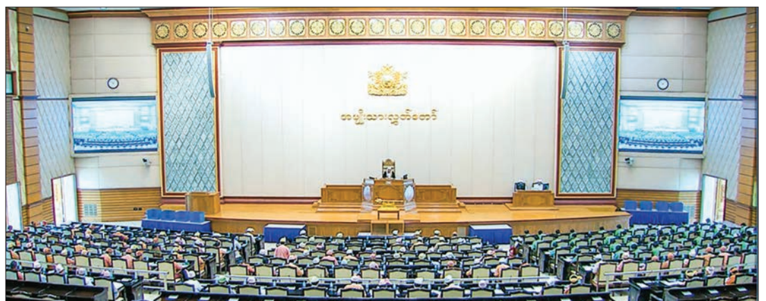
Amyotha Hluttaw is being convened in Nay Pyi Taw.

Oxygen concentrators were distributed to 39 central hospitals and at 36 state and region hospitals with 100 to 200 beds, according to Minister for Health and Sports Dr. Myint Htwe's address during yesterday's Amyotha Hluttaw meeting.