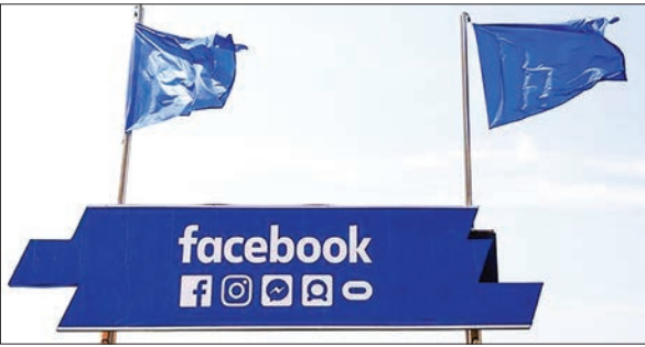
The logo of the social network Facebook is seen on a beach during the Cannes Lions Festival in Cannes, France, on 21 June, 2017.

Chicago celebrates Pride over two weekends. The weekend before the parade is Pridefest, a festival with music, costumes, food, and more celebration. The Pride festival and parade will return to Chicago next summer with more unique floats, costumes, and festivities.—Xinhua ■