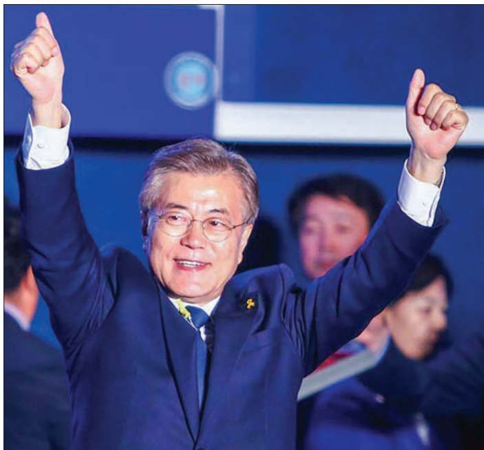
South Korean President Moon Jae-in.

The presidential special advisor said on 16 June that if the Democratic People's Republic of Korea (DPRK) stops any nuclear and missile provocations, the South Korea-US joint military exercises and the deployment of the US military strategic assets in South Korea could be scaled down