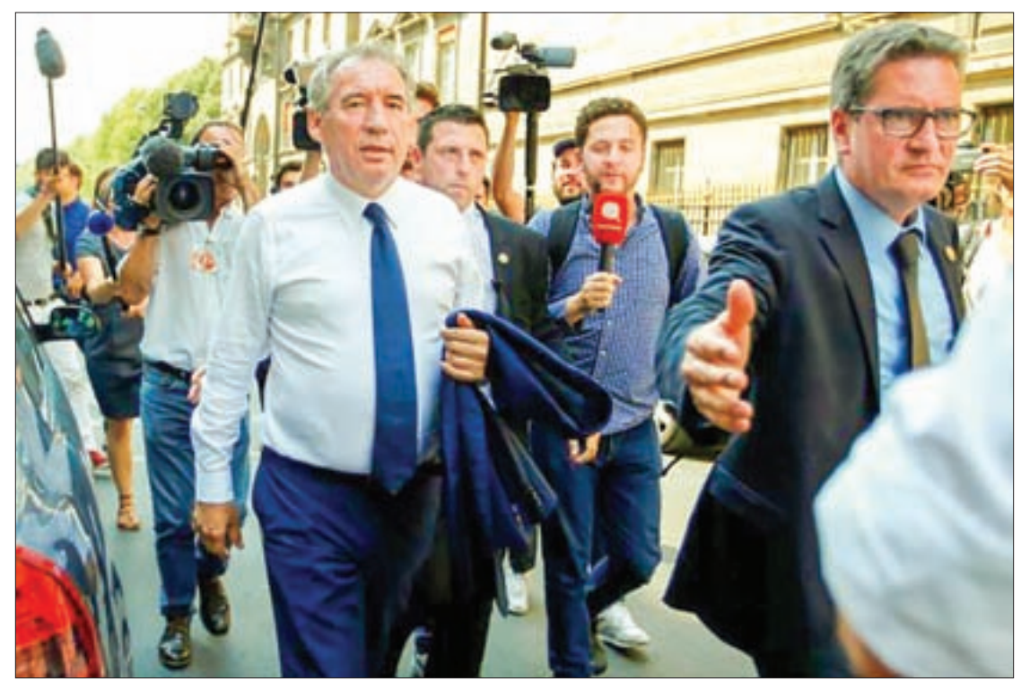
MoDem leader Francois Bayrou, outgoing Justice Minister, leaves after a meeting with his parliamentary group at the National Assembly in Paris, France, on 21 June 2017.

Macron's reshuffle, tapping more people from the non-political world, reflects the profile of