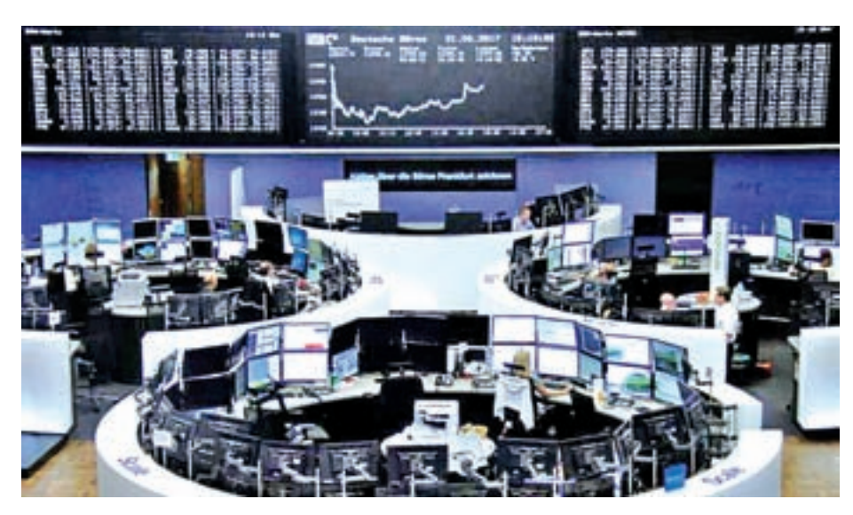
Traders work in front of the German share price index, DAX board, at the stock exchange in Frankfurt, Germany, on 21 June 2017.

Health care was the top-gaining sector, up 0.8 per cent with Switzerland's Novartis in the driving seat as its shares advanced 2.5 per cent, following a positive study result for its canakinumab medicine,