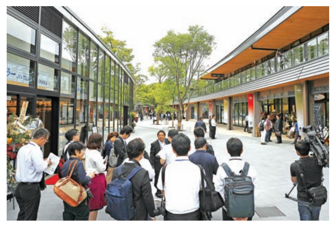
A new restaurant complex called Jo-Terrace Osaka opens on 22 June, 2017 in the park that houses Osaka Castle. The twostorey complex includes restaurants and coffee shops and is aimed at attracting domestic and overseas visitors.

"Hopefully this park will draw more visitors and continue to grow as an attractive regional tourism hub by showcasing a piece of history," Osaka Mayor Hirofumi Yoshimura said in a speech at the opening ceremony of the complex operated by a business consortium including Daiwa House Industry Co. Another similar complex is scheduled to open near the castle's main tower in October as local businesses and municipalities look to take advantage of the recent tourism boom. —Kyodo News ■