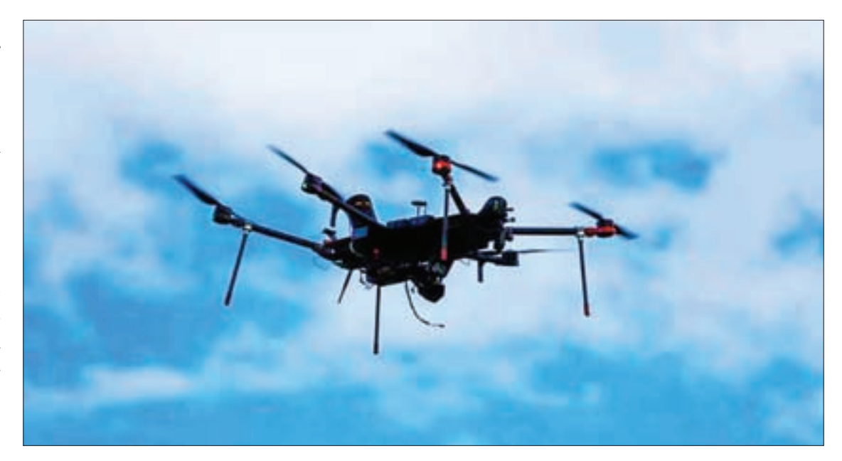
An Airspace Systems Interceptor autonomous aerial drone flies during a product demonstration in Castro Valley, California, on 6 March 2017.

The chief executives of several unmanned aerial system, or drone, companies including Kespry Inc, AirMap, Airspace