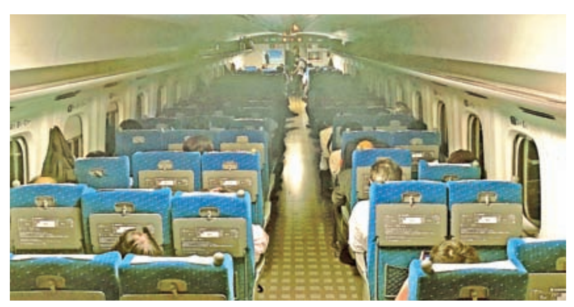
Passengers sit in the dark aboard a shinkansen bullet train in Osaka on 21 June 2017, after the services connecting western and southwestern Japan were suspended for a number of hours due to a power outage. Several thousand passengers were stranded by the issue.

The presidential poll is scheduled to be held on July 17 while the counting of votes will take place on 20 July. — PTI ■