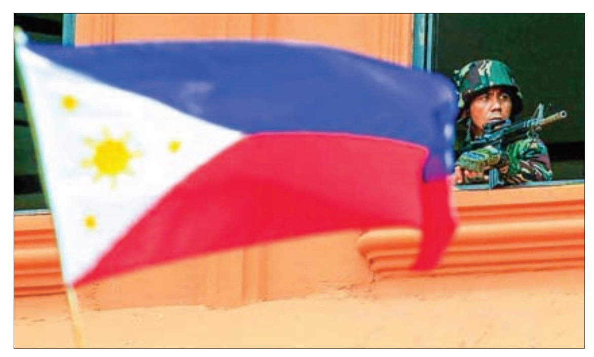
A government soldier guards a city hall compound, as government troops continue their assault against insurgents from the Maute group, who have taken over parts of Marawi City, Philippines, on 22 June 2017.

"We fear that they may enter the country disguised as illegal immigrants or foreign fisher-