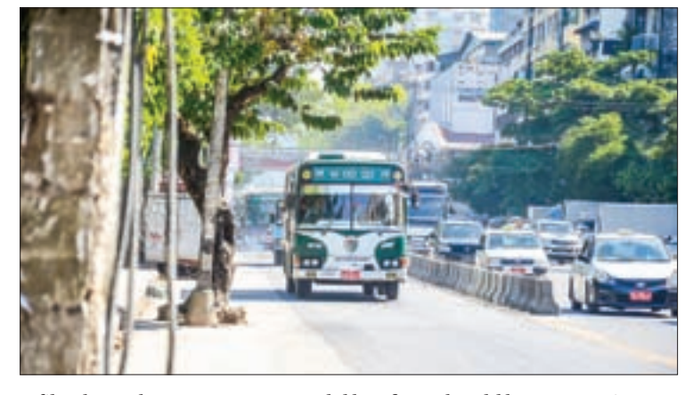
A file photo shows a pre-1995 model bus from the old bus system in Yangon.

Yangon has introduced thousands of new Chinese-made buses to enhance service and reduce traffic congestion. The retirement of older transit vehicles is part of the government's