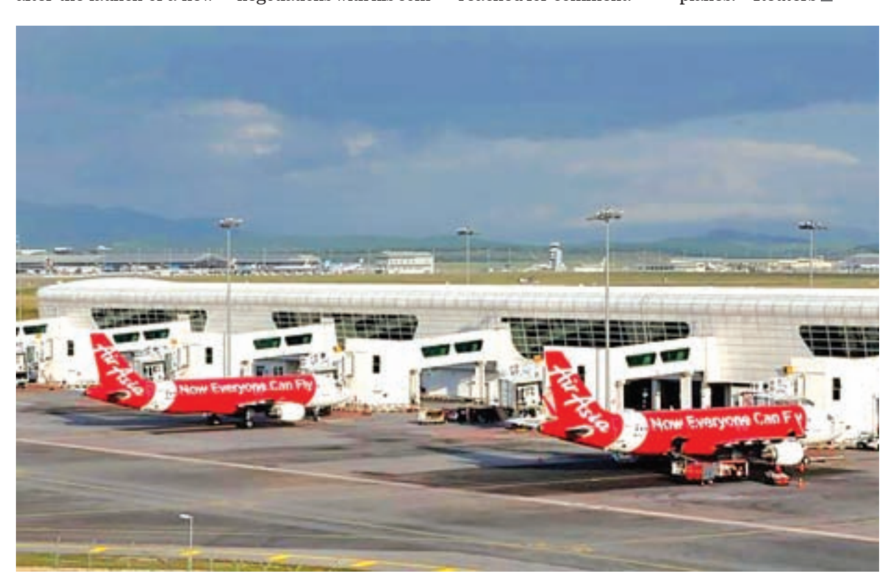
AirAsia planes are seen parked on the tarmac at Kuala Lumpur International Airport 2 (KLIA2) in Sepang, Malaysia on 15 February 2016.

Going into the fourth trade day of the Paris Airshow, Boeing was ahead on net, new orders and commitments after launching a new version of its 737 MAX family of planes.—Reuters