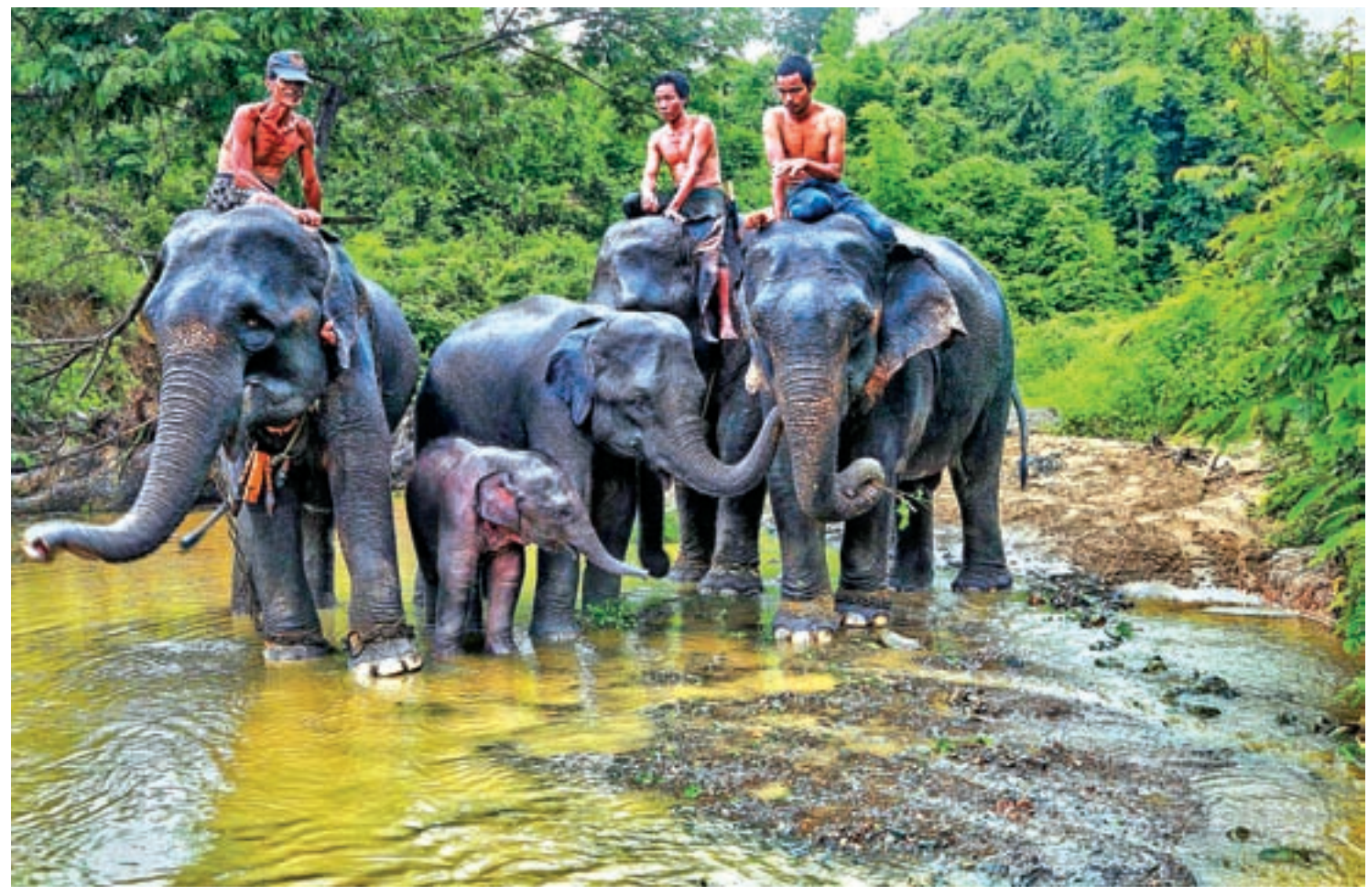
Elephants enjoying their time in the water with their mahouts at Hmaw Yaw Gyi elephant camp in Bago Region.

with your name and title. Due to limitation of space we are only able to publish "Letter to the Editor" that do not exceed 500 words. Should you submit a text longer than 500 words please be aware that your letter will be edited.