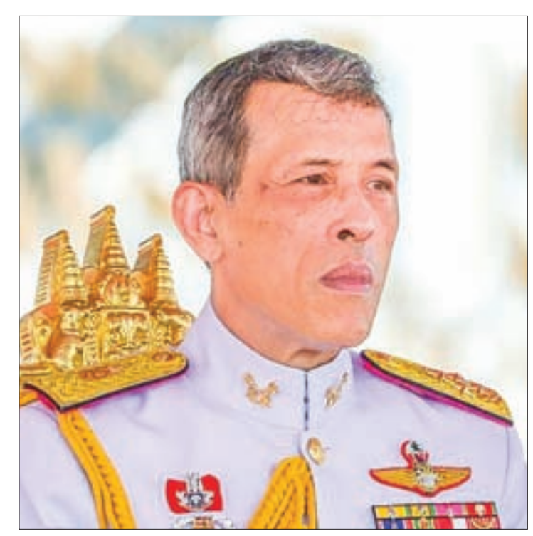
Thailand's King Maha Vajiralongkorn Bodindradebayavarangkun watches the annual Royal Ploughing Ceremony in central Bangkok, Thailand, on 12 May 2017.

Reuters was unable to contact the youth, who has not been identified, or representatives for him.