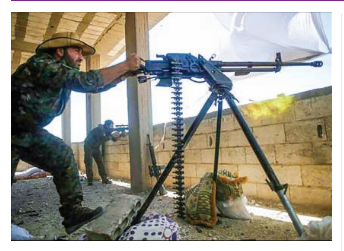
A Kurdish fighter from the People's Protection Units (YPG) fires heavy machine-gun at Islamic State militants in Raqqa, Syria, on 21 June 2017.

23 JUNE 2017 THE GLOBAL NEW LIGHT OF MYANMAR WORLD 12