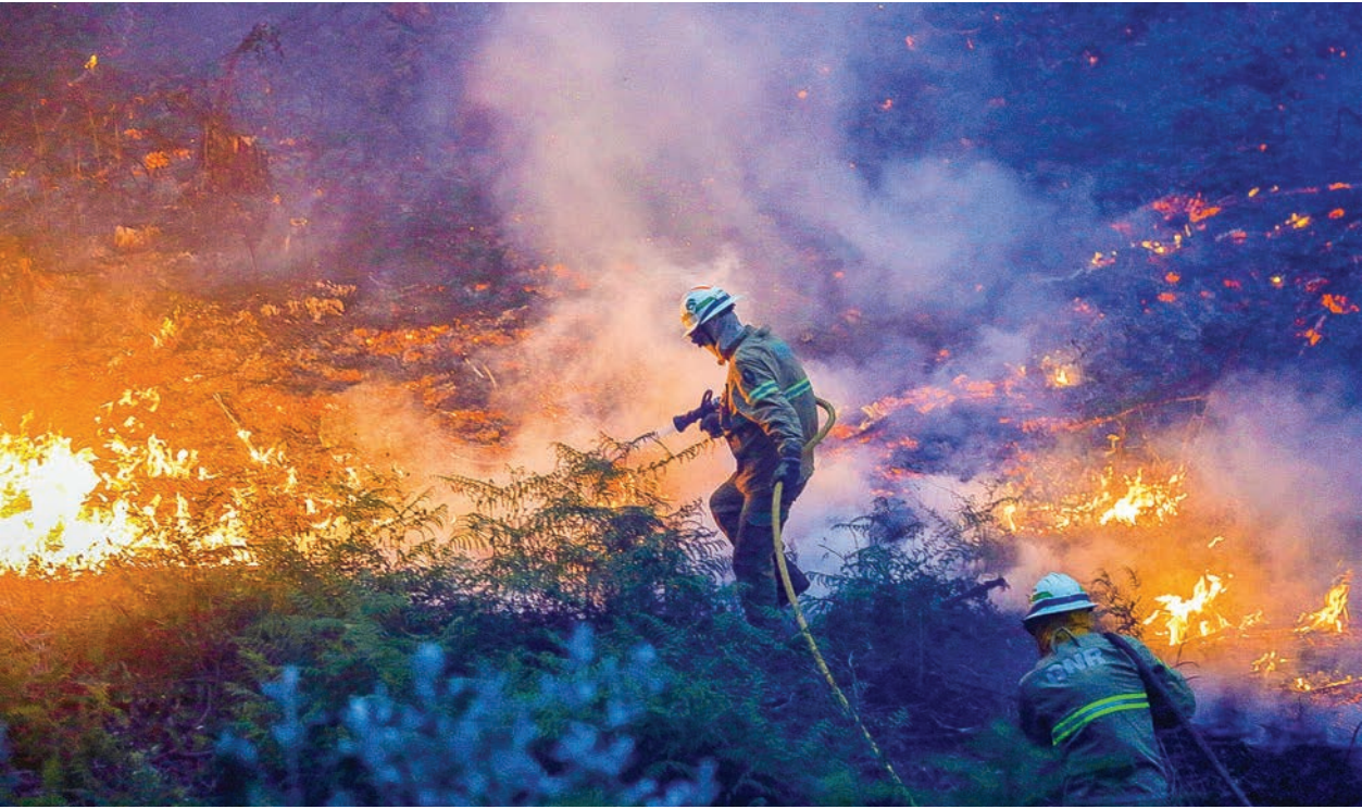
Firefights work to put out a forest fire near the village of Fato, central Portugal on 18 June, 2017.

PEDROGAO GRANDE, Portugal —More than 1,000 firefighters were still battling Portugal's deadliest forest blaze on Monday after it killed at least 62 people over the weekend. Prime Minister Antonio Costa, who on Sunday visited Pedro Grande, a mountainous area about 200 kilometres (125 miles) northeast of Lisbon, called it the biggest human tragedy in Portugal in living memory. Welcome light rain that started on Monday morning brought only modest relief to the shocked population and exhausted firefighters. Water planes, including French and Spanish ones, resumed their missions after stopping overnight. "There is still a lot of forest that can burn and the rain does not make much difference," said Rui Barreto, deputy chief firefighter at the make-shift emergency services headquarters in Pedrogao Grande as thunder rolled