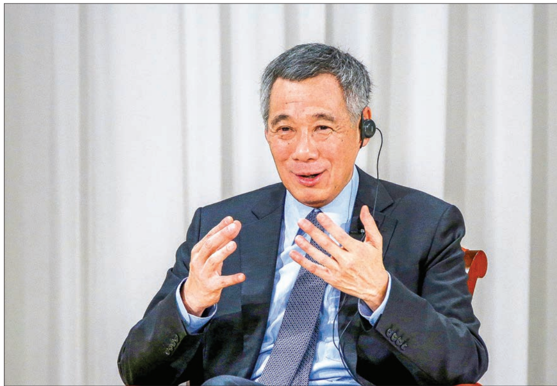
Singapore Prime Minister Lee Hsien Loong.

Prime Minister Lee denied the allegations made by his siblings, and said he would make a statement on the charges and answer questions when parliament sits on 3 July.