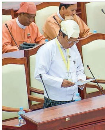
U Hla Kyaw, Deputy Minister for Agriculture, Livestock and Irrigation.

U Myint Thein of Wetlet constituency asked about a plan to provide agricultural loans to farmers farming in forest reserved areas and protected forest outside of forest reserved areas. Deputy Minister U Hla Kyaw said the procedure to provide agriculture loans stipulates that loans can be provided only to those who are in possession of form-7 that shows the right to farm on a land, issued by the Settlement