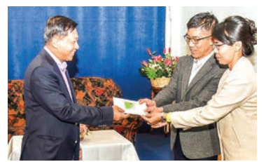
NATIONAL Senior General meets families of Myanmar Embassy staff, military attaché in Russia