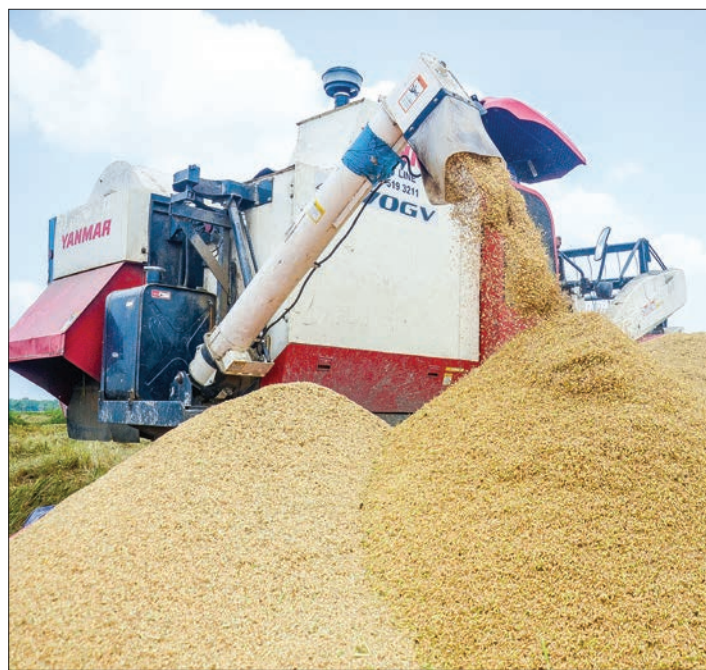
Collection of rice from a threshing machine in Kangyidauk, Ayeyawady Region.

From the 4th to the 10th of June, nearly 4,500 tons of white