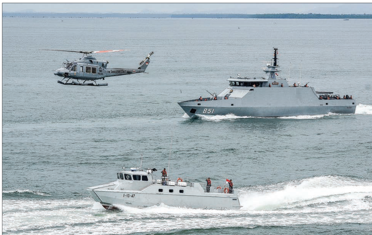
Indonesia navy soldiers on warship and helicopter are seen during the launch of coordinated patrols to beef up security between Malaysia, Indonesia, and Philippine off the Tarakan sea, in Tarakan, Indonesia on 19 June, 2017.

out for the 500 to 600 terrorists there, 257 of whom have been killed already. The rest, based on information we are getting, are blending in with refugees to get out,” said Indonesian military chief Gatot Nurmantyo.