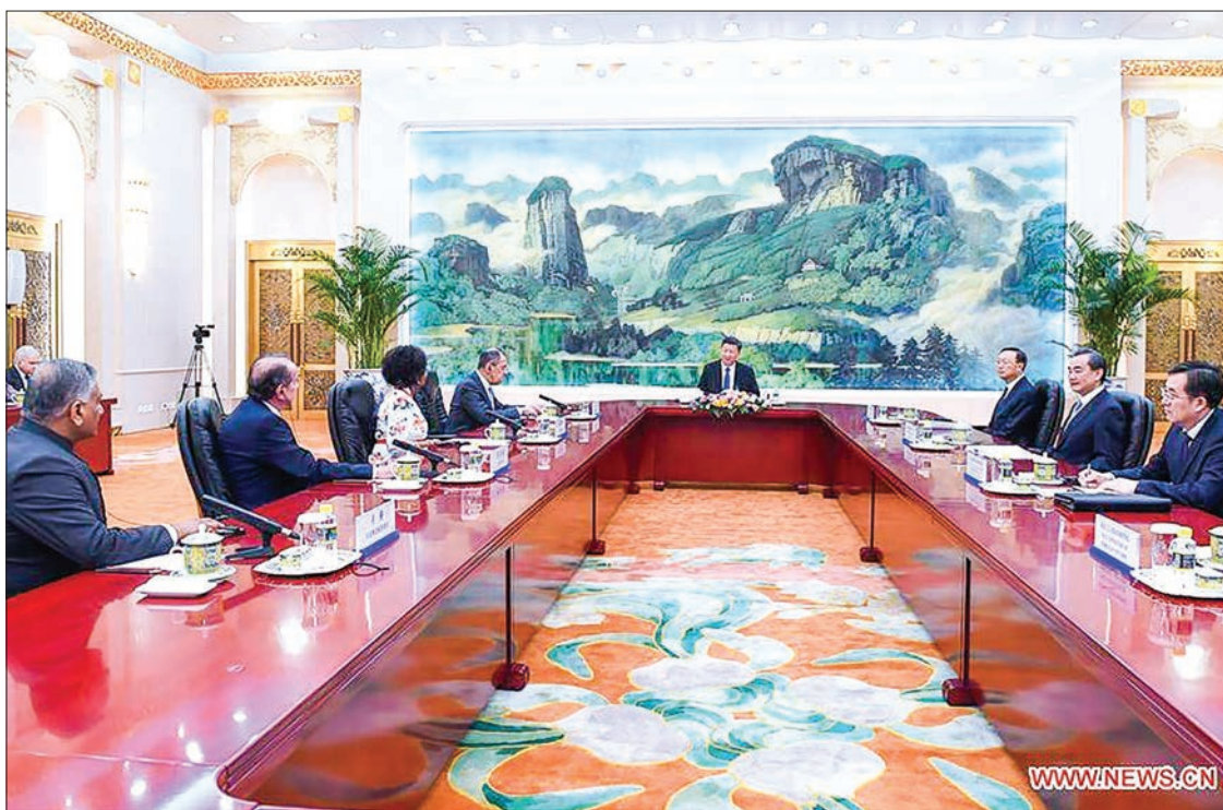
Chinese President Xi Jinping (4th R) meets with the heads of delegations from Brazil, Russia, India and South Africa who are in Beijing to attend the BRICS foreign ministers’ meeting in Beijing, capital of China on 19 June, 2017.

and BRICS members have focused on development, which not only benefits the people in the five countries but also offers a recipe for the world to address food and security problems, Xi said. “BRICS countries are a community of shared interests and future,” Xi said, urging the countries to give full play to the win-win spirit and jointly contribute to the development of the organization.—Xinhua ■