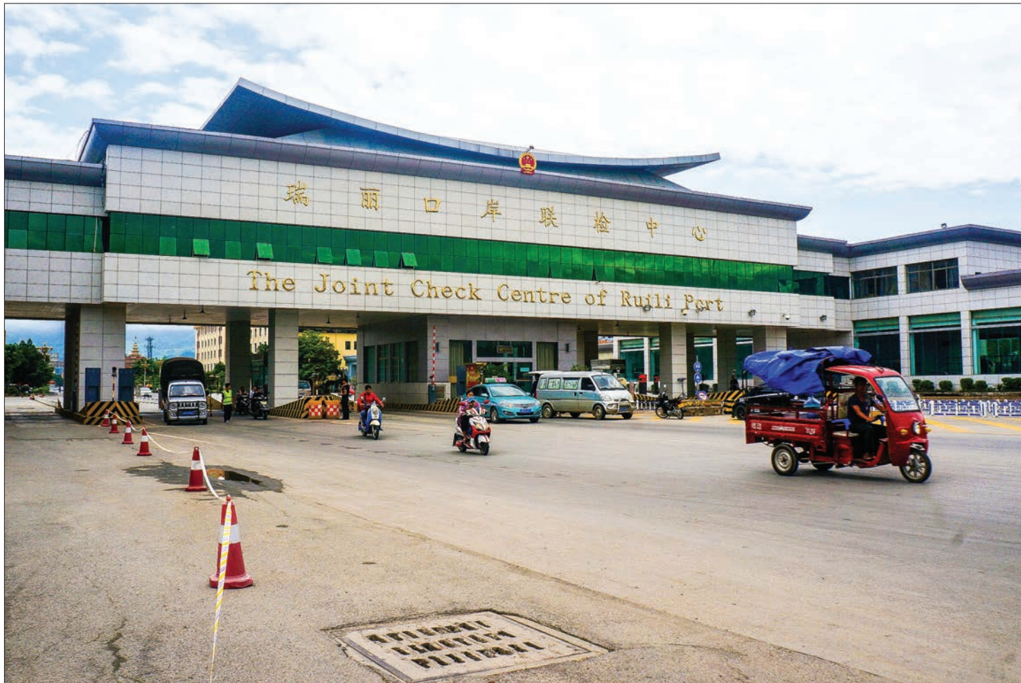
Above, the Ruili checkpoint in Yunnan Province, China, where trucks carrying Myanmar commodities cross into China from the 105-mile Muse border trade zone in Shan State. Last week, bank accounts of over 100 Myanmar companies were frozen.