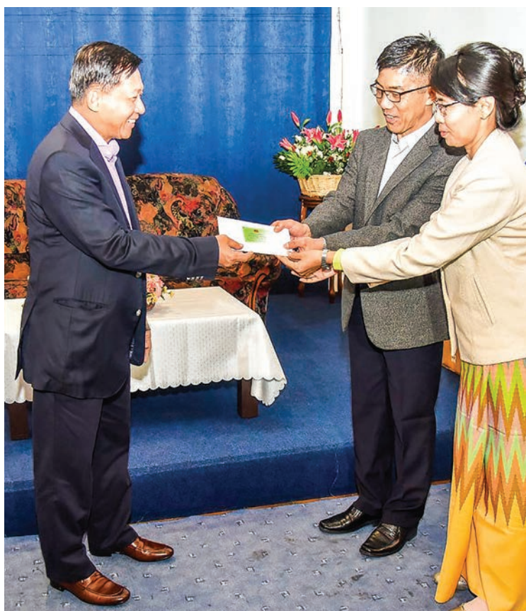
Senior General Min Aung Hlaing gives gift to the families of Myanmar embassy and military attaché on 18 June.

The Senior General and party then tour Moscow to view the developments and took a ride on a subway train from Smolenskaya station to Ploshchad Revolyutsii station. —Myanmar News Agency ■