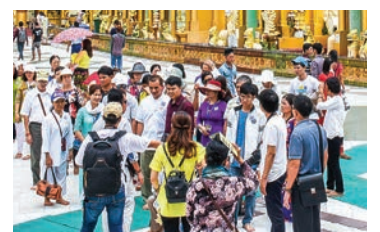
NATIONAL Thais top list of foreigners who make pilgrimage to Shwedagon Pagoda