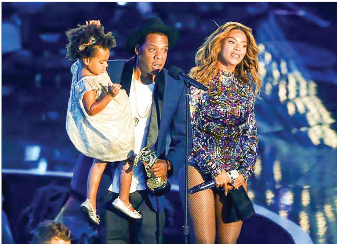
Jay-Z presents the Video Vanguard Award to his wife Beyonce as he holds their daughter Blue Ivy during the 2014 MTV Video Music Awards in Inglewood, California on 24 August, 2014.

The celebrity news websites did not provide additional details, such as the date and time the twins were born or the sex of the infants.