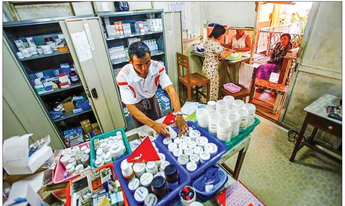
Pharmacists prepare medicine for two HIV-positive patients at Médecins Sans Frontières-Holland (AZG)'s clinic in Yangon.

The Médecins Sans Frontières/Doctors Without Borders (MSF), has helped people worldwide where the need is greatest,