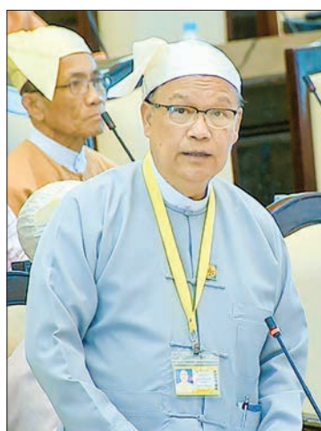
U Thant Sin Maung, Union Minister for Transport and Communications.

U Win Maung of Magway Region constituency 6 asked if there were any plan by Myanmar Posts and Telecommunications (MPT) to establish GSM