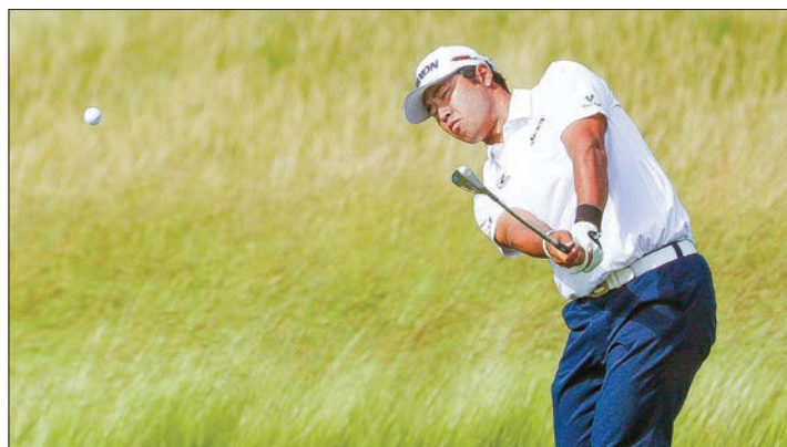
Japan's Hideki Matsuyama hits an approach shot on the 14th hole during the final round of the US Open at Erin Hills in Erin, Wisconsin on 18 June, 2017.

Matsuyama tied for second with Brian Harman of the United States who shot an even-par 72 on Sunday, giving up his 54-hole lead. Matsuyama equaled Isao Aoki's record for the best