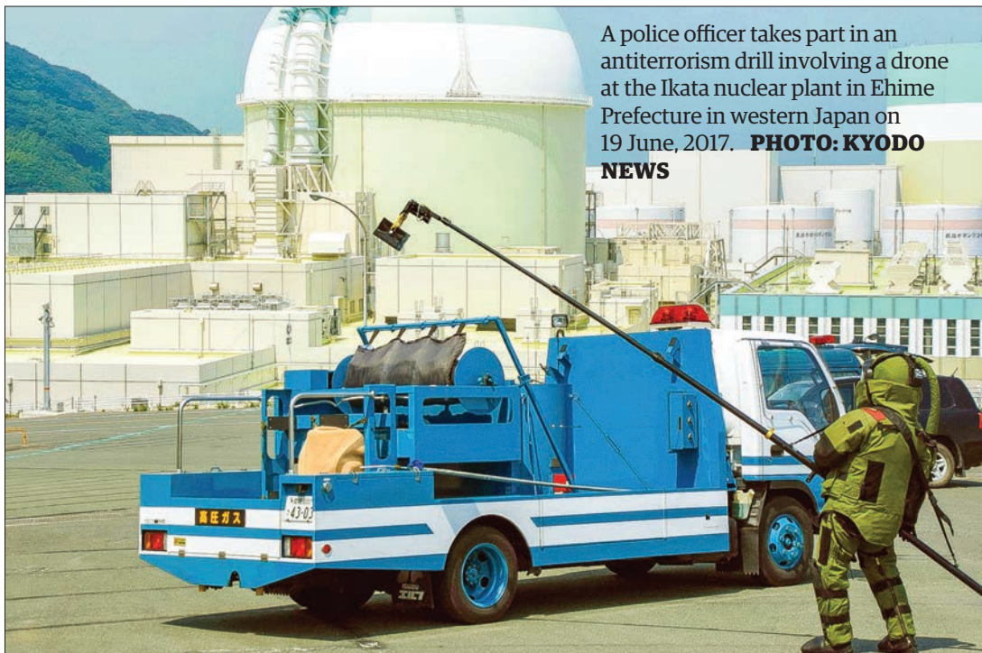
A police officer takes part in an antiterrorism drill involving a drone at the Ikata nuclear plant in Ehime Prefecture in western Japan on 19 June, 2017.