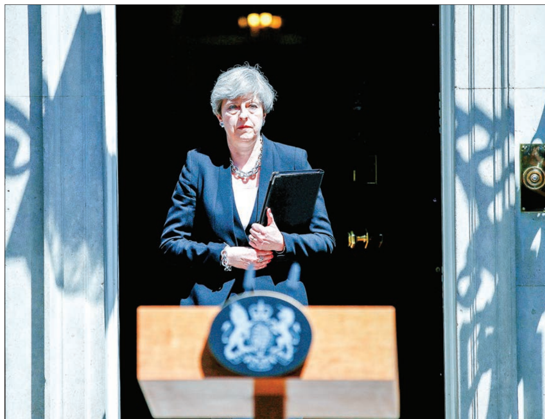
Britain's Prime Minister, Theresa May, arrives to speak outside 10 Downing Street, following the attack at Finsbury Park Mosque, in central London, Britain on 19 June, 2017.

"Their restraint in the circumstances was commendable," said Neil Basu, senior national co-ordinator for counter-terrorism policing. The man was arrested on suspicion of