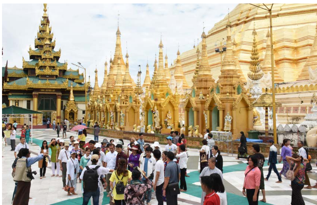
Shwedagon Pagoda crowded with pilgrims in Yangon.