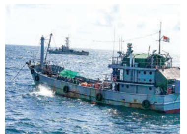
NATIONAL Y-8 military plane victims' items found