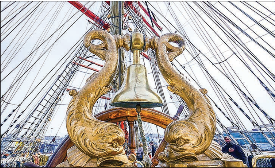
Barque Sedov.

The Sedov barque, originally named the Magdalene Vinnen II, was launched in Kiel in 1921 at Germany’s Friedrich Krupp Germaniawerft. She was used as a cargo ship voyaging from Europe to South America, Australia, South East Asia and Oceania. In 1936, the Magdalene Vinnen II was sold to Norddeutscher Lloyd, Bremen and renamed the Kommodore Johnsen. The new owner modified it to a cargo-carrying training