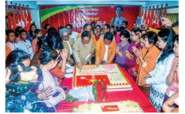
NATIONAL State Counsellor's 72nd birthday celebrated