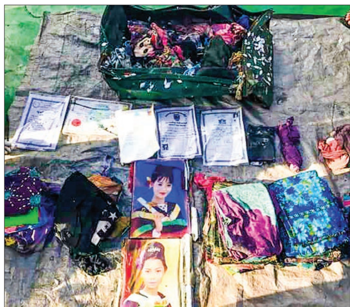
Personal belongings and clothing of passengers from the Y-8 plane that crashed shortly after takeoff from Myeik on 7 June were recovered yesterday, including photos, children's dolls and military uniforms. The retrieval of the items was made in the Andaman Sea in southern Myanmar.

It has been learnt that investigation are under way according to the investigation process, for finding facts on the crash of the plane from Flight Data Recorder-Black box & CVR-Cockpit Voice Recorder.—Myanmar News Agency ■