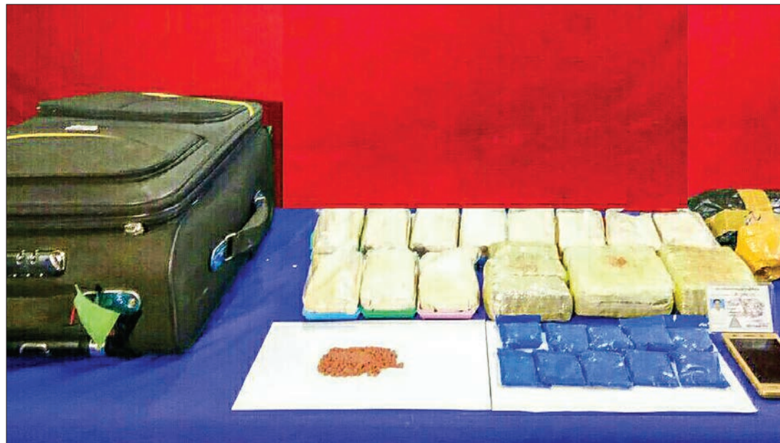
WY stimulant tablets and herion. PHOTO: 101

Though government made smoke free zones and drafted master plans to reduce smoking by collecting high taxes and publishing pictures warning of side effects on cigarette packets, the plans were mostly unsuccessful as companies and people failed to participate.—200 ■