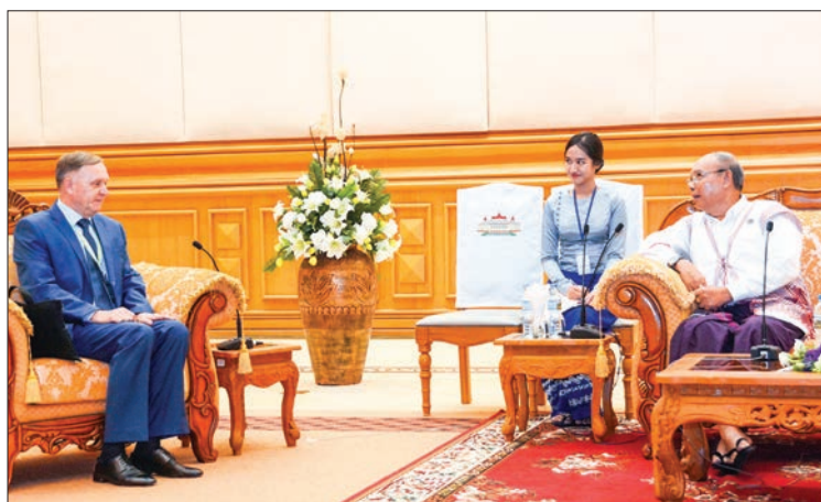
Amyotha Hluttaw Speaker holds talks with Russian Ambassador in Nay Pyi Taw yesterday.