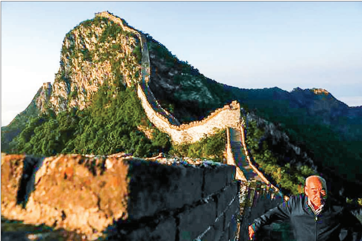
Cheng Yongmao, the engineer in charge of the reconstruction project on the Jiankou section of the Great Wall, looks as the sun rises over the wall, located in Huairou District, north of Beijing, China, on 7 June 2017.