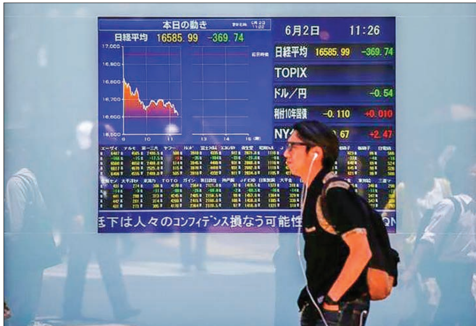
A man walks in front of a screen showing today's movements of Nikkei share average outside a brokerage in Tokyo, Japan, on 2 June 2016.

tral bank offered a more upbeat view on private consumption and overseas economies, signaling its confidence that the recovery was gaining momentum.