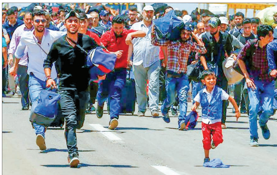
A Syrian boy runs with the others, who say they are returning to Syria ahead of the Eid al-Fitr, near the Turkish Cilvegozu border gate, located opposite of Syrian crossing point Bab al-Hawa in Reyhanli, in the southern Hatay Province, Turkey, on 15 June 2017.

"Even smelling the soil of Aleppo is better than here," said the former Aleppo resident. "I'd