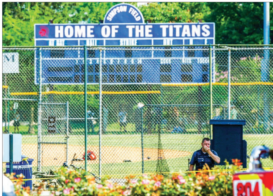
Police investigate a shooting scene after a gunman opened fire on Republican members of Congress during a baseball practice near Washington in Alexandria, Virginia.

Hodgkinson, who had a history of posting angry messages against Trump and other Republicans on social media, died after being wounded by police.