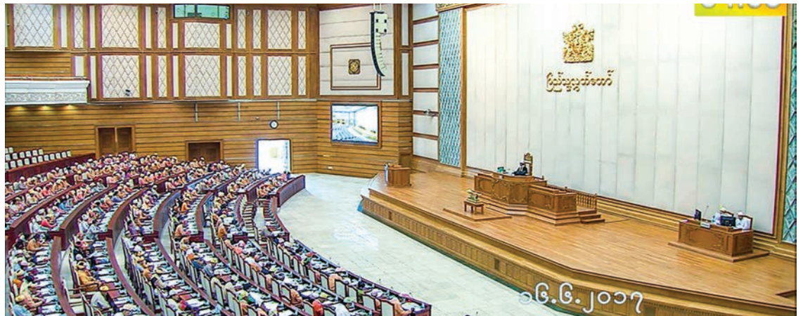
Pyithu Hluttaw being convened in Nay Pyi Taw.

"According to the finally released communication law, issuing licences and collecting fees concerning illegally installed TV satellites need not be made. Those equipments are required to be imported in accord with