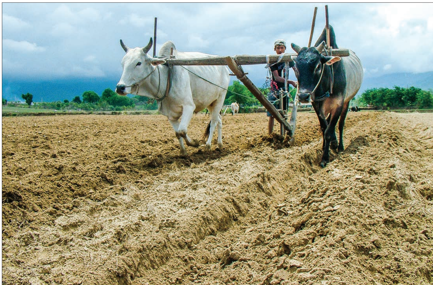
Agriculture in central Myanmar, which is considered a dry zone, is challenging because of frequent drought.

In order to combat desertification a country should apply a holistic approach, integrating several elements like water recycling, reclamation and