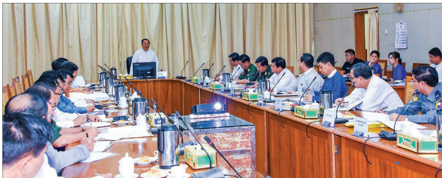
Vice President U Myint Swe addresses the 1 st coordination meeting of 70 th Anniversary of Martyrs' Day convening central committee.

The Vice President added, "In taking responsibility for security, it needs to be performed with extreme care systematically. And, it is of great importance for all the people to know the facts about martyrs' day on which the