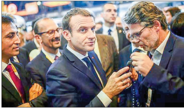
French President Emmanuel Macron (C) holds a device at the Viva Technology event dedicated to start-ups development, innovation and digital technology in Paris, France, on 15 June 2017.

The state should act as an enabler — not a constraint — for innovators and entrepreneurs, he said. The French president said he would limit the wealth tax to cover just property in order to help businesses, and would create a single levy of 30 per cent on capital