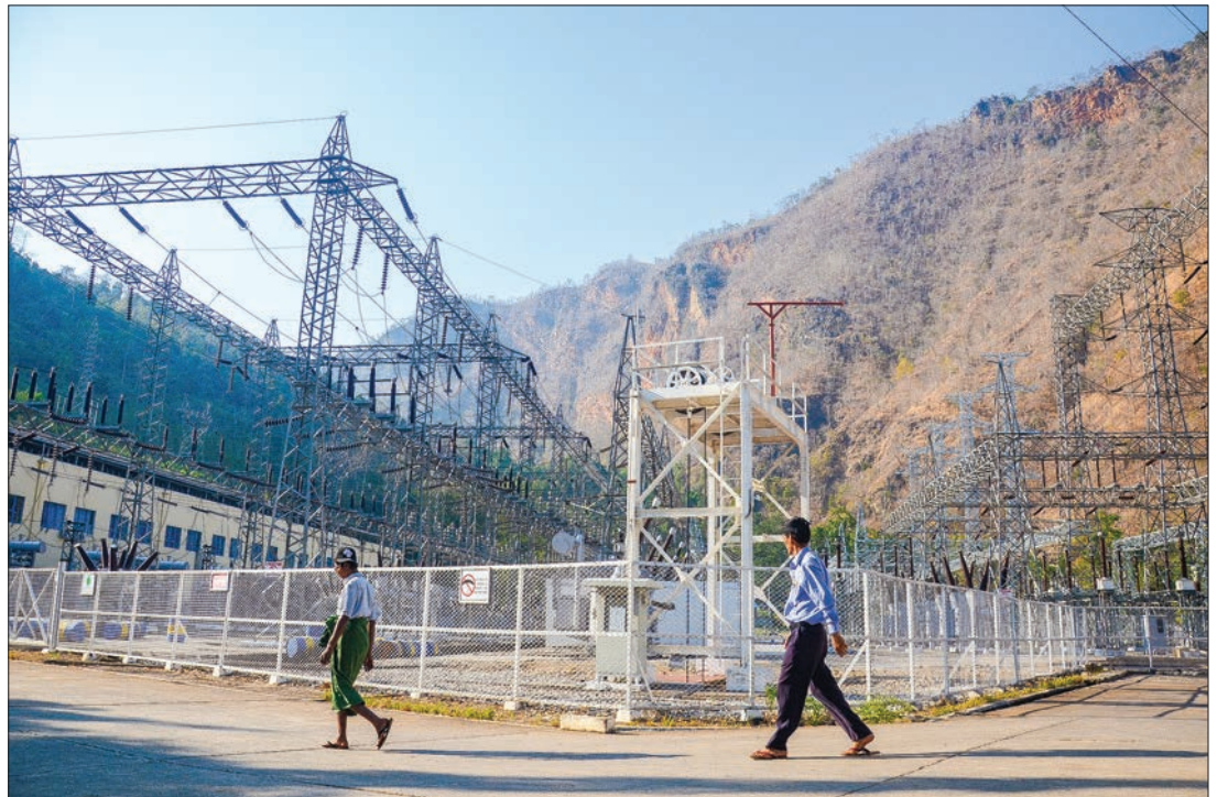
Lawpita Hydroelectric Power Plant located in Kayah State. It is operated by Myanmar Electric Power Enterprise.

"Myanmar has many energy resources to generate the electricity such as hydroelectric energy, wind energy, geothermal energy, natural gas and other resources. Current annual elec-