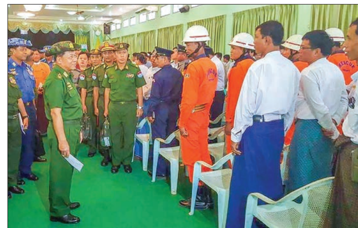
Senior General Min Aung Hlaing greets with local people who helped in the search and recovery operation for crashed plane.

He also met with departments, organisations, civil societies and local people who helped