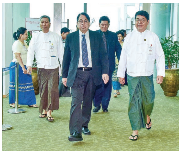
Union Minister for Information Dr. Pe Myint welcomed back by officials at Yangon International Airport.

Finally, Vice President U MyintSwe gave concluding remarks regarding the explanations given followed by the conclusion of the meeting.—Myanmar News Agency ■