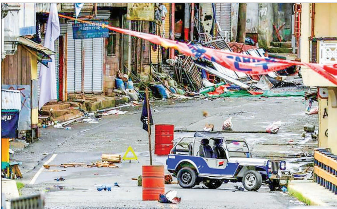
A view of the Maute group stronghold with an ISIS flag in Marawi City.

The offensive to retake the town, in the middle of the southern Philippines region of Mindanao, is now in its fourth week.