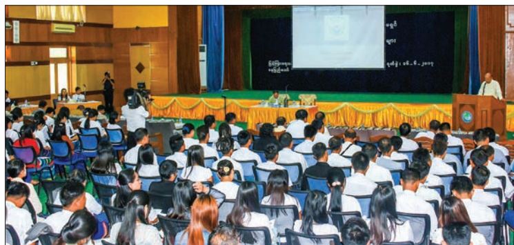
Awareness-giving ceremony of Human Rights in progress.

Also present were Amyotha Hluttaw Deputy Speaker U Aye Tha Aung and officials from Amyotha Hluttaw. —Myanmar News Agency ■