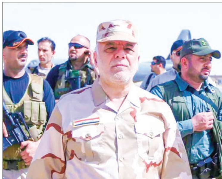
Iraqi Prime Minister Haider al-Abadi (C) walks during his visit to Mosul, Iraq, on 29 May 2017.

BAGHDAD — Iraq's Prime Minister Haider al-Abadi postponed a Saudi Arabia visit to avoid taking sides in the rift between the kingdom and Qatar, Iraqi of-