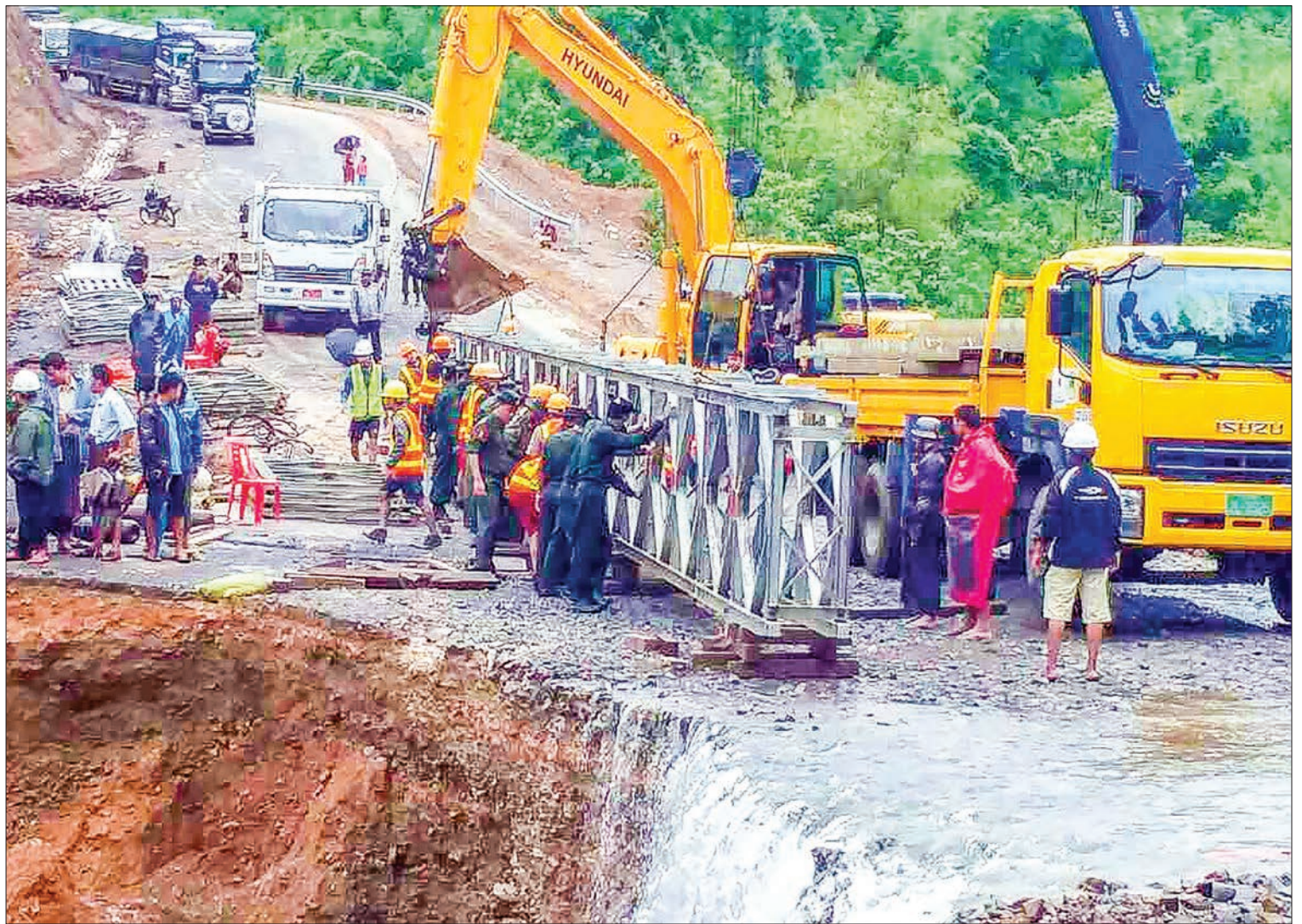
Workers construct a bailey bridge yesterday on Yangon-Ann-Sittway Union Road in An, Rakhine State after floods caused by recent torrential rain washed away the bridge. Traffic returned to normal yesterday after completion of the 200-ft long bailey bridge.

It will help the Ministry of Planning and Finance to de-