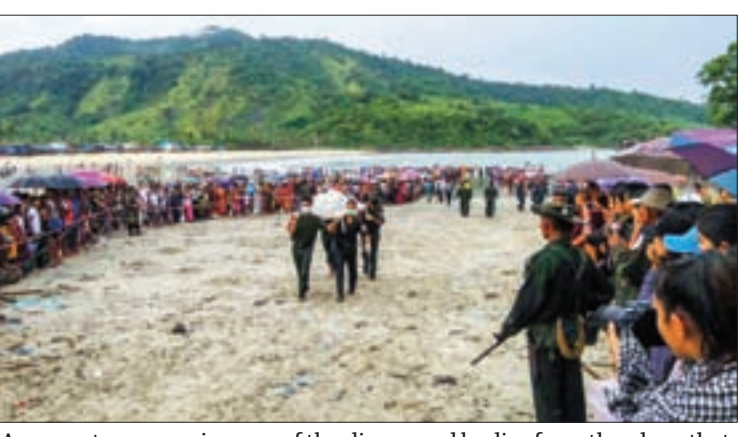
A rescue team carrying one of the discovered bodies from the plane that crashed on 6 June.

Some patches of oil were spotted some 16 nautical miles (18 miles) from Dawei, the military said.