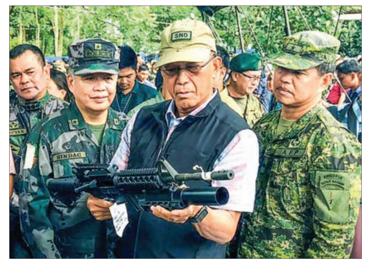
Philippines Defence Secretary Delfin Lorenzana (C) inspects a high-powered firearm seized from various hideouts of Islamist militants during their visit at a military camp in Marawi city, Philippines, on 8 June 2017.

The seizure of the town suggested to many that pro-Is-