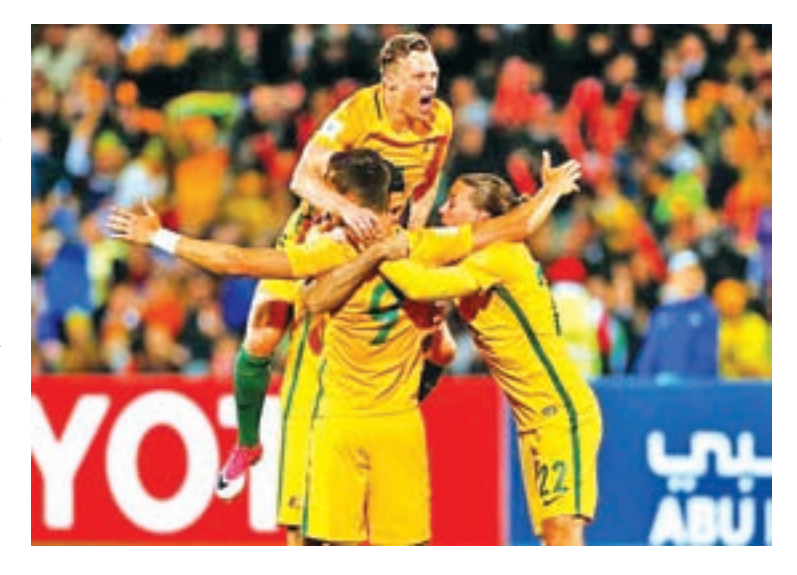
Australia's team celebrates after their first goal during World Cup 2018 Qualifiers at Adelaide Oval, Adelaide, Australia, on 8 June 2017.

The top two teams qualify automatically for Russia, with the third placed side going into a playoff. Forward Tomi Juric scored a first half brace but the Green Falcons showed courage to equalise twice through goals from Salem Al Dawsari and Mo-