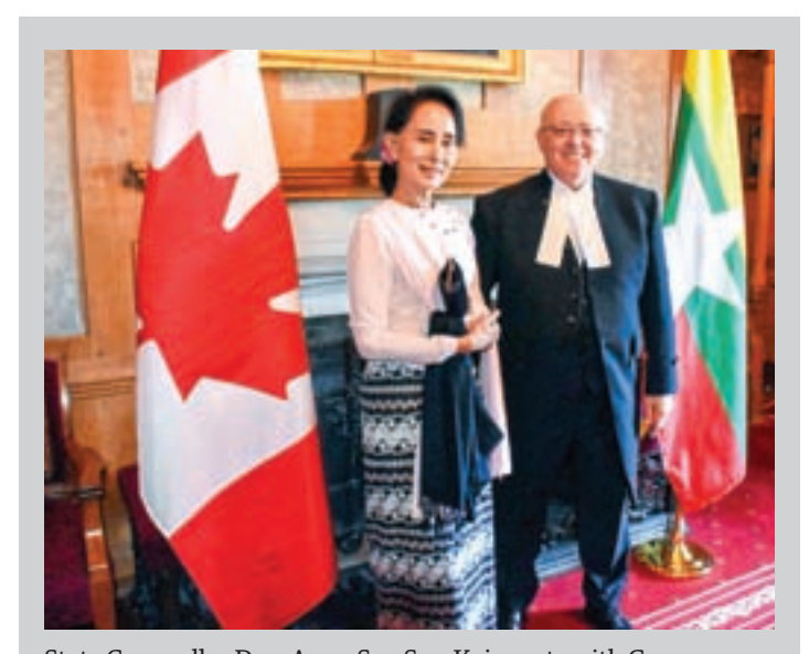
State Counsellor Daw Aung San Suu Kyi meets with George J.Furey, Speaker of the Canadian Senate, at the Parliament Building in Ottawa, Canada.