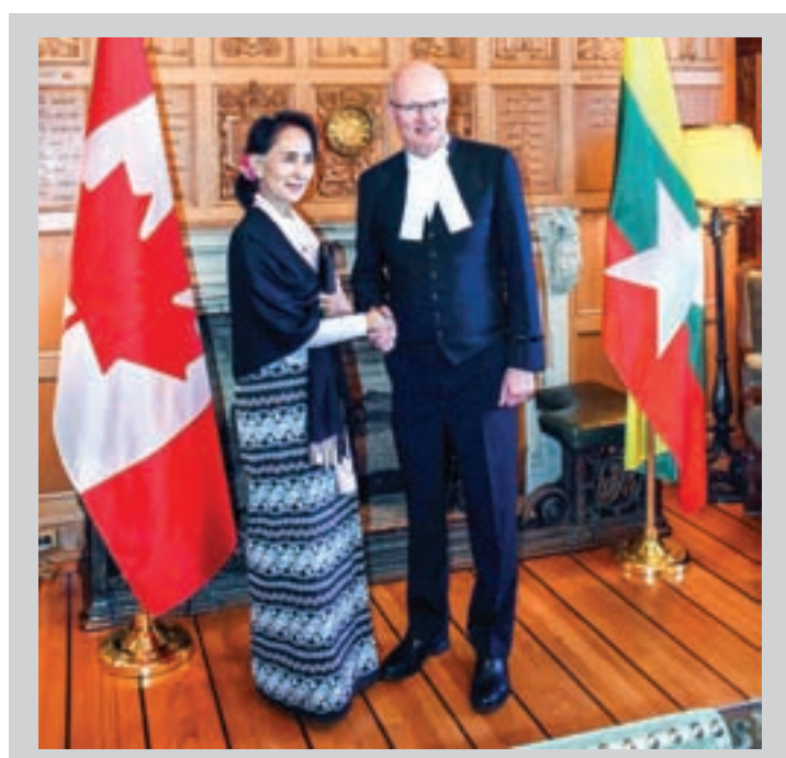
The State Counsellor meets with Geoff Regan, Speaker of the House of Commons, at the Parliament Building in Ottawa, Canada.

Also present at the meeting were Minister of State for Foreign Affairs U Kyaw Tin, Myanmar Ambassador to Canada U Kyaw Myo Htut and high ranking officials.—Myanmar News Agency