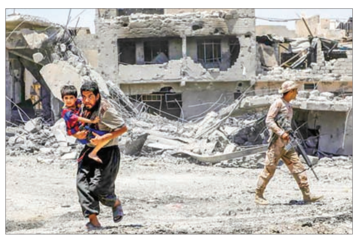
A man carries his child as he runs to a safer place near an Iraqi soldier standing guard in Mosul's al-Zanjili's district, Iraq, on 7 June, 2017.

But a young man told Reuters he had been wounded when