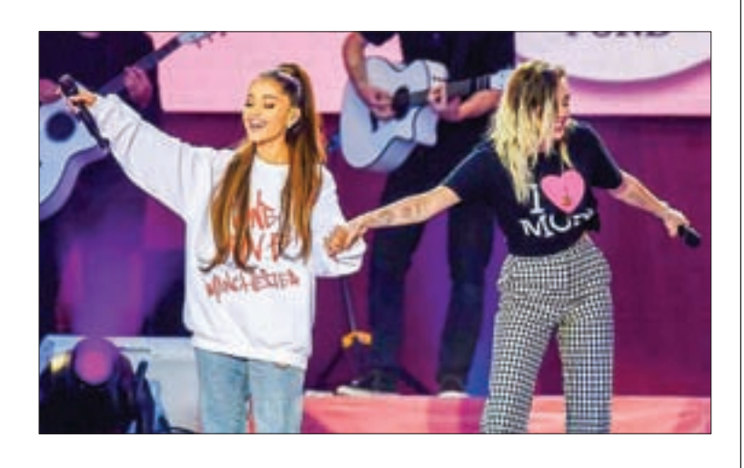
Ariana Grande (L) and Miley Cyrus perform during the One Love Manchester benefit concert for the victims of the Manchester Arena terror attack at Emirates Old Trafford, Greater Manchester, in Britain on 4 June, 2017.

PARIS — French fans of Ariana Grande flooded to a Paris concert hall on Wednesday as the US pop star resumed her European tour following a suicide bombing at the end of her show in the English city of Manchester that killed 22 people. There was a heavy police presence outside Paris' Accor Hotels Arena, with roads surrounding the venue blocked off to traffic hours before the event started. Security staff searched all bags and police with sniffer dogs patrolled the venue.