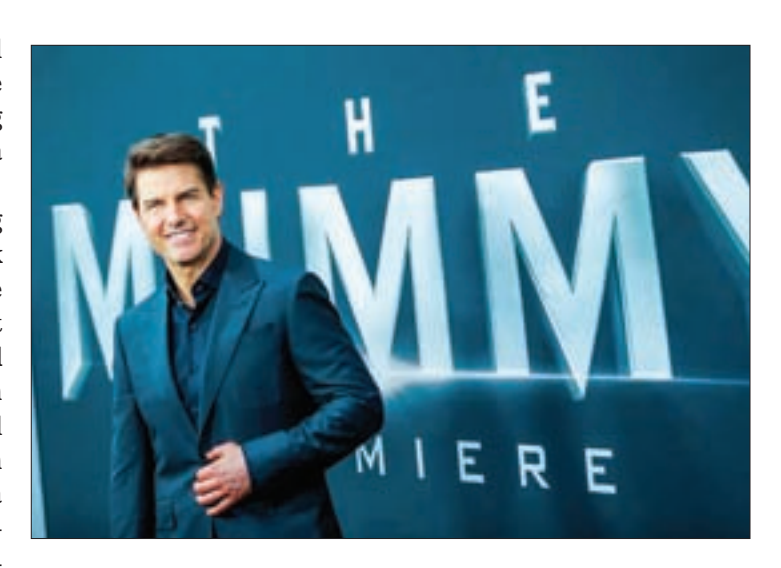
Actor Tom Cruise arrives for the premiere of the film "The Mummy' in New York, US, on 6 June 2017.

Cruise, 54, known for doing most of his own stunts, is back on screen this week in adventure "The Mummy," the latest reboot of the ancient Egyptian-inspired horror film series first seen in 1932. In September, Cruise will be out promoting "American Made, a crime thriller about a drug runner in the 1980s. "Mission: Impossible 6" is also filming and Cruise is in pre-production on a long-awaited sequel to the 1986 fighter pilot movie "Top Gun" that made him an international star. "I just love movies period and I love to entertain an audience. And I give it everything that I possibly can and I never take anything for granted," Cruise said at Tuesday's New York red carpet premiere for "The Mummy." "Some people say, don't you want a va-