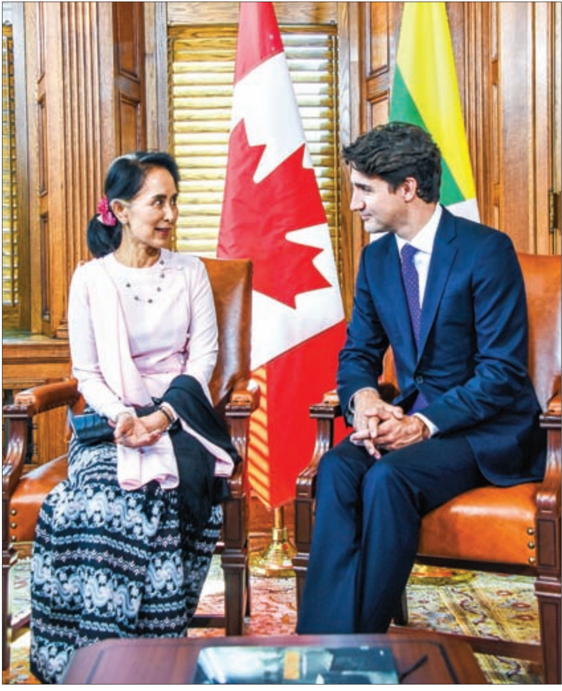
State Counsellor Daw Aung San Suu Kyi holds talks with Canada's Prime Minister Justin Trudeau during a meeting in Trudeau's office on Parliament Hill in Ottawa, Ontario, Canada, on 7 June.

Present at the meetings were Minister of State for Foreign Affairs U Kyaw Tin, Deputy Minister from the Office of the President U Min Thu, Myanmar ambassador to Canada U Kyaw Myo Htut and high ranking officials.—Myanmar News Agency ■