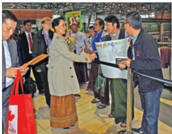
State Counsellor Daw Aung San Suu Kyi is welcomed at Ottawa Macdonald-Cartier International Airport in Canada.

Later, State Counsellor will meet Myanmar Embassy staff and family after which she'll attend a meeting on federal.—Myanmar News Agency ■