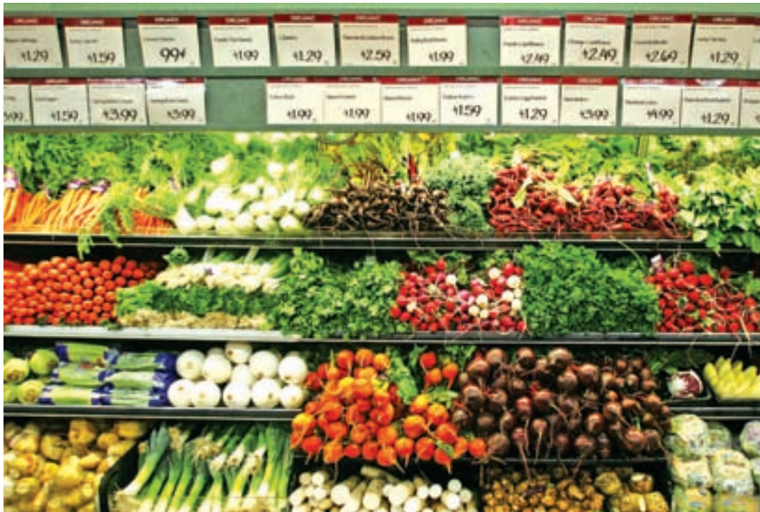
Organic vegetables are shown at a Whole Foods Market in LaJolla, California.

"Cambodia is potentially a better place for organic farming and as a production base for exports compared to other countries in the region because of its cheap labor and competitive prices of raw materials," he said. "Its foreign investor-friendly in-