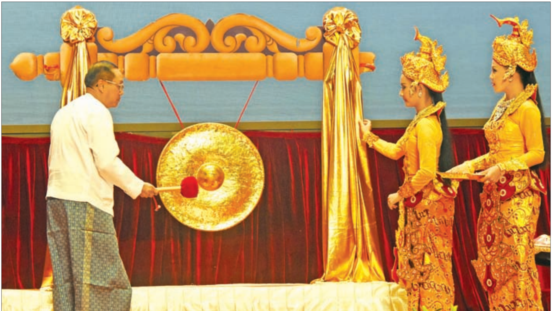
Vice President U Myint Swe strikes a ceremonial gong at the opening ceremony of the Myanmar Investment Forum 2017 in Nay Pyi Taw yesterday.