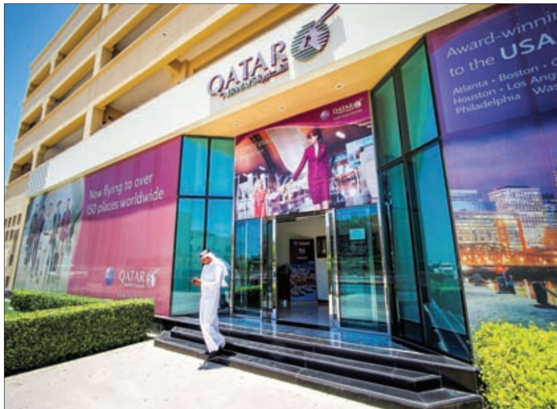
A man leaves Qatar Airways office in Manama, Bahrain on 5 June 2017.

Qatar's ruler Sheikh Tamim bin Hamad Al-Thani spoke by telephone overnight with his counterpart in Kuwait, which has maintained ties with Qatar, and decided to postpone the speech, the minister told Qatar-based Al Jazeera television.