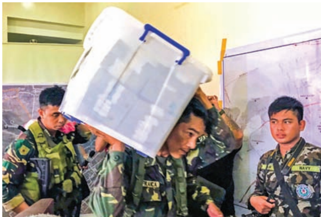
A government soldier carries a box containing 52.2 million pesos ($1.06 million) cash seized from a vault in a house previously controlled by militants in the Marawi city, Philippines on 6 June, 2017.

The battle for Marawi has raised concerns that the ultra-radical Islamic State, on a back foot in Syria and Iraq, is building a regional base on the Philippine island of Mindanao.