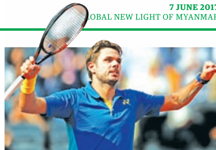
Switzerland's Stanislas Wawrinka celebrates winning his fourth round match against France's Gael Monfils at Roland Garros in Paris, France on 5 June, 2017.

to Serie A champions Juventus with the final decision about the keeper's future resting with Arsenal.—Reuters