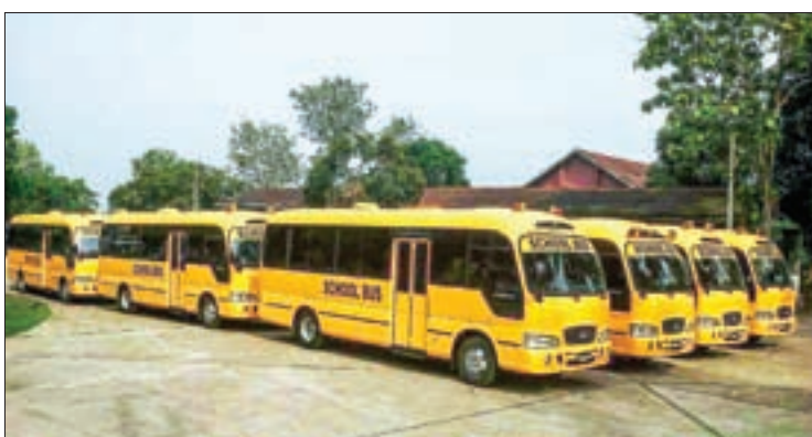
The new Hyundai 2017 model school buses will provide safer transportation for students.

"We're not saying that these vehicles were a required purchase. The government purchased these vehicles to meet their set safety standards. If schools are interested in purchasing these vehicles, the government is ready to give out bank loans for them. Since these vehicles were purchased from government to government, they