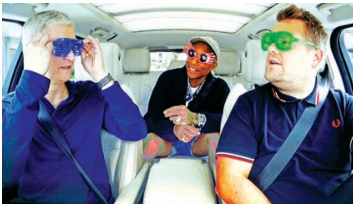
Apple Inc CEO Tim Cook is shown with TV personality James Corden and musician Pharrell during a taped comedy bit in this image shot from a projection screen during an Apple media event in San Francisco, California, US on 7 September, 2016.