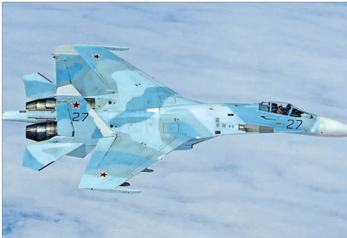
The crew of Russia's Sukhoi-27 jet approached the aircraft staying at a safe distance, identified it as a US strategic bomber B-52 and escorted it for some time.