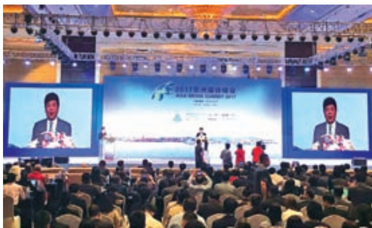
Opening ceremony of the 14th Asia Media Summit at the Shangri-La Hotel in Qingdao, China.