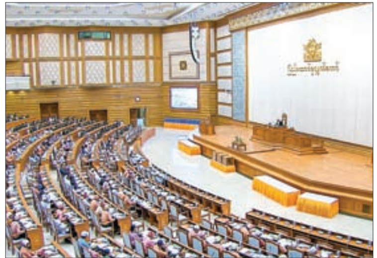
Pyidaungsu Hluttaw is convened in Nay Pyi Taw.

Myanmar is in the middle of Himalaya region, Indochina region and Malay Peninsula region. Myanmar is one of the world's most bio-diverse nations, but its environment is under threat from global warming and human development. —Myanmar News Agency