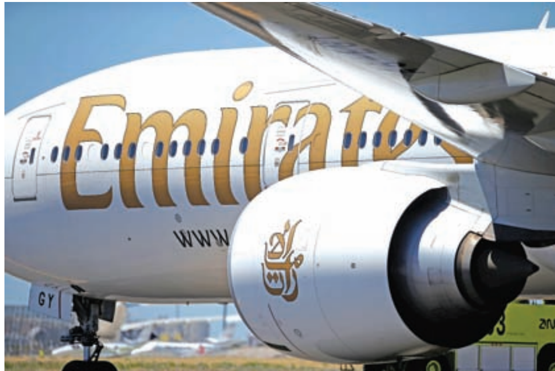
An Emirates plane seen at Lisbon's airport, Portugal.

Dubai-based premium airline Emirates will launch a new route between Yangon and Phnom Penh, Cambodia on 1 July.