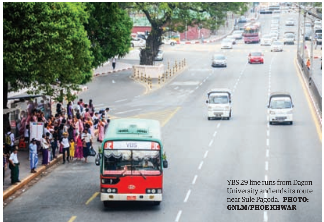
YBS 29 line runs from Dagon University and ends its route near Sule Pagoda.

YBS 86 line will run from Lower Pazundaung Street of Mingalar Taung Nyunt Township to Yawama Kyaung Road of Insein Township passing through ABC bus stop, Thamain Bayan Street, U Chit Maung Road and