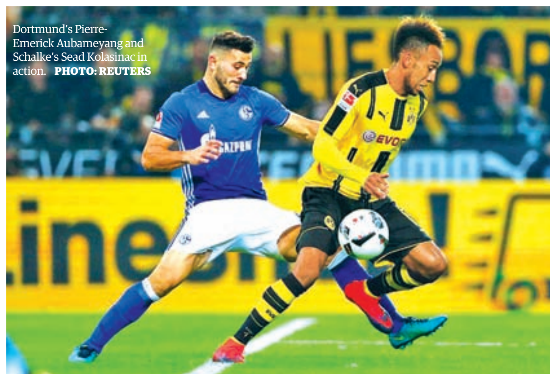
Dortmund's Pierre-Emerick Aubameyang and Schalke's Saed Kolasinac in action.

England travel to Scotland for the Group F World Cup qualifier and Kane expected a tougher encounter than their 3-0 win in the reverse fixture in November. "It is a massive game; everyone knows how big England versus Scotland is with the rivalry that we have," he said. "We know it will be a bit tougher doing it away from home but, with the team we have got and the confidence we have got, we know we just have to go out there and not get too caught up in the moment." —Reuters ■