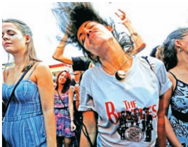
A woman dances during an open-air covers concert in celebration of the release of Beatles’ landmark album “Sgt. Pepper’s Lonely Hearts Club Band” 50 years ago, in Havana, Cuba on 1 June, 2017.

Kendrick Lamar’s “Damn.” held onto second place with another 84,000 units sold in its seventh week of release.