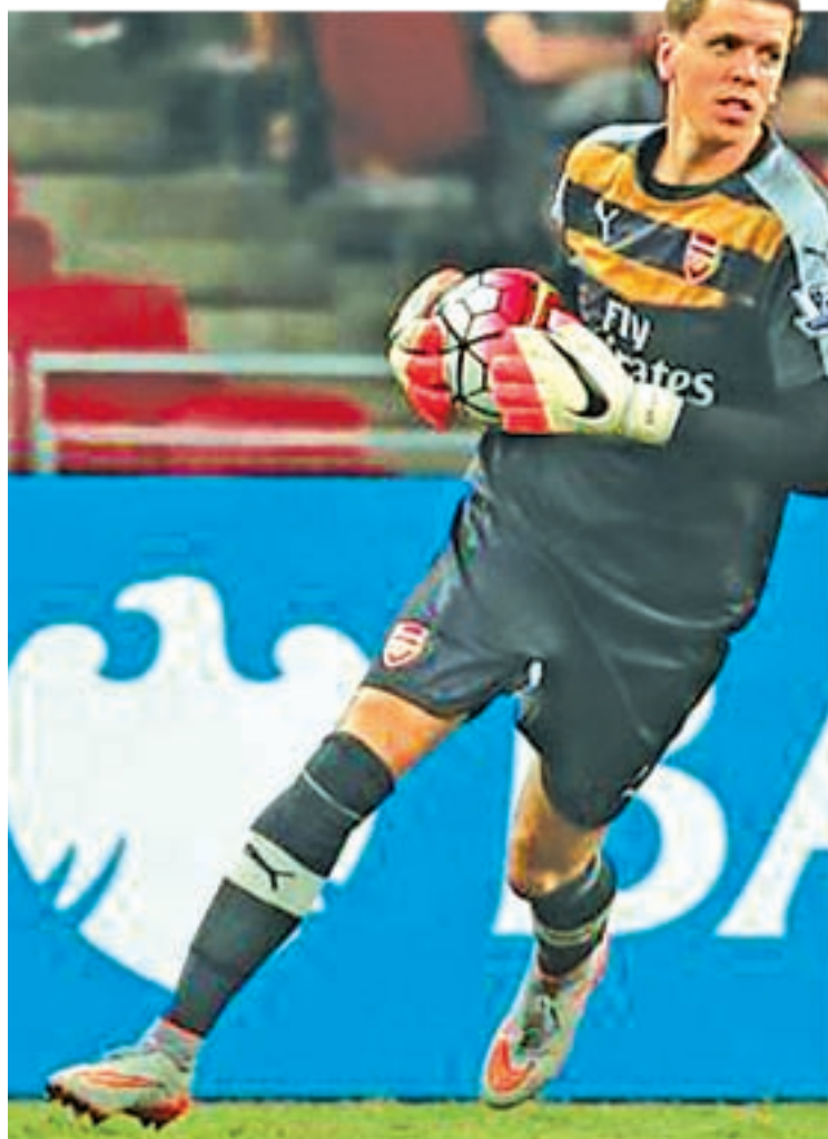
Roma's Wojciech Szczesny.

"I'll say more, I was surprised by the fact some of the players I thought had wanted to leave came up to me before and after the final game to say they wanted to remain. "It's a sign we've got a good group, we