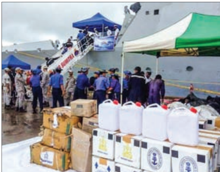
Officials unloading aid sent from India for cyclone-stricken Rakhine.

Cyclone Mora wreaked havoc in Maungtau Township