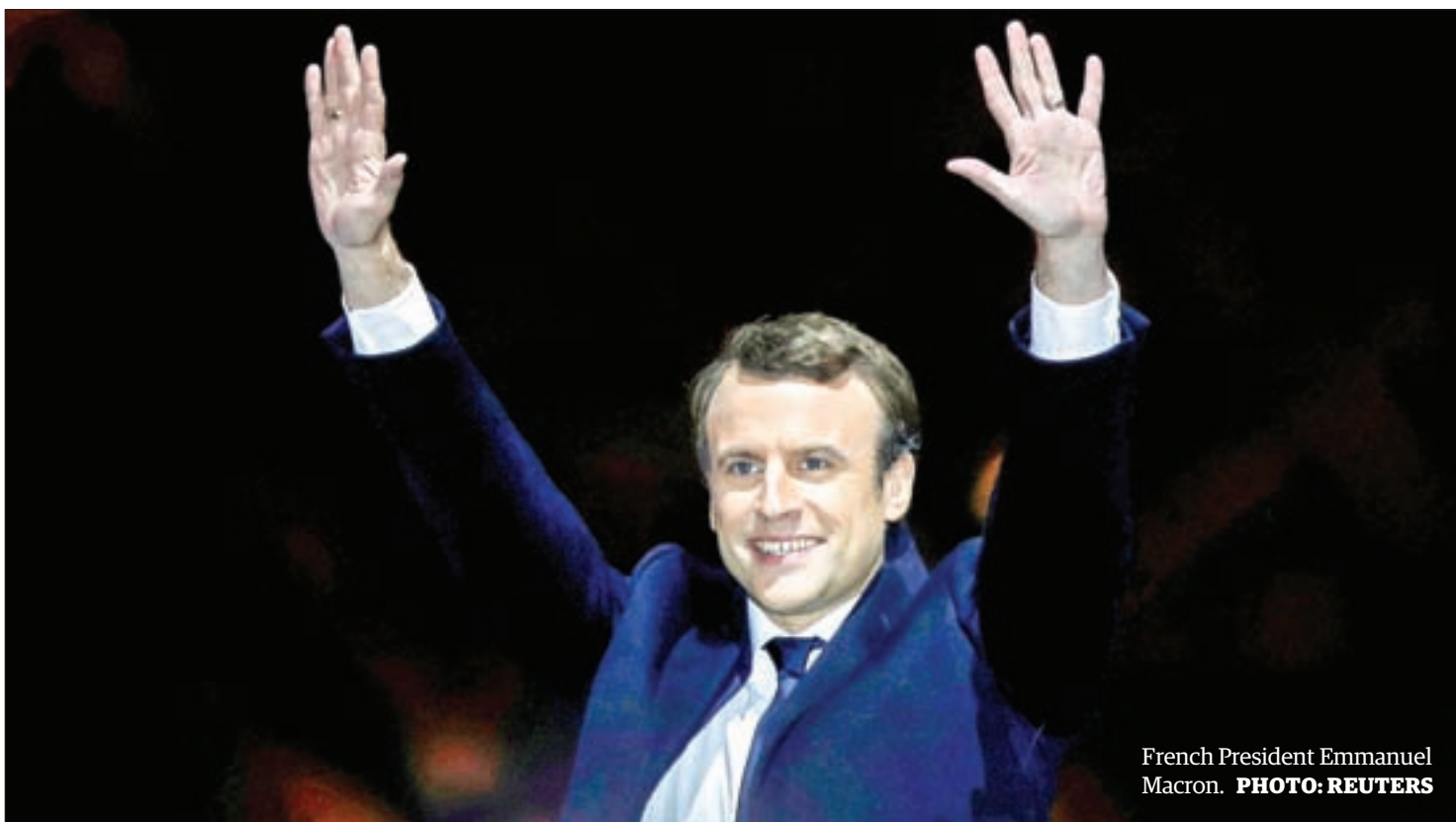
French President Emmanuel Macron.

Mobile phone connectivity across India is erratic especially in rural areas.—Xinhua ■