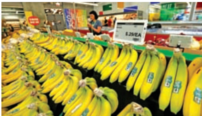
The price of bananas is displayed on a digital price tag at a 365 by Whole Foods Market grocery store ahead of its opening day in Los Angeles, U.S., May 24, 2016.

vestment policy and access to international markets with tariff exemption make Cambodia a good place for organic farming investment."