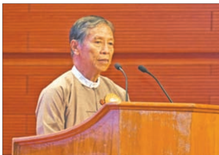
U Kyaw Win, Union Minister for Planning & Finance.

“Myanmar is still weak in rapid economic development after the incumbent started to take office, but it is in the promising