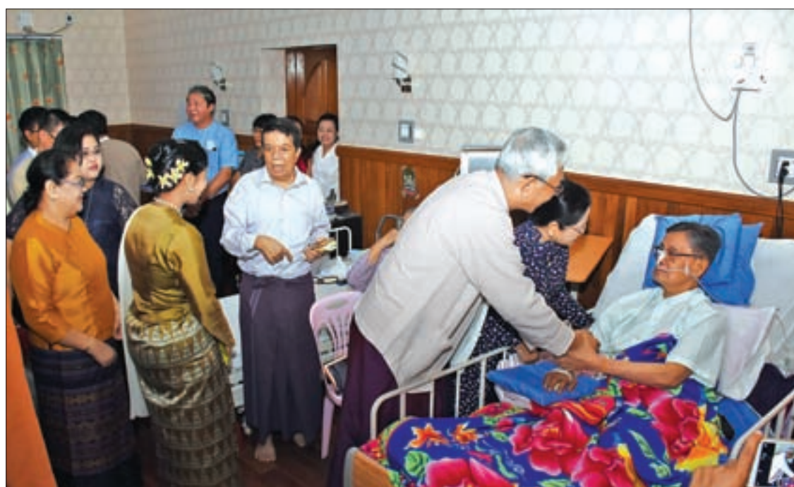
President U Htin Kyaw and his wife Daw Su Su Lwin visit NLD Patron U Tin Oo at Yangon General Hospital's cardiac ward, where he is recovering from a recent stroke.