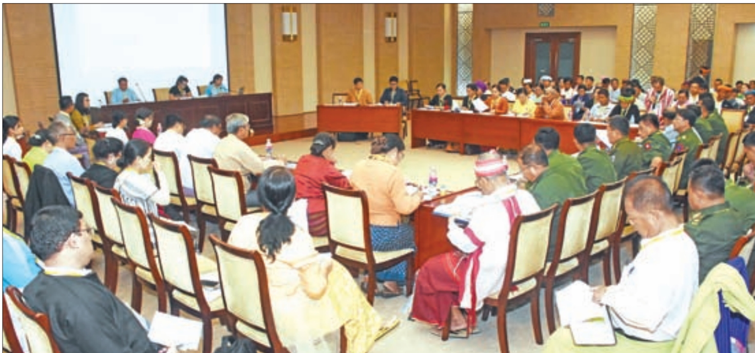
Participants discuss the social sector of the Union Peace Conference—21 st Century Panglong (Second Session).