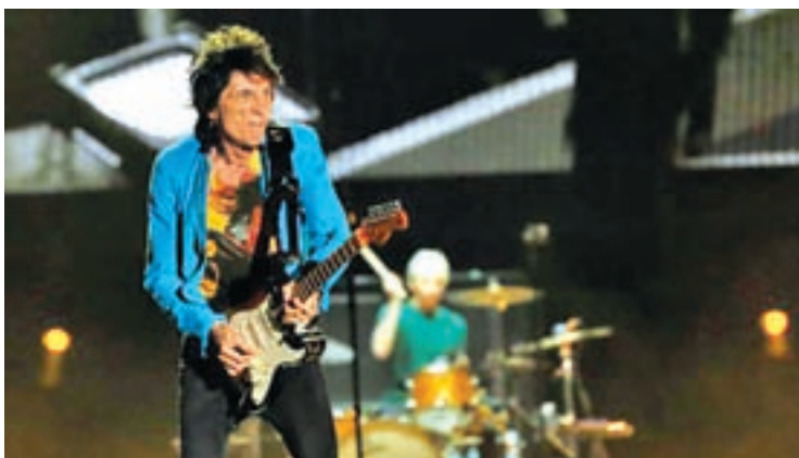
Ronnie Wood of The Rolling Stones performs during Desert Trip music festival at Empire Polo Club in Indio, California US, in 2016.

LOS ANGELES — Rolling Stones guitarist Ronnie Wood has undergone surgery for a small lesion on his lung, but is feeling fine, his representative said on Wednesday. Wood, 69, will need no additional treatment and the upcoming Rolling Stones tour of Europe will not be affected, the representative said in a statement in London. "I'm so grateful for modern screening which picked this up so early, and would