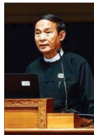
U Win Myint.