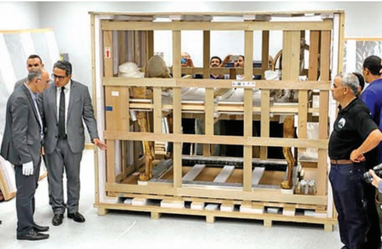
Egyptian Minister of Antiquities Khaled Enany (2nd L) and the Egyptian director of the Grand Egyptian Museum Tarek Sayed Tawfik (L) during the arrival of King Tutankhamun’s funerary bed at the restoration laboratory of the Grand Egyptian Museum in Giza, Egypt, on 23 May 2017.