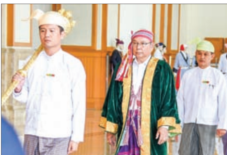
Amyotha Hluttaw Speaker arrives at the 4th day of the second Amyotha Hluttaw 5th regular meeting in Nay Pyi Taw.

To provide loans to SMEs in Chin State, a loan of ¥5 billion (approx. Ks50 billion) was received from Japan International Cooperation Agency (JICA) in 2015. Since 2016, an amount of Ks 41.558 billion from that international loan has been distributed to KBZ bank, Myanmar Citizens Bank, Small and Medium Industrial Development Bank (SMIDB), Ayeyawady Bank (AYA), Co-operative Bank