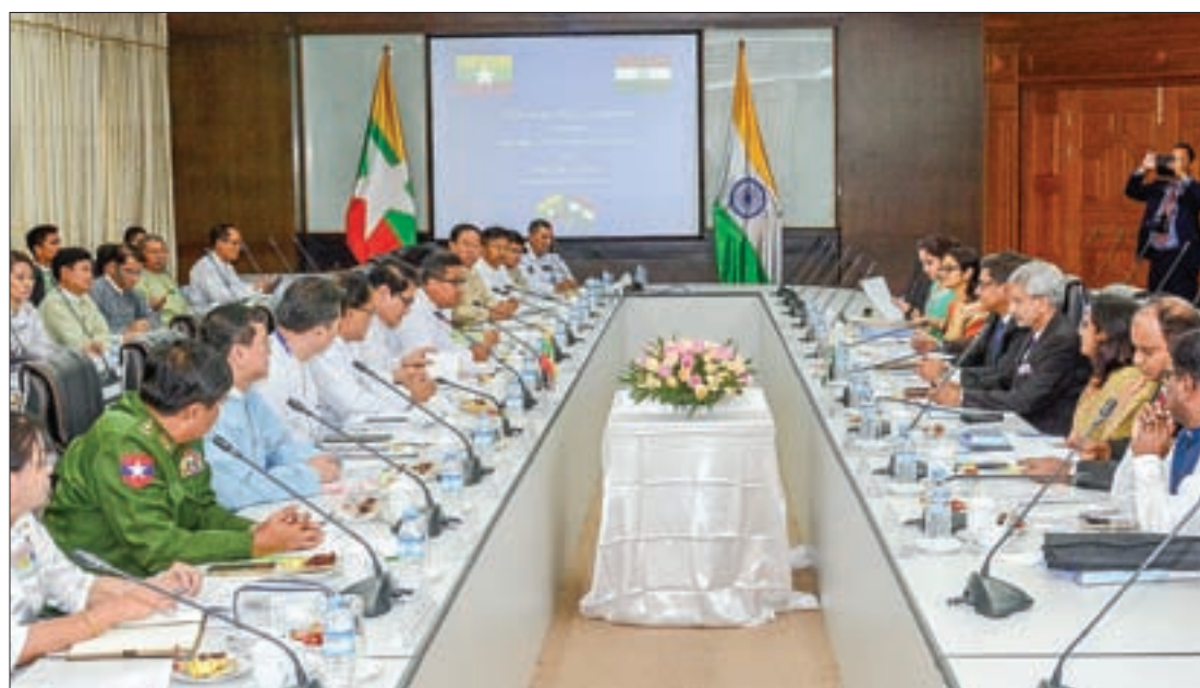
The 16th round of Myanmar-India Foreign Office Consultations met yesterday in Nay Pyi Taw to discuss on various topics on bilateral relations and multi-faceted cooperation.