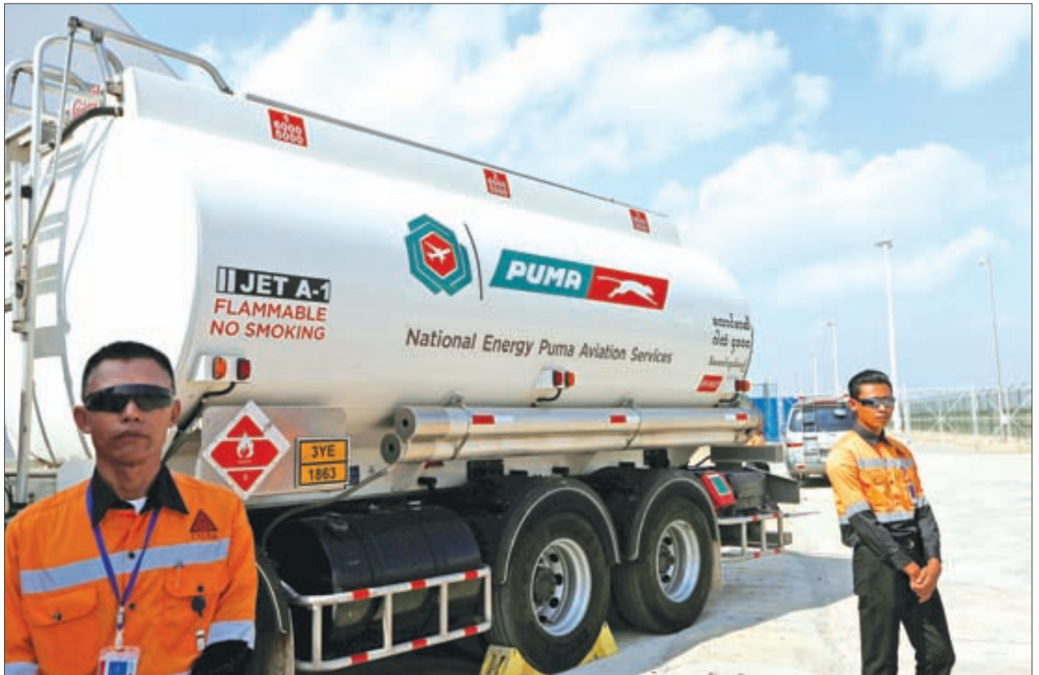
Security guards stand near a tanker carrying aviation fuel during the opening ceremony of Puma Energy fuel storage facility at Myanmar International Terminal Thilawa outside Yangon on 6 May.

Most of the sugar produced in the country has only local market interest, but local manufacturers are putting forth continuous efforts to produce export-quality sugar.—200