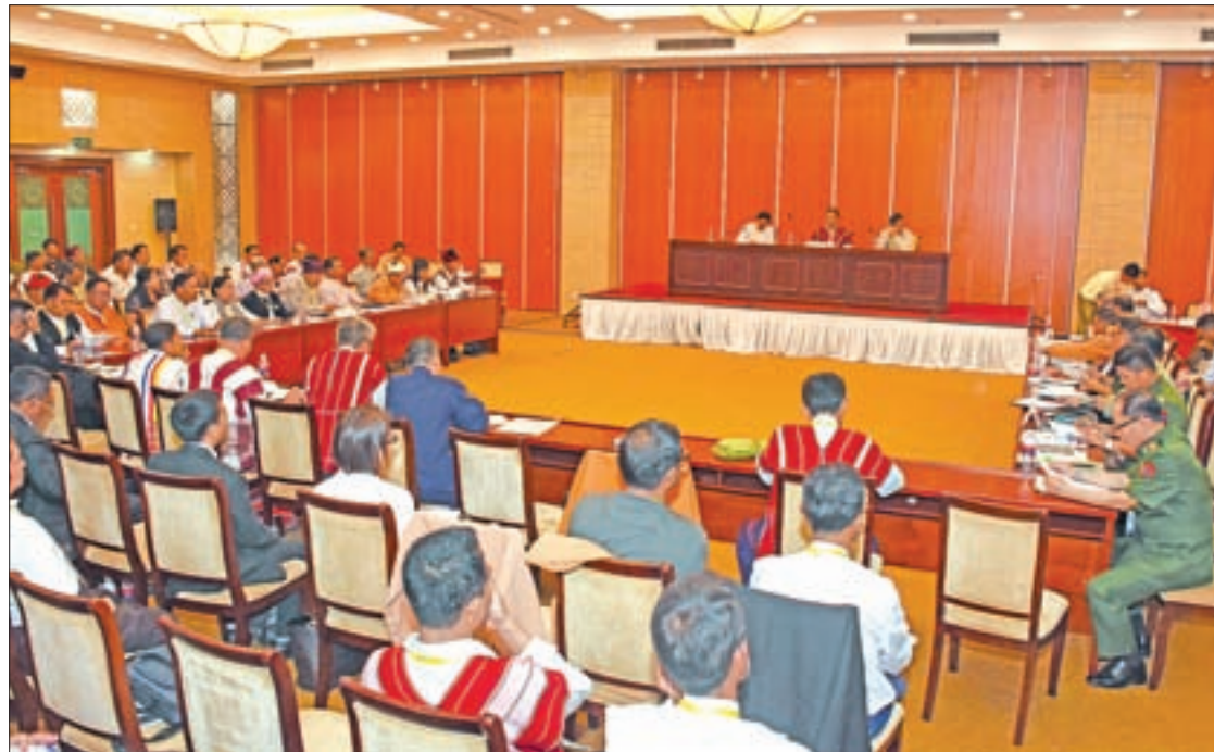
Representatives discuss matters concerning the political sector at the press conference.

In the discussion of the political sector, the topics of the proposal on sovereignty, proposals on exercising sovereignty, the proposal on equality, the proposal on self-promulgation, the proposal on the policy of Federal Union