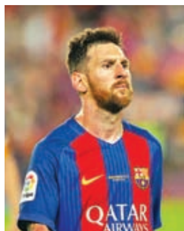
Barcelona's Lionel Messi.

BARCELONA — La Liga club Barcelona have expressed their support for Argentine striker Lionel Messi and his father after the Spanish Supreme Court upheld their prison sentences over tax fraud charges, although neither are expected to go to jail.