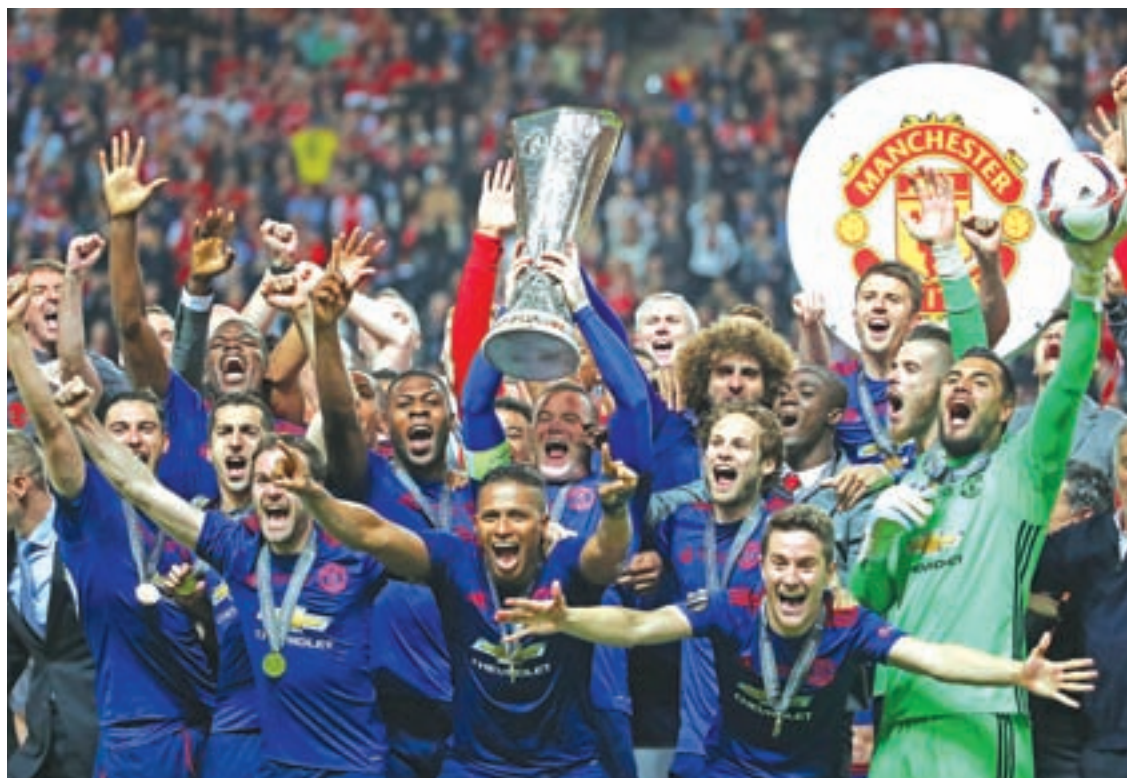
Manchester United's Wayne Rooney and teammates celebrate with the trophy after winning the Europa league on 24 May.

"We know things like this are very sad all over the world," said Pogba referring to the attack. "We had to focus. Manchester — we won for them. We played for England, we played for Manchester and we played for them — the people who died."