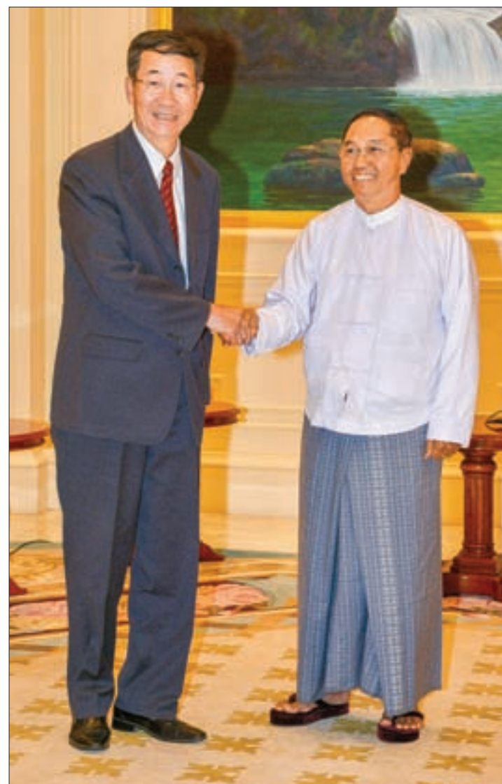
Vice President U Myint Swe shakes hands with Special Envoy Mr. Sun Guoxiang in Nay Pyi Taw yesterday.

Afterwards, Minister of State for Foreign Affairs hosted a luncheon in honour of the Indian delegation led by the Foreign Secretary at Park Royal Hotel, Nay Pyi Taw. —Ministry of Foreign Affairs ■