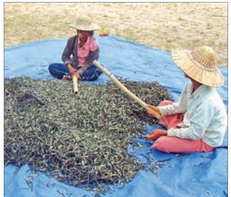
Farmers harvest pea on a farm at a village near Nay Pyi Taw. Pea price slumped due to halt of pea purchase from India.

A total of 1.43million tonnes of various peas were exported in the Fiscal Year 2016-2017, according to the Commerce Ministry.—Ko Khant ■