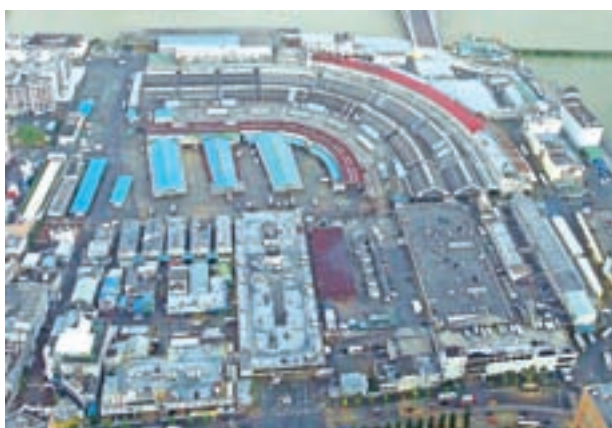
Photo taken in August 2016 shows aerial view of Tokyo's Tsukiji fish market. The Tokyo metropolitan government said on May 25, 2017, that toxic substances exceeding legal safety limits have been detected in soil samples from the market.

Koike, who became governor last August, has suspended a plan to transfer the wholesale market to the Toyosu waterfront district due to soil and air