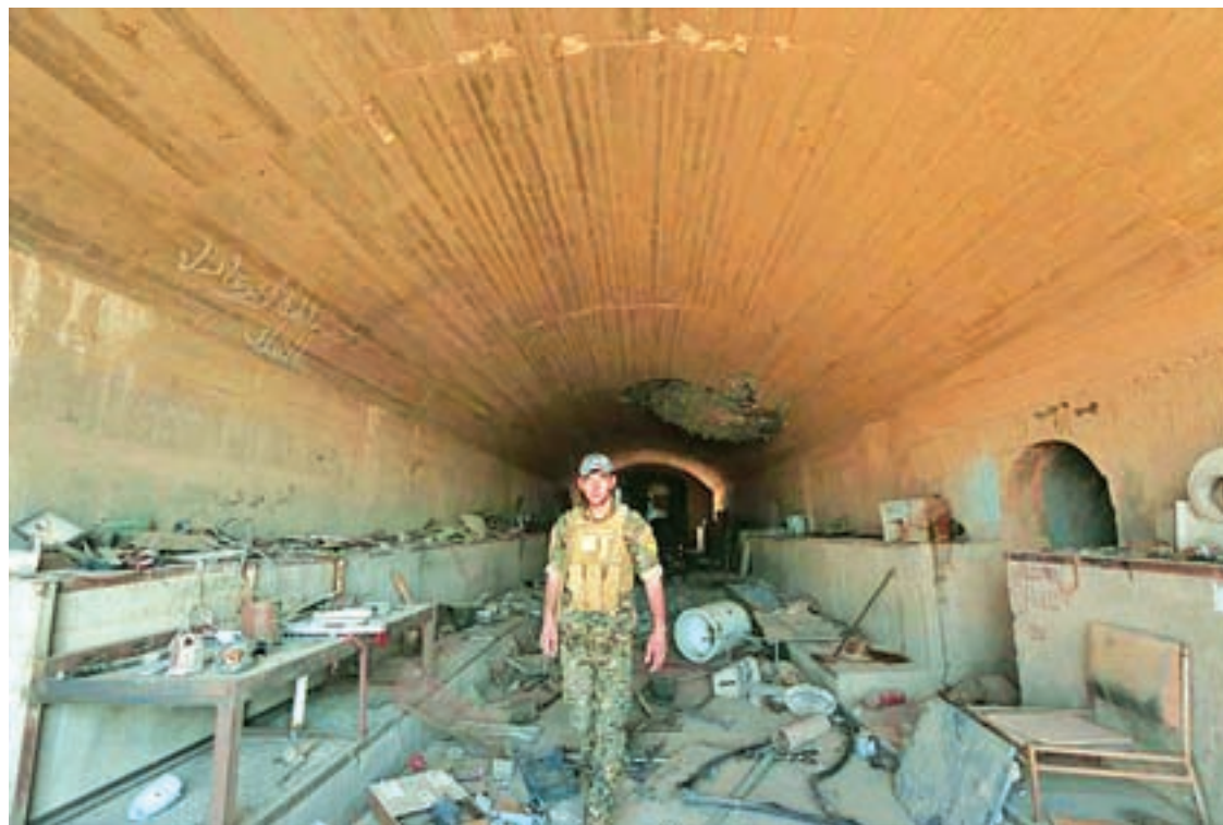
A Syrian Democratic Forces (SDF) fighter inspects a damaged building inside Tabqa military airport after taking control of it from Islamic State fighters, west of Raqqa city, Syria, on 9 April 2017.

In a statement, the SDF said a 15 May appeal for militants to turn themselves in within 10 days had achieved "positive results",