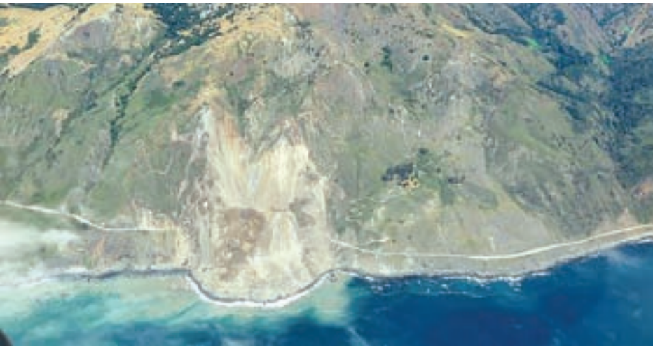
A massive landslide is seen in this Caltrans aerial photo of a quarter-mile section of State Route 1 about 100 miles south of San Jose, California, US in this photo released on 24 May 2017.

The Big Sur portion of State Route 1 is designated as a National Scenic Byway