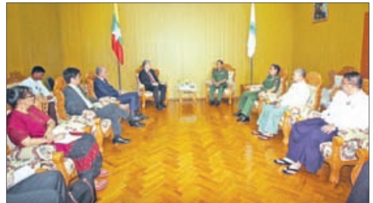
Union Minister Lt-Gen Ye Aung receives a delegation led by UN Assistant Secretary-General Mr. Miroslav Jenca.

that shop and the other 2 shops were also gutted by time. The fire was under control within half an hour by the Fire department including 3 fire engines also with the help of public and local police force. Fire destroyed 3 shops, and action is being taken against U Zaw Myint Kyi for the negligence fire.—Myanmar News Agency ■