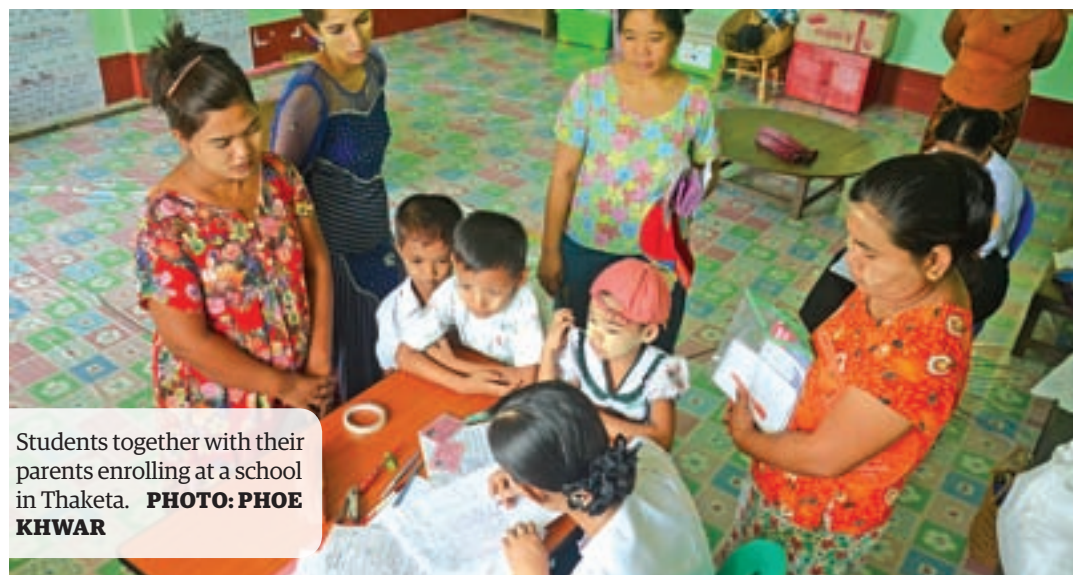
Students together with their parents enrolling at a school in Thaketa.

“The meeting between the State Counsellor and the northern armed groups is ‘social’”, said U Zaw Htay, the spokesman of the government. Several representatives of northern ethnic armed groups accepted invitations to the Union Peace Conference-21st Century Panglong (Second Session) as special guests and attended the conference's opening ceremony. ■