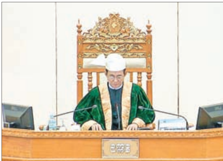
Pyithu Hluttaw Speaker U Win Myint.

Daw Cho Cho of Ottwin constituency raised the question of whether there is any plan to control and guide cases of allowed budget being more than the actual