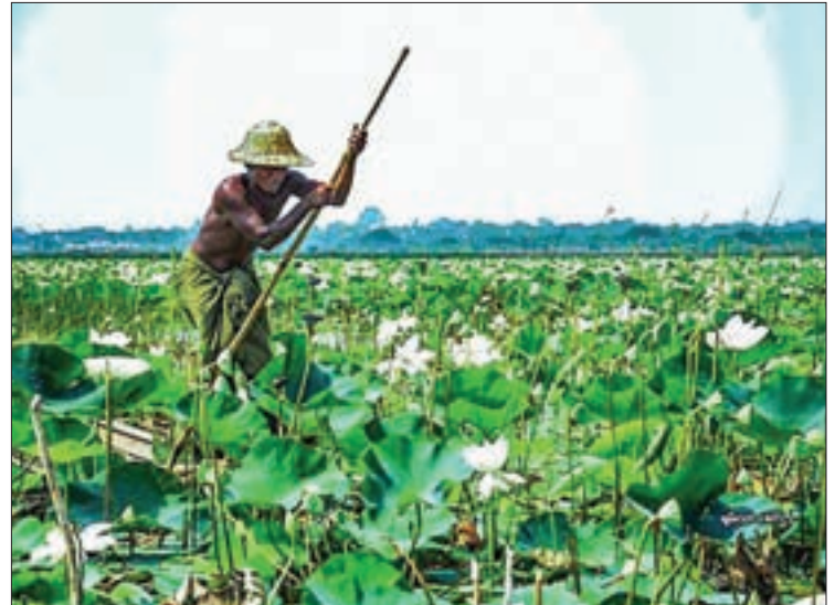
A man rows a boat in Meiktila Lake which has full of lotus flowers in the Wunzin Ward in Meiktila, Mandalay.

The lake is also being used as the natural setting to photograph both male and female models as well as couples wishing to take pre-wedding photographs.—Chan Tha (Meiktila) ■