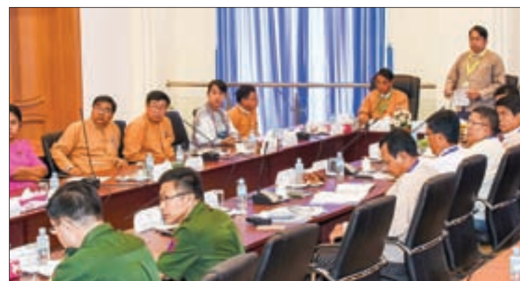
Union Minister Dr. Pe Myint explaining the role of the Ministry of Information to the attendants.

Next, the Union Minister gave a closing address and the committee chairman spoke words of thanks.—Myanmar News Agency ■