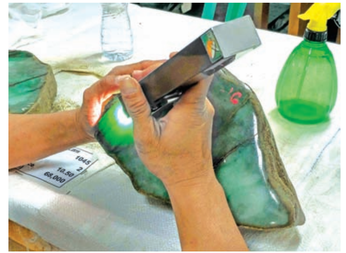
A jade stone being appraised at the 53rd Myanmar Gems Emporium at the Mani Yadana Jade Hall in Nay Pyi Taw.

The ministry granted seven-year permits and five-year