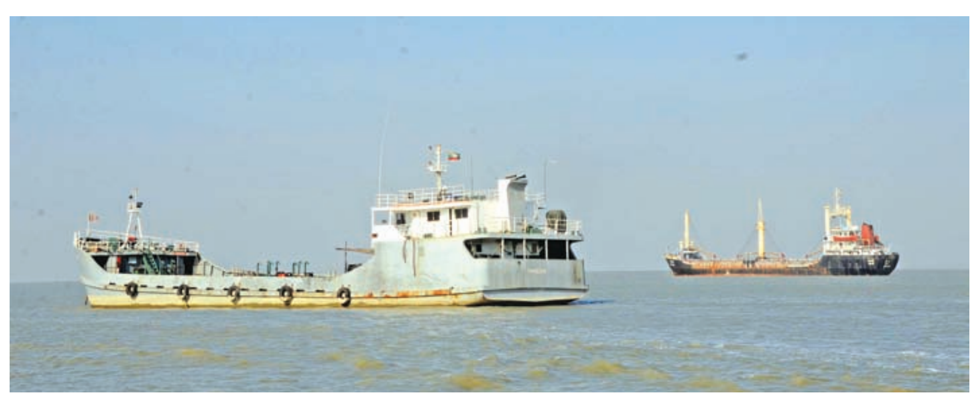
The Kaladan project on the Kaladan River will connect Sittway, the capital of Rakhine State, and the Mizoram in India.

NATIONAL 20 MAY 2017 THE GLOBAL NEW LIGHT OF MYANMAR