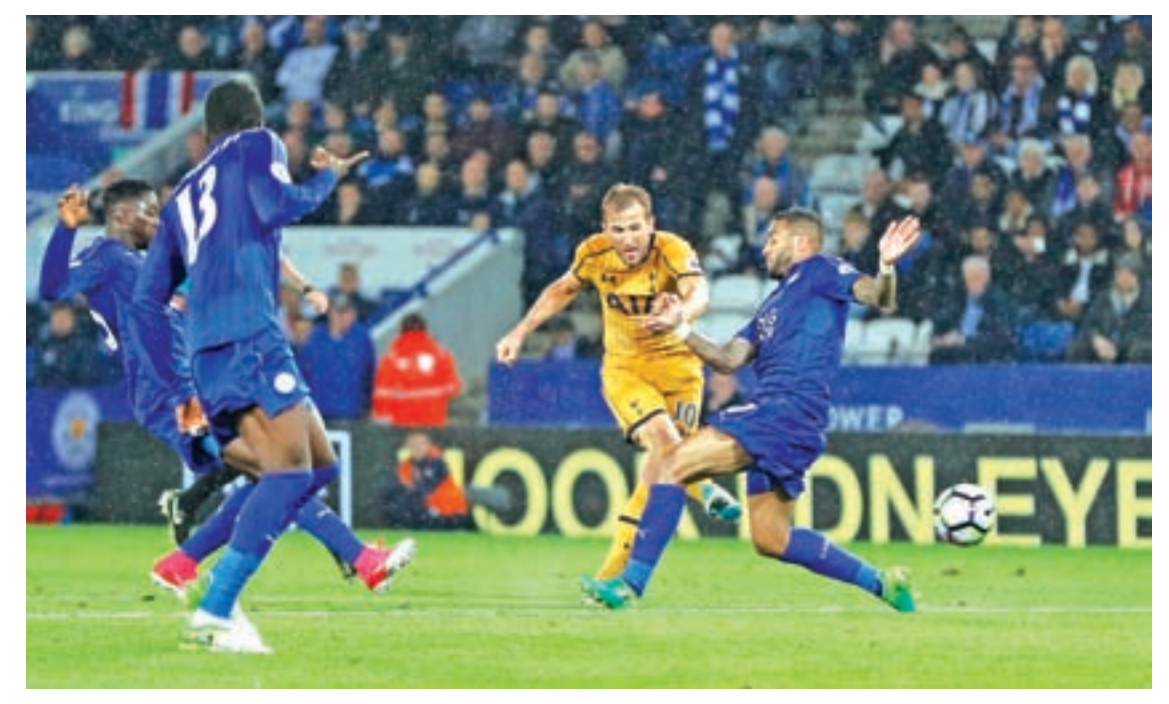
Tottenham's Harry Kane scores their fifth goal to complete his hat trick during Premier League at King Power Stadium, on 18 May 2017.

"I wanted to get one or two goals at least and take it (the battle for the Golden Boot) to the final game," the England striker told Sky Sports after firing Spurs