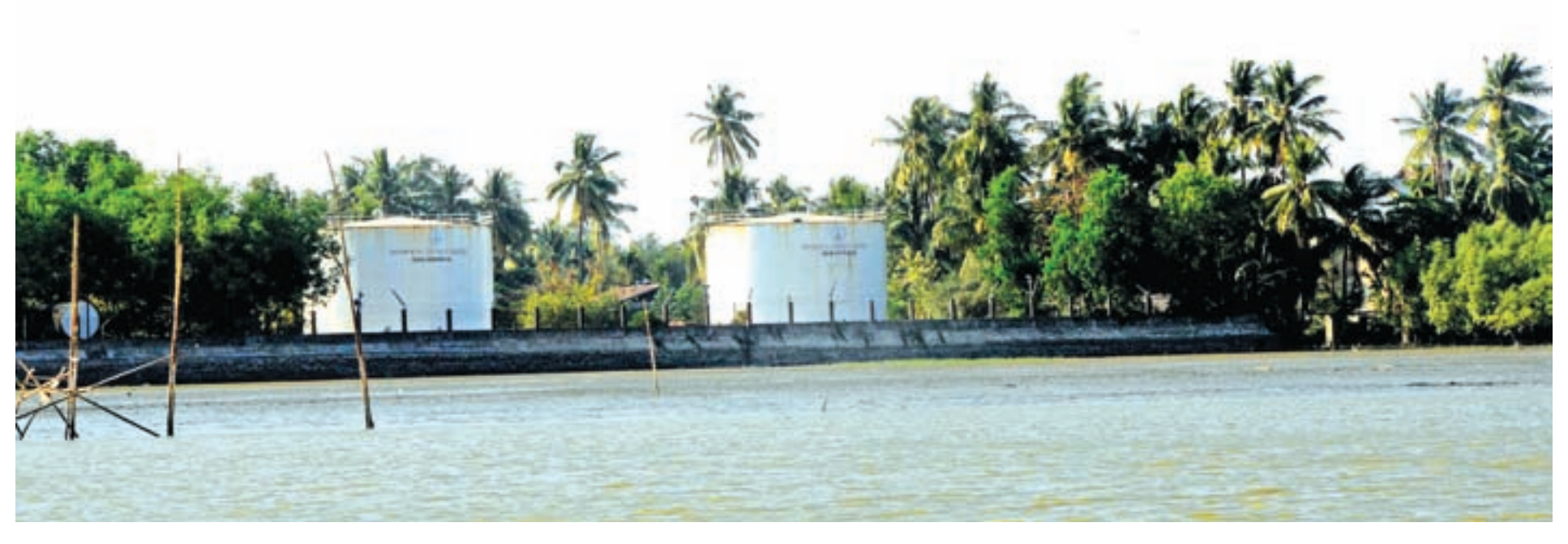
A fish farm by Inn Pauk Wa Co Ltd in Rakhine State, which mainly does prawn and fish breeding in its abundant rivers and lakes.