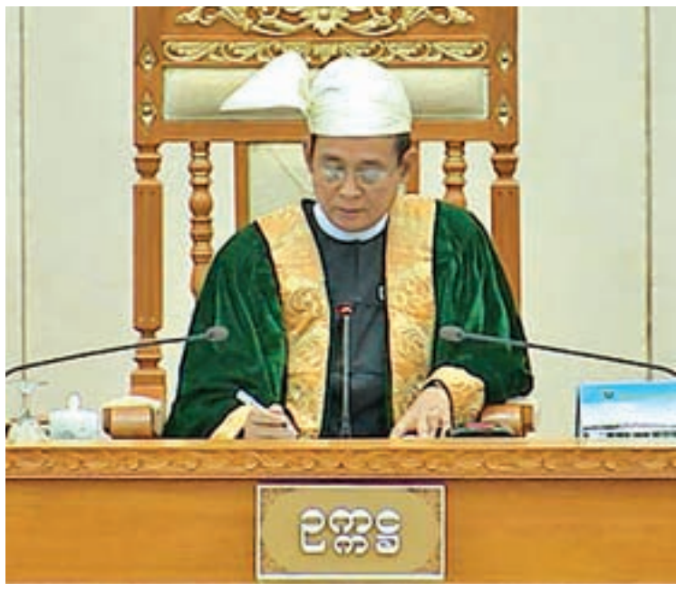
Speaker of Pyithu Hluttaw U Win Myint.

tarian who presented the motion, forest coverage in Myanmar dropped from 60% in 1990 to 43% in 2015 and there occurred cutting down forests excessively in the country legally or illegally, burning trees for hill farming, extending farming land, wild fires outbreaks, insects affecting crop production, exploitation of underground resources, building dams and embankments, urban sprawl and deforestation caused by natu-