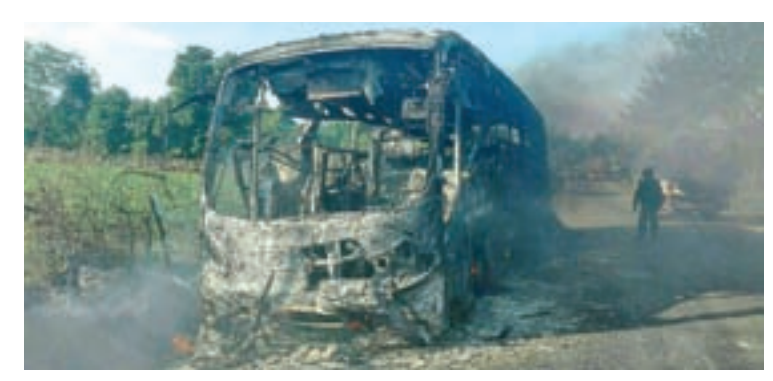
The bus burnt by KIA armed group as a warning for extortion

curred and are following the retreating armed group. The Tatmadaw endeavor to protect the people and safeguard the regional security it is learnt. —Myanmar News Agency