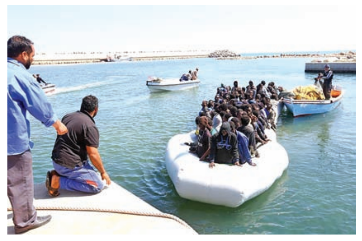
Illegal migrants arrive after being rescued by Libyan coast guards in the sea off the coastal town of Guarabouli to the east of Libya's capital Tripoli, on 18 May 2017.

committee also held a meeting last week to discuss illegal immigration and southern Libyan border security.