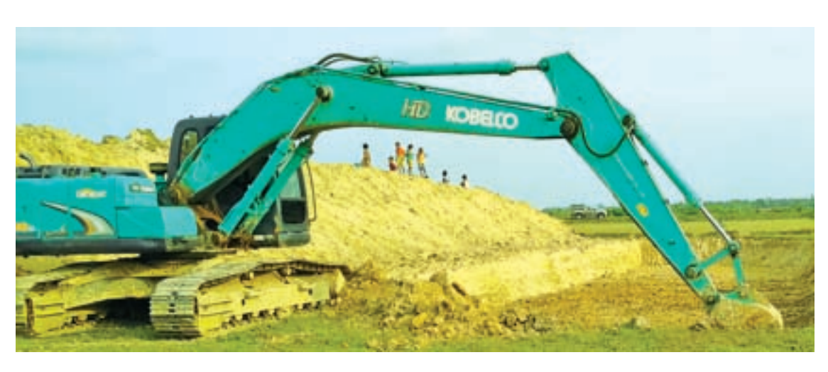
A fish pond is being dug with the use of heavy machinery in Maungtaw.

The newly permitted hotel and guesthouses are 2 guesthouses in Sittway with 30 rooms, a hotel and 3 guesthouses in Kyaukphyu with 93 rooms.