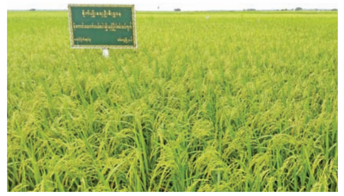
Thriving rice field in Sittway, Rakhine.