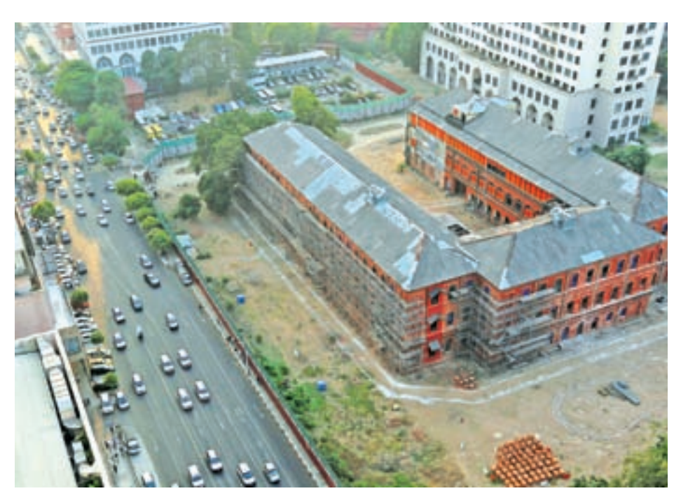
The old Burma Railway Headquarters building is seen in Yangon on 27 April 2016.

THE volume of construction will grow to US$15.5 trillion worldwide by 2030, according to PWC statistics. Companies from China, US and India can invest in the construction sector.