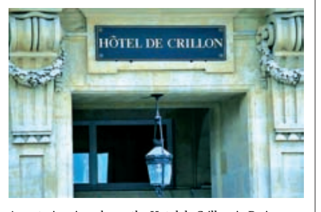
An exterior view shows the Hotel de Crillon, in Paris, France, on 17 May 2017.

"I think it could take (Paris) palaces at least five years to return to average occupancy rates of 65-67 per cent," said Gwenola Donet, head of France for JLL Hotels & Hospitality.—Reuters