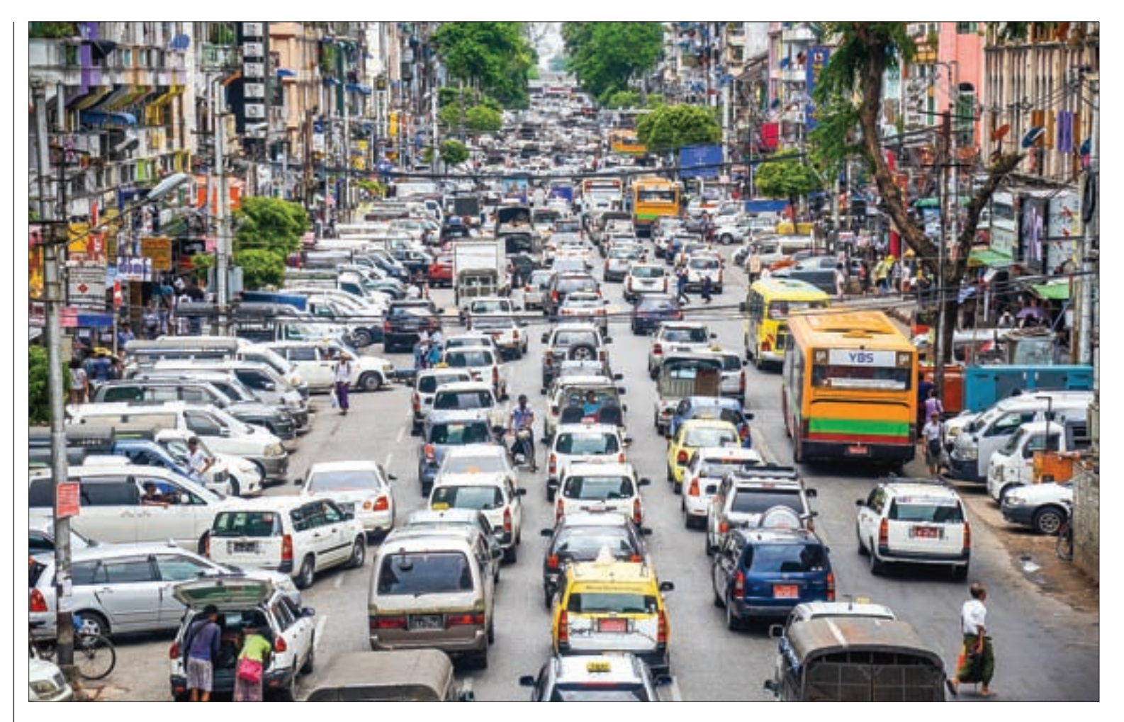
Despite the decline in car sales, numerous vehicles congest the roads of Yangon daily.

During April, the gold price hit the lowest rate of around Ks894,000 per tical and a record high of Ks911,800. The global gold prices per tical were Ks895,000 on 15th, Ks900,500 on 16th and Ks905,000 on 17th May. — Htet Myat 🔳