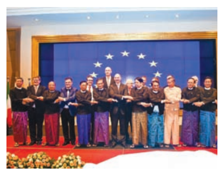
Union Minister U Kyaw Tint Swe poses with other participants of the European Union Day celebration in Nay Pyi Taw.

en against the accused, over the letters of objection.-Union Election Commission (Unofficial Translation)