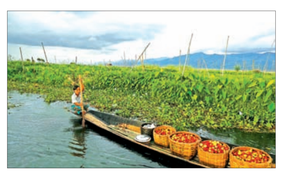
A woman rows her boat as she harvests tomatoes on Inle lake, in Nyaungshwe Township, Shan State.

A wide variety of fish and snail species have been found in the lake, which also hosts rare migratory birds.—200 ■