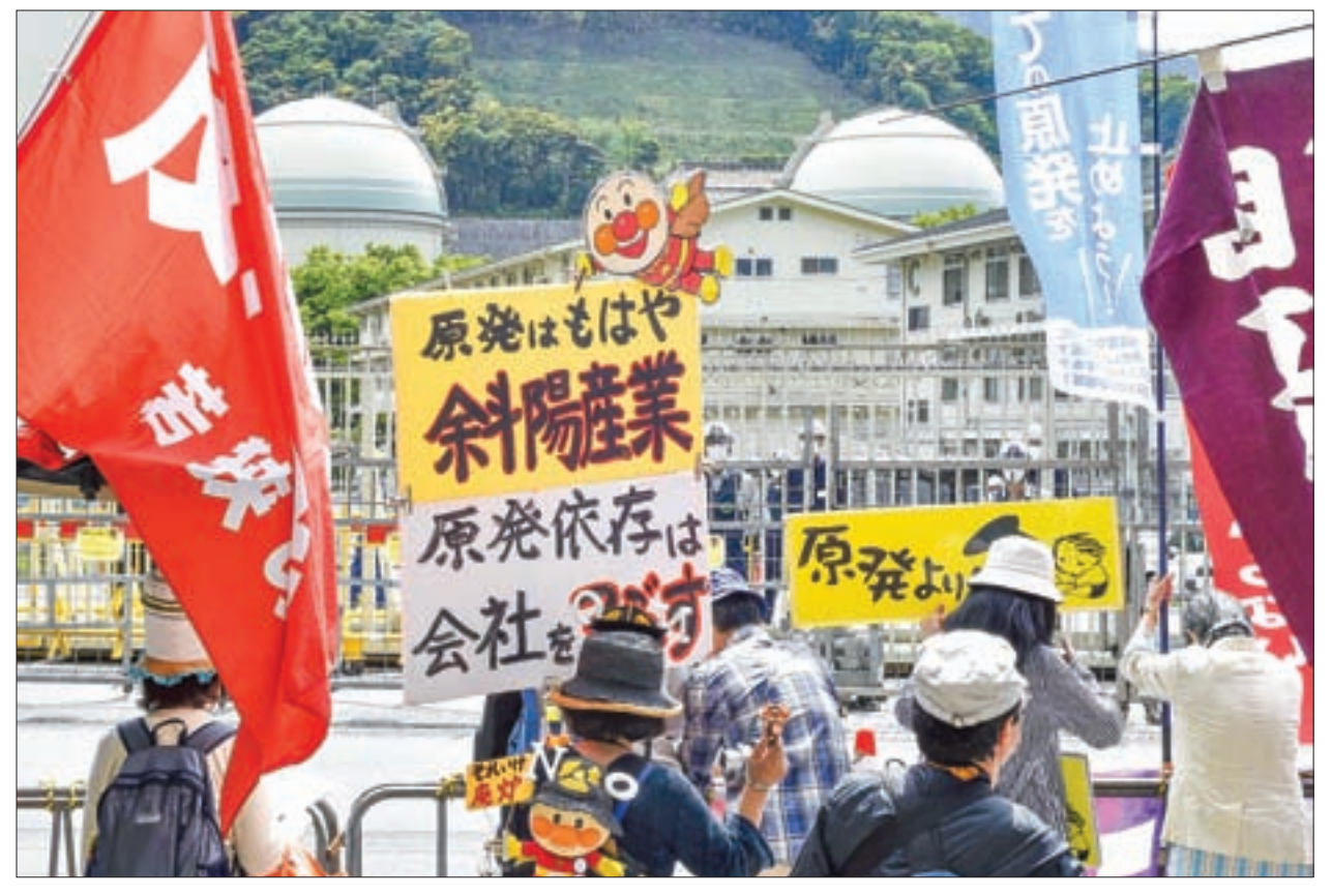
Protesters rally in front of Kansai Electric Power Co.'s Takahama nuclear power plant in Fukui Prefecture, central Japan, on 17 May 2017, against the company's imminent restart of a reactor at the plant.