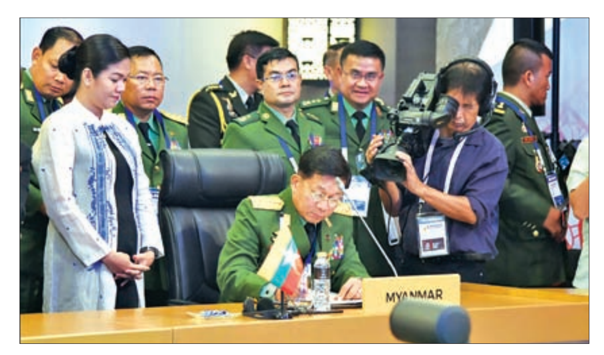
Senior General Min Aung Hlaing signing the joint statement of the 14th ACDFIM.