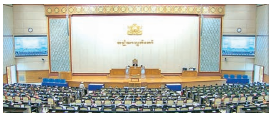
The first day of 5<sup>th</sup> regular session the second Amyotha Hluttaw is being convened in Nay Pyi Taw.

Then, the representative of No 11 constituency in Rakhine State, Daw Htu May questioned about the plan to appoint a per-