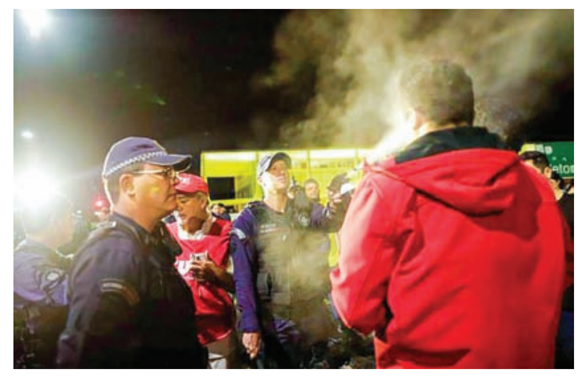
A police officer uses pepper spray against a demonstrator during a protest against Brazil's President Michel Temer in front of the Planalto Palace in Brasilia, Brazil, on 17 May, 2017.

assets in foreign markets after the news broke late in Brazil, as the prospect of Temer becoming enmeshed in a fresh political crisis clouded the prospects for his unpopular reform agenda, considered key to ending a deep recession.