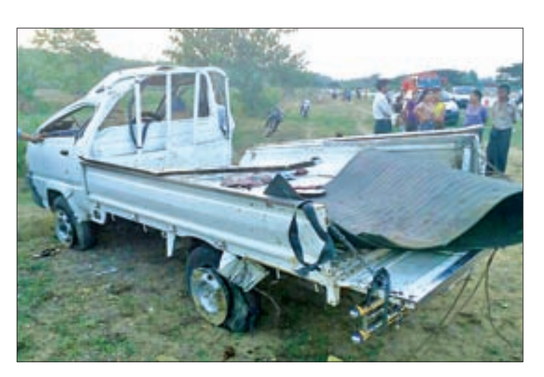
Overturned light truck seen at Yangon-Mandalay Highway.

Police filed charges against the reckless driver under section 304 (A)/338/337 of the Penal Code.—Than Oo (Lemyathna)