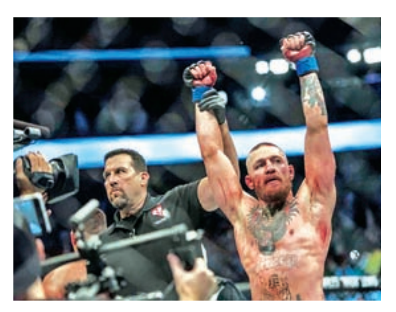
Conor McGregor (blue gloves) reacts to fight with Nate Diaz (red gloves) during UFC 202 at T-Mobile Arena Las Vegas, NV, on 20 August 2016.

United host Crystal Palace in their last league game of the season on Sunday before travelling to Stockholm to face Ajax Amsterdam in the Europa League final on 24 May. -Reuters