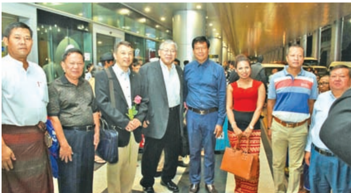
The delegation from Kodokan Judo Institute is welcomed by officials.

The delegation will form a special committee for the Myanmar Judo Federation to give certificates for Myanmar Judo athletes directly. — Saw Thein Win ■