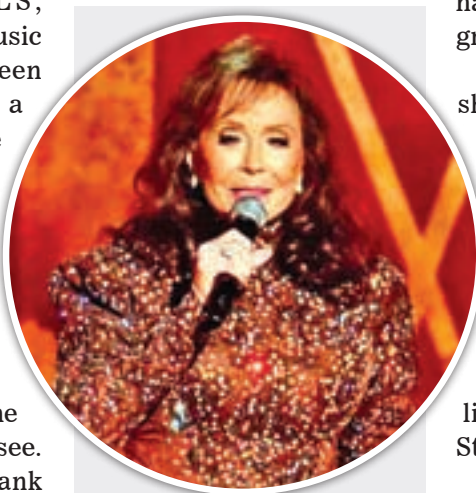
Musician Loretta Lynn performs during the 48th Country Music Association Awards in Nashville, Tennessee on 5 November, 2014.

“Loretta wants to thank everybody for their prayers, love and support,” her representatives posted on the singer’s official Facebook page on Monday. “Loretta has been moved from hospital facility in to rehabilitation and we’re