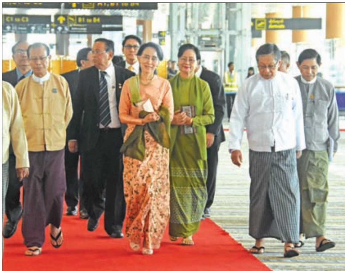
State Counsellor Daw Aung San Suu Kyi welcomed back at Nay Pyi Taw International Airport.