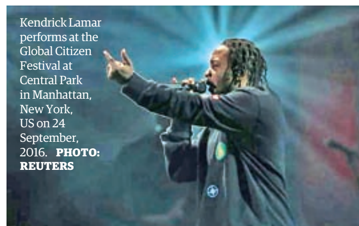
Kendrick Lamar performs at the Global Citizen Festival at Central Park in Manhattan, New York, US on 24 September, 2016.

Born in Kentucky, she carved a career in the country music scene with her down-home twangy voice, writing and singing hits such as 1960’s “I’m a Honky Tonk Girl” and “Coal Miner’s Daughter,” released in 1970. —Reuters ■