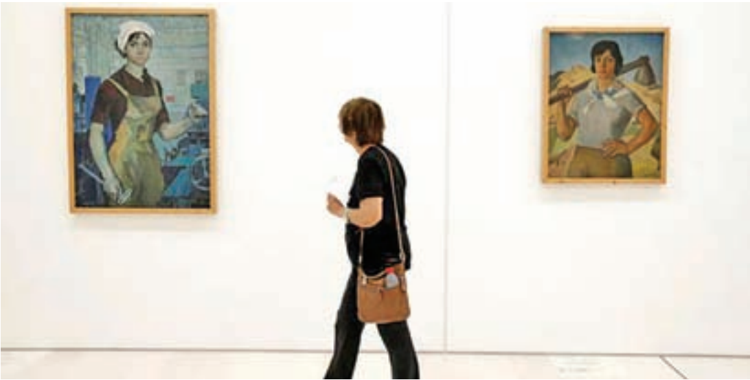
A visitor walks past the paintings 'The Turner' (L) by Albanian artist Zef Shoshi and 'The Action Worker' by Hasan Nallbani during the 'Documenta 14' art exhibition in the National Museum of Contemporary Art in Athens, Greece on 9 May, 2017.