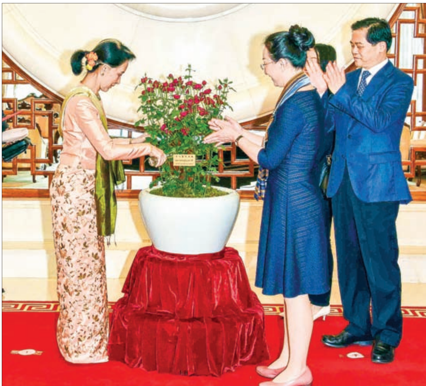
State Counsellor Daw Aung San Suu Kyi waters the rose named after her at a ceremony in Yunnan Province in China.