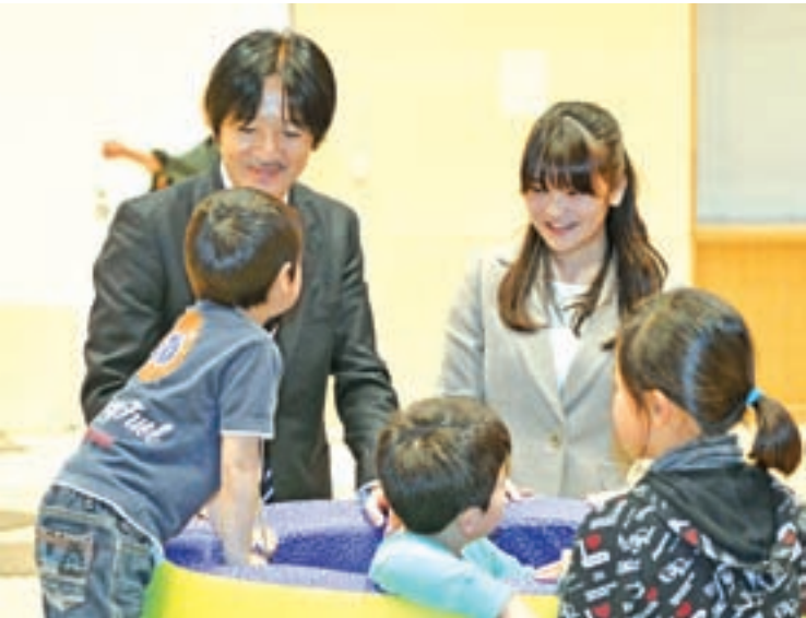
Photo taken in March 2014 shows Japan's Princess Mako (R), a granddaughter of Emperor Akihito, meeting children who lost their parents in the March 2011 earthquake and tsunami disaster, along with her father Prince Akishino (L) in Sendai, northeastern Japan. The 25-year-old princess will soon become engaged to a man who also went to Tokyo's International Christian University, the Imperial Household Agency said on 16 May, 2017.