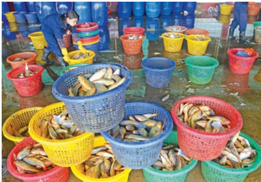
Worker sorts through deliveries of fish at the fish market.

Fisheries exports earned over US$668mil in 2011-2012, over US$493mil in 2012-2013 and over US$341mil in 2013-