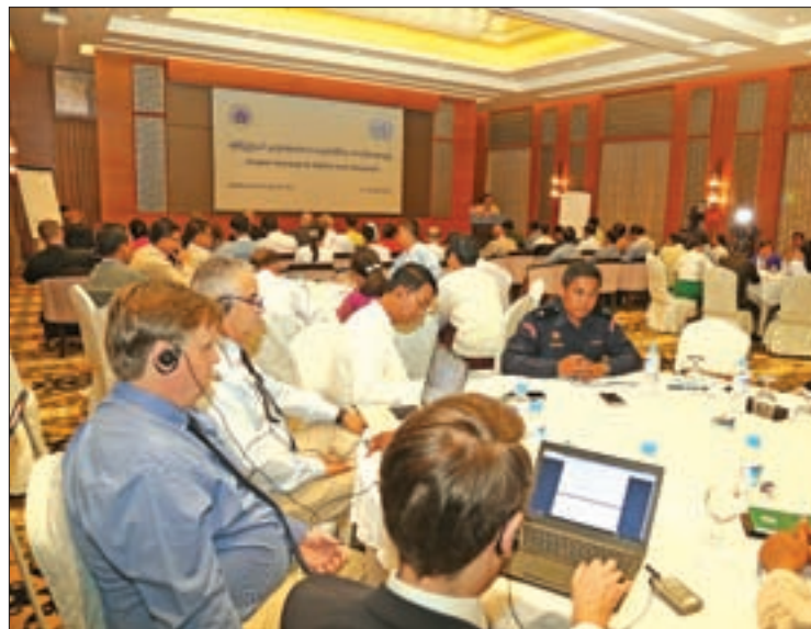
Union Minister Dr. Win Myat Aye delivers a speech at the initiation workshop in Nay Pyi Taw.

Cessation of conflicts and achievement of peace is of great importance, it was determined. It is necessary for 15 regions and states, including Nay Pyi