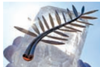
A Chopard representative displays the Palme d’Or, the highest prize awarded to competing films, during an interview before the start of the festival at 70 th Cannes Film Festival in Cannes, France on 17 May, 2017.

“Set in and around Calais as the refugee crisis grows, the film is certainly not short of political relevancy,” said Irish Times critic Donald Clarke, who reckons this year’s line-up is “the most promis-