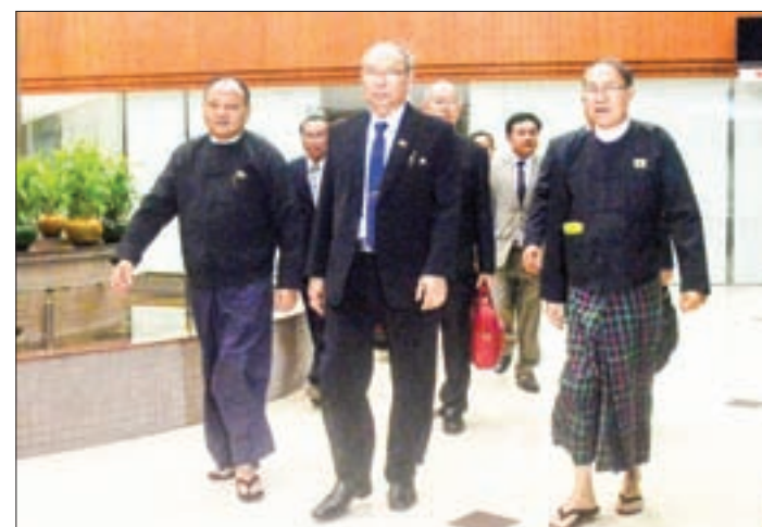
Amyotha Hluttaw Speaker Mahn Win Khaing Than (center) arrives back Yangon International Airport.

The President of the Republic of the Union of Myanmar has appointed U Win Myint, Ambassador at the Embassy of the Republic of the Union of Myanmar in Singapore, as Ambassador Extraordinary and Plenipotentiary of the Republic of the Union of Myanmar to the Islamic Republic of Pakistan.—Ministry of Foreign Affairs ■