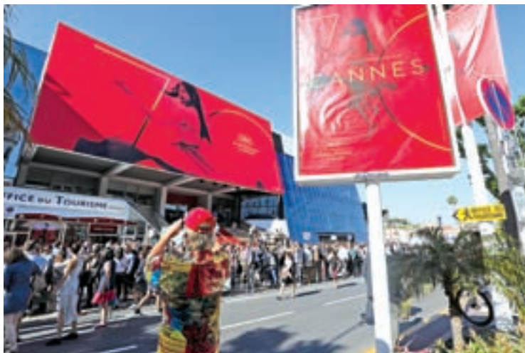
A tourist takes a photo of the official poster, featuring actress Claudia Cardinale, on the facade of the festival palace at 70 th Cannes Film Festival in Cannes, France on 17 May, 2017.

While a fight between American streaming giant Netflix and French movie theaters has overshadowed the opening, fans of auteur cinema are excited to see the latest works by the likes of Noah Baumbach, Francois Ozon and Lynne Ramsay. Todd Haynes, director of acclaimed lesbian drama “Carol”, has the first film in the main competition, “Wonderstruck”, based on a half-text, half-graphic novel about the inter-connected stories of two troubled children, set decades apart. Sofia Coppola’s “The Beguiled”, one of two films screening at Cannes starring Nicole Kidman and Colin Farrell, is a remake of the 1971 Clint Eastwood