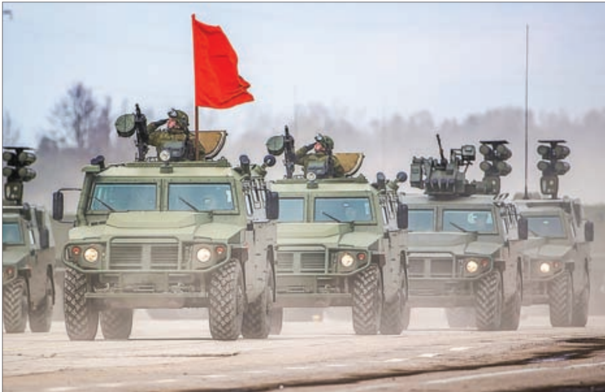
The new vehicle will have a heavy-lift capacity and a V-shaped undercarriage and more comfortable seating for the combat crew and landing troops.