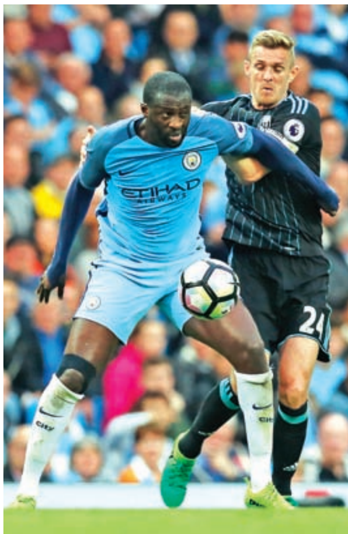
Manchester City's Yaya Toure in action with West Bromwich Albion's Darren Fletcher during the match of Premier League between Manchester City and West Bromwich Albion at Etihad Stadium on 16 May, 2017.

Arsenal, in fifth have 72, and could only catch City if Pep Guardiola's side lost to Watford on the final day and Arsenal beat Everton and there was a five-goal swing in goal difference. —Reuters ■