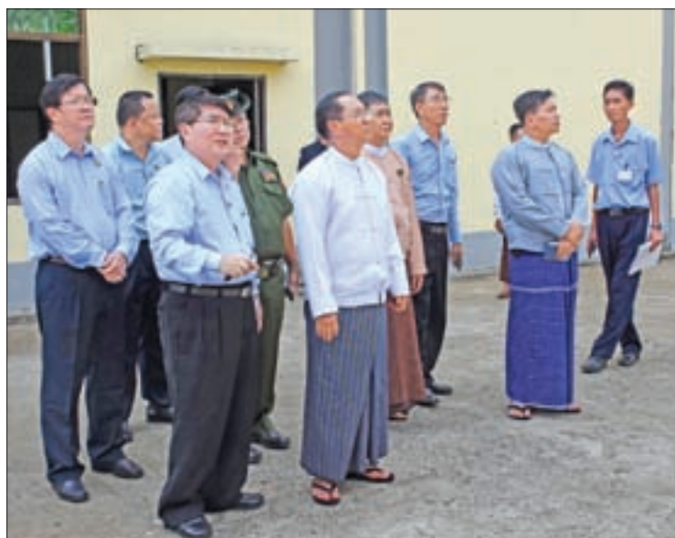
Vice President U Myint Swe inspects Ye Nwe hydropower plant in Sittaung.