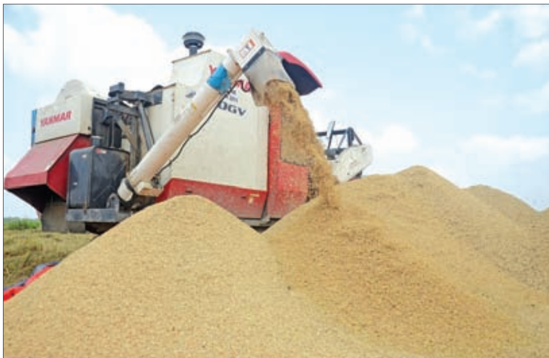
The machine adding at the rice heap at Kangyidauk, Ayeyawady.

Myanmar exported 1.4 million tonnes of rice in 2012-2013 FY, 1.2 million tonnes in 2013-2014 FY, 1.8million tonnes in 2014-2015 FY, 1.4million tonnes in 2015-2016 FY and 1.7million tonnes in 2016-2017 FY, according to an announcement of the Commerce Ministry.