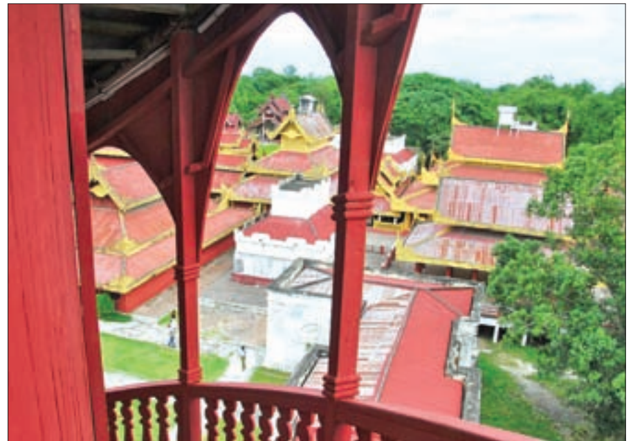
The Mandalay Palace, Ancient city of Innwa, also known as Mya-Nan-San-Kyaw-Shwe-Nan-Taw.

Currently, entrance fees for foreigners cost Ks 10,000 each and Ks 200 for local visitors. Nearly 180,000 foreign travellers visited the Palace in 2016.—200