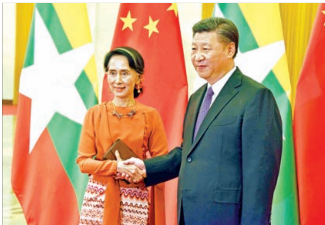
State Counsellor Daw Aung San Suu Kyi shakes hands with Chinese President Xi Jinping as they meet at the Great Hall of the People in Beijing, China, yesterday.

The documents signed were "Agreement on Economic and Technical Cooperation between the Government of the Republic of the Union of Myanmar and the Government of the People's Republic of China", "Memorandum of Understanding between Ministry of Commerce of the Republic of the Union of Myanmar and Ministry of Commerce of the People's Republic of China on the Establishment of China-Myanmar Border Economic Cooperation Zone", "Memorandum of Understanding between the Government of the Republic of the Union of Myanmar and the Government of the People's Republic of China on Cooperation within the Framework of the Silk Road Economic Belt and the 21st Century Maritime Silk Road Initiative", "Memorandum