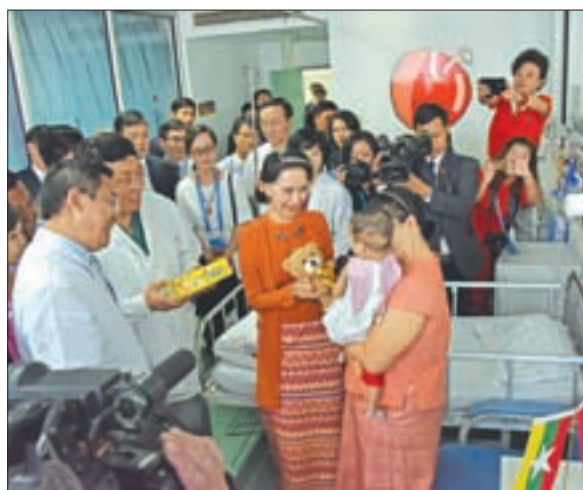
State Counsellor visits Myanmar children from Yankin Children's Hospital who are receiving free heart surgery at Anzhen Hospital in Beijing.