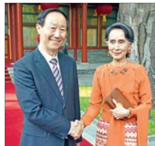
State Counsellor meets Mr. Wang Jiarui of the Chinese People's Political Consultative Conference.

of Understanding on Health Cooperation between the Ministry of Health and Sports of the Republic of the Union of Myanmar and the National Health and Family Planning Commission of the People's Republic of China" and "Memorandum of Understanding between the Ministry of the Religious Affairs and Culture of the Republic of the Union of Myanmar and the State Administration of Cultural Heritage of the People's Republic of China on Cooperation in Post-quake Restoration and Protection of Historic Monuments of Bagan". In the evening, State Coun-