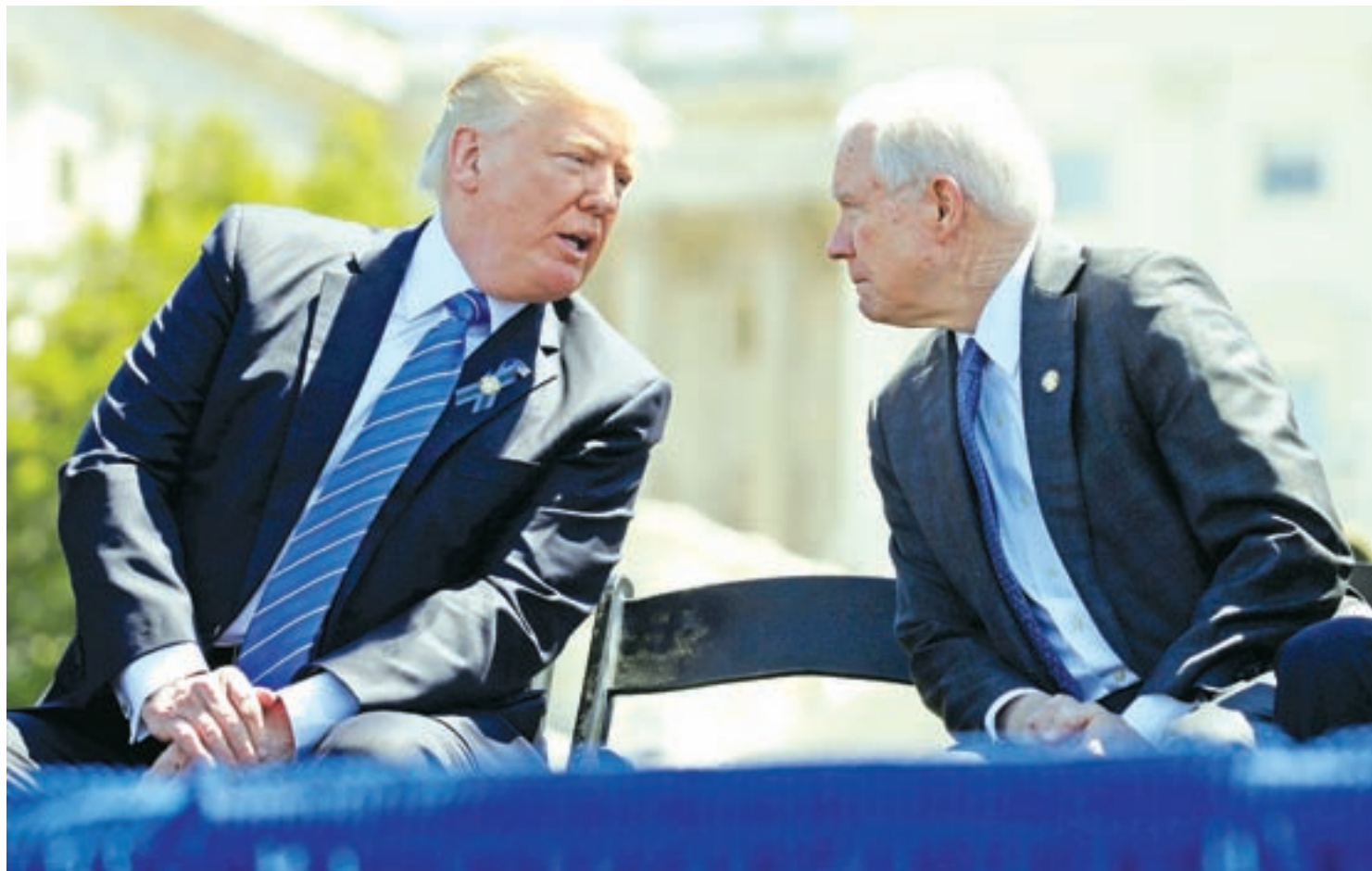
President Donald Trump speaks with Attorney General Jeff Sessions as they attend the National Peace Officers Memorial Service on the West Lawn of the US Capitol in Washington, US on 15 May, 2017.