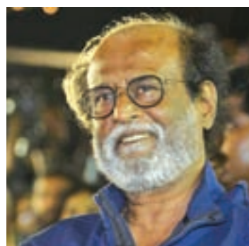
The Tamil superstar Rajinikanth.

He said he thought "wisely" before he took a decision. "If you step into the water and later realise that there are crocodiles in it, you shouldn't brave them and refuse to step out of the water. Such blind courage will take you nowhere," he said.