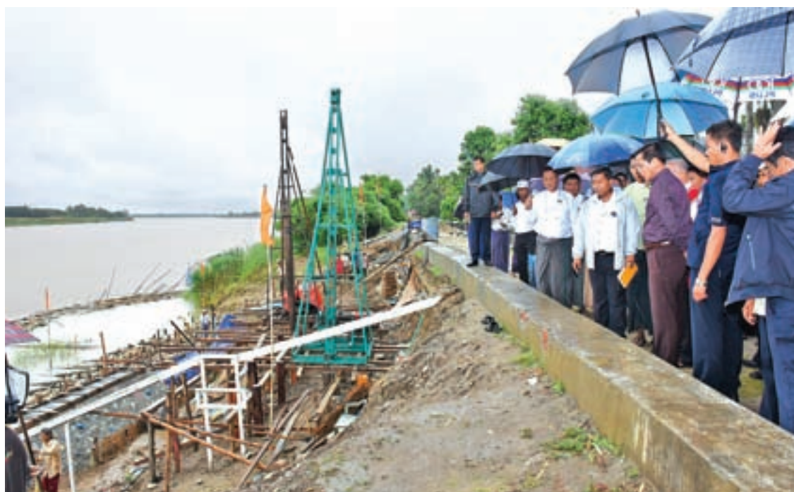
Vice President U Henry Van Thio inspects reinforcement of the bank of the Ayeyawady River during his tour of inspection in Ayeyawady Region.

Following the meeting, Vice President U Henry Van Thio began his tour of inspection by visiting Nyaungdon and inspecting maintenance of the bank of the Ayeyawady River that will prevent erosion.