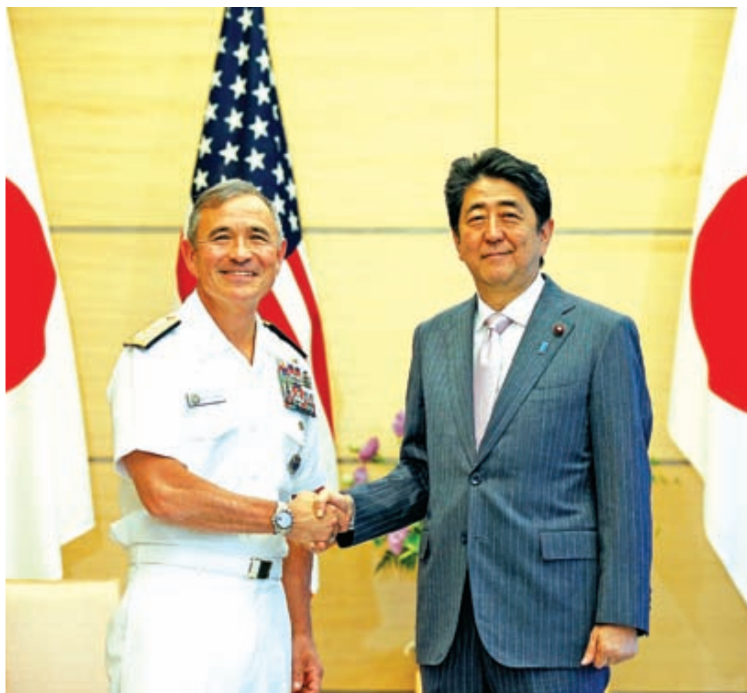
Admiral Harry Harris (L), Commander of the US Pacific Command (USPACOM), shakes hands with Japan's Prime Minister Shinzo Abe at Abe's official residence in Tokyo, on 16 May, 2017.

Referring to the joint drill between the two allies conducted in the Sea of Japan near the