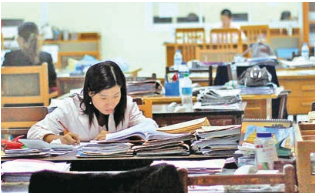
An Employee works at the Myanmar Central Bank's headquarters in Nay Pyi Taw.