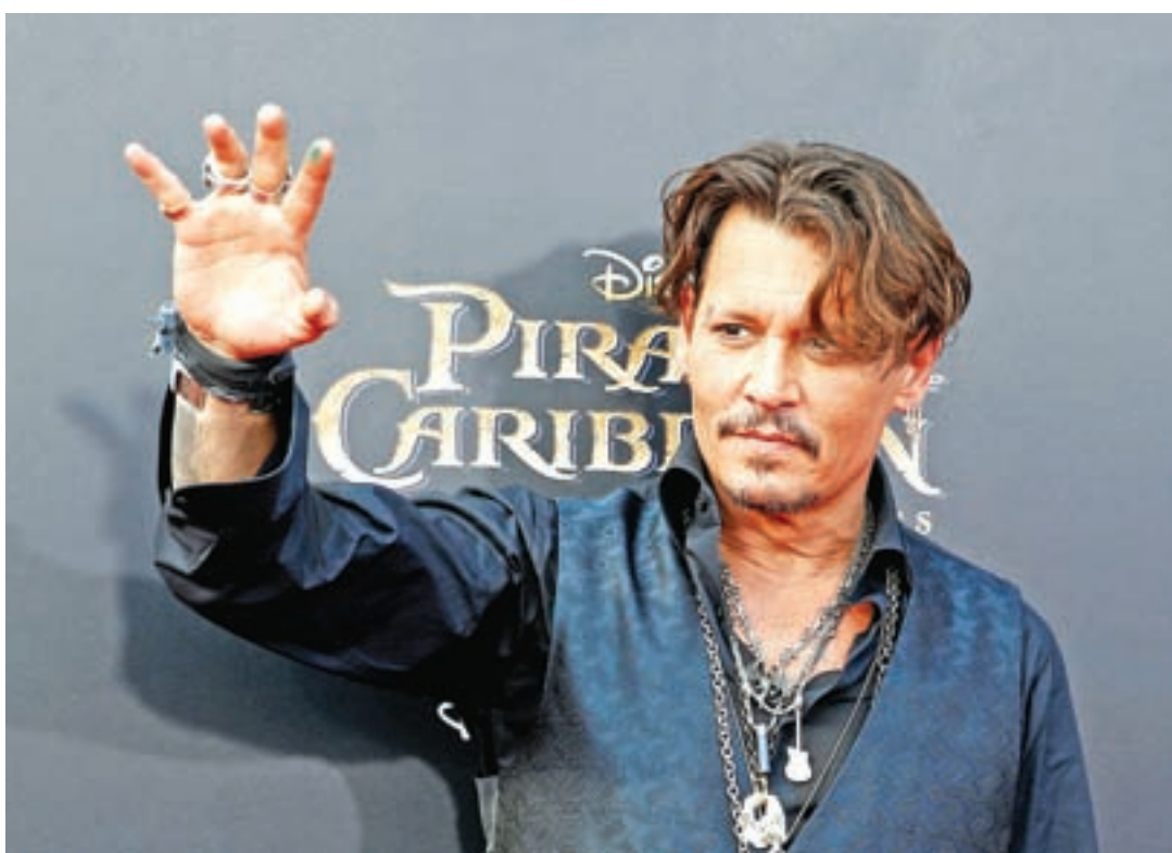
Actor Johnny Depp arrives on the red carpet for the global premiere of the film "Pirates of the Caribbean: Dead Men Tell No Tales", in Shanghai, China on 11 May 2017.

on the air, having debuted in 2011. The renewal was in the cards but the network and studio want more episodes. Created by Liz Meriwether, "New Girl" also stars Jake Johnson, Max Greenfield, Lamorne Morris and Hannah Simone.—PTI ■