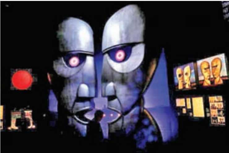
Visitors are silhouetted at The Pink Floyd Exhibition: Their Mortal Remains at the V&A Museum in London, Britain on 9 May, 2017.

LONDON — A new exhibition celebrating the career of Pink Floyd, featuring a raft of memorabilia and tributes to the rock group’s famously surreal iconography, opens in London on Sunday. The Victoria and Albert Museum hosts “The Pink Floyd Exhibition: Their Mortal Remains”, to mark the 50 th anniversary of the release of the British band’s debut album, “The Piper at the Gates of Dawn”. “It’s not just about nostalgia,” said Pink Floyd drummer Nick Mason, who worked with the designers behind some of the band’s most legendary album artwork, Aubrey “Po” Powell and Storm Thorgerson, to conceive and develop the exhibition. “Fifty years always seems like a good moment, and the truth of the matter is that we’re not all here forever. We’ve lost two of the band over the years,” he said, referring to original lead guitarist and main songwriter Syd Barrett and keyboardist Rick Wright, “and it’s so important...if you want to tell these stories to do it when people are still around to tell them.” The exhibition is an audio-visual chronicle of Pink Floyd’s rise from the darlings of London’s underground music scene in the late 1960s to global stardom and a career that saw them sell over 250 million albums. Visitors enter through an oversized recreation of the van that carried Pink Floyd to their early gigs, and can view over 350 artifacts ranging from original concert posters to guitars from the band’s career in addition to unreleased footage of the group at work.—Reuters ■