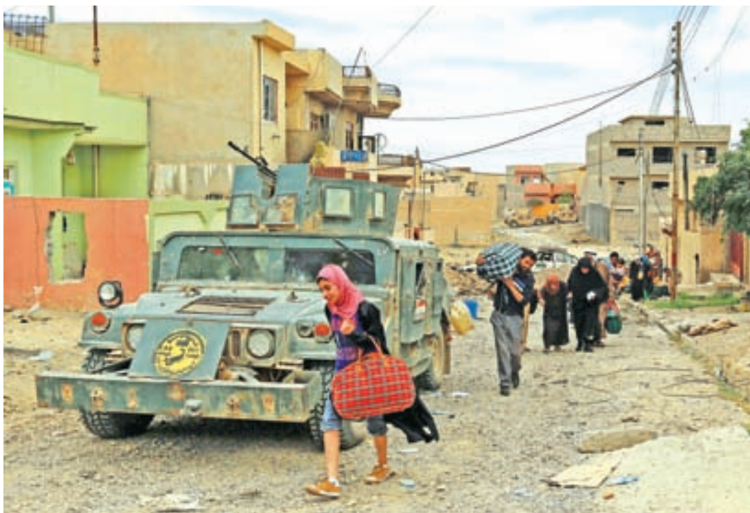
Displaced Iraqis flee during clashes between Iraqi forces and Islamic State militants in western Mosul, Iraq on 16 May, 2017.

With the help of advisers and air strikes by the coalition, Iraqi forces have made rapid gains