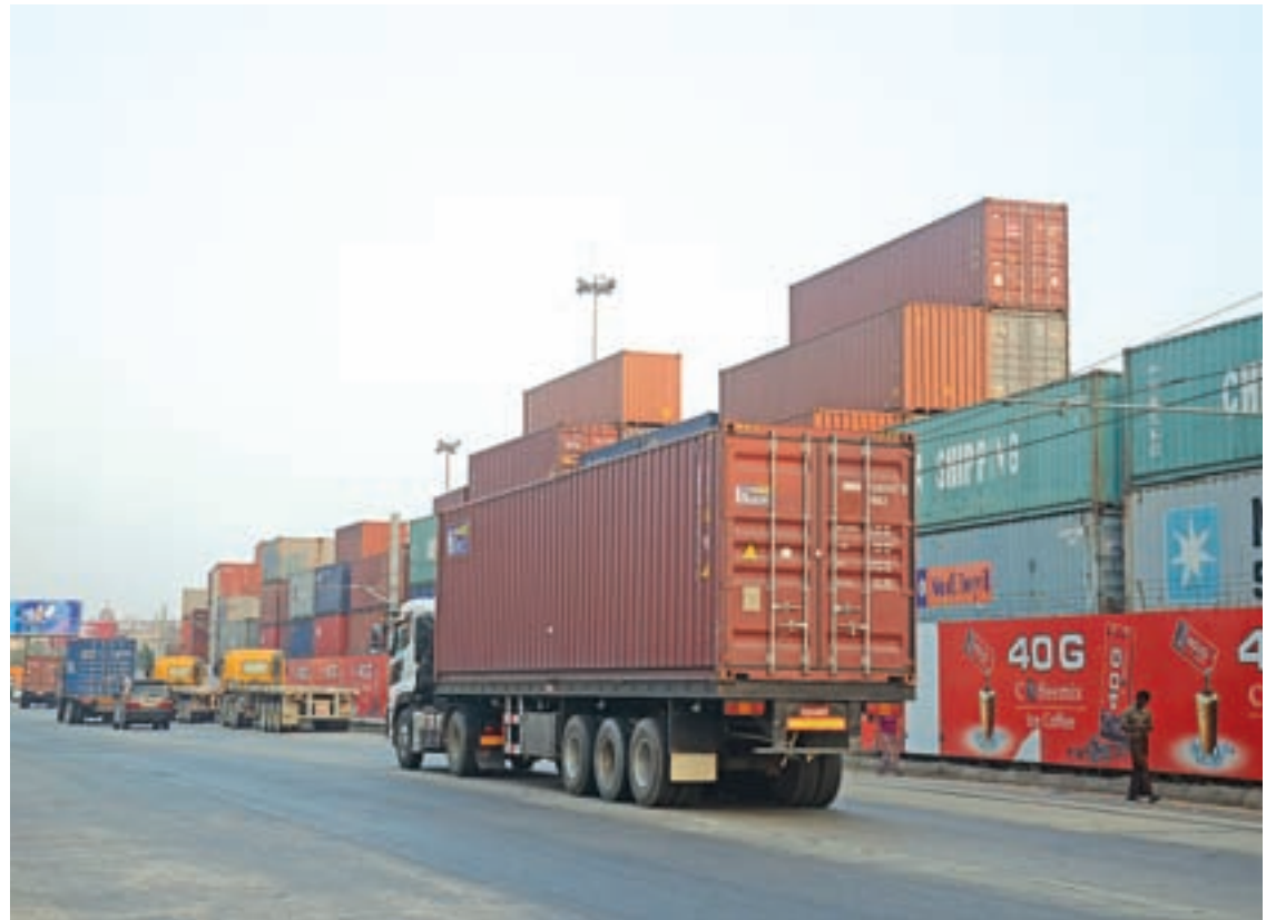
A truck drives past a cargo container yard at a port in Yangon.

Myanmar exported agricultural products, animal products,