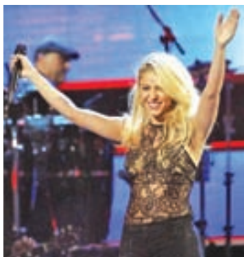
Colombian singer Shakira.

The track of the same name arrived at number 11 on Bill-