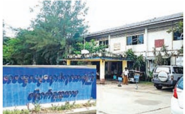
The 800-bed North Okkalapa General Hospital in Yangon.

North Okkalapa needs to be upgraded into a 1500-bed hospital because there are an average of 50,000 inpatients and 200,000 outpatients a year. Most of the patients are from Yangon, Ayeyawady, Bago, Magway regions, and Mon and Rakhine states. North Okkalapa General Hospital was constructed on a 29.37-acre plot of land. The hospital opened as an 800-bed facility in February, 2016.— 200 ■