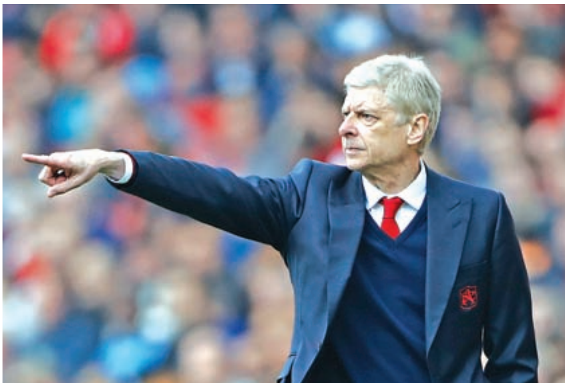
Arsenal manager Arsene Wenger.