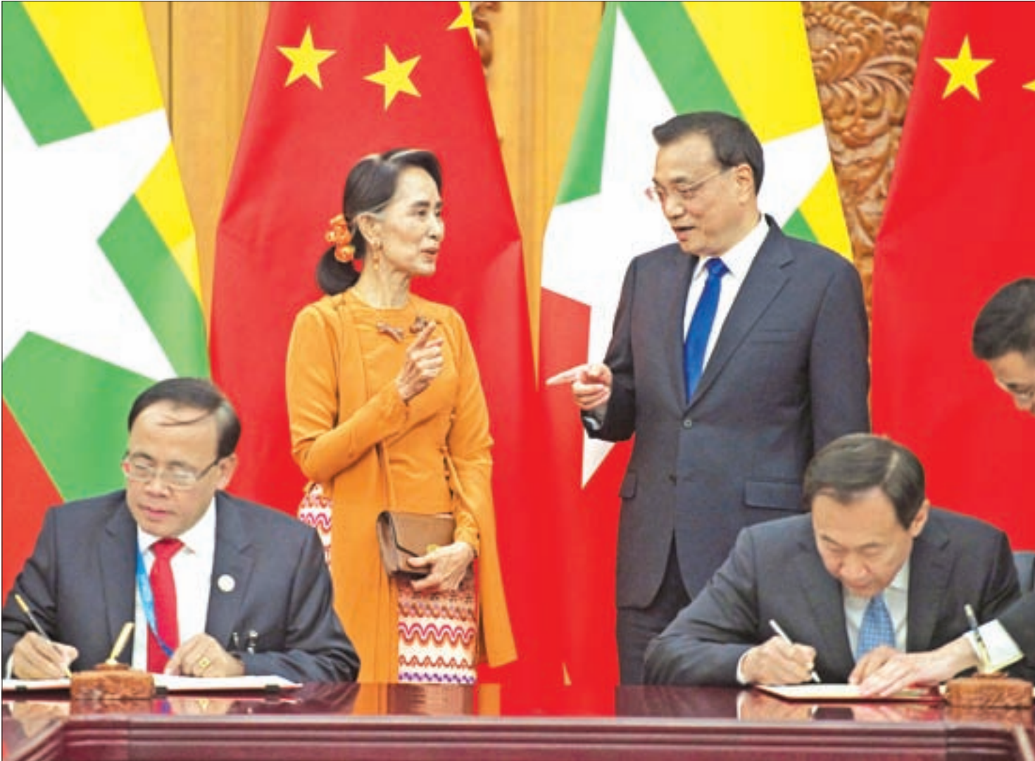
State Counsellor Daw Aung San Suu Kyi (back, left) talks with Chinese Premier Li Keqiang (back, right) during a signing ceremony at the Great Hall of the People in Beijing yesterday. The documents signed included an agreement on a China-Myanmar economic zone.