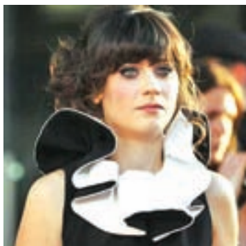
Actress Zooey Deschanel.

It is the network's longest-running live-action comedy