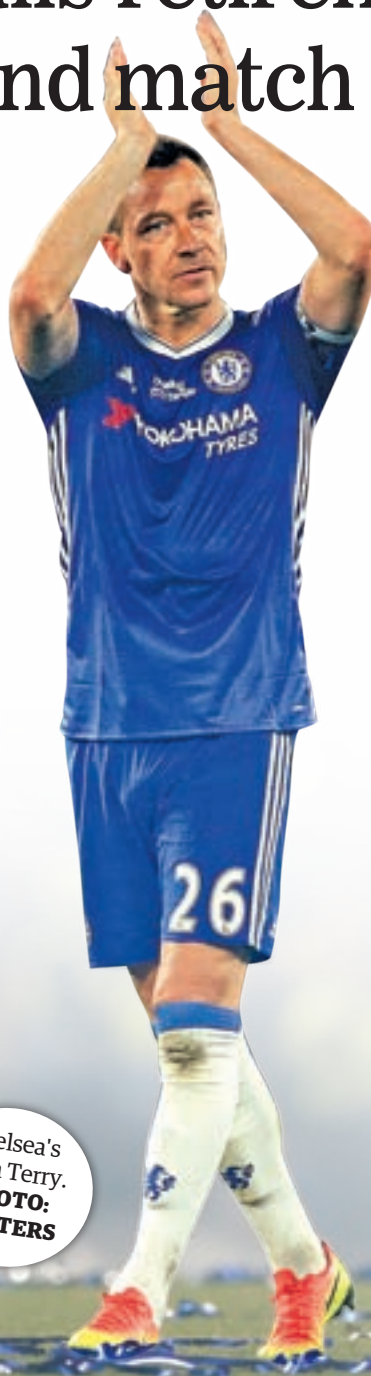
Chelsea's John Terry.

player just hanging about that people can't wait to get rid of or stopping the progress of a younger player coming through." Terry, who has played more than 700 times for Chelsea — the club he joined as a 14-year-old schoolboy — said adjusting to a bit-part role this season had been hard, but credited manager Antonio Conte with helping to ease the transition.