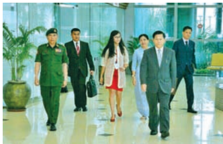
Senior General Min Aung Hlaing is seen as he arrives at the Yangon International Airport to leave for the Philippines.

The government has spent more than Ks935 million on building cyclone shelters and school cum shelters and digging lakes and wells in the region from the beginning of the 2016-2017 fiscal year to up to date. — Myanmar News Agency ■