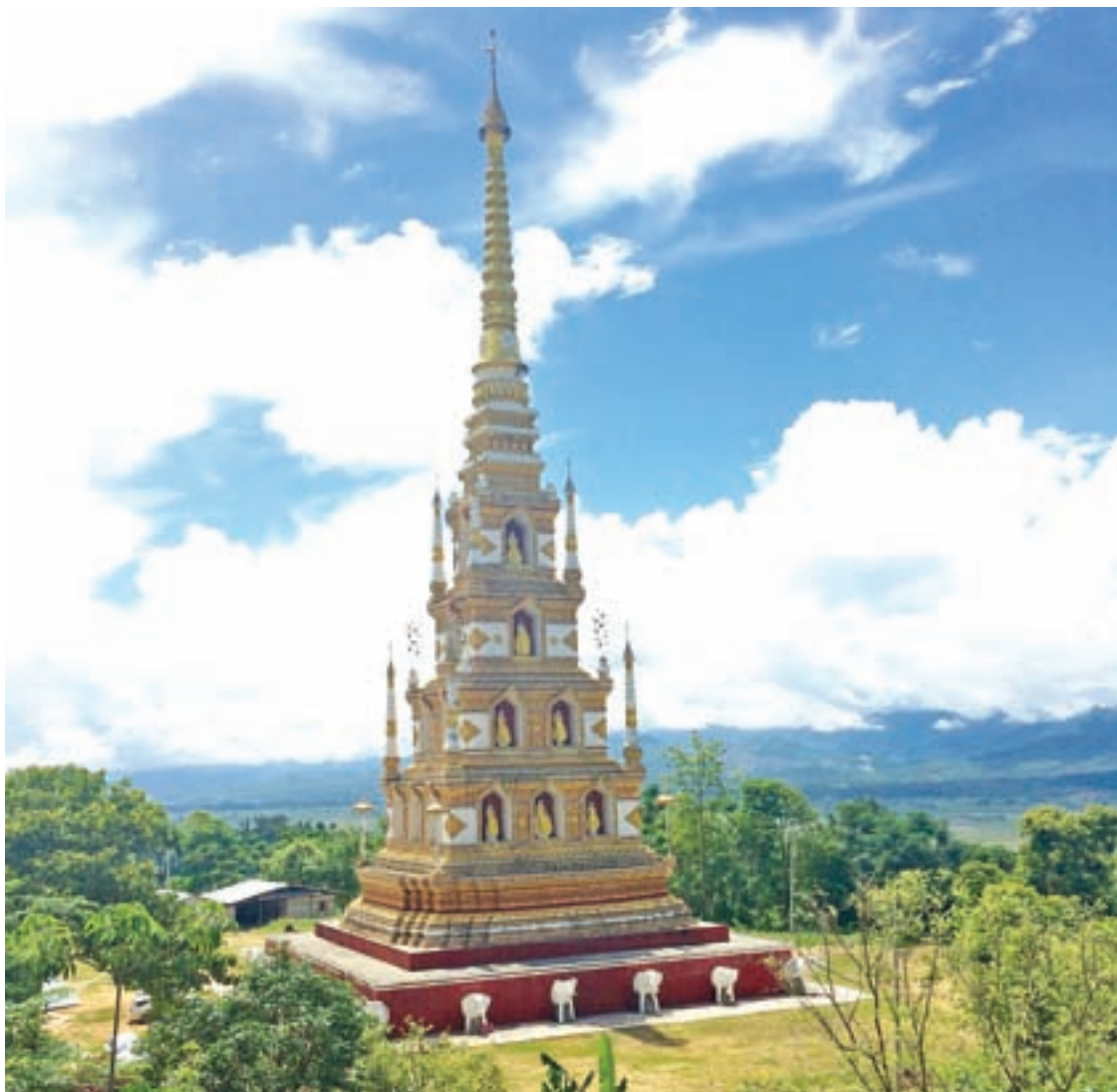
Photo shows the Kaunghmu Htut Pagoda.

In fact, the town Hsenwi has a long history as it was the seat of the Shan chieftains. Once, the town was besieged by a large invading army with flags and banners fluttering high in the air.