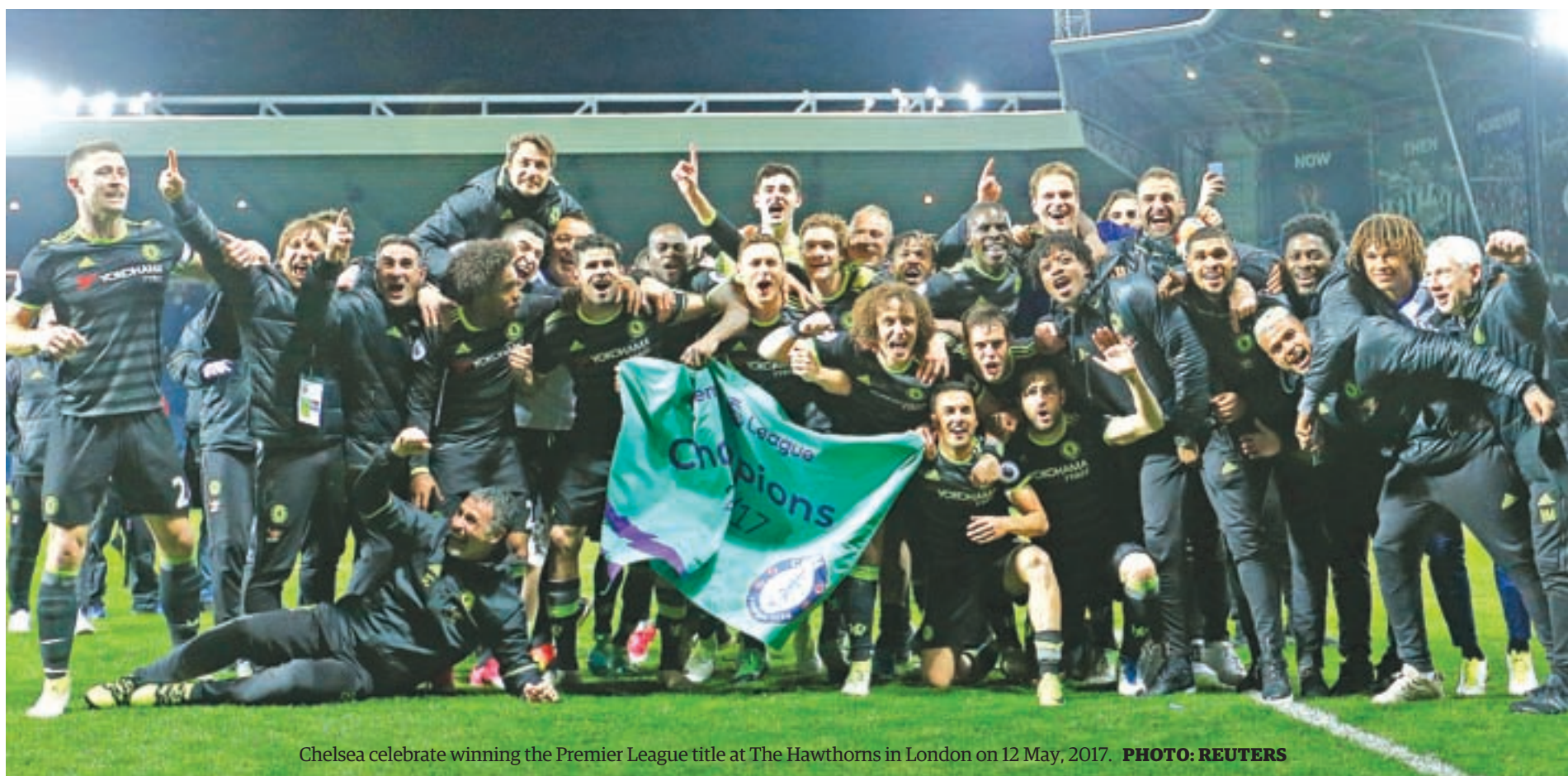
Chelsea celebrate winning the Premier League title at The Hawthorns in London on 12 May, 2017.