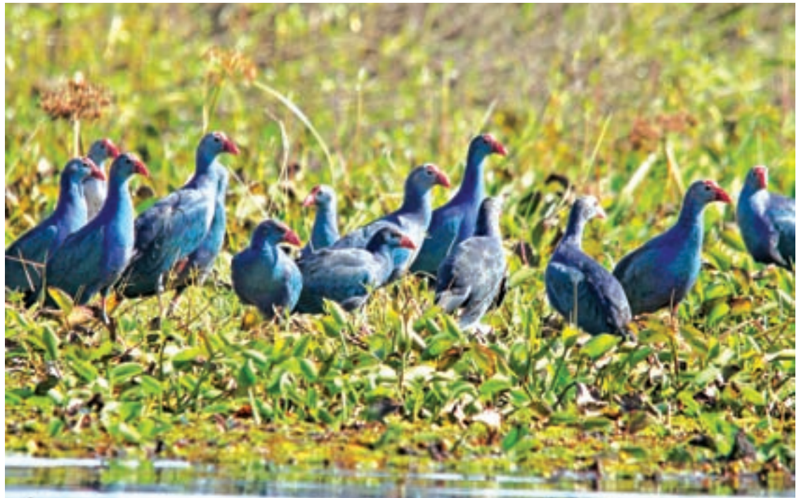
Purple Swamphen are seen in Indawgyi Lake.