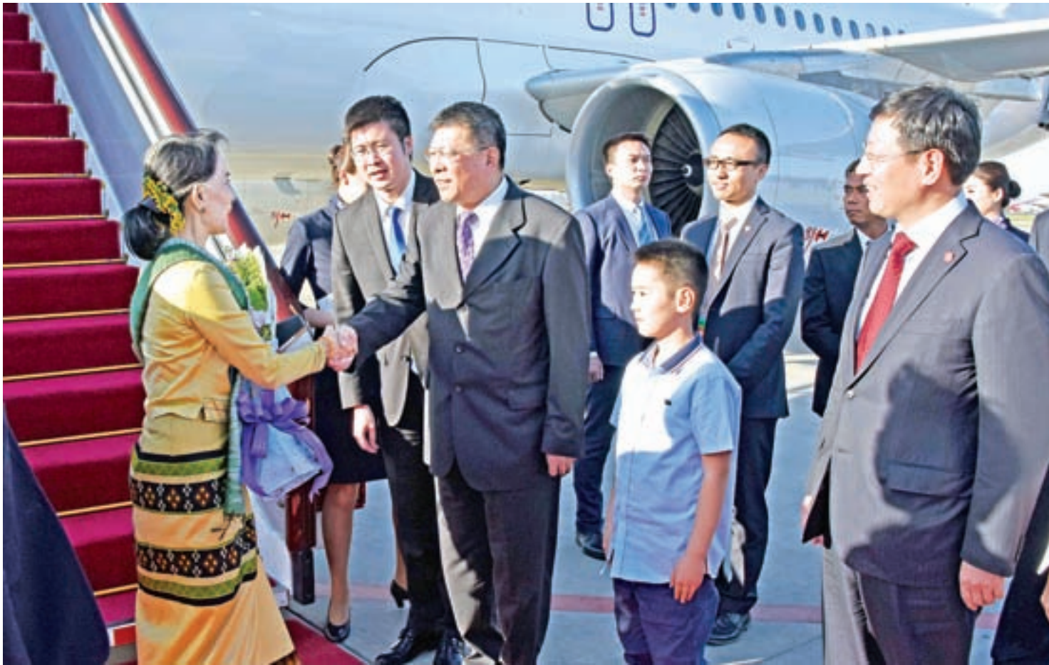
State Counsellor Daw Aung San Suu Kyi is welcomed by Vice Chairman Mr. Wang Yongqing in Beijing, China.