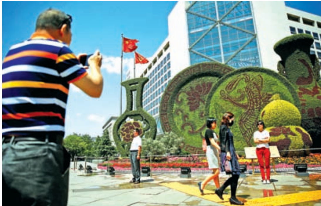
A man takes pictures of a flower display set up ahead of the Belt and Road Forum in central Beijing, China, on 10 May, 2017.

projects that can link Asia with or through Latin America," said Bachelet, adding that she had spoken with Jin about the possibility of investing in a Trans-Pacific optic fibre cable to improve digital connectivity between Asia and Latin America.