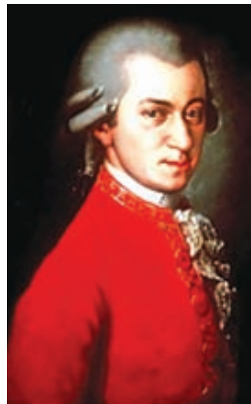
(B) Wolfgang Amadeus Mozart