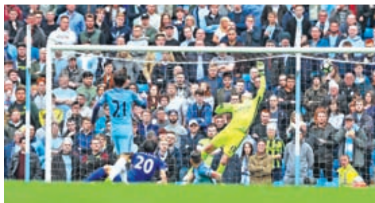
Leicester City's Shinji Okazaki scores their first goal during the match of Premier League between Leicester City and Manchester City at Etihad Stadium on 13 May, 2017.

Shinji Okazaki smashed in a sensational volley before half-time and the hosts had a huge let-off in the 77 th minute when Riyad Mahrez's penalty was ruled out because he inadvertently made a double contact while striking the ball.