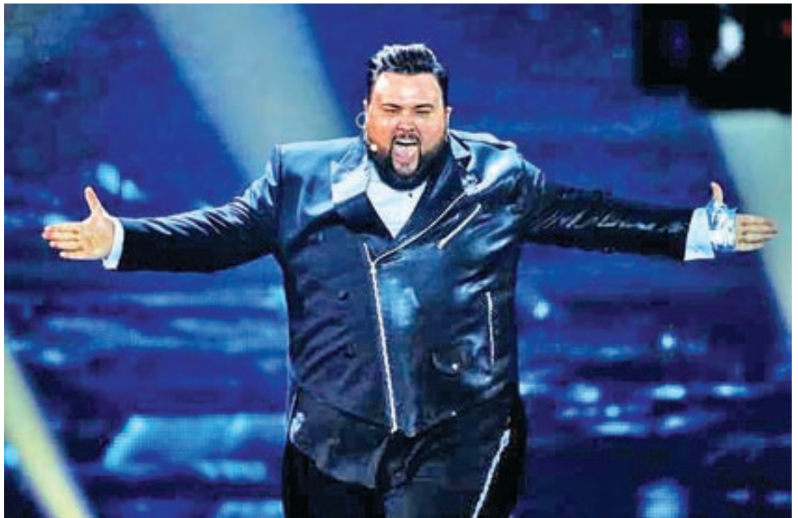
Croatia's Jacques Houdek performs with the song 'My Friend' during the Eurovision Song Contest 2017 Semi-Final 2 Dress rehearsal 1 at the International Exhibition Centre in Kiev, Ukraine, on 10 May 2017.

Eight countries missed out on a final place, including Macedonia's Jana Burceska, but any disappointment she felt was likely eased by a surprise marriage proposal from her partner live on air. —Reuters ■