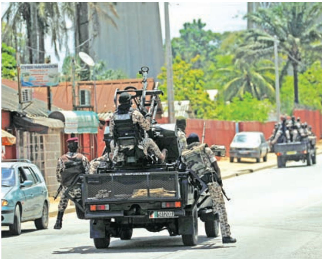
Soldiers of Ivory Coast presidential guard take position in front of mutinying soldiers camp in the centre of the commercial capital Abidjan, Ivory Coast on 12 May, 2017.

volting over delays to bonus payments, promised by the government after the January mutiny but which it has struggled to disburse after a collapse in the price of cocoa, Ivory Coast's main export, caused a revenue crunch.