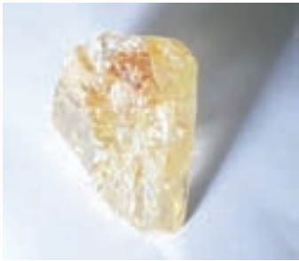
The 709-carat diamond pictured at the Bank of Sierra Leone building where it is being kept in Freetown, Sierra Leone on 10 May, 2017.