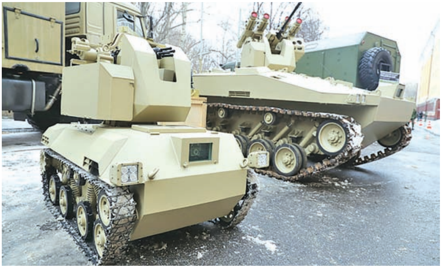
Soratnik robotized combat system. Russia's arms producer Kalashnikov last year demonstrated its first robotized system Soratnik developed at the request of the Defence Ministry.

Similar attacks were reported among companies in Spain and delivery company FedEx Corp in the United States. Romania's intelligence agency claimed it had stopped attacks against its government entities.—Kyodo News ■