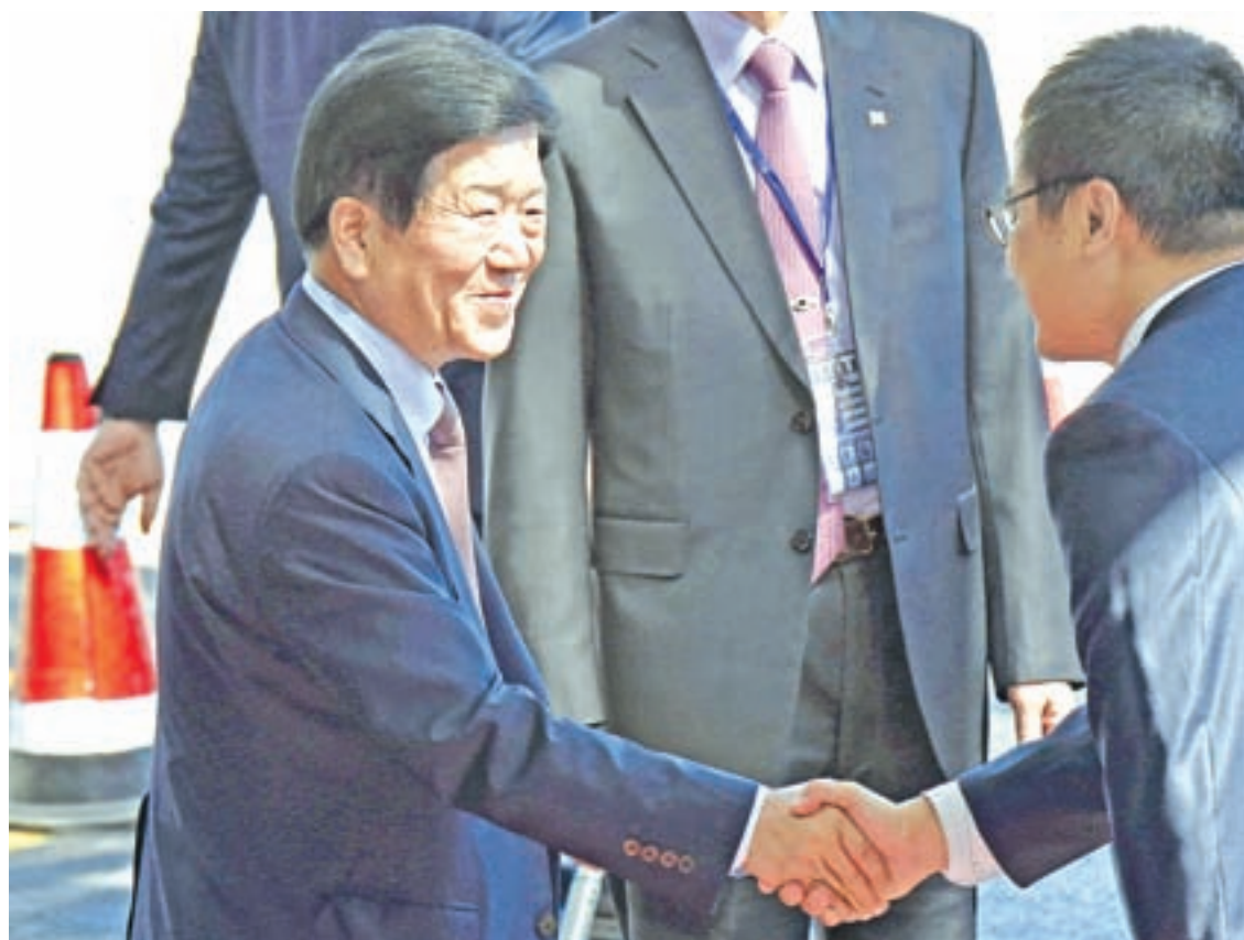
Park Byung Seok, a lawmaker from South Korea's ruling Democratic Party of Korea, arrives in Beijing on 13 May, 2017, to attend an international conference on building a new Silk Road linking Asia, Africa and Europe.