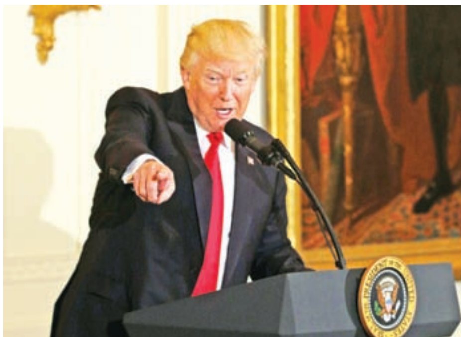
US President Donald Trump acknowledges a guest while attending a "celebration of military mothers" at the White House in Washington, US on 12 May, 2017.