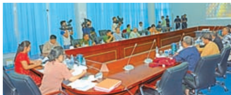
Participants discuss at the last day meeting of Union Peace Dialogue Joint Committee-UPDJC's secretariat meeting.

included. Chinese government's One Belt, One Road (OBOR) had been endorsed by 56 countries and regional organizations by signing OBOR MoUs and agreements with China. Furthermore an initial investment of US$ 40 billion is made to implement OBOR. The opening ceremony of OBOR will be attended by Russian President Vladimir Putin, Italian Prime Minister Paolo Gentiloni and Managing Director of the International Monetary Fund Christine Lagarde while heads of ASEAN countries Viet Nam, Indonesia, Cambodia, Malaysia and Philippines, Europe and east-Europe countries of Greece and Belarus as well as Pakistan, Sri Lanka, South Korea and Ethiopia will attend the forum.—MNA ■