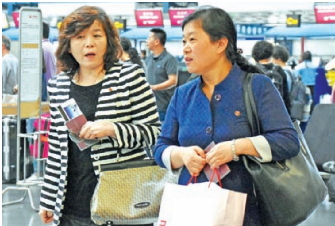
Photo shows Choe Son Hui (L), head of the North Korean Foreign Ministry's North America bureau, prior to her departure for Pyongyang from Beijing Capital International Airport on 13 May, 2017.

Ahead of her departure to Pyongyang from Beijing Capital International Airport, Choe also disclosed they did not address the fate of four US citizens detained in North Korea during the two-day meeting.