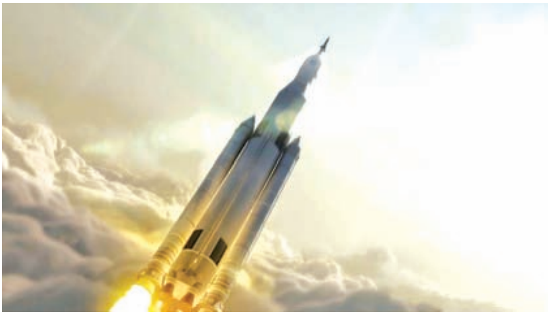
NASA's Space Launch System (SLS) 70-metric-ton configuration is seen launching to space in this undated artist's rendering released on 2 August, 2014.