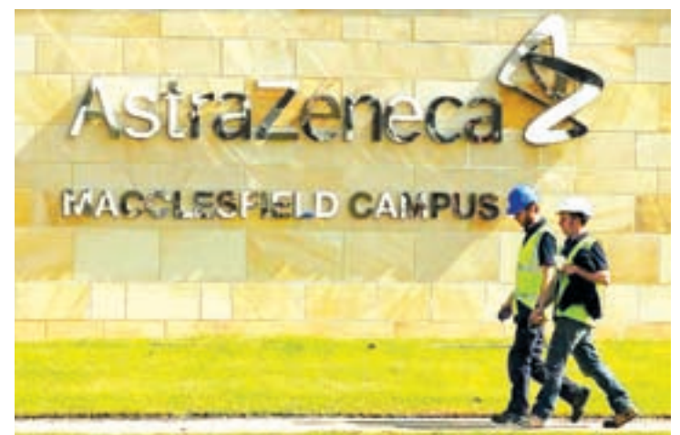
A sign is seen at an AstraZeneca site in Macclesfield, central England on 19 May, 2014.

"In theory, this could open a market opportunity of $1.75 billion to $3.5 billion (or more) for the drug, which is not included in our current forecasts."—Reuters ■