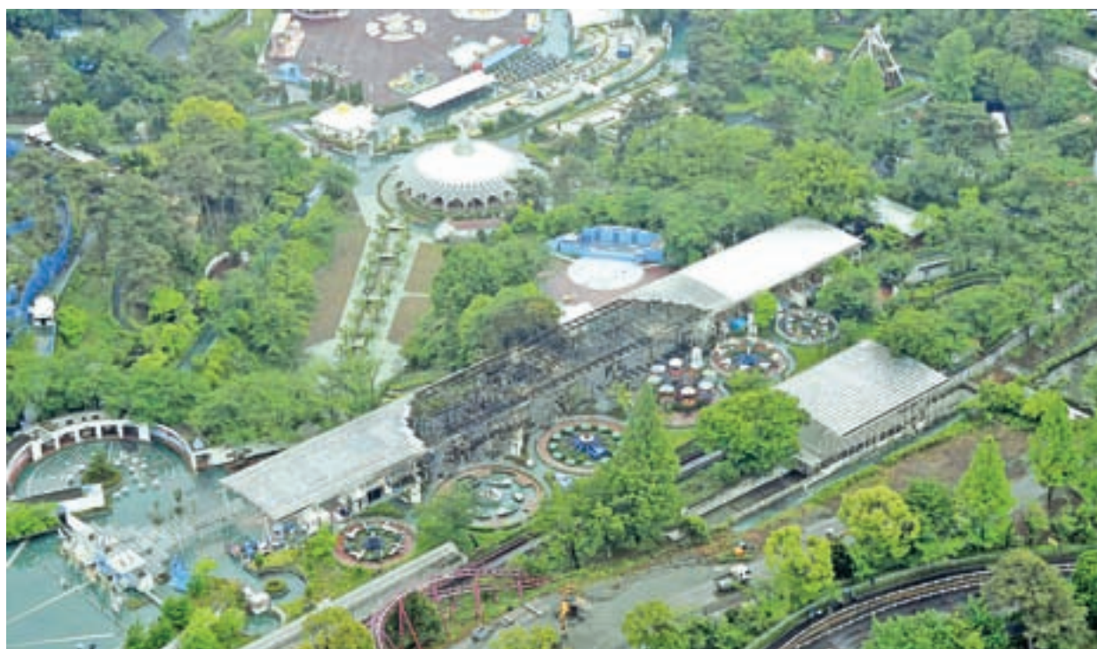
Photo taken on 13 May, 2017, from a Kyodo News helicopter shows the site of a fire (C) at Seibuen amusement park in Tokorozawa, near Tokyo. No one was injured.

Liberty University said it expects more than 7,000 of its 18,000 graduates to participate in the ceremonies, most of whom earned their degree online. Past commencements have attracted as many as 40,000 people, the college said.—Reuters ■