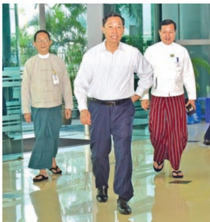
Thura U Shwe Mann arrives Yangon International Airport to leave for Qatar.

The delegation was seen off at Yangon International Airport by officials from Pyidaungsu Hluttaw's Legal Affairs and Special Cases Assessment Commission.—Zaw Gyi (Panita) ■