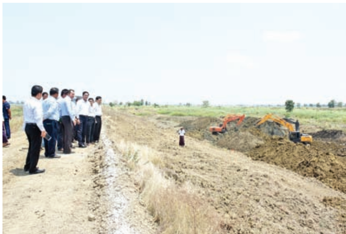
Vice President U Henry Van Thio and officials inspect works for preventing floods in Monyo.

He then inspected the embankment on the west side of Myitmakha river in Monyo Township