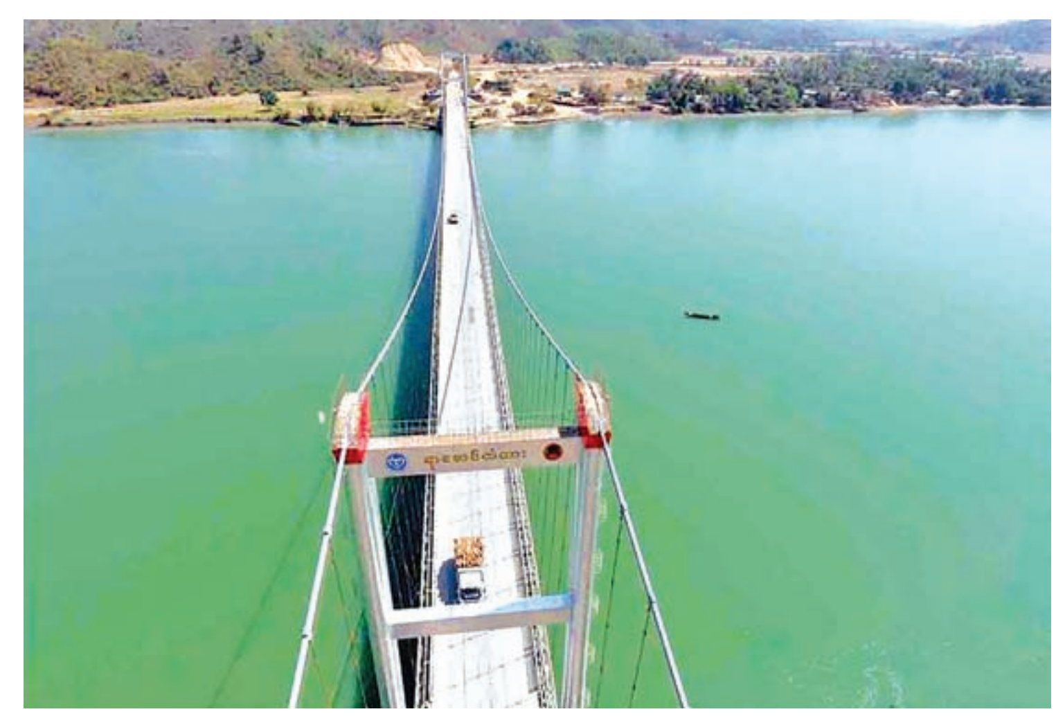
Ramong Suspension Bridge on Minbu-An-Sittway road.