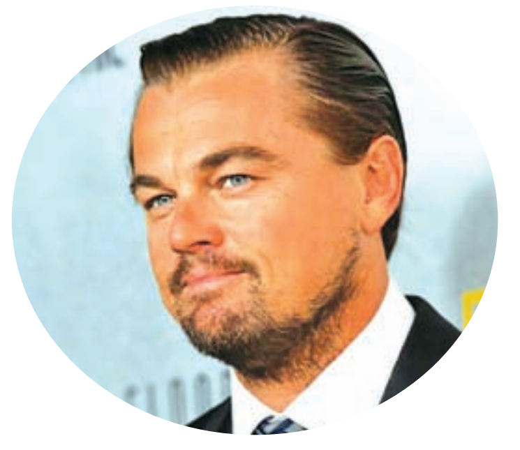
US actor and UN Messenger of Peace Leonardo DiCaprio.

Viva Vaquita, a group dedicated to saving the porpoise, says on its website that the vaquita population was estimated to be less than 50 in January 2017, based on earlier study findings.—Reuters ■