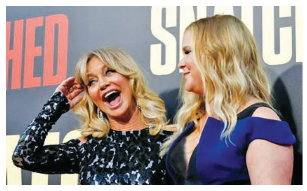
Cast members Goldie Hawn (L) and Amy Schumer pose at the premiere of the movie 'Snatched' in Los Angeles, California, US, on 10 May 2017.

SOCIAL 13 MAY 2017 THE GLOBAL NEW LIGHT OF MYANMAR