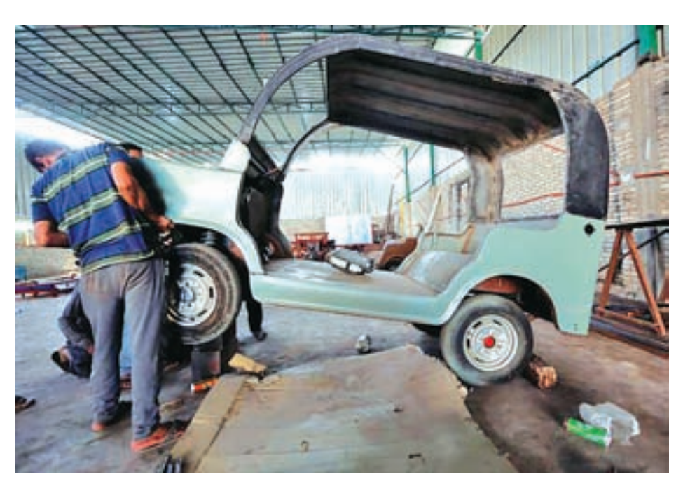
Workers carry the main body of new 'Mini-Car-Egypt' car in a workshop, near Egypt's pyramids of Giza, in Kerdasa, Egypt on 10 May 2017.

Prices of imported products have soared since Egypt devalued its currency in November as part of measures to stimulate the economy.