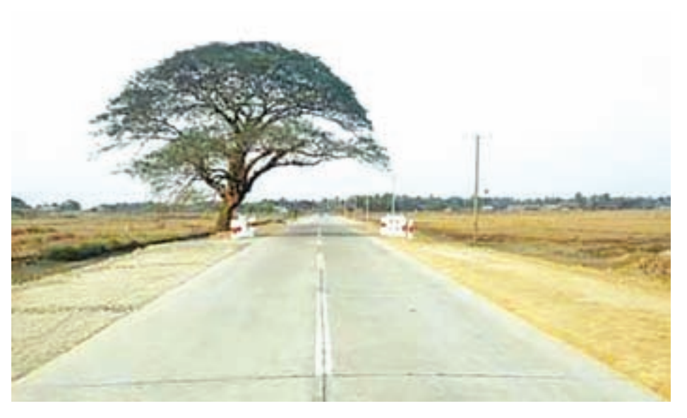
Upgraded Minbu-Ann-Sittway Road.

The Kyauktaw-Haka road meets with Pakokku-Gangaw Road at Haka, therefore every part of the Rakhine State becomes accessible, thanks to the expanded new network of roads planned and materialized by the new government. Furthermore, the incumbent government had built all season roads and bridges in every part of the State defeating all the barriers and difficulties so that people can travel by car and communicate easily within the State.