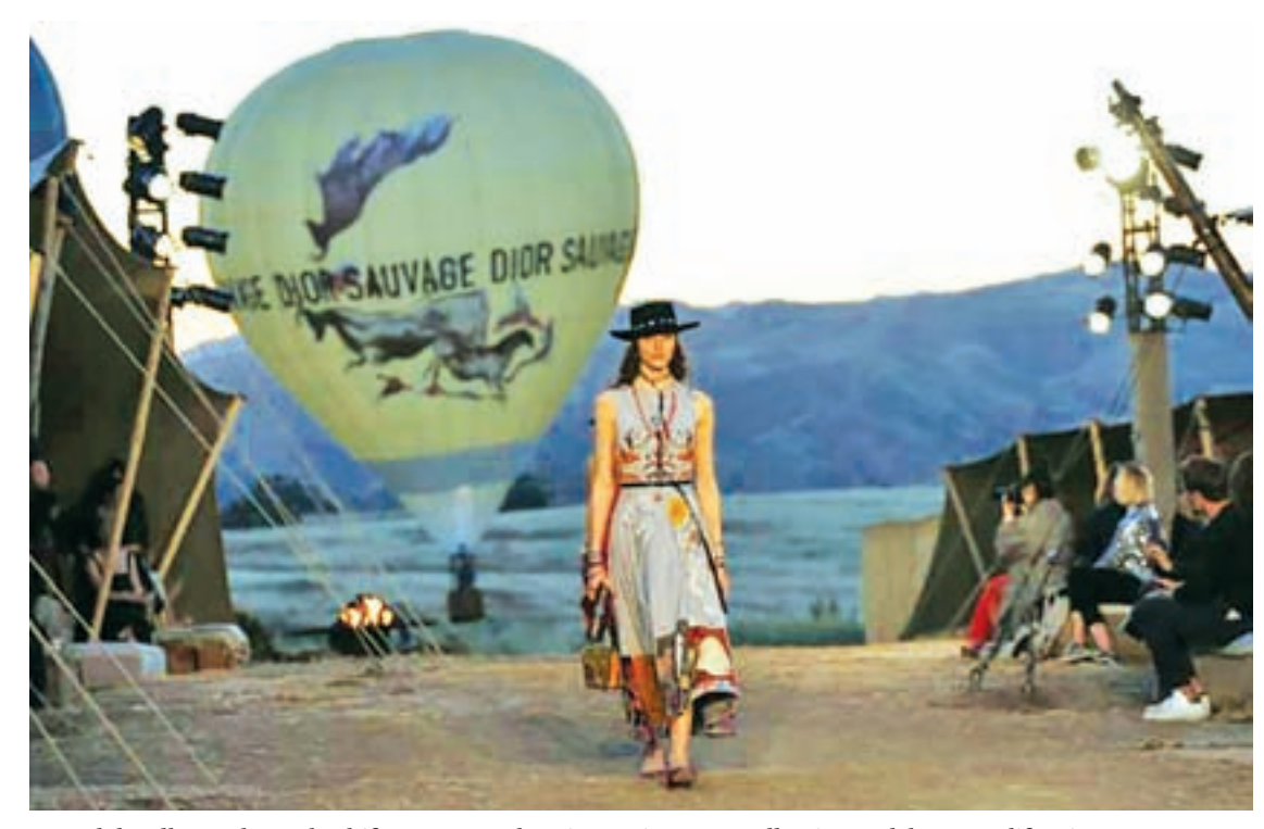
A model walks on the makeshift runway at the Dior Cruise 2018 Collection, Calabasas, California, US, on 11 May 2017.

Layering was a key element to the collection that elevated the fashion often seen at festi-