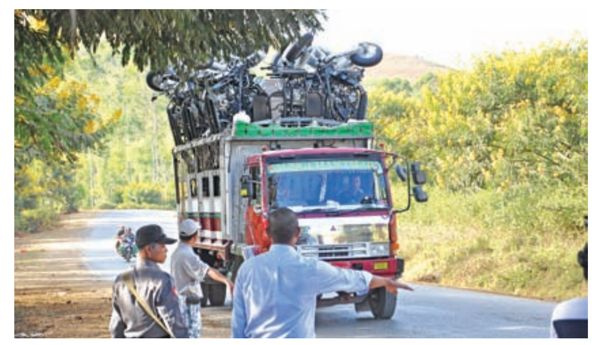
A truck carrying motorbikes seen at 105-mile Muse Trade Zone, Shan State.

The Road Transport Administration Department continues to register vehicles entering into the country.—Kyaw Saw ■