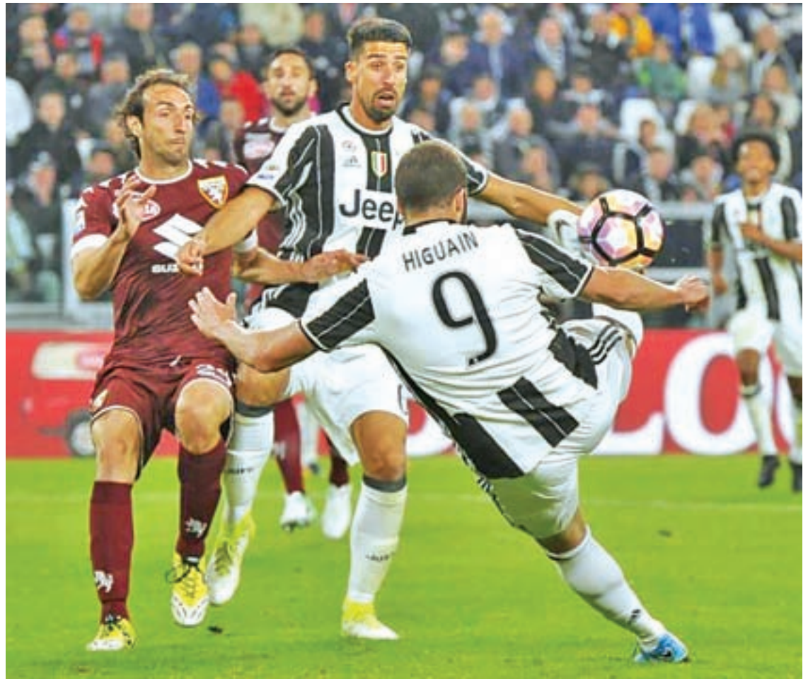
Juventus' Gonzalo Higuain in action against Torino during Italian Serie A at Juventus Stadium, Turin, Italy, on 6 May 2017.

Belarus (calendar year season): BATE Borisov won the 2016 title, their 11th in a row, by an 11 point margin. The Belarus sea-