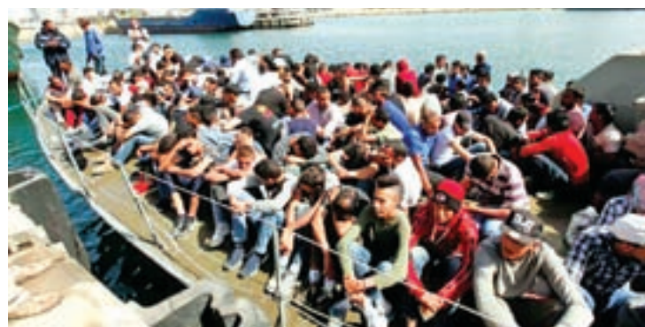
Illegal migrants arrive by boat at a naval base after they were rescued by Libyan coastguard in the coastal city of Tripoli, Libya, on 10 May 2017.

Ruben Neugebauer, a spokesman for Sea-Watch, said the NGO had received instruction from Italy's coastguard control centre in Rome that the Libyan coastguard would be taking over "on-scene command", and that the Sea-Watch ship had stopped to await further instructions.—Reuters ■