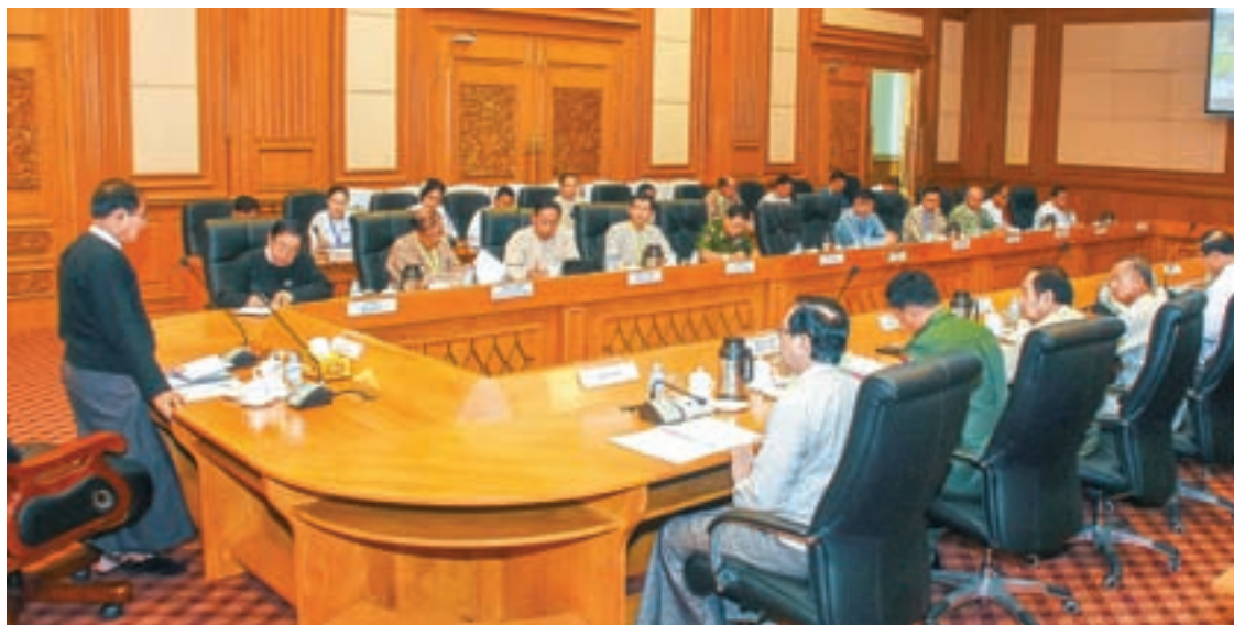
Speaker U Win Myint addresses the coordination meeting between the Central Committee and Working Committees of Pyithu Hluttaw and Amyotha Hluttaw.

Patron of the Central Committee for holding Hluttaw meetings, Speaker of Pyithu Hluttaw, U Win Myint said members of the Central Committee and Working Committee consisting of officials including union level personnel had made the best effort for the