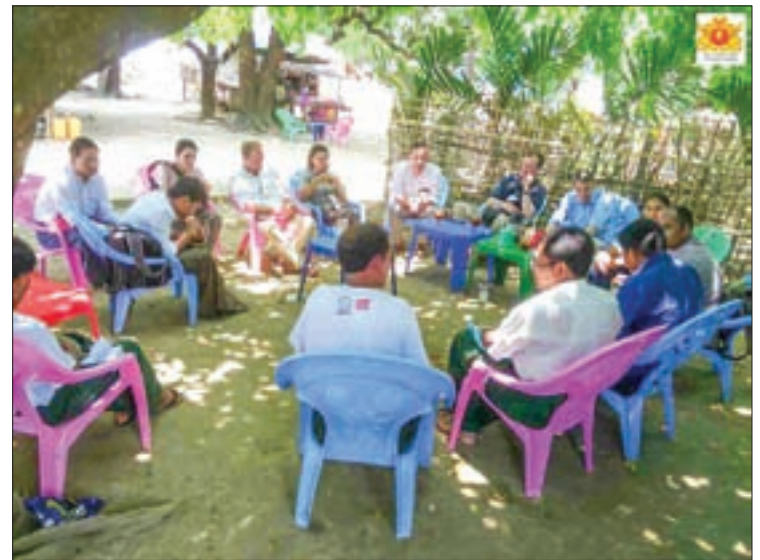
ICRC delegation meets with locals in Sintatmaw Village.