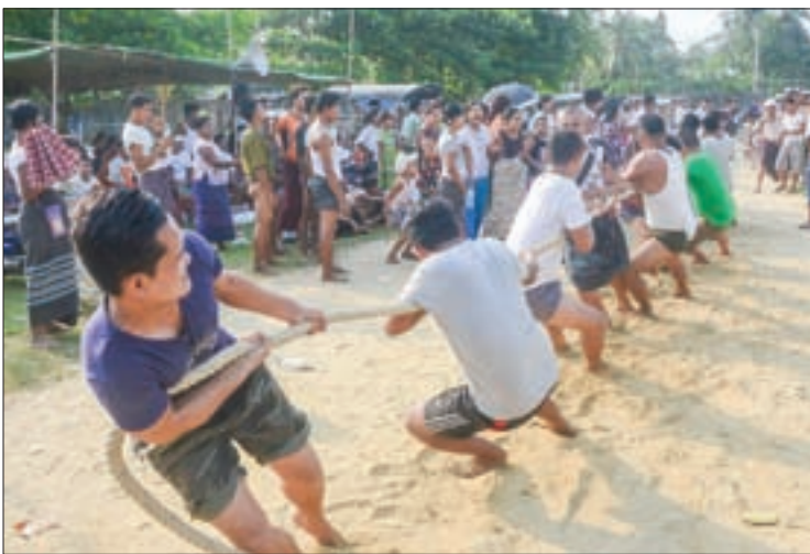
Local men in a tug-of-war enjoying celebrations.