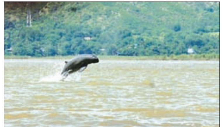
The Ayeyawady dolphin is an endangered species with a population less than a hundred.

Using the SMART technologies in the Ayeyawady dolphin conservation areas can give better results in seizing illegal fishing and maintaining law and order of those areas by getting the update information. SMART software application enables to collect the data by the SMART