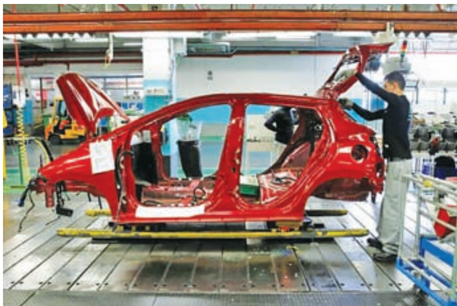
Employee works on the assembly line of the Nissan Micra at the Renault SA car factory in Flins, near Paris, France, on 23 February 2017.

Nissan, which has an 18-year alliance and cross-shareholdings with France's Renault, forecast global retail vehicle sales for the year ending in March 2018 of 5.83 million vehicles, compared to 5.63 million in the year