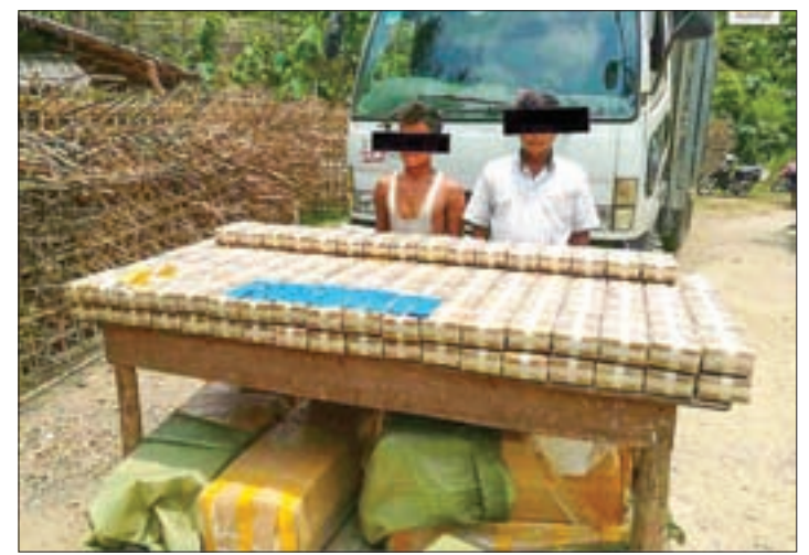
The suspects, their truck and the confiscated drugs.

together with U Saw Yan Aung on board at 6-mile inspection gate at 10:50 am yesterday. The police discovered about 16 lakh stimulant tablets worth over Ks 3 billion in the search. Local police have taken action against them in accordance with the law. —Myanmar News Agency ■