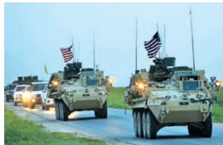
US military vehicles and Kurdish fighters from the People's Protection Units (YPG) drive in the town of Darbasiya next to the Turkish border, Syria, on 28 April 2017.

The YPG said Washington's decision would bring swift results and help the militia "play a stronger, more influential and more decisive role in combating terrorism".—Reuters ■