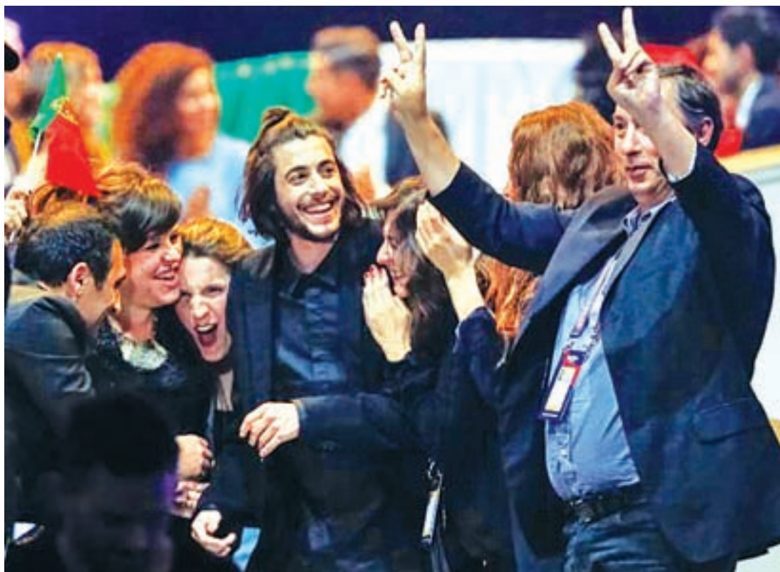
Portugal's Salvador Sobral (C) celebrates with team after the Eurovision Song Contest 2017 Semi-Final 1 at the International Exhibition Centre in Kiev, Ukraine, May 10, 2017.

KIEV — The Portuguese and Armenian entrants for the 2017 Eurovision song contest, among the favorites to win the continent-wide songfest, were two of 10 to qualify for the final in the first round of heats in Kiev.