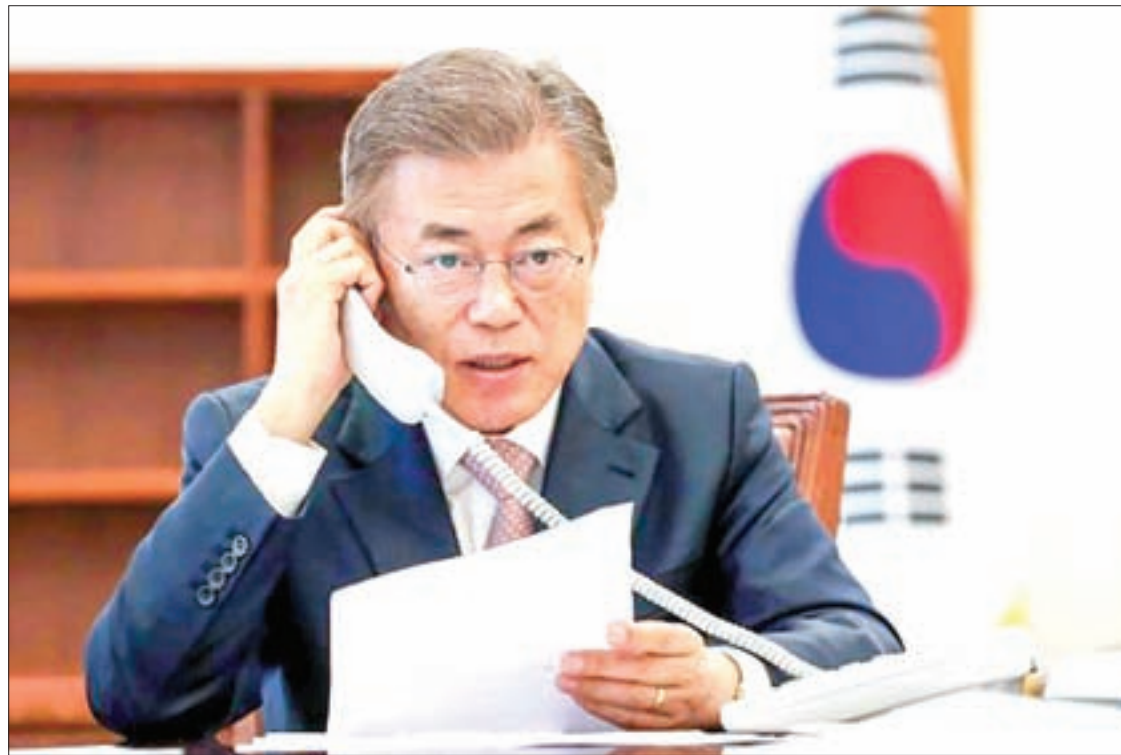
South Korean President Moon Jae-in speaks with Chinese President Xi Jinping by telephone at the Presidential Blue House in Seoul, South Korea in this handout picture provided by the Presidential Blue House and released by Yonhap on 11 May 2017.

China has rigorously objected to the deployment, saying it destabilised the regional security balance and did little to curb the threat posed by North Korea's nuclear and missile pro-