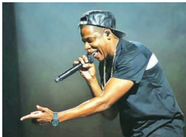
American rapper Jay-Z performs at Bercy stadium in Paris in 2013.

The full list can be seen at Forbes.com.—Reuters ■