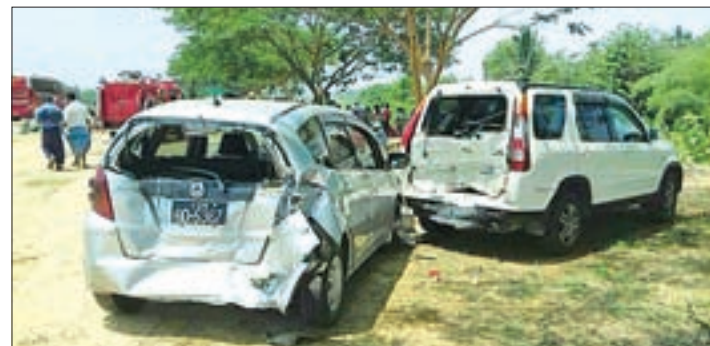
The dented vehicles after the chain collision.

illegal fishing and distances and frequencies of monitoring. As a result, management works on conservation of Ayeyawady dolphin will be more effective.—200 ■