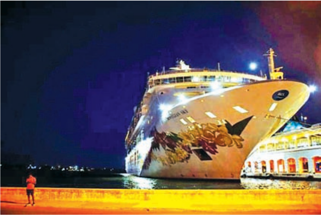
A man uses his mobile phone near the cruise ship Norwegian Sky in Havana, Cuba, on 9 May 2017.

“The reality is that US travel to Cuba is in its nascent stages, and all the players are still learning how to make it work,” the report read. “Success, as with most things Cuban, will require