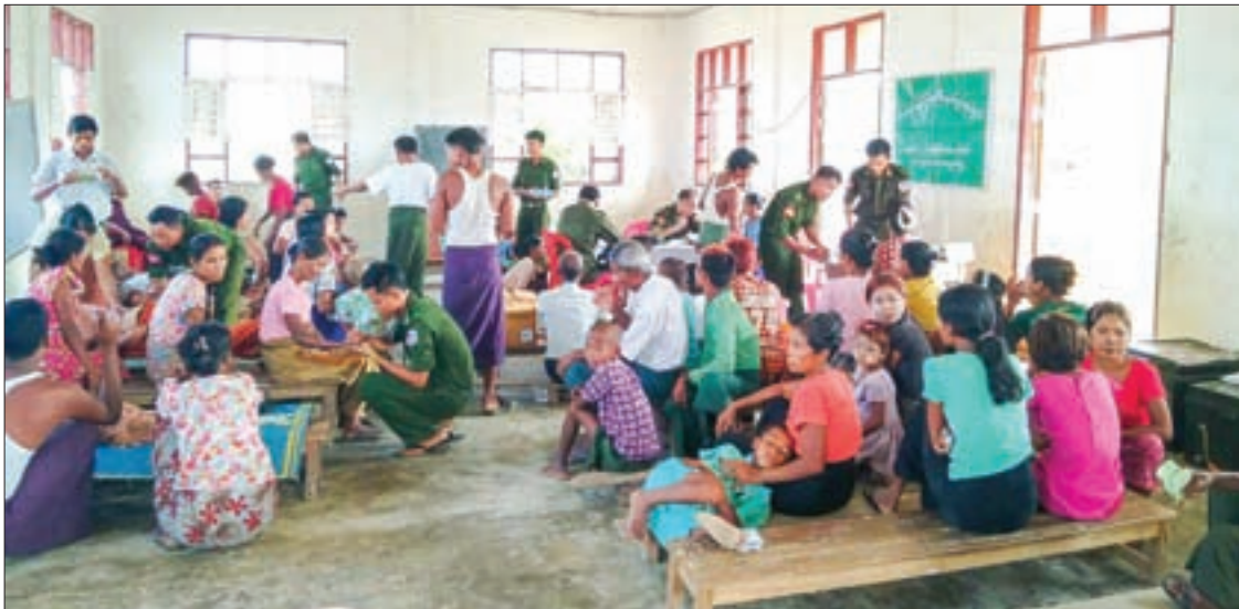
Mobile medical team provides treatment to the patients in Beya Village in Pauktaw Township.