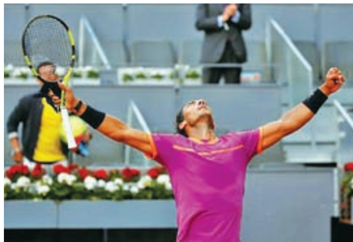
Nadal celebrates at the end of the match Madrid, Spain, on 10 May 2017.

Almagro, ranked 76th, broke Djokovic in the opening game but the world number two roared back to win six consecutive games, finishing the last with a tidy drop shot. Spaniard Almagro, who has never gone beyond the quarter-finals in a grand slam, grew in confidence in the second set, however, with the backing of the home support and saved two break points before forcing a decider. An upset looked on the cards when Almagro broke Djokovic at the first attempt in the third set and marched into a 3-0 lead