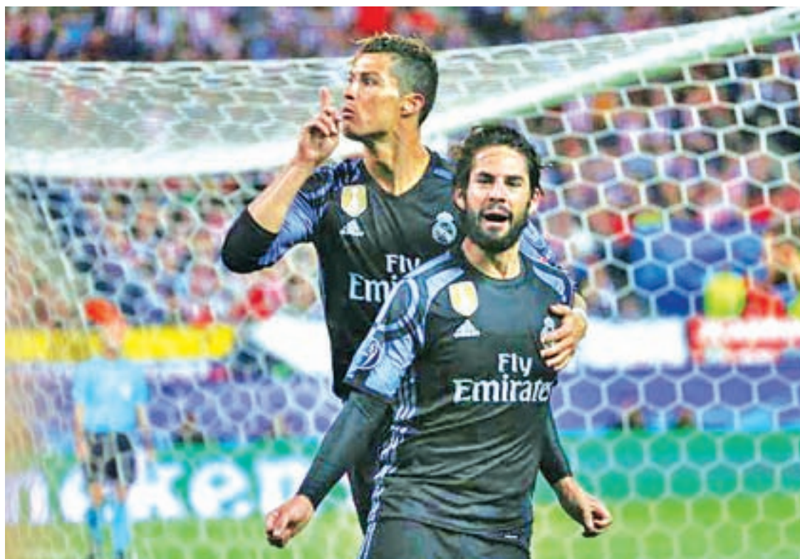
Real Madrid's Isco celebrates scoring their first goal with Cristiano Ronaldo during UEFA Champions League Semi Final Second Leg at Vicente Calderon Stadium, Madrid, Spain, on 10 May 2017.