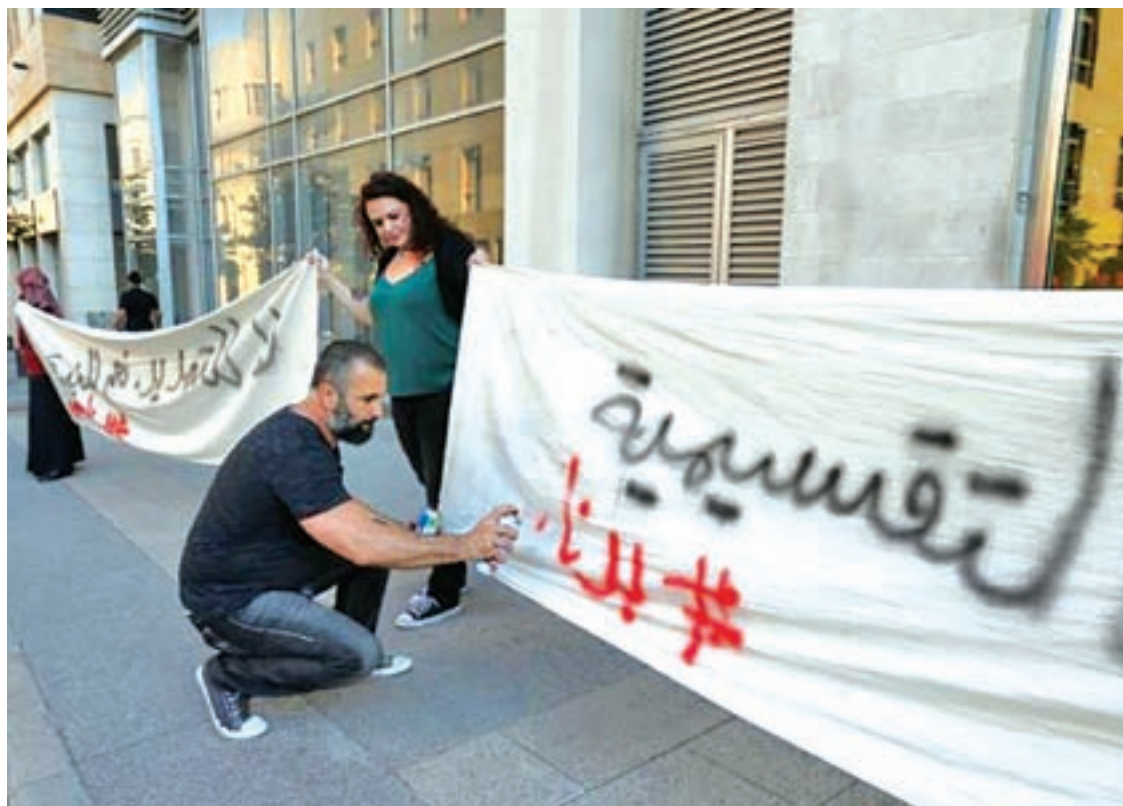
A man sprays paint on a banner during a demonstration against an extension of the parliament's term, in Beirut, Lebanon on 6 May 2017.

The bigger risk is state paralysis as the government tries to revive an economy saddled by massive public debt and to cope with the strain of 1.5 million refugees from neighbouring Syria.—Reuters ■