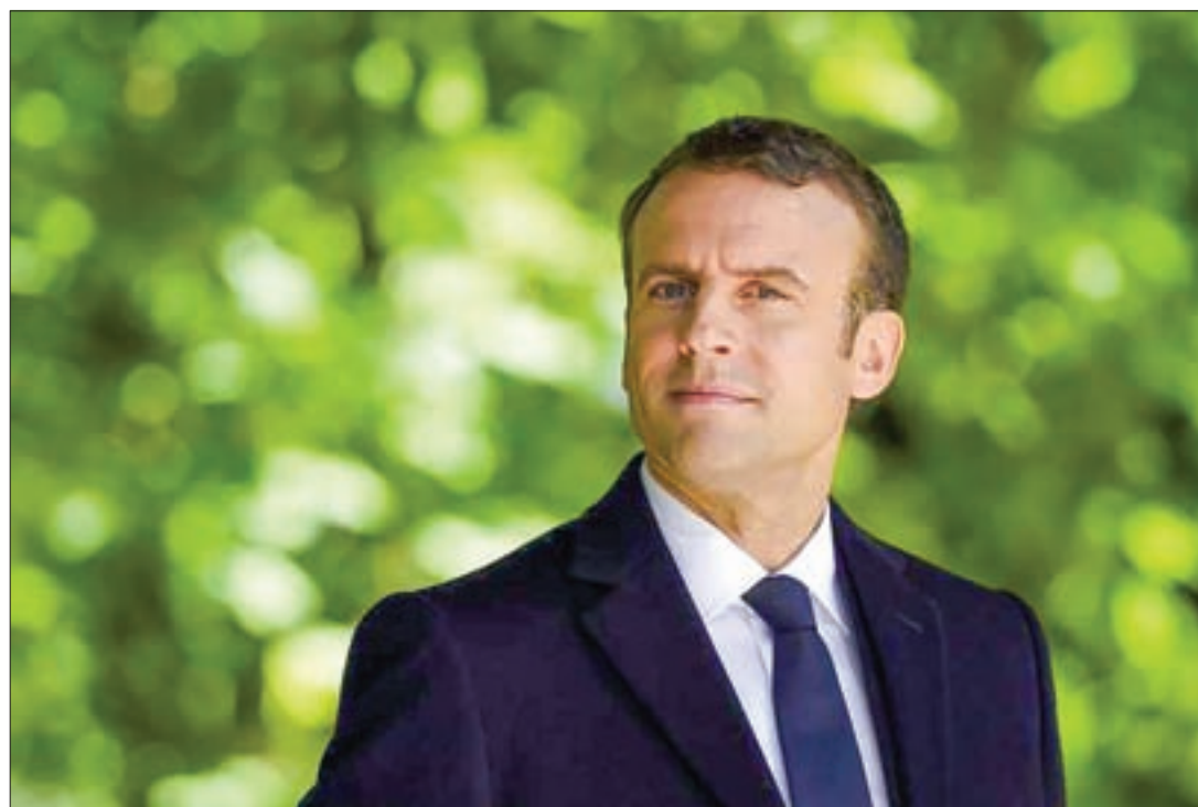
French President elect Emmanuel Macron attends a ceremony to mark the anniversary of the abolition of slavery and to pay tribute to the victims of the slave trade at the Jardins du Luxembourg in Paris, France, on 10 May 2017.

Some 16,000 people had applied to become candidates, he said — 1,600 of them in the few days since the 39-year-old ex-banker beat National Front leader Marine Le Pen in the presidential runoff on 7 May.