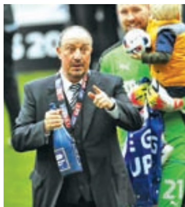
Newcastle manager Rafael Benitez celebrates winning the league at St James' Park, on 7 May 2017.

happy with the meeting and was looking ahead to next season.