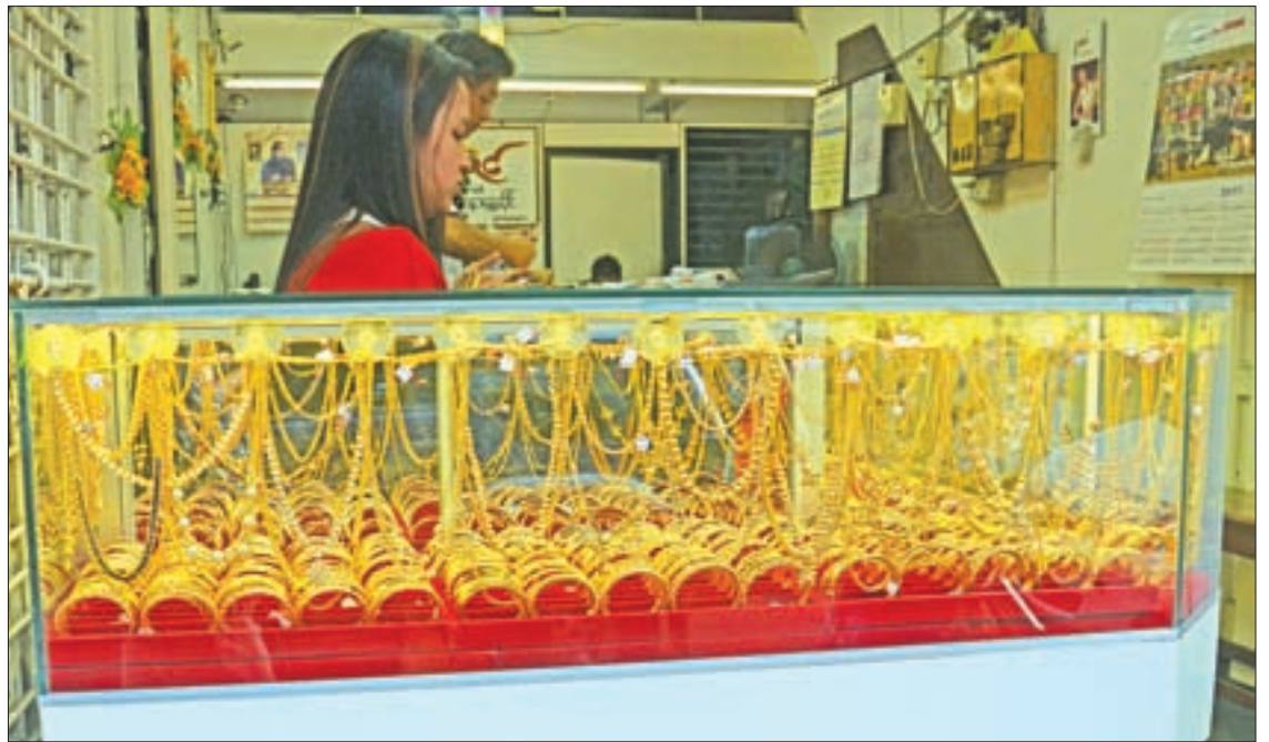
Domestic gold price rises while the US dollar exchange rate has risen.

The domestic gold price hit the new record of Ks911,800 on 18th April with the high global gold price. —Ko Htet ■