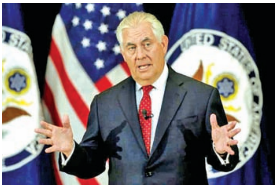
US Secretary of State Rex Tillerson delivers remarks to the employees at the State Department in Washington, US, on 3 May 2017.

Unlike former President Barack Obama, Trump has expressed doubts about whether human activity has a significant role in climate change, and is mulling whether to pull the United States out of a global pact to fight it.