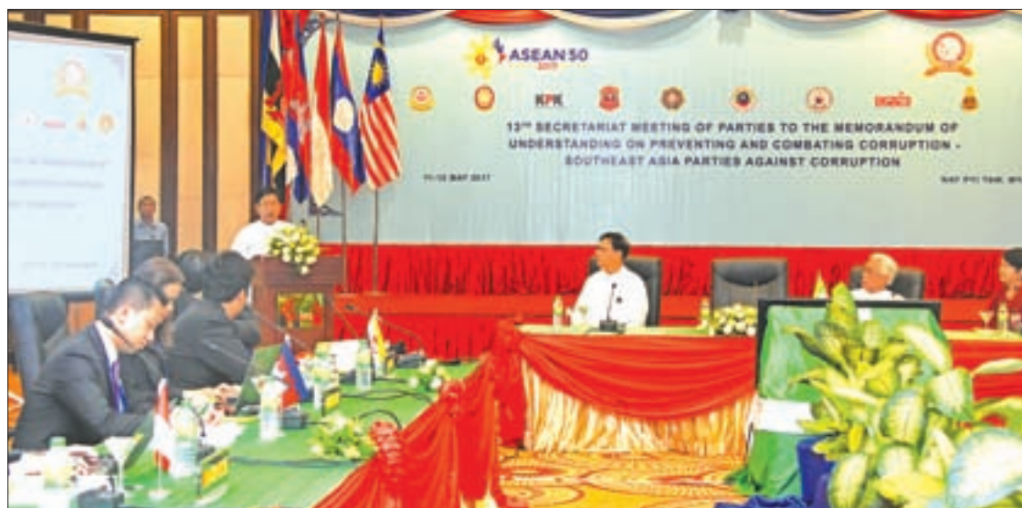
U Mya Win speaks on the importance of fighting corruption for global peace at the SEA-PAC 13th secretariat meeting at The Hotel Royal Ace in Nay Pyi Taw yesterday.

He added, "Corruption must be regarded to be a criminal case, which begets destruction of economic progress and people's minds and characters. Anti-corruption is concerned not only with every individual, every institution and each country but also the global community. Each and every one of the member countries of SEA—PAC must implement the two major objectives of the (SEA—PAC). It includes strengthening the cooperation for fighting against corruption between member countries; and exchange of news and information, training for upgrading the abilities of skilled persons, sending professionals and staff from anti-corruption-related