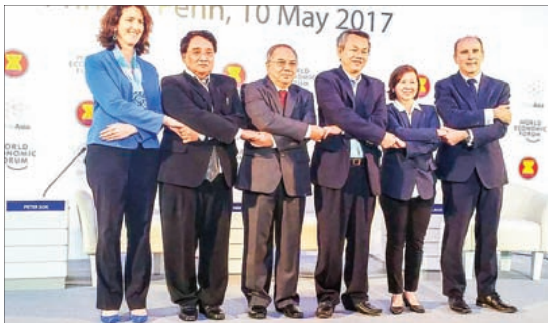
Union Minister Dr. Than Myint poses for a commemorative photo with other participants at the Grow Asia Forum in Cambodia.