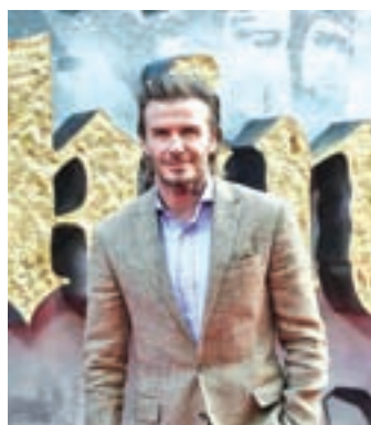
David Beckham poses at the European premiere of "King Arthur: Legend of the Sword" in London, Britain, on 10 May 2017.