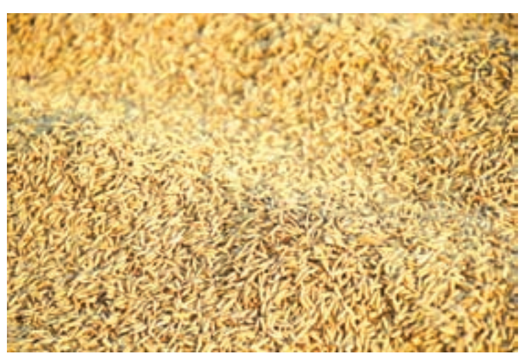
1,975 tonnes of rice were exported to Poland, South African countries and Singapore in the last week of April.