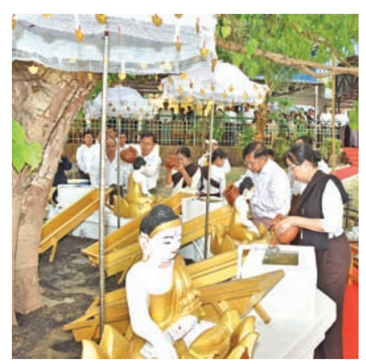
Senior General Min Aung Hlaing and wife pour water on the Bo Tree at the Lawka Chantha Pagoda in Nay Pyi Taw.

Similarly, in the Military Command Headquarters as well, festivals for pouring sacred water to Bo trees—in Nay Pyi Taw Region Command, Northern Command, North-East Com-