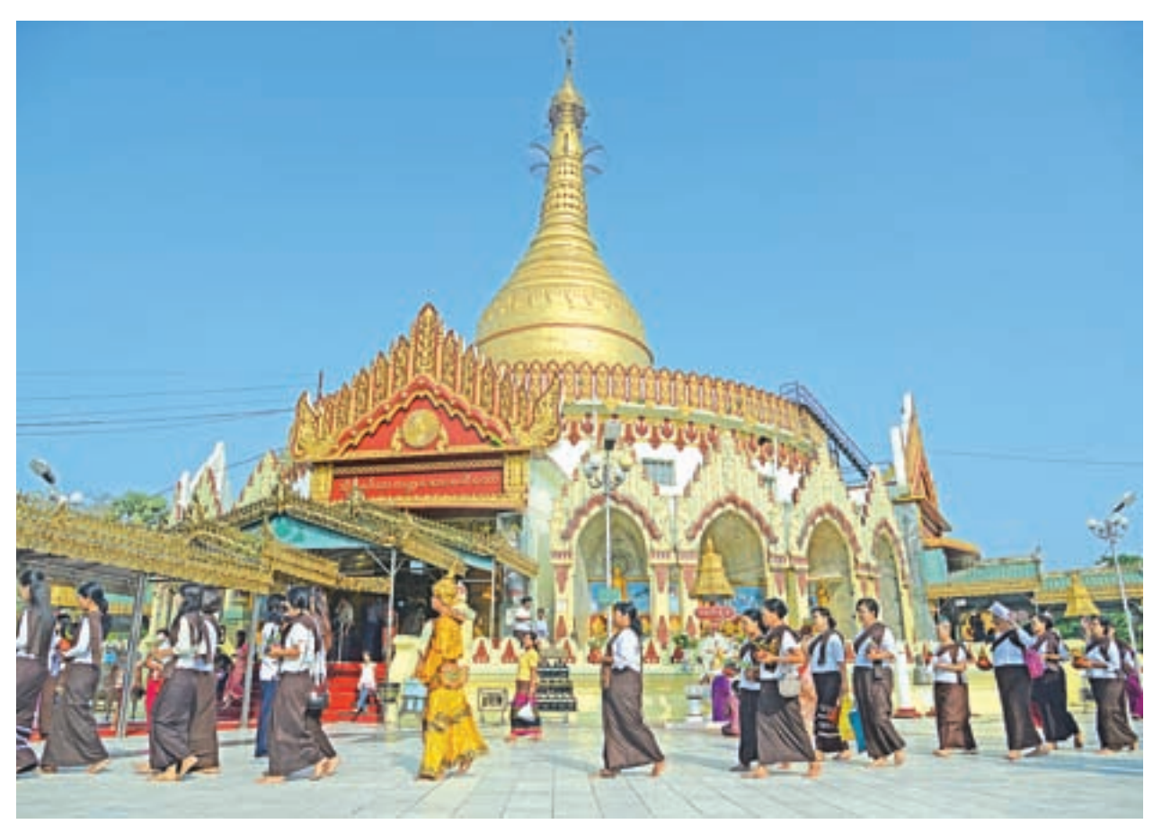
Buddhist devotees celebrating the Buddha Day at the KabaAye Pagoda in Yangon.

NATIONAL 11 MAY 2017 THE GLOBAL NEW LIGHT OF MYANMAR