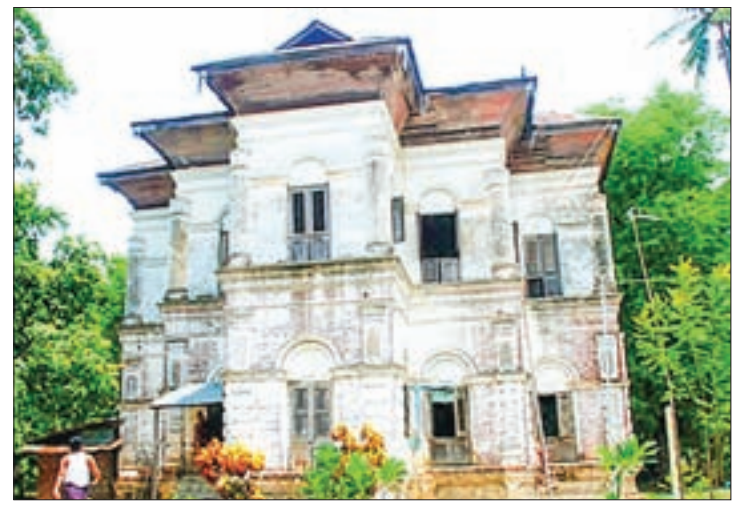
The colonial-era building in Toungoo.

The Sayadaw said the roof and other parts of the two-storey structure have worn out, urging well-wishers to take part in the renovation plan. Taungoo was a