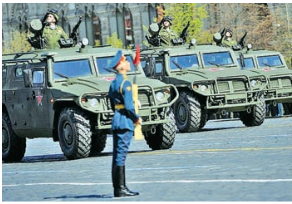
Tigr armoured vehicles.

"Compared to previous-generation stations,