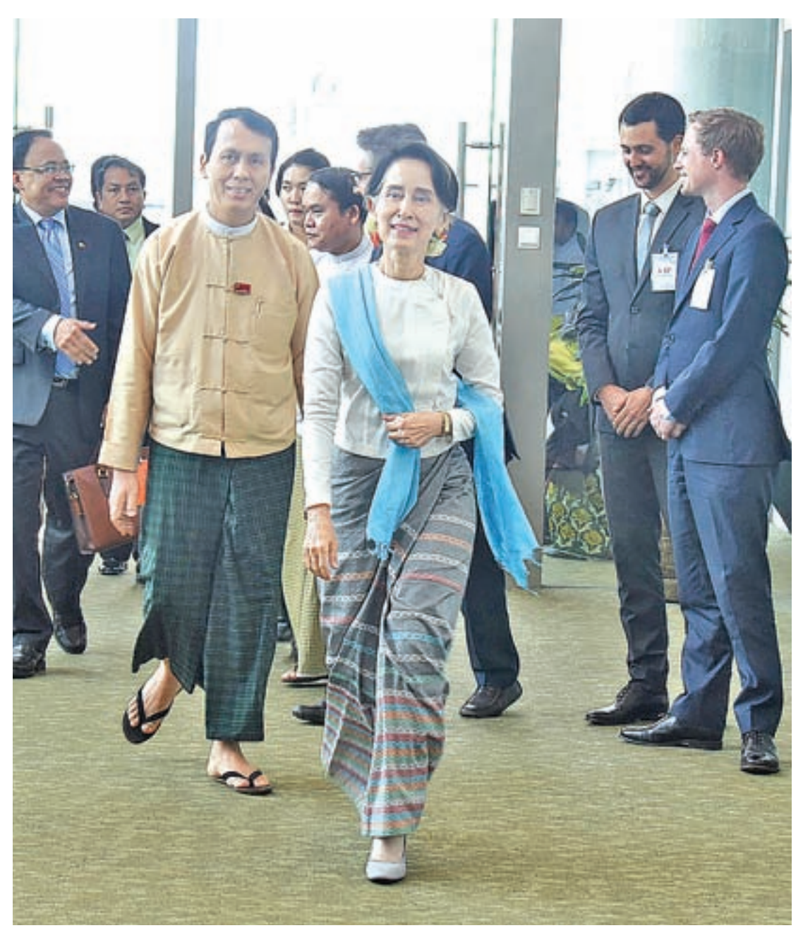
State Counsellor arrives back at the Yangon International Airport yesterday.

THE GLOBAL NEW LIGHT OF MYANMAR NATIONAL