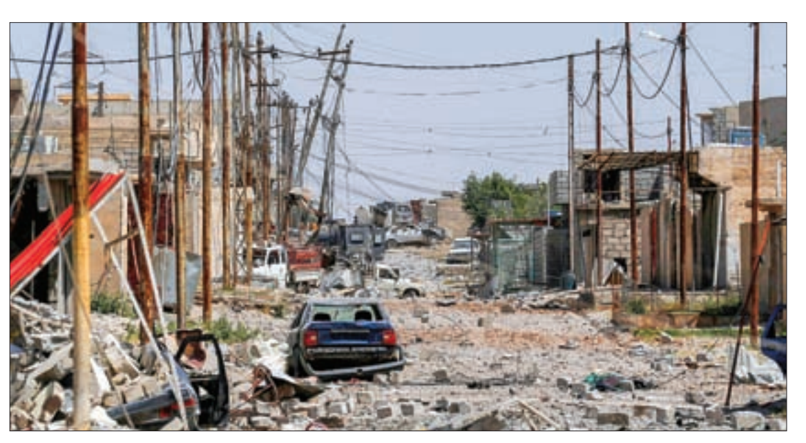
Debris is seen on a street controlled by Iraqi forces fighting the Islamic State fighters in north west of Mosul, Iraq on 9 May, 2017.

"They tried to scare us into helping them, they said the army would rape our women. But we