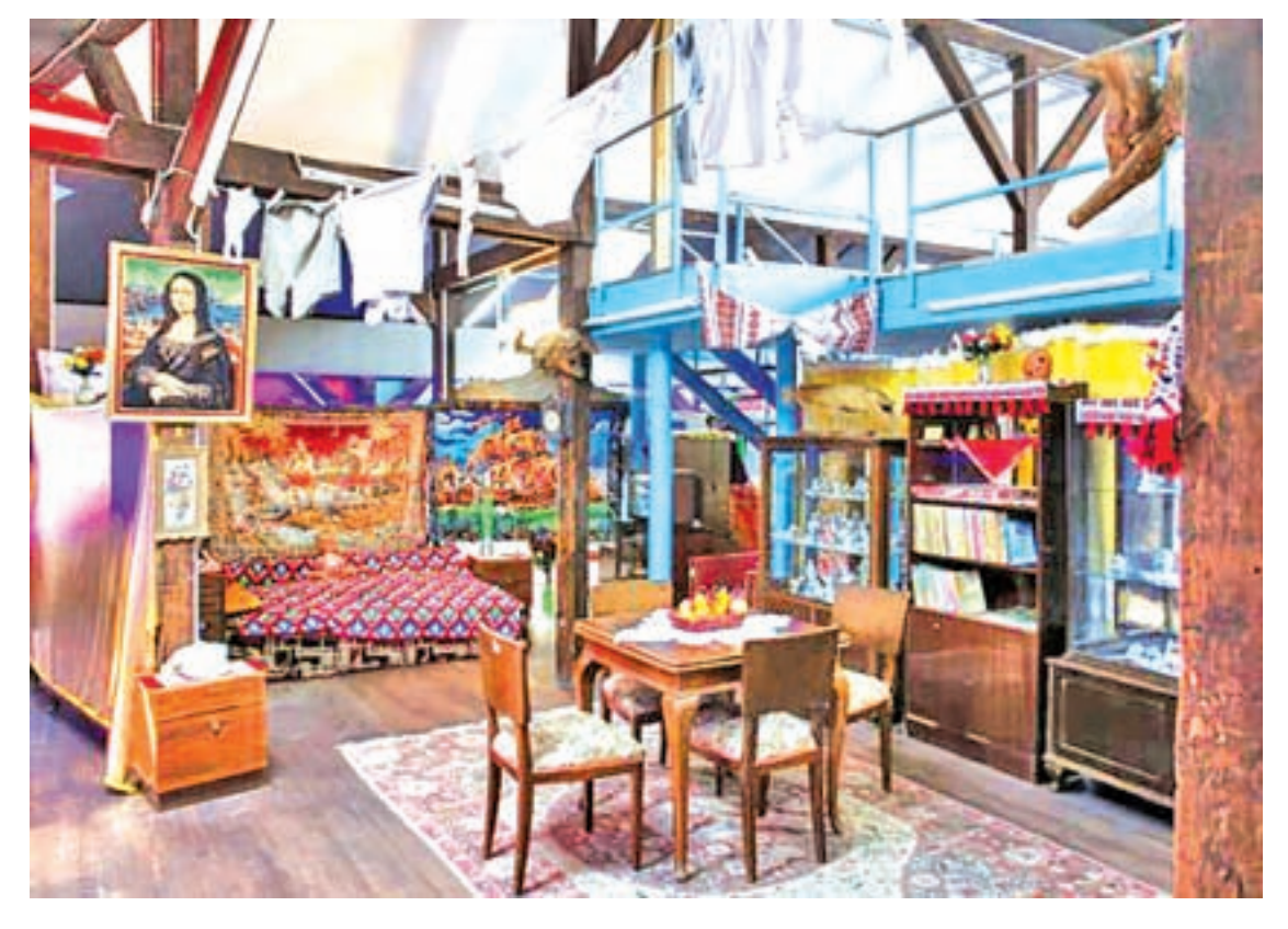
A reconstructed apartment interior is pictured inside the newly opened kitsch museum in Bucharest, Romania on 4 May, 2017.

"I am glad such a museum has opened. Everything I have seen has made me nostalgic." –Reuters 🔳