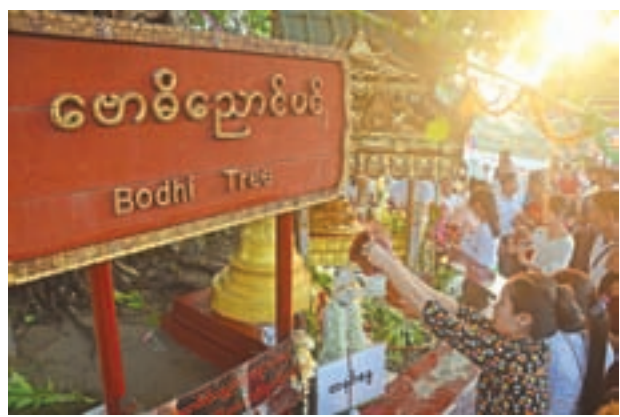
Buddhist devotees water the Bo Tree at the Shwedagon Pagoda.