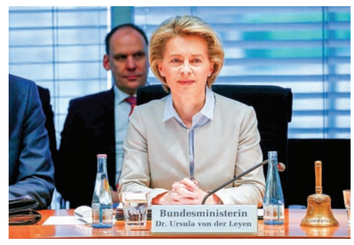
German Defence Minister Ursula von der Leyen faces the defence commission of the lower house of parliament Bundestag in Berlin, Germany on 10 May, 2017.

She said the ministry would clarify its "Traditionserlass," a policy last updated in 1982 that gives a differentiated view of how troops are to treat and view the legacy of the German military. Von der Leyen, whose post in-