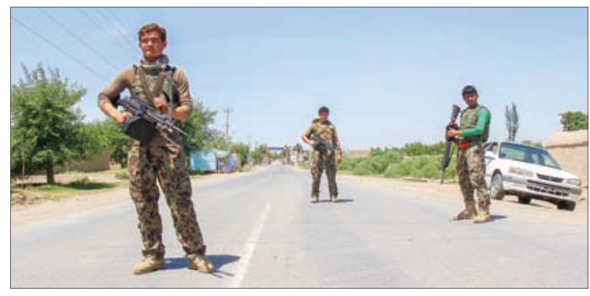
Afghan National Army (ANA) soldiers stand guard during a battle with Taliban in Kunduz provice, Afghanistan, on 10 May 2017.

NATO already has some 13,450 troops in Afghanistan, including about 6,900 US military personnel, who are training the Afghan armed forces to eventually take over the country's defence and security and