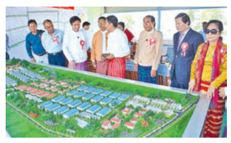
Officials inspect the modeling of the Maubin Industrial Park Project during the groundbreaking ceremony.

The project will include 42 factories relating to clothing, three factories of foodstuff, three factories of household goods, one literature and entertainment factory, one electric product factory, for a total of 50 factories. With a total estimated