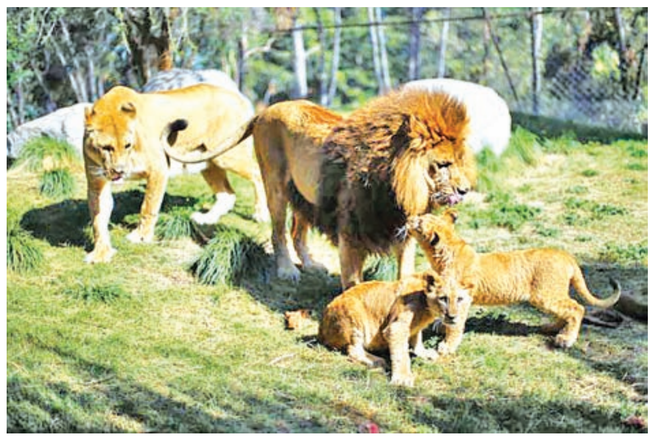
Lion cubs, who were born after a pioneering veterinary procedure that involved a reversed vasectomy of their father, are presented to the media, at Buin Zoo, in the outskirts of Santiago, Chile on 4 May 2017.

One of the cubs, which were born around three months ago, is named Niara and the other is yet to be named. Both are female. —Reuters