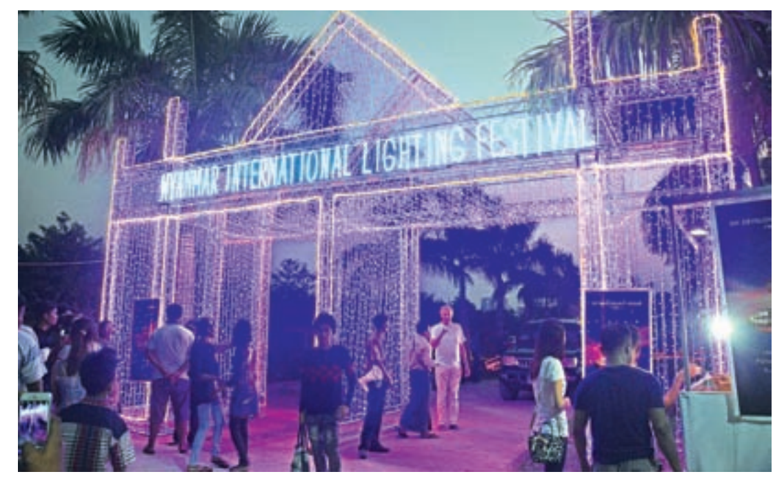
Entrance to lighting festival in People's Park in Yangon on 19 March.

Yangon People's Park was lit up with 70 million LED bulbs and about 20 million bulbs were damaged due to the rain and people attending the festival. This time