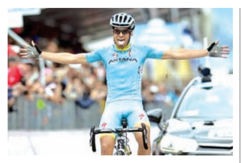
Astana rider Mikel Landa Meana of Spain celebrates as he crosses the finish line in the 174 km (108 miles) 16th stage of the 98th Giro d'Italia (Tour of Italy) cycling race from Pinzolo to Aprica, Italy, on 26 May 2015.

"Having a co-leader is great because we can play our tactics. Geraint is a very good climber