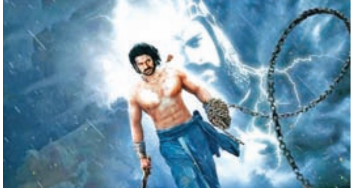
Handout photo from the film 'Baahubali 2 -The Conclusion".

"The biggest lesson is that the size of the market is huge. In the last few years, people (from the industry) have been saying that we need more screens or that the younger audiences are moving to digital, but this movie has shown that the medium is there and so are the audiences," said Shailesh Kapoor of Ormax, an agency that tracks box office results.—Reuters