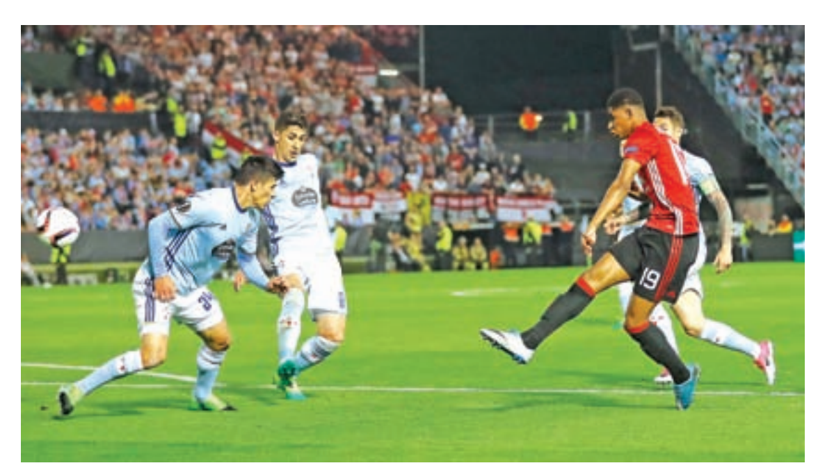
Manchester United's Marcus Rashford shoots at goal during UEFA Europa Semi Final First Leg at Balaidos Stadium, Vigo, Spain on 4 May 2017.

have the result closed but we have to go and play at Old Trafford.... We tried to win the match but we missed chances, but the team played well. They were compact against a side who are difficult to play against."