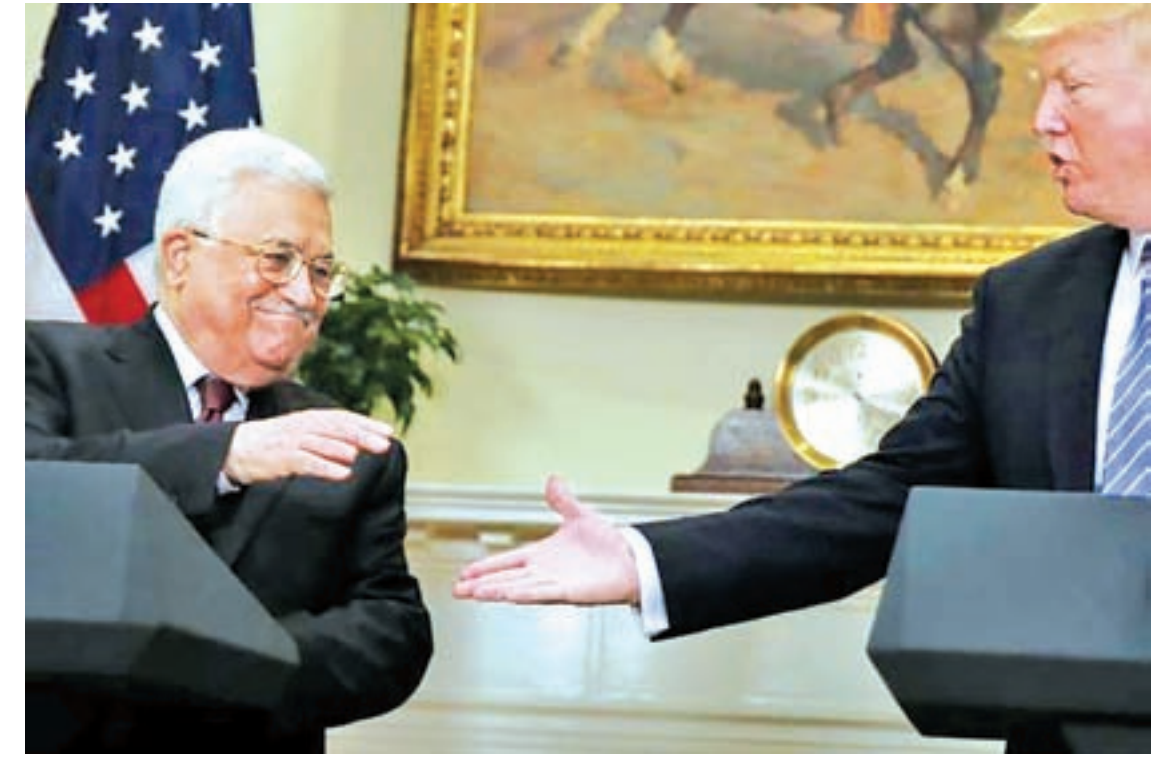
US President Donald Trump shakes hands with Palestinian President Mahmoud Abbas as they deliver a statement at the White House in Washington DC, US, on 3 May 2017.

"Our task is not to dictate to others how to live but to build a coalition of friends and partners who share the goal of fighting terrorism and bringing safe-