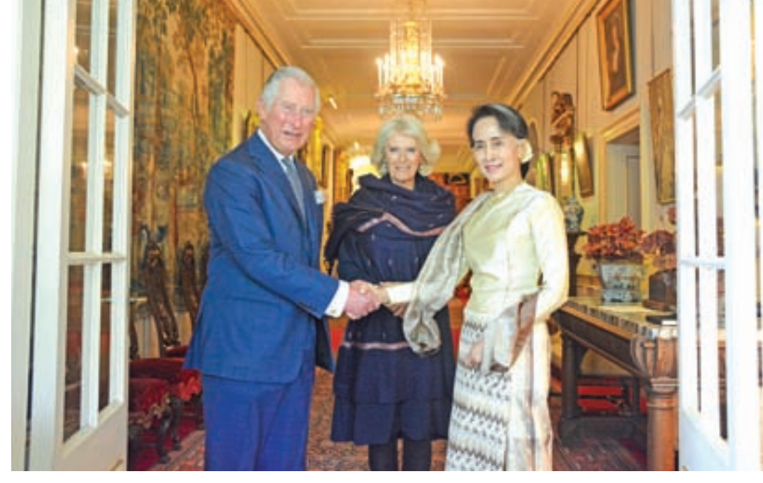
State Counsellor Daw Aung San Suu Kyi is welcomed by Charles, Prince of Wales and his wife Camilla, Duchess of Cornwall in Clarence House.

This emphasis on broad-based ownership is crucial. Though motor travel is a welcome marker of development and increased autonomy, its public health impact is shared across society. As motor vehicle ownership in the Region increases, and as countries seek to advance public health and productivity, creating safer roads through good public policy is both readily achievable and necessary. Taking the wheel on road safety is a duty that cannot be foregone.