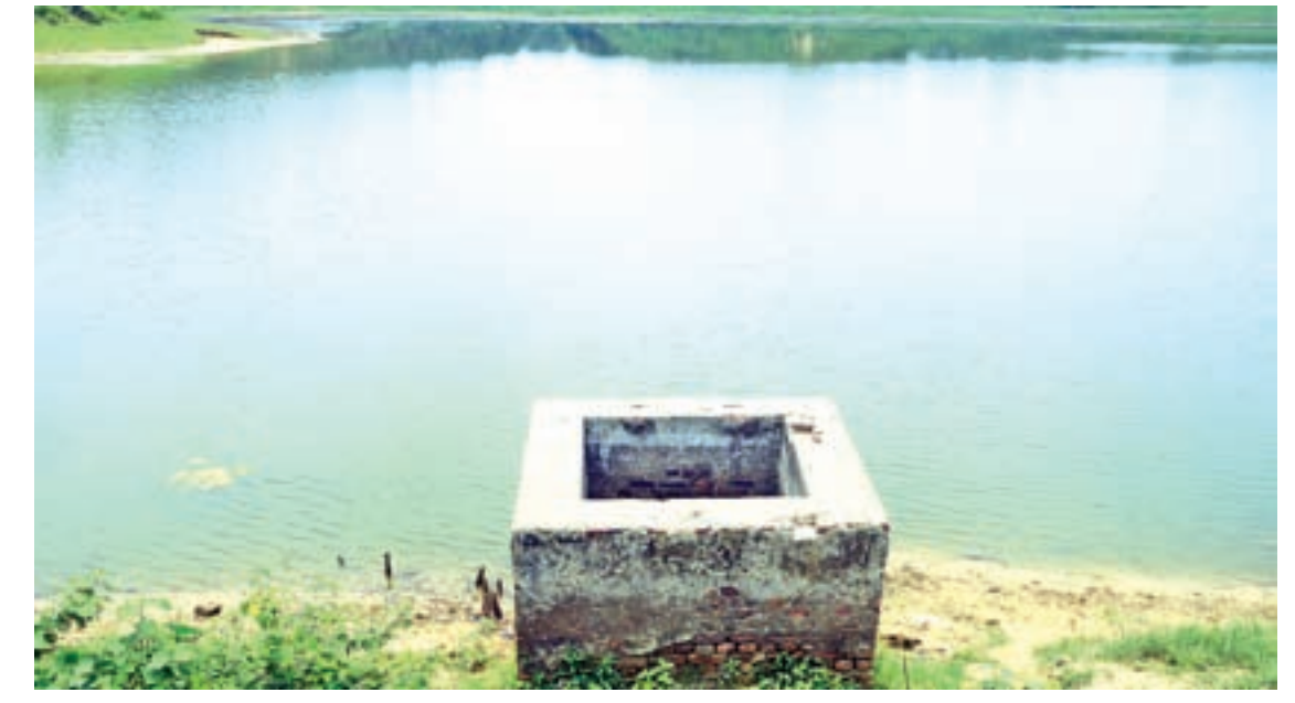
Kandawgyi Lake, which supplies water to the wards in Buthidaung.

more new water pipelines to some wards which need more water", he said. Currently, the township municipal manages the water supply in a rotating system to 184 households in seven wards and 14 sub-water supply points. The water is supplied three times daily, from 7 am to 9 am, from 11 am to 1 pm, and from 4 pm to 6 pm. The new water pipes to be installed will extend the water supply more than 1,000 feet to supply water to some wards that need more water.