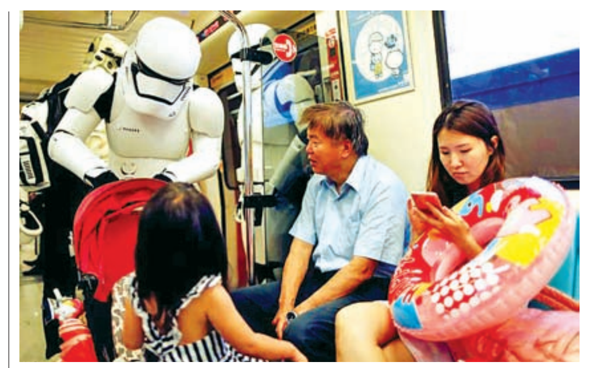
A fan dressed as a Storm Trooper from 'Star Wars' reacts at the Taipei Metro (MRT) during Star Wars Day in Taipei, Taiwan on 4 May 2017.

The widely acclaimed production also won in the Best Lighting Design, Best Costume Design, Best Sound Design and Best Set Design categories.— PTI 🔳