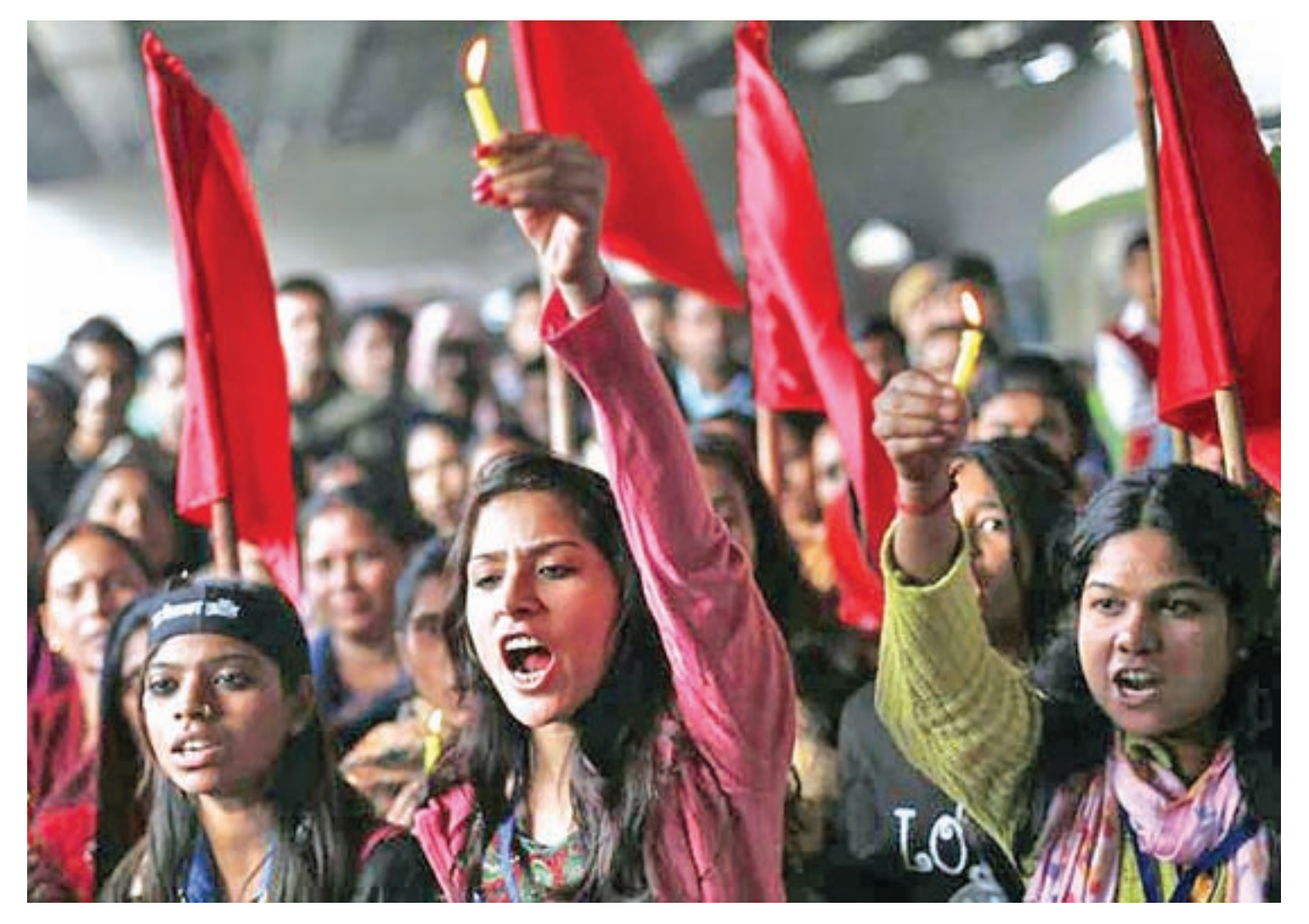
Protesters carry candles as they shout slogans during a protest to mark the first anniversary of the Delhi gang rape, in New Delhi 16 December, 2013. PHOTO: REUTERS

The World Health Organization recommends concentrations of just 10 micrograms. —Reuters ■