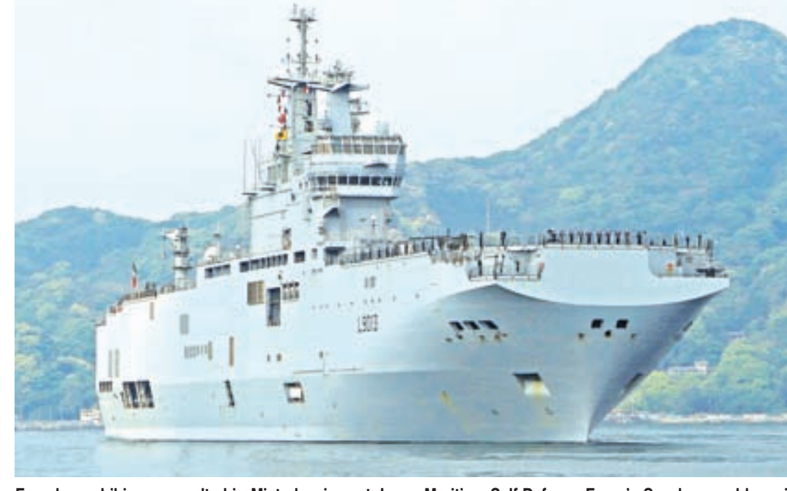
French amphibious assault ship Mistral arrives at Japan Maritime Self-Defense Force's Sasebo naval base in Sasebo, Nagasaki prefecture, Japan on 29 April, 2017, ahead of joint exercises with US, British and Japanese forces in waters off Guam.

This month China launched its first domestically-built aircraft car-