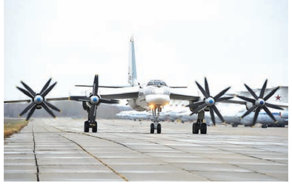
Tu-95MS strategic bomber.