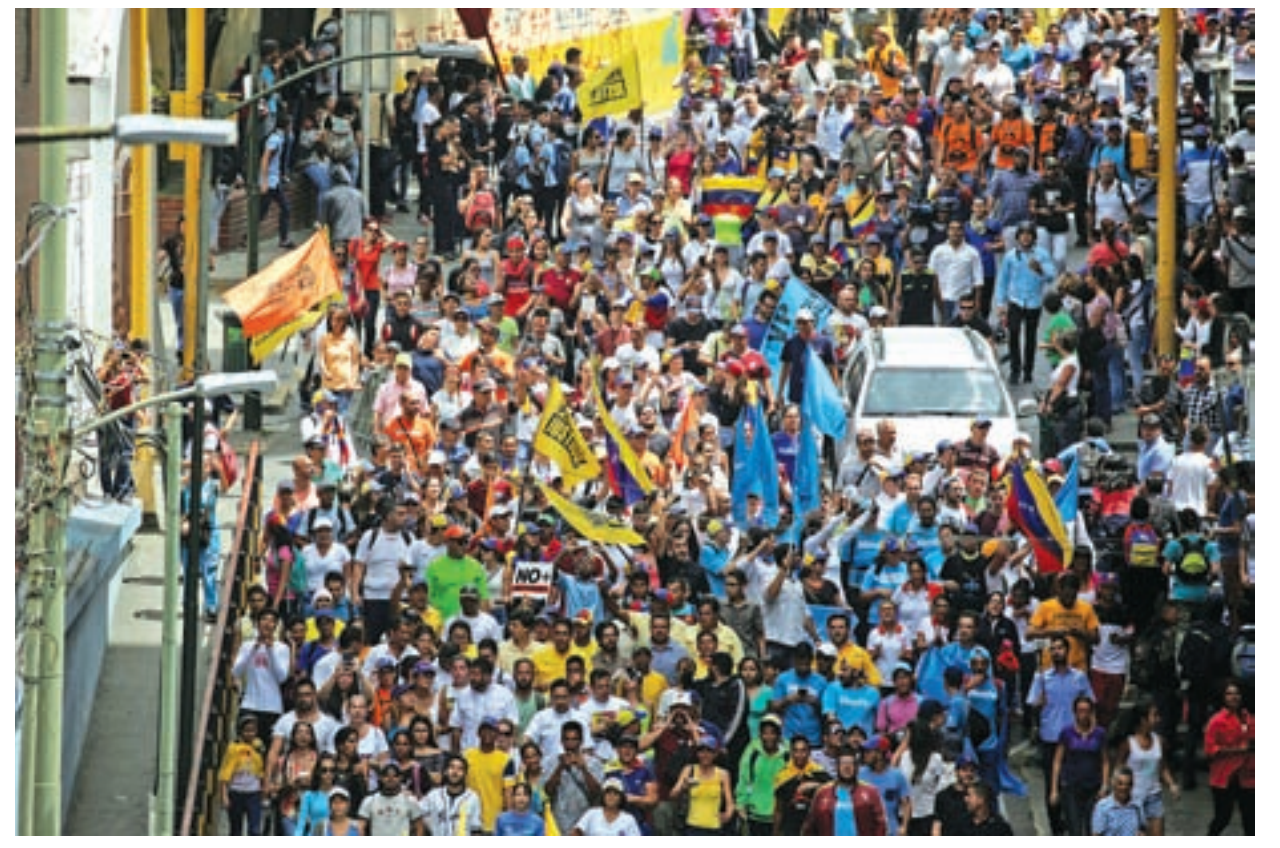
Opposition supporters attend a rally in support of political prisoners and against Venezuelan President Nicolas Maduro, in downtown Los Teques, Venezuela on 28 April, 2017.