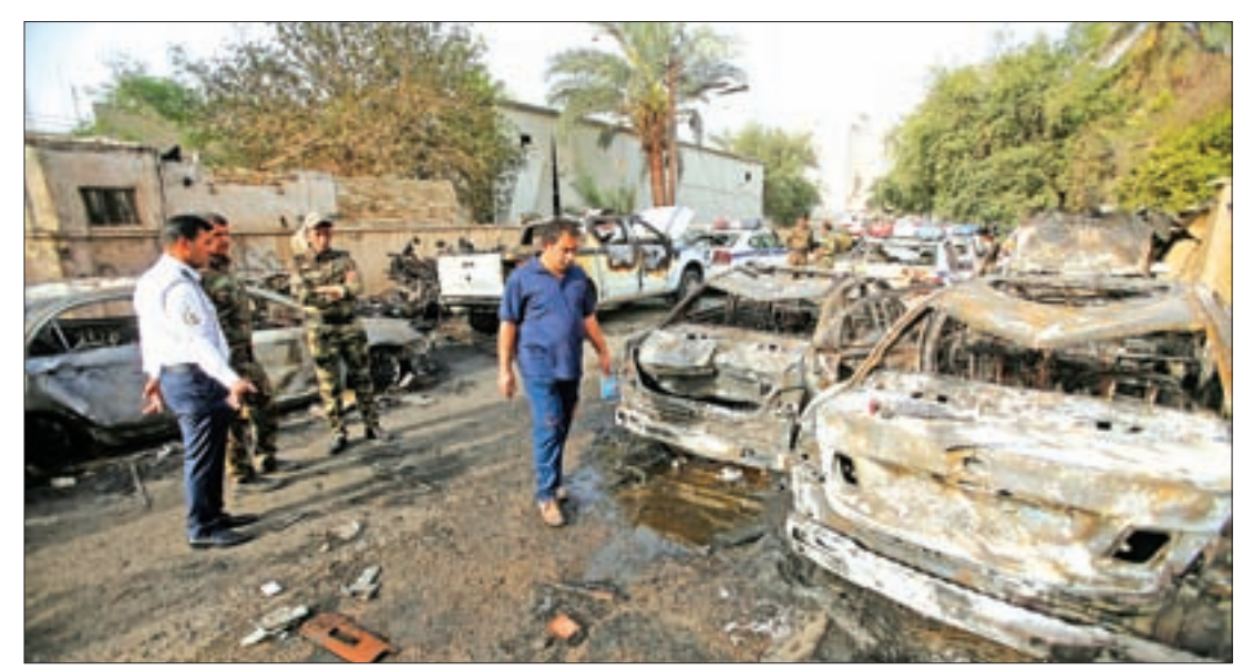
Members of Iraqi security forces look at the site after a suicide car bomb attack in Baghdad, Iraq on 29 April, 2017.

Embassy is located in the area. Islamic State claimed the suicide attack on its Amaq news agency. The hardline Sunni group has controlled parts of Iraq and Syria since 2014. —Reuters