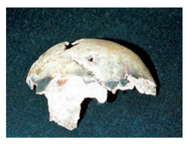
A fragment of Hitler's skull with a bullet hole.

Funeral services will be held at St Augustine's RC Church at 64 Inya Road at 08:00 am on 1st May 2017 followed by burial at Htein Pin. Catholic cemetery.