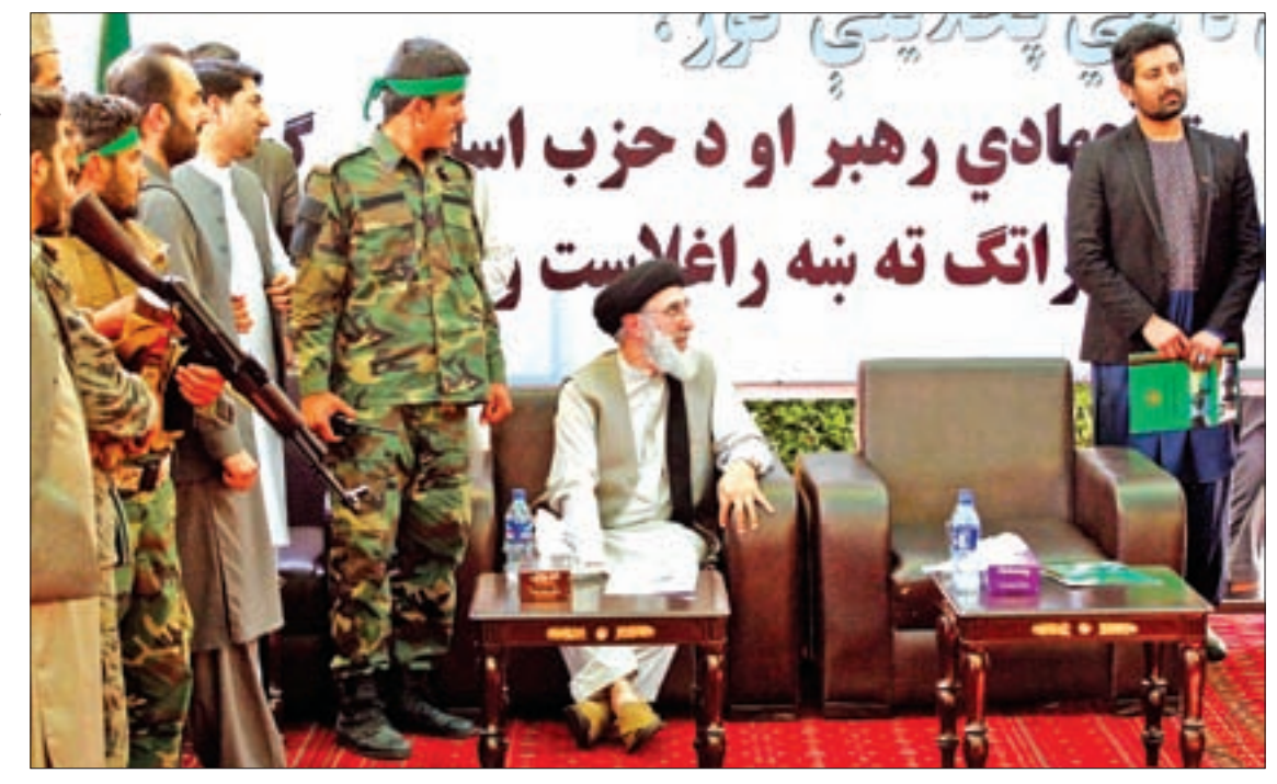
Afghan warlord Gulbuddin Hekmatyar (C) arrives to speak to supporters in Laghman province, Afghanistan on 29 April, 2017.

"I want a free, proud, independent and Islamic Afghanistan," he said on Saturday.