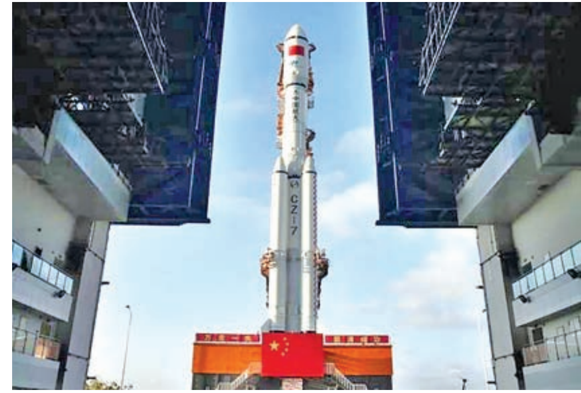
Long March-7 rocket and Tianzhou-1 cargo spacecraft are seen as they are transferred to a launching spot in Wenchang, Hainan province, China on 17 April, 2017. PHOTO: REUTERS

China insists it has only peaceful ambitions in space, but has tested anti-satellite missiles. — Reuters