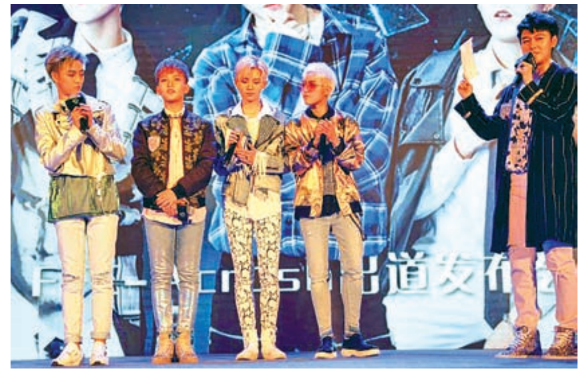
Members of China's all-girl 'boyband' FFC-Acrush appear on the stage during their maiden press conference in Beijing, China, on 28 April 2017.

In 2005, a boyish-looking Li Yuchun briefly won fans with her style. She also sparked debate