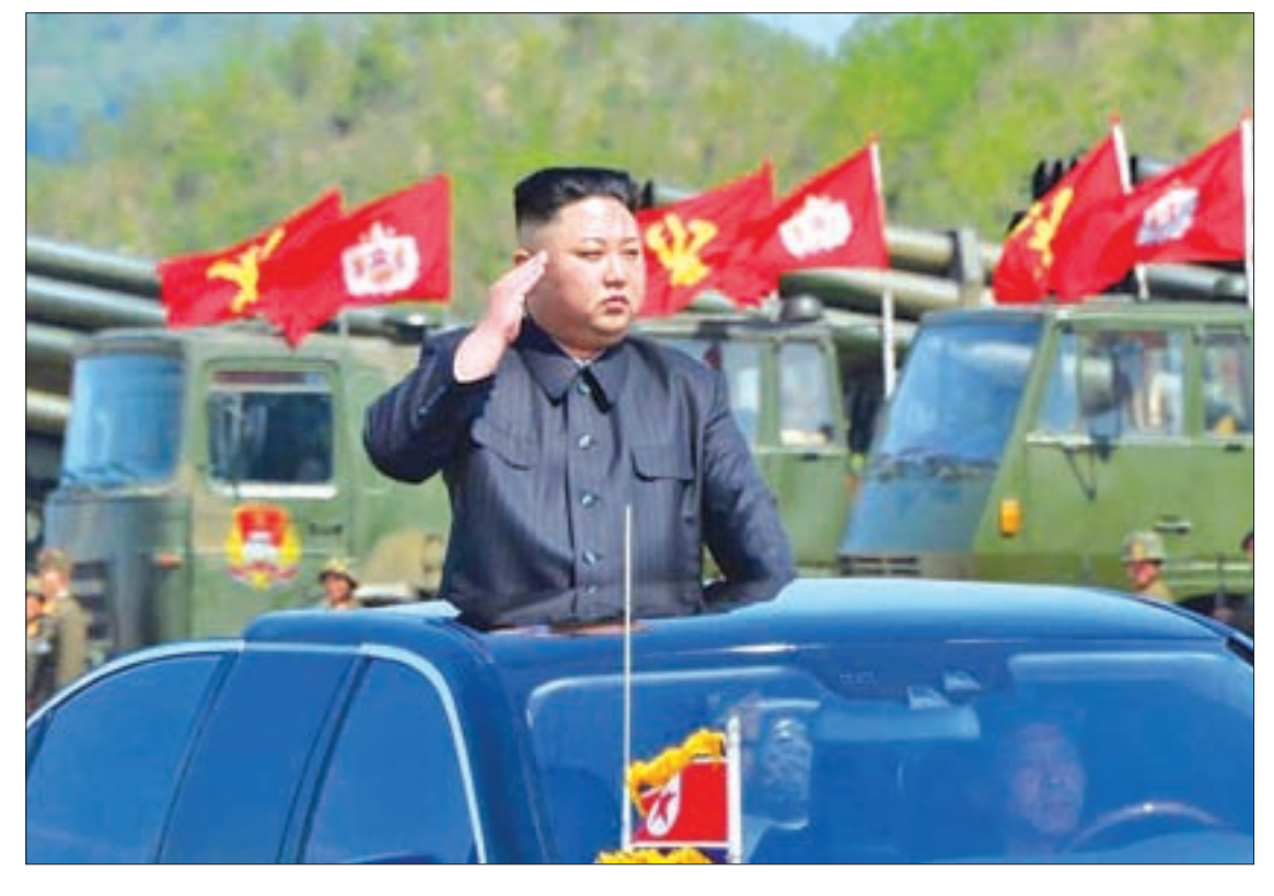
North Korea's leader Kim Jong Un watches a military drill marking the 85th anniversary of the establishment of the Korean People's Army (KPA) in this handout photo by North Korea's Korean Central News Agency (KCNA) made available on April 26, 2017. PHOTO: REUTERS

Trump praised Chinese leader Xi Jinping for "trying very hard" to rein in Pyongyang.