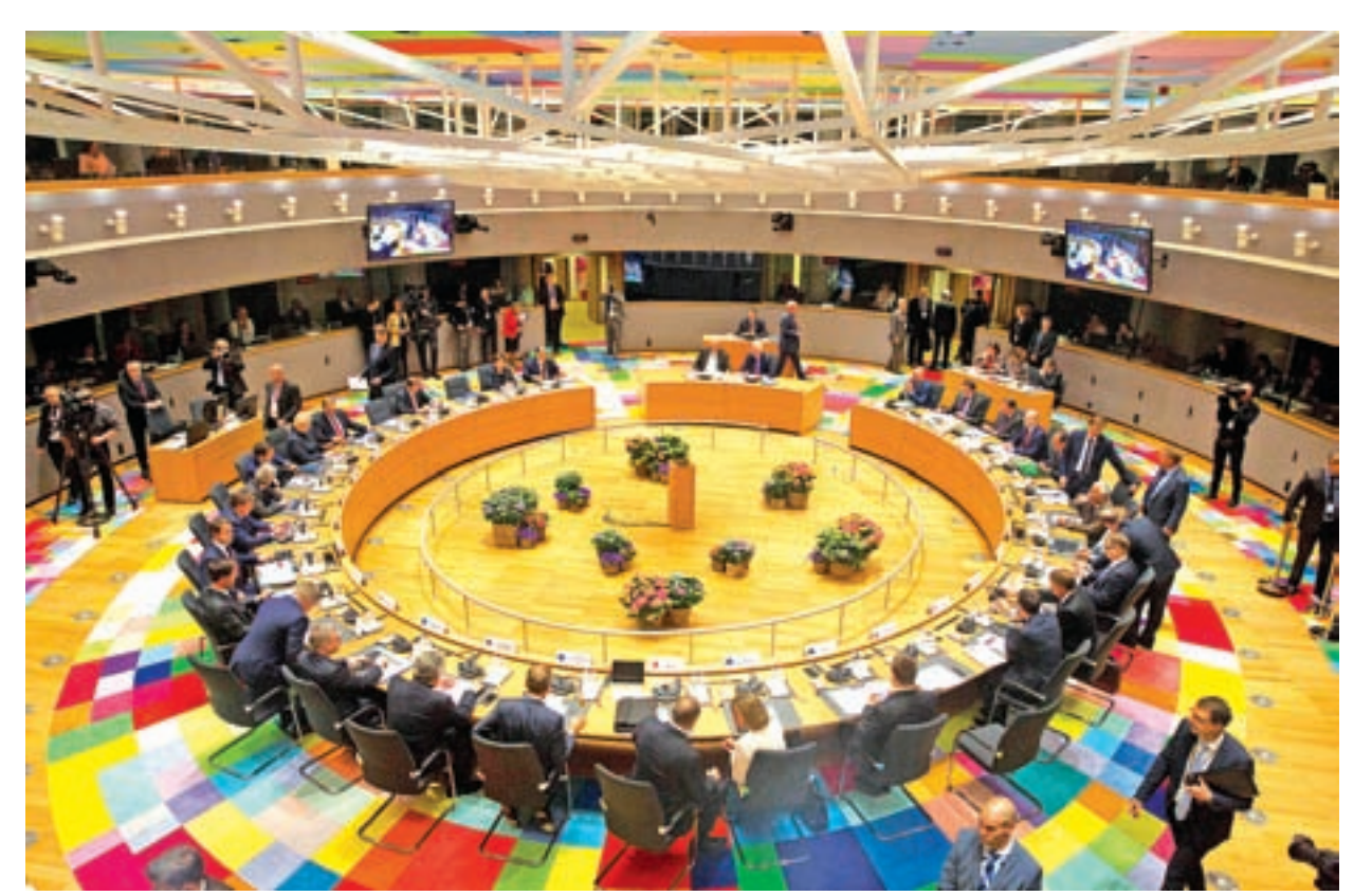
European Heads of State meet during a EU summit in Brussels, Belgium on 29 April, 2017.

BRUSSELS — European Union leaders endorsed a stiff set of divorce terms for Britain at a summit on Saturday, rejoicing in a rare show of unity in adversity but well aware that may start to fray once negotiations begin.