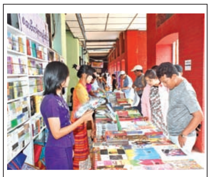
Book worms visit a book shops of summer book festival in Yangon on 29th April.

Once ratified, the new act will put foreign investors on a more level footing with Myanmar citizens, giving them the opportunity to buy into the domestic economy and reinforcing their confidence in their legal rights.