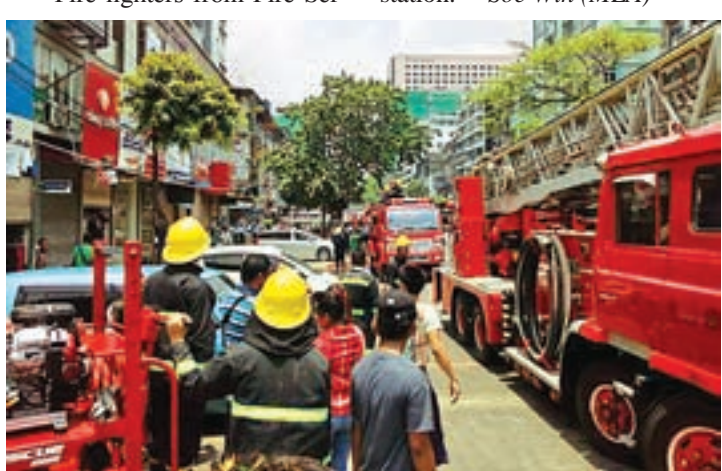
Fire breaks out at Pansoedan Business Tower in Kyauktada Township.