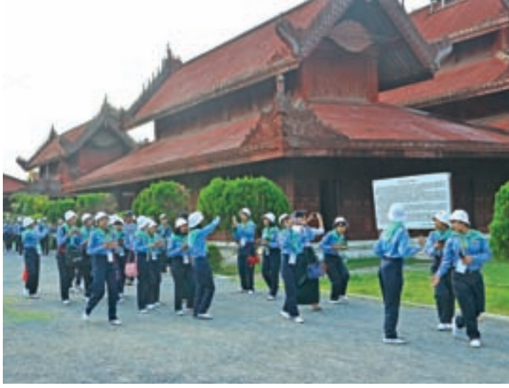
Outstanding students making an excursion tour in Mandalay.

The outstanding students will take a recreation at Myananbon Royal Emerald River View Resort during the trip.—Naing Lin Kyi