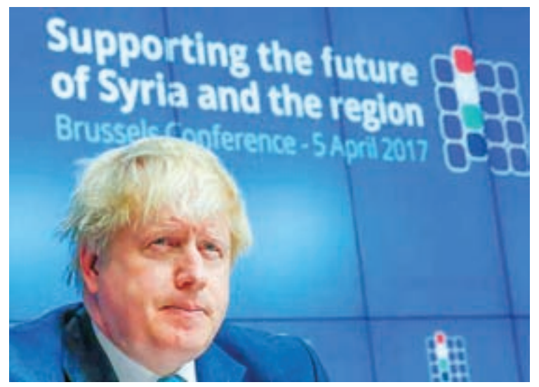
British Foreign Secretary Boris Johnson takes part in an international news conference on the future of Syria and the region, in Brussels, Belgium, on 5 April 2017.

"If the Americans were once again to be forced by the actions of the Assad regime ... and they ask