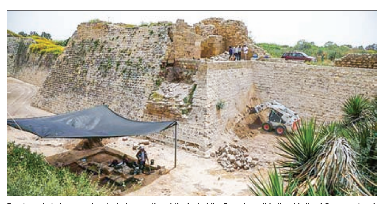
People work during an archaeological excavation at the foot of the Crusader wall in the old city of Caesarea, Israel, on 26 April 2017.

CAESAREA, (ISRAEL) honour of Emperor Augusa once-towering ancient-Roman temple in the modern-day Mediterranean city of Caesaria.