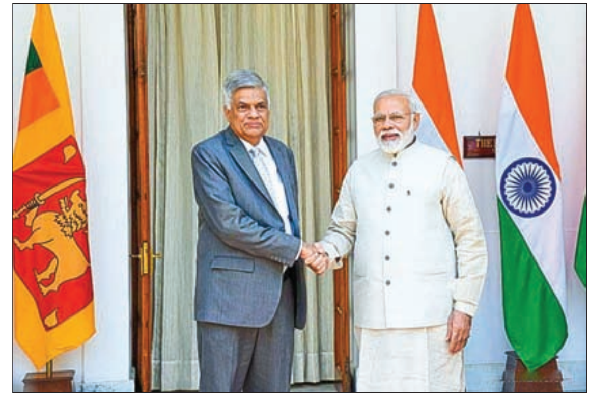
Indian Prime Minister Narendra Modi (R) shakes hands with his Sri Lankan counterpart Ranil Wickremesinghe before their meeting at Hyderabad House in New Delhi, capital of India, on 26 April 2017. India and Sri Lanka on Wednesday singed a key agreement on economic cooperation as Prime Minister Narendra Modi held extensive talks with his Sri Lankan counterpart Ranil Wickremesinghe in the national capital to strengthen bilateral ties.

Sri Lanka has proposed to sign an MoU with India next month during Modi's visit, which proposes Indian investment in development of port and oil tank farms in Trincomalee, setting up a power plant and terminal, piped gas supply in Colombo, and highway and railway projects.—Xinhua