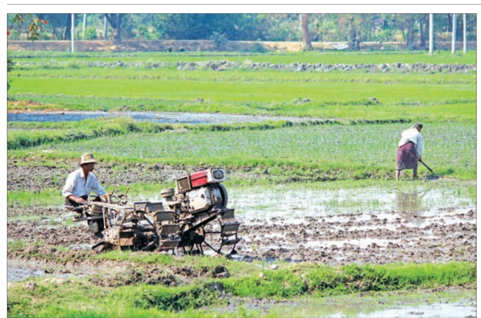
Myanmar's farmers need assistance to shift from traditional to mechanised farming as the country moves toward contract farming.