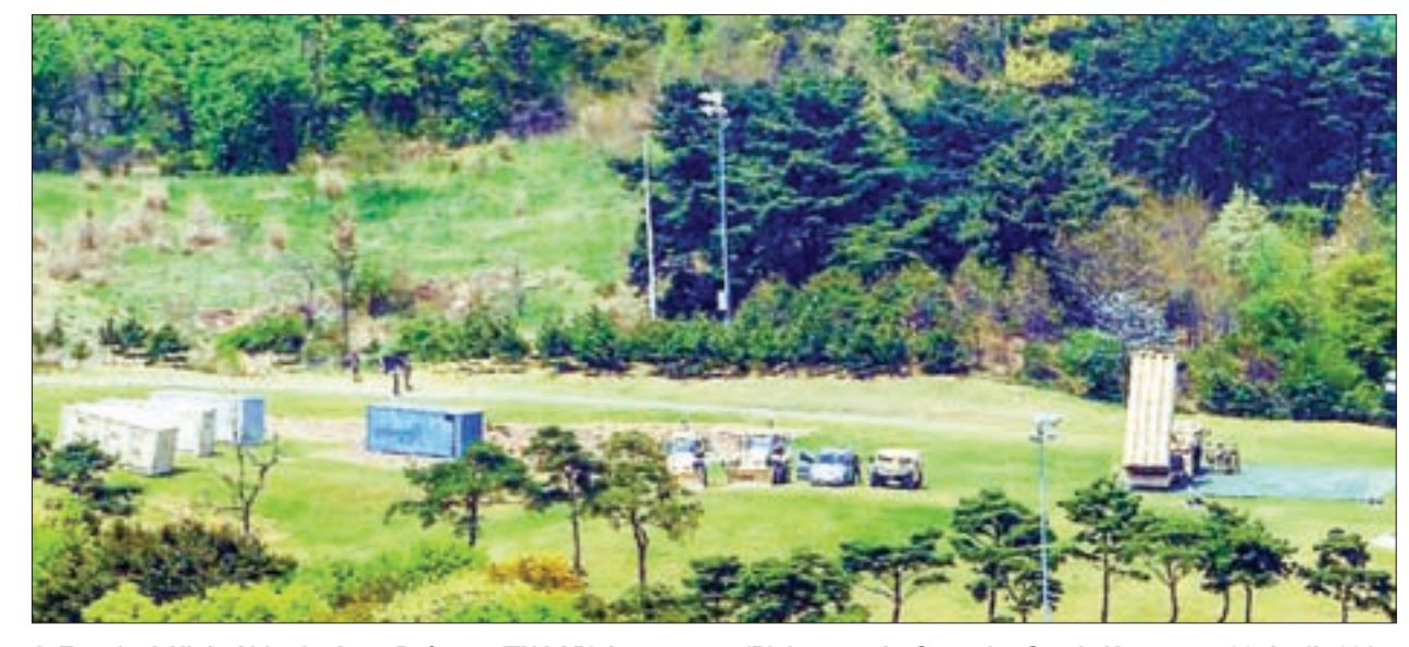
A Terminal High Altitude Area Defence (THAAD) interceptor (R) is seen in Seongju, South Korea, on 26 April, 2017.

"The United States seeks stability and the peaceful denuclearisation of the Korean peninsula. We remain open to negotiations towards that goal.