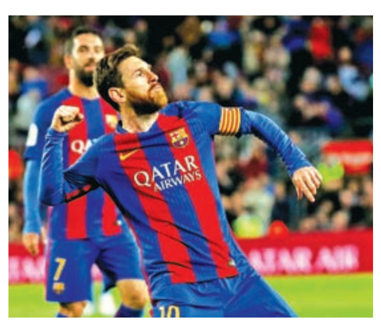
Barcelona's Lionel Messi celebrates a goal at Camp Nou stadium, Barcelona, Spain, on 26 April 2017.

BARCELONA — Real Madrid Lucas Vazquez and substitute thrashed Deportivo La Coruna 6-2 to stay level with Barcelona at the top of La Liga on Wednesday after the Catalans crushed Osasuna 7-1, condemning the minnows to relegation.