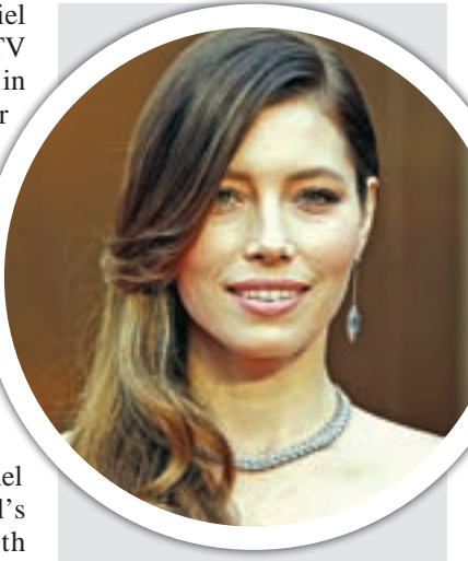
Jessica Biel.

"It was totally different from what I've done recently and in the