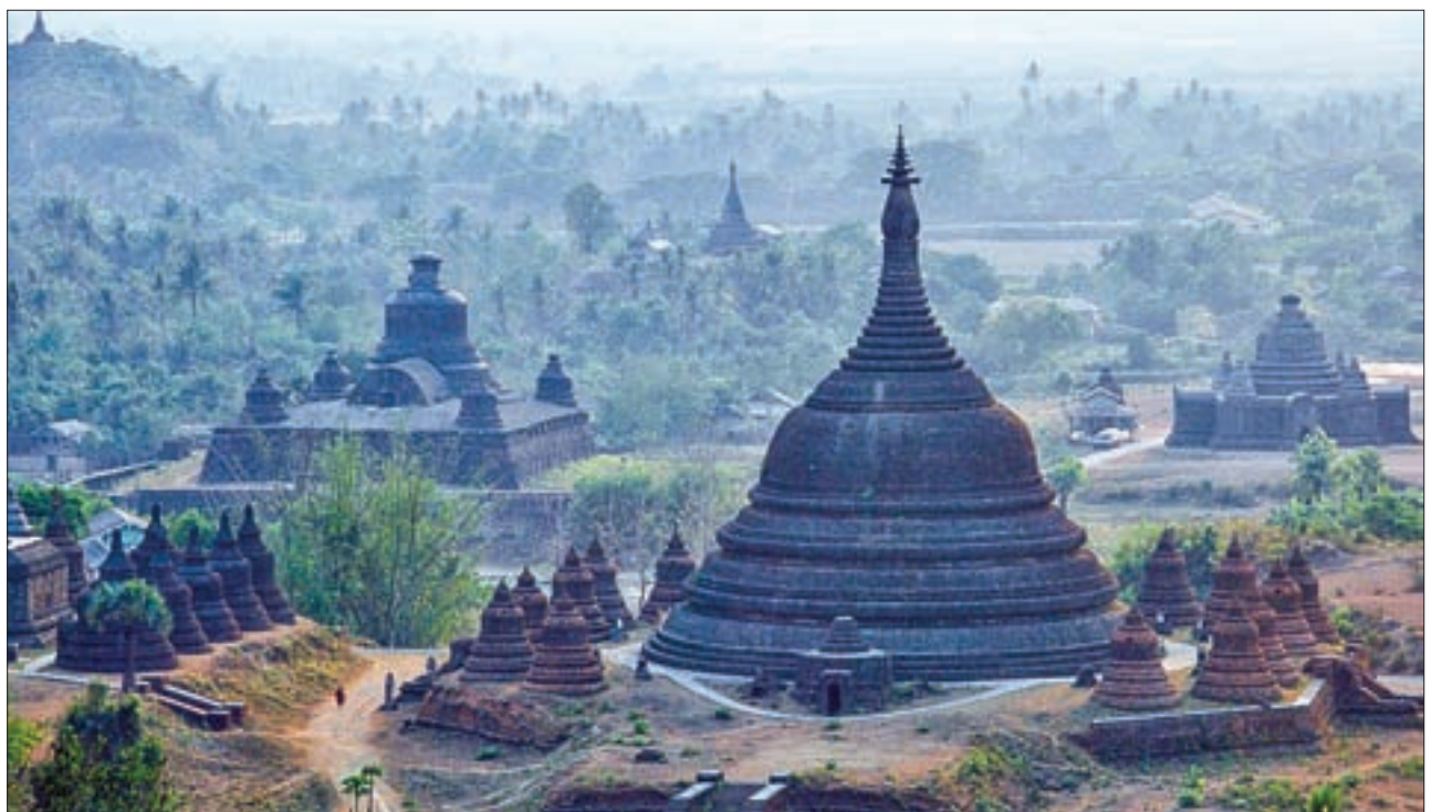
MraukU is a well-known site of ancient temples and pagodas in Rakhine State.

2) Let's Clean House: The Chinese government uncovered a local problem that was a hindrance to tourism, and I think it