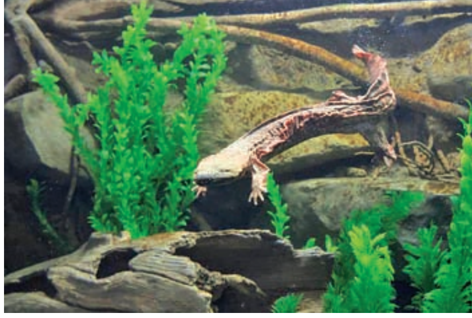
An Eastern Hellbender salamander swims in its enclosure at the Bronx Zoo in New York, US, on 18 April 2017.

The creatures made their public debut over the