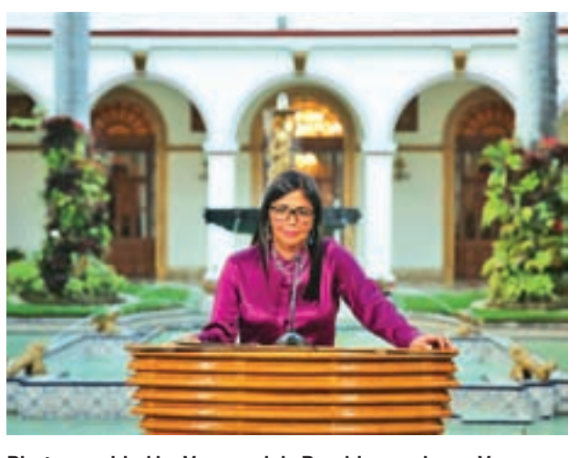
Photo provided by Venezuela's Presidency shows Venezuela's Foreign Minister Delcy Rodriguez delivering a speech in Caracas, Venezuela, on 26 April 2017. Photo: XINHUA

Venezuela has long accused the OAS secre-