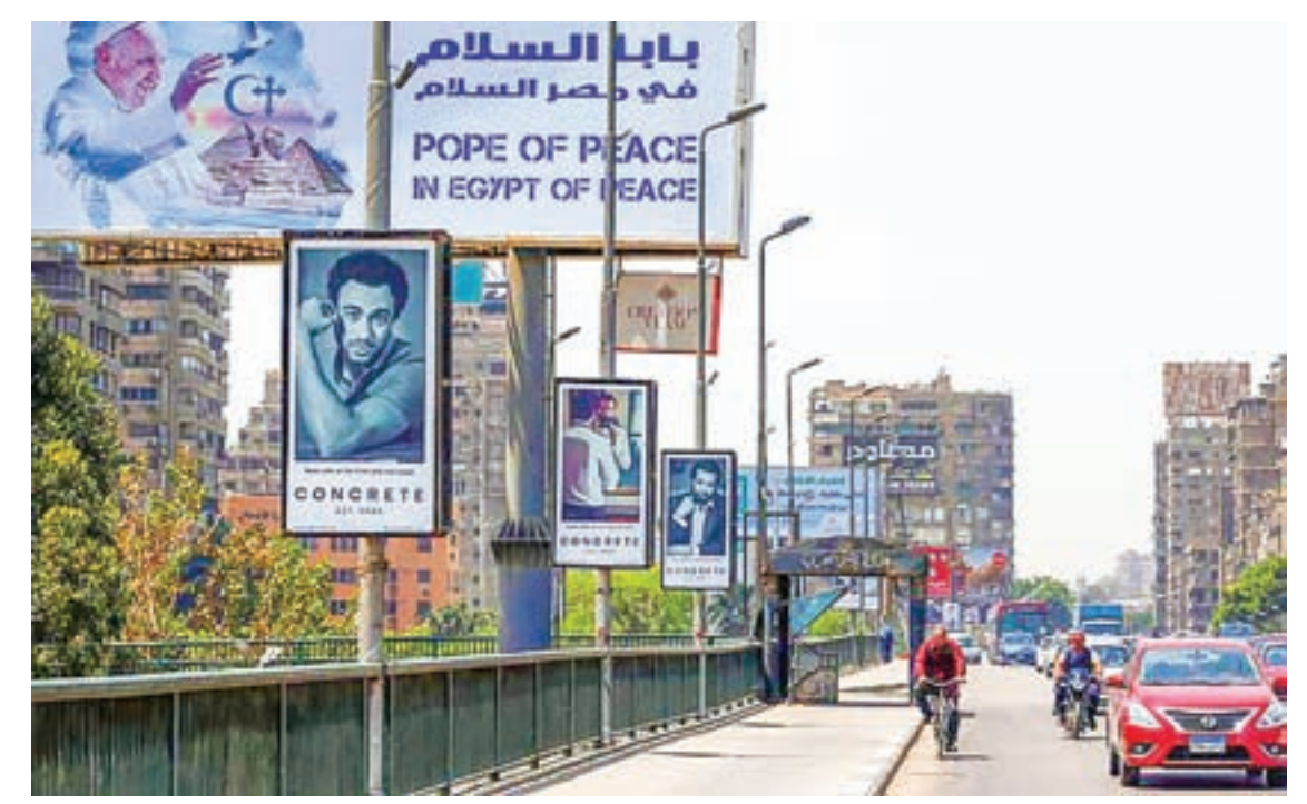
Vehicles drive past a billboard ahead of Pope Francis' visit in Cairo, Egypt, on 26 April 2017.

"There's no future for us here," she said, speaking in a cafe, the sound of falling shells thudding in the distance. —Reuters