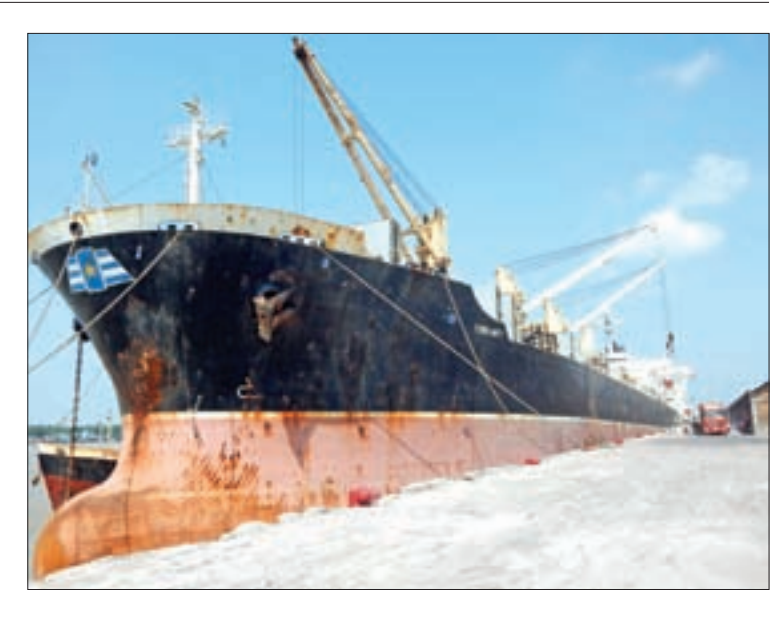
Rice bags being loaded onto the cargo ship M V Tomini Amity at Pier 2 Sule Port. The successful docking of the cargo ship significantly reduces transportation costs.

The successful docking was accomplished with the help of the managing director, chief navigator and officials from Myanma Port Authority, which is under the guidance of the Ministry of Transport and Communications.