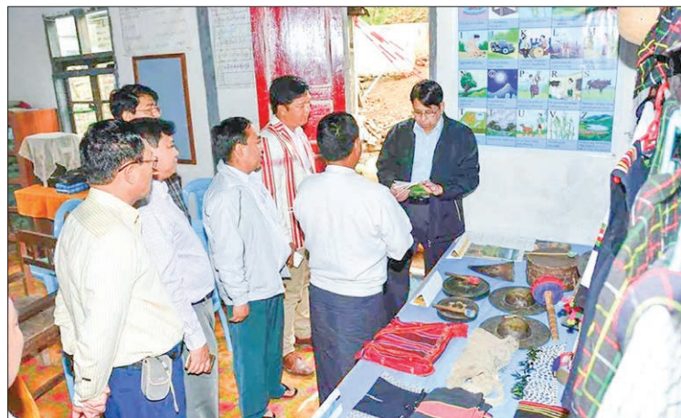
Union Minister Dr. Pe Myint viewing Chin traditional handicraft.

UNION Minister of Information Dr. Pe Myint, together with his entourage and Chin State Minister for Social Affairs U Paung LunHtan, arrived in Tiddim, Chin State on Wednesday morning.