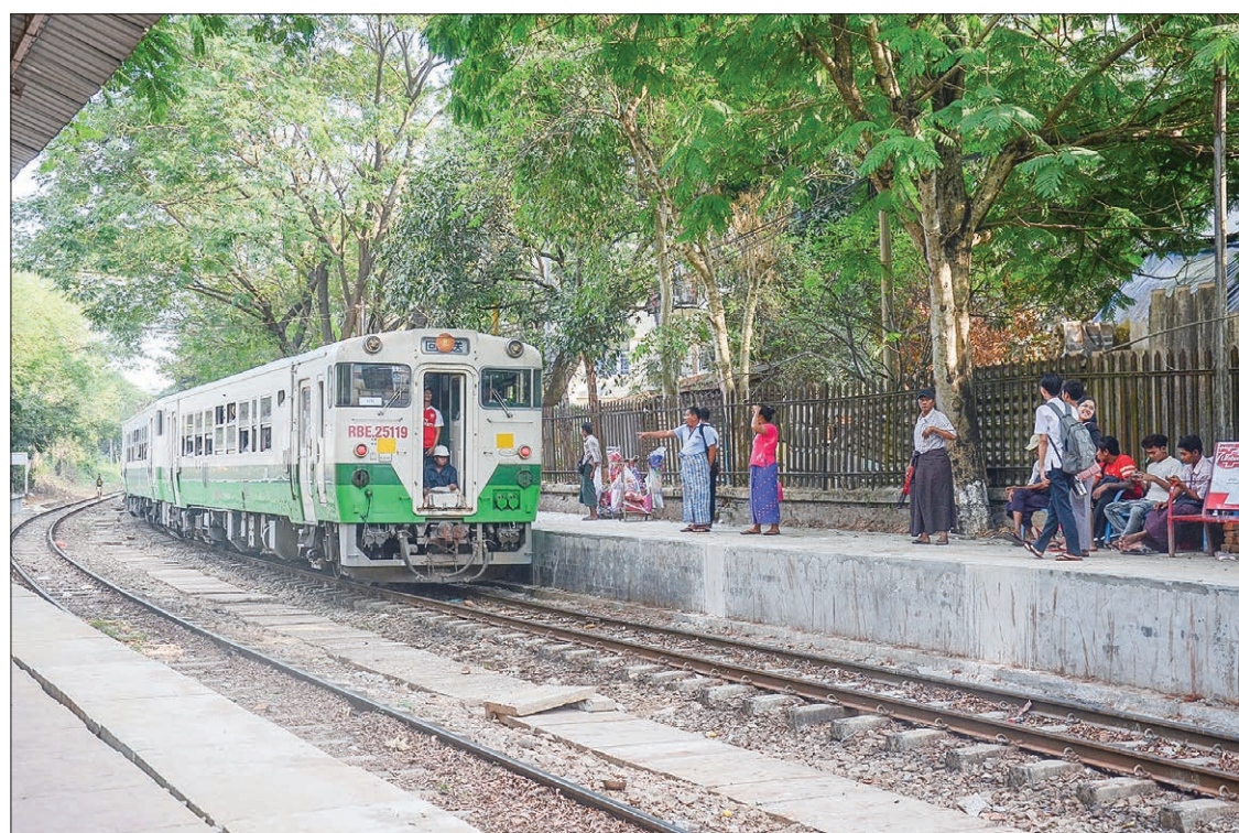
A circular train runs on railway lines at a rural railway station.

The MR has been upgrading railway stations and platforms