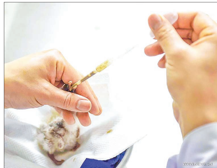
A staff member feeds a baby crested ibis at a breeding center of Sichuan Provincial Academy of Natural Resources Sciences in Emeishan, southwest China's Sichuan Province, on 19 April 2017.

During the past three decades, the population of crested ibis in China has grown from seven to more than 2,000 due to conservation efforts by the government and academic institutions. The endangered birds are under top national protection.—Xinhua