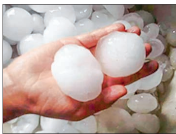
Tennis ball-sized hailstones from a 2016 storm.

Amid the weather warning, the Union Minister for Social