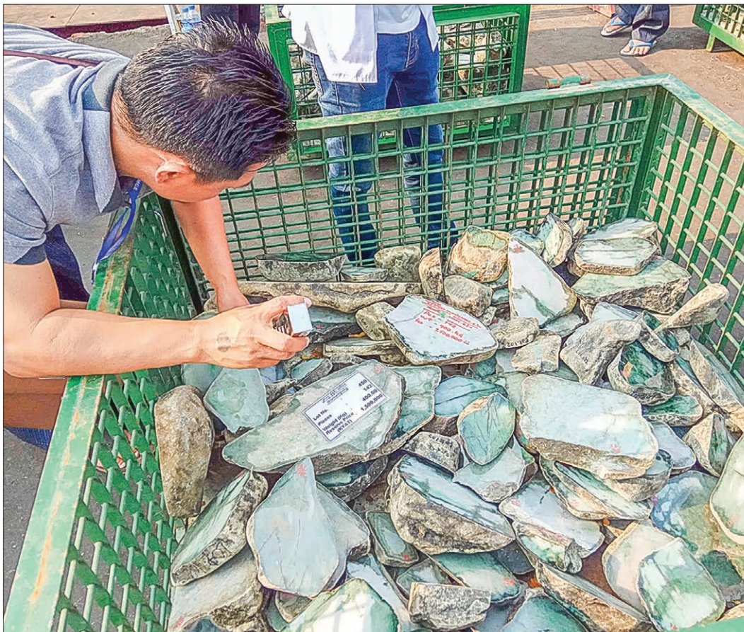
A trader evaluates jade stones at the Gems and Jade emporium in Nay Pyi Taw in March 2017.

In 2016-17 FY, cross-border trade with ITCs was more than Ks18 billion.— Kyaw Swa