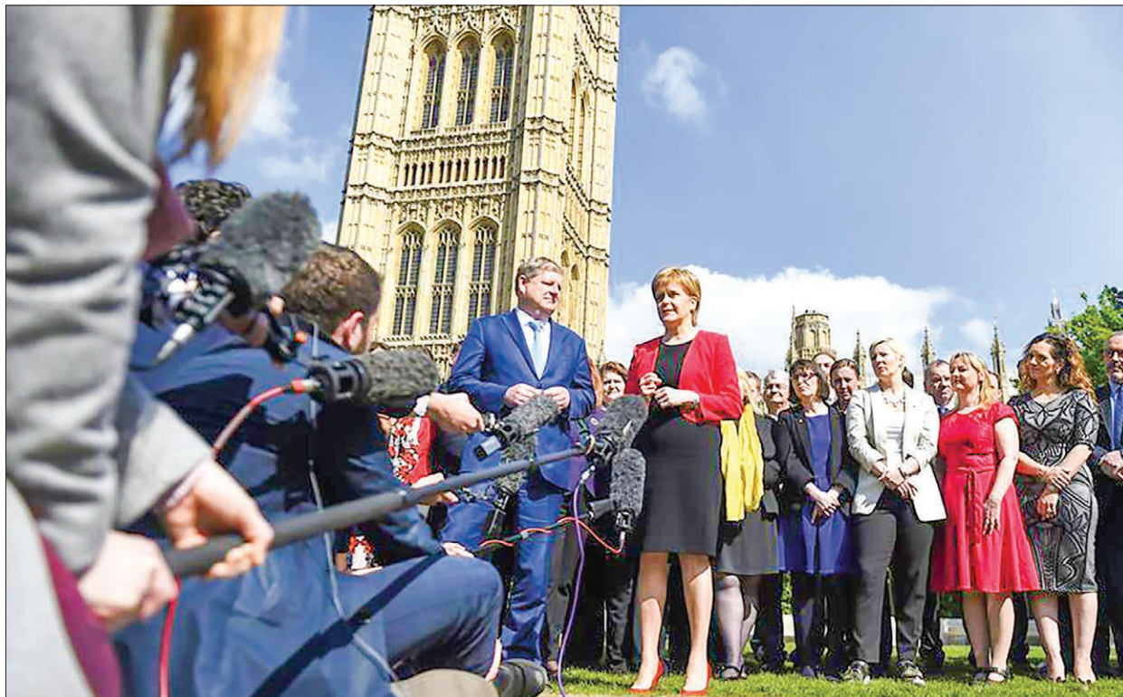
Scottish National Party (SNP) leader and Scottish First Minister Nicola Sturgeon (R, front) speaks outside the houses of Parliament with deputy SNP leader Angus Robertson in London, Britain, on 19 April 2017. Members of Parliament in the British House of Commons gave their backing Wednesday to prime minister Theresa May's call for a snap general election on 8 June.

LONDON — Members of Parliament (MPs) in the British House of Commons gave their backing Wednesday to Prime Minister Theresa May's call for a snap general election on 8 June.