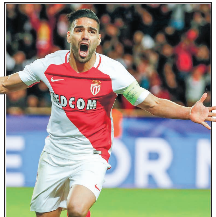
Monaco's Radamel Falcao celebrates scoring their second goal during UEFA Champions League Quarter Final Second Leg at Stade Louis II, Monaco, on 19 April 2017.