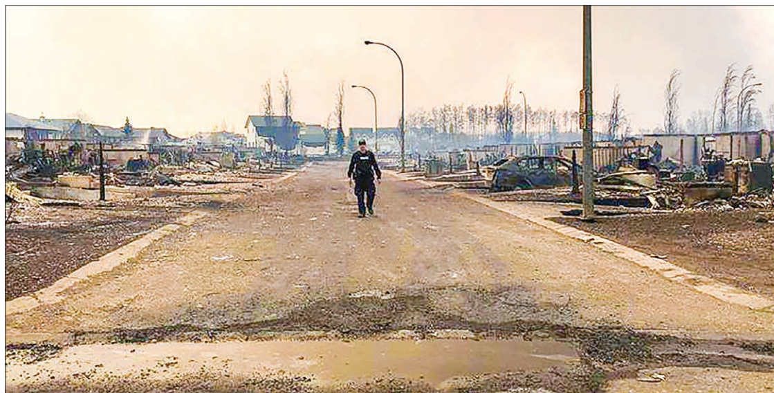
A Mountie surveys the damage on a street in Fort McMurray, Alberta, Canada in this May 4, 2016 image posted on social media.

Companies operating around Fort McMurray including Suncor