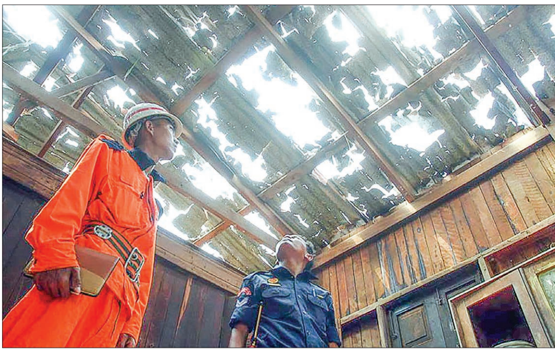
File photo shows roof damaged by hailstones at a village in Kyaukse, Mandalay, in April 2016.

“Due to heavy rainfall, local people should be alerted to flash floods and landslides and gales, lightning and hailstones due to cumulus clouds. Degree of certainty is 60 per cent,” said Dr Tun Lwin. He is also a former director-general of the Meteorology and Hydrology Department of