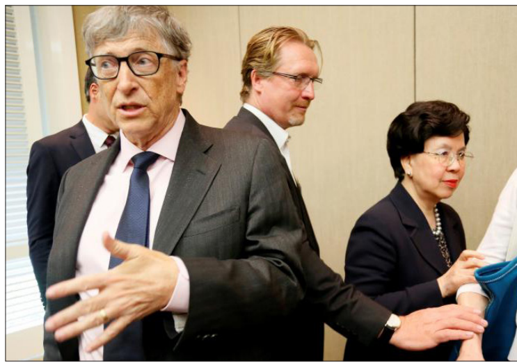
Bill Gates (L), co-founder of the Bill & Melinda Gates Foundation, and World Health Organisation (WHO) Director-General Margaret Chan (R) after a news conference on neglected tropical diseases (NTDs) in Geneva, Switzerland, on 18 April 2017.

The crippling disease, transmitted by contaminated water,