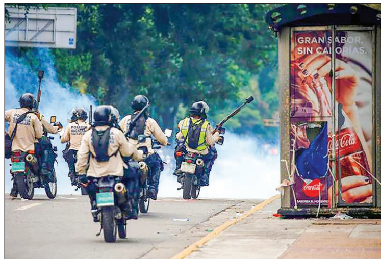
Riot police take positions during the so called 'mother of all marches' against Venezuela's President Nicolas Maduro in Caracas, Venezuela, on 19 April 2017.

CARACAS/SAN CRISTOBAL, (Venezuela) — Two Venezuelan students and a National Guard sergeant died on Wednesday after being shot during protests against unpopular leftist President Nicolas Maduro, increasing turmoil in the volatile nation amid a devastating economic crisis.