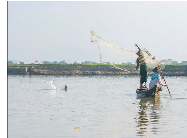
Fishermen catch fish in the Ayeyawady River with the help of a dolphin.