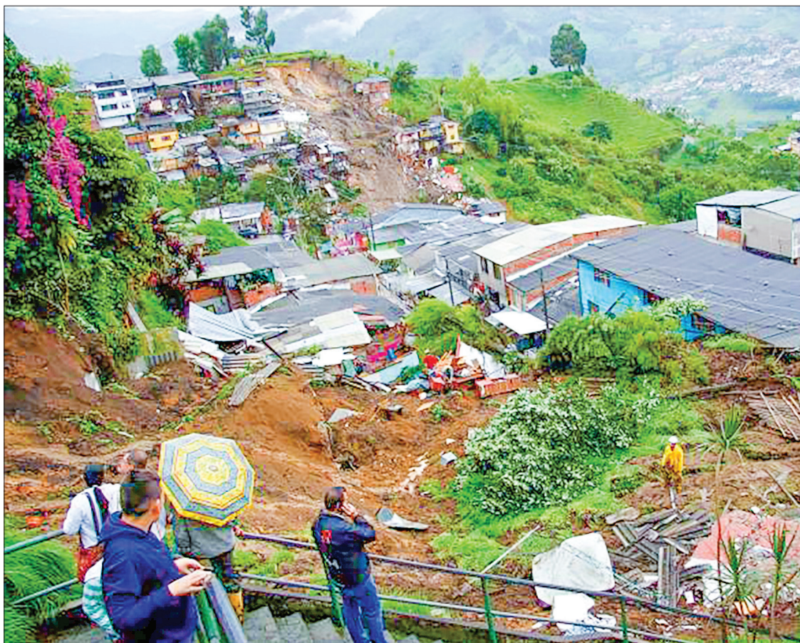
View of a neighbourhood destroyed after mudslides, caused by heavy rains leading several rivers to overflow, pushing sediment and rocks into buildings and roads, in Manizales, Colombia, on 19 April 2017.

Colombia’s deadliest landslide, the 1985 Armero disaster, killed more than 20,000. —Reuters