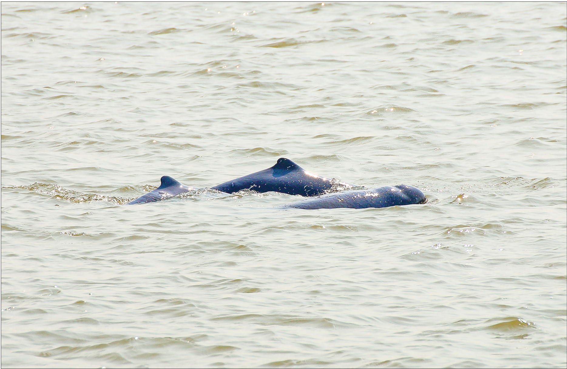
A pair of Ayeyawady dolphins are seen in the conservation area in the Ayeyawady River near Mandalay.

It is natural for the new breed of political leaders to take the place of the dying breed of elder statesmen one day. Young but medium level educated-and-inexperienced politicians in our country are strong-minded. In my opinion, we need such kinds of people in our country, especially in such a time of building up a nation. Being qualified is better than being certified, especially in our country, because our poor education systems produced myriad amounts of graduates and post graduates in the past 50 years or so. We should stop and think if we were really qualified for the degrees we had already got. Education or knowledge can be acquired through books. But, knowledge cannot come into our minds just by sitting in a library all the time. Knowledge acquired from books can help fortify our spirits, beliefs, judgments and intellects, broaden our visions, change our mindsets and become a well-qualified person or leader. As for me, I want our leaders-to-be to read a lot, so as not to be called naive by those who will always blame others. We are watching your abilities, capacities and simplicity. We will designate you as worthy successors, on behalf of our great leader.