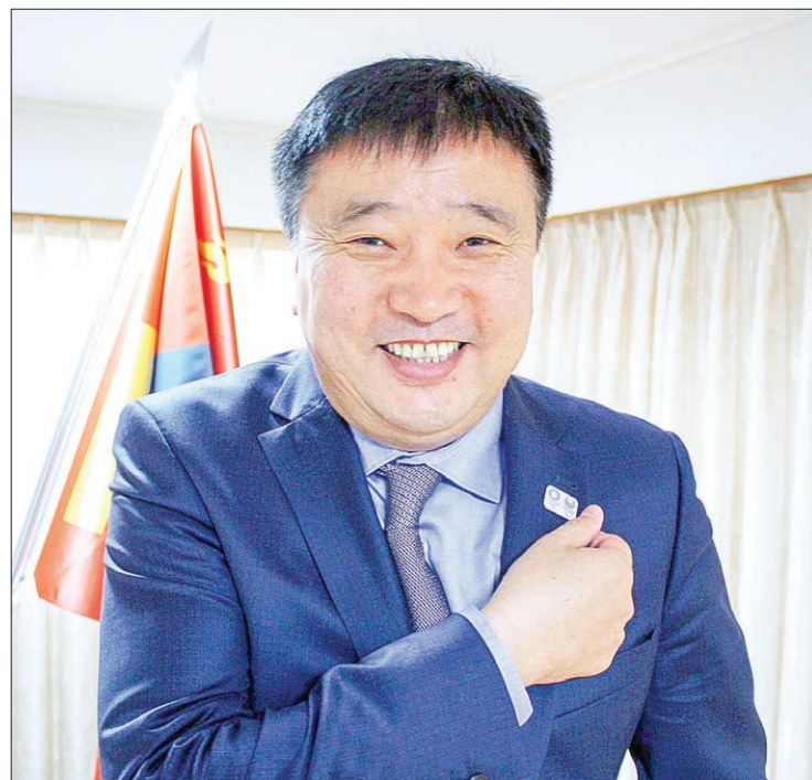
During an interview with Kyodo News in Tokyo on 19 April, 2017, Ulan Bator Mayor Sundui Batbold expresses hope that a sister city agreement can be forged with Tokyo by 2020. He also is looking to an expansion in bilateral ties through tourism, culture and sports.

TOKYO — The mayor of Mongolia's capital said Wednesday that Ulan Bator is seeking to forge a sister city agreement with Tokyo by 2020 and expand bilateral ties through tourism, culture and sports.