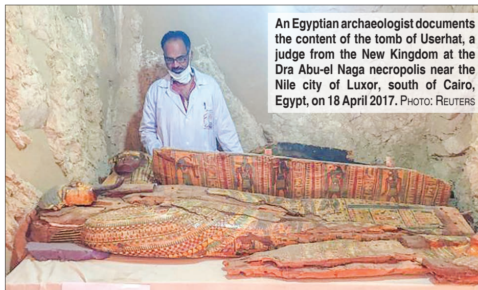
An Egyptian archaeologist documents the content of the tomb of Userhat, a judge from the New Kingdom at the Dra Abu-el Naga necropolis near the Nile city of Luxor, south of Cairo, Egypt, on 18 April 2017.

"These discoveries are positive news from Egypt's tourism industry, which is something we all really need," he said. Tourism in Egypt has suffered in the aftermath of the mass protests that toppled former president Hosni Mubarak in 2011. Militant bomb attacks have also deterred foreign visitors.— Reuters