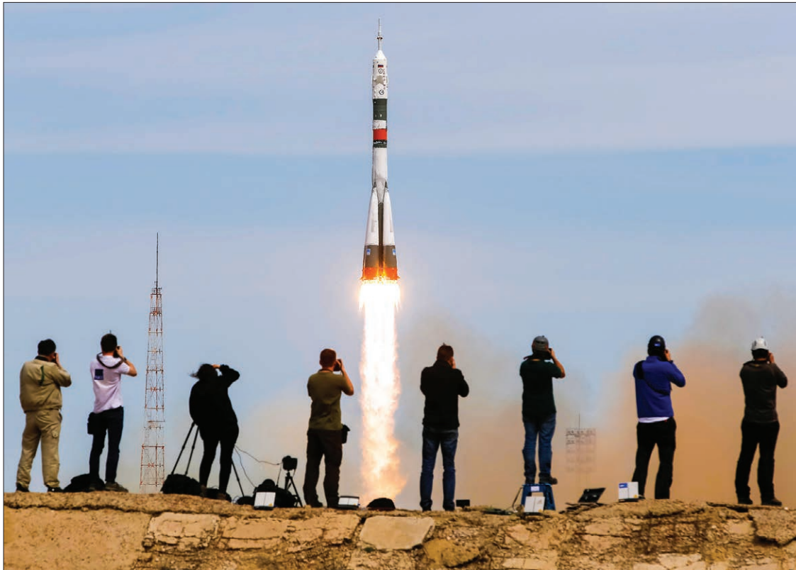
Photographers take pictures as the Soyuz MS-04 spacecraft carrying the crew of Jack Fischer of the US and Fyodor Yurchikhin of Russia blasts off to the International Space Station (ISS) from the launchpad at the Baikonur Cosmodrome, Kazakhstan, on 20 April 2017.