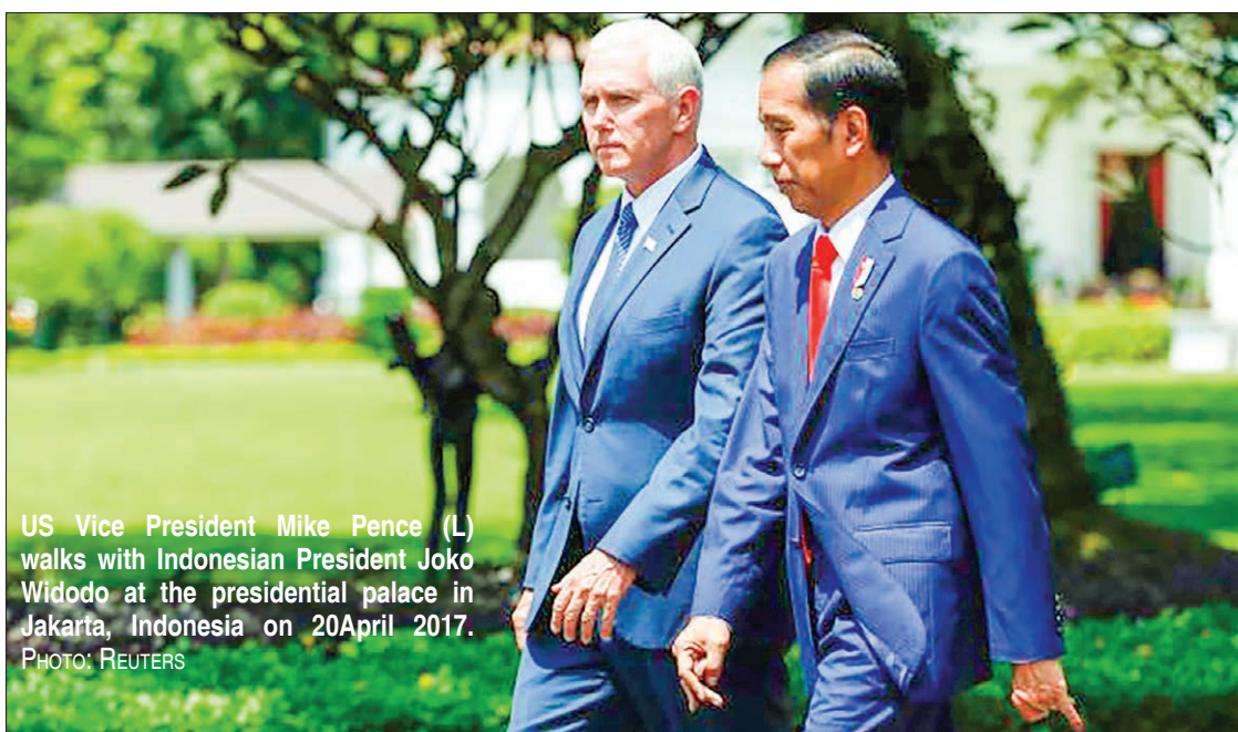
US Vice President Mike Pence (L) walks with Indonesian President Joko Widodo at the presidential palace in Jakarta, Indonesia on 20 April 2017.

"In your nation as in mine, religion unifies, it doesn't divide," he added. Pence, joined by his wife and daughters, later went on a tour of Jakarta's Istiqlal mosque, posing for pictures in the massive empty courtyard and walking through the five-storey prayer hall, big enough