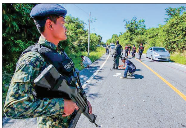
Military personnel inspect a site of an attack at the Saba Yoi district, in the troubled southern province of Songkhla, Thailand, on 20 April 2017.

The violence was the BRN's way of showing it is capable of coordinated