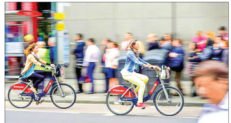
Commuters cycle past a bus queue outside Waterloo Station in London, Britain in 2015. People who commute by bike or on foot have a substantially lower risk of developing cancer or heart disease or dying prematurely, scientists said on Thursday, and governments should do all they can to encourage more active commuting.

"A shift from cars to more active modes of travel will also decrease traffic in congested city centres and help reduce air pollution, with further benefits for health," he said.—Reuters