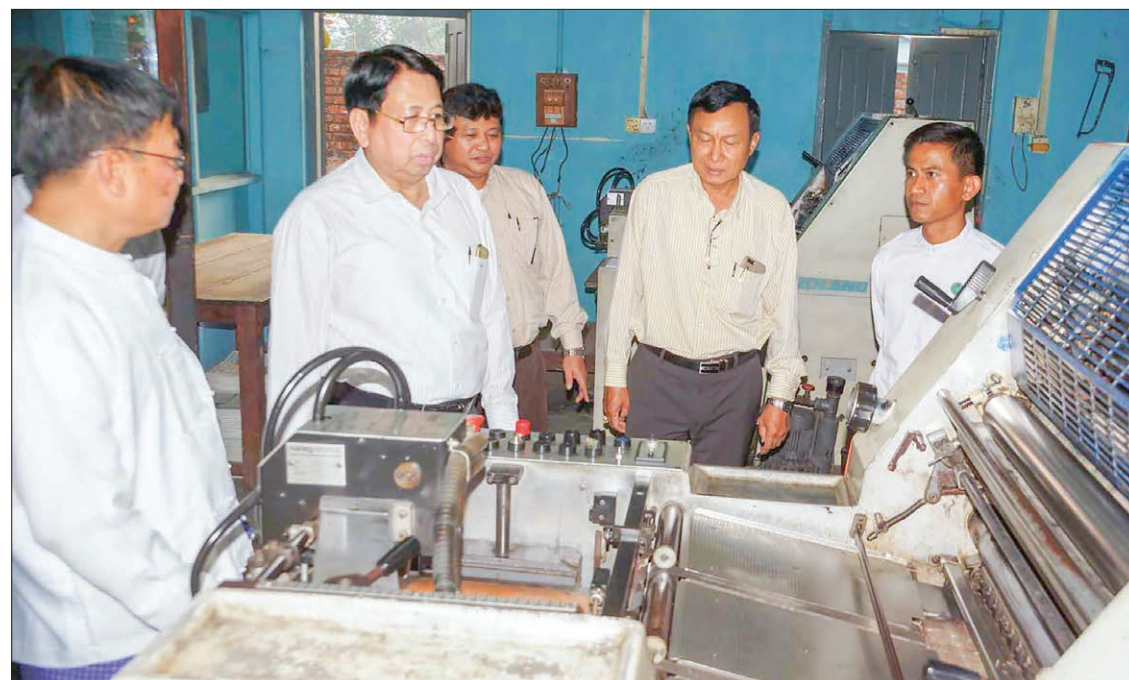
Union Minister Dr Pe Myint inspects sub-printing press of the NPE in Kalay.

The Union Minister asked for his knowledge and gave cash assistance to staff members.— Myanmar News Agency