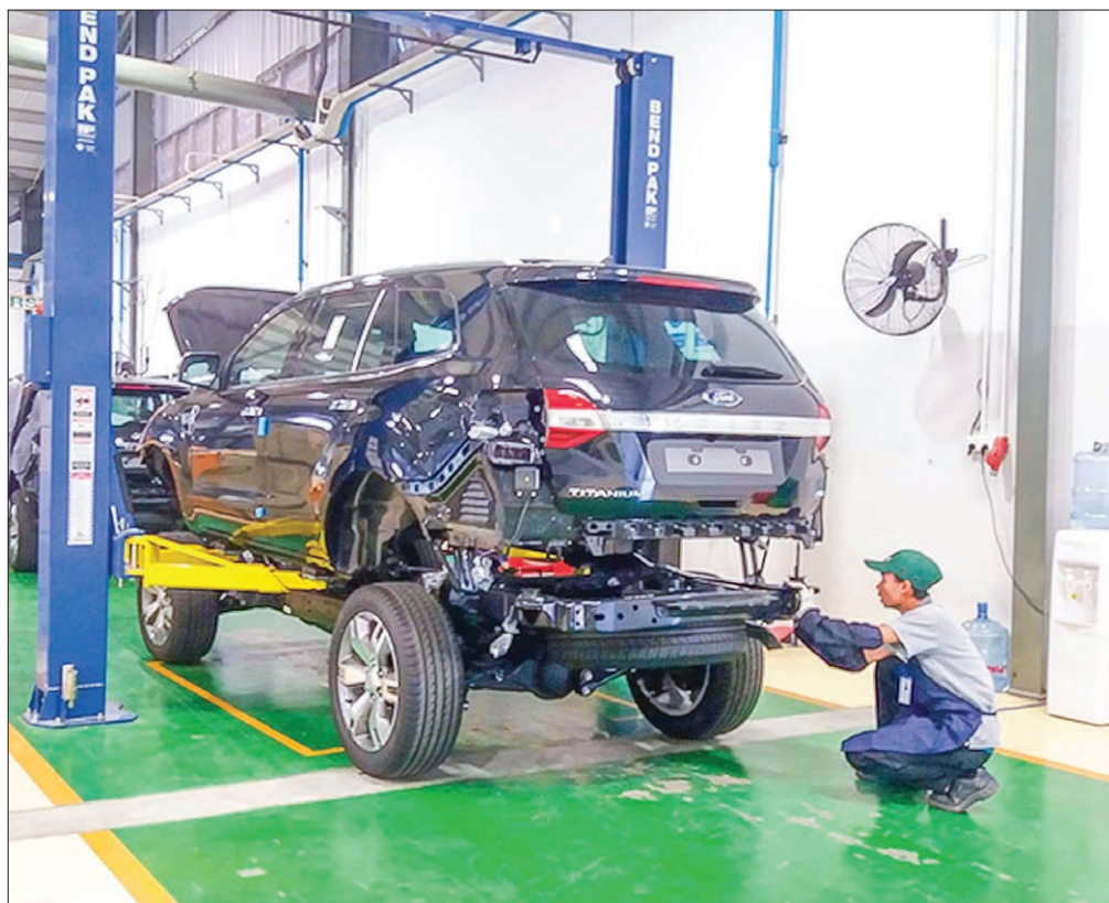
A worker oversees the assembly of a vehicle at a factory under the Ministry of Industry.