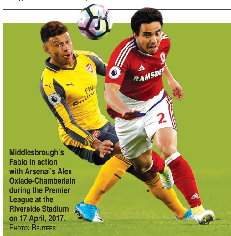
Middlesbrough's Fabio in action with Arsenal's Alex Oxlade-Chamberlain during the Premier League at the Riverside Stadium on 17 April, 2017.