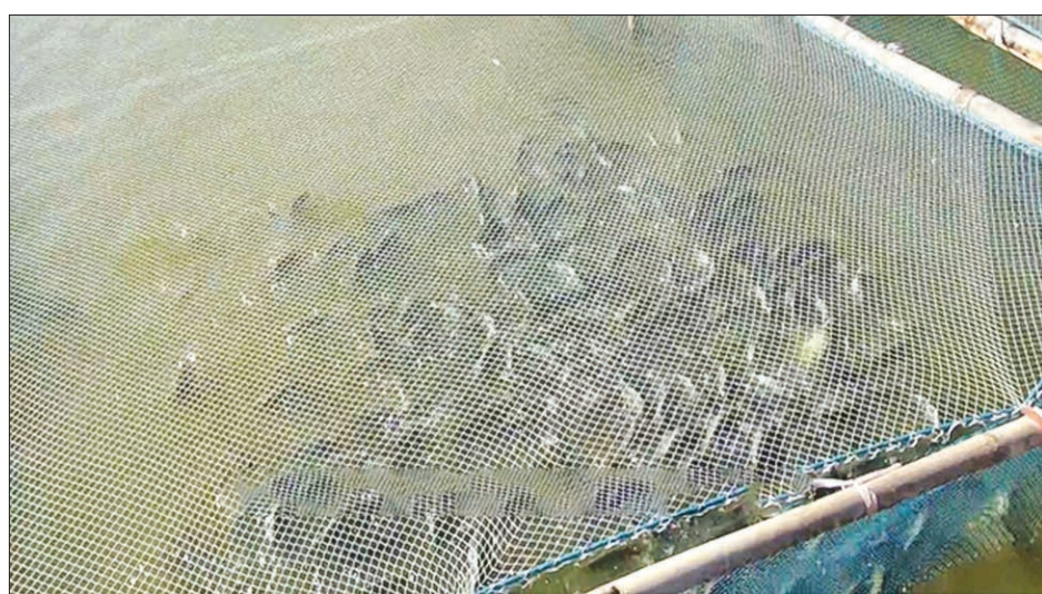
Genetically modified tilapia fish at a fish farm.

to security reasons. And this has contributed much to tourism development. During 11 month-period from April 2016 to February 2017, altogether 42 hotels and guest houses with 1992 rooms were allowed to be established while setting to start constructing the Hanthawady International Airport