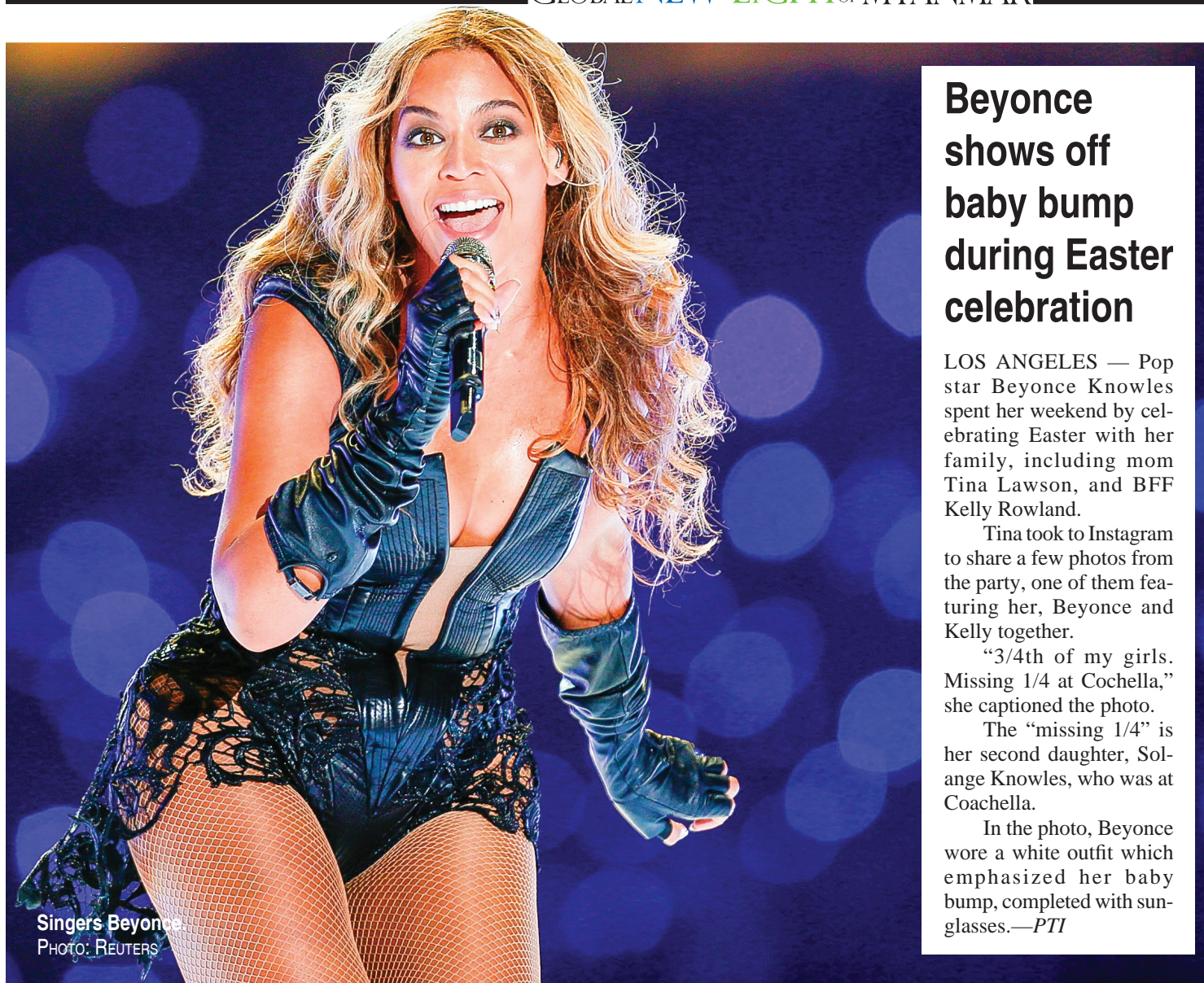
Singers Beyoncé