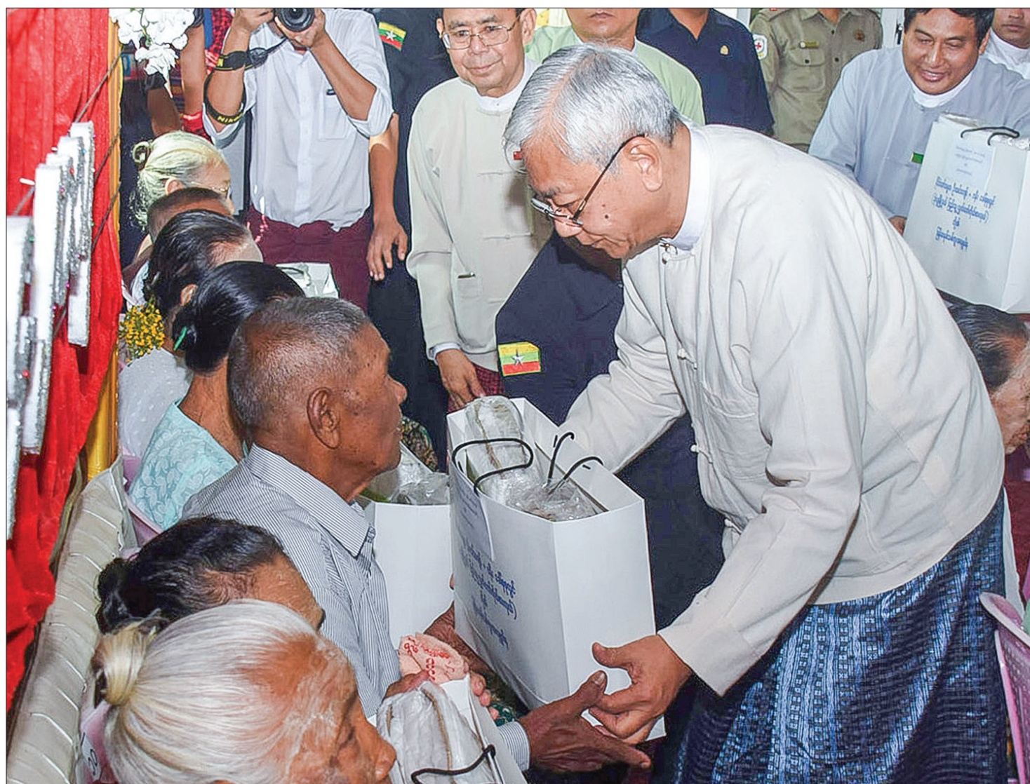
President U Htin Kyaw presents gifts to one of 115 elders representing the 1,514 elders of Thongwa Township who are above 80 years of age.