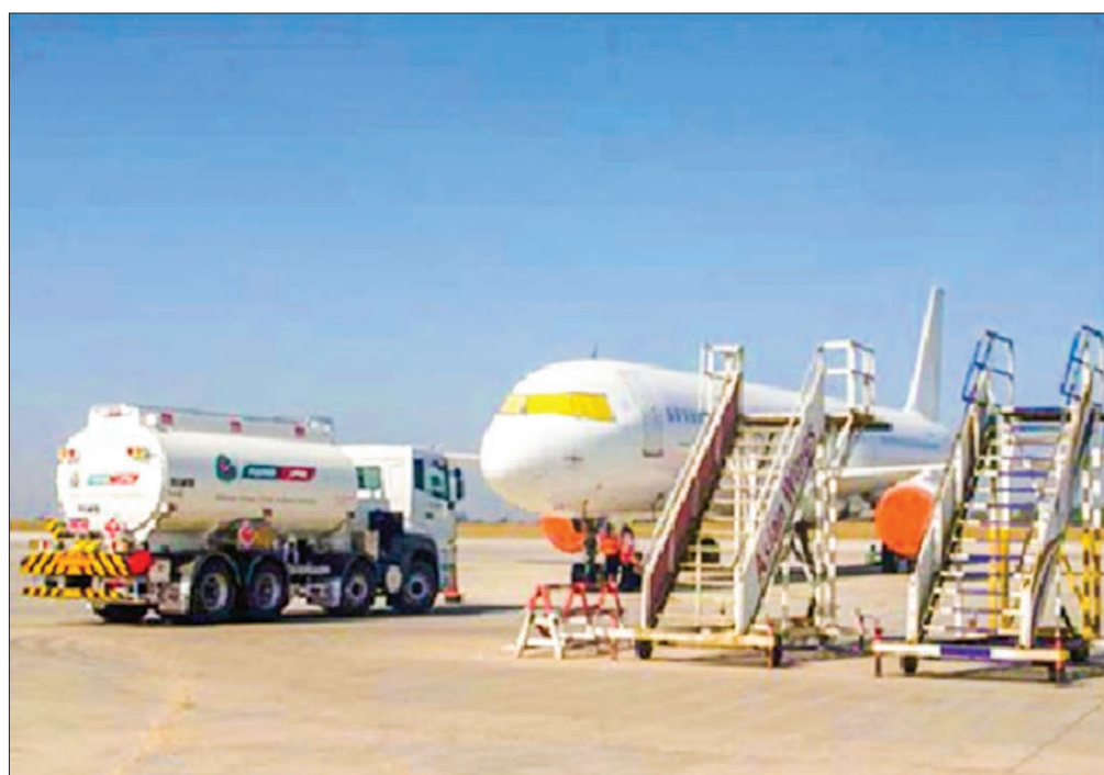
Aircraft fuelling service is now a joint-venture business.