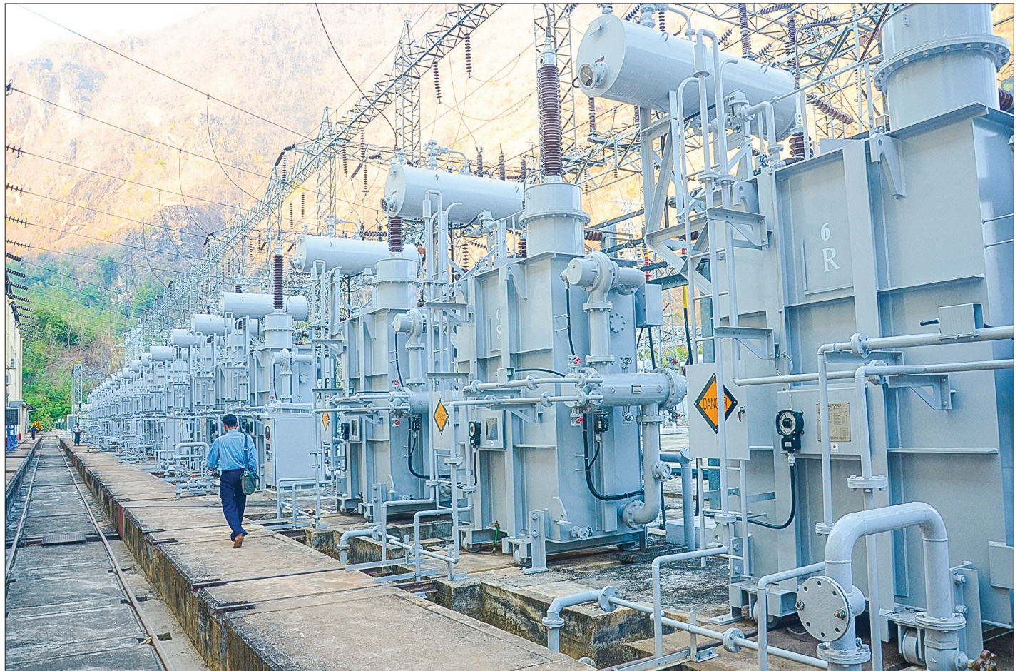
Baluchaung Hydropower Plant in Kayah State.