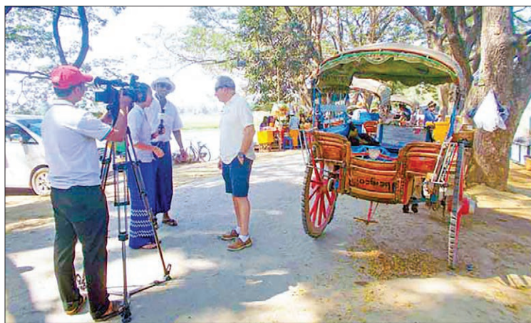
Tourist being interviewed near a pony cart as he enjoys scenic Innwa.

Along with Mandalay, Innwa is perhaps Myanmar's most famous old capital and is situated 20 kilometres south of Mandalay. Innwa Bridge, also known as Sagaing Bridge, and the Ayeyawady river attract numerous visitors. There are over 200 pony carts welcoming visitors. Innwa was officially founded on 26 February 1365 (726 ME), and is home to many ancient pagodas.— The mirror