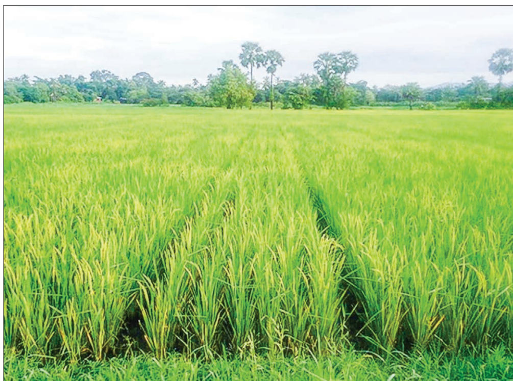
Sea of paddy plantations in Mon State.