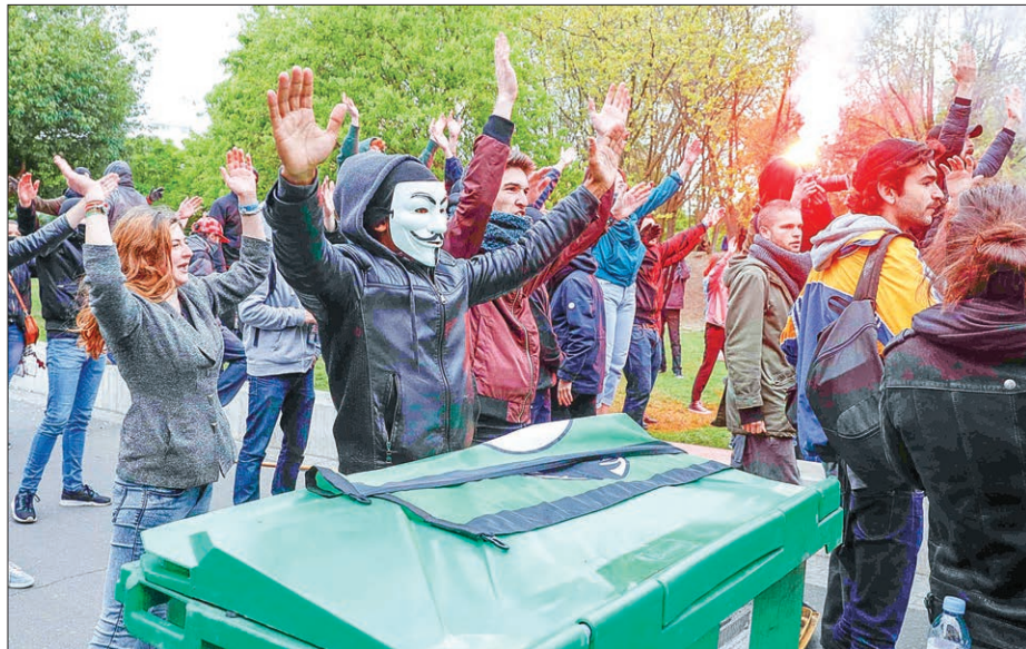
People protest near the venue of a campaign rally for Marine Le Pen, French National Front (FN) political party leader and candidate for French 2017 presidential election in Paris, France on 17 April, 2017.

Authorities have closed Wylie Beach for the next 48 hours. Brouwer's broken surfboard was being examined to try to determine the species of the shark that attacked her, media reported.—Reuters