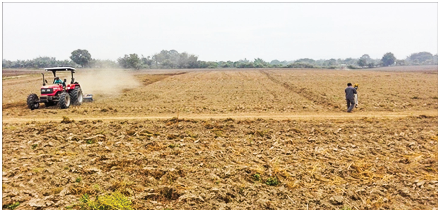
Farmer ploughing the field with the use of tractor in Kachin State.