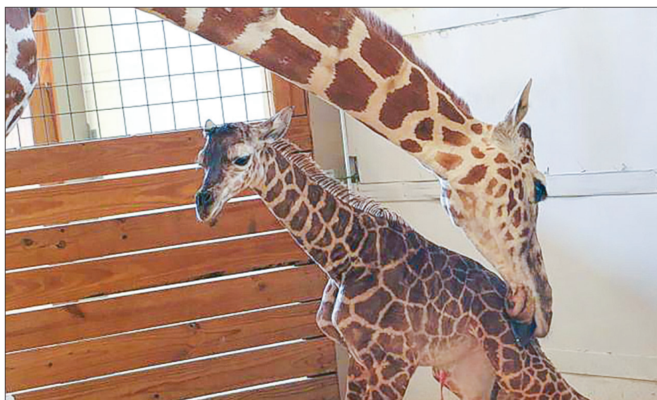
April helps her newly born unnamed baby giraffe stand at the Animal Adventure Park, in Harpursville, New York, US, on 15 April, 2017.

Classed as vulnerable by the International Union for Conservation of Nature Red List of Threatened Species in 2016, giraffes are the world's tallest mammals. The species is usually found in dry savanna zones in sub-Saharan Africa.—Reuters