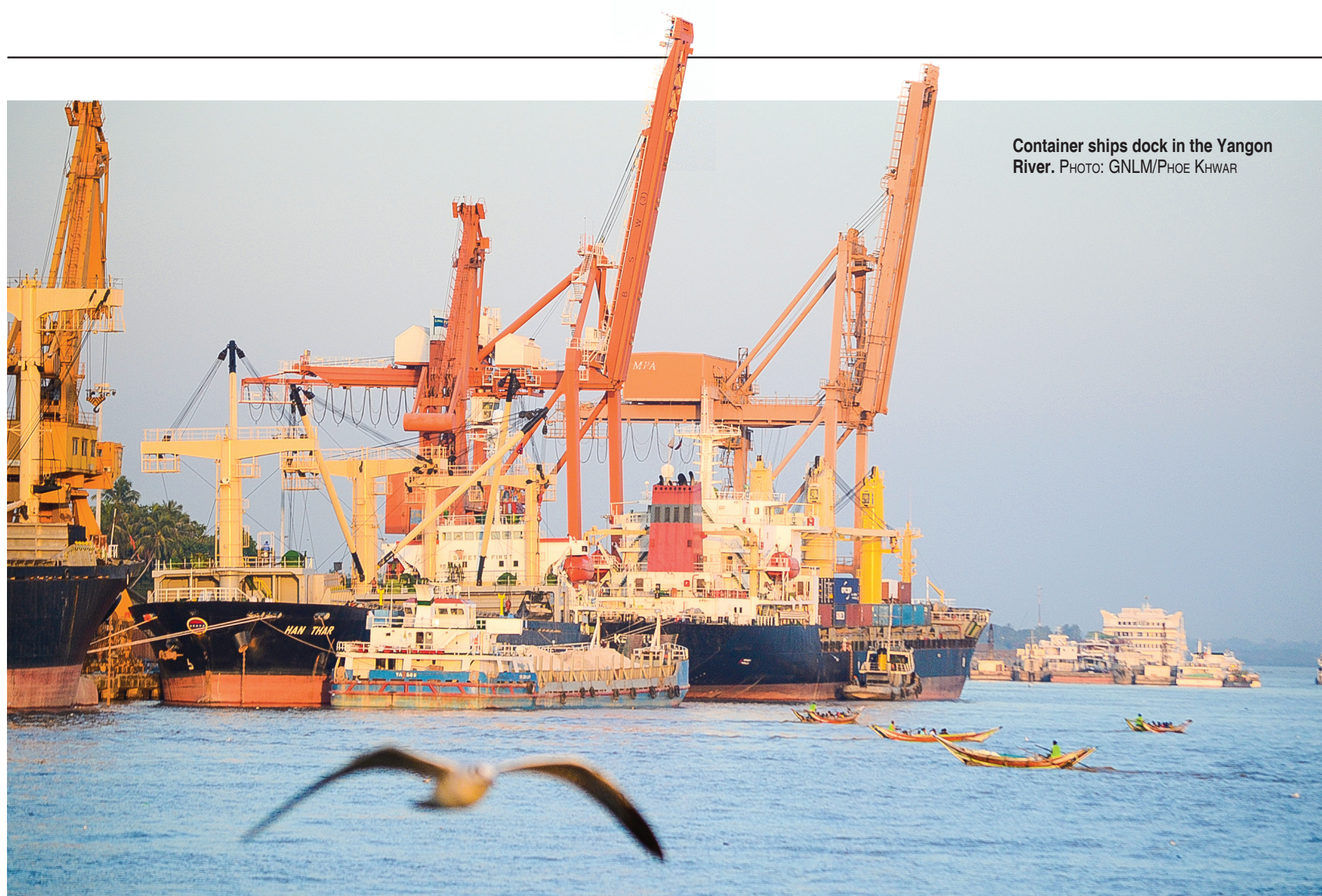
Container ships dock in the Yangon River.