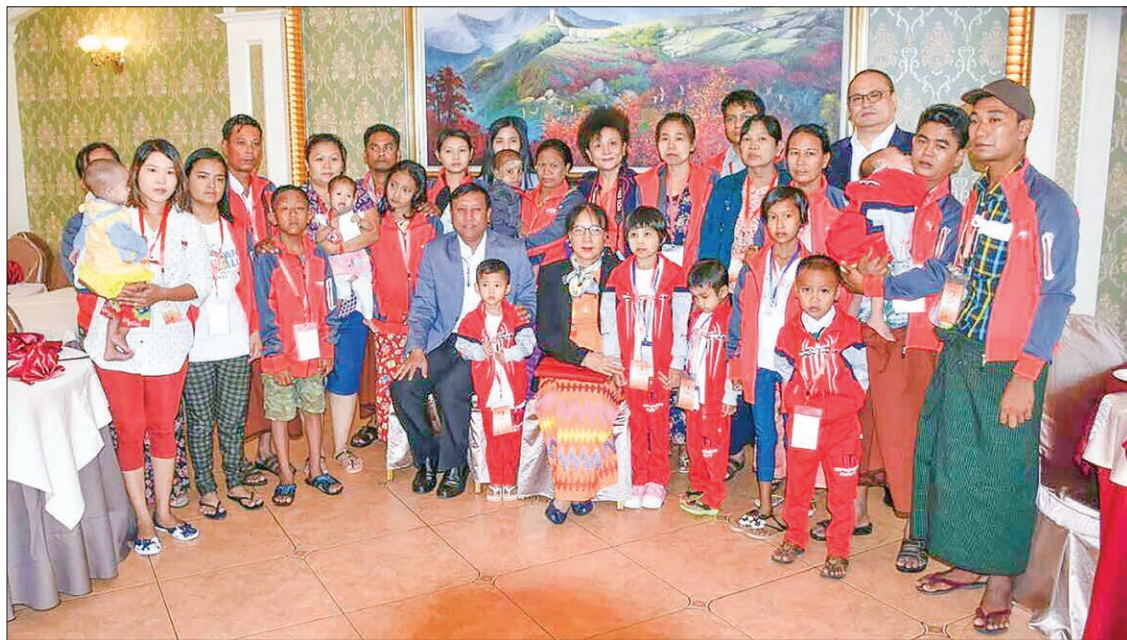
Myanmar Ambassador and wife with parents and children who arrived for free heart surgery in Beijing.