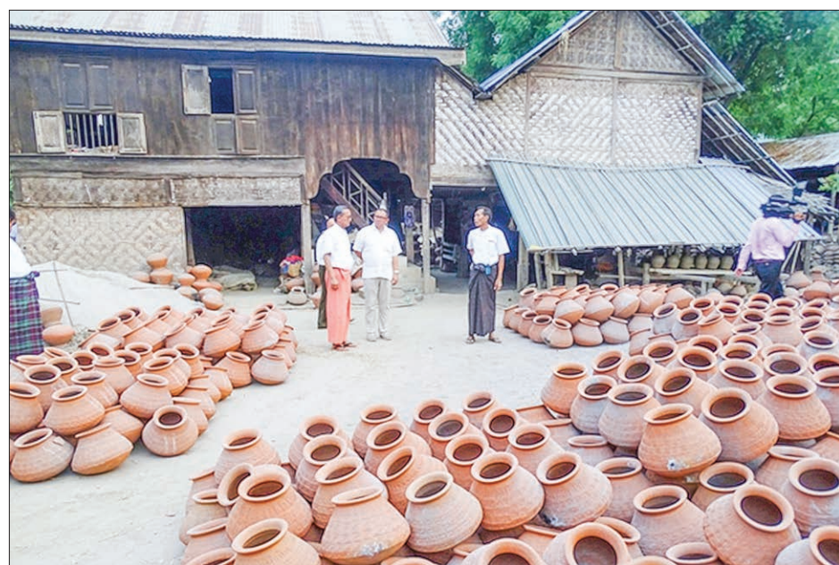
Traditional clay pots on display in a village.