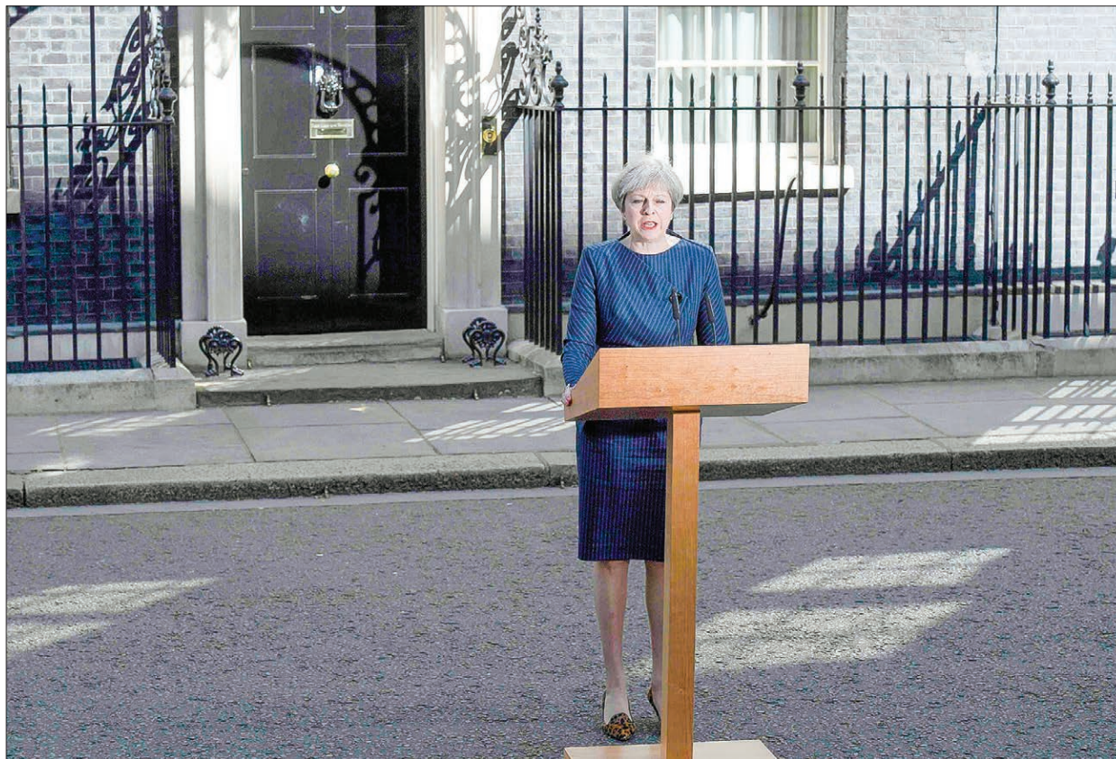
Britain's Prime Minister Theresa May speaks to the media outside 10 Downing Street, in central London, Britain on 18 April, 2017.

LONDON — British Prime Minister Theresa May called on Tuesday for an early election on 8 June, saying it was the only way to guarantee political stability for years ahead as Britain negotiates its way out of the European Union.