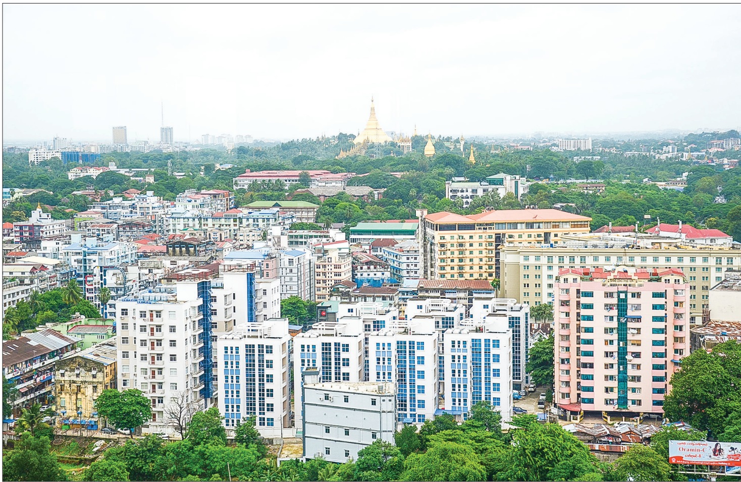
File photo shows ariel view of Yangon's developing real estate, which draws in a considerable rate of investment from its citizens.