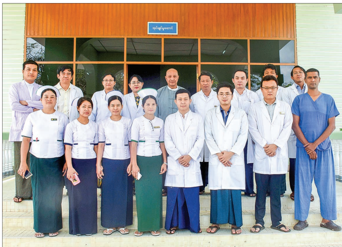
The medical team at Nay Pyi Taw 1,000-bed Hospital that performed the reattachment surgery on 3 March.

"There were three stages in this treatment. First, we ensured that blood flowed through the arteries. Second, we attached the