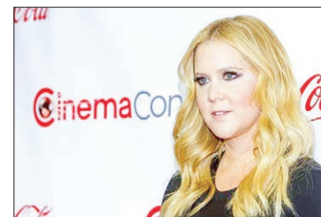
Actress Amy Schumer. PHOTO: REUTERS

In the photo, Beyoncé wore a white outfit which emphasized her baby bump, completed with sunglasses.—PTI