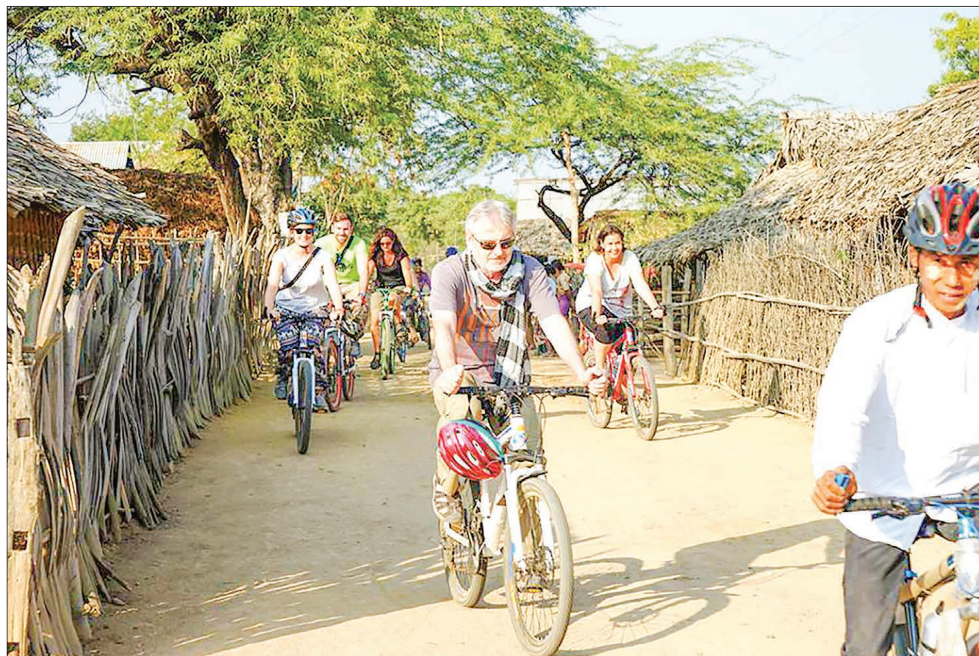
Booming tourism industry helps boost the economy of local villages.