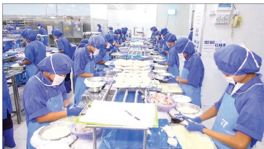
Labourers sorting at fish cold storage factory.