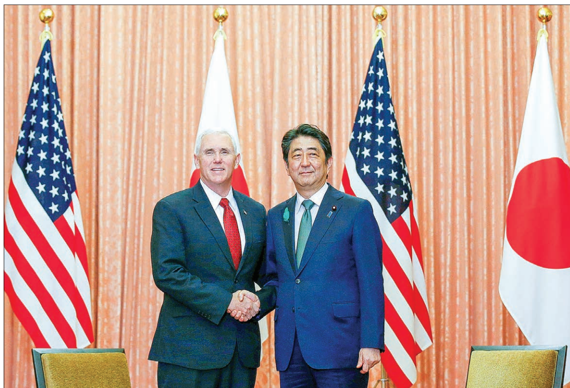
US Vice President Mike Pence (L) meets with Japan's Prime Minister Shinzo Abe at Abe's official residence in Tokyo, Japan on 18 April, 2017.