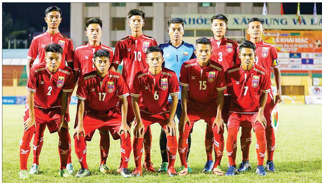
Myanmar U18 Football Team competing in 2017 Vietnam U 19 Challenge Cup.