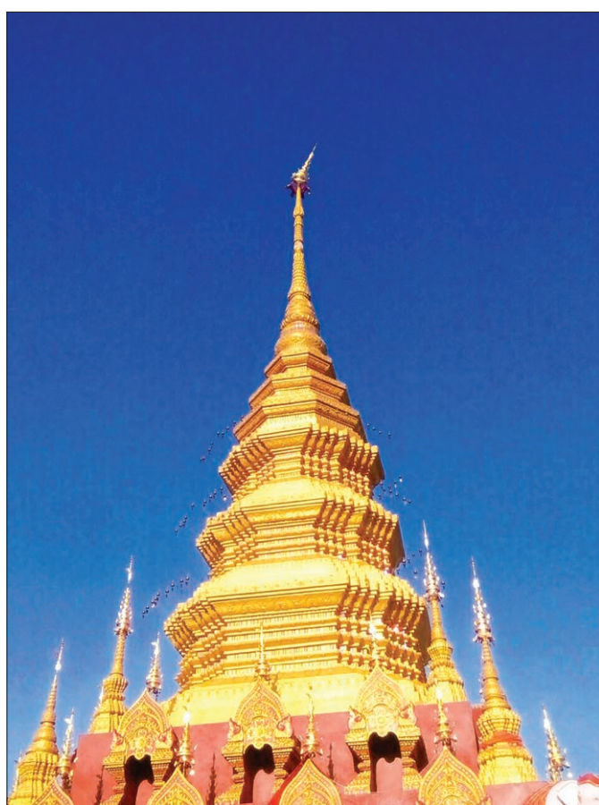
The top tier of the pagoda was loosened as a result of the Tuesday earthquake.