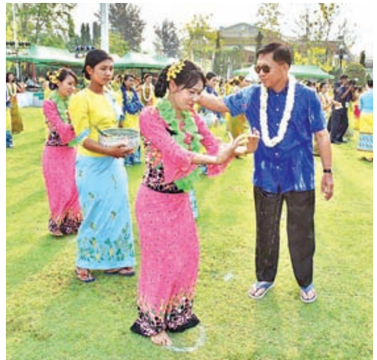
Senior General Min Aung Hlaing pours water on a dancer.