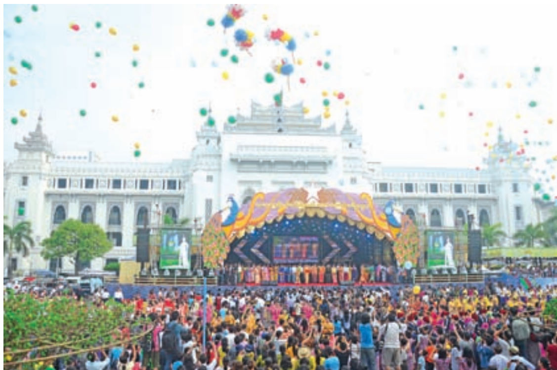
The opening ceremony of Thingyan festival in front of Yangon City Hall.