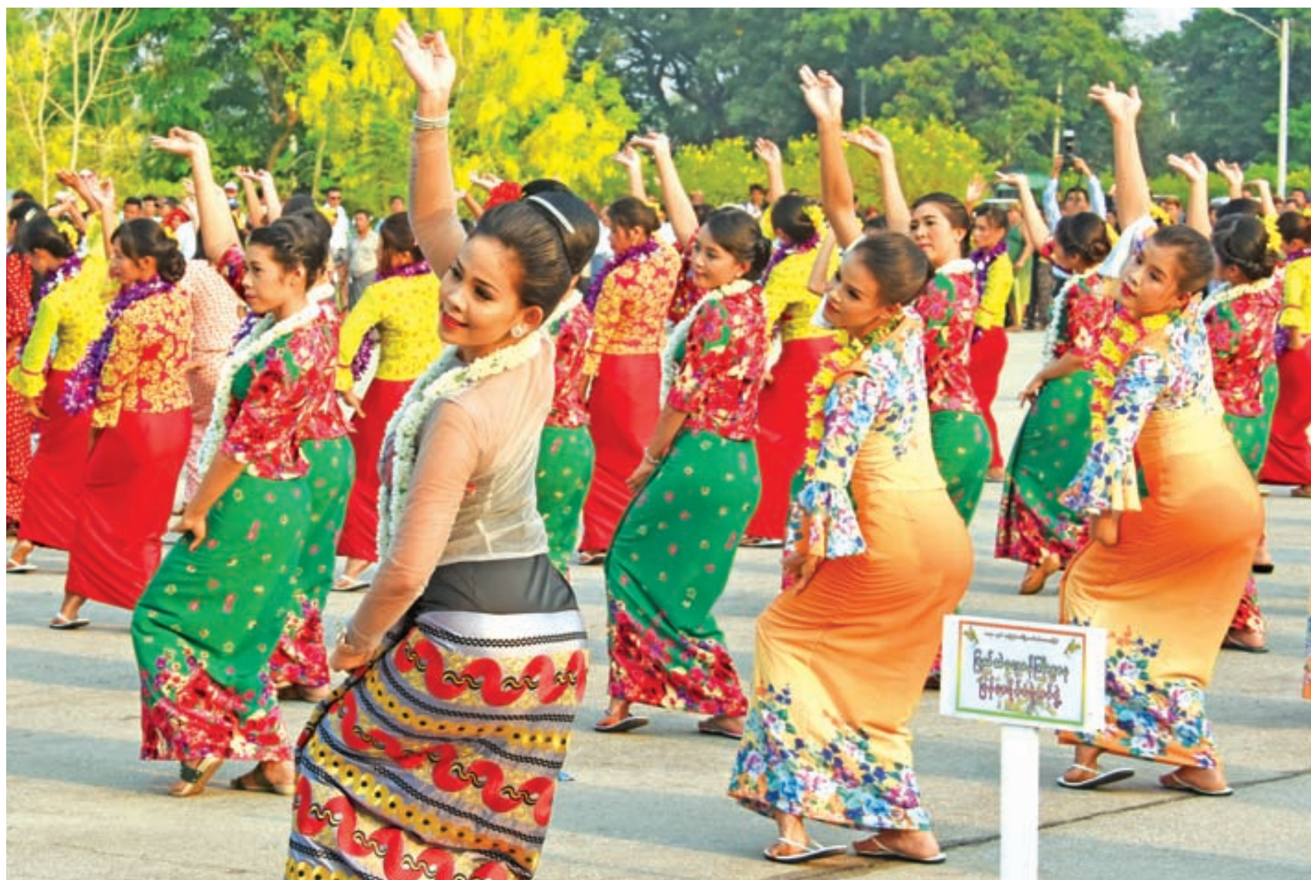
Dance troupes perform on the opening of the Nay Pyi Taw Mayor's pandal to mark opening of the traditional Thingyan New Year festival in the capital yesterday.