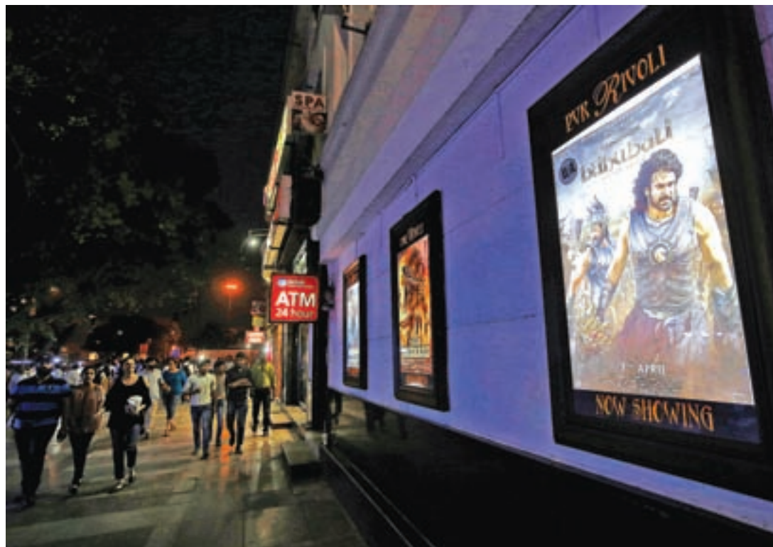
People walk past a poster of an Indian movie 'Baahubali: The Beginning' outside a movie theater in New Delhi, India, on 12 April 2017.

But younger audiences were looking to Hollywood franchises