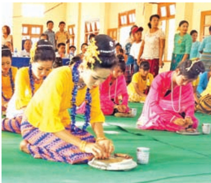
Women grind sandalwood at the Rakhine traditional sandalwood grinding ceremony in Buthidaung.

Traditional water festival of Rakhine ethnic people and the central pandal in Maungtaw will commence on 17th April. Yamanya