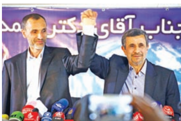
Iran's former President Mahmoud Ahmadinejad (R) and his former vice president Hamid Bagaei attend a press conference in Tehran on 5 April 2017.

In a press conference on 5 April, Ahmadinejad, who served as president for eight years from 2005, reiterated his position not to run in the election, instead throwing his support behind Hamid Bagaei, his former vice president and one of his close aides, who had been arrested and detained on cor-