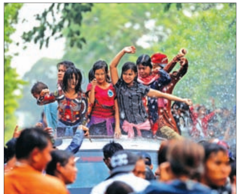
People ride on a vehicle as they get sprayed with water during Myanmar's New Year Water Festival in Mandalay on 13 April.