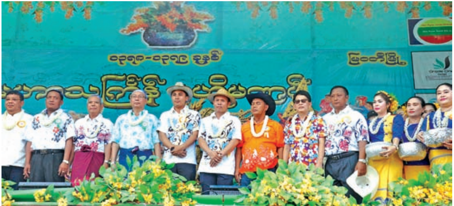
Thingyan festival is formally opened in Myawady in the presence of Speaker Mahn Win Khaing Than and dignitaries .

The Speaker of Amyotha Hluttaw and officials, Governor of Tak Province, Thailand and officials then took a commemorative