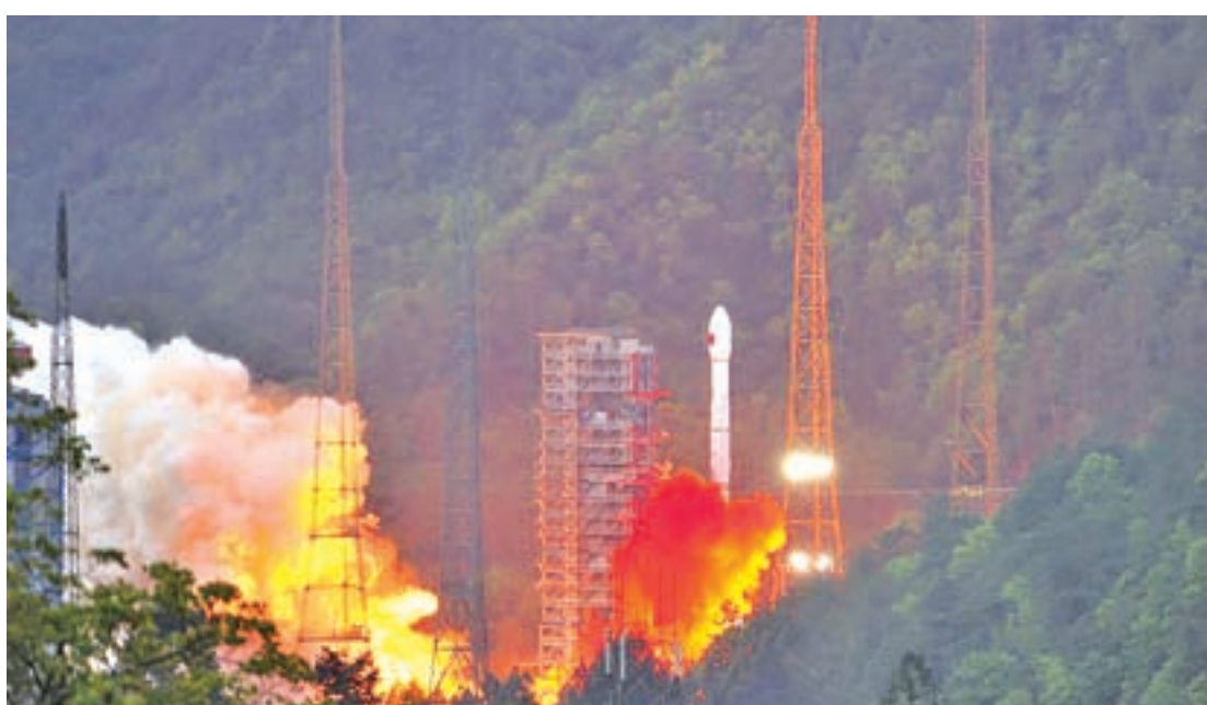
A Long March-3B carrier rocket carrying Shijian-13, China's first high-throughput communications satellite, blasts off from the launching pad at the Xichang Satellite Launch Center in Xichang, southwest China's Sichuan Province, on 12 April 2017. Shijian-13 has a higher message capacity than all of China's previous communications satellites combined and will provide better Internet access in less-developed regions, as well as on planes and high-speed trains.

Shijian-13 is the first Chinese satellite to be powered by electricity, potentially improving efficiency by as much as 10 times compared with those using chemicals as propellant, extending the