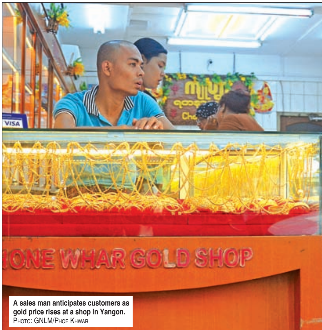
A sales man anticipates customers as gold price rises at a shop in Yangon.

FMI traded 711 shares while 1,558 shares of MTSH were traded on Wednesday. On that day, only 40 shares of FPB were traded, while MCB hit zero trading. The share prices were Ks16,500 for FMI, Ks4,300 for MTSH, Ks8,700 for MCB and Ks30,000 for FPB. — Ko Htet