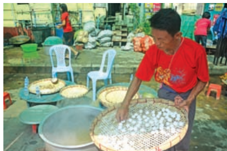
A man prepares mote lone yay paw, a Thingyan charity snack.