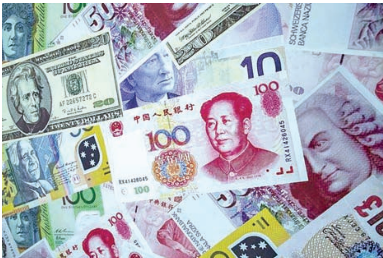
An advertisement poster promoting China's renminbi (RMB) or yuan, US dollar and Euro exchange services is seen outside at foreign exchange store in Hong Kong, China in 2015.

The World Bank added that the region’s resilience could be tested if global financial conditions tighten faster than expected at a time when the United States is normalising its monetary policy. —Reuters