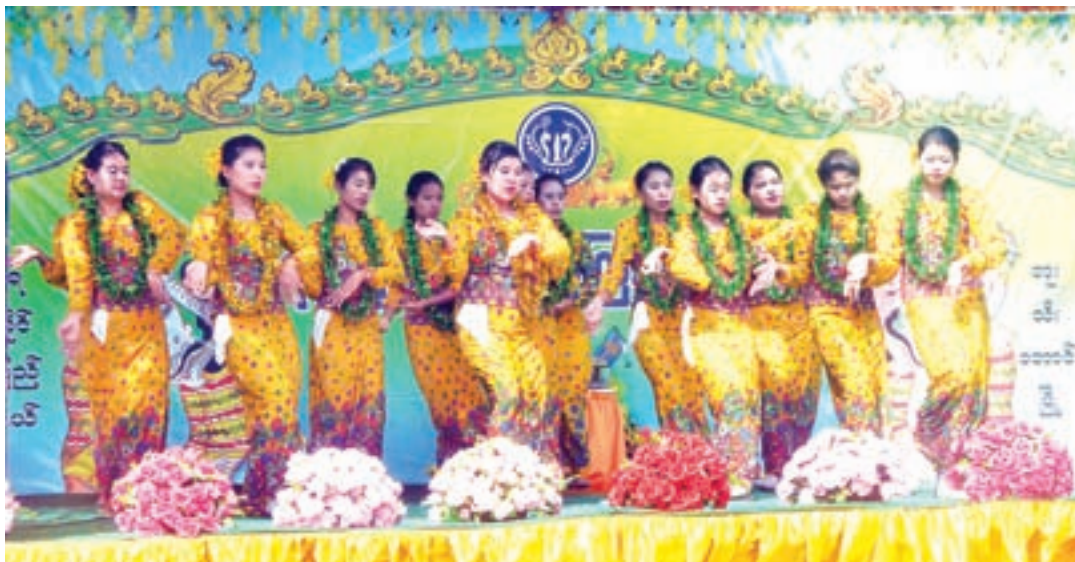
Rakhine dance troupe perform at opening of Thingyan festival in Buthidaung.

Thingyan this year runs from Thursday to Sunday, and culminates with New Year's Day on Monday.— Myanmar News Agency