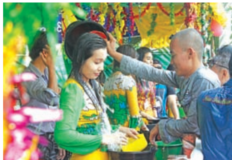
A reveller pours water on an Rakhine ethnic woman to celebrate Thingyan festival in Thuwanna Stadium.