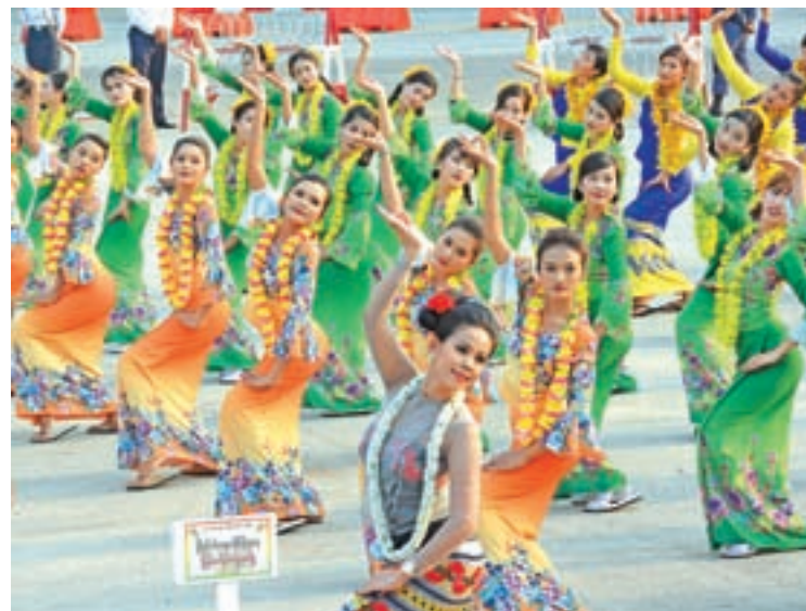
Dancer troupe of the Ministry of Home Affairs performing at the opening ceremony in Nay Pyi Taw.

The opening ceremonies were held along with dance troupes and music as people enjoyed the splashes of water thrown from the pandals. —Myanmar News Agency