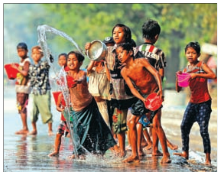
Children play with water during Myanmar's New Year Water Festival outside Mandalay, Myanmar, on 13 April 2017.