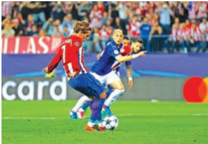
Atletico Madrid's Antoine Griezmann scores their first goal from the penalty spot during UEFA Champions League Quarter Final First Leg at Vicente Calderon Stadium, Madrid, Spain, on 12 April.

At this rate, you would not bet against Ronaldo reaching his century in the competition before the end of this campaign.—Reuters