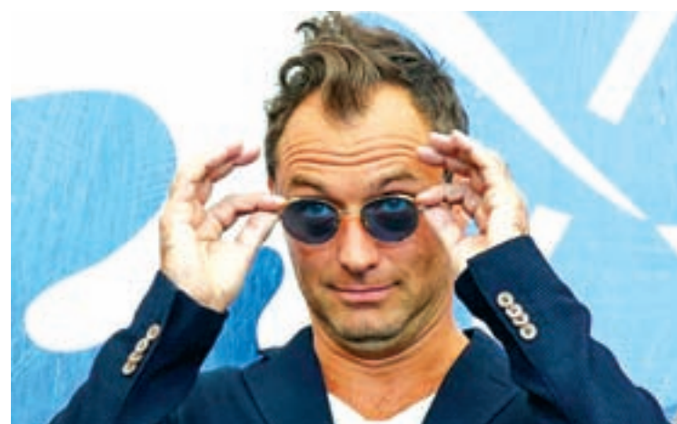
Actor Jude Law attends the photocall for the movie 'The Young Pope' at the 73rd Venice Film Festival in Venice, Italy in 2016.

Several British actors were considered for the role of young Dumbledore, including Christian Bale, Benedict Cumberbatch and Jared Harris, according to Hollywood publication Variety.—Reuters