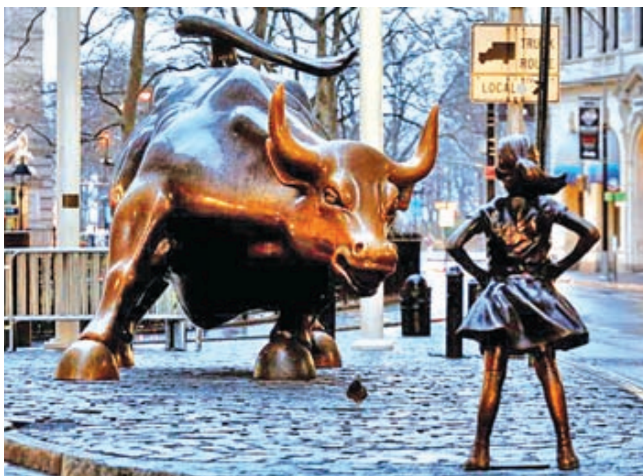
A statue of a girl facing the Wall St. Bull is seen, as part of a campaign by US fund manager State Street to push companies to put women on their boards, in the financial district in New York, US, on 7 March 2017.

Di Modica told a news conference he envisioned his statue as a positive symbol, but that the addition of the courageous girl turned his bull into a villain.