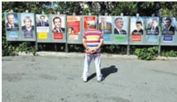
A man looks at campaign posters of the 11th candidates who run in the 2017 French presidential election in Saint Andre de La Roche, near Nice, France, on 10 April 2017.

However, the mainstream conservative is tainted by scandal — he is under formal investigation on suspicion of financial impropriety, although he denies doing anything ille-