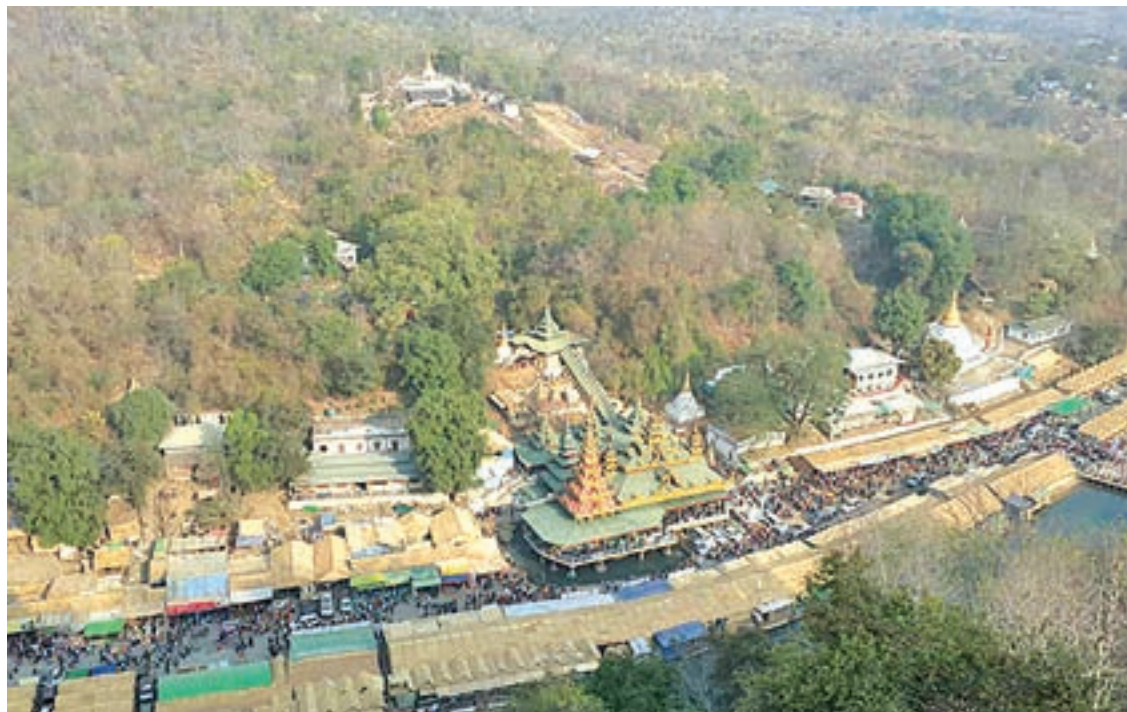
Photo shows Mann Shwe Settaw in Minbu during the pagoda's festival.