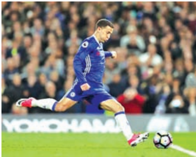
Chelsea's Eden Hazard has his penalty saved before scoring their second goal from the rebound during Premier League at Stamford Bridge, on 5 April 2017.