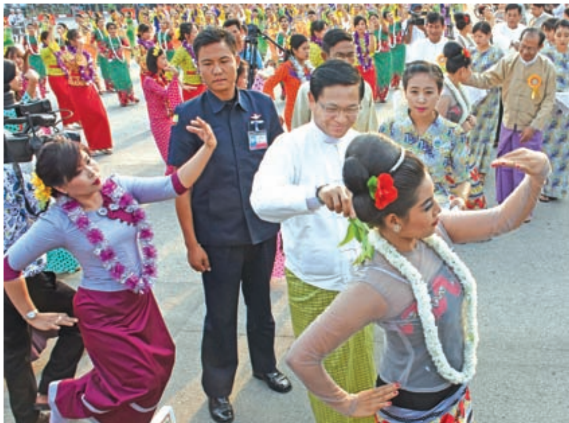
Vice President U Henry Van Thio sprinkles scented water on a dancer at the opening ceremony of Thingyan Water Festival in Nay Pyi Taw.