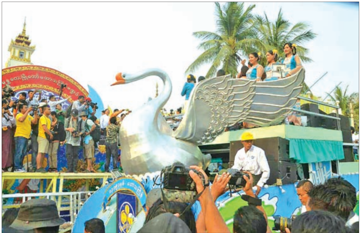
The decorated float Silver Swan, which is popular for Thingyan festival in Mandalay, is seen on the first day of the festival.

Travel promotion in the central pavilion and a walk through the Thingyan pavilion in the south of Mandalay Moat were also part of the celebration.— Tin Maung, Min Htet Aung