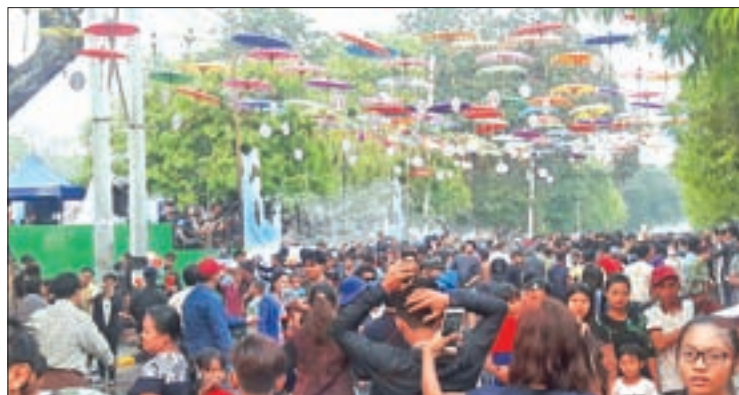
The busy street in Mandalay is decorated with umbrellas.