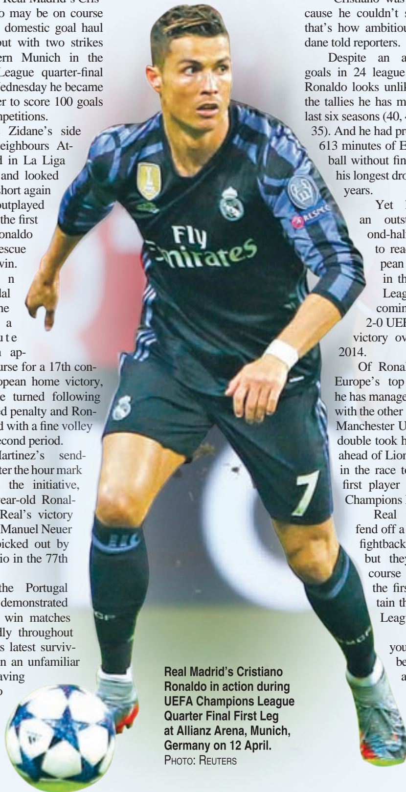
Real Madrid's Cristiano Ronaldo in action during UEFA Champions League Quarter Final First Leg at Allianz Arena, Munich, Germany on 12 April.

While the Portugal forward has demonstrated an ability to win matches single-handedly throughout his career, his latest survival act came in an unfamiliar context having struggled to hit the lofty heights he sets himself in La Liga this season.