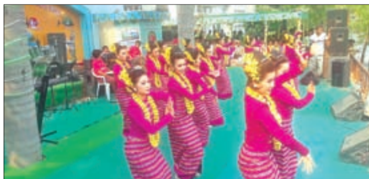
Troupes perform on the first day of festival in Mandalay.