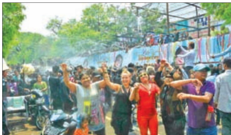
Revellers enjoy the Thingyan festival in Mandalay.