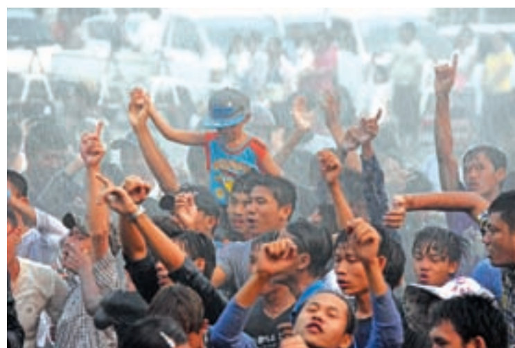
People enjoying the Thingyan celebrations during the later part of the day in Nay Pyi Taw.