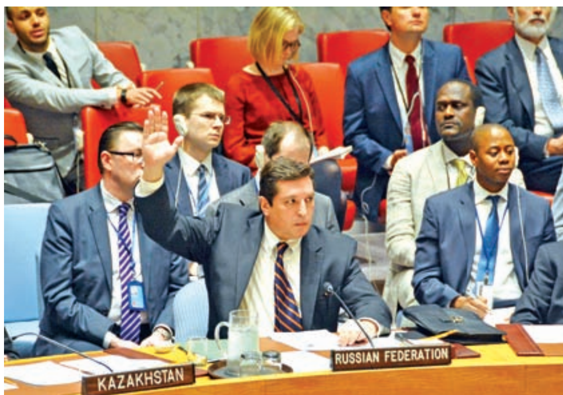
Russian Deputy UN Ambassador Vladimir Safronkov vetoes a Western-led UN Security Council resolution that condemns the alleged use of chemical weapons by Syrian President Bashar al-Assad's regime at the UN headquarters in New York on 12 April 2017. Russia criticized the resolution for labeling the Syrian government as the culprit in the chemical weapons attack.

In addition, Safronkov lambasted the missile strike by the administration of US President Donald Trump, saying it violates international norms. Nikki Haley, US ambassador to the United Nations, berated Russia for siding with the Syrian regime, even as many other nations were united