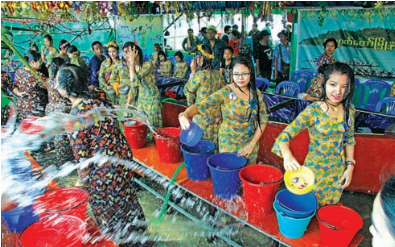
Rakhine ethnic women throw water on revellers as they celebrate the water festival traditionally.

Tha tradition of sacred bathing Buddha images was known to have started since the era of 3rd Danyawaddy. During 3rd Danyawaddy era at BC580 Sandar Thuria took the throne and at BC 554, 12 years after his coronation he came to know that Gottama had attained enlightenment and became Buddha in Myitizima land in the west (now Nepal). He strongly desired to see Buddha and according to the advice of his counsellors he vowed and implored Buddha in his spiritually resolute mind to do him a favour of visiting Danyawaddy. The Buddha complying with the king's request came to Danyawaddy together with 500 Sangha