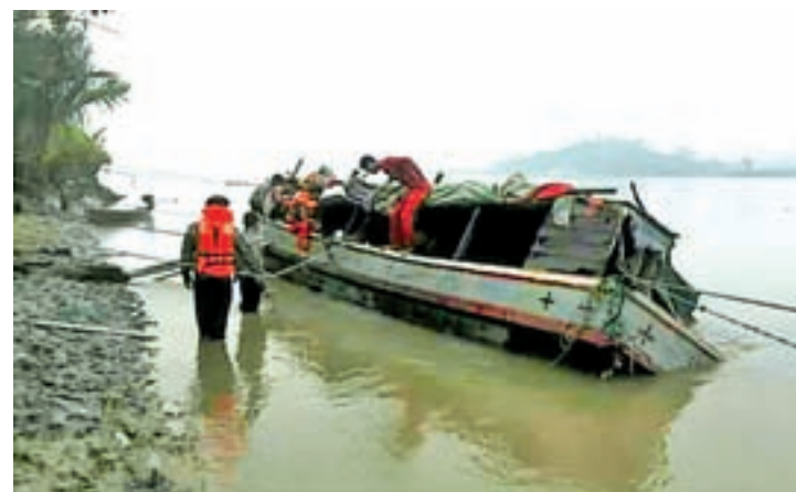
Officials inspecting the capsized wooden motor boat in Minkyaung River.

A search for the missing person is being carried out. — Myanmar News Agency