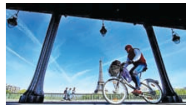
A man rides a Velib self-service public bicycle operated by French outdoor advertising firm JCDecaux under an elevated metro line near the Eiffel Tower in Paris, France, on 12 April, 2017 as Paris has awarded the operation of its pioneering Velib bicycle hire scheme to French-Spanish consortium Smoovengo, officials said.

French outdoor advertising firm JCDecaux, which has operated the scheme for the past decade, has said it will appeal the tender award.—Reuters