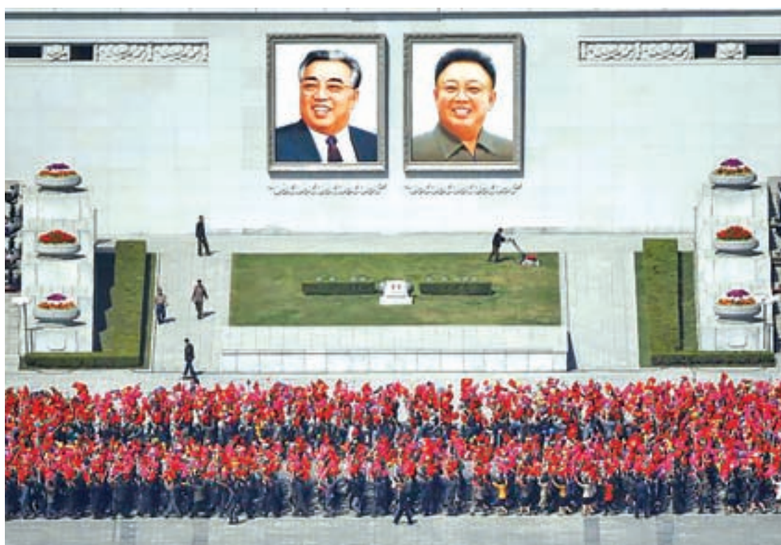
People practice for the expected parade on the main Kim Il-Sung Square in central Pyongyang, North Korea on 12 April 2017.

While US President Donald Trump has put North Korea on notice that he would not tolerate any provocation, US officials have said his administration was focusing its strategy on tougher