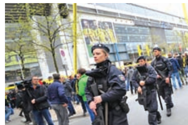
Police officers outside the stadium before the match, Borussia Dortmund v AS Monaco, UEFA Champions League Quarter Final First Leg, at Signal Iduna Park, Dortmund, Germany, on 12 April 2017.

SHIPPING AGENCY DEPARTMENT MYANMA PORT AUTHORITY AGENT FOR: M/S CONTINENTAL SHIPPING LINE PTE LTD Phone No: 2301185