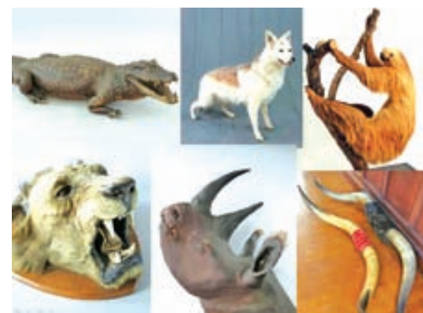
A series of stuffed animals stolen by Jason Hopwood during a burglary in Wimbledon are seen after they were recovered, in an undated Metropolitan Police photograph handed out in London, Britain, on 5 April 2017.

"Survivors of the atomic bombings (in Nagasaki and Hiroshima) will disappear someday," Sakue Shimohira, an 82-year-old A-bomb survivor in Nagasaki, said at the opening of the exhibition. "I hope (the ambassadors) will continue to deliver messages on the cruelty of atomic bombs and wars in place of us."—Kyodo News