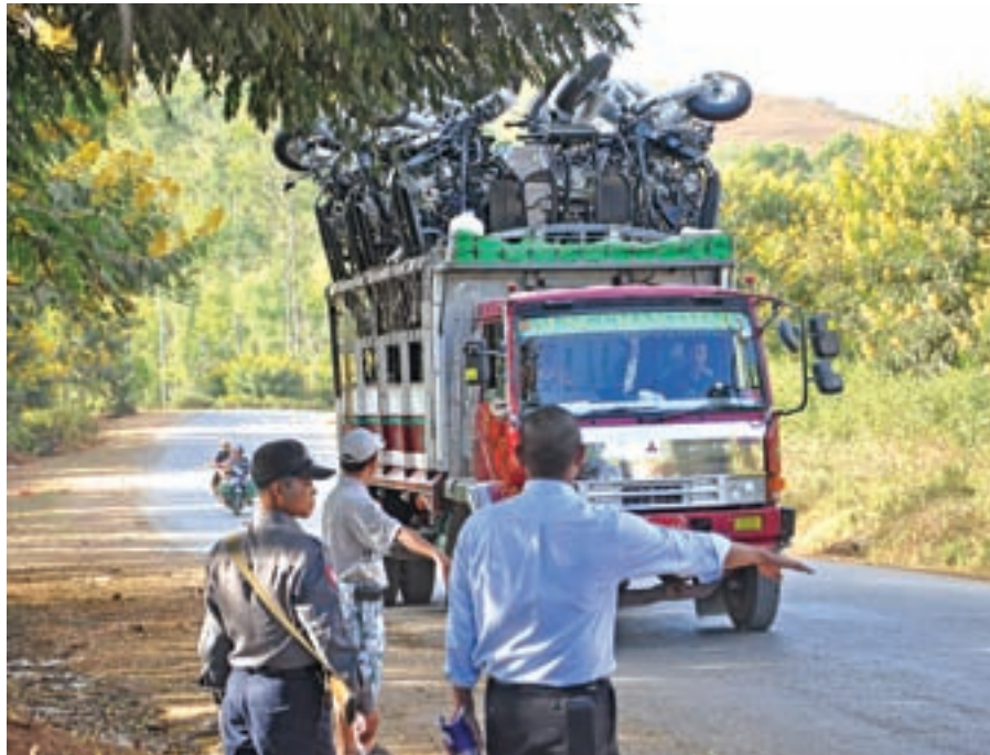
A truck carrying motorbikes is seen near the 105-mile Muse Trade Zone, Northern Shan State.

The border trade values with ITC as of 24th March in this FY were over Ks861million in Tamu, over Ks867million in Muse, over Ks11.15 billion in Myawady, Ks767million in Tachilek, over Ks30million in Lweje, over Ks2.18 billion in Kan Pike Tee, over Ks383million in Kawthaung, over Ks708million in Reed, over Ks961million in Maw Taung and