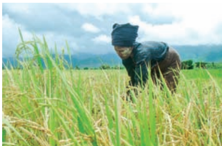
A female farmer harvests rice grown in irrigated field near Nay Pyi Taw.

The authorities have no plans to raise the amount of farming loans per acre for rice farmers, but crop growers will be helped this financial year, according to an official from the Myanmar Rice Federation, which welcomes the new plan to enhance agricultural production.