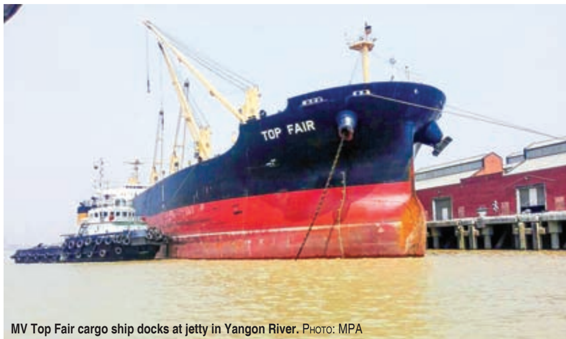
MV Top Fair cargo ship docks at jetty in Yangon River.