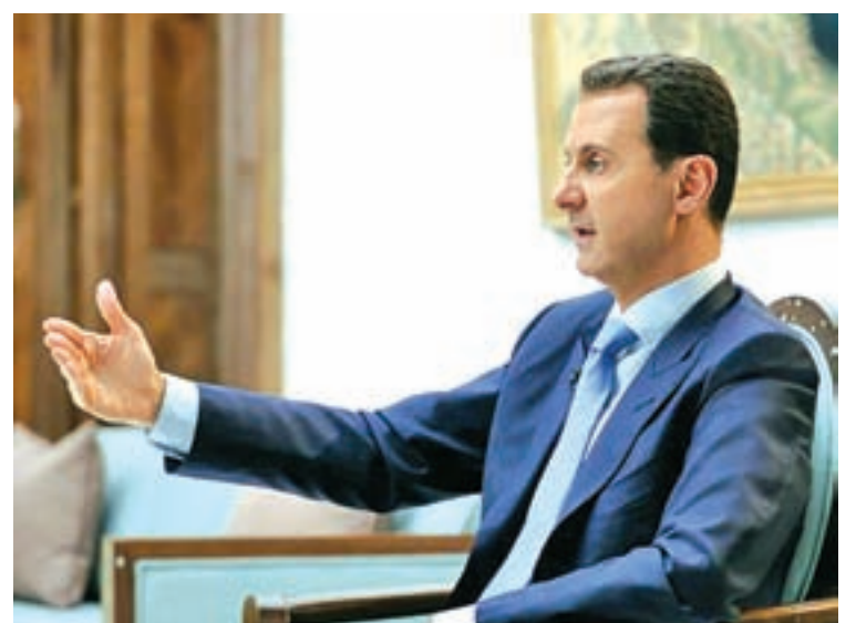
Syria's President Bashar al-Assad speaks during an interview with Croatian newspaper Vecernji List in Damascus, Syria, in this handout picture provided by SANA on 6 April 2017.

Rebels have in recent weeks launched two of their boldest offensives in many months, attacking in Damascus and north of the government-held city of Hama. The army says both assaults have been repelled.—Reuters