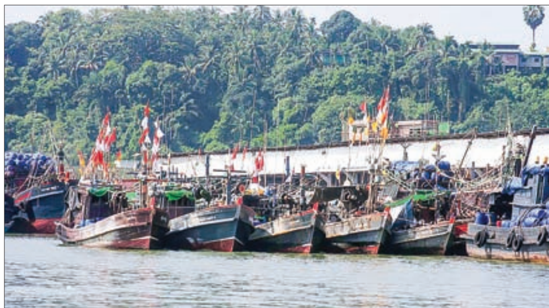
Myanmar and Thailand agree to impose illegal fishing vessels that unload at Thai ports.

The Thai Directorate of fisheries postponed the implementation time for the purpose of sustaining long-term friendship between the two countries. The Thai Directorate of Fisheries will implement the Port State Measure Agreement (PSMA) 60 days after the original implementation date of 1 April.—Kyaw Soe (Kawthoung)