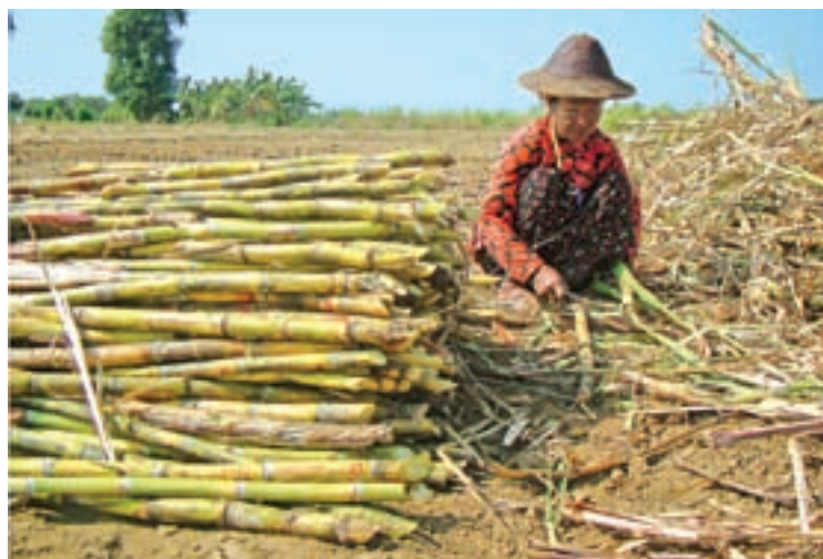
A farmer harvests sugarcanes in a village near Nay Pyi Taw.

The country earns more revenue from re-export trade with the increase in trade volume. In addition, all the stakeholders in this industry are financially doing