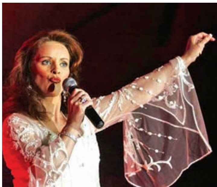
Sheena Easton in Vina del Mar , about 75 miles (120 km) northwest of Santiago, in 2008.

It is not the production's first showing in London, having run in the West End from 1984 to 1989. A relatively unknown Catherine Zeta Jones performed in the chorus line in 1984.— Reuters