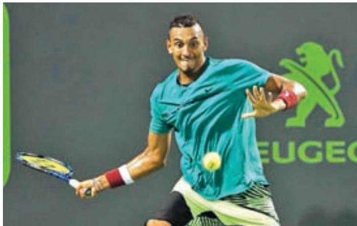
Nick Kyrgios of Australia hits a forehand against Roger Federer of Switzerland (not pictured) during a men's singles semi-final in the 2017 Miami Open at Brandon Park Tennis Center Miami, FL, USA, on 31 March 2017.

"If our match does go to five sets I think it would make for a pretty cool atmosphere out there