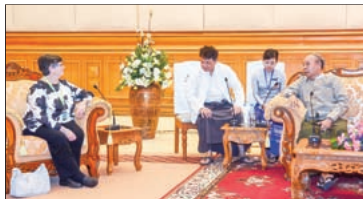
Speaker Mahn Win Khaing Than receives former Swiss President Ms. Ruth Dreifuss.