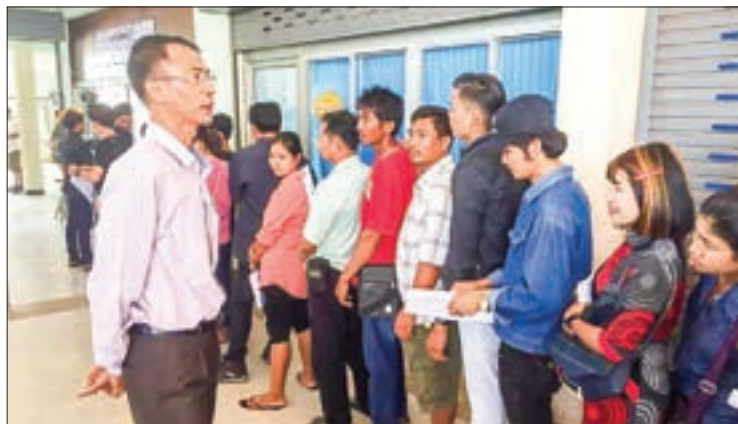
Myanmar workers line up to apply for CI cards.

"We requested Thailand immigration not to abolish their