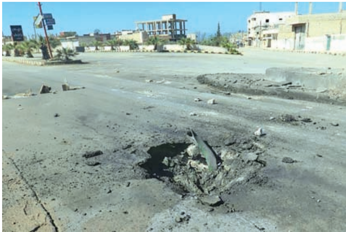
A crater is seen at the site of an airstrike, after what rescue workers described as a suspected gas attack in the town of Khan Sheikhoun in rebel-held Idlib, Syria on 4 April 2017.

Nations Nikki Haley warned that countries "could be compelled to act."