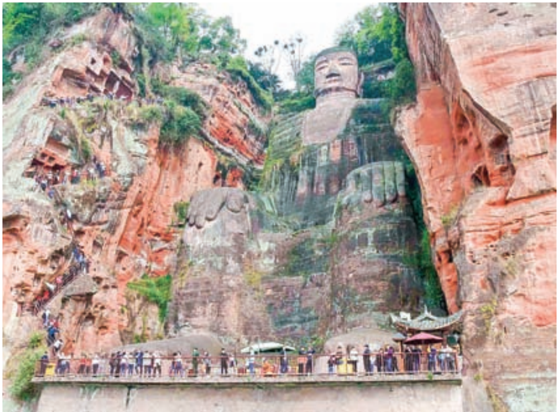
President U Htin Kyaw, First Lady Daw Su Su Lwin look at the Giant Buddha at the confluence of the Minjiang, Dadu and Qingyi rivers near the city of Leshan, China.

AT the invitation of President of the People's Republic of China Mr. Xi Jinping, President U Htin Kyaw, First Lady Daw Su Su Lwin and entourage left Nay Pyi Taw yesterday for a State Visit and were seen off at the airport by State Counsellor Daw Aung San Suu Kyi, Vice Presidents U Myint Swe and U Henry Van Thio, Senior General Min Aung Hlaing, Commander-in-Chief of the Defence Services, Union Minister for Transport and Communications U Thant Sin Maung, Nay Pyi Taw