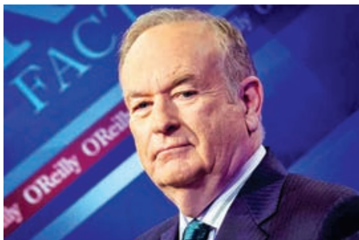
Fox News Channel host Bill O'Reilly poses on the set of his show "The O'Reilly Factor" in New York in 2015.

Fox News is a unit of 21st Century Fox. Several companies have pulled ads from O'Reilly's Fox News show "The O'Reilly Factor."— Reuters