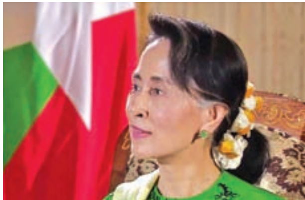
State Counsellor Daw Aung San Suu Kyi.

Well this happened not because the UN asked for this, or any other body said we should have a fact finding mission, we invited Dr. Kofi Annan to form this commission and look into the problems in the Rakhine and help us to find long term solutions. We