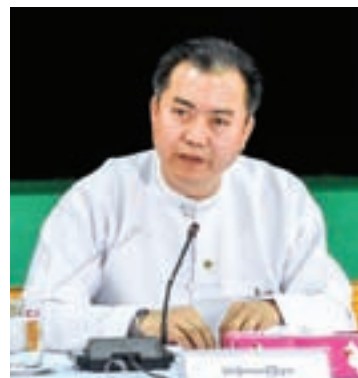
U Kyaw Zeya, Permanent Secretary of the Ministry of Foreign Affairs

He added, "Remarkable performances of the ministry of the border affairs in one-year peri-