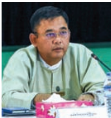
U Ye Naing, Permanent Secretary of the Ministry of Border Affairs

Concerning immigrant Myanmar citizens abroad, implementation strategies have been researched to utilize the human resource of the immigrant Myanmar