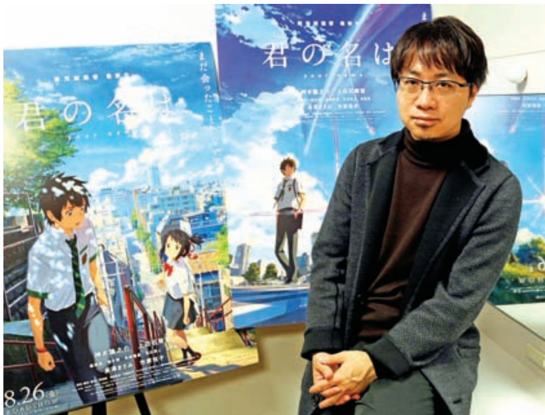
Japanese anime director Makoto Shinkai poses for a photo in front of posters of his animated film 'Your Name' after an interview with Reuters in Tokyo, Japan, on 16 November 2016.