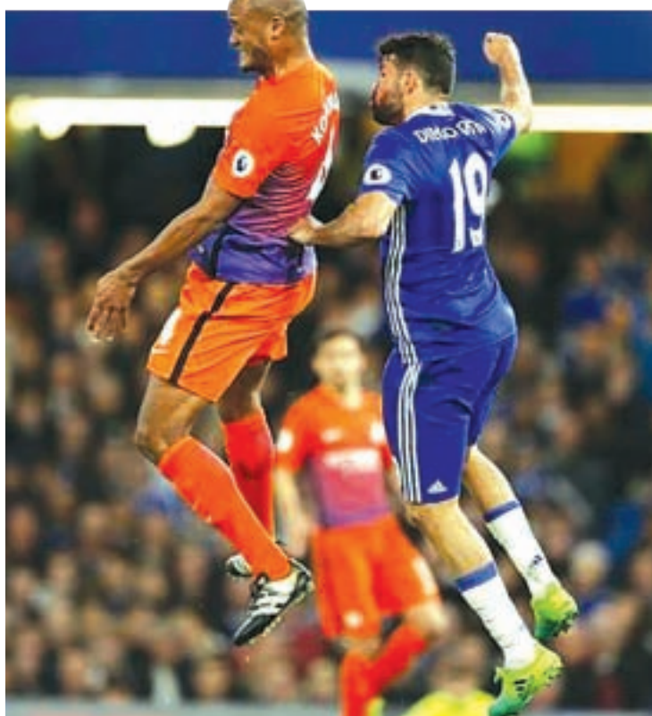
Manchester City's Vincent Kompany in action with Chelsea's Diego Costa during Premier League at Stamford Bridge, on 5 April 2017.

"Our target (now) is Champions League and hopefully, getting to the final of the FA Cup."—Reuters