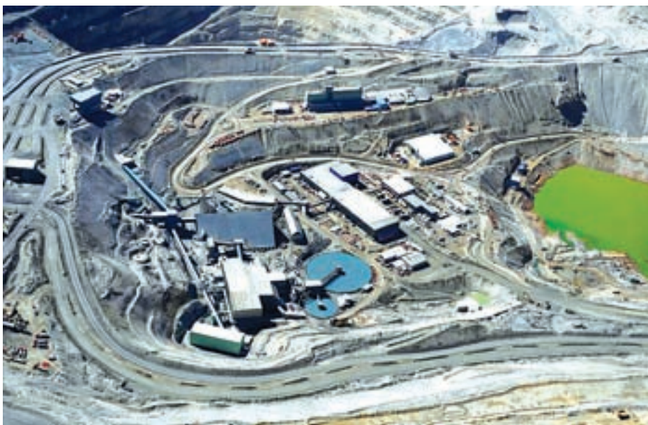
An aerial view of Anglo American’s Los Bronces copper mine at Los Andes Mountain range, near Santiago city, Chile, in 2014.

A major obstacle is the massive upfront cost for in-