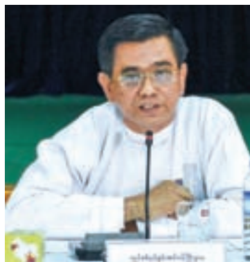
U Htein Lwin, Permanent Secretary of the Ministry of Electric Power and Energy

State Counsellor delivered a policy speech at the 71st UN General Assembly. The greatest achievement for Myanmar was the finalization of the Human Rights Draft Proposal submitted yearly to the Third Committee in EU since 1991, which after 2016 in the 71st UN General Assembly was no longer required for submission.