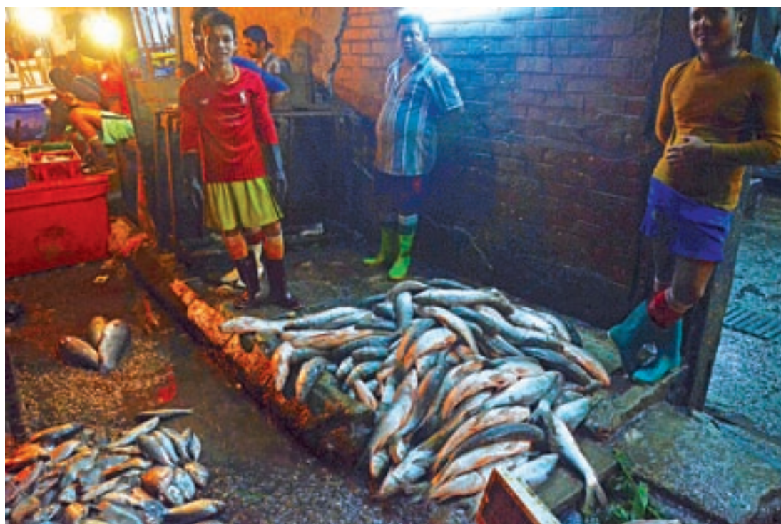
Myanmar needs to enhance its fishery industry to be able to boost its fishery production.

In addition to showcasing the latest technologies and equipment as well as agriculture, livestock and fisheries products, the international agricultural exhibitions in Cambodia and Myanmar