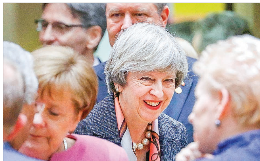
British Prime Minister Theresa May.

Government officials, lawmakers and analysts say privately that she believes she has some strong cards to play, while also hoping that EU officials will favour pragmatism over punishment. —Reuters