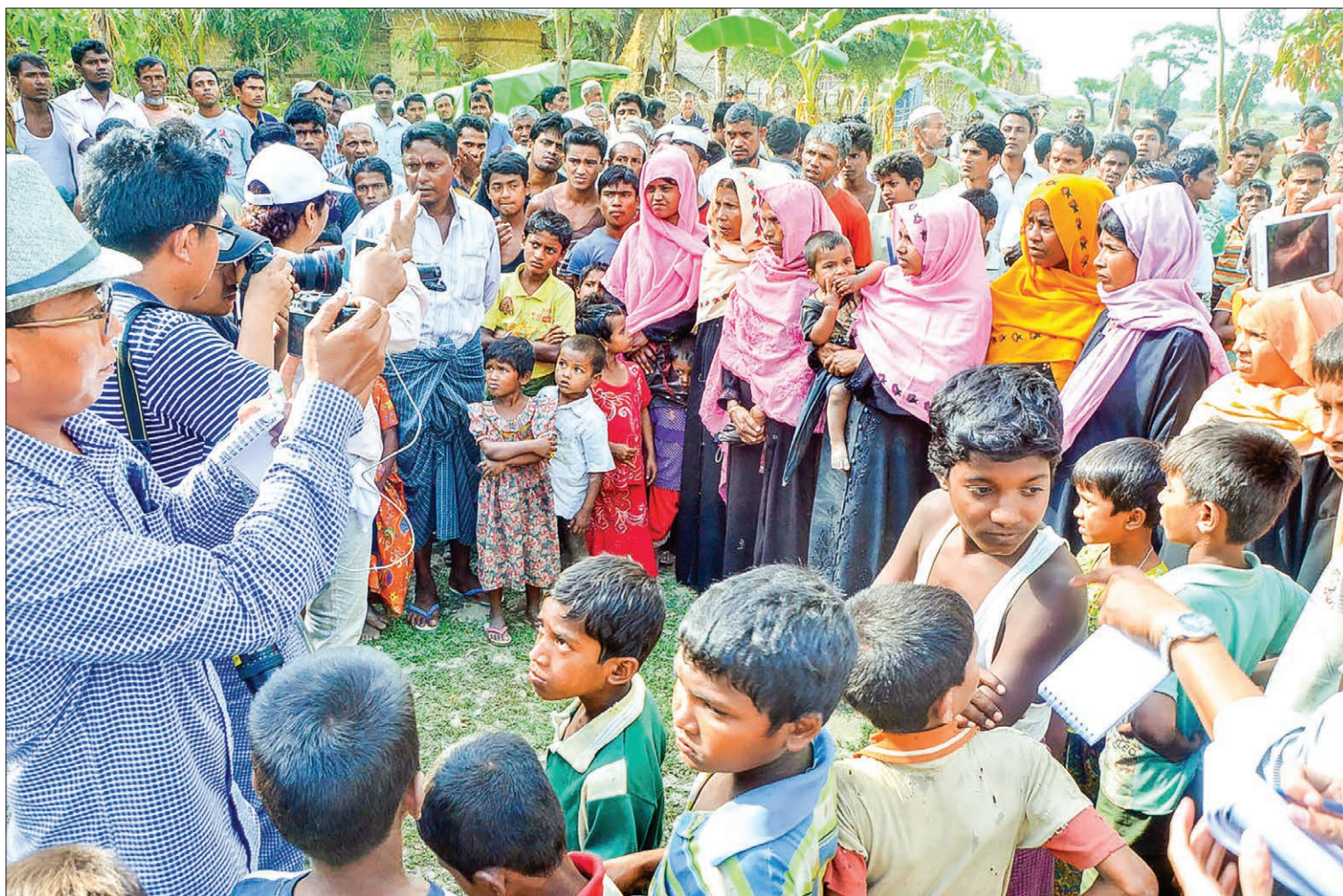
Journalists talk to local residents during their trip to a village in Maungtaw Township in northern Rakhine State.

Before this visit, some of the journalists discussed with Ministry of Information on where and where they want to visit and how to collect news. The visit was