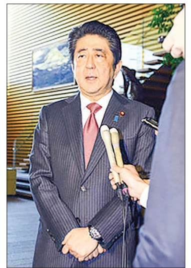
Japanese Prime Minister Shinzo Abe speaks to reporters at his office in Tokyo on 4 April 4, 2017. PHOTO: KYODO NEWS

"We are doing our utmost to confirm the safety of Japanese nationals," Chief Cabinet Secretary Yoshihide Suga told a press conference. —Kyodo News