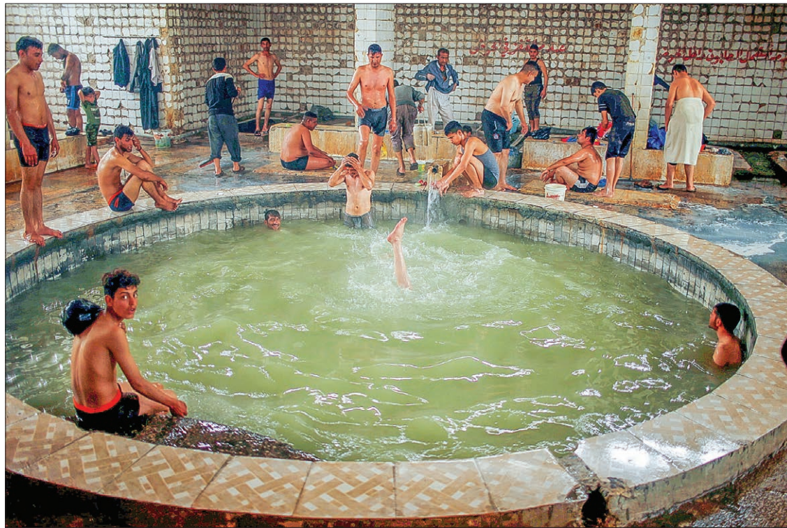
Iraqis swim at a sulfur pond at Hammam al-Alil city south of Mosul, Iraq on 3 April, 2017.

"The hisbah came checking that everyone had the right