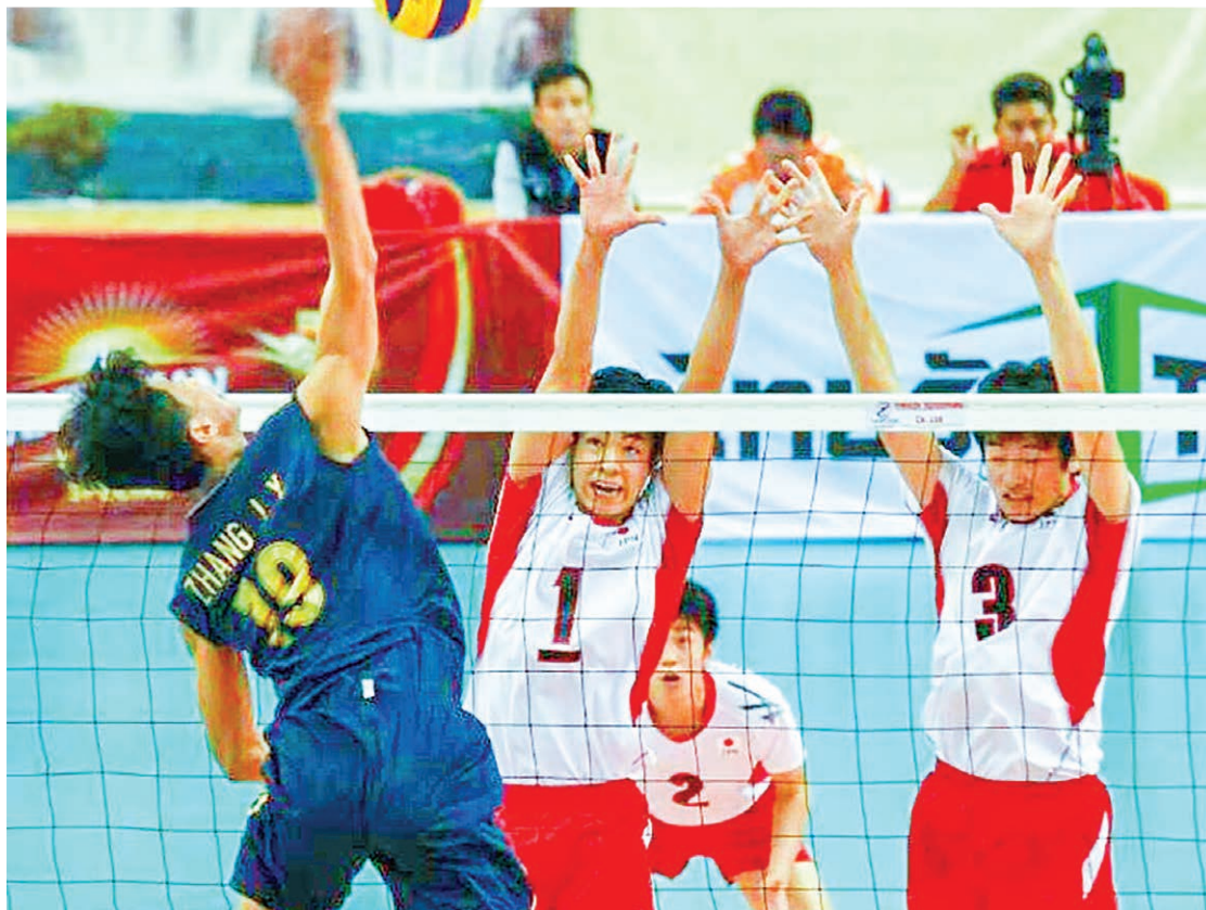
A Japanese player aims for the ball as the opposing team readies their defense.