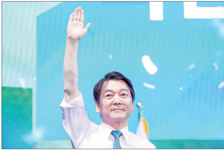
Ahn Cheol-soo celebrates after winning the nomination as a presidential candidate of the People's Party, during a national convention, in Daejeon, South Korea on 4 April, 2017.

He sought to find a new way in South Korean politics long marred by ideological and regional division, founding the People's Party last year that emerged as a major political force in the parlia-