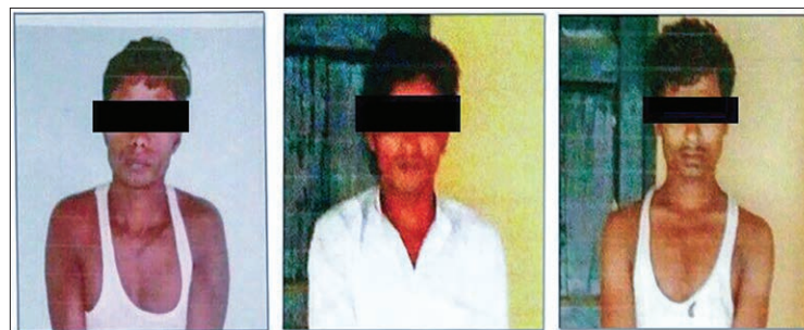
The three suspects in Buthidaung Township.

The three men are believed to be involved in the murder of