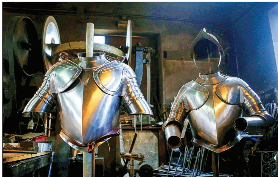
Suits of armour for the Vatican's Swiss Guards are pictured at a workshop in Molln, Austria, on 29 March, 2017.

And, for the coming years at least, he and his brother will produce the Guards' distinctive crested helmets, he said. —Reuters