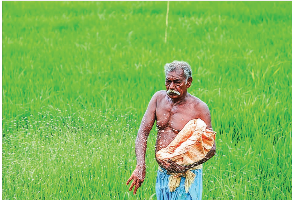
A farm hand sprinkles chemical fertilisers to protect the rice crop from pests that are increasing with heat and high humidity arriving early in Kidangara village, Kuttanad, India, January 2017.

That damaged fish populations and distorted the system — an effect that has worsened in recent years as