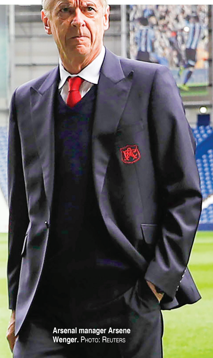
Arsenal manager Arsene Wenger.

Defender Per Mertesacker and midfielders Alex Oxlade-Chamberlain and Aaron Ramsey return from injury lay-off and could feature against West Ham. Arsenal suffered their first home defeat in eight years when Slaven Bilic’s side won 2-0 at the Emirates last season.— Reuters