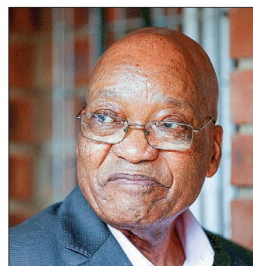
President Jacob Zuma.

"With regards to the finance portfolio, we reiterate that while the political leadership has changed, government's overall policy orientation remains the same as derived from the governing party, the African National