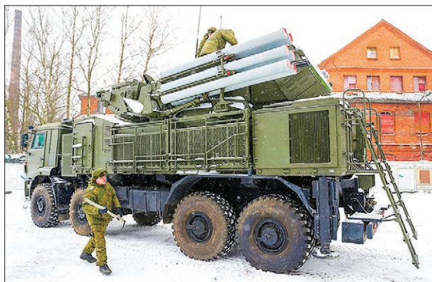
Pantsir-S1 missile systems. Russia has completed the delivery of Igla-S shoulder-fired air defence missile systems to Brazil.

According to earlier reports, Brazil's Defence Ministry had plans for acquiring 12 Pantsir-S1 systems installed on a chassis provided by Germany's Rheinmetall to create three batteries. In the meantime, the European company MBDA declared plans to pool efforts with Brazil's Avibras to develop a medium range air defence system AV-MMA, the Pantsir-S1's likely rival. Brazil has conducted talks on acquiring Russia's air defence systems since 2013. Originally, the signing of the contract was scheduled for 2015. In May 2016 the then head of Russia's Federal Service for Military-Technical Cooper-