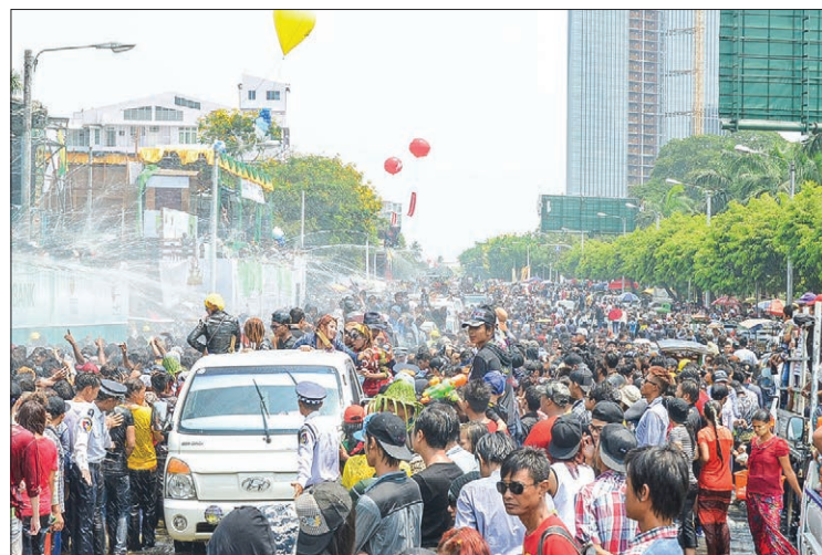
People celebrate Thingyan Water Festival in 2016 in Yangon.

As part of its efforts to reduce road accidents during the Thingyan New Year Festival, the committee is now accelerating its public awareness programmes in townships across the