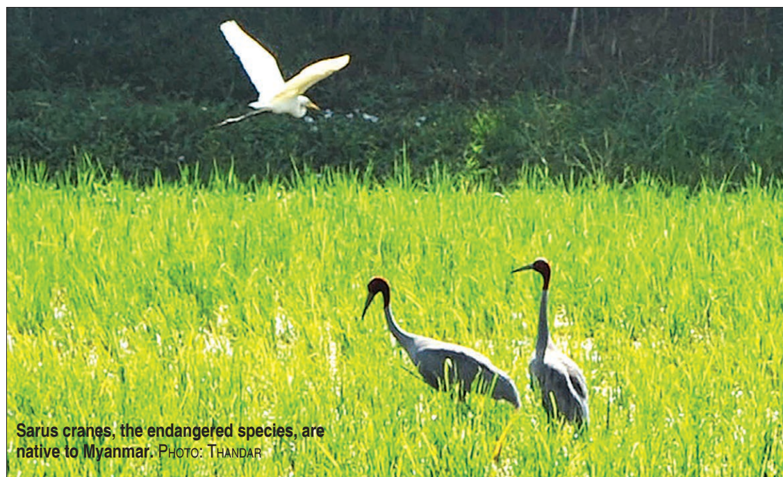
Sarus cranes, the endangered species, are native to Myanmar.