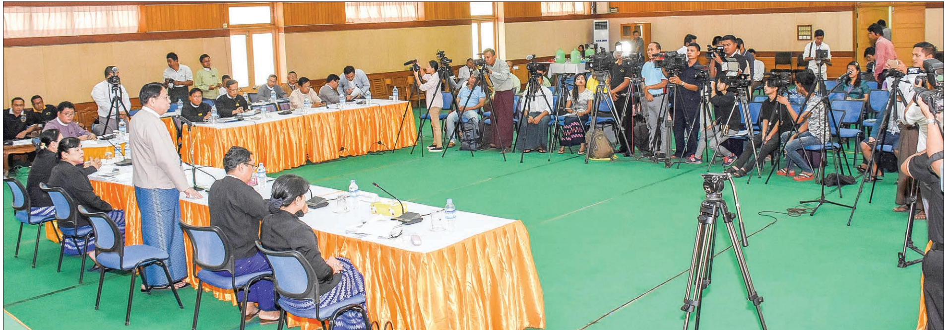
Union Minister Dr Pe Myint clarifies holding the press conference on performance of governmental institutions in the first one-year period.