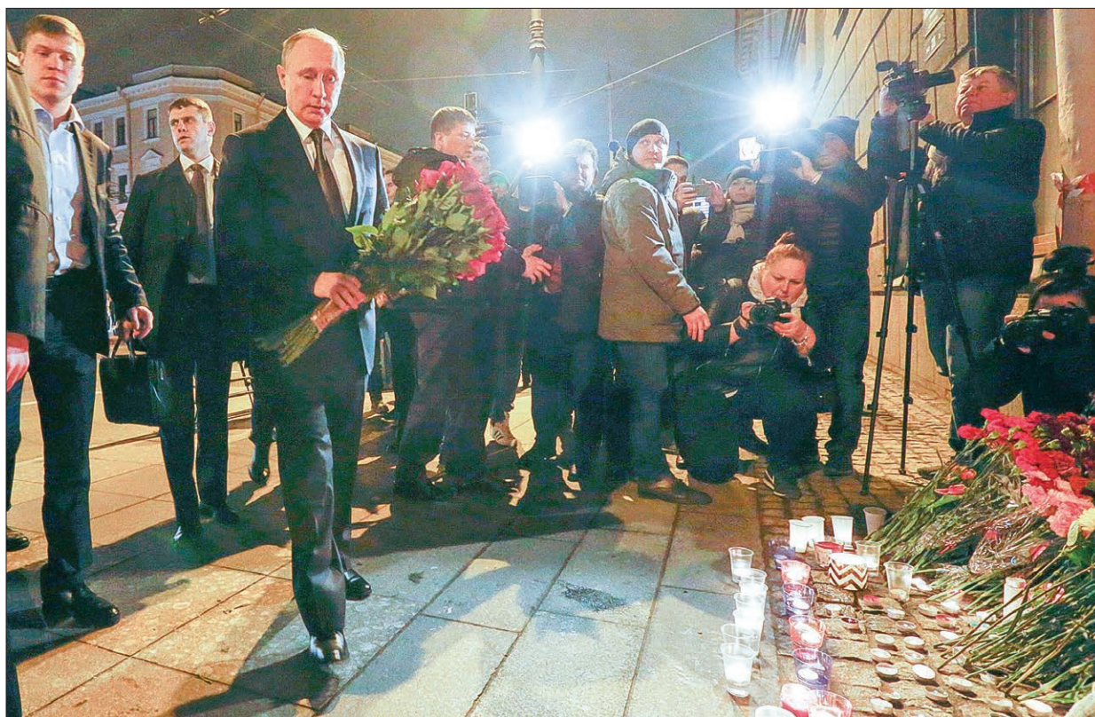
Russian president Vladimir Putin puts flowers down outside Tekhnologicheskii Institut metro station in St Petersburg, Russia on 3 April 2017.

The blast raised security fears beyond Russian frontiers. France, which has itself suffered a series of attacks, announced additional security measures in Paris.— Reuters