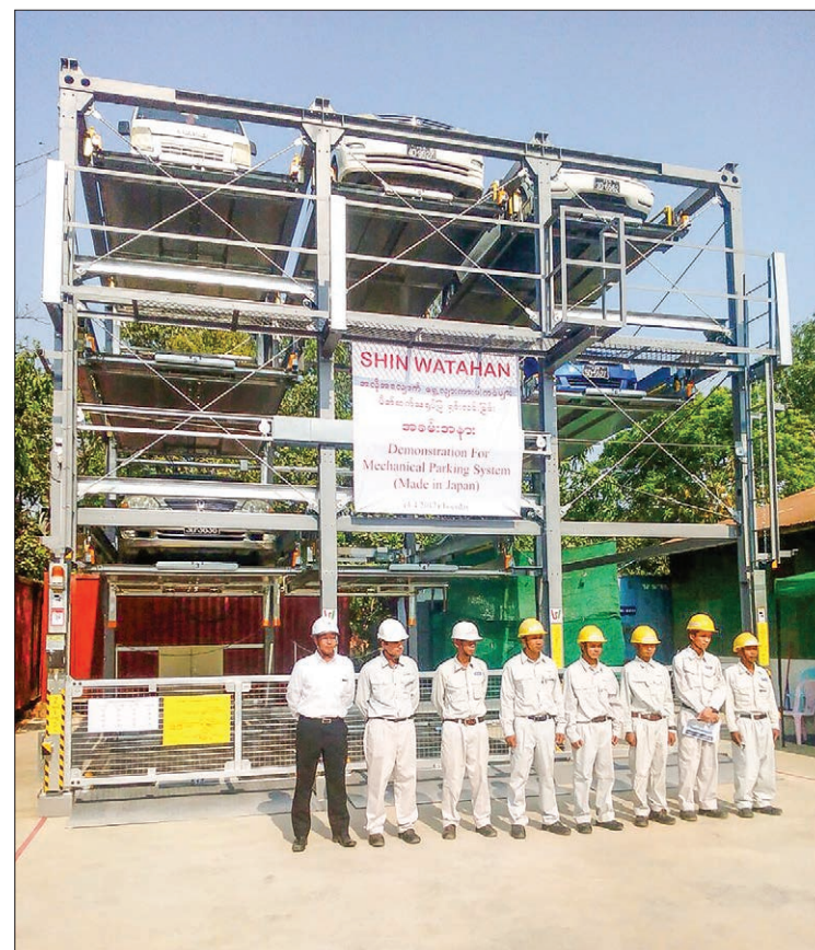
Experts from Shin Watahan pose for a photo in front of the demonstrative mechanical car parking system.

The Mechanical Car Parking System comes in different sizes to be able to set up in different unoccupied areas and can be handled easily without affecting the environment. It currently costs US$7,000 but will cost only US$5,000 if assembled in Myanmar. Maintenance costs are US$10 per month.