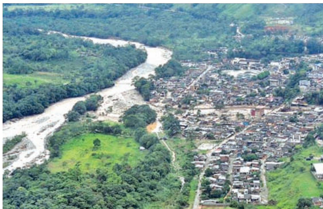
An aerial view shows a flooded area after heavy rains caused several rivers to overflow, pushing sediment and rocks into buildings and roads in Mocoa, Colombia, on 1 April 2017. PHOTO: REUTERS

Photos posted on Twitter by the air force showed neighborhood streets filled with mud and damaged houses, while videos on social media showed residents searching for survivors in the debris and struggling to move through waist-high water during the night.—Reuters