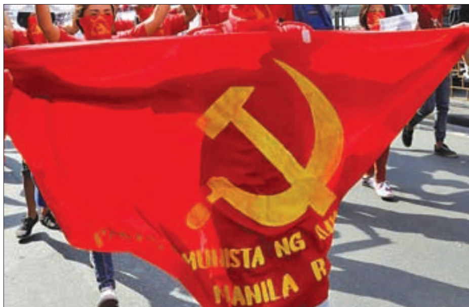
A protester is silhouetted behind a Communist sickle and hammer banner as members and supporters of an underground Communist movement march along a street in Manila, Philippines on 31 March 2017.

MANILA — Peace negotiations between the Philippine government and Maoist rebels started anew on Sunday in Oslo, but without any ceasefire and with both parties warning of continuing violence.