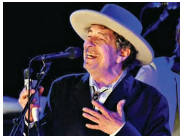
US musician Bob Dylan performs during on day 2 of The Hop Festival in Paddock Wood, Kent on 30th June 2012.

SLOKHOLM — Bob Dylan got the Nobel Literature prize-giving he wished for on Saturday, a Swedish broadcaster reported, finally receiving his diploma and medal in a private ceremony in Stockholm a world away from the media storm the award has generated.