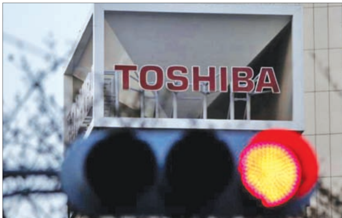
The logo of Toshiba Corp is seen behind a traffic light at the company's headquarters in Tokyo, Japan, on 29 March 2017.

The Japanese conglomerate, which only recently emerged from a huge accounting scandal, has