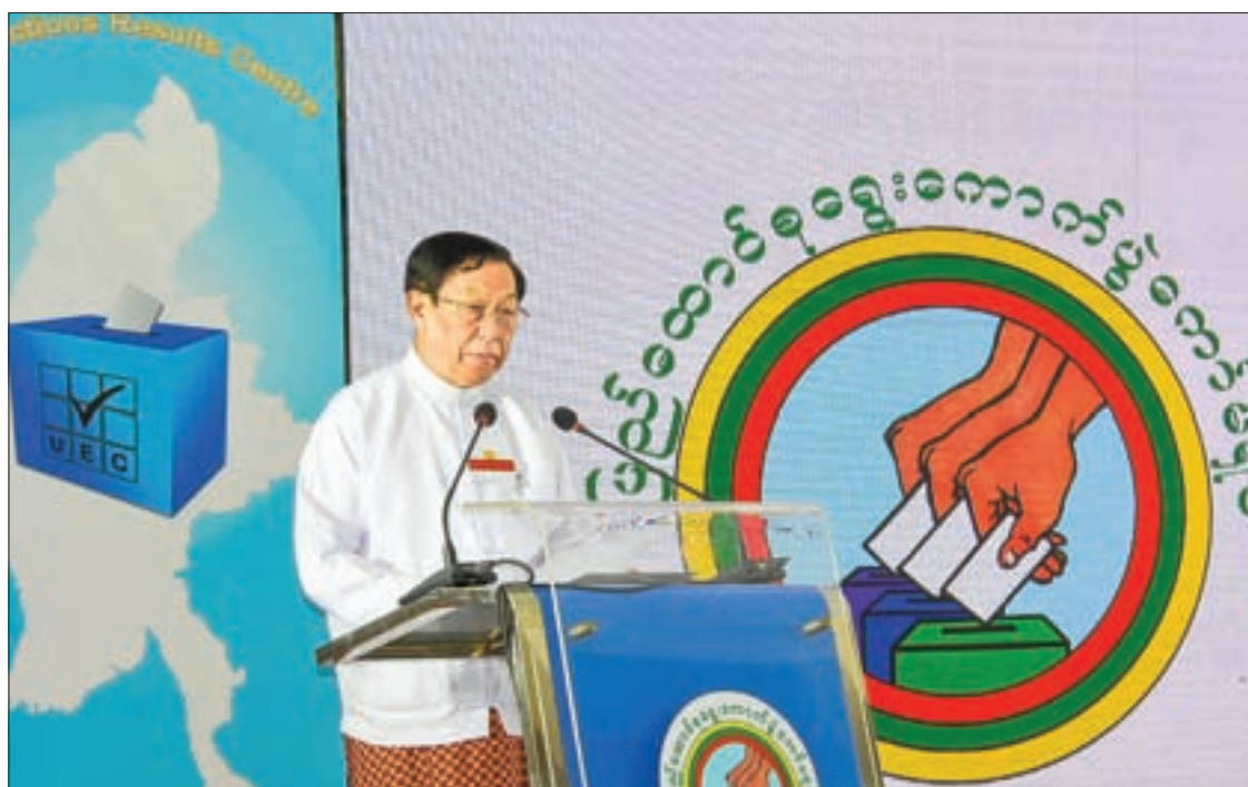
U Hla Thein, Chairman of the Union Election Commission, announces the results of the 2017- by-elections.

For Hlinethaya Township in Yangon Region, eight hluttaw candidates participated in the