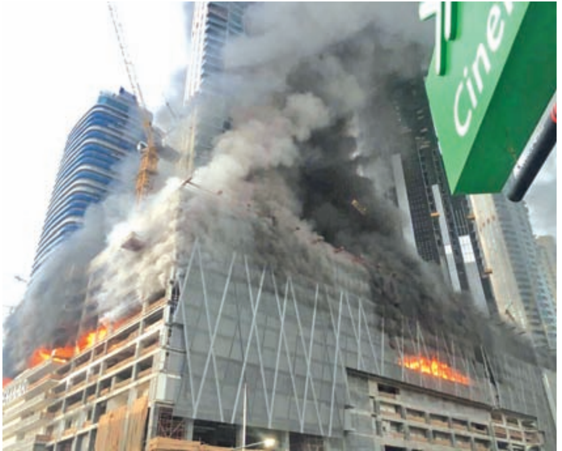
A fire is seen at a tower under construction in Dubai's Downtown district, United Arab Emirates on 2 April, 2017.

Several tall buildings, including residential compounds and hotels, have been hit by fire in Dubai over the past two years or so. The spate of blazes has prompted the authorities to tighten safety regulations on new buildings. —Reuters