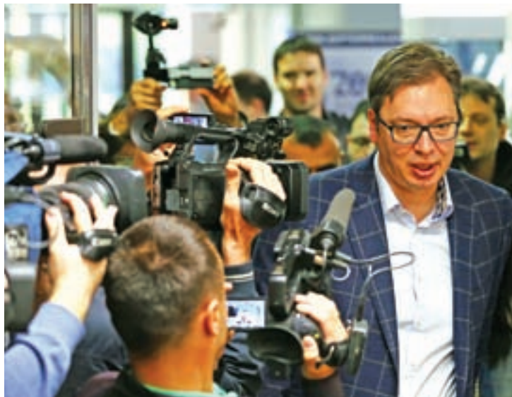
Serbian Prime Minister and presidential candidate Aleksandar Vucic arrives at a polling station during the presidential election in Belgrade, Serbia, on 2 April 2017.

"There were no real proposals or ideas in the programmes