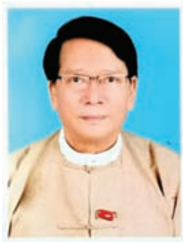
Dr Maung Maung.

I feel elated that I can now perform the duties and aims of the National League for Democracy. I am able to fulfill the wishes of the people of Monywa and protect their national rights too, and for that I am happy.