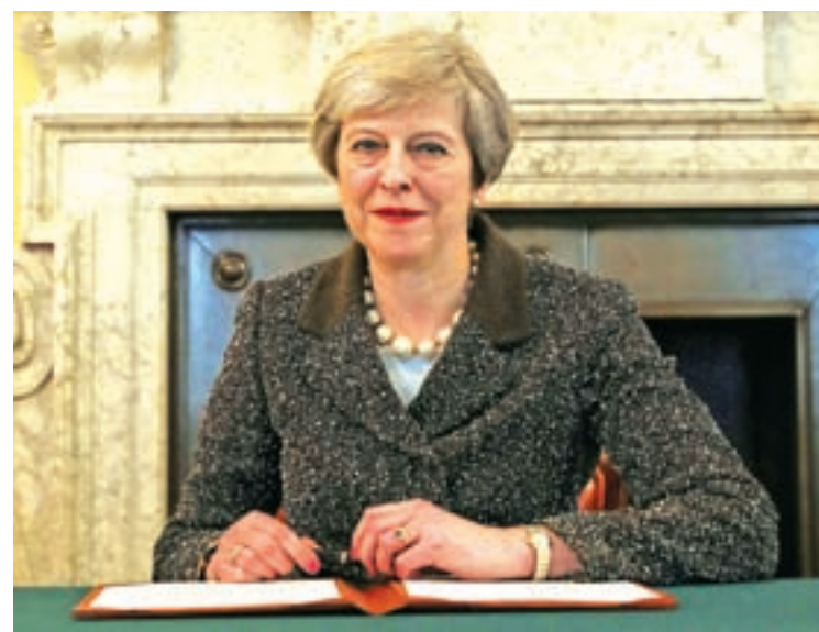
British Prime Minister Theresa May.

"I do not think it's necessary to talk about vetoes". —Reuters