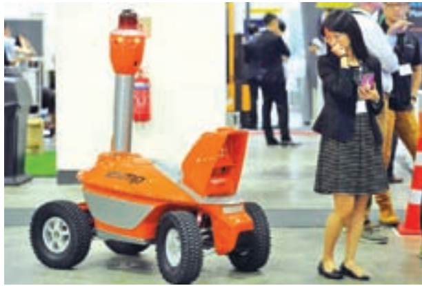
Photo taken on 1 November, 2016 shows a robot demonstrating autonomous movement at the Singapore International Robo Expo (SIRE).

Supported by RIE, a 450 million-Singapore dollar (324 million-US dollar) initiative, called National Robotics Programme, will support public-private partnerships among research performers, companies and public agencies to undertake R&D and pilot relevant technologies in targeted areas.