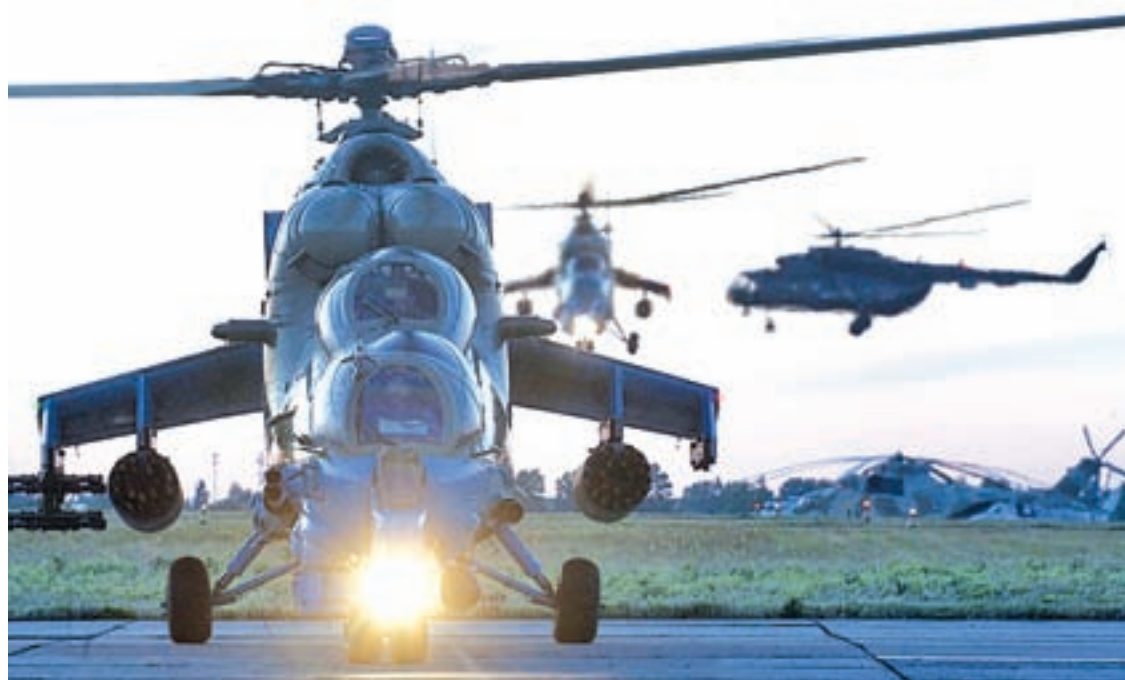
Mi-24 attack helicopter is a low-capacity troop transport with room for eight passengers. Mi-24 helicopter of the Berkuts aerobatic display team. The helicopter protection system Vitebsk will be upgraded by 2018.

MOSCOW — The helicopter protection system Vitebsk will be upgraded by next year on the basis of its performance in Syria, the Russian Defence Ministry said on Wednesday.