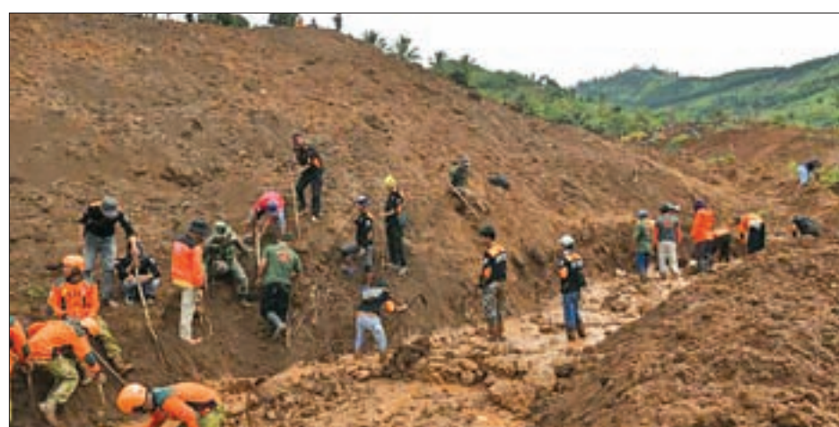
Rescuers look for people feared to be buried after a landslide triggered by heavy rain hit Banaran village in Ponorogo, East Java province, Indonesia on 2 April 2017 in this photo taken by Antara Foto. PHOTO: REUTERS

Some of the victims were believed to include a group harvesting a crop of ginger in fields around the