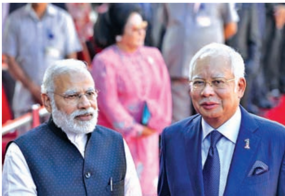
Indian Prime Minister Narendra Modi (L) welcomes Malaysian Prime Minister Najib Razak during a ceremonial reception held at the Indian Presidential Palace in New Delhi, India on 1 April, 2017. Najib Razak is on his five-day visit to India.

Later, addressing a joint press conference, Modi said: “To secure our societies, and for the greater regional good, we have agreed to further strengthen our strategic partnership to shape an effective response to our common concerns and challenges.”