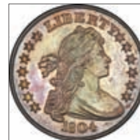
A 1804 Draped Bust Silver Dollar coin which sold at auction for $3.29 million.

BALTIMORE — An 1804 US silver dollar sold for $3.3 million in one of a series of auctions that brought in a record total of more than $100 million for a renowned private coin collection, organizers said on Saturday.