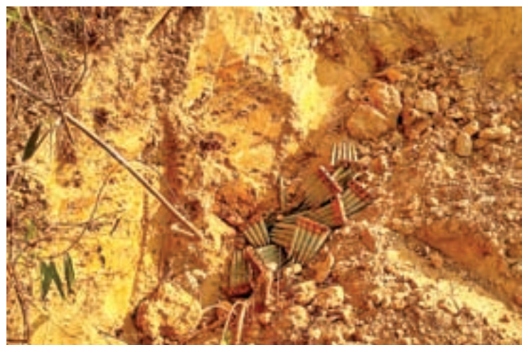
Hundreds of old bullets dug up near Aungtharya Village, Maungtaw.

The bullets are thought to be Point-303 rifle bullets used back in 1942. The bullets have been sent to Arms and Ammunition Troop for careful inspection.— Ramanya, Tin Soe