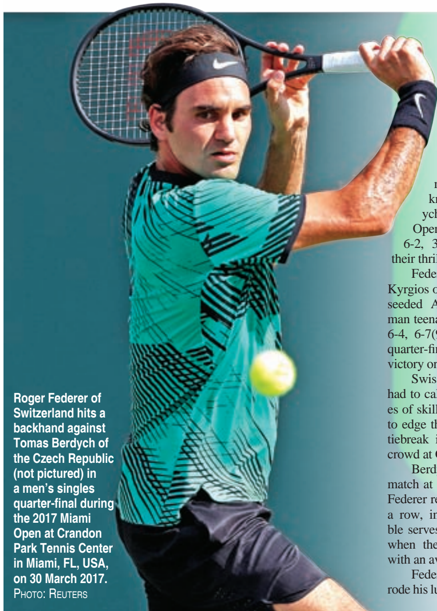
Roger Federer of Switzerland hits a backhand against Tomas Berdych of the Czech Republic (not pictured) in a men's singles quarter-final during the 2017 Miami Open at Crandon Park Tennis Center in Miami, FL, USA, on 30 March 2017.