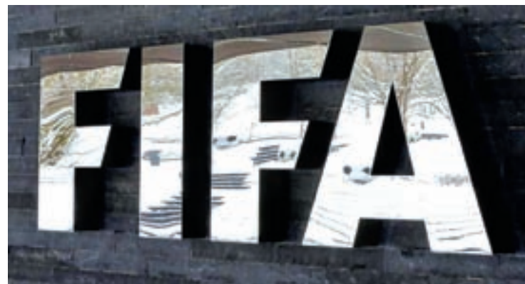
The snow-covered landscape is reflected in a logo in front of FIFA headquarters in Zurich, Switzerland, on 10 January.

increase the tournament from 32 teams to 48. The current allocation is 13 places to Europe, five to Africa, four to Asia and South America and three to CONCACAF.