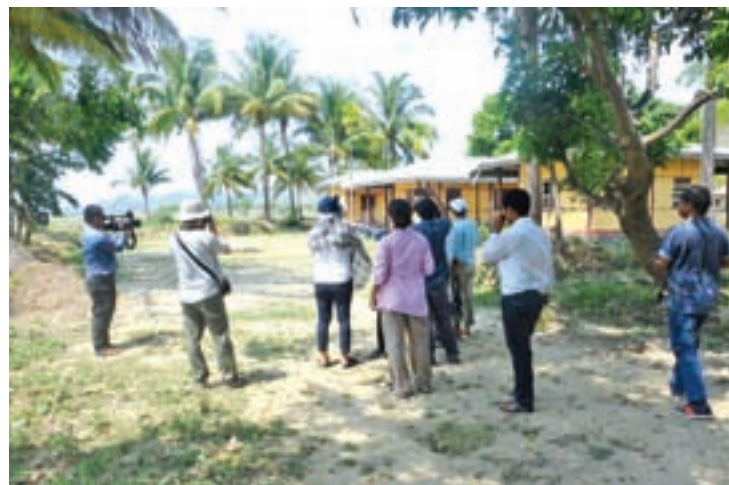
Foreign and Local media observe Maungtaw POE.