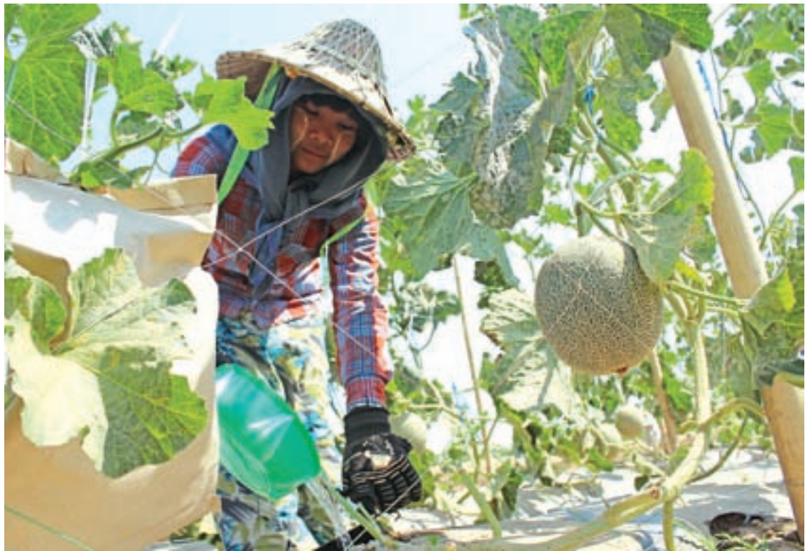
A farmer works in the muskmelon farm in Nay Pyi Taw.

THE price of muskmelon declined because of low demand of China, causing financial difficulties for muskmelon growers, according to the Mandalay fruit market.