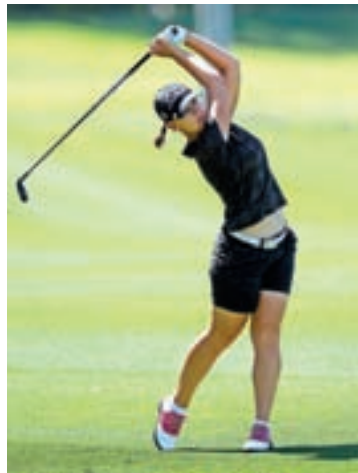
Karine Icher hits on the eighteenth course fairway during the first round of the ANA Inspiration golf tournament at Mission Hills CC-Dinah Shore Tournament Course in Rancho Mirage, CA, USA, on 30 March 2017.

With gusts of 45 miles per hour (72 kph) bending palm trees and blowing marked balls off greens and higher winds forecast,