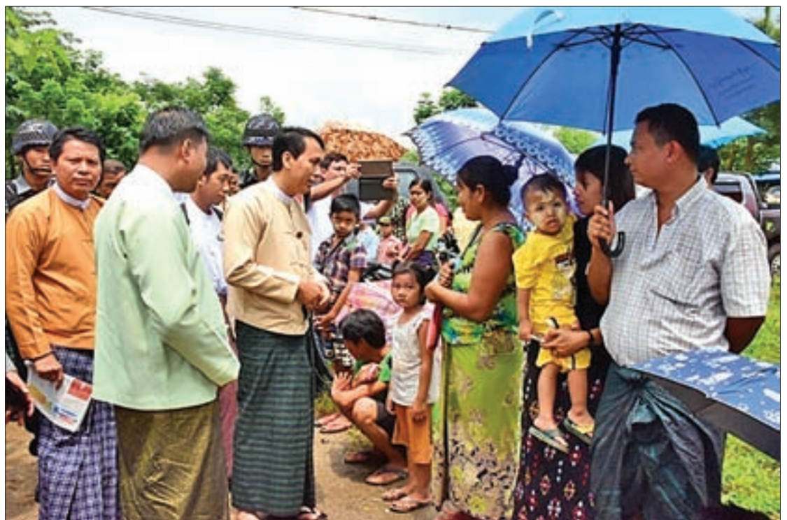
Yangon Region Chief Minister warmly greets squatters in Yangon.