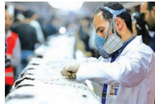
An Egyptian scientist works on restoring a piece of the second Khufu boat at a temporary laboratory set up next to the Great Pyramids where it was discovered, in Giza, Egypt, on 29 March 2017.

The number of tourists visiting Egypt stood at 9.3 million in 2015, compared to more than 14.7 million in 2010, but the country's tourism minister expressed hope earlier this month that numbers could return to levels experienced before the uprising.—Reuters