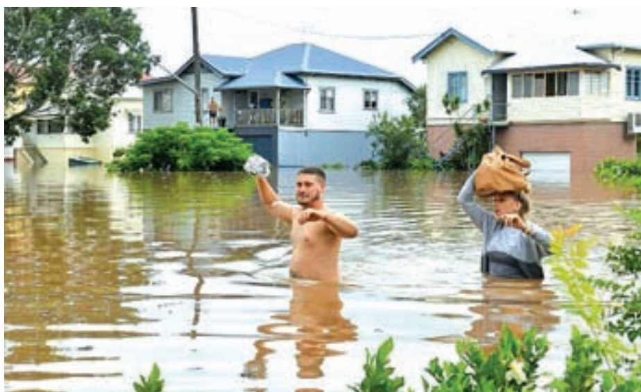
Local residents waded through floodwaters near their homes in the northern New South Wales town of Lismore, Australia, on 31 March 2017 after heavy rains associated with Cyclone Debbie swelled rivers to record heights across the region.

NSW police said they had recovered the body of a woman from floodwaters on Friday, the first reported death since Cyclone Debbie