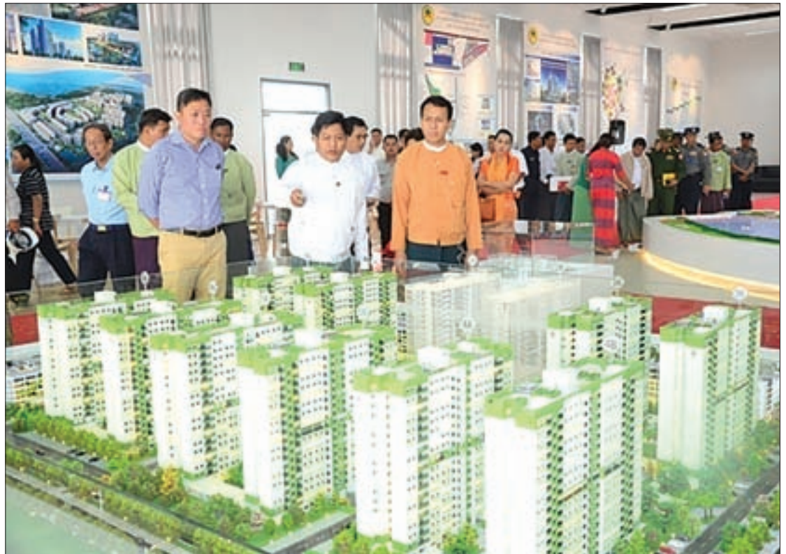
Yangon Region Chief Minister observes the scale model of Yadanar Hninsi housing complex in Yangon.

It is sure that the relentless efforts of the region government will bring about prosperity for the people who hope a brighter future.