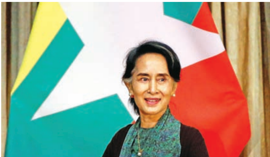
State Counsellor Daw Aung San Suu Kyi is seen during her visit to Japan in 2016.

THE incumbent government soon after taking office enacted the law regarding the State Counsellor on 6 April 2016 and later established a new Ministry in accordance with that law: the Ministry of the Office of the State Counsellor.