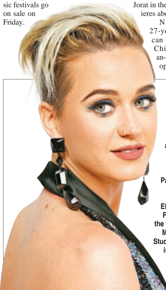
Singer Katy Perry poses at Elton John's 70th Birthday and 50-Year Songwriting Partnership with Bernie Taupin benefiting the Elton John AIDS Foundation and the UCLA Hammer Museum at RED Studios Hollywood in Los Angeles, California, US, on 25 March 2017.

Simone, Miles Davis, Aretha Franklin, Prince and Deep Purple have given legendary concerts at Montreux, which former co-director Quincy Jones called the "Rolls-Royce" of festivals.