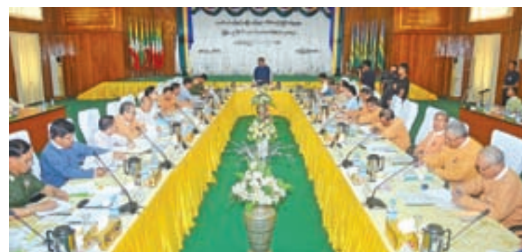
Vice President U Henry Van Thio delivering a speech at the meeting.

The Central Committee has been solving cases left over from the previous government and it is necessary for the development of the cases to be published in a monthly government gazette. It is also necessary to present the plans and conditions, in accordance with land management law, for those confiscated lands by Nay Pyi Taw,