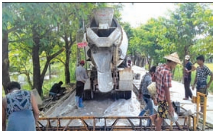
The road is being paved with concrete.