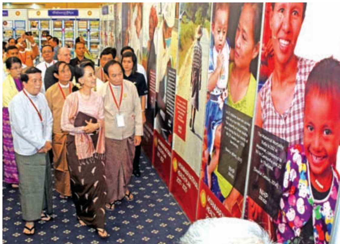
State Counsellor Daw Aung San Suu Kyi looks at photos displayed at the ceremony.

Public health is of great importance for the country. My mother, who was a nurse, used to say that we must be healthy and nothing can be done without good health. She herself encountered as a nurse that many educated or high-ranking or wealthy persons lost their potential when their health deteriorated. My mother stressed great importance on health. Here, I want to say that public health is an invaluable resource for our country, hence the need to make concerted efforts for public health care. The present national health plan is the public orientated plan, so we are required to start from our houses. It is not to get medical treatment only when we arrive at the hospitals. Instead, we must be careful about our health while living in our homes. We generally differentiate between those who need to have medical treatment and those giving medical treatment. In fact, we cannot think like that. Some say that medical doctors do not cure patients,