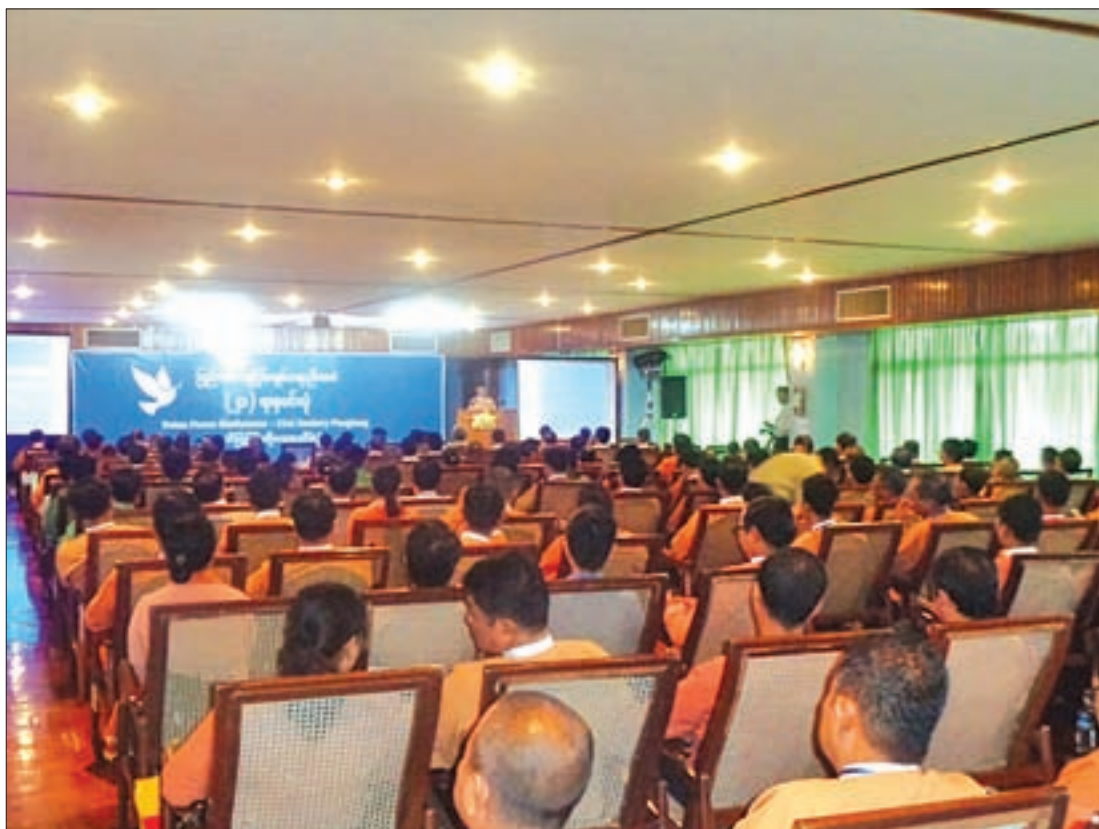
Welcoming ceremony for Union Peace Conference—21st Century Panglong.