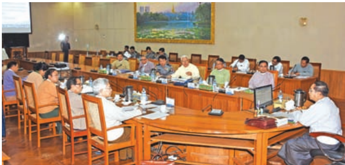
Vice President U Myint Swe addresses the Maungtaw Investigation Commission meeting in Nay Pyi Taw.