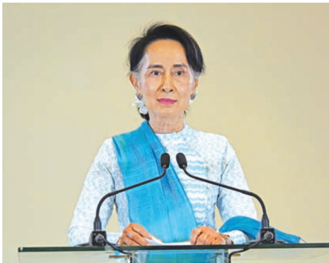
State Counsellor Daw Aung San Suu Kyi delivering her speech Thursday night from Nay Pyi Taw.

When we speak of changing the system, we need to understand that it involves changing the old system that has been deeply entrenched in our society for over fifty years. In this regard, our main goal for the change is to demonstrate that the Government is here to serve the people. How people perceive our action – whether the Government is really serving the people or whether it is using the people to achieve its goals – is an important indicator to determine the measure of success. I believe most people are becoming increasingly aware that they do not have to live in fear of the Government anymore. I see this as progress.