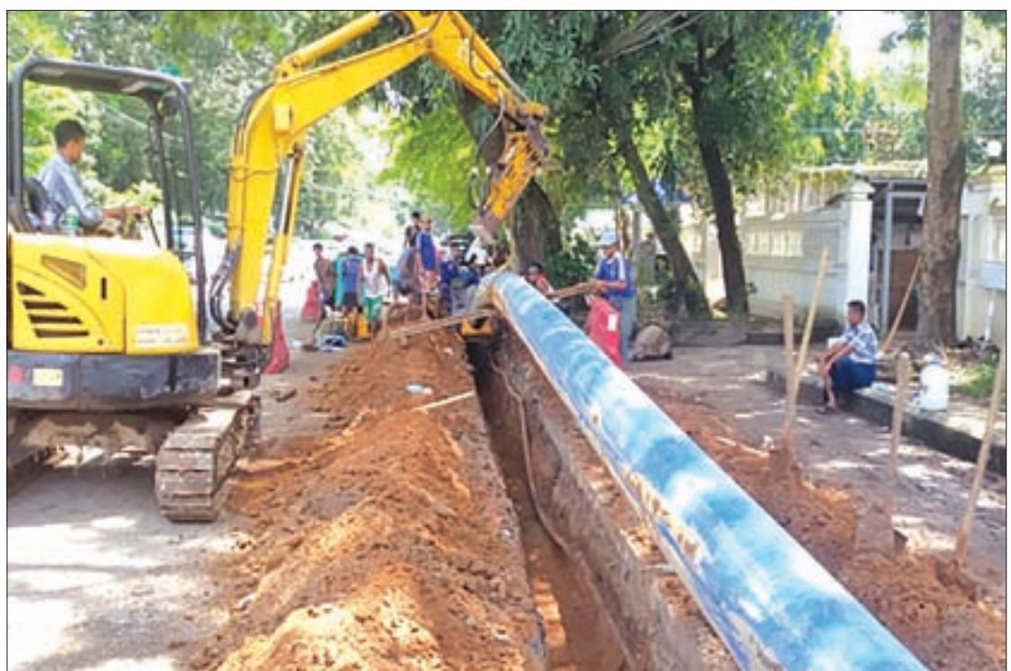
Laying of underground water pipelines in Yangon.