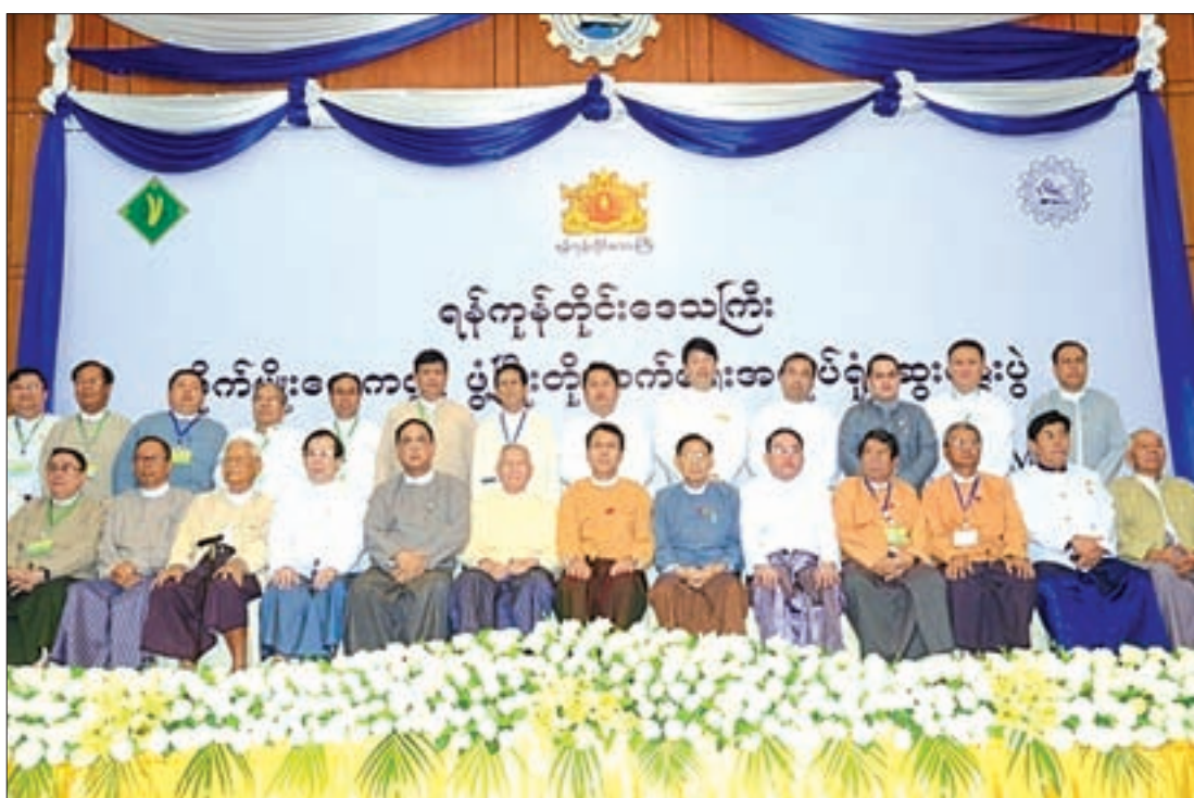
Yangon Region Chief Minister, centre, at the workshop on development of agricultural sector.