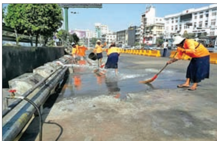
Workers clean the area for the night market along Strand Road.