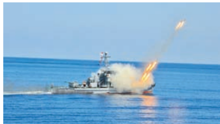
A naval ship shoots congratulatory fire to celebrate new jetty in Coco Island. PHOTO: MNA

the naval commander. The Senior General and party released turtles into the sea to commemorate the opening of the jetty. The new jetty is expected to contribute to development of the Coco Island and will help improve transportation and the flow of commodities.— Myanmar News Agency