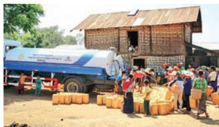
Local residents clamour to get clean drinking water from a water bowser.

The BFM bought 44 bowsers in 2016 and supplied water to the people facing water shortages that summer.—Thura Lwin