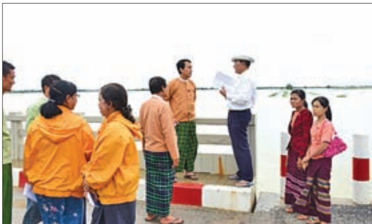
Yangon Region Chief Minister listens as an official clarifies measures for regional development.