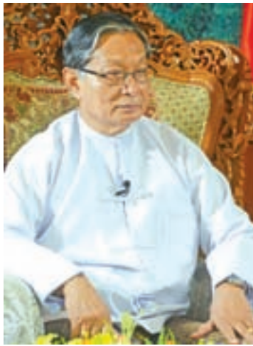
Union Minister for Office of the State Counsellor U Kyaw Tint Swe.

Since the youths of new generation have to bear the brunt of the result of the fact whether