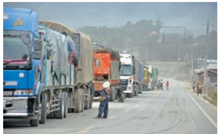
Trucks seen near Muse Border Trade Zone in Muse, northern Shan State.

The border trade values as of 17th March in the current FY were US$4.72bil at Muse, US$185.588mil at Lweje, US$550.081mil at Chimshehaw, US$93.691mil at Kan Picketee, US$4.424mil at Kengtung, US$74.260mil at Tachilek, US$866.692mil at Myawady, US$121.950mil at Kawthoung, US$193.329mil at Myeik, US$11.452mil at Ht-