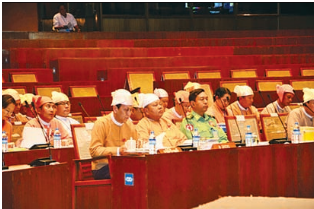
Yangon Region Chief Minister U Phyo Min Thein in attendance at a Hluttaw meeting.